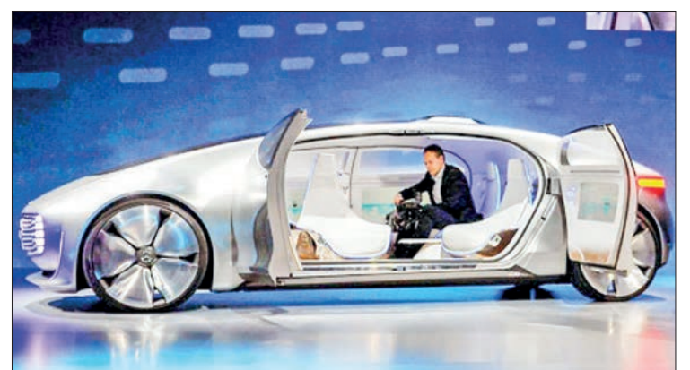
Total EU luxury sales to Russia were worth €3.5 billion per year. The Mercedes-Benz F 015 Luxury car.

Schumer said he expected the move to have "broad bipartisan support" in the Senate, vowing to push it through quickly.— AFP ■