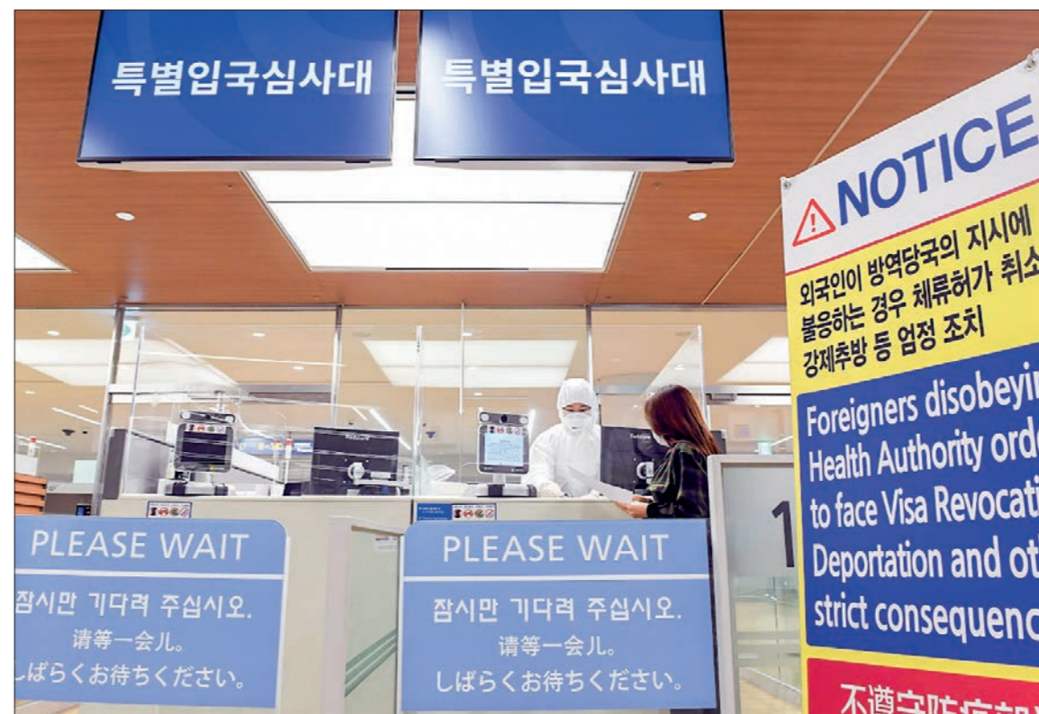
WHO said cases are especially on the rise in parts of Asia. A staff member checks information of a foreigner entering South Korea at Incheon International Airport in Incheon, South Korea, 8 April 2020.