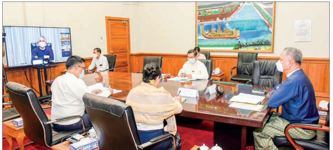
The meeting 2/2022 of the Working Committee to Address the Impact of COVID-19 on the National Economy in progress.

During the meeting, the discussion was held on the provision and repayment of loans under COVID-19 Fund, collection condition of loan interest, ongoing process for provision of loans for the Film, Music, Theatrical, Press and Media and the works done by the working committee. The meeting also discussed relief measures carried out by concerned ministries, upcoming plan of actions, and issues presented to the committee. —MNA