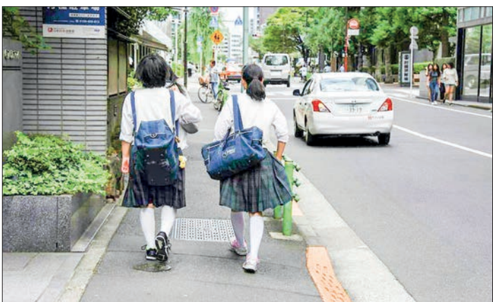
Japanese schoolgirls walk on a street in Tokyo on 1 September 2019.

Later this month, he will enter court-mediated arbitration with the school and city, hoping authorities will revise the rules. Change is already under way in Tokyo, which recently announced that strict rules on issues such as hair colour will be scrapped at public schools in the capital from April.—AFP ■