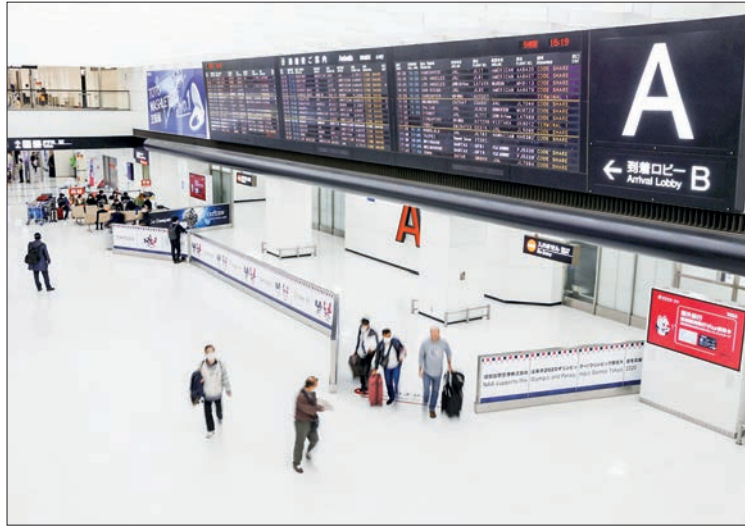
An arrival lobby at Narita International Airport has far fewer people than usual on 9 March 2020.

JAPAN is considering raising the daily cap on overseas arrivals to 10,000 from the current 7,000 starting in April, further easing its COVID-19 border controls, government sources said