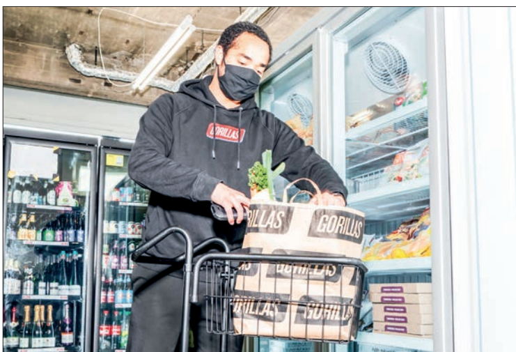
Gorillas, a German on-demand grocery delivery company, delivering groceries within 10 minutes of ordering by using dark stores.

RUSSIA'S invasion of Ukraine will have a heavy impact on the