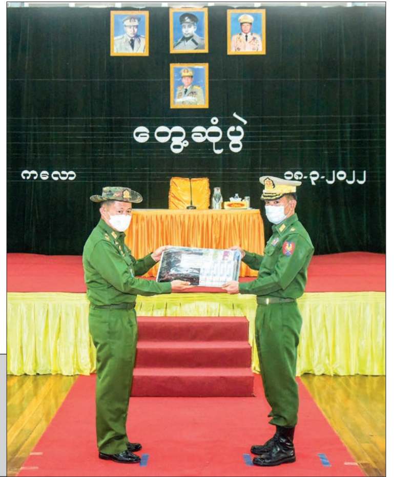
The Vice-Senior General presents foodstuffs and cash assistance for the Kalaw Station.

The Vice-Senior General and party cordially greeted Tatmadaw members and families.