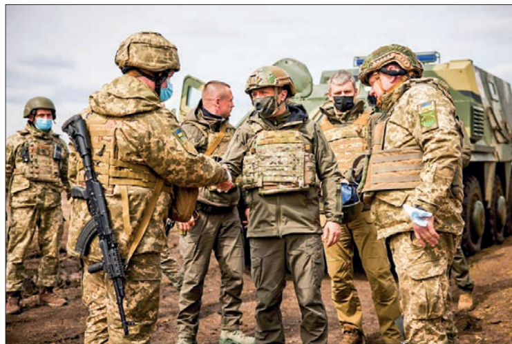
Ukrainian President Volodymyr Zelensky inspects the positions of the Armed Forces of Ukraine at the frontline of defense in Donbass, eastern Ukraine, 8 April 2021.