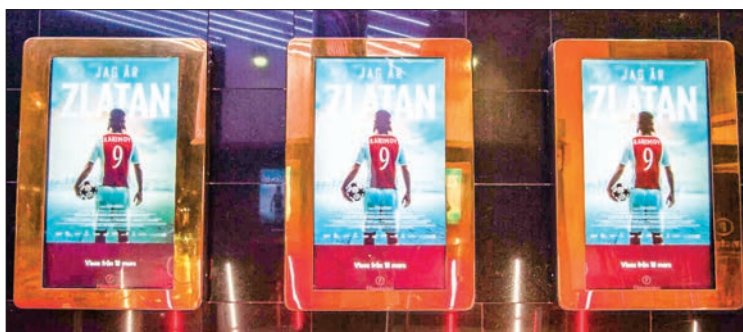
Film posters are pictured prior to the gala premiere of the film 'I Am Zlatan'.