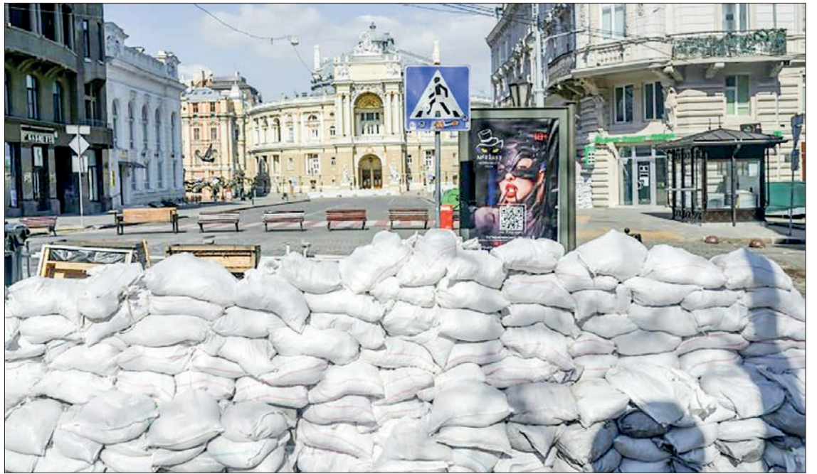
Odessa, a key port of about 1 million people, of whom around 100,000 have left since the invasion began, is both a strategic and symbolic target for the Russians.

IN front of a barricade mounted outside Odessa's magnificent opera house, a soldier shares a long, emotional hug with his wife and daughter.