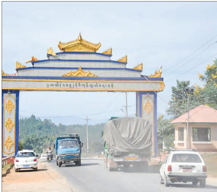
The Sino-Myanmar border trade zone.

Major export items via Mang Wein crossing various beans and pulses, rice and