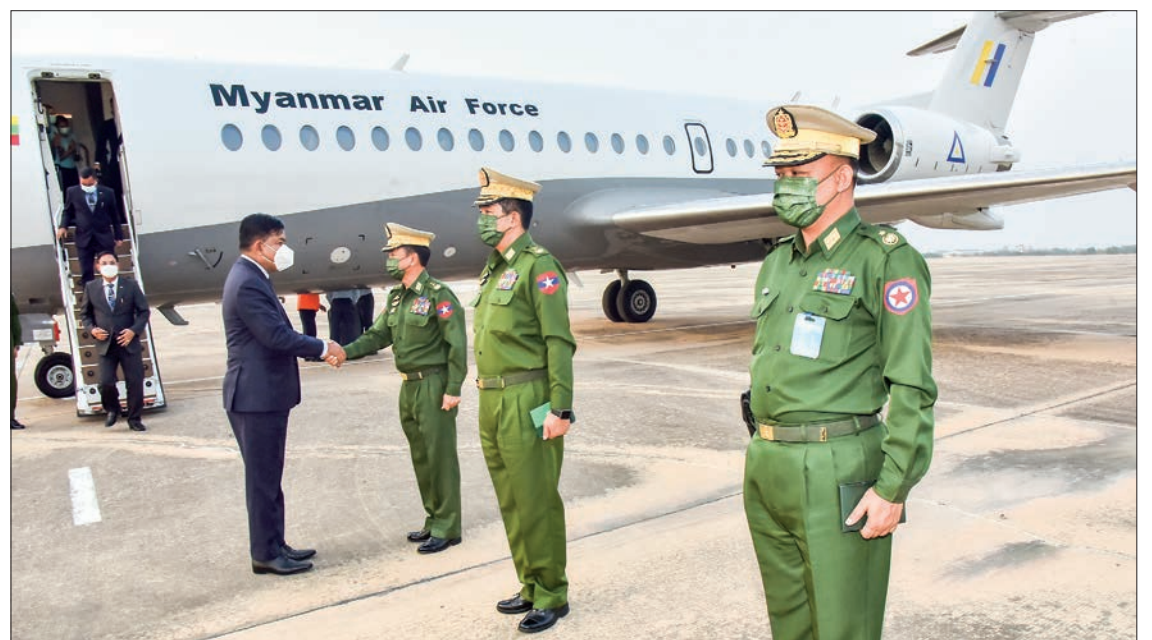
The Myanmar Tatmadaw delegation is welcomed back at Nay Pyi Taw Tatmadaw Airport yesterday.

The Myanmar Tatmadaw delegation arrived back at Tatmadaw Airport in Nay Pyi Taw at 6 pm yesterday. Lieutenant-General Than Tun Oo from the Office of the Commander-in-Chief (Army), Adjutant-General Lieutenant-General Myo Zaw Thein, the Commander and officials of Nay Pyi Taw Command welcomed back the delegation at the airport. — MNA