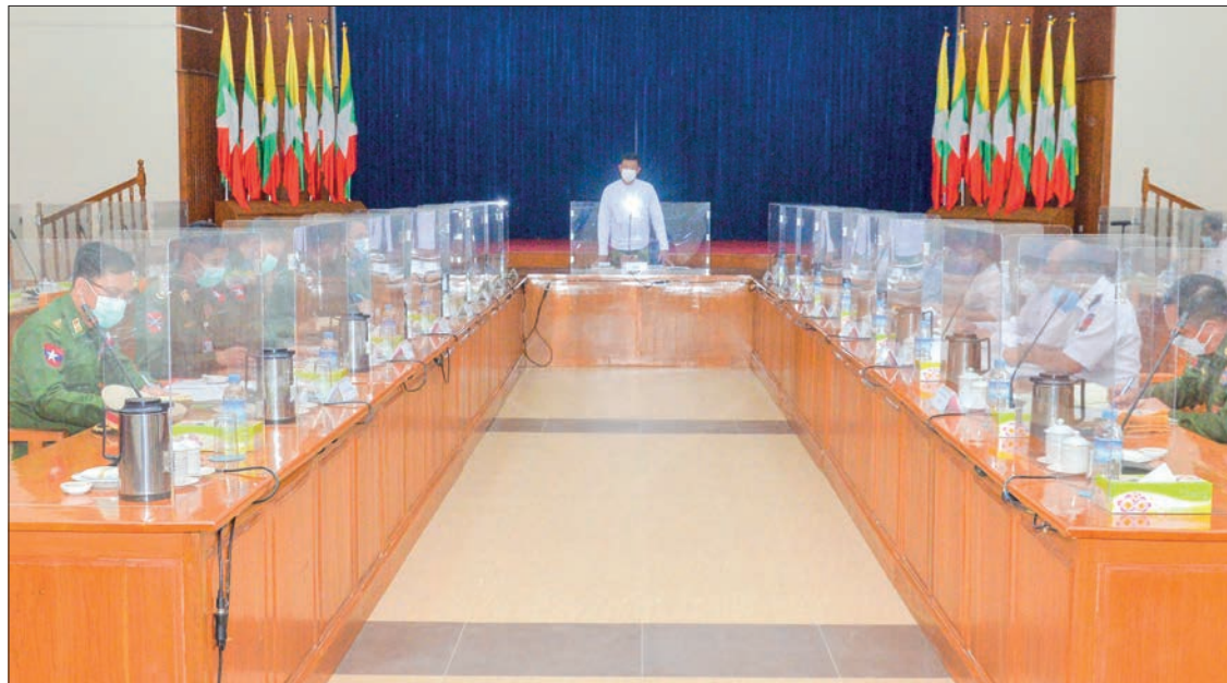
The meeting 1/2022 of the Committee on the Prevention of Recruitment of Child Soldiers in progress.

After the end of the second six-month term on 27 December 2014, the Plan of Action was not extended but carried out with Indicator 21 and then it was reduced to Indicator 11 according to the meeting of CTFMR and the government conducted on 26 July 2018. According to the Plan of Action, the Tatmadaw