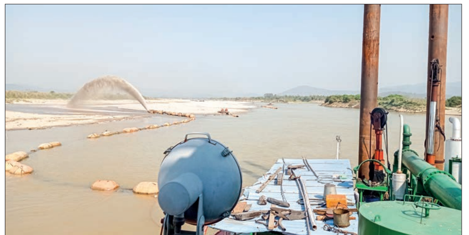
The 97-per-cent completion of the dredging works is seen in Bhamo Township.

THE Bhamo District Construction Quality Control Committee inspected the 97-per-cent completion of the dredging work to improve the port waterway in Bhamo Township, Kachin State, on 10 March.