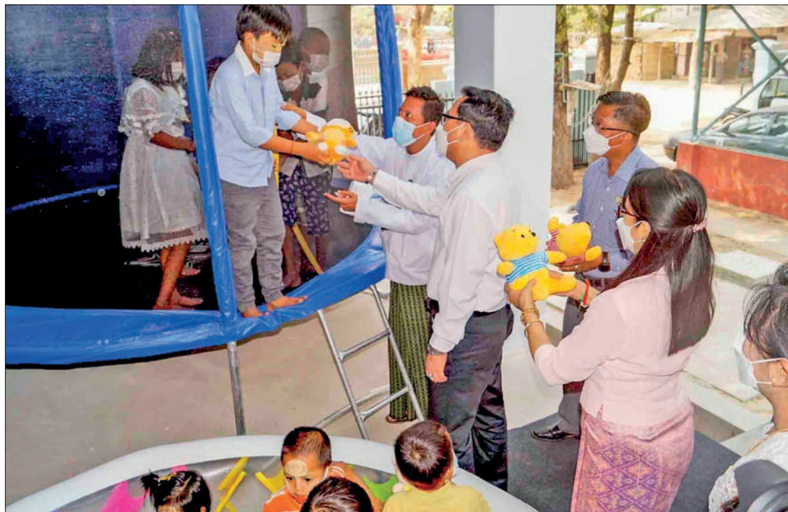
The MoI Union Minister comforts the children at the Natmawk Community Centre.

centre was constructed using more than K414 million of State budget and the Magway Region government donated materials worth K50 million.