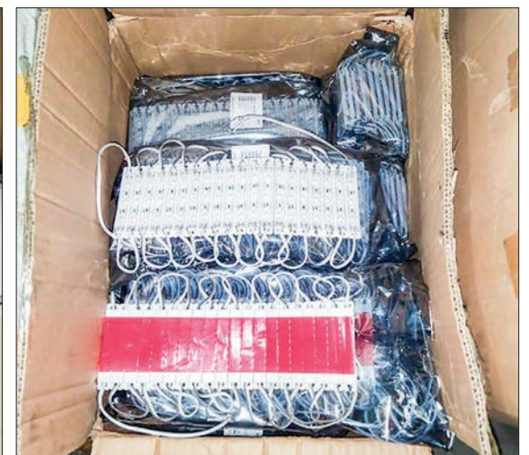
Confiscated illegal goods at the warehouse of Yangon International Airport.