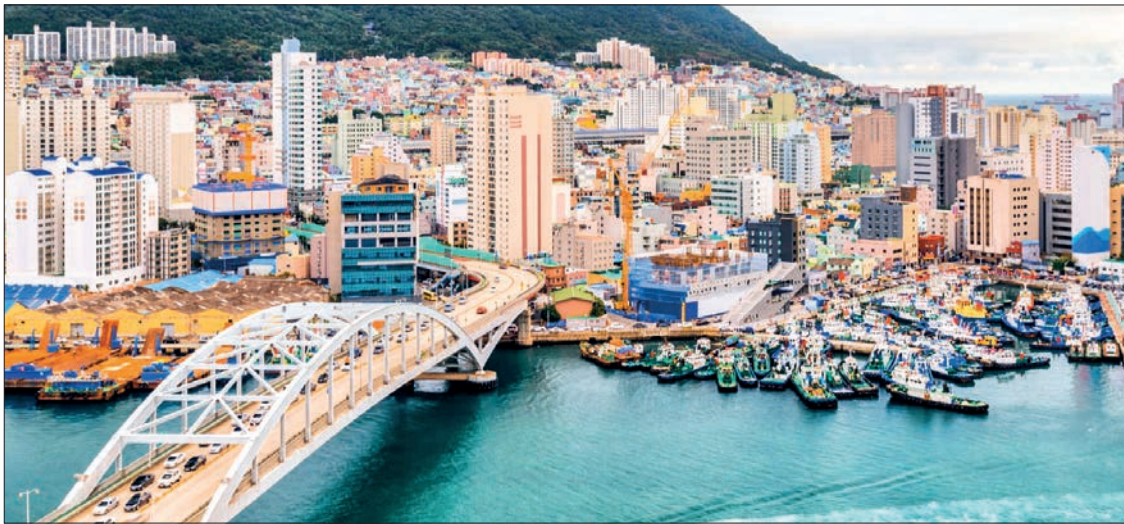
Busan Harbour, the largest port in South Korea.

SOUTH Korea's economy was faced with uncertainties both at home and abroad amid the spread of the COVID-19 Omicron variant and geopolitical risks in Europe, a government report said Friday.