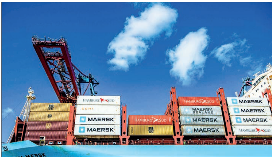
Germany's largest port, Hamburg, has warned that global supply chain issues are here to stay.

THE majority of German companies have reported disruptions to supply chains and logistics as a