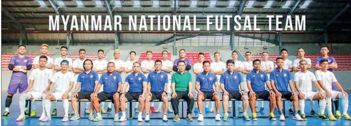
The Myanmar Futsal Team players pose for a group photo with team authorities and coaches.

THE ASEAN Football Federation has recently announced fixtures for the 2022 ASEAN Futsal Championship to be played by Myanmar Futsal Team.