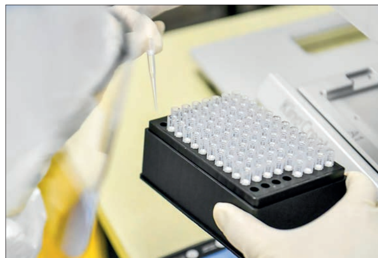
A staff member works at the air-inflated testing lab for COVID-19 nucleic acid testing in Beichen District of north China's Tianjin, Jan. 13, 2022.

VV116 was first approved for clinical trials in Uzbekistan and allowed to be used in the treatment of moderate to severe COVID-19 patients in the country in late 2021.—Xinhua ■