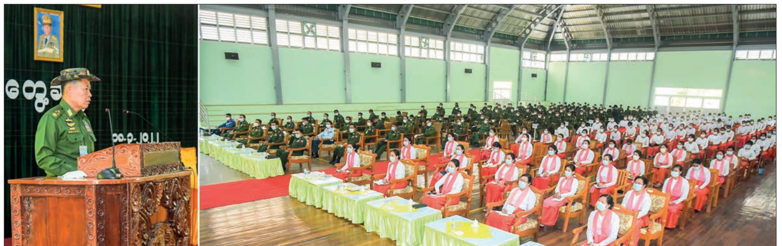
State Administration Council Vice-Chair Deputy Commander-in-Chief of Defence Services Vice-Senior General Soe Win meets the officers, other ranks and family members of the Kalaw Station yesterday.

ALTHOUGH terrorists commit instigations, the Tatmadaw is standing with strong unity of military units, said Vice-Chairman of the State Administration Council Deputy Commander-in-Chief of Defence Services Commander-in-Chief (Army) Vice-Senior General Soe Win at the meeting with officers, other ranks and families from Kalaw Station at the Station Hall of Kalaw, Shan State (South), yesterday afternoon.