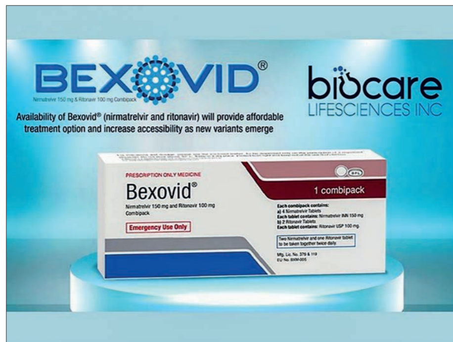
Philippines FDA approves world's first generic version of Pfizer's anti-Covid pill. The Manila city government on 10 March 2022 received its order of Bexovid drug for the treatment of mild to moderate coronavirus disease 2019 (Covid-19) for individuals 12 years old and above.

The sub-licences allow manufacturers to produce the raw ingredients for nirmatrelvir, and/or the finished drug itself co-packaged with the HIV medicine