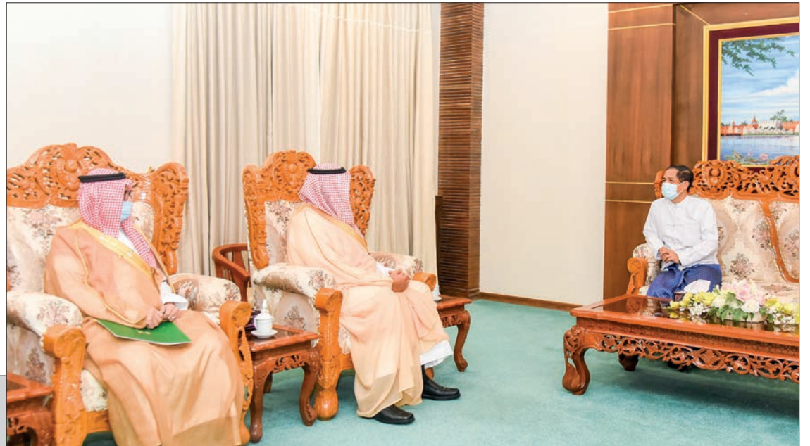
The Union Minister for International Cooperation receives the Saudi Arabian Ambassador to Myanmar.

They cordially exchanged views on the importance of religious harmony, expanding bilateral cooperation, particularly in trade, investment and energy sectors.—MNA