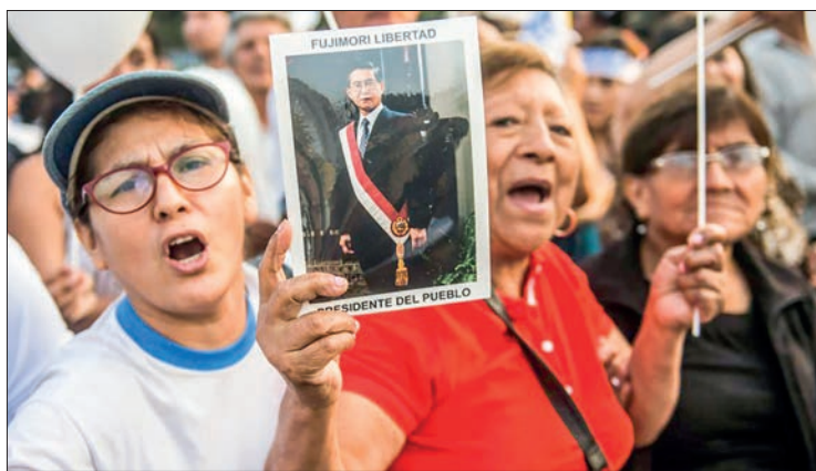
Demonstrators hold a march in favour of the pardon of former Peruvian President Alberto Fujimori in Lima, on 12 January 2018.

PERU'S constitutional court on Thursday ordered the release of disgraced former president Alberto Fujimori, who is serving a 25-year sentence for crimes against humanity, a judicial source said. The court reinstated a “humanitarian pardon” given to the 83-year-old in December 2017