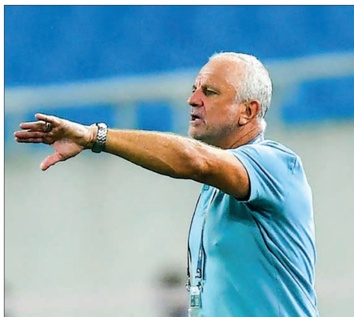
Australia coach Graham Arnold has tested positive for Covid-19.

AUSTRALIA suffered a major setback Friday ahead of their must-win World Cup qualifier against Japan next week with coach Graham Arnold testing positive for Covid-19.