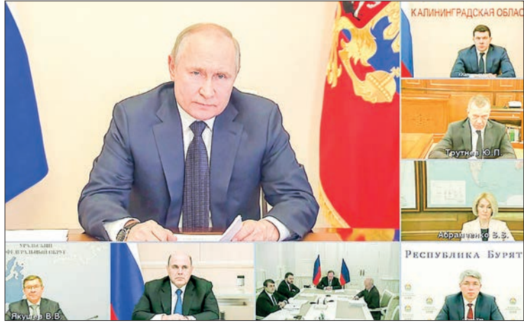
The policy of containing and weakening Russia, including through economic isolation, or a blockade, is a premeditated long-term strategy, Putin said.

THE world is now paying for the West's attempts to maintain its elusive dominance by any means possible, Russian President Vladimir Putin said.