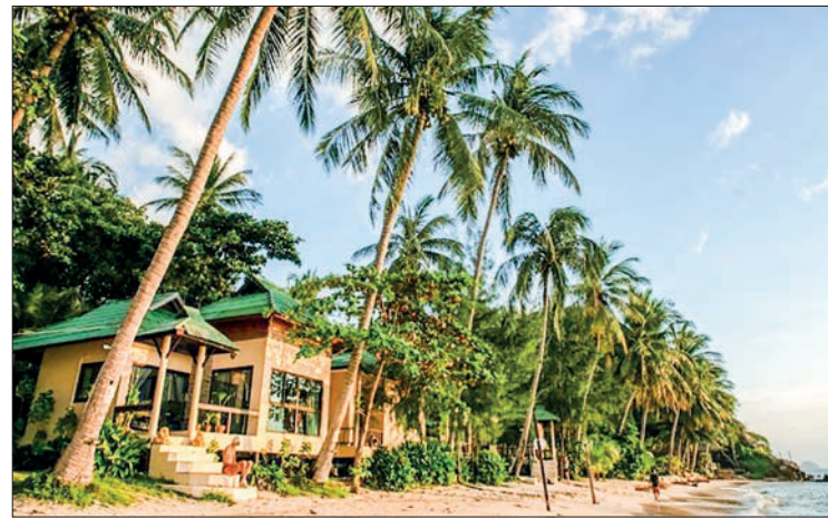
Thailand's tourism industry accounts for about a fifth of the country's economy.

Thailand is currently recording around 25,000 new cases of Covid a day as the Omicron variant spreads around the country, but officials hope this will tail off in time for them to move to a "post-pandemic" phase from July.