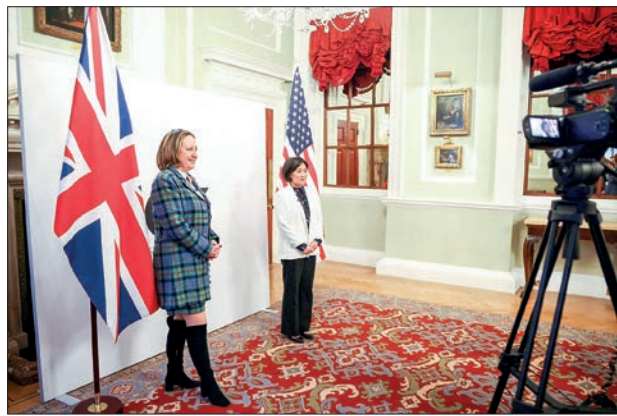
Britain's International Trade Secretary Anne-Marie Trevelyan (L) and US Trade Representative Katherine Tai pose for a picture during a G7 trade summit at Mansion House in London on 22 October 2021.

WASHINGTON and London have chosen the port city of Baltimore — just an hour's drive from the US capital — as the site of Monday's talks on deepening their economic relationship.