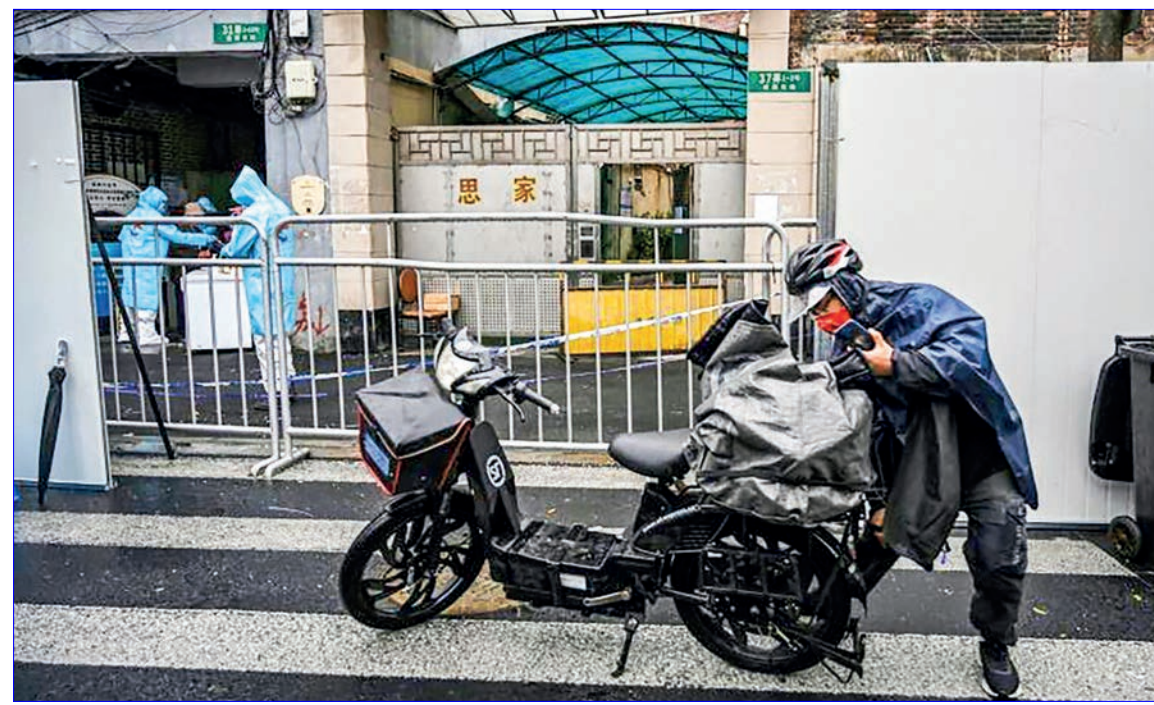
Food runners report they are currently making up to 100 deliveries a day, which are often left outside housing complexes to avoid human contact.

With the highly transmissible Omicron variant spreading, authorities have imposed stay-at-