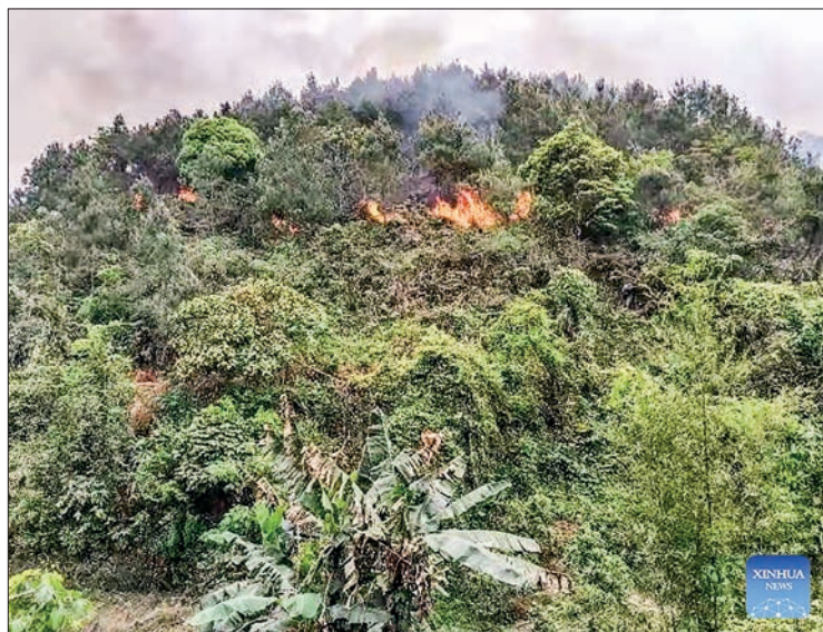
Photo taken with a mobile phone shows the plane crash site in Tengxian County, south China's Guangxi Zhuang Autonomous Region, 21 March 2022. A passenger plane with 132 people aboard crashed in south China's Guangxi Zhuang Autonomous Region Monday afternoon, said the regional emergency management department.

China Eastern Airlines said on Monday that it has initiated an emergency response mechanism following the crash. It has established nine special working groups for aircraft disposal, accident investigation, family assistance, logistics support, legal support, public relations, security, financial insurance, and cargo disposal. The working groups were en route to the site, and the company said that the cause of the accident would be fully investigated.— Xinhua ■