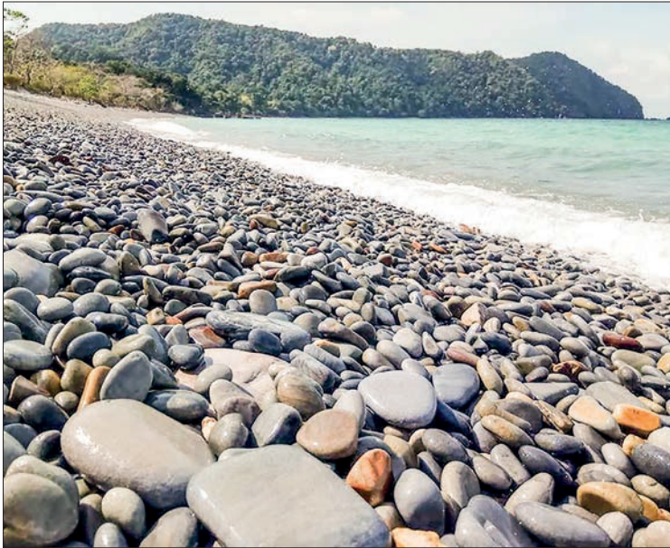
One of the tourist destinations in Myeik Archipelago.

ONCE-POPULAR Myeik Archipelago destination in Taninthayi Region crowded with the visitors attract only the small number of visitors and tourism businesses have nearly come to a halt, said a tourism entrepreneur.