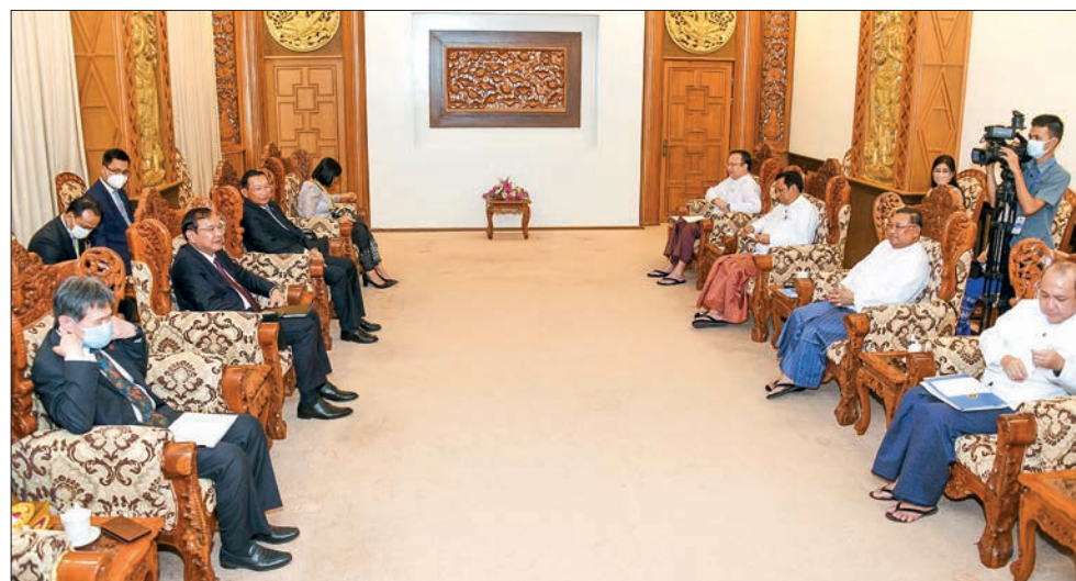
The MoFA Union Minister receives the Special Envoy to Myanmar.

U Wunna Maung Lwin, Union Minister for Foreign Affairs of the Republic of the Union of Myanmar received Mr Prak Sokhonn, Deputy Prime Minister, Minister of Foreign Affairs and International Cooperation of Cambodia and special envoy to Myanmar of the ASEAN Chair and Mr Dato Lim Jock Hoi, Secretary-General of