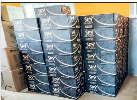
Seized consumer goods in Kayin State.