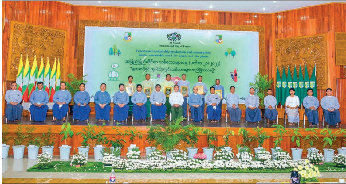
The International Day of Forests event in progress in Nay Pyi Taw.

THE Department of Forest Research in Nay Pyi Taw held a ceremony to celebrate International Day of Forests yesterday morning, and Union Minister for Natural Resources and Environmental Conservation U Khin Maung Yi attended and addressed the ceremony.