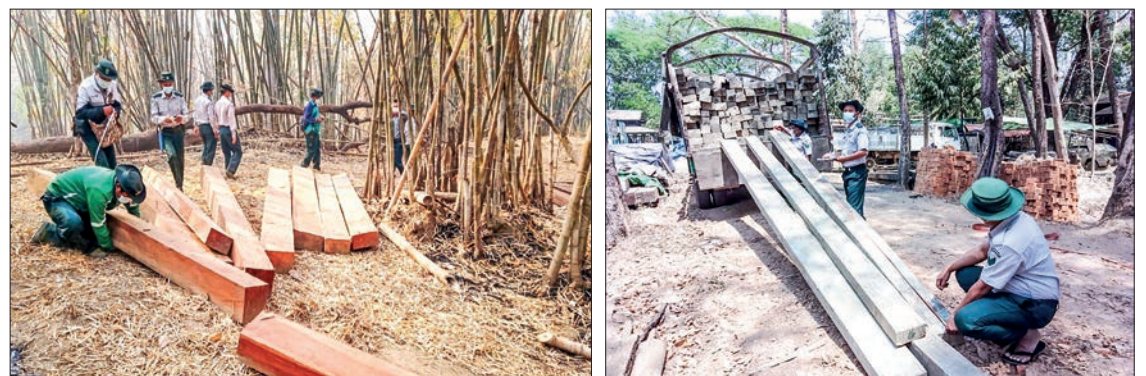
Confiscated illegal timbers in Bago Region and Yangon Region.

A combined inspection team led by the Yangon Region Department of Forestry also conducted inspections and seized a six-wheel truck carrying 8.742 tonnes of illegal timbers (estimated value of K35,411,940) near Milestone (18/5) on the Yangon-Mandalay expressway in Hlegu Township under the Forest Law.