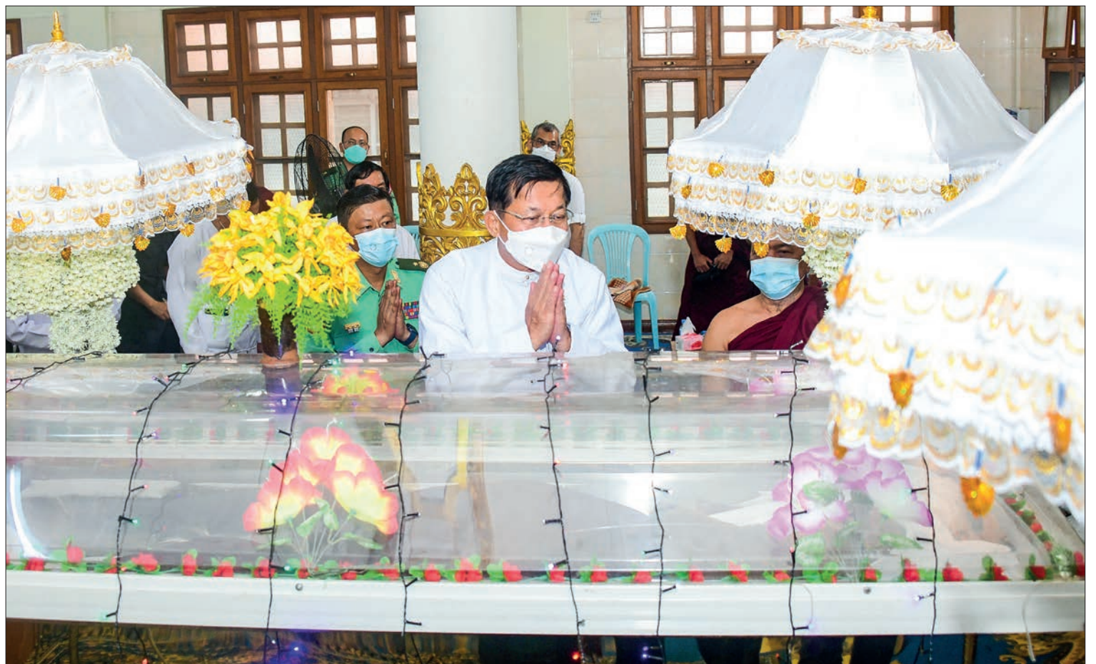
State Administration Council Chairman Prime Minister Senior General Min Aung Hlaing pays homage to remains of late State Ovadacariya Chairman of Shwegyin Nikaya Dhipati Presiding Sayadaw in Yangon on 21 March 2022.

First, the Senior General and party paid homage to Shwegyin Nikaya Upa Chairman Maha Nayaka Joint Shwegyin Sangharaja Chancellor of Sitagu World Buddhist Academies Abhidhaja Maha Rattha Guru Abhidhaja Agga Maha Saddhamma Jotika Agga Maha Pandita Maha Dhammakathika Bahujana Hitadhara Sitagu Sayadaw Bhaddanta Nyanissara and donated K10 million to organize the final rites of late Sayadaw.