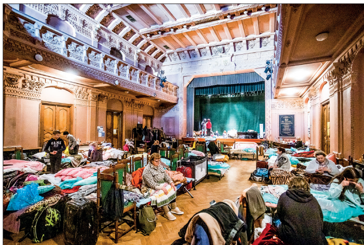
Valentina from Kyiv (C) sits in the theatre of the Ukrainian House where a shelter for refugees is installed in Przemysl, southeastern Poland, near the Ukrainian-Polish border, on 18 March 2022. More than 3.25 million refugees have fled Ukraine since the Russian invasion, the United Nations said on 18 March 2022, with more than two million crossing the Polish border.

"As if to counter the despair, we have also witnessed overwhelming acts of welcome