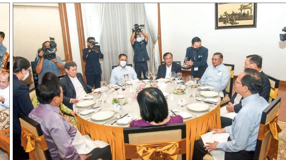
The MoFA Union Minister hosts dinner for the Special Envoy of the ASEAN Chair.

During the meeting, Union Minister explained that the implementation of the five-point consensus must be a Myanmar-owned and Myanmar-led process. He also highlighted that the special envoy's first visit to Myanmar would pave the way