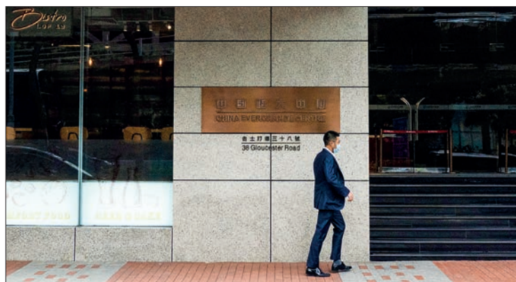
A man walks past the signage of the China Evergrande Centre in Hong Kong on 21 October 2021.

Among those embroiled in the crisis is Evergrande, one of the country's largest developers, which has been involved in restructuring negotiations