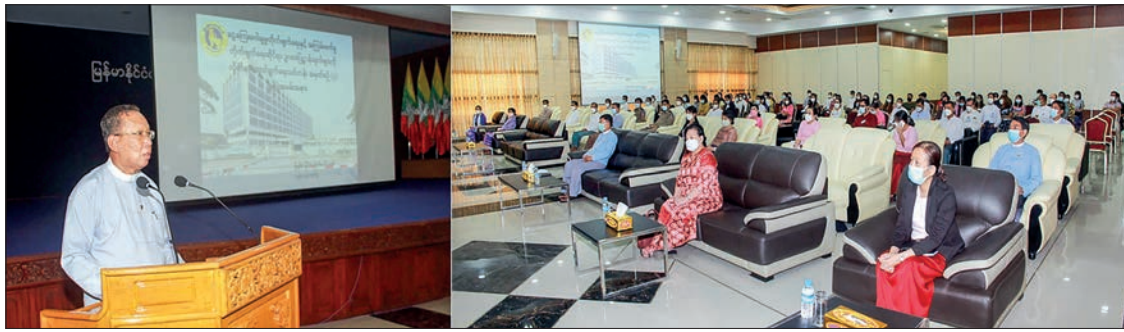
The Central Bank of Myanmar opens the regulatory compliance training course (Third Batch) for Anti-Money Laundering and Countering the Financing of Terrorism (AML/CFT) in Yangon yesterday.

that the CBM has been continuously conducting regulatory compliance training courses regarding AML/CFT. This effort is to control the hundi business, an informal money transfer system, promote a formal channel for remittance service and increase the country's revenue, following