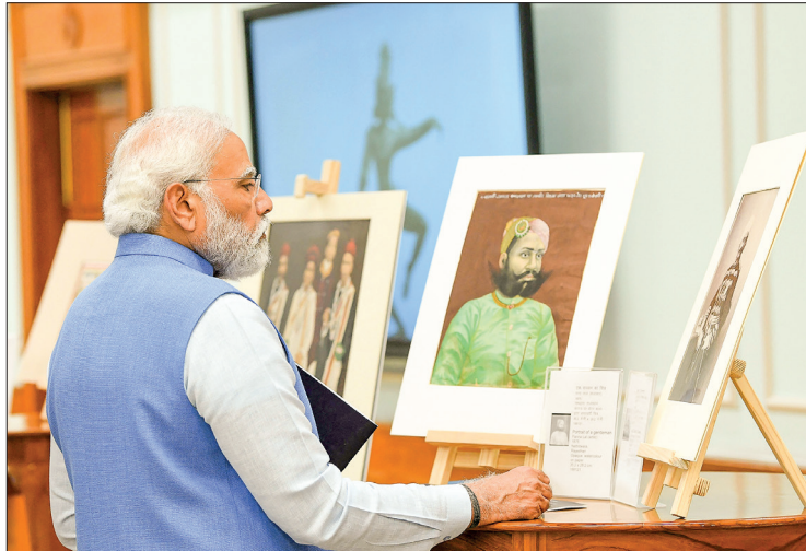
This handout photograph taken on 21 March 2022 and released by the Indian Press Information Bureau (PIB) shows India's Prime Minister Narendra Modi inspecting the antiquities repatriated from Australia, in New Delhi.

thank you for the initiative to return ancient Indian artefacts," Modi told his Australian coun-