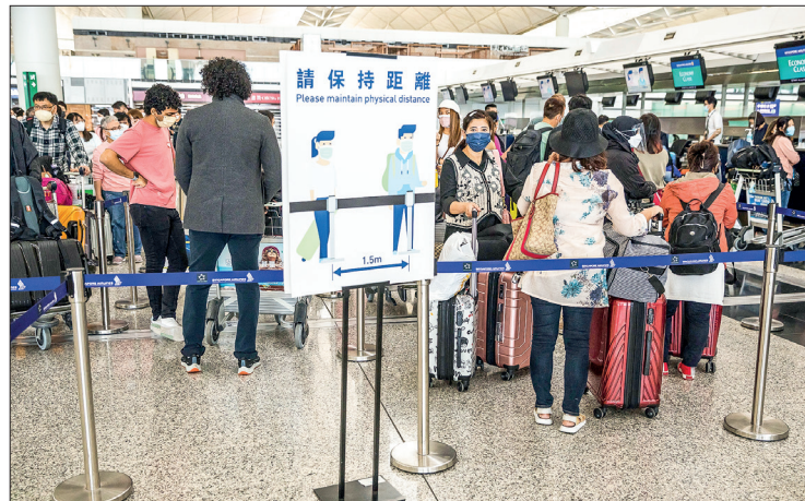
People wait in a queue to check-in for their flight at Hong Kong International Airport in Hong Kong on 21 March 2022.

Once the variant broke through, hospital wards were flooded with patients and morgues overcrowded with