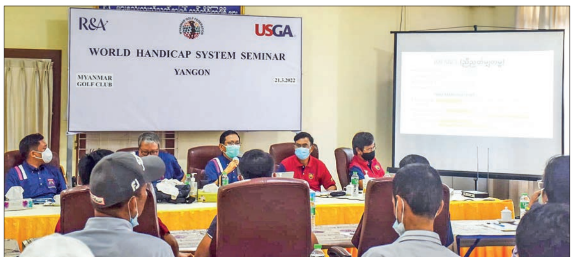
The Myanmar Golf Federation officials address the World Handicap System Seminar at the nine-miles golf club in Yangon on 21 March 2022.

After that, the attendees asked questions and the officials explained. The event was attended by 30 enthusiasts from various golf clubs.