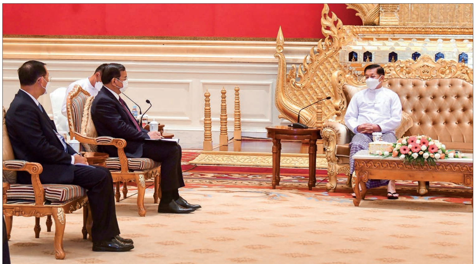
State Administration Council Chairman Prime Minister Senior General Min Aung Hlaing receives ASEAN Special Envoy to Myanmar Mr Prak Sokhonn and ASEAN Secretary-General Dato Lim Jock Hoi at the Credentials Hall of the SAC Chairman Office in Nay Pyi Taw yesterday.

During the meeting, they openly exchanged views on the pathways of Myanmar entering the multiparty democratic system in 2010, serving the State responsibilities by the SAC under the 2008 Constitution, which was enacted by a referendum, due to the voting fraud in the 2020 multiparty general election, protests evolved into violence sparked by political dissents, murder cases without any reasons, mine attacks on government buildings and schools, security measures of the SAC to ensure the lives and prosperity of the people, implementations on the Five-Point Consensus of ASEAN, distribu-