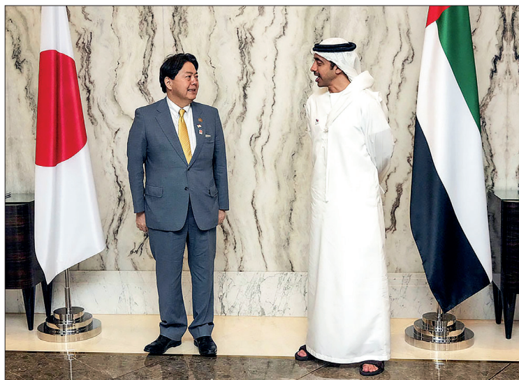
Japanese Foreign Minister Yoshimasa Hayashi (L) is pictured with his UAE counterpart Sheikh Abdullah bin Zayed Al Nahyan in Abu Dhabi on 20 March 2022.

JAPANESE Foreign Minister Yoshimasa Hayashi called on the United Arab Emirates on