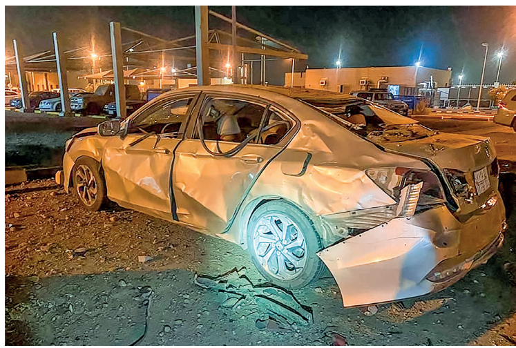
This handout image released by the Saudi press Agency (SPA) shows a damaged car parked at an Aramco oil terminal in the southern Saudi border town of Jizan on 20 March 2022, following a "drone assault" the previous day on a petroleum products distribution terminal run by Aramco.

TOP crude exporter Saudi Arabia warned Monday that Yemeni rebel attacks on the kingdom's oil facilities pose a "direct threat" to global supplies.