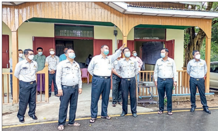
The Union Construction Minister inspects the renovation works at the Maha Pasana Cave in Yangon.

Afterwards, the Union minister and party arrived at the construction site of the old cable-stayed bridge Panmawady