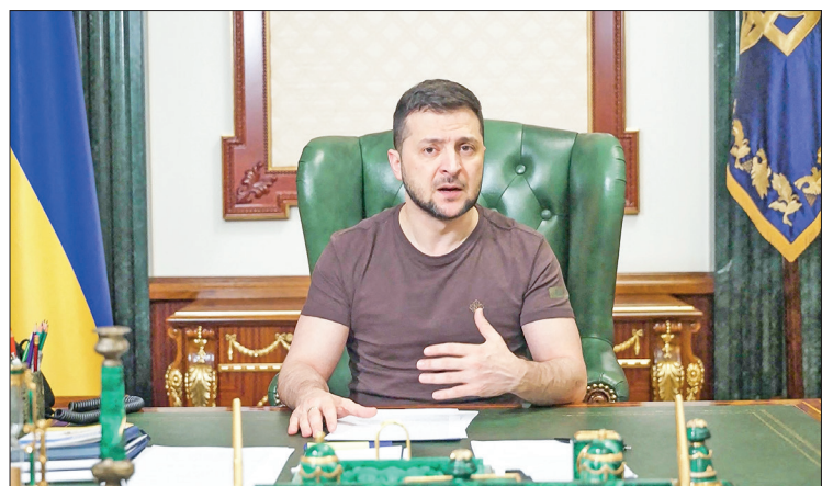
In this handout picture taken on 20 March 2022 and released by the Ukrainian Presidency Press Office, Ukrainian President Volodymyr Zelensky delivers a video address in Kyiv.

UKRAINIAN President Volodymyr Zelensky suggested Jerusalem could host peace talks between him and Vladimir Putin, his latest attempt to push for a meeting with his Russian counterpart.