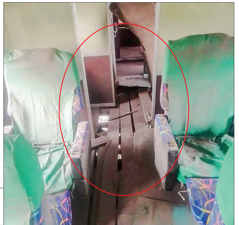
Ravages of train cabin in the aftermath of mine blast.

People are urged to work together to prevent these acts of vandalism and to arrest those involved in the crime as soon as possible by reporting any information and movement related to them, in the interests of the stability and security of the townships and villages. Worthy awards will be granted to whistleblowers, it is reported. — MNA