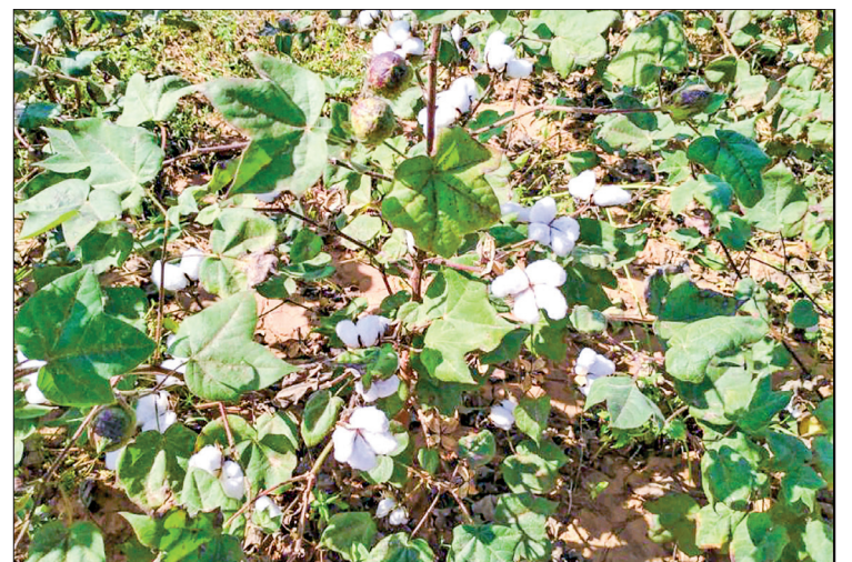
Those cotton acres are being implemented with water supply by the irrigation network starting from 20 February 2022 and over 900 acres have been cultivated. The remaining is slated to complete by the end of March.

Additionally, the department is striving to carry out seed farms for the pre-monsoon season. Those seeds will fulfil the requirements of cotton seeds for the 2022-2023 late monsoon season. The cotton is cultivated throughout the monsoon, pre-monsoon and late monsoon season. Last year, over 7,000 acres of long-staple cotton were cultivated in the monsoon and late monsoon periods. — Maung Aye Chan/GNLM