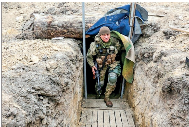
A Ukrainian serviceman walks along a trench on the frontline of the northern part of Kyiv region on Monday.