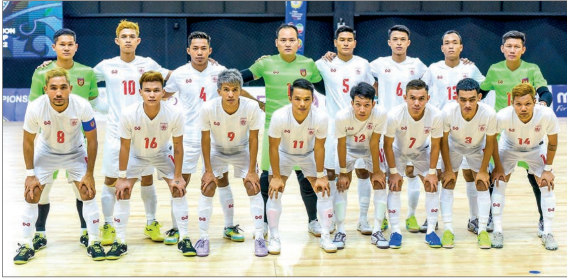
Myanmar futsal players pose for a group photo during a match in Thailand Invitational Cup.