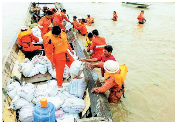
Firemen are seen helping flood victims.