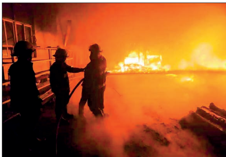
Firemen makes the extinguishing efforts amid the flames of fire in the industrial zone.