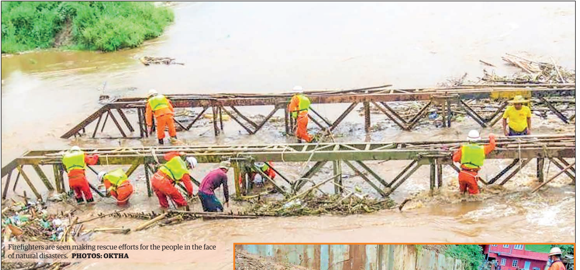
Firefighters are seen making rescue efforts for the people in the face of natural disasters.

I N a bid to protect the lives, property and heritage of the State and the people, fire safety measures and natural disaster response programmes are undertaken. Such an effort can minimize the hazards triggered by disaster and fire. Being the unpredictable nature of the disaster, fires can threaten lives and property in the State and hinder the country's development. This being so, to keep abreast of the development activities and keep connected with other countries, implementation of those programmes can help bring towards effective disaster risk management. Every citizen must conserve the natural resources of the country. Most importantly, the firefighters across