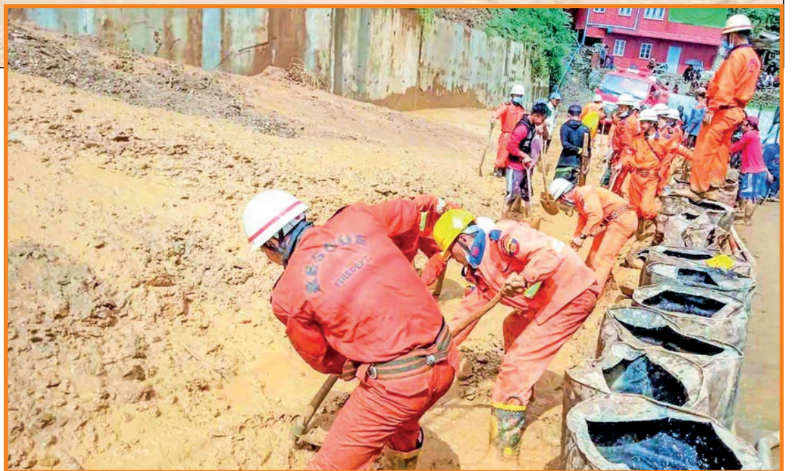
Firemen are contributing their rescue efforts in one of the incidents of natural disasters.

Myanmar Fire Brigade is continuously taking fire safety measures. The hot season is vulnerable to fire outbreaks. The automatic fire sprinkler sys-