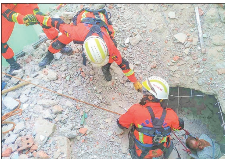
Fire Brigade members are in brave action in one of the rescue efforts.

Ukrainian firefighters were seen battling with a huge blaze during the Ukraine-Russia conflict. Firefighters never leave the fire incidents for rescue and migration. Every country has different patterns of politics, economics, education and health. Nonetheless, every firefighter across the globe is ready to serve the lives of the people, all of them perform the same and they are committed to the job. Maltese Cross is known around the world as the symbol of fire