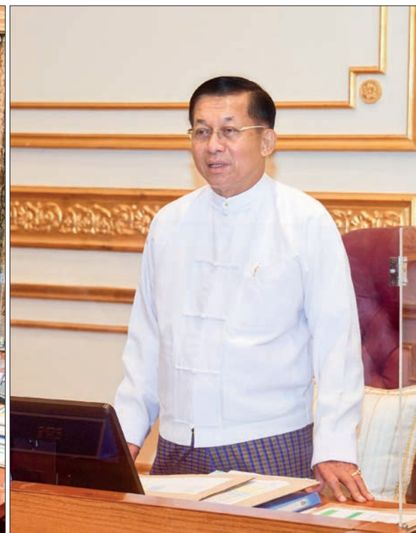
State Administration Council Chairman Prime Minister Senior General Min Aung Hlaing addresses the SAC meeting 3/2022 in Nay Pyi Taw on 29 March 2022.

M EDICAL and technical universities will give priority to outstanding applicants for studying respective subjects in the coming academic years, said Chairman of the State Administration Council Prime Minister Senior General Min Aung Hlaing at the SAC Meeting 3/2022 at the Office of SAC Chairman in Nay Pyi Taw yesterday morning.