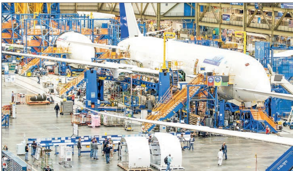
The Boeing 787 Dreamliner sits on the assembly line 13 June, 2012 at the Boeing Factory in Everett, Washington.