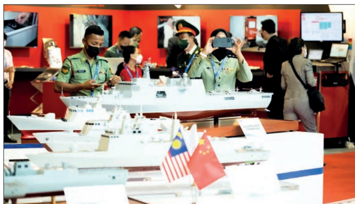
Visitors take photos at the booth of China Shipbuilding Trading Co., Ltd. at Defense Services Asia 2022 in Kuala Lumpur, Malaysia, 28 March 2022.

Morrison said he had been in contact with New Zealand Prime Minister Jacinda Ardern, who this week called the draft deal "gravely concerning" and said there was "very little reason in terms of the Pacific security for such a need and such a presence".—AFP ■