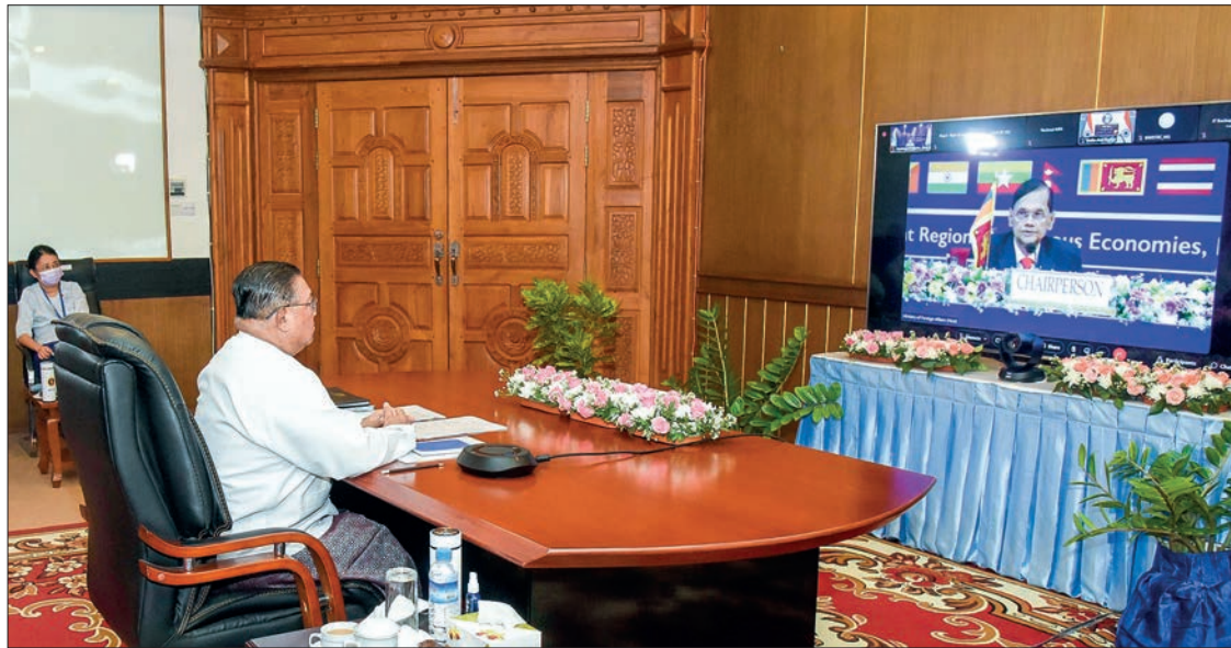
MoFA Union Minister U Wunna Maung Lwin joins the 18 th BIMSTEC Ministerial Meeting virtually.

In his statement, Union Minister U Wunna Maung Lwin stated that BIMSTEC has set its silver jubilee on 6 June of this year in promoting deeper cooperation among the Member States for their common goal of regional sustainable develop-