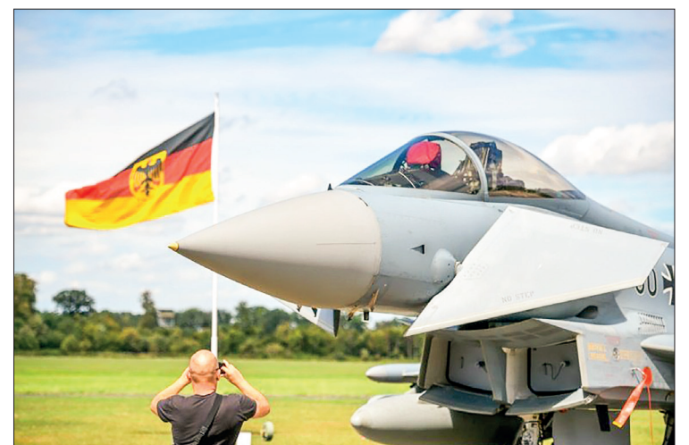
After the Russian attack on Ukraine began, Scholz pledged a special budget of 100 billion euros for the military.

And as for ground equipments, out of 350 Puma combat vehicles, only 40 are considered "fit for war".—AFP ■