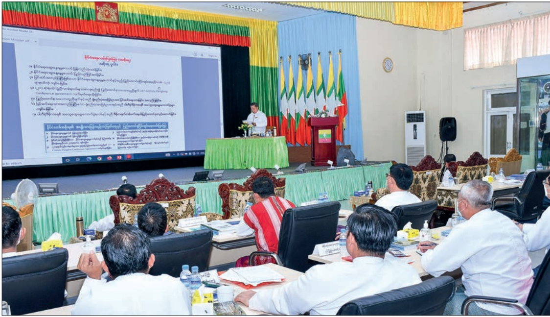
MoEA Union Minister U Saw Tun Aung Myint talks on the peacemaking processes at the second-day forum.

THE second day of ethnic representatives' meeting (forum) aiming to strengthen the ethnic solidarity and Union spirit was organized in Nay Pyi Taw according to the COVID-19 health