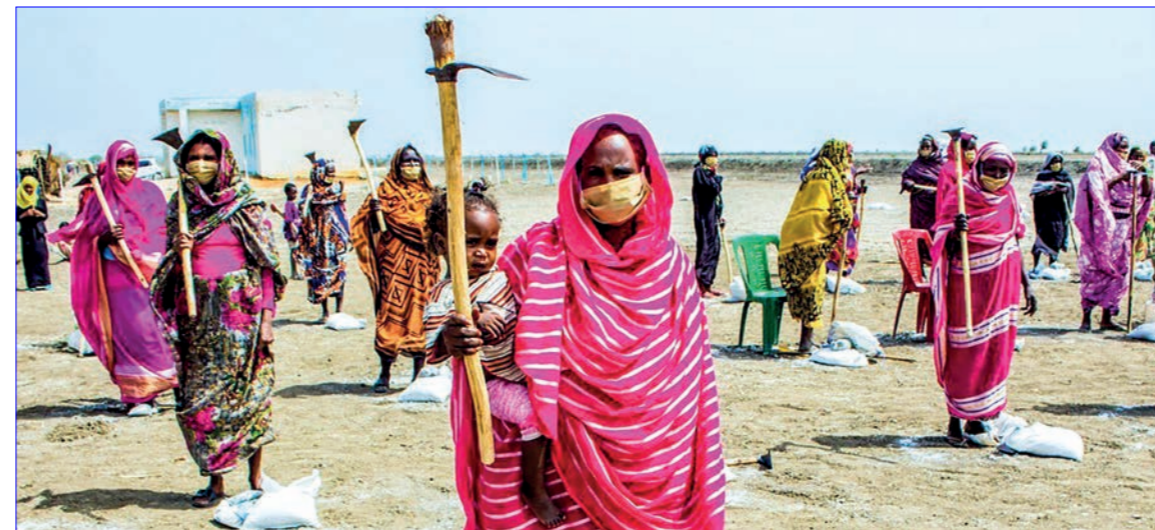
UNDP is supporting Sudanese farmers whose incomes and crop yields have been impacted by COVID-19 lockdowns.

New analysis by UNDP shows that most of the vulnerable countries are found in Sub-Saharan