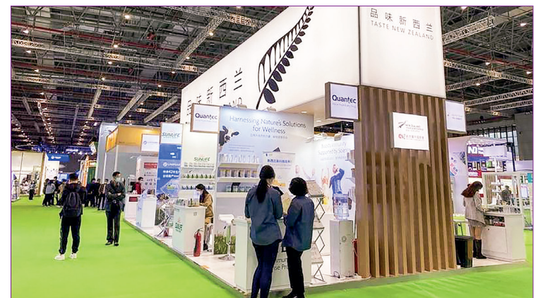
File photo shows the exhibition booth of New Zealand at the third China International Import Expo in Shanghai, east China.

Song said that the past years witnessed continued revenue growth for the company despite the COVID-19 pandemic disrupting the supply chain severely, raising the input costs and squeezing the margin of most New Zealand exporters.