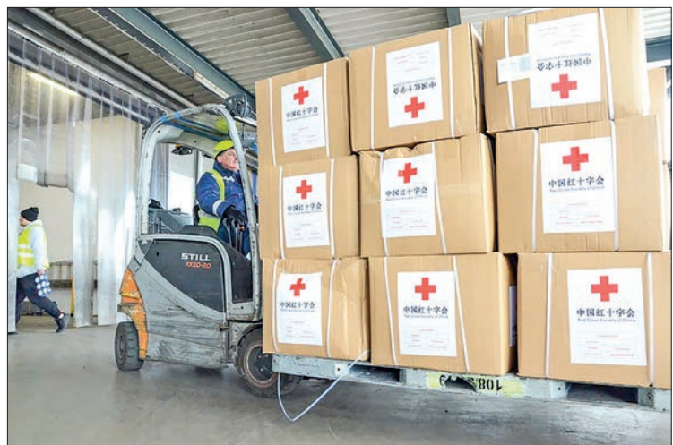
Humanitarian aid supplies sent by the Red Cross Society of China to the Ukrainian Red Cross Society are transported in Warsaw, Poland, 15 March 2022.

UN Secretary-General Antonio Guterres on Monday launched an initiative for a humanitarian ceasefire in Ukraine.