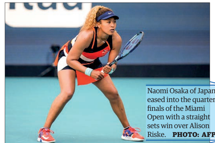
Naomi Osaka of Japan eased into the quarter-finals of the Miami Open with a straight sets win over Alison Riske.

NAOMI Osaka will face American Danielle Collins for a place in the semi-finals of the Miami Open after the Japanese star beat Alison Riske 6-3, 6-4 on Monday.