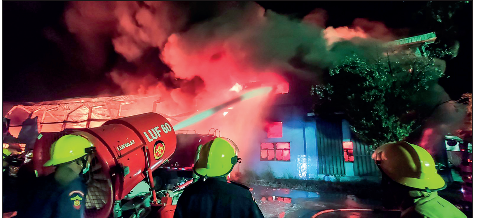
Fire Brigade members are extinguishing the fires in one of the industrial zones to minimize the loss of property.

Yangon is the commercial hub of the country and fire outbreaks can cause a significant loss in the city. It took so long to put out the major urban conflagrations such as herbal warehouse fire in Mingala Taungnyunt in Yangon Region on 29 December 2011, teak and