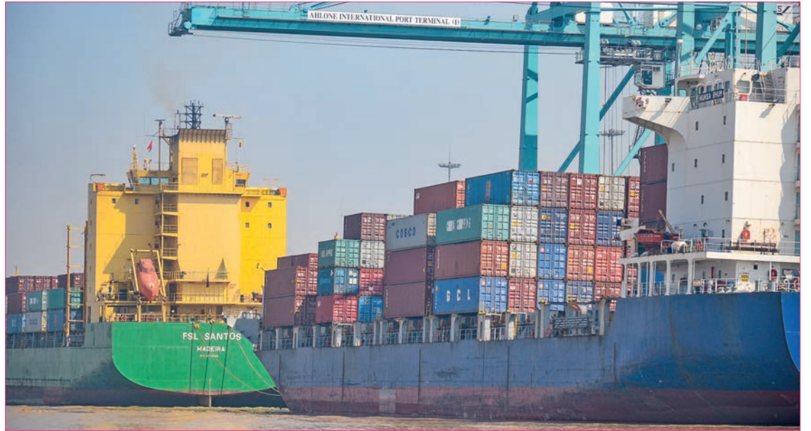
The country currently has nine ports involved in sea trade. Yangon Port is the main gateway for Myanmar's maritime trade and includes the Yangon inner terminals and the outer Thilawa Port.

The country currently has nine ports involved in sea trade. Yangon Port is the main gateway for Myanmar's maritime trade and includes the Yangon inner terminals and the outer Thilawa Port. — KK/GNLM