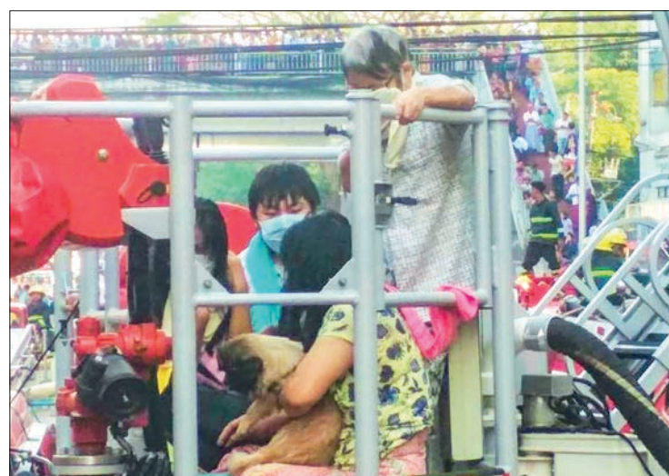
Fire Brigade members are seen giving their helping hands to the people during the fire incident in Yangon.