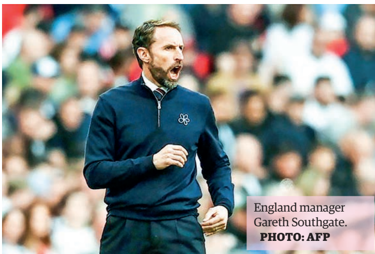
England manager Gareth Southgate.

GARETH Southgate has told his England stars to place extra focus on penalty practice as he sets his sights on winning the World Cup.