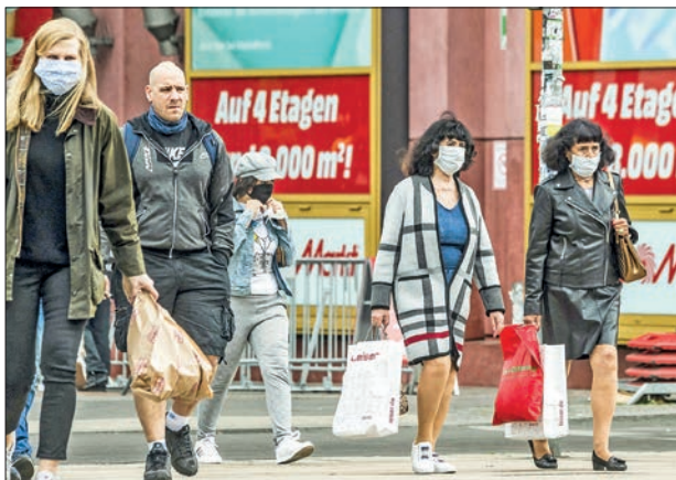
Shoppers walk out of a shopping mall in Berlin on 3 March.

THE mood of consumers in Germany has darkened significantly as the Russian invasion of Ukraine dimmed the outlook for Europe's largest economy, according to a key survey published Tuesday.