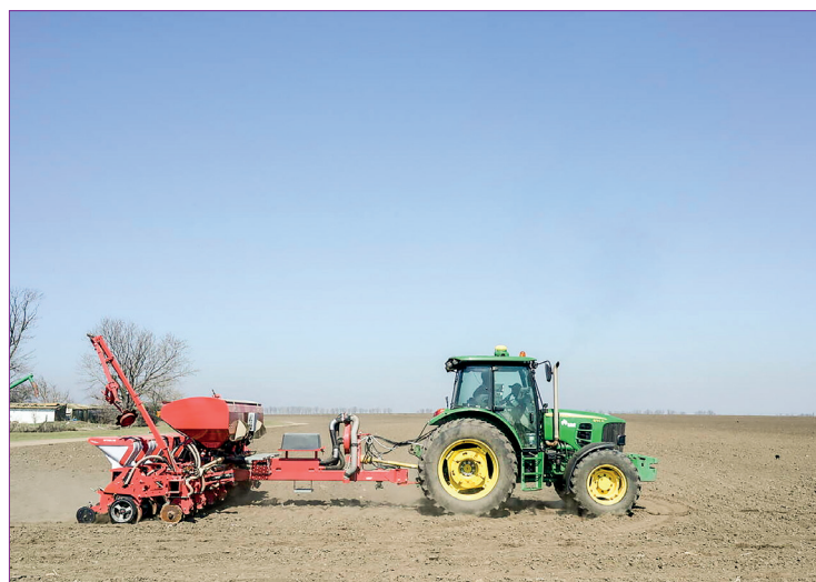
Ukraine is the world's top producer of sunflower oil and a major exporter of wheat, a breadbasket of the world under threat from the Russian invasion.

Mykolaiv is facing a daily barrage of Russian shelling