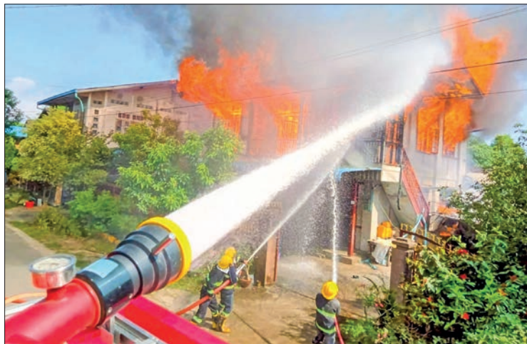
Firefighters are aiming their firehoses at the houses to protect the property of the people.

coal fire inside Myanmar International Terminal Thilawa in Kyauktan Township on 26 March 2012, Aung Moe Khaing cold storage fire in Kyauktan on 11 January 2013, Coca Cola factory fire on 24 September 2015, fire on the 22-floor of the hotel is under construction on Parami Road, Mayangon Township on 17 November 2015, Mingala market fire on 9 January 2016, fire outbreak of a tanker carrying jet fuel in Dagon Myothit (South) on 6 August 2017, Kandawgyi Palace hotel fire on 19 October 2017, YPI garment factory fire