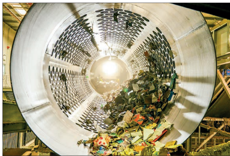
With only an estimated nine per cent of plastics ever produced recycled, campaigners say the only long-term solution to the plastic waste crisis is for companies to make less and consumers to use less.

THE resumed fifth session of the UN Environment Assembly (UNEA-5) wrapped up on Wednesday with delegates adopting a resolution to pave the way for establishment of a legally binding global treaty by 2024 to end plastic pollution.