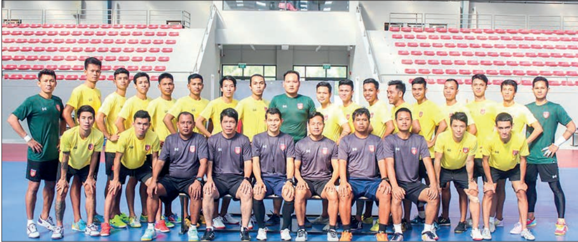
Myanmar National Futsal Team are seen with team's head coach and team administration officials.

MYANMAR National Futsal Team will compete in NSDF Futsal invitation 2022 organized by the Thai Football Federation and is placed in Group B according to drawing-lot result.