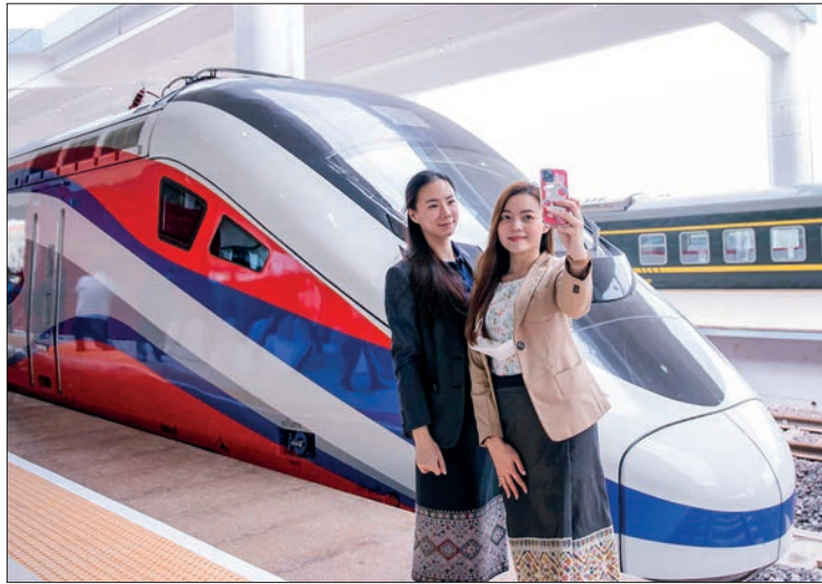
The China-Laos Railway connects Kunming in Yunnan Province with the Laotian capital Vientiane. It is the first overseas railway jointly constructed and operated by the two countries.

THE China-Laos Railway has transported over 1.7 million passengers and 1.1 million tonnes of cargo since it was launched in December 2021, said the transport authorities of southwest China's Yunnan Province.