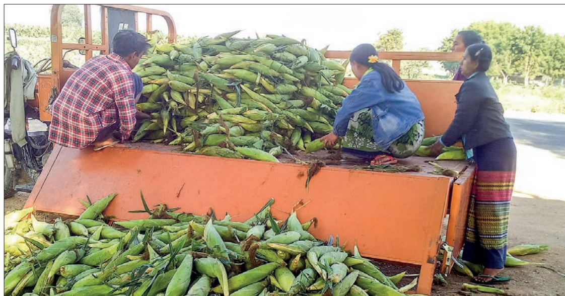
The corn is cultivated up to four times a year. The local farmers mainly grow sweet corn and sticky corn. The growers also grow other corn species, locally called Kyattamaw corn sometimes.

Some of the growers are growing the corn using Latpachaypaw river water while most of the farmers