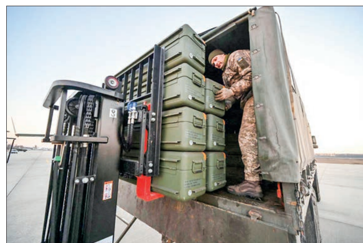
Military assistance shipped from Lithuania to Boryspil Airport, in Kyiv, on 13 February.

"Further military equipment is ready to be sent," a defence ministry spokeswoman told AFP without giving details, noting