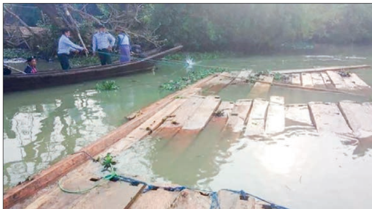
Seized illegal timbers.

THE Forest Department under the Ministry of Natural Resources and Environmental Conservation implements the community