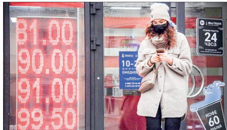
The Moscow stock exchange has been closed since Monday and Russian Prime Minister Mikhail Mishustin announced on Tuesday that Russia was preparing a decree to stop the hemorrhaging of foreign investment to the country. A woman walks past a currency exchange office in central Moscow.

"It might be that they are essentially worthless," Trond Grande, the fund's deputy head,