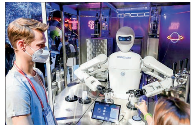
A robot bartender developed by Spanish food tech group Macco Robotics serves drinks -- but also speaks a dozen languages and recognizes customers by their faces.

the block to get in, no security guards at the entrance -- just a virtual reality headset and a booming soundtrack. On the stand of the South Korean operator SK Telecom, visitors had a lively taste of the metaverse, the immersive version of the internet touted as the centrepiece of the next online generation.— AFP ■