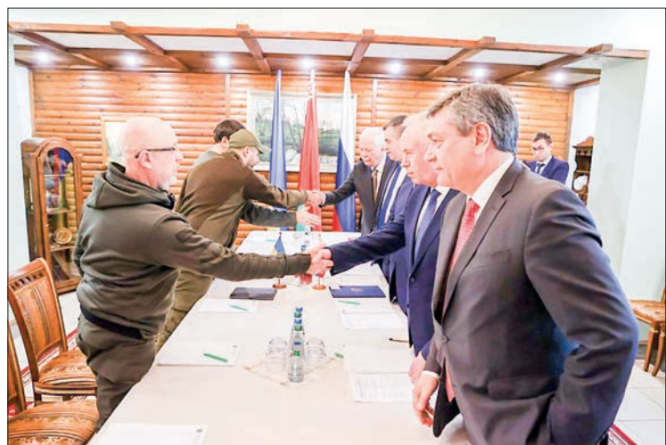
Photo taken on 3 March 2022 shows a view of the second round of talks between Russian and Ukrainian delegations at the Belovezhskaya Pushcha on the Belarus-Poland border.

RUSSIA and Ukraine agreed to organize humanitarian corridors to evacuate civilians in the second round of talks in Belarus on