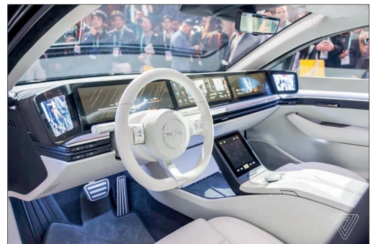
Japanese electronics giant Sony and carmaker Honda have created a joint venture to make and sell electric vehicles.