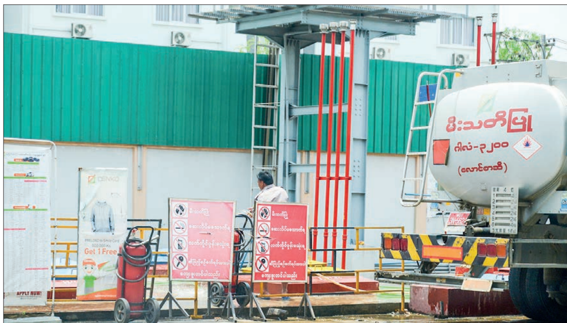
Bowser supplies the fuel oil at one of the filling stations in Yangon.

THE price of fuel oil surged up to over K1,900 per litre in the Yangon domestic market, according to the fuel oil filling stations.