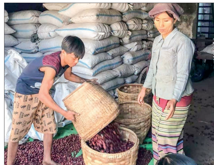
The price of jujube nuts stands at K23,000 per viss (a viss equals 1.6 kilogrammes). Some jujube fruits are made into jams and spread.

The jujube is considered a medicinal herb that calms the mind, reduces hypertension and improves brain function. It’s also used in Chinese traditional medicine due to numerous health benefits.— Lu Lay/GNLM