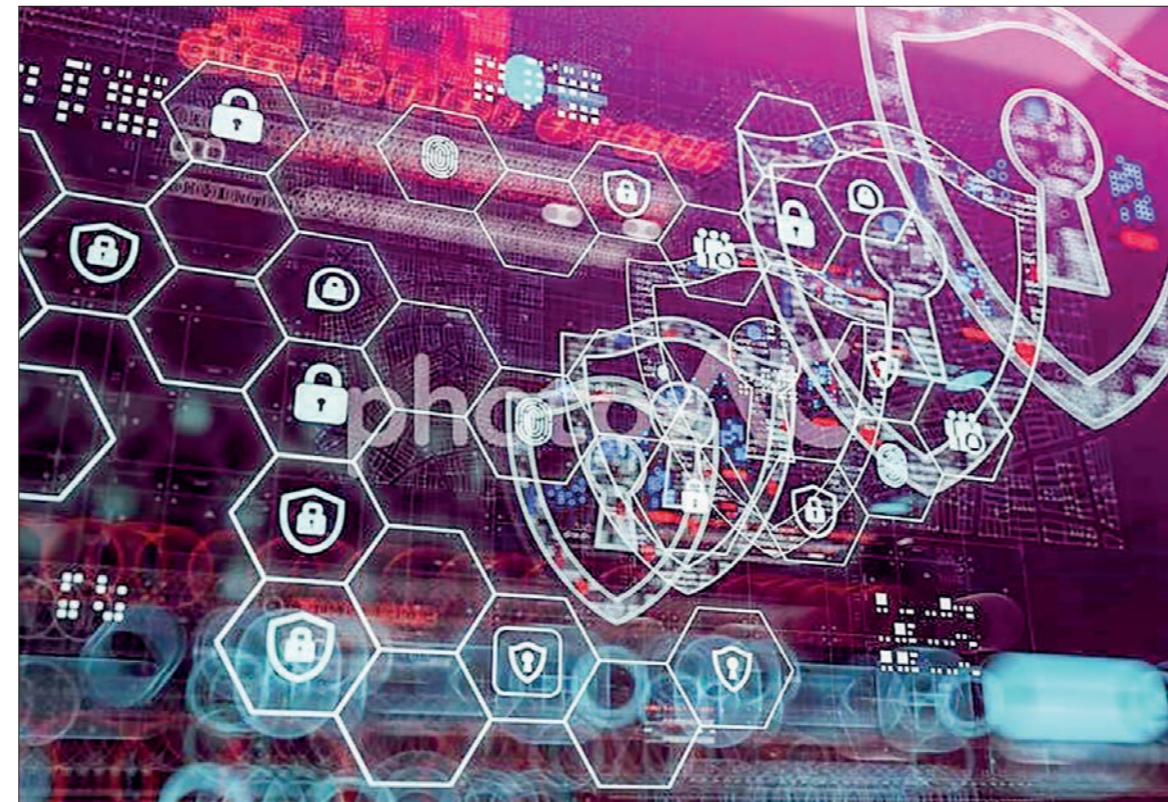
Image of cyber security

The concern of the Financial Services Agency and the Ministry of Economy, Trade and Industry is that there are many groups in Ukraine that carry out cyber-attacks such as ransomware, and in the event of a war, cyber-attacks will become more active in an attempt to illegally raise funds from foreign countries including Japan. The government foresaw and cautioned that it would be a financial burden for Japanese companies with weak informa-