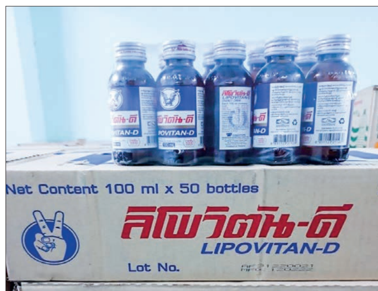
Seized consumer goods in Bago Region.

On 4 March, 5.9398 tonnes of illegal timber (estimated value of K1,023,690) were seized in the Bago district and Thayawady district forest reserves under the Forest Law. — MNA