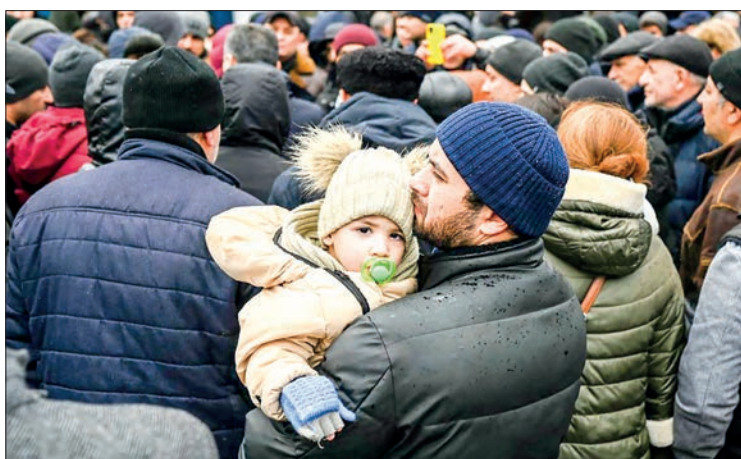
Refugees from Ukraine wait to enter a camp in the Moldovan capital Chisinau on Thursday.

He is volunteering to provide tea and coffee to the stream of Ukrainian refugees who have been pouring across the border since Russia's attack on their country began. In a sign of the