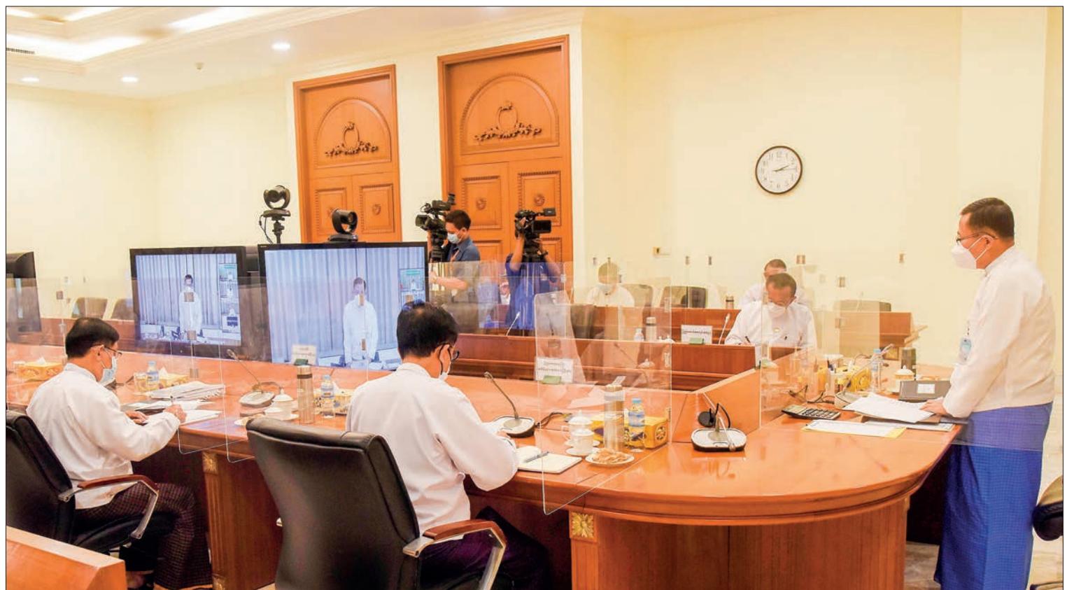
State Administration Council Vice-Chairman Deputy Prime Minister Vice-Senior General Soe Win presides over the coordination meeting on submission of the region and state budgets for the 2022-23 financial year in Nay Pyi Taw yesterday.

The Vice-Senior General stated that the FY2022-23 is to encourage the resurgence of