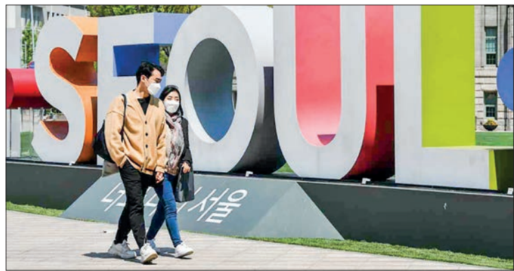
A couple wearing face masks walk through Seoul Plaza in front of the City Hall in Seoul on 23 April 2020.

SOUTH Korea reported 198,803 new COVID-19 cases as of midnight Wednesday compared to 24 hours ago, raising the total number of infections to 3,691,488, the