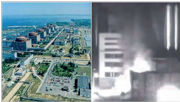
Zaporizhzhia nuclear power plant houses six of Ukraine's nuclear energy reactors, and videos emerged of a fire there after reports it was under Russian attack.

But it remained unclear what the invading forces planned next. President Volodymyr Zelen-