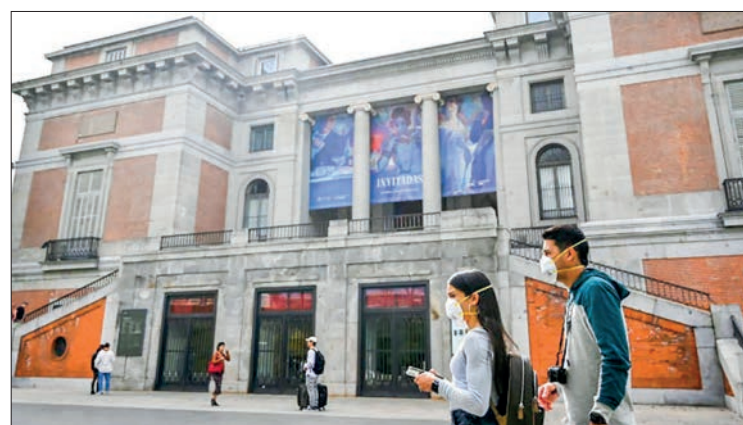
Tourists wearing face masks outside the Prado museum in Madrid after all of the city’s state-run museums were closed to the public due to the coronavirus outbreak.

Despite high vaccination rates, Covid cases exploded over