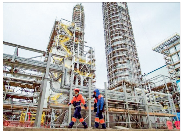
A petrochemical facility on the outskirts of Tobolsk, at the heart of Russia's Siberia.

The senators' proposal was also supported by House Speaker Nancy Pelosi.—AFP ■