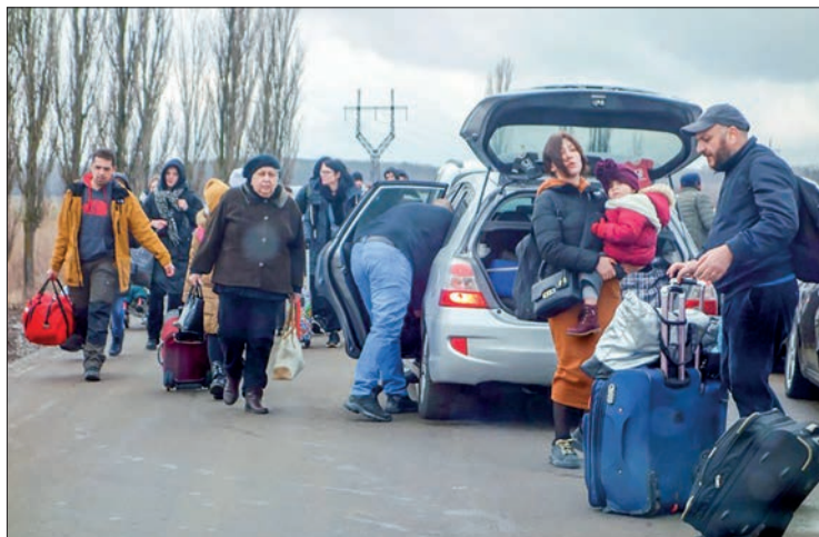
Some people from Ukraine arrive at Palanca checkpoint, Moldova, 2 March 2022.

ONE million refugees have fled Ukraine in the week since Russia's invasion, the United Nations said Thursday, warning that unless the conflict ended immediately, millions more were likely to flee.