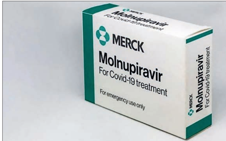
Eight capsules of molnupiravir are taken orally for five days, for a total of 40 capsules.

However “young and healthy patients, including children, and pregnant and breastfeeding women should not be