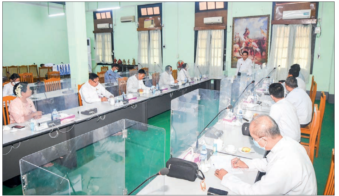
The meeting between the MoI Union Minister and Myanmar Press Council in progress.

The Union minister also handed over the video CD and publication related to the Diamond Jubilee Union Day ceremony to the Myanmar Press Council Chairman and members. — MNA