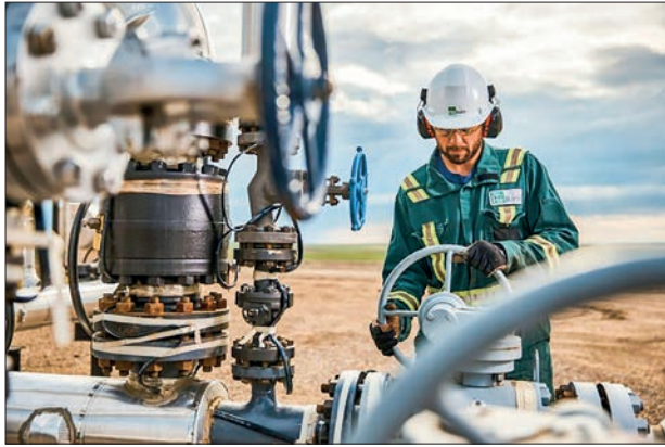
This image shows an employee working at the Battle Creek helium plant near Consul, Saskatchewan, Canada.

HELIUM is the second most-abundant element in the known universe, but to the semiconductor fabricators and doctors who rely on it for their businesses, it is better known as the latest raw material to grow scarce -- and the war in Ukraine could make the shortage worse.