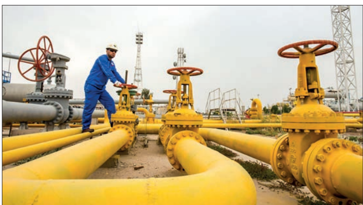
The government has pledged to phase out the practice by 2030 but the road to a greener, less wasteful energy sector is proving a long one. Iraqi gas workers work in Basra. PHOTO: AFP/FILE

For the oil companies exploiting the mega fields around Basra, it is actually cheaper to flare off the associated gas than to capture, process and market it, despite the obvious environmental costs.—AFP