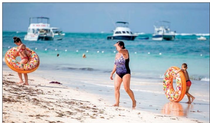
Tourists enjoy a beach in Punta Cana in the Dominican Republic, on 7 January 2022.

The 14,800 Russian tourists are mainly in the eastern province of La Altagracia, home to visitor hotspot Punta Cana. An official survey also found some 1,900 Ukrainian visitors in the country, who will remain in their hotels until a repatriation plan is in place. —AFP ■