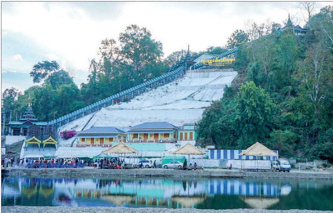
More than 90 makeshift guest lodges have been built for the people to spend their afternoon bathing in Mann Creek, and the price of a lodge is K10,000.

FOLLOWING its brief opening on the 5 th Waxing of Tabodwe, the Mann Shwesettaw Pagoda in Minbu (Sagu) Township, Magway Region, is receiving visitors from all over the country, according to the pagoda Board of Trustees.