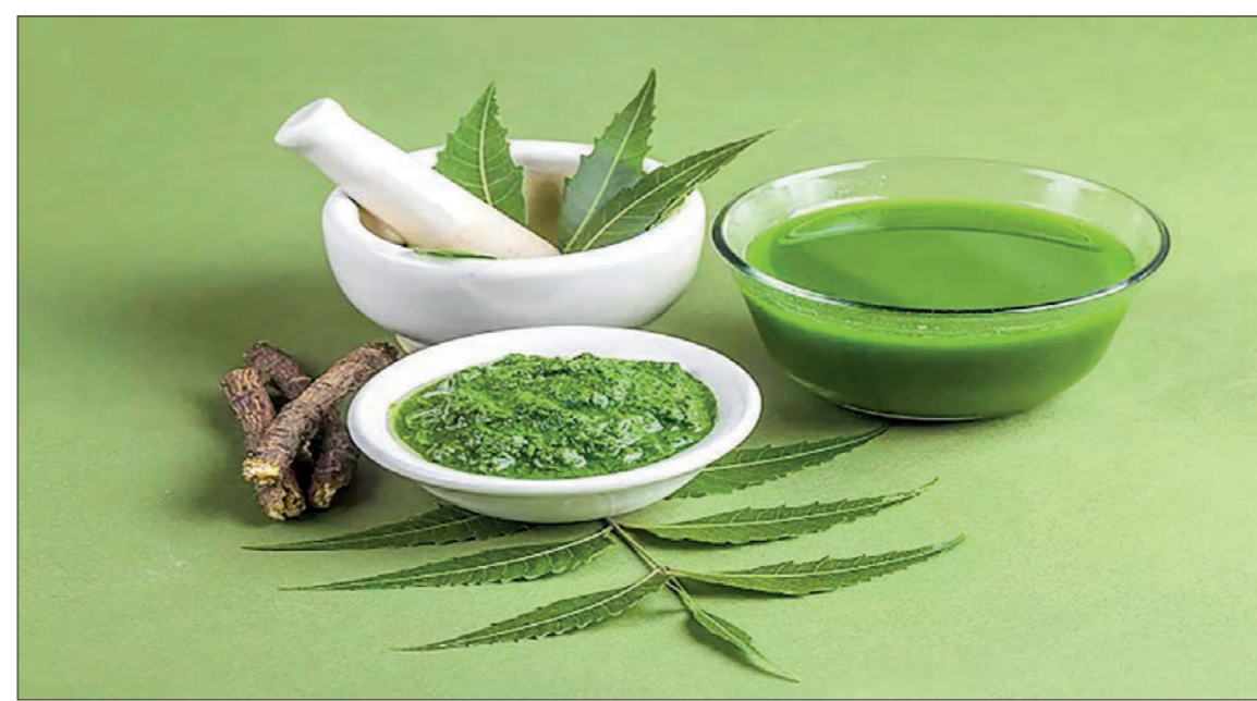
Neem, ( Azadirachta indica ), also called nim or margosa, fast-growing tree of the mahogany family (Meliaceae), valued as a medicinal plant, as a source of organic pesticides, and for its timber. Neem is likely native to the Indian subcontinent and to dry areas throughout South Asia.

"The next step in our research is to identify the specific components in Neem bark extract that are antiviral. Because