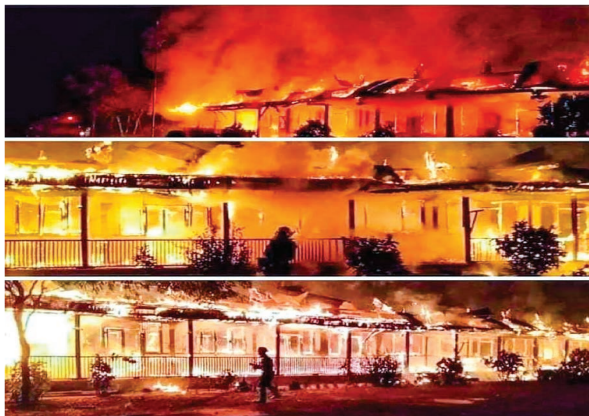
Kamyawkin Basic Education High School in Dawei township on fire in the arson attack of PDF terrorists.

I D now like to present a sorrowful news report spreading on social media that inspired me to write this article after I stopped writing a while. I reckon most Facebook users might have already known the report.