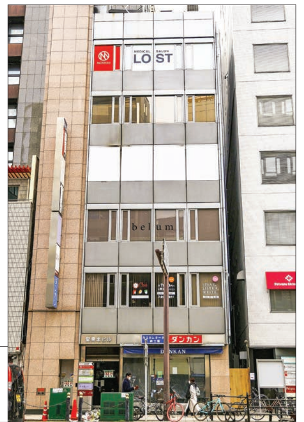
Photo taken on 7 March 2022, shows a building in Osaka that was hit by a deadly fire in December 2021.

Police aims to refer the case to prosecutors later this month. Notes about the comings and goings at the clinic were found on Tanimoto's smartphone dating back to June, suggesting he had been planning the attack beforehand. — Kyodo ■