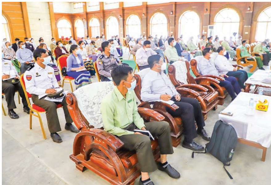
MoD Union Minister General Mya Tun Oo meets town elders in Katha Township yesterday.