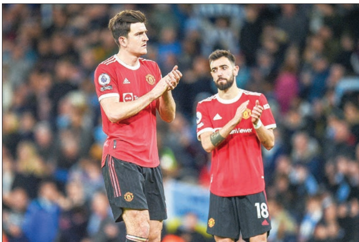
Manchester United's English defender Harry Maguire (L) and Manchester United's Portuguese midfielder Bruno Fernandes (R) react to their defeat on the pitch after the English Premier League football match between Manchester City and Manchester United at the Etihad Stadium in Manchester, north west England, on 6 March 2022. Manchester City won the game 4-1.