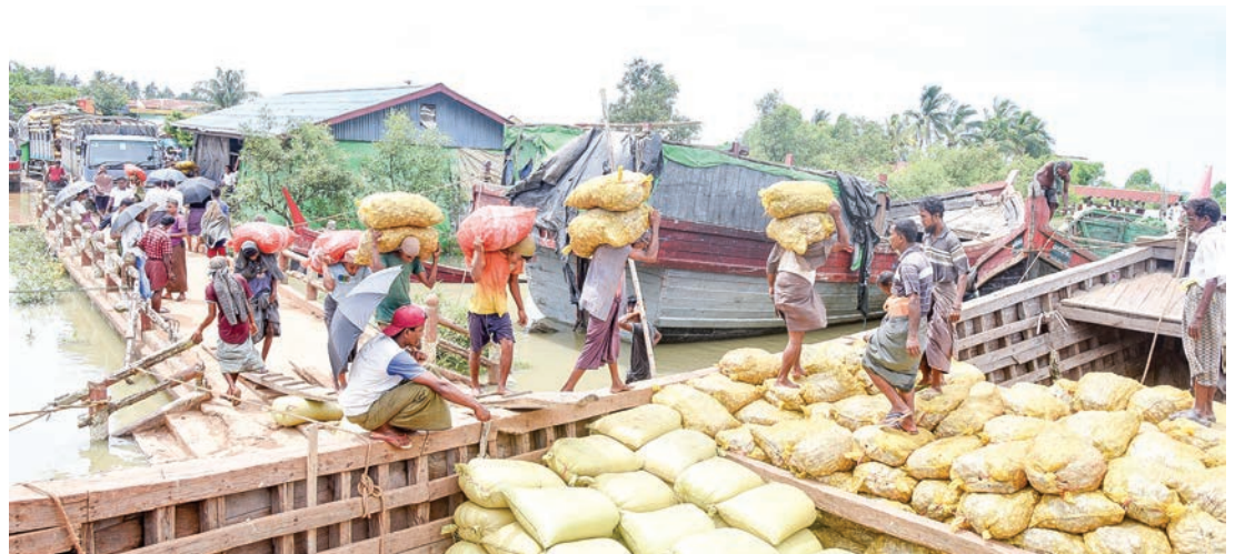
Between 1 October and 25 February of this mini-budget period, the Myanmar-Bangladesh trade through border checkpoints has touched $18.002 million, with exports worth $17.92 million and imports amounting to $0.080 million.

TRADE between Myanmar and Bangladesh as of 25 February since October this mini-budget year has exceeded US$ 18 million, down $2.49 million from the same period last year, according to the monthly data issued by the Ministry of Commerce.