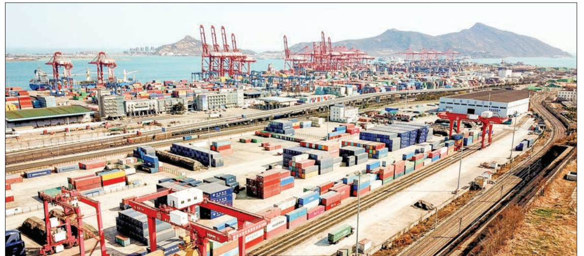
This aerial photo taken on 7 March 2022 shows containers stacked at a port in Lianyungang, in China's eastern Jiangsu province.

Trade data for January and February is usually combined