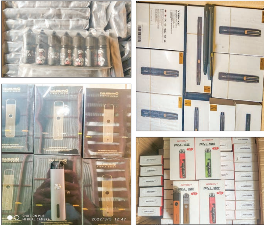
Confiscated illegal goods.

THE Anti-Illegal Trade Steering Committee focuses on strict control of illegal trade by the law.