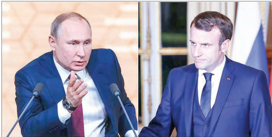
Xinhua file photos of Russian President Vladimir Putin and French President Emmanuel Macron.

Moscow demands that the Ukrainian side establish all the conditions for the creation of humanitarian corridors and ensure an organized withdrawal of civilians and