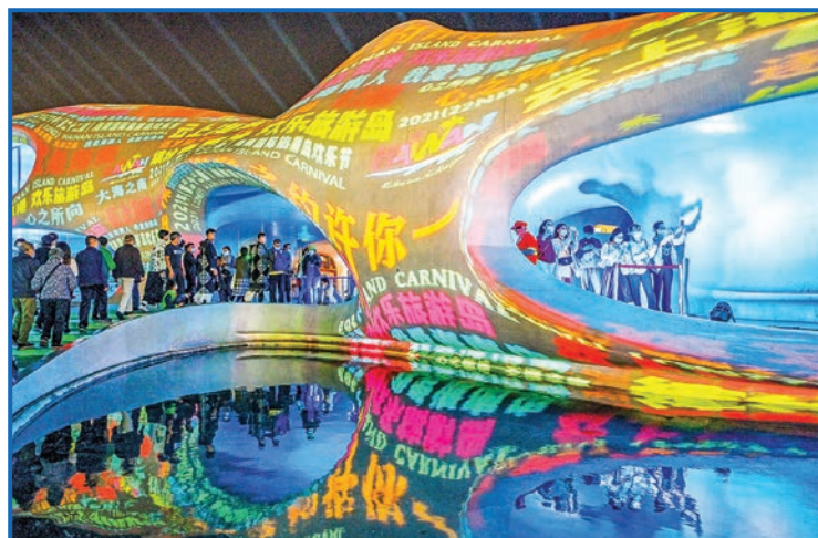
Photo taken on 10 Dec 2021 shows a light show held during the Hainan Island Carnival.