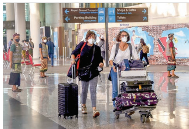
Travellers walk through the international arrivals hall at Ngurah Rai International Airport in Tuban near Denpasar on Indonesia's resort island of Bali on 16 February 2022, after a Singapore Airlines flight arrived following a nearly two-year break due to Covid-19.

“President Joko Widodo has agreed to trial a no-quarantine policy for overseas travellers to Bali starting on 7 March,” maritime affairs and investment minister Luhut Binsar Pandjaitan said in a briefing. Visitors will be exempt from isolation if double-jabbed and holding a negative PCR test and will have to show proof of a four-day hotel booking.— AFP ■