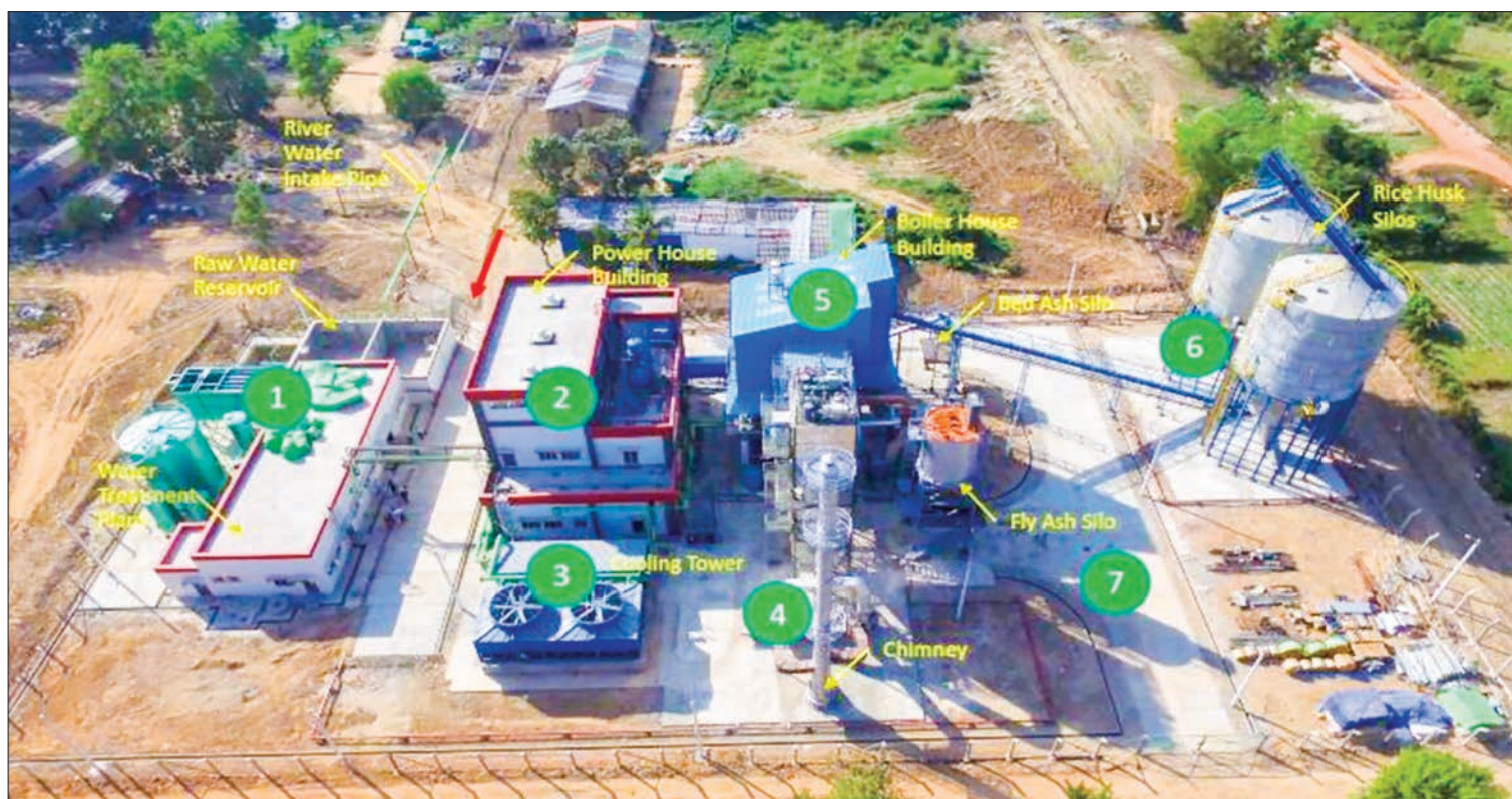
Rice husk power plant as the renewable energy and rice bran oil factories will be developed. Those value-added projects can contribute to the green electricity generation, edible oil sector and feedstuff processing industries.

Those value-added projects can contribute to the green electricity generation, edible oil sector and feedstuff processing industries. Furthermore, it can bring about job opportunities, do-