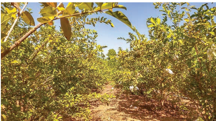
The growers from NyaungU township are growing the guavas using underground water, and the farmland is successfully yielded.

To make the fruits beautiful and prevent the germs from penetrating, each fruit is wrapped in paper and covered with plastic bags. Then, it can start to pick up after two months of covering with plastic bags. Guava cultivation requires fewer labourers and input costs. The growers from NyaungU township are growing the guavas using underground water, and the farmland is successfully yielded. The growers are selling them for K1,200 per viss, said U Paik, a guavas grower. — Ko Htein (KPD)/GNLM