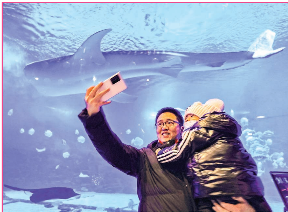
Tourists take selfies at the Haichang whale shark ocean park in Yantai city, east China's Shandong province, 4 Feb 2022.

So far, Anhui has built over 50,000 5G base stations, and covered 16 prefecture-level cities and Mount Huangshan, Mount Jiuhua, and other major scenic