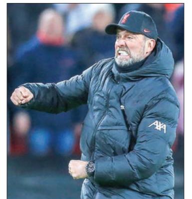
Liverpool's German manager Jurgen Klopp.

"It's a much better result than I would have ex-