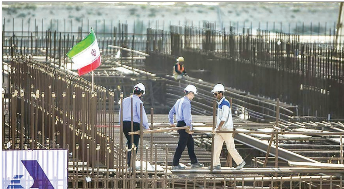
People work at the construction site of the second phase of Iran's Bushehr Nuclear Power Plant in Bushehr, southern Iran, on 10 November 2019.

SECRETARY of Iran's Supreme National Security Council Ali Shamkhani on Monday