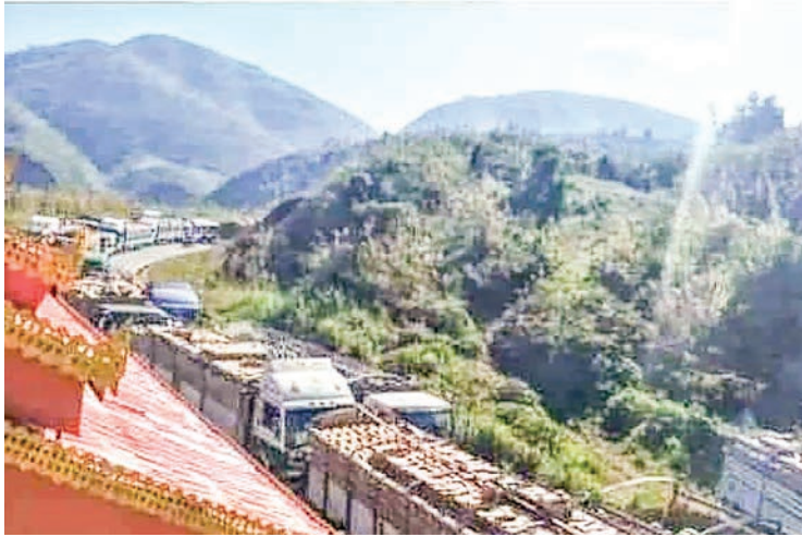
Melon trucks are seen still getting stuck on the China-Myanmar border.

“The cross-border trade via China’s Wamding port is pretty complex. Additionally, China’s Customs regulations cause the delay. Moreover, the health inspection team seems to wait for guidance. At present, almost all the buyers of watermelon and muskmelons are quarantined for seven days at the hostels in Changhaw yard. If the melon trucks pass the coronavirus test, they can enter the market on 10 March. Over 200 trucks are still