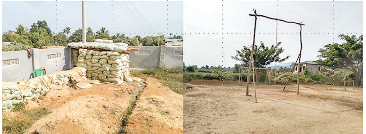
PDF terrorists use the Marathein school in Htigyaing township as their fortified base and training ground.

NUG/PDF terrorists and some EAOs that do not follow