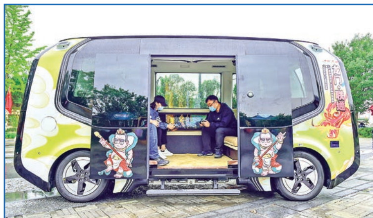
Visitors sit in a 5G-driven autonomous vehicle at the tourist service area of the Longmen Grottoes, a world cultural heritage site in Luoyang, central China's Henan province, 4 Oct 2021.

Besides, many scenic spots and museums have developed online digital experience products to present tourism resources with the help of digital technologies. They have also cultivated new business forms such as virtual tour, online performance, live streaming show, and online exhibition, creating new scenarios of immersive travel experience.