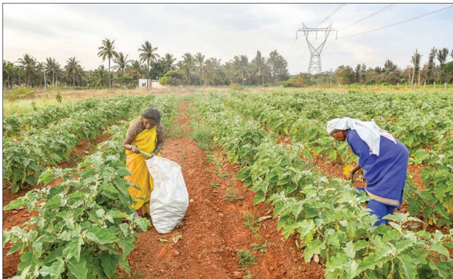
Farmers harvest a crop of brinjal from a field on the outskirts of Bangalore on 2 March 2022.

Exports of wheat recorded a huge surge at 1.7 billion US dollars during April-January 2021-22, growing 387 per cent over the corresponding period in 2020-21, while other cereals registered a growth of