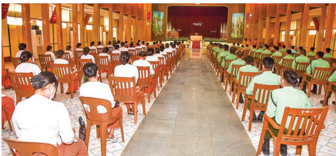
The MoD Union Minister meets officers, other ranks and their families of Monywa Station.

provided food aids for the district and township-level departments to the respective district and township administration bodies' chairpersons. — MNA