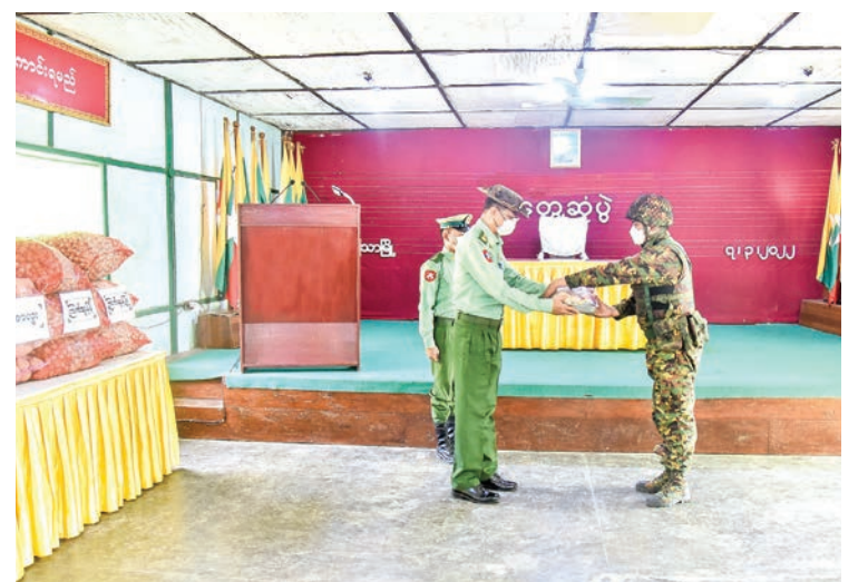
The MoD Union Minister provides food assistance for families of Katha Station.