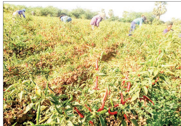
The prices increased from K4,500 to K5,400 per viss in early March. High input costs such as fertilizers and fuel oil for farming machinery are attributed to the price hike.

The export varieties of fresh chilli are 692, 777, 999, Demon, Sunshine and Lucky One. — NN/GNLM