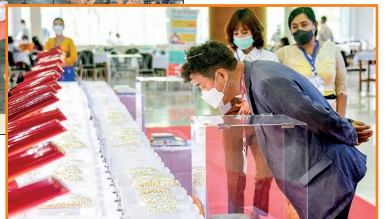
Gems merchants view gem stones.

The gems emporiums have been held successfully since 1964 to generate foreign income, and this 57 th gems emporium will be held from 22 and 28 April. – Myo Satt Thit/GNLM