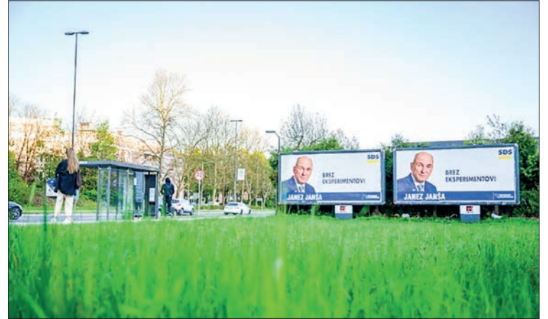
Analysts say concerns over the rule of law has boosted the opposition against Slovenian Prime Minister Janez Jansa.