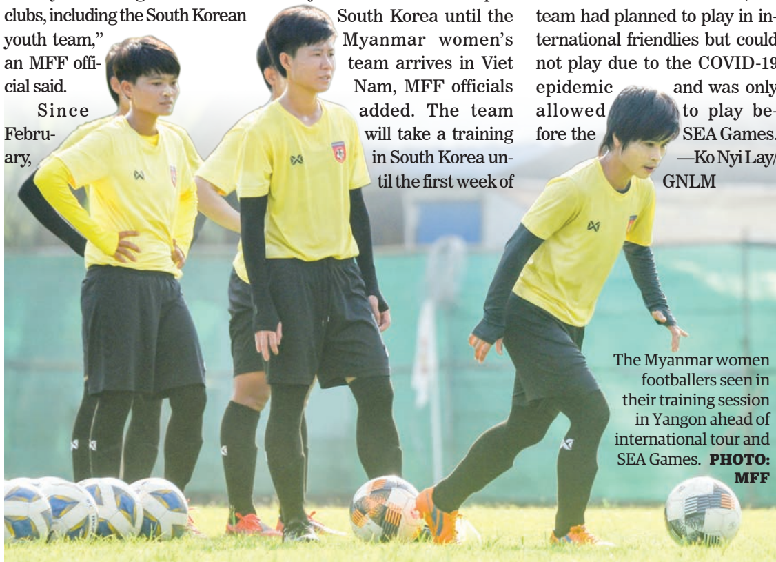
The Myanmar women footballers seen in their training session in Yangon ahead of international tour and SEA Games. PHOTO: MFF

Before the tournament, the team had planned to play in international friendlies but could not play due to the COVID-19 epidemic and was only allowed to play before the SEA Games. —Ko Nyi Lay/GNLM