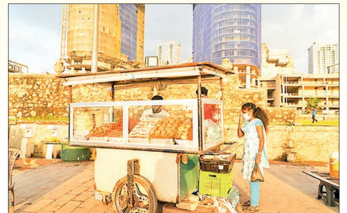
Vendors sell food at a roadside stall in Colombo.

CRISIS-hit Sri Lanka's inflation hit a record high for the sixth consecutive month, official data showed on Friday as the government asked the IMF for an urgent bailout. The broad-based National Consumer Price Index (NCPI) rose 21.5 per cent year-on-year in March, more than four times the 5.1 per cent inflation of a year earlier. Food inflation in March stood at 29.5 per cent, according to the latest data from the Department of Census and Statistics. The figures are likely to rise further: the state-run oil company has subsequently raised the price of diesel, commonly used in public transport, by 64.2 per cent.—AFP