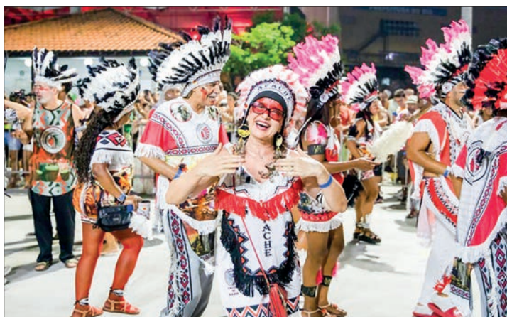
Revellers attend carnival celebrations in Rio de Janeiro, Brazil.

The all-night parades by the city's top samba schools Friday and Saturday nights will be the first since February 2020, marking a turning point for hard-hit Brazil, where Covid-19 has claimed more than 660,000 lives, second only to the United States.—AFP