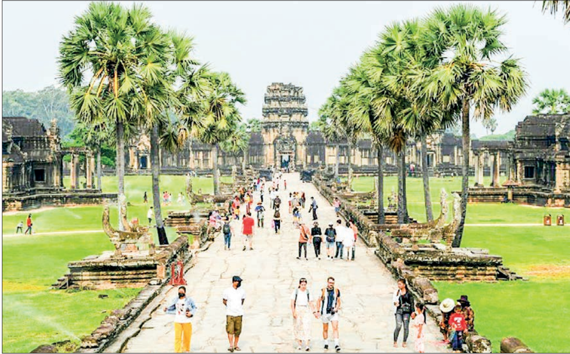
A large-scale vaccine rollout and dropping Covid-19 case numbers have allowed Cambodia to resume issuing visas on arrival for some tourists.

AS dawn breaks, foreign tourists gather by the ancient towers of Cambodia's Angkor Wat, some of the lucky few to see the World Heritage Site with the crowds thin as the country recovers from the coronavirus.