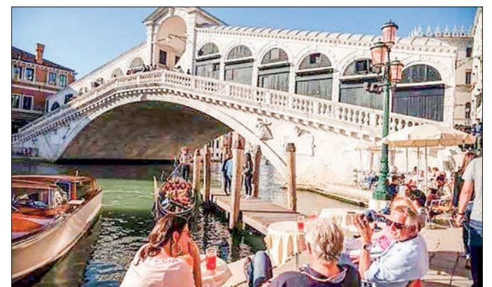
Tourists sit at a cafe near the Rialto Bridge in Venice, Italy on May 20, 2021.