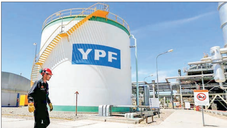
Yacimientos Petroliferos Fiscales (YPF) is the national energy company of Argentina.

In total, the new pipeline will increase Argentina's gas supply by more than 40 million cubic meters a day "supplying urban centres and industry in the centre and north of the country and giving the opportunity to export to Brazil and Chile," the presidency said in a statement.—AFP