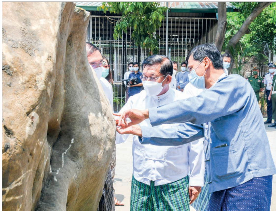
SAC Chairman Prime Minister Senior General Min Aung Hlaing looks into the 35-tonne largest jade stone at the 57 th Myanmar Gems Emporium in Nay Pyi Taw yesterday.