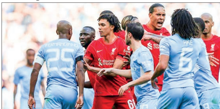
Manchester City and Liverpool are fighting for the Premier League title.

Guardiola's side are one point clear of second placed Liverpool after both teams won comfortably in midweek. With six games left, it will likely take just one slip from either team to decide the enthralling race.—AFP