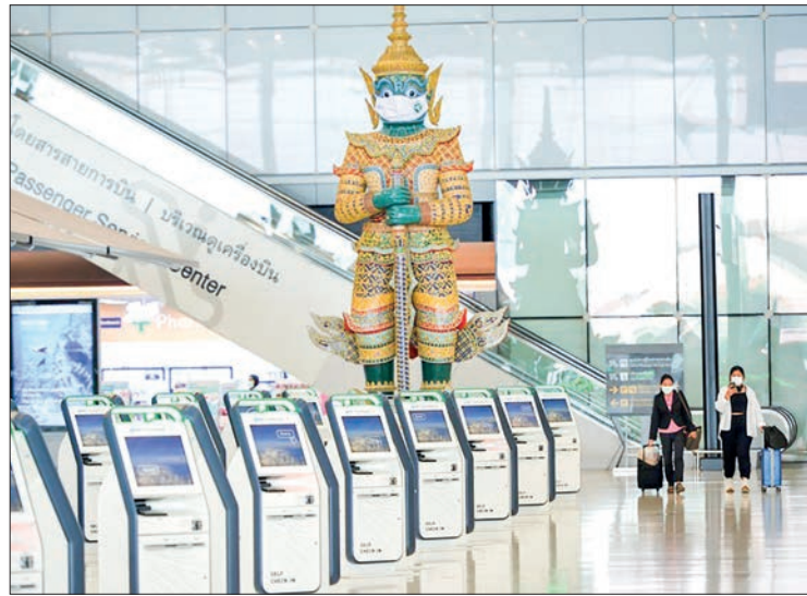
Passengers walk in the Suvarnabhumi International Airport in Bangkok, Thailand, on 1 Feb 2022.

THAILAND on Friday announced the end of compulsory Covid-19 tests for vaccinated travellers, as the country steps up efforts to revive its pandemic-thumped tourism industry.