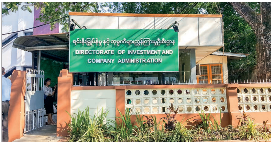
The office of the Directorate of Investment and Company Administration (DICA).

FORTY out of 49 MIC-permitted foreign enterprises put investments in the manufacturing sector, pumping an estimated capital of US$202.667 million in the past mini-budget period (October 2021-March 2022), according to the Directorate of Investment and Company Administration-DICA's statistics.