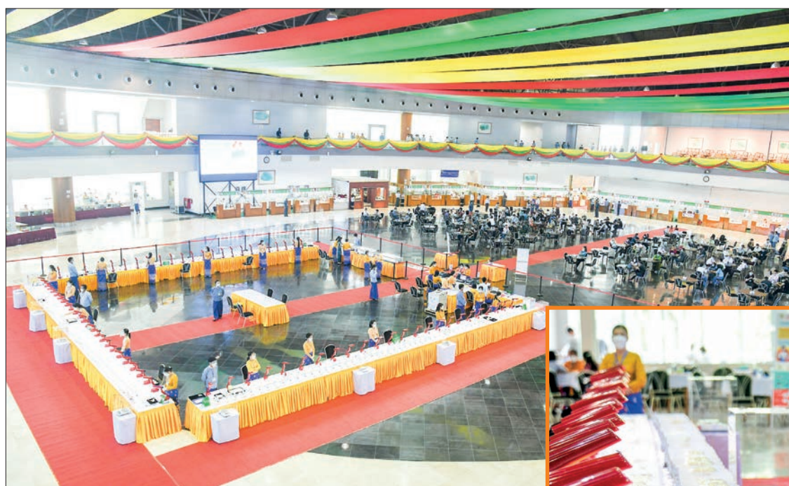
The first day of the 57 th Gems Emporium in progress.

of pearls are priced in US dollars, and foreign jewellers can pay in US dollars and Yuan, and local jewellers can pay in