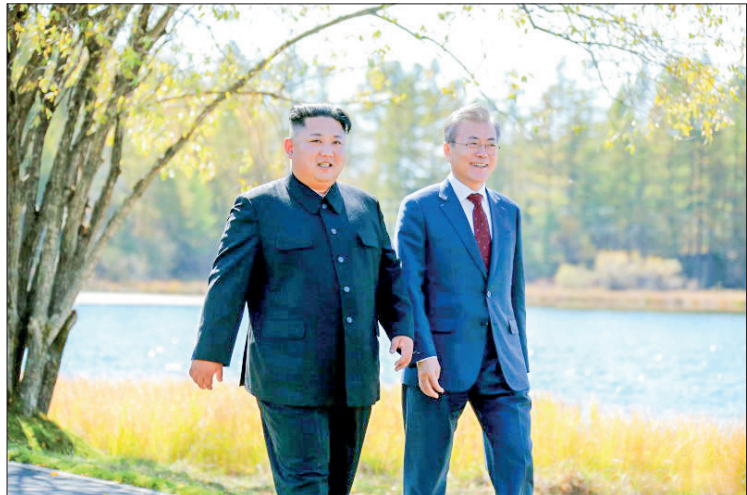
The warm words from North Korea to President Moon Jae-in came in an exchange of letters less than three weeks before Moon leaves office to be replaced by a conservative leader who has already signalled a tougher line on North Korea.

NORTH Korean leader Kim Jong Un and outgoing South Korean President Moon Jae In have exchanged personal letters, the North's official media reported Friday, despite rising tensions over Pyongyang's military provocations.