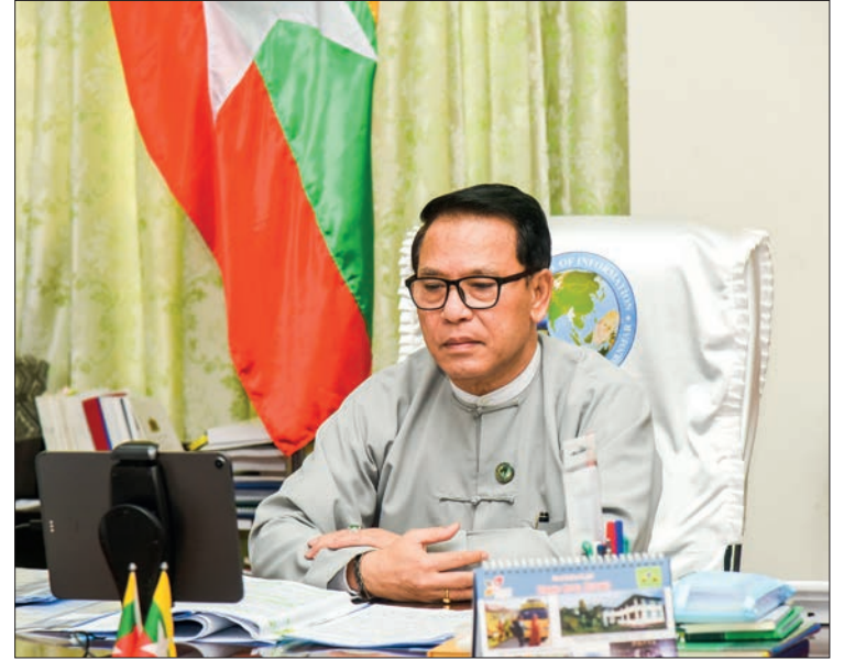
MoI Union Minister U Maung Maung Ohn.

Myanmar hosted more than 3.5 million tourists in 2019 (January to October), while there were only more than 800,000 in 2020 (January to October), and it saw a 75 per cent drop in tourist arrivals compared to the previous year, according to the data of the Ministry of Hotels and Tourism released in November 2020.