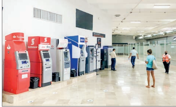
In Mexico, an ATM is called a 'cajero'. Most cities and towns in Mexico have an abundance of ATMs (cash machines).

The digital currency will seek to generate means of payment aimed at financial inclusion; expand options for fast, secure, efficient and interoperable payments; and implement competitive features to payment methods, she said before