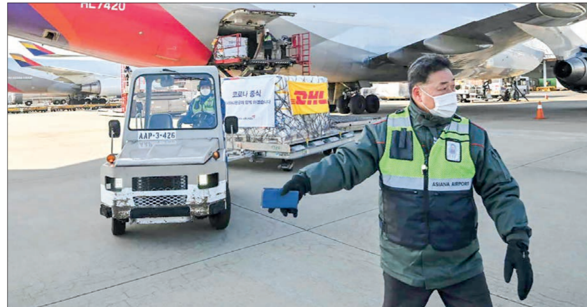
South Korean workers transport cargo containing Pfizer's antiviral COVID-19 pill, Paxlovid, at a cargo terminal of the Incheon International Airport in Incheon on 13 January 2022.

For the same patients, the WHO also made a "conditional (weak) recommendation" of the antiviral drug remdesivir made by US biotech firm Gilead — which it had previously recommended