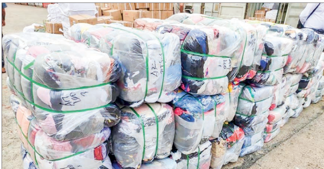
Confiscated commodities at the Myanmar Industrial Port.

BY the Anti-Illegal Trade Steering Committee, action is being