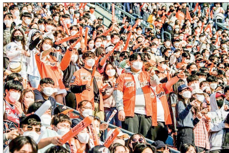
Supporters of the Hanwha Eagles during a match in Seoul earlier this month.

SOUTH Korean baseball fans and football supporters will be allowed to cheer at stadiums for the first time in two years from Friday as the country drops almost all coronavirus restrictions.