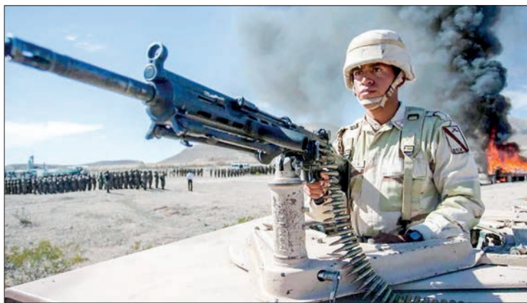
A Mexican soldier stands guard as a haul of marijuana and cocaine are incinerated in the background in November 2009.

first reported by the Reuters news agency, was created in 1997 and worked on cases such as the capture of notorious drug kingpin Joaquin “El Chapo” Guzman.