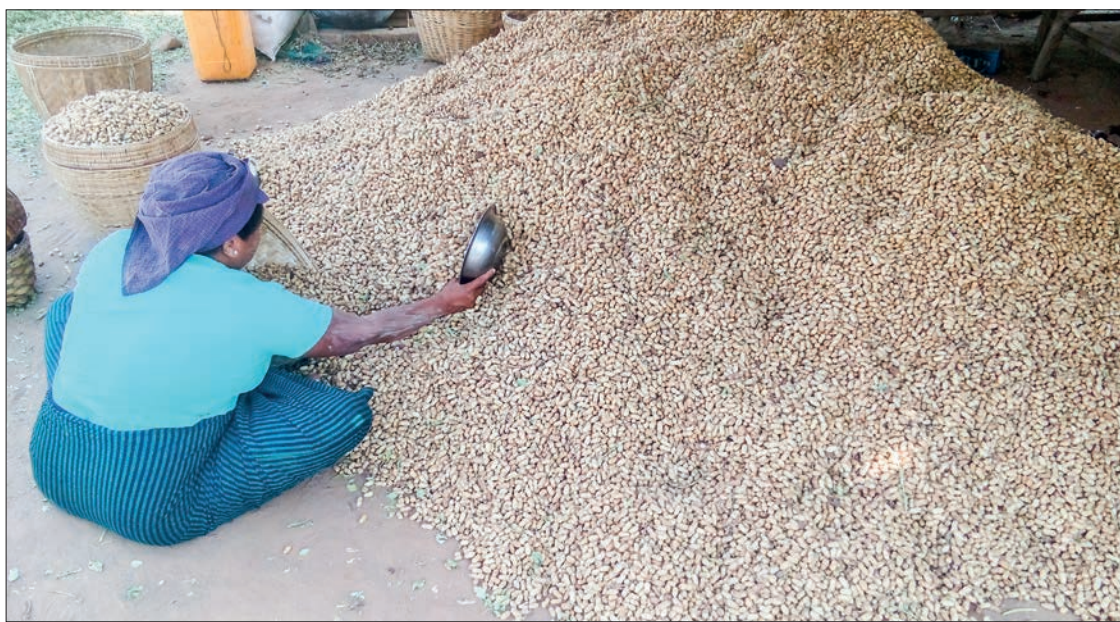
Tracking the price hike of imported palm oil and Kyat depreciation against the US dollar, the price of peanut oil rises tremendously to over K8,500 per viss and sesame oil fetches K8,000 per viss in the domestic market.

The consumer's behaviour has changed and turned to peanut oil due to the health bene-