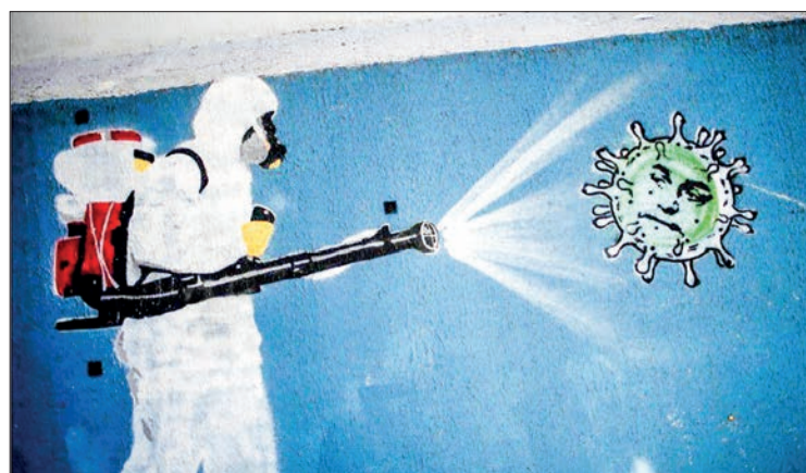
Omicron raised alarm because of its sheer number of mutations.

WITH the latest spike of more than 1000 COVID-19 cases in the national capital in a single day, the health experts believed that possibilities of new variants of the Omicron are emerging and they are being sequenced.