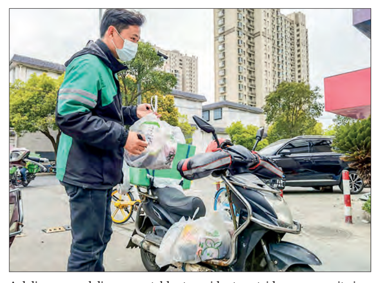
A deliveryman delivers vegetables to residents outside a community in Shanghai's Pudong New Area on 28 March 2022.

SHANGHAI will launch a nucleic acid testing campaign in areas west of the Huangpu River starting Friday amid the second