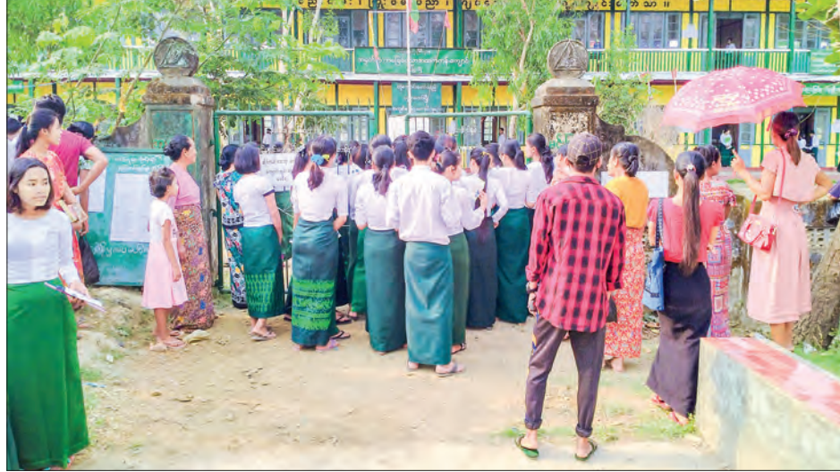
Minbya, Rakhine State.