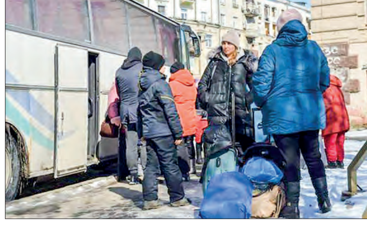
Residents prepare to evacuate Ukraine.

"We are sending 45 buses to the Mariupol corridor". Seventeen buses had already left for Mariupol from Zaporizhzhia,