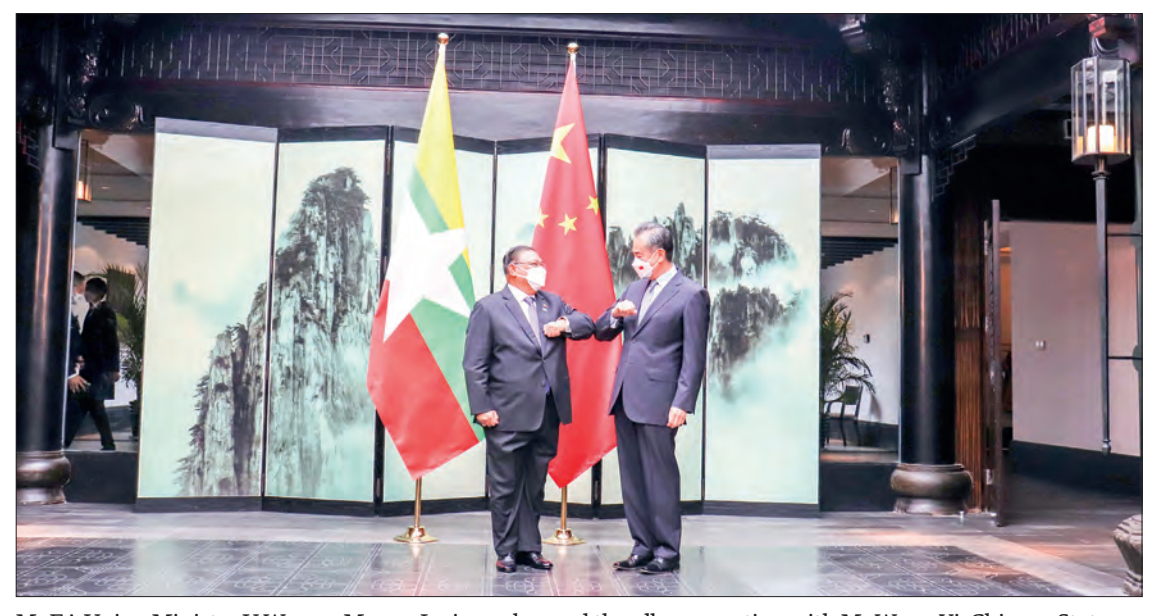
MoFA Union Minister U Wunna Maung Lwin exchanged the elbow greeting with Mr Wang Yi, Chinese State Councilor and Foreign Minister.

While in Huangshan, at 5:00 pm on 1 April 2022, Union Minister for Foreign Affairs U Wunna Maung Lwin had a separate meeting with State Councilor and Minister of Foreign Affairs of China Mr Wang Yi, followed by a bilateral meeting between the two Foreign Ministers. At the meeting, they cordially exchanged views on matters pertaining to the further consolidation of the existing Pauk Phaw relations, accelerating the implementation of Myanmar-China bilateral projects on the basis of mutual benefit, strengthening cooperation in the fights against the Covid-19 pandemic, opening the Myanmar Consulate-General in Chongqing Municipality, the maintenance of peace and stability along the border between Myanmar and China, closer coordination for the