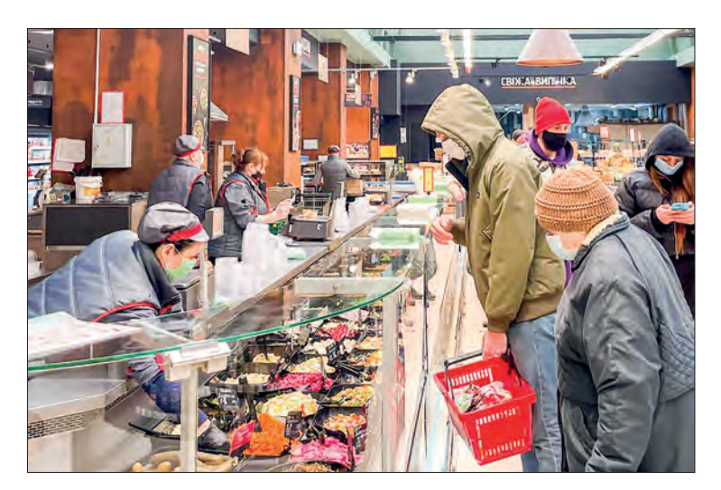
People go shopping at a supermarket in Lviv, Ukraine, 28 February 2022.

"Disruptions to Ukrainian and Russian grain and oilseed production and exports and restrictions on Russia's exports can have significant impacts on global food security," noted Ben-Belhassen.—Xinhua ■