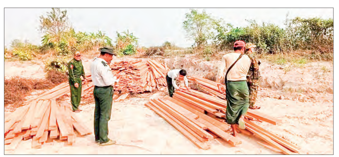
Officials confiscate illegal timbers.

Therefore, five arrests (estimated value of K118,922,364) were made on 31 March and 1 April, according to the Anti-Illegal Trade Steering Committee. — MNA