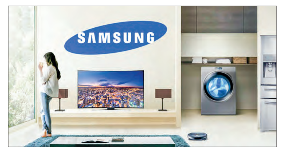
The country is home to major technology firms including Samsung Electronics, the world's leading smartphone maker, whose chips are used in a wide range of devices.

South Korea's outbound shipments stood at US$63.48 billion for March 2022, up from $53.69 billion a year earlier. The figures are "the highest tally since 1956, when trade statistics started to be collected",