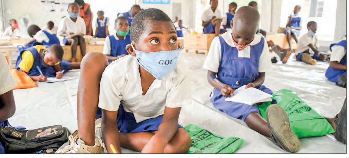
Pupils attend class at a pirmary school in Kasese District, Uganda

And between March 2020 and July 2021, the number of children out of school in South Africa, tripled from 250,000 to 750,000. Around one in 10 Ugandan students did not re-