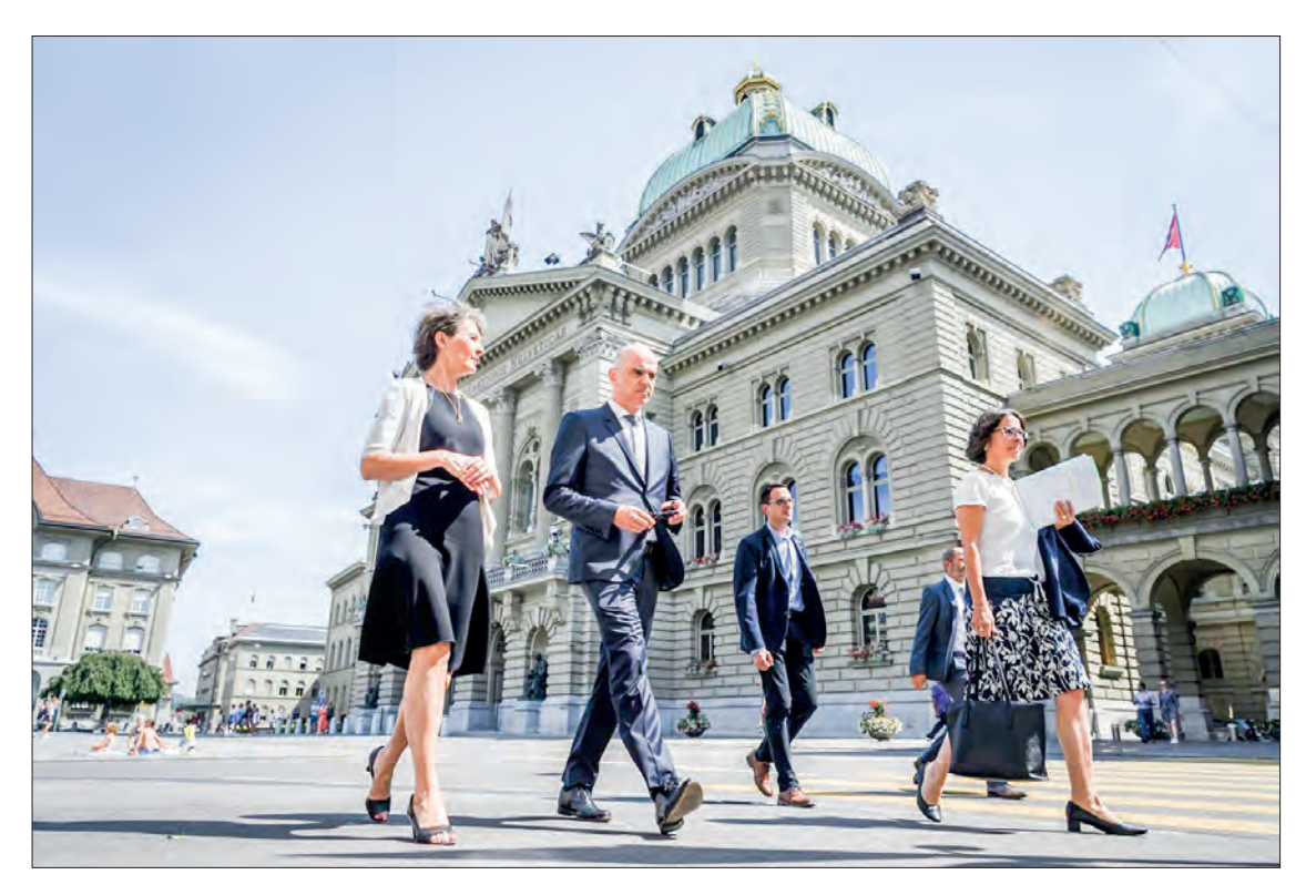
Swiss President Simonetta Sommaruga (L) and Swiss Health Minister Alain Berset walk in front of the Swiss House of Parliament on 27 August 2020.

THE Swiss government on Wednesday said that it has decided to lift all COVID-19 restrictions in the country on 1 April.