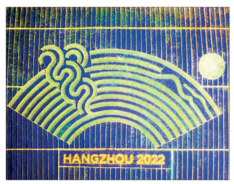
This aerial photo taken in March 2019 shows different coloured flowers used to create the logo of the 19th Asian Games in Hangzhou.

"Functional checks for the events have been finished," the statement said, adding sever-