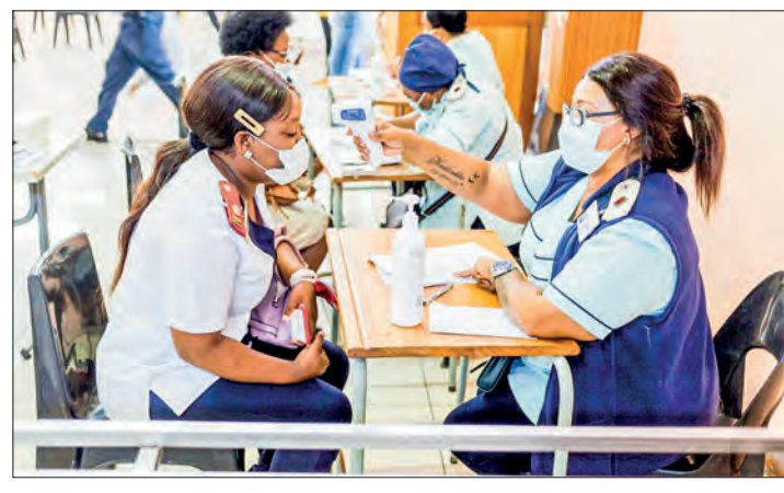
South Africa is the continent's hardest hit country, counting more than 3.7 million coronavirus cases or more than 30 per cent of Africa's over 11.3 million cases.

"Although more data are needed on the underlying causes of (natural) death, (the) observation is strongly supportive that a significant proportion of the current excess mortality being observed in South Africa is likely to be attributable to Covid-19," it said in a report on its website.—AFP ■