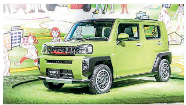
Daihatsu Motor Co., Toyota's minicar subsidiary, sold 506,436 cars, down 7.8 percent.

Nissan Motor Co. marked declines of 3.4 per cent and 1.1 per cent, respectively. Mazda Motor Corp. reported a 15.4 per cent fall, with Subaru Corp. losing 14.2 per cent.