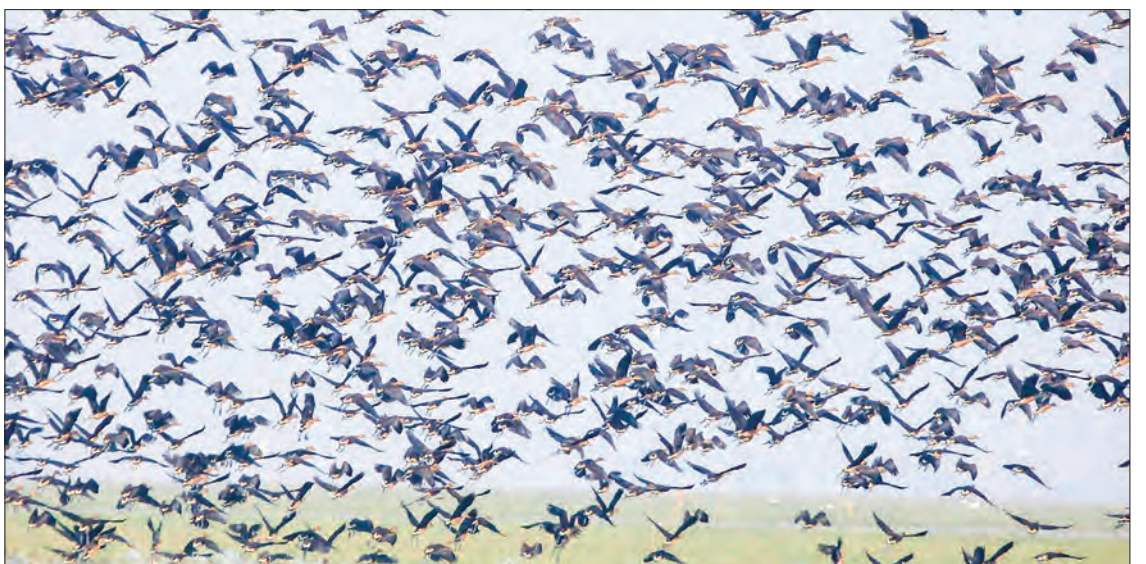
The ecosystem of Moeyungyi Sanctuary in the Bago Region is currently conserved with the residential bird inhabitants and migratory birds when the water level becomes lower starting the end of March. PHOTO:

decreases, and the Storks that eat snails and clams living in groups.