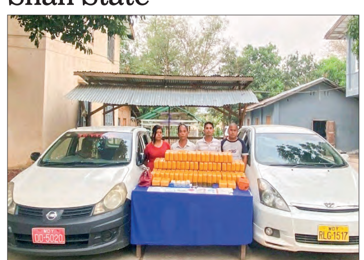
Four arrestees are seen along with seized stimulant pills and vehicles.

THE police seized K400 million worth of stimulant tablets in Hsipaw Township of Shan State.