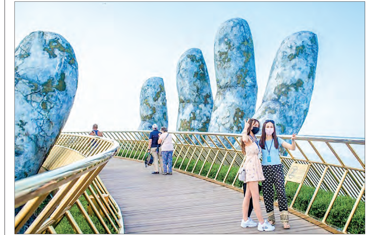
Tourists pose for photos on the Golden Bridge on Ba Na Hills, Da Nang city, Vietnam.