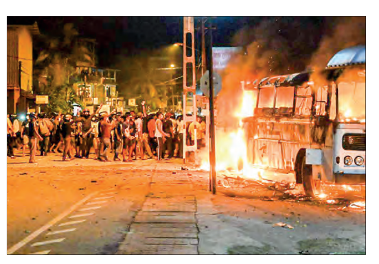
Protesters shout slogans after setting a bus on fire during a demonstration outside the Sri Lankan president's home to call for his resignation in Colombo.

SECURITY forces were deployed across the Sri Lankan capital on Friday after protesters tried to storm the president's home in anger at the nation's worst economic crisis since independence.