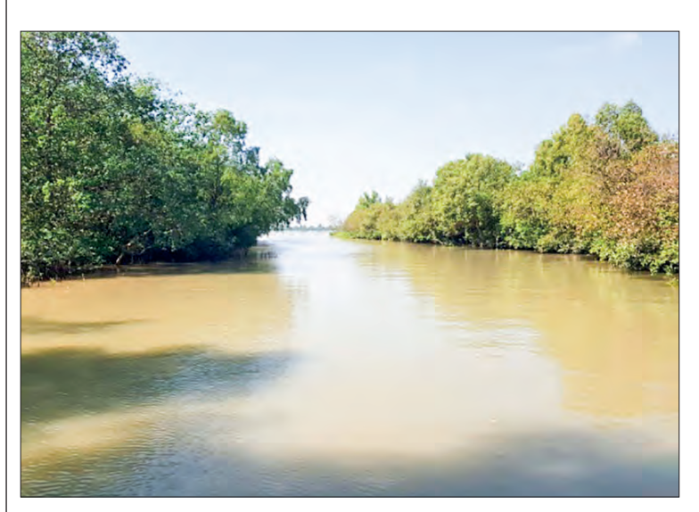
Monrec designates 9,274.38 acres in Kungyangon Township as "Green Wall Mangrove Protected Forest Reserve" effective 1 April 2022.

EXERCISING powers conferred under Sub-section (e) of Section (6) of the Forest Law promulgated in September 2018, the Ministry of Natural Resources and Environmental Conservation of the Government of the Republic of the Union of Myanmar has designated the area of 9,274.38 acres in Kungyangon Township in Yangon South District as "Green Wall Mangrove