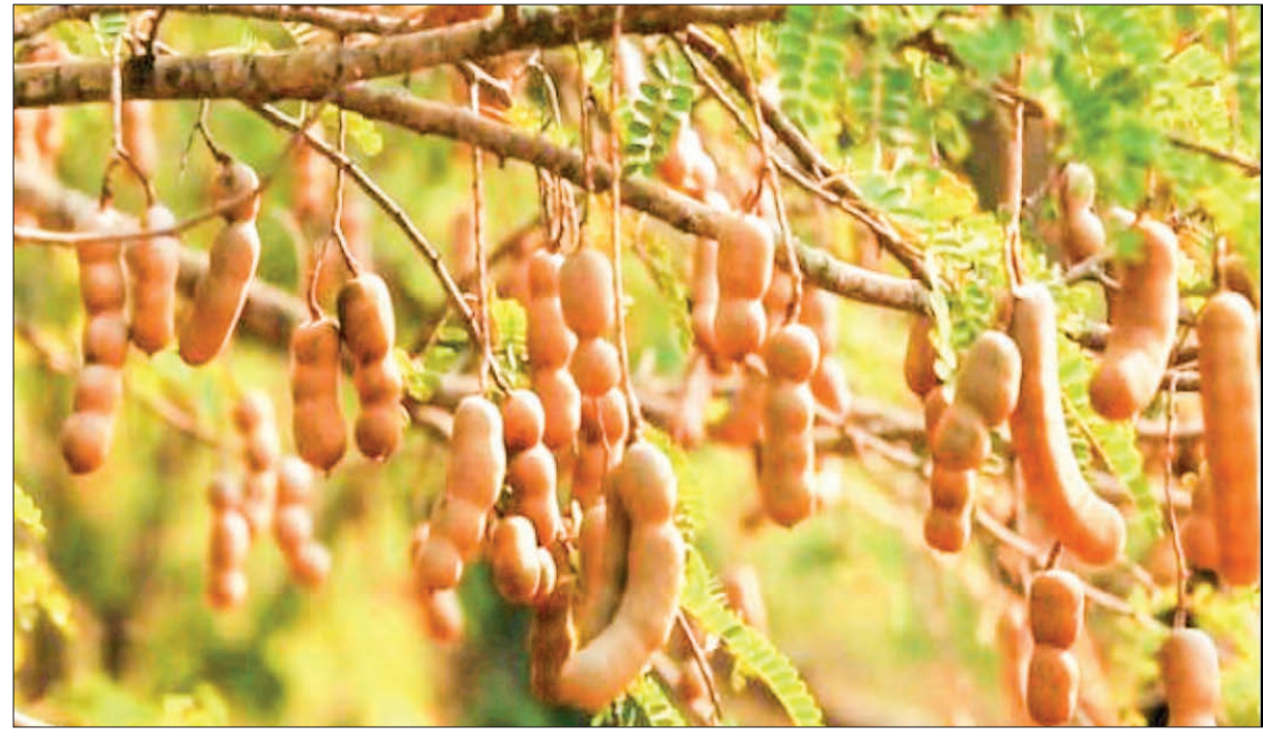
This year, the seeded tamarind is worth K1,800 per viss, and the prices of seedless ones stand at K3,600 per

"This year, tamarind businesses are thriving. The yield is also expected to drop. The competitive buying between the domestic dealers and the foreign trade partners hikes the price up. Furthermore, the price is likely to remain higher