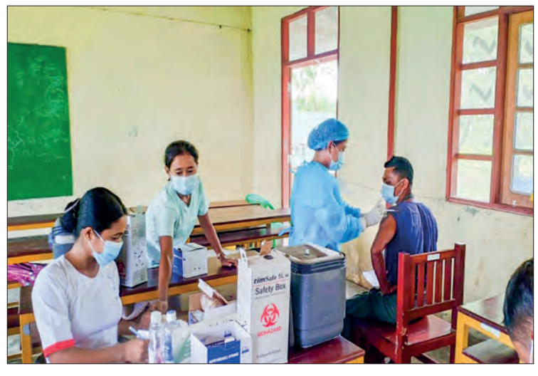
A local in Ponnagyun Township, Rakhine State gets COVID-19 vaccine shot

DOCTORS and nurses from public hospitals, Tatmadaw medical teams, healthcare workers and volunteers are working hard to give COVID-19 vaccines in different states and regions as the vaccination programme is one of the most important activities in the prevention, control and treatment of COVID-19 disease.