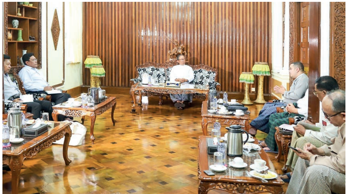
Discussions between the MoALI Union Minister and the UMFCCI-affiliated organizations in progress.

After that, the Union minister and officials of the Myanmar Fertilizer, Seed and Pesticide Entrepreneurs Association