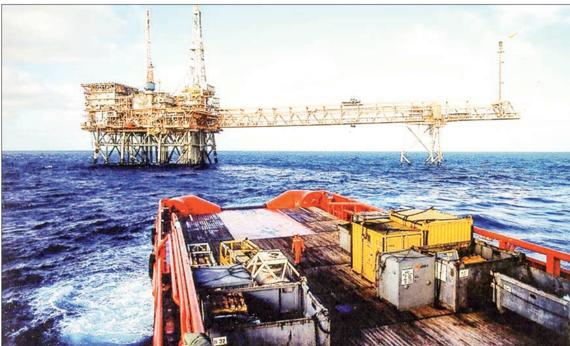
Diversifying the economy, which is massively dependent on oil and gas, is the biggest task facing Timor-Leste.

REFLECTING on his country's 20 years of independence, East Timor's first president and former guerilla leader Xanana Gusmao sees that the way ahead will still not be easy despite some progress made in terms of developing the economy and raising people's standard of living.