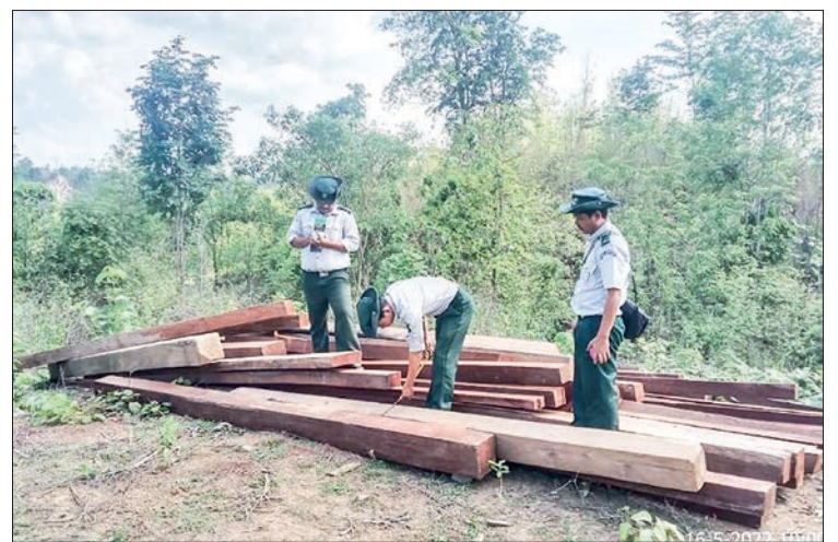
Officials confiscate illegal timbers.

Police confiscated three unregistered vehicles at an estimated value of K19,000,000 at the milepost 5/0 on the DaikU Township-Sittoung Road and milepost 4/3, 4/4 on the Yan-