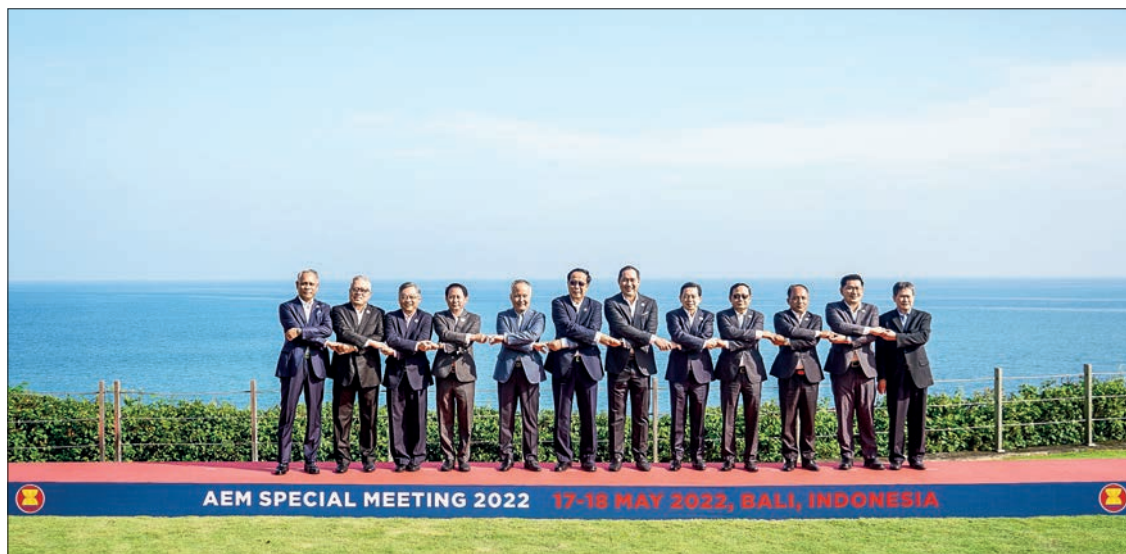
The MIFER Union Minister poses for the documentary group photo of the ASEAN Economic Ministers' Special Meeting in Bali, Indonesia.

With regard to the implementation of the Regional Comprehensive Economic Partner-