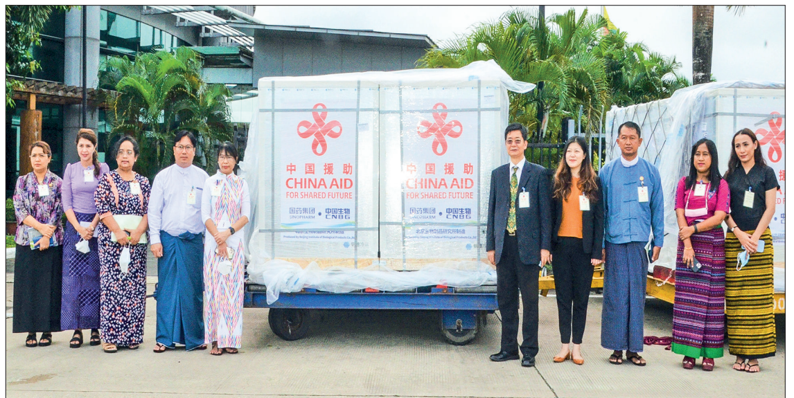
The donation ceremony is held at Yangon International Airport.

tinue to be distributed to regions and states with the help of the Tatmadaw (Air) and Myanmar Airways. — Nyein Thu(MNA)