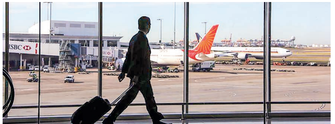
One of the travellers with a tourist visa is seen at Yangon International Airport.

The GDP contribution to Myanmar's tourism was six per cent before the COVID-19 outbreak, according to the World Travel and Tourism Council. The online e-Visa (Tourist) can be applied at https://evisa.moip.gov.mm .