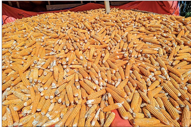
Myanmar's corns are demanded by the Philippines, India and Viet Nam at present and the sea trade is used for shipment. China and Thailand are also purchasing them through cross-border trade.

Thailand gives green light to corn imports through Maesot