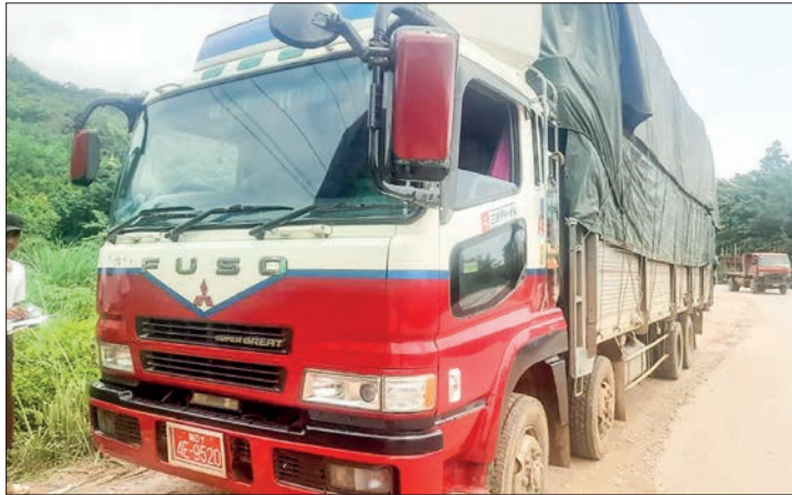
A lorry is seen transporting imported anti-Covid devices to where necessary.

Officials from relevant departments cooperate to facilitate and expedite standard operating procedures for the import process.