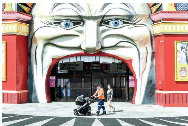
A family walks past the entrance to Luna Park in the Melbourne suburb of St Kilda on 16 September 2020 as Melbourne continues to enforce strict lockdown measures to battle a second wave of the Covid-19 coronavirus.

THE number of Australians taking precautions against the spread of coronavirus has fallen amid a surge in cases.