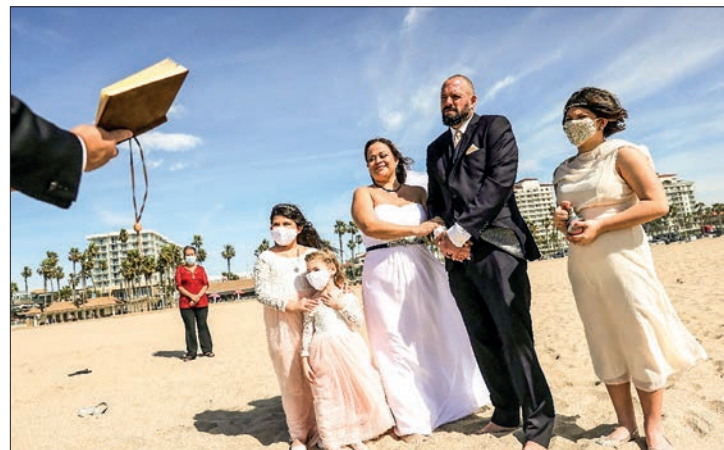
A wedding on a beach in California in February 2021.

Nevada — home to Las Vegas, where many couples go to tie the knot — also saw a decline from 2019, but it remained the state with the most marriages in 2020, as in previous years. — AFP