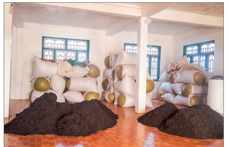
Four visses of wet tealeaf produce one viss of dried tealeaf and farmers sell them at K5,200 per viss this year and the market price of dried tealeaf is between K3,500 and K4,000.

The prices do not cover labour costs and transport charges for tealeaf farmers and they also face hardships due to high commodity prices. The tealeaf factory in Naungtaya buys the wet tealeaf at K1,000 per viss and now at K800. — Khun Aung (Naungtaya)/GNLM