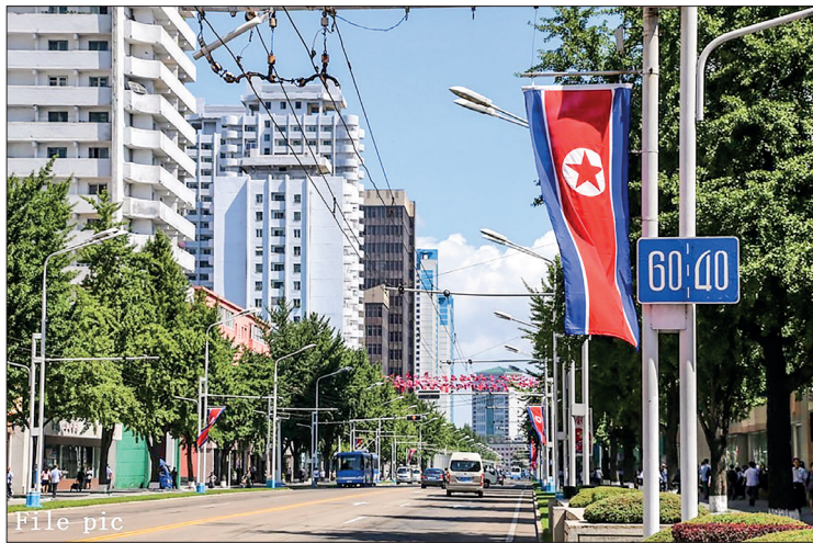
Photo taken on 8 Sept 2018 shows an avenue decorated with national flags in Pyongyang, capital of the Democratic People's Republic of Korea (DPRK).

In another report on Tuesday, the KCNA said urgent measures have been taken to ensure the supply of medicines and the military medical forces of the People's Army were deployed on Monday to all pharmacies in Pyongyang and began to supply