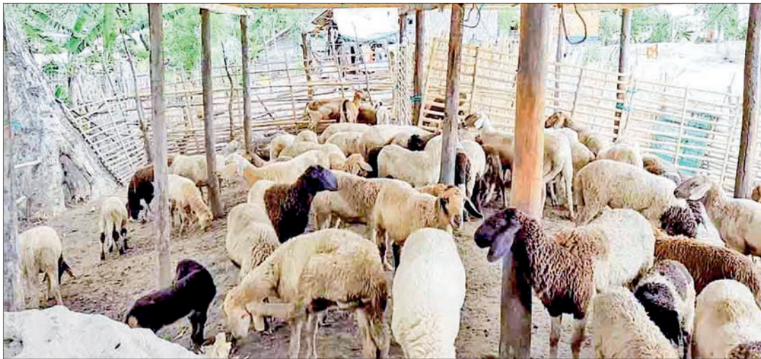
The manageable-scale sheep and goat farming increases the income of residents as they fetch good prices in selling in Pwintbyu Township of Magway Region.

THE manageable-scale sheep and goat farming increases the income of residents as they fetch good prices in selling in Pwintbyu Township of Magway Region, according to farmers from Lalphila village of Kanthagyi village-tract in Pwintbyu Township.