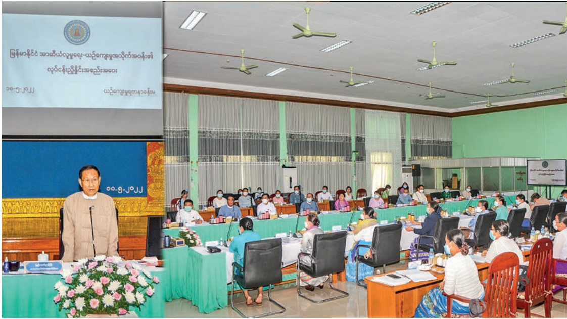
MoRAC Union Minister U Ko Ko addresses the coordination meeting to implement the ASEAN Socio-Cultural Community, in Nay Pyi Taw yesterday.

THE Ministry of Religious Affairs and Culture organized a coordination meeting on the implementation of the ASEAN Socio-Cultural Community in Nay Pyi Taw yesterday.