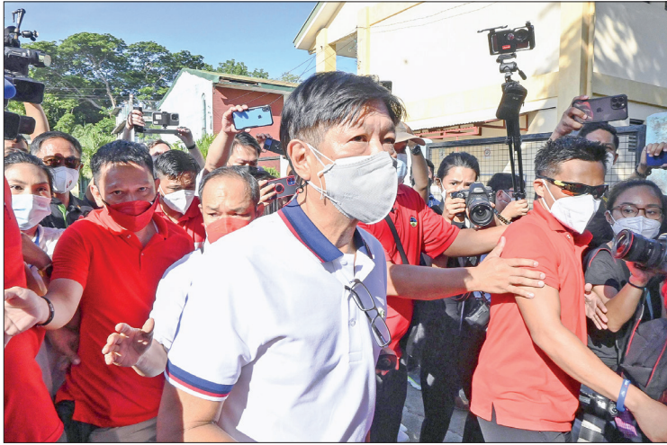
Ferdinand Marcos Jr. exits a polling station in Batac in the Philippines on 9 May 2022.

OUTGOING President Rodrigo Duterte's efforts to liberalize foreign ownership of key industries in the Philippines were important as much as a "danger" should the next leader fail to safeguard national security, an economist says in commenting