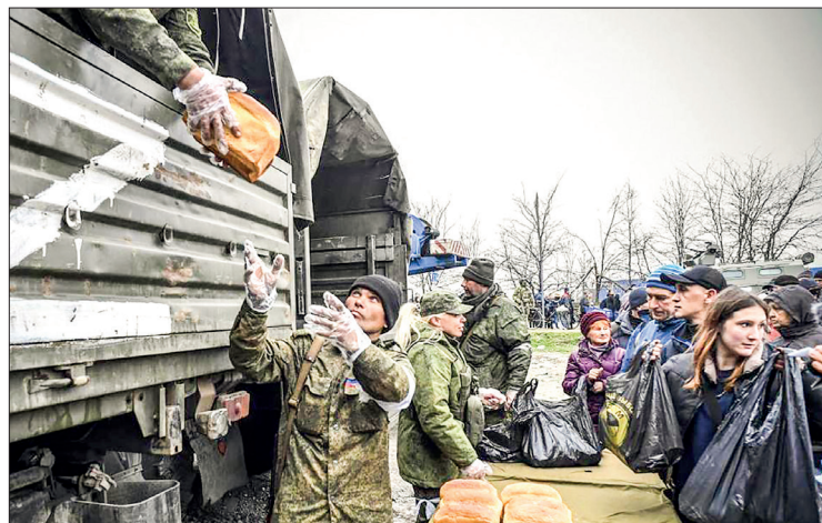
Russian soldiers and volunteers distribute bread in Mariupol.

Asked by reporters on Tuesday whether the Ukrainian soldiers will be treated as war