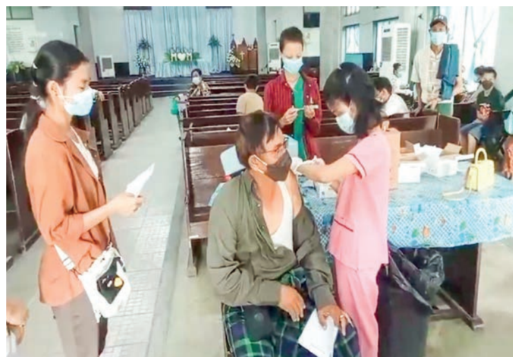
A local in Toungoo Township, Bago Region gets jabbed against COVID-19.