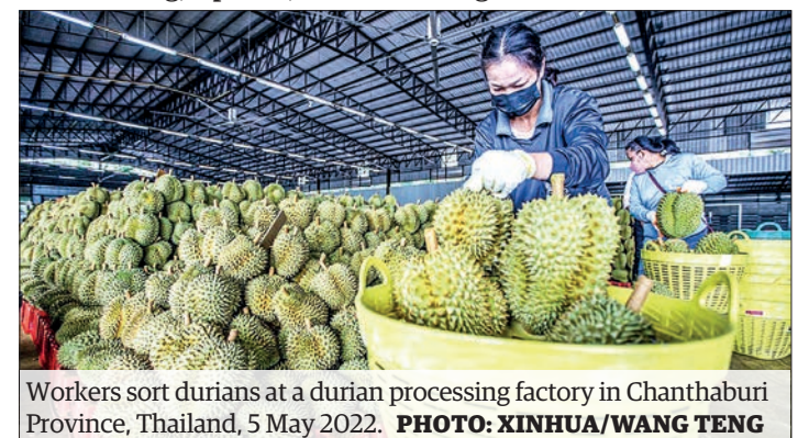
Workers sort durians at a durian processing factory in Chanthaburi Province, Thailand, 5 May 2022.

Located in the Chanthaburi province, the renowned fruit capital of Thailand, Silaphon's orchard is home to hundreds of durian trees with dozens of fruit on each of them. For its distinctive shape, intensive smell and rich custard-like flavour, durian is also called the "king of fruits".—Xinhua