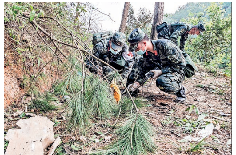
This photo taken on 21 March 2022 shows paramilitary police officers conducting a search at the site of the China Eastern Airlines plane crash in Tengxian county, Wuzhou city, in China's southern Guangxi region.

According to a report from Boeing, investigators found no evidence of “anything abnormal”, China's Civil Aviation Administration (CAAC) said in April. In a statement, the CAAC said staff had met safety requirements before takeoff, the plane was not carrying dangerous goods and did not appear to have run into inclement weather, though the agency said a full investigation could take years.—AFP