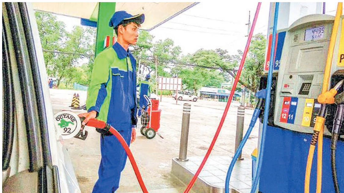
A car is seen getting its tank filled up with fuel oil at one pump station in Yangon.

IN the local fuel oil market, the price was high about K90 per litre of Octane 92 and K10,000 per gallon of Octane 92, according to the Fuel Import, Storage and Distribution Supervisory Committee on 18 May.