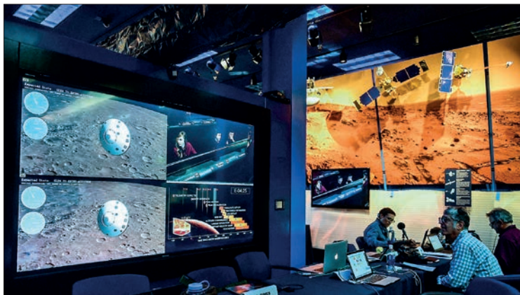
People watch the landing of NASA's InSight spacecraft on the planet Mars on television screens at NASA's Jet Propulsion Laboratory (JPL) in Pasadena, California, 26 November 2018.

AFTER some four years probing Mars' interior, NASA's InSight lander will likely retire this summer as accumulated dust on its solar panels saps its power.