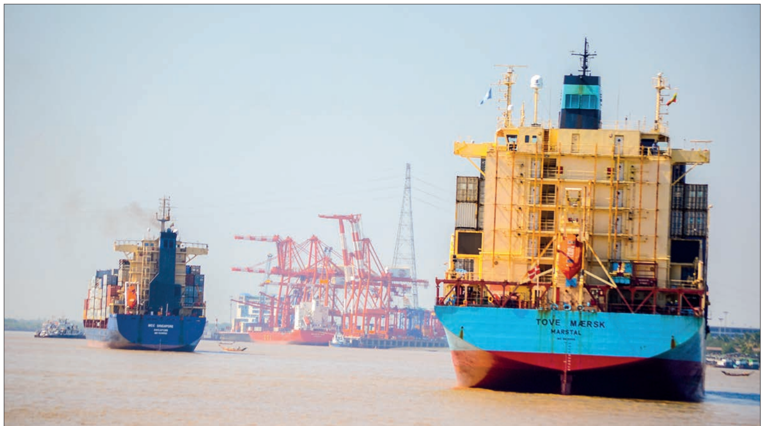
The photo shows some of the overseas-going merchant vessels in the Yangon River.

Earlier, the larger ships have draft problems preventing their sailings on the Yangon River. The draft extension is up to 10 metres with the new navigation channel accessing