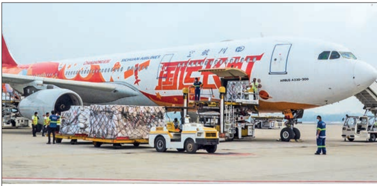
China-donated 5 mln doses of Sinopharm vaccine and 2 mln syringes.

THE first batch of five million doses of Sinopharm COVID-19 vaccines arrived at Yangon International Airport by Sichuan Airlines yesterday morning as the People's Republic of China will donate ten million doses of COVID-19 vaccine to Myanmar.