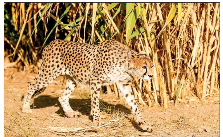
A critically endangered Asiatic cheetah is seen in its enclosure at Pardisan Park in the Iranian capital Tehran in 2017. Just a dozen individuals are believed to survive in the wild. PHOTO: AFP/FILE

They are still found in parts of southern Africa, but have practically disappeared from North Africa and Asia.—AFP