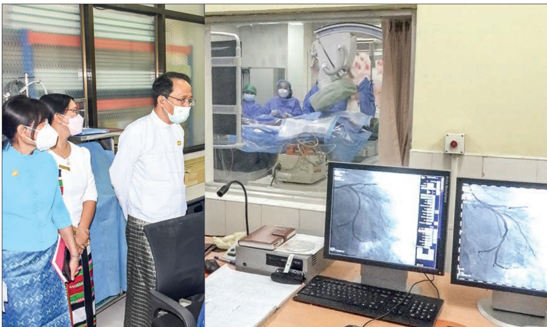
The MoH Union Minister makes an inspection tour around the Nay Pyi Taw People's Hospital.

UNION Minister for Health Professor Dr Thet Khaing Win said if patients with emergency medical conditions such as gastric bleeding, stroke, and myocardial infarction receive timely medical care, their lives can be saved.