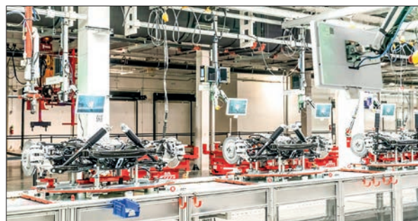
View of the inside of the Tesla Giga Texas manufacturing facility in Austin, Texas.