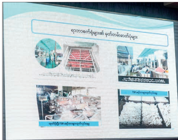
The Vice-Senior General meets Taninthayi Region government and departmental officials in Dawei Yesterday.

If the region changes the crude palm oil to the commercial oil in the region, the local people will have oil sufficiency and earn increased income. Hence, officials need to arrange the infrastructures for producing the commercial oil from crude palm oil through initiatives. Taninthayi Region is plentiful in rare water resources, coral reefs and natural beauties to attract travellers. Efforts must be made to generate good-income jobs for local people and undertake development in systematically carrying out fishery and agricultural tasks. — MNA