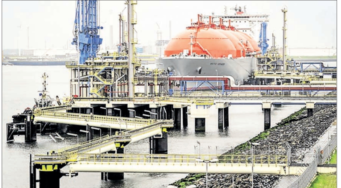
All of Europe's LNG terminals are import facilities, with the exception of (non-EU) Norway and Russia which export LNG. There are currently 28 large-scale LNG import terminals in Europe (including non-EU Turkey).

He also described the terminal as a new energy gateway for Greece, the Balkans and south-eastern Europe.—Xinhua