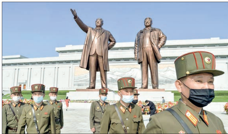
Bronze statues of late North Korean leaders Kim Il Sung and Kim Jong Il at Mansu Hill Grand Monument in Pyongyang, in a file photo.

lutely cannot be condoned as it threatens the peace and safety of the international community," Japanese Prime Minister Fumio Kishida told reporters in Italy, where he is currently visiting.