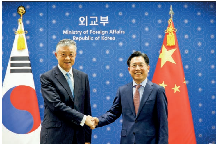
China's Special Representative on Korean Peninsula Affairs Liu Xiaoming (L) and South Korea's Special Representative for Korean Peninsula Peace and Security Affairs Noh Kyu-duk.

CHINA will play a "constructive" role in resolving tensions on the Korean peninsula, Beijing's top envoy to Pyongyang said Tuesday.