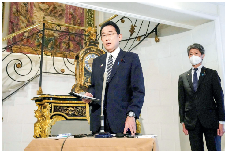
Prime Minister Fumio Kishida speaks to reporters in Rome on Wednesday.

Since Friday, Kishida has been on an eight-day tour of five countries in Southeast Asia and Europe. He is scheduled to hold talks with British Prime Minister