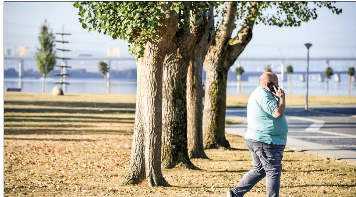
Obesity rates in Europe have ballooned by 138 per cent in the past five decades.