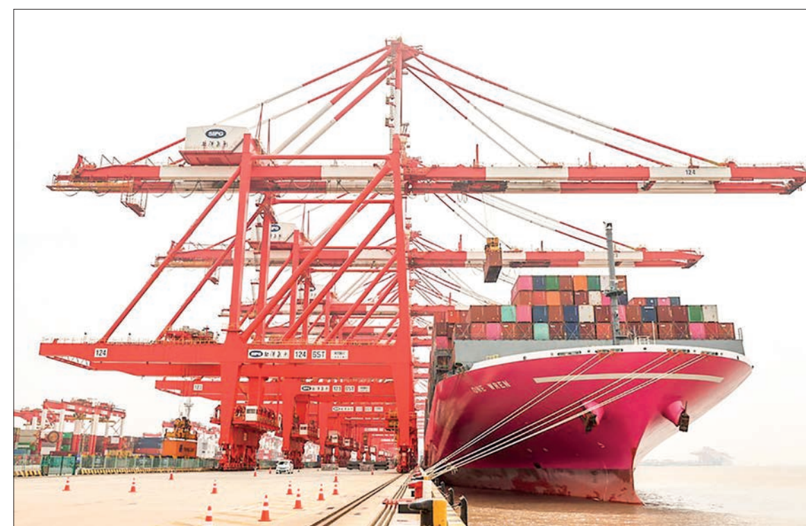
A container ship from Japan is anchored at the container dock of Shanghai's Yangshan Port in east China, 27 April 2022.

China has seen an accelerated pace of resumption of work and production in key areas and industries. In Shanghai, 86.8 per cent of enterprises of the 666 companies included in the first batch