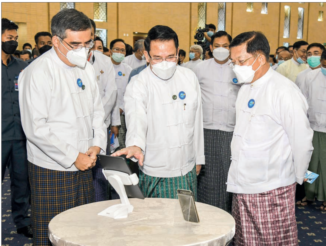
The Senior General views the Application of the MRTV App & Web.

Media are to give correct information to the people according to ethics to be public media. The Senior General urged all ethnic people to join hands with the government to serve the nation's interest.