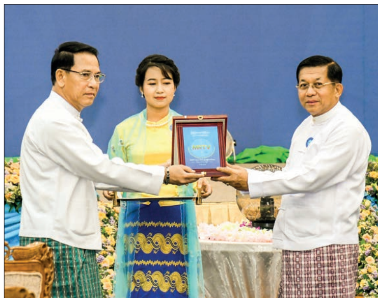
The Senior General receives the souvenir gift to mark the initiation of the Application.

It is an effort to erect the historical milestone for MRTV in improving its functions using modern techniques. Moreover, it is a milestone for the State Administration Council for its endeavour to result in development undertakings in its tenure.