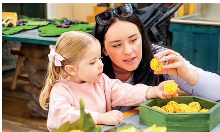
According to CDC, kids infected by Covid-19 may be related to the lowest vaccination coverage.

MORE than half of all Americans and about 75 per cent of kids had been infected by COVID-19 by the end of February this year, according to a new study on antibodies by the US Centres for Disease Control and Prevention (CDC).