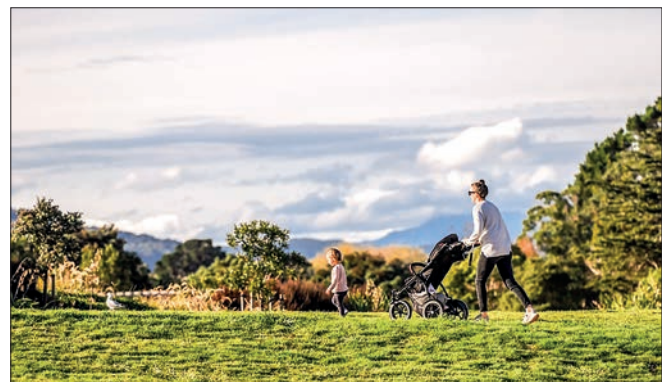
People walk at a park in Wellington, New Zealand, 14 May 2020.

In addition, 128 new cases of COVID-19 were detected at the New Zealand border. Currently, there are 481 COVID-19 patients being treated in New Zealand hospitals, including 10 people in intensive care units or high dependency units. The ministry also reported 20 more deaths from COVID-19.—ANI