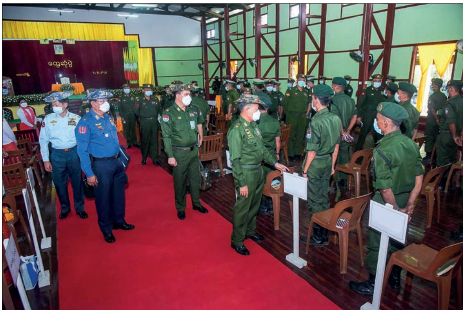
The Vice-Senior General cordially greets service members and families at Dawei Station.

The Vice-Senior General and party inspected wards of the hospital, fulfilled the hospital's needs, and presented cash awards to health staff serving at the hospital. — MNA