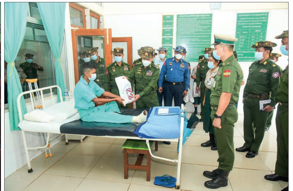
The Vice-Senior General comforts the patient at the Mawlamyine Station Hospital.