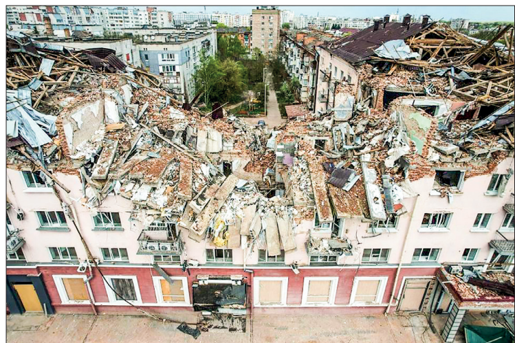
An aerial view taken of the destroyed Hotel Ukraine in Chernigiv.

pounding sites across eastern Ukraine, as the European Union moves to punish Moscow with oil sanctions.