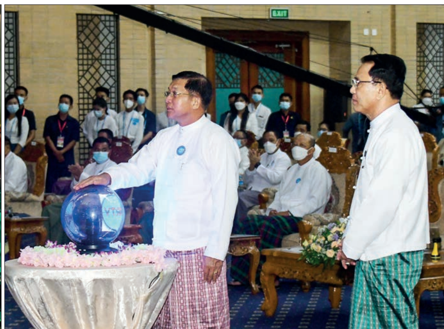
SAC Chairman Prime Minister Senior General Min Aung Hlaing presses the electric button to inaugurate the MRTV Media Worldwide Mobile Satellite Data Application Services—MRTV App & Web.