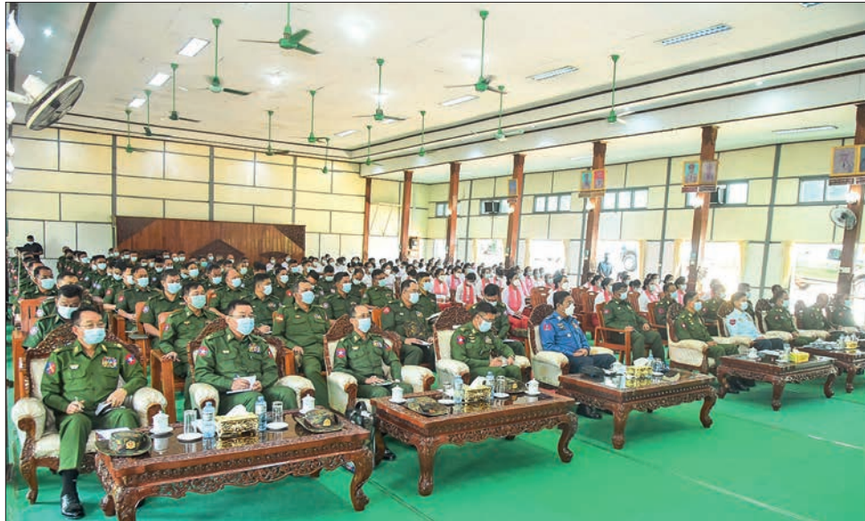
SAC Vice-Chair Deputy Commander-in-Chief of Defence Services Vice-Senior General Soe Win meets service members and families at Mawlamyine Station on 4 May 2022.

The administrative machinery of the Tatmadaw is being operated with pinions of general staff, adjutant and quartermaster. All duties and functions are being undertaken under the procedures, rules