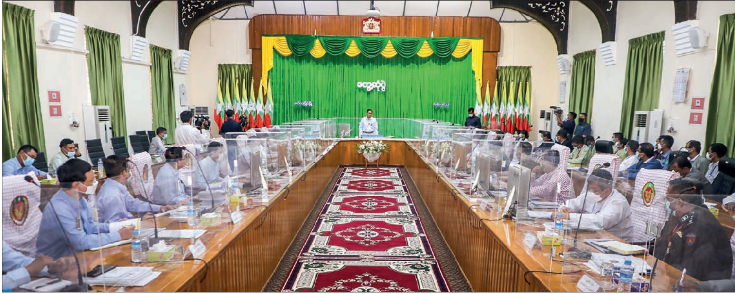
SAC Vice-Chair Deputy Commander-in-Chief of Defence Services Vice-Senior General Soe Win meets Mon State government, state, district and township-level departmental officials on 4 May 2022.

WHILE striving to earn income, it is necessary to efficiently use fuel and cooking oil so as to stop the waste of foreign exchange, said State Administration Council Vice-Chairman Deputy Commander-in-Chief of Defence Services Commander-in-Chief (Army) Vice-Senior General Soe Win in meeting with Mon State government, state, district and township-level departmental officials at the meeting hall of the government office yesterday morning.