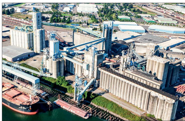
As the demand for Canadian grain exports continues to increase, it is important to ensure new trade opportunities that help strengthen the value chain. PHOTO: REPRESENTATIVE IMAGE: UNITED GRAIN CORP./XINHUA

dian grain exports continues to increase, it is important to ensure new trade opportunities that help strengthen the value chain, the news release said.—Xinhua