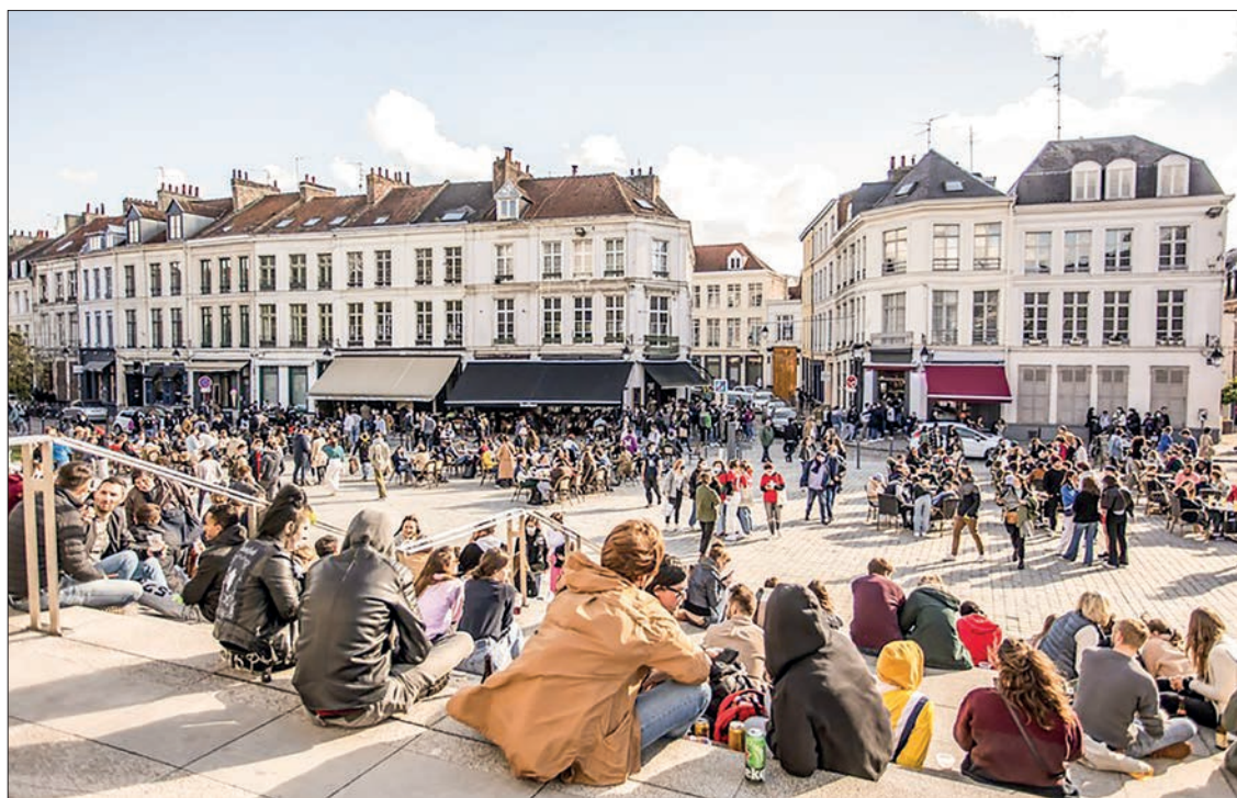
People enjoy their leisure time in Lille, northern France, 19 May 2021.

“Projections show that there could be a slight increase in the number of cases in July, which may be due to multiple factors,” Trillos said.—Xinhua