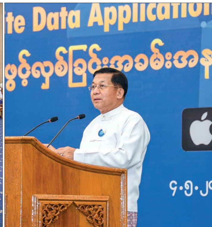
State Administration Council Chairman Prime Minister Senior General Min Aung Hlaing speaks on the occasion of the launching event of MRTV Media Worldwide Mobile Satellite Data Application Services (MRTV App & Web) in Nay Pyi Taw on 4 May 2022.

N OW is the time to enhance the capacity of all media as media influences societies through various ways and means, said State Administration Council Chairman Prime Minister Senior General Min Aung Hlaing at the launching ceremony of MRTV Media Worldwide Mobile Satellite Data Application Services (MRTV App & Web) of MRTV under the Ministry of Information at Myanmar