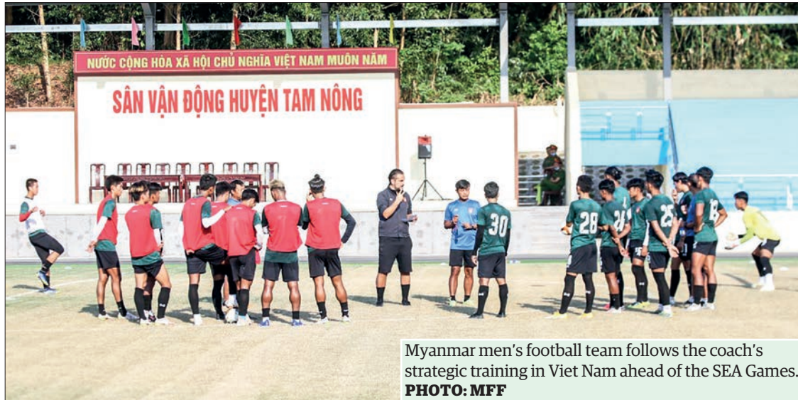
Myanmar men's football team follows the coach's strategic training in Viet Nam ahead of the SEA Games.