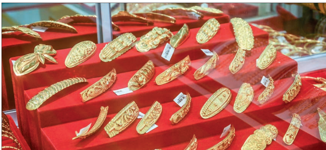
Gold jewellery is seen at one of the gold outlets in Yangon.

THE prices of pure gold fell back to below K2 million per tical (0.578 ounce, or 0.016 kilogramme), according to the Yangon Region Gold Entrepreneurs Association (YGEA).