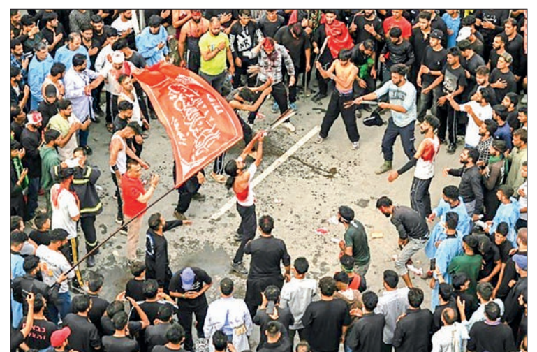
Shiite Muslims march through Kashmir's largest city for a major Muharram religious festival allowed to proceed for the first time in 33 years.

But authorities in Kashmir had banned the traditional ceremony in 1990, the year after an armed revolt against Indian rule erupted in the disputed region that is also claimed by Pakistan.