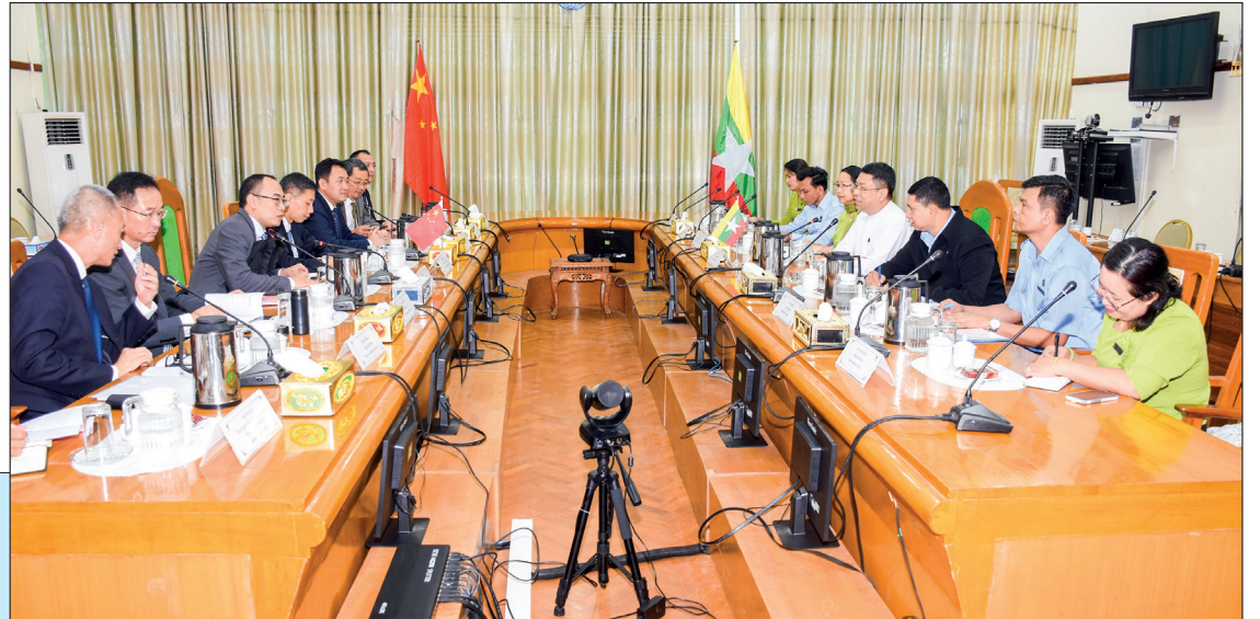
The coordination meeting on bilateral trade in progress yesterday in Nay Pyi Taw.

At the meeting, the participants discussed the opening of more border gates between the two countries, policy issues, the smooth flow of goods, financial cooperation, the greater cooperation between the two countries in agricultural sectors, and the status of increasing exports between the two countries. — MNA/CT