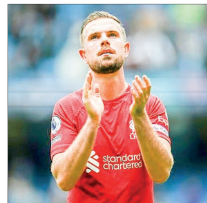
Jordan Henderson has left Liverpool after 12 years for Saudi Pro League club Al-Ettifaq.

Liverpool are due to receive an initial £12 million ($15.5 million) from the Saudi club.—AFP