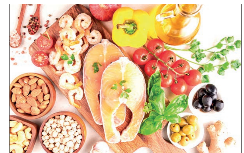
Researchers have turned their attention to exploring the potential effects of omega-3 fatty acids on lung health. One promising avenue of exploration lies in the realm of nutrition, particularly the potential benefits of omega-3 fatty acids found abundantly in fish and fish oil supplements.

One caveat of the current study is that it only included healthy adults. As part of this ongoing project, researchers are collaborating with the COPD Gene study to examine blood levels of omega-3 fatty acids in relation to