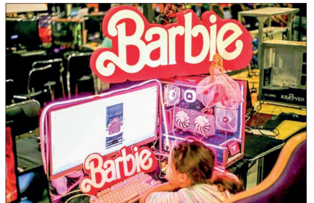
A child looks at a Barbie-themed computer in Anhembi, northern Sao Paulo, Brazil, on 26 July 2023.

Mattel's toy categories were mixed, with "Hot