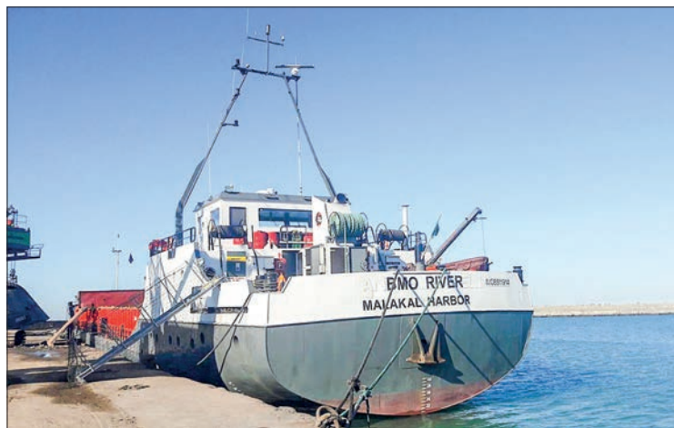
The ship, Bmo River, arrived from Türkiye and had previously sailed twice to the Ukrainian port of Reni, the state-run Interfax news agency reported, citing security officials.

“The foreign ship may have been used earlier to transport explosive substances to Ukraine,” the FSB