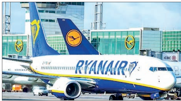
The complaint alleges that the budget airline is forcing customers to go through an invasive facial recognition process.

Noyb said the complaint came from a customer from Spain who booked a Ryanair flight through the Barcelona-based online travel agency eDreams and then received an email from Ryanair requesting her to complete a "verification process". The case was filed with the Spanish Data Protection Agency (AEPD).—AFP