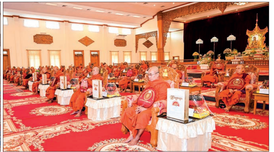
State Administration Council Chair Prime Minister Senior General Min Aung Hlaing attends the Waso robe-offering event, and along with his wife, offers Waso robes yesterday (above and below photos).