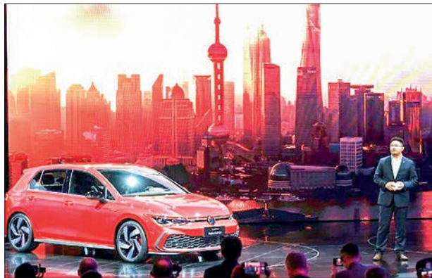
Volkswagen has faced increased competition in China, particularly in the booming electric car market.

In the first half of 2023, Volkswagen's deliveries of vehicles in China were down 1.2 per cent compared to the previous year, weighed down by a