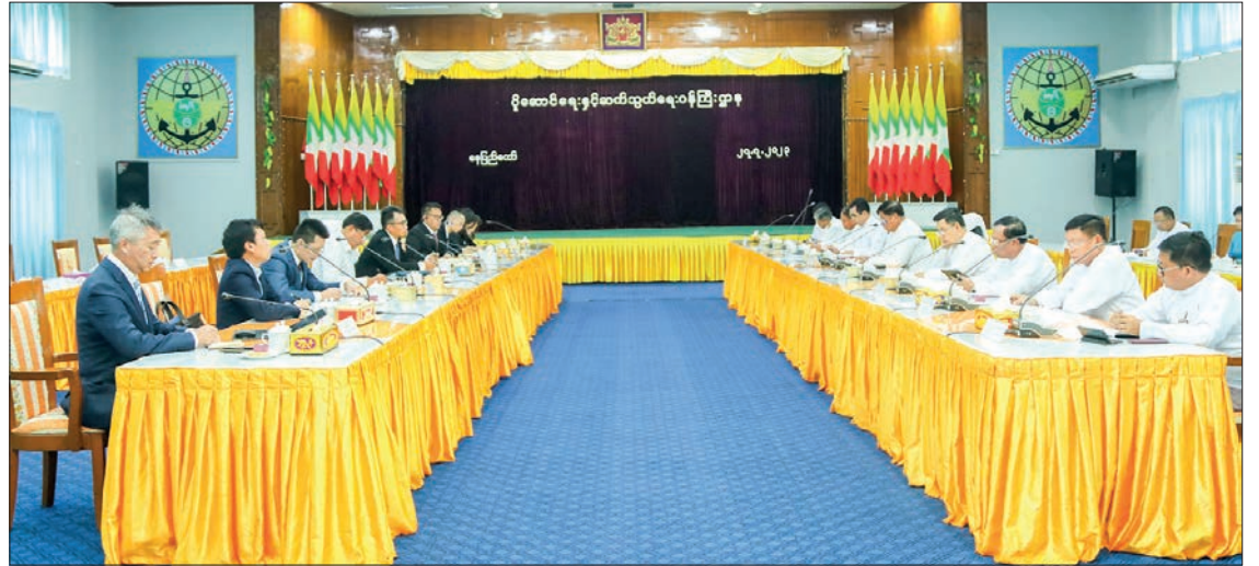
SAC Member DPM Union Transport & Communications Minister Admiral Tin Aung San holds talks with the Chengdu business delegation yesterday.

During the meeting, they openly exchanged views on border facilitation for trade, supply and transport, gems and jewellery, transport of marine products and vegetables to China by cargo flights and the establishment of a pilot training school in Myanmar. —MNA/KTZH