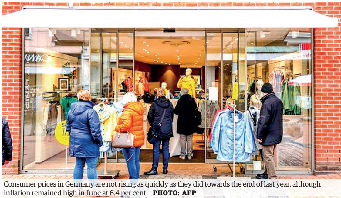
Consumer prices in Germany are not rising as quickly as they did towards the end of last year, although inflation remained high in June at 6.4 per cent.

GERMAN consumer confidence rose heading into August, a key survey showed Thursday, as once red-hot inflation looked to be on the way back down.