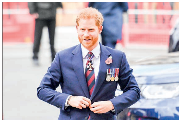
Prince Harry is suing several UK newspapers over alleged unlawful information-gathering.