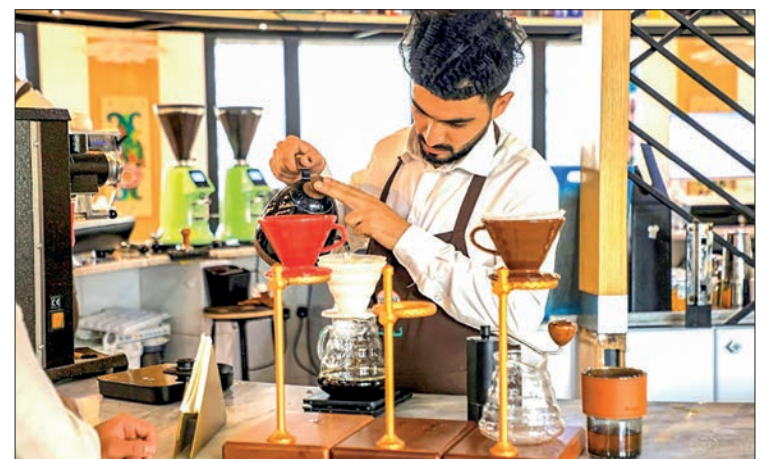
In Yemen, there is a war going on between rebel groups and the government. Despite the difficult situation, there are coffee houses in the capital city that serve speciality coffee.

The most famous among them is Mokhtar Alkhanshali, whose death-defying bid to ship a container full of speciality beans during the war's early stages was chronicled in Dave Eggers' 2018 best-selling book "The Monk of Mokha". — AFP