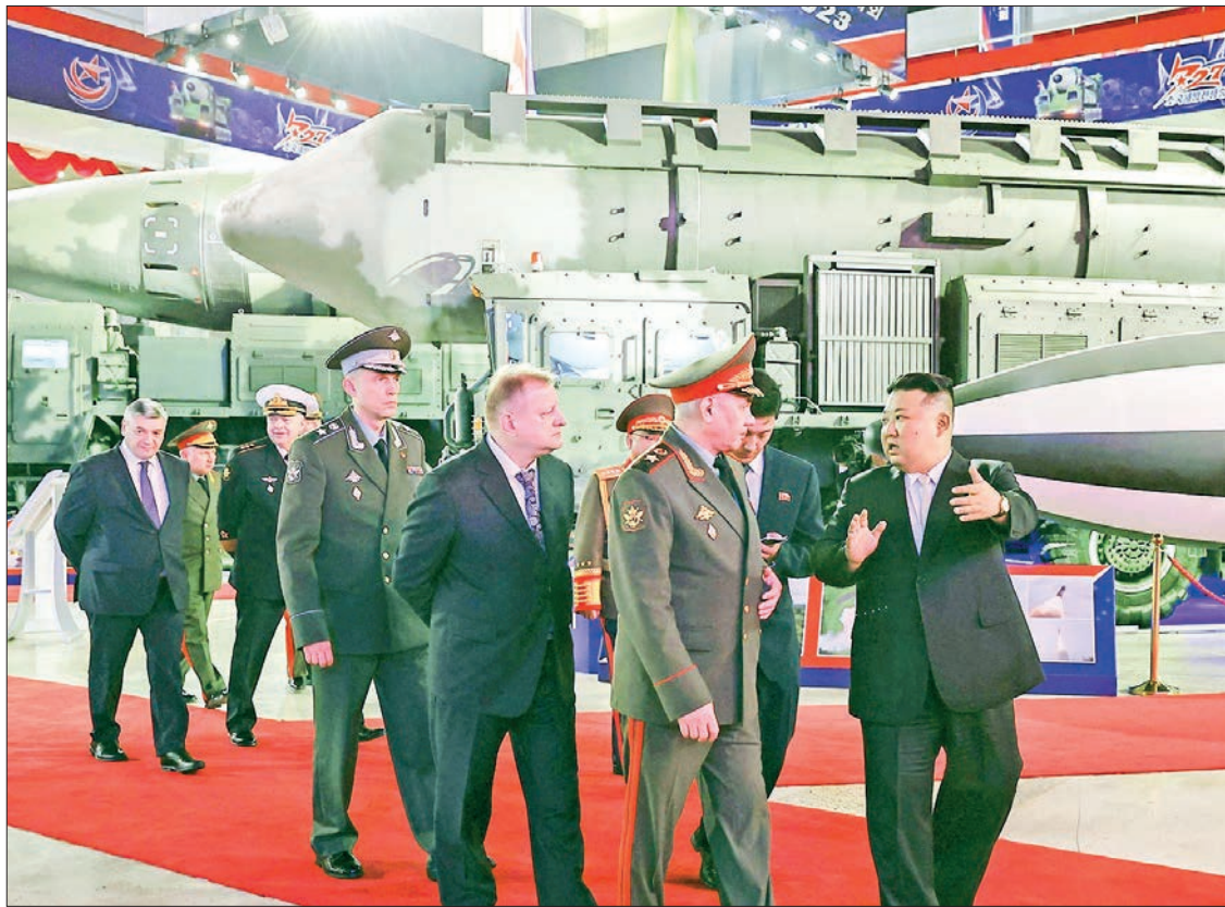
North Korean leader Kim Jong Un (front R) shows Russian Defence Minister Sergei Shoigu (front L) around an arms exhibition in Pyongyang on 26 July 2023.

NORTH Korean leader Kim Jong Un met Russian Defence Minister Sergei Shoigu on Wednesday and showed him round an arms exhibition held in the capital to commemorate the 70th anniversary of the Korean War armistice, state-run media in Pyongyang said.