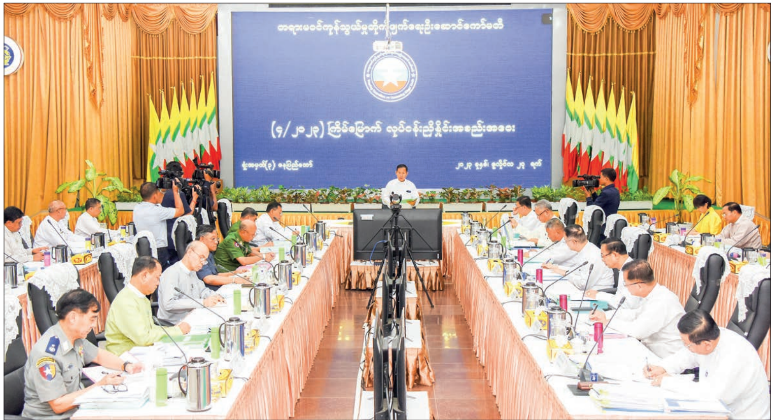
State Administration Council Vice-Chair Deputy Prime Minister Vice-Senior General Soe Win addresses the meeting 4/2023 of the Illegal Trade Eradication Steering Committee yesterday in Nay Pyi Taw.

The Vice-Senior General highlighted that the illegal trade process used detours for transportation and also passed the checkpoints and security gates with bribery money. Chairmen of special task forces and in-charge directors-general of OSS have to strictly supervise functions of checkpoints and security gates