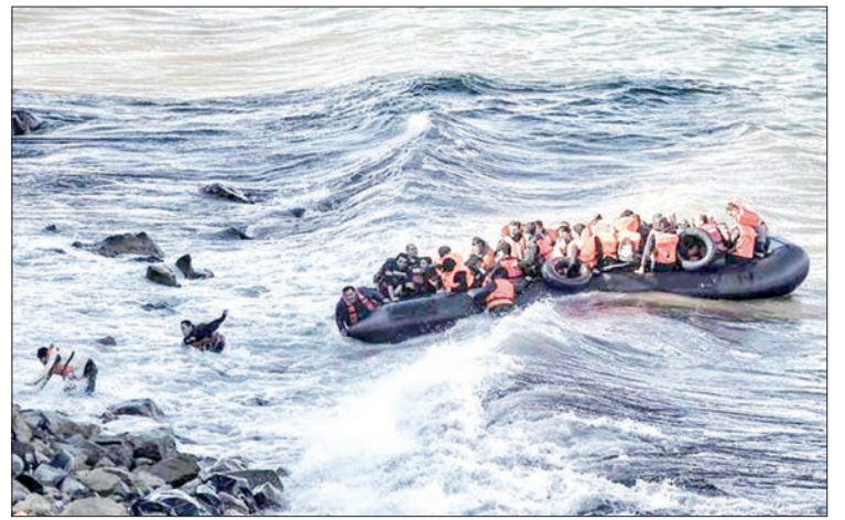
Refugees and migrants try to reach the shore of Lesbos in rough seas, 30 October 2015, after crossing the Aegean Sea from Türkiye.

migrant’s biometrics and migration status in the country. The ministry is planning to increase the number of centers up to 39, he said. Raids to detain illegal migrants under the new interior minister are now conducted daily, including on tourist ferries. Yerlikaya has pledged not to stop fighting illegal migration. Turkish President Recep Tayyip Erdogan