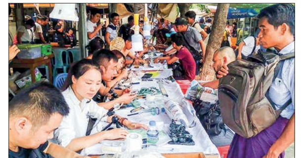
The photo shows some booths in the Mandalay gems market.

Market field inspections are also being conducted regularly by the FDA to prevent the use of hazardous chemicals and prohibited drugs in food and consumer goods sold in the market, in cooperation with related departments, including regional FDAs and the Township Food and Drug Supervision Committee. — TWA/CT