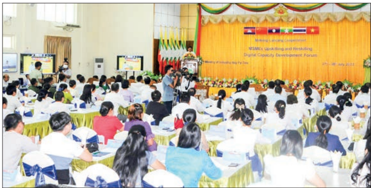
Forum to enhance digital skills of Mekong-Lancang MSMEs in progress yesterday in Nay Pyi Taw.

A forum to enhance the digital skills of Mekong-Lancang MSMEs was held yesterday morning at Office No 30 of the Ministry of Industry in Nay Pyi Taw.