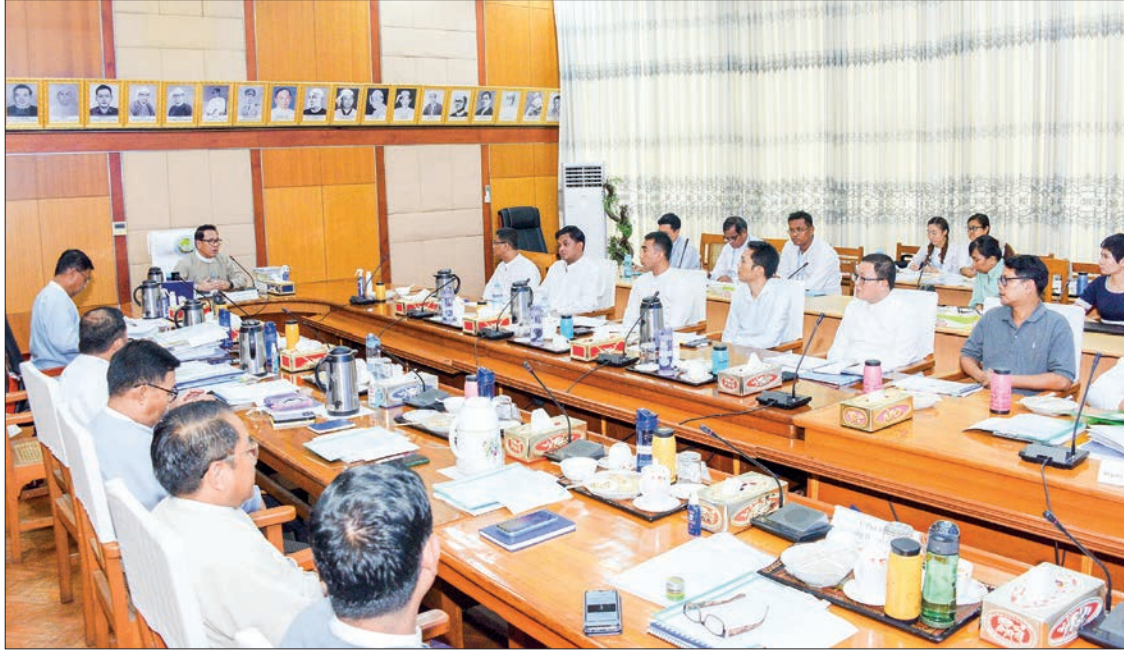
Union Minister U Maung Maung Ohn briefs about the debut of three new TV channels on MRTV yesterday.

THE Ministry of Information announced the debut of three new TV channels on the MRTV DTH Platform (Direct to Home)