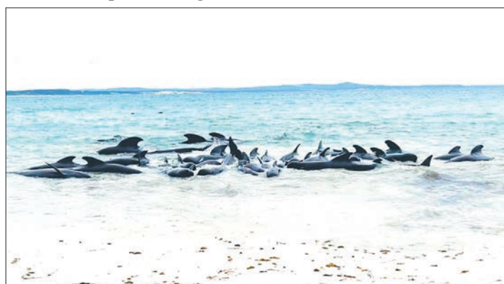
Scores of pilot whales stranded at Cheynes beach, near Albany in Western Australia.

"From that point, the vets assessed them and it was determined on welfare grounds that they needed to be euthanized." — AFP