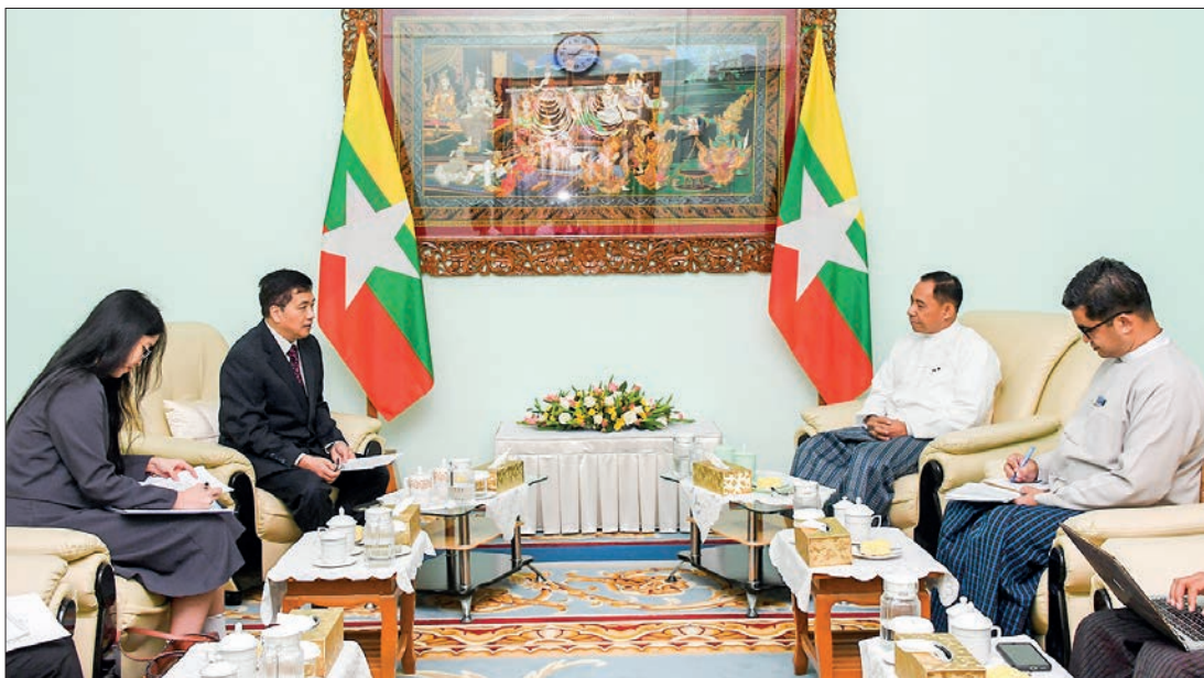
The Special Envoy for Asian Affairs of China calls on SAC Member Union Minister NSPNC Chair Lt-Gen Yar Pyae yesterday.

MEMBER of the State Administration Council Union Minister at the Union Government Office and Chairman of the National Solidarity and Peacemaking Negotiation Committee Lieutenant-General Yar Pyae met