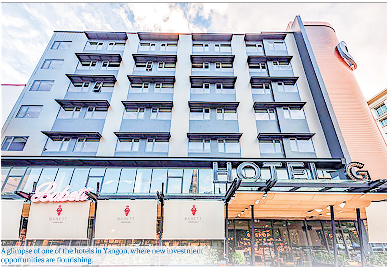
A glimpse of one of the hotels in Yangon, where new investment opportunities are flourishing.