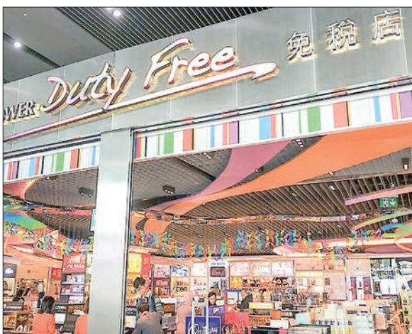
A King Power Duty-Free shop in Bangkok, Thailand.

This promotion will run until 30 September 2023 and is valid at King Power stores in Suvarnabhumi, Don Mueang, Chiang Mai, U-Tapao Airports, as well as King Power Rangnam, Srivaree, Pattaya, and Phuket. — TWA/MKKS