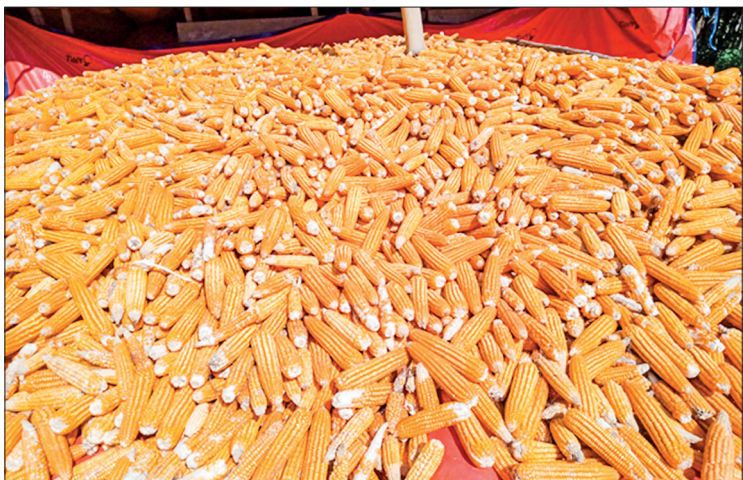
The corn is cultivated in Shan, Kachin, Kayah and Kayin states and Mandalay, Sagaing and Magway regions. The photo shows the corn for sale in the market.

THE price of corn rallied to K1,170-1,190 per viss in the domestic market as the FOB corn prices rise to US$290-310 per tonne, according to Yangon Region Chambers of Commerce and Industry (Bayintnaung Commodity Depot).