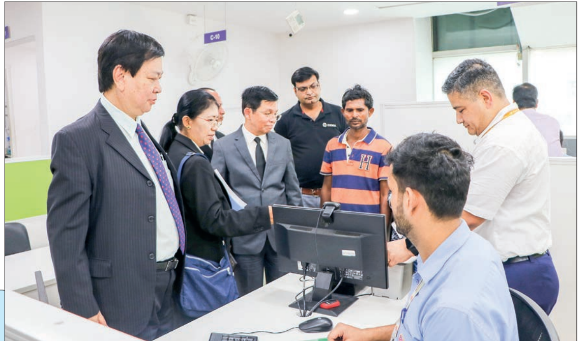
Union Minister U Myint Kyaing and Ambassador U Moe Kyaw Aung seen during their visit to the regional office of the Aadhaar Centre in New Delhi.

The visit to the Aadhaar Centre in New Delhi marks a significant step in fostering collaboration and learning from India's experience in implementing this unique identification system. The Myanmar government continues to explore effective measures for streamlining services and providing better assistance to its citizens. — MNA/TS