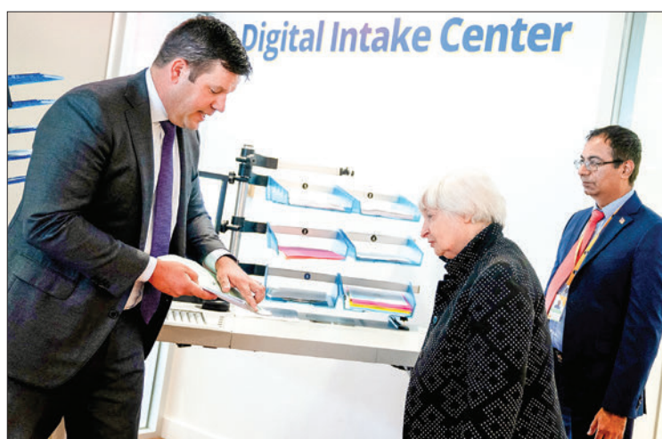
US Treasury Secretary Janet Yellen (C) looks on during a demonstration of a new Internal Revenue Service (IRS) (paperless processing initiative in McLean, Virginia, on 2 August 2023.

The two countries will also explore potential collaboration opportunities in carbon markets with third countries. — Xinhua