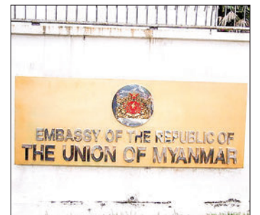
The photo shows the Myanmar Embassy, Kuala Lumpur.

It has been clarified that these social media profiles have no affiliation with the Myanmar embassy in Kuala