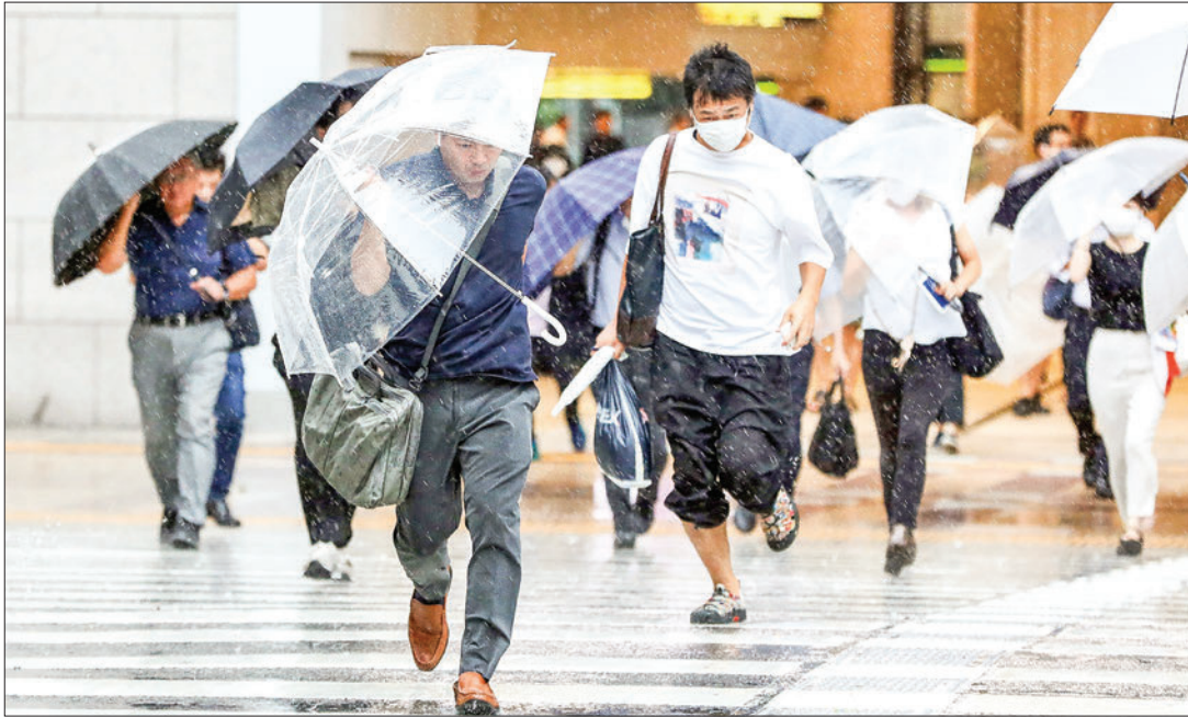
Pedestrians try to shield from wind and rain as they cross the street in front of Osaka Station on 15 August 2023 as Tropical Storm Lan hit the main island of Honshu overnight.