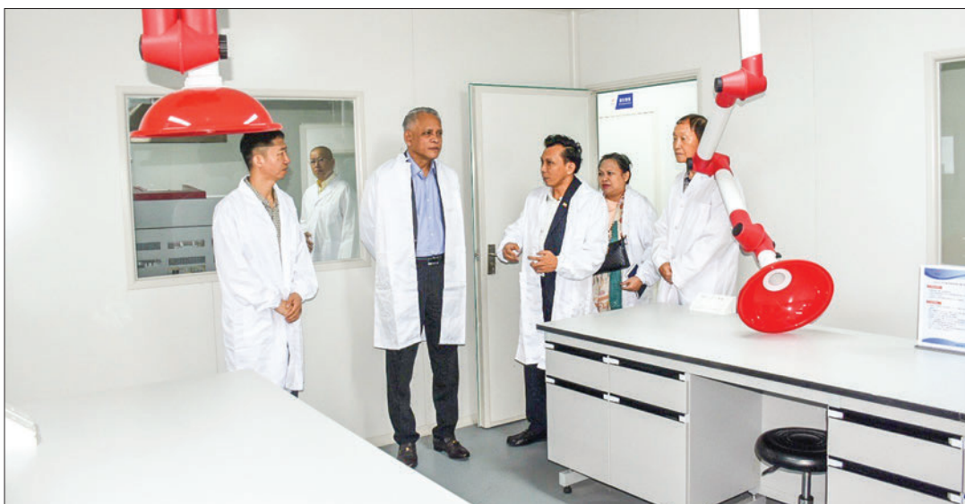
Union Minister U Aung Naing Oo (C) is pictured during his observation tour in Kunming, China.

In the evening, U Aung Naing Oo joined a dinner hosted by the Governor of Yunnan State, an event held to honour leaders of delegations from South and Southeast Asian nations. — MNA/KZW