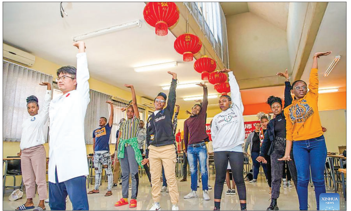
Students practice Baduanjin Qigong during a traditional Chinese medicine lecture at the University of Namibia in Windhoek, Namibia, on 14 August 2023.

During the lecture, the students had the opportunity to experience some of the techniques which included acupuncture,