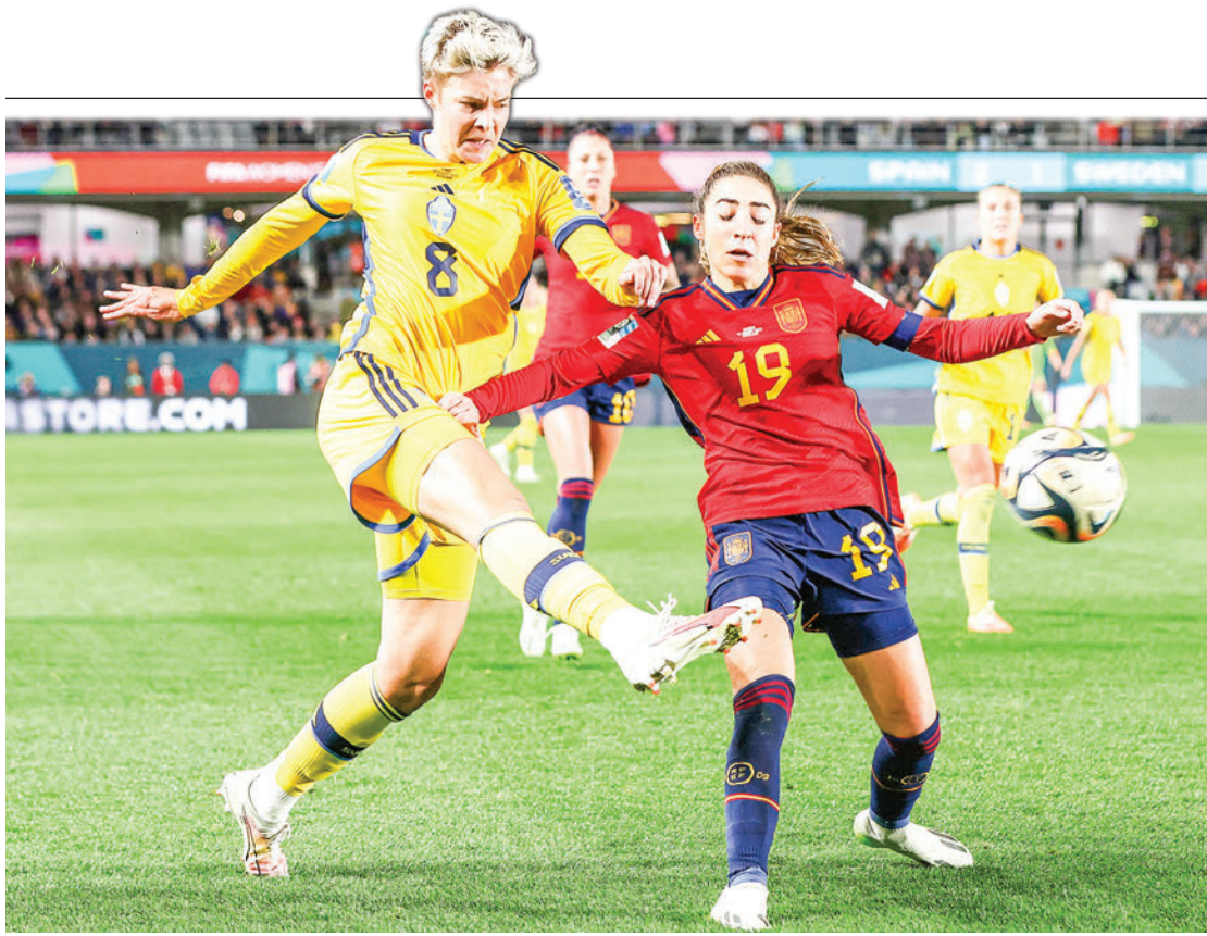
Spain's defender (19) Olga Carmona and Sweden's forward (8) Lina Hurtig fight for the ball during the Australia and New Zealand 2023 Women's World Cup semi-final football match between Spain and Sweden at Eden Park in Auckland on 15 August 2023.