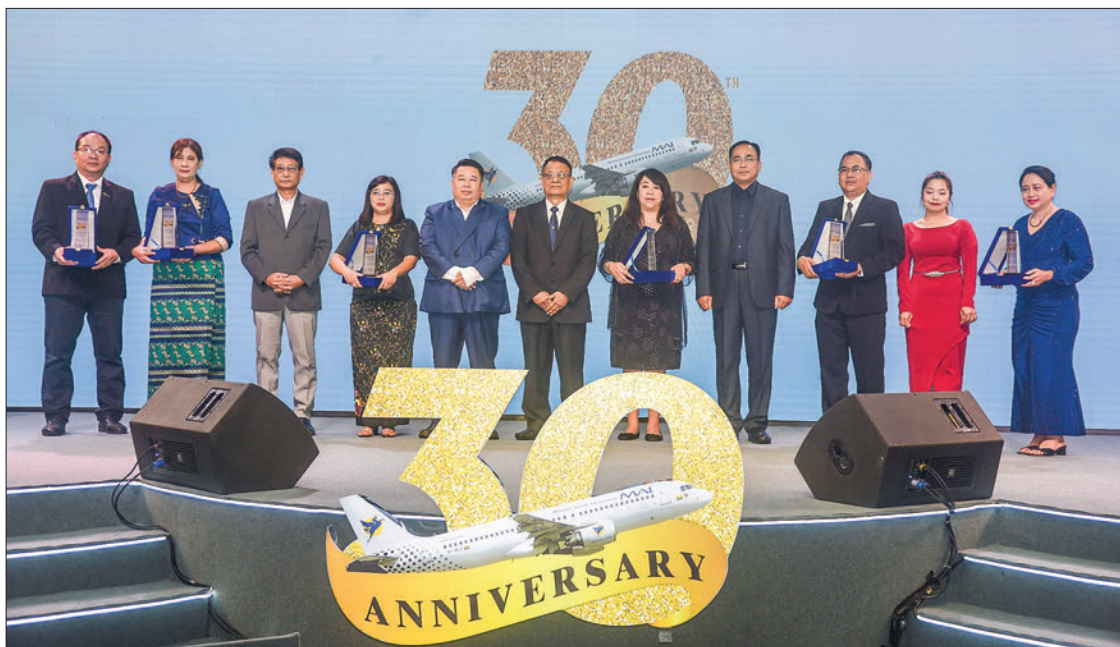
A commemorative group photograph captures the essence of the documentary celebrating MAI's 30 th anniversary, taken yesterday in Yangon.

MAI is a Myanmar national-owned private company and the safety and comfort of our passengers are the airline's priority regardless of the profits of the airline. The MAI has never suspended flights while the