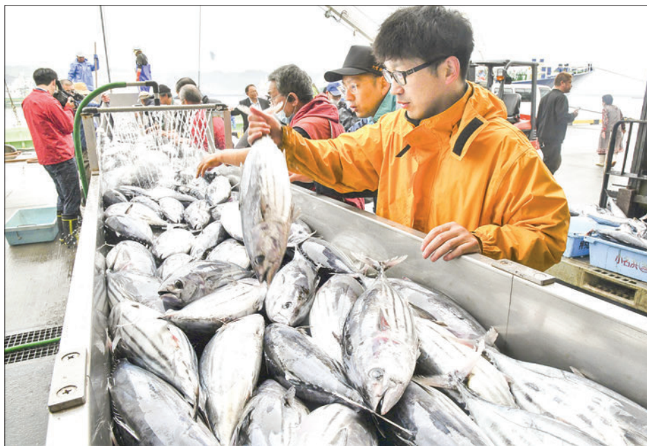
The season's first catch of bonito at Onahama port in Fukushima Prefecture, northeastern Japan, is landed on 29 May 2023.

Following the moves by European countries, Japan's Agriculture, Forestry and Fisheries Ministry plans to set up a new export support platform in Brussels to provide information to producers. — Kyodo