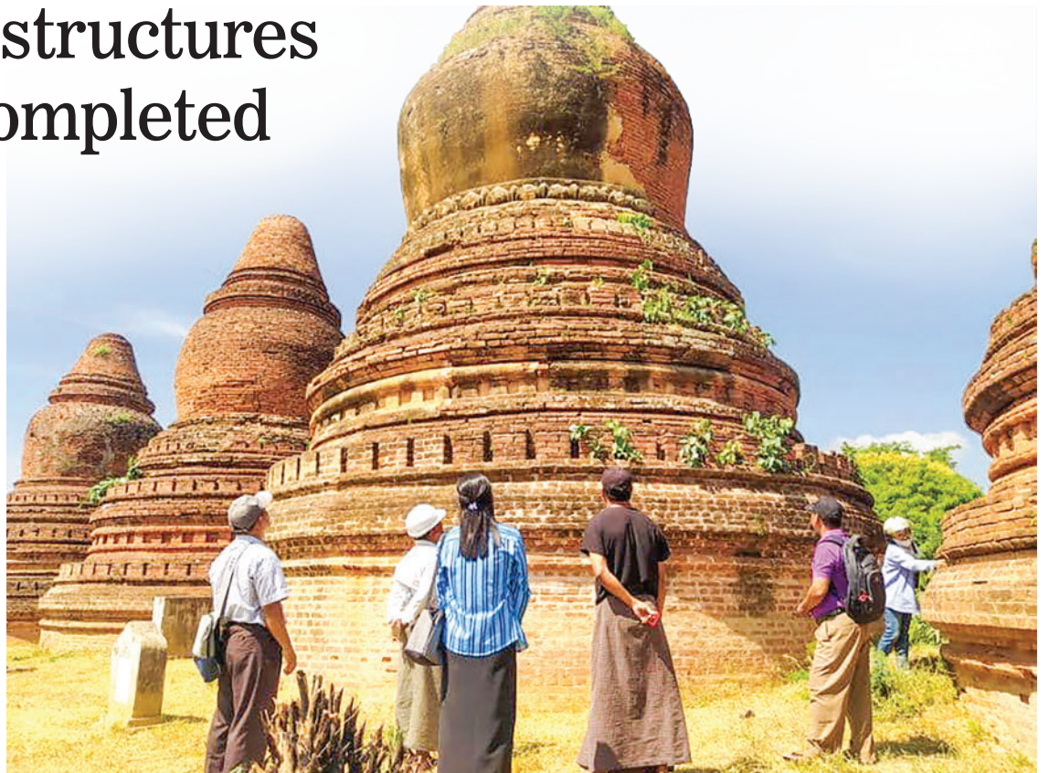
Personnel from the Department of Archaeology and National Museum (Bagan branch) are captured in the midst of their maintenance efforts within the Bagan Archaeological Zone.

“Maintenance works are carried out yearly and the scope of work each year is subjected to budget allotment. Bagan Archaeological Zone, which has more than 3,000 ancient buildings, has been divided into 11 sections and is being cleaned and beautified. The weeds clinging to the pagodas are removed using chemicals. In addition to normal maintenance schedules, the pagodas and temples affected by the Mocha storm in May has been repaired following UNESCO guidelines,” Dr Min Swe said. — ASH/ TH