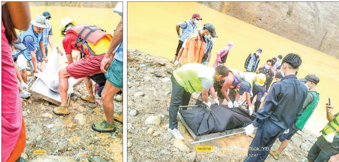
Members of the Parahita teams are seen carefully packing the recovered bodies at the incident site in Phakant's jadeland area.

This incident mirrors a similar tragedy that unfolded in 2020, where a sand cliff collapse in Wekha Hmaw, Phakant Township, resulted in the loss of over 150 unregistered prospectors' lives. — TWA/KZW