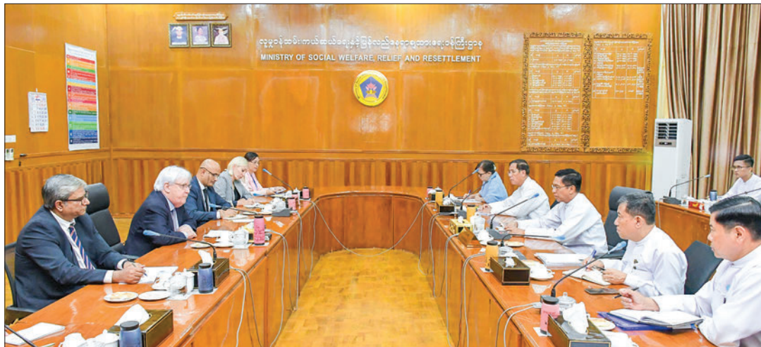
Discussions between Union Minister Dr Soe Win and the UN Humanitarian Chief underway yesterday.

UNION Minister for Social Welfare, Relief and Resettlement Dr Soe Win received Mr Martin Griffiths, UN Humanitarian and Emergency Relief Coordinator yesterday in Nay Pyi Taw.