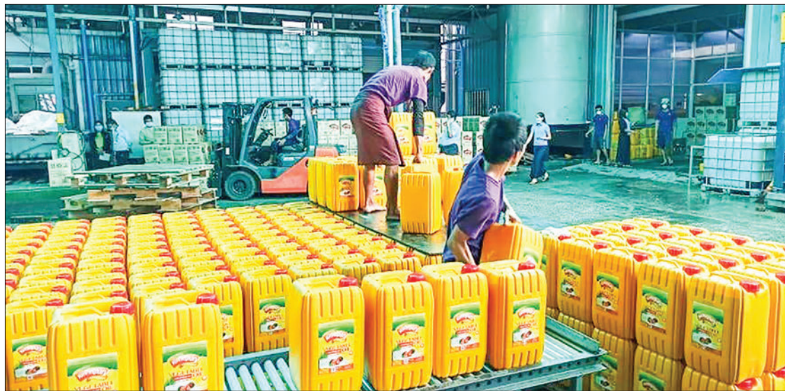
A glimpse inside a cooking oil factory, where workers are arranging jerrycans of edible oil destined for sale and distribution.

The Supervisory Committee on Edible Oil Import and Distribution under the Ministry of Commerce has been closely observing the FOB prices in Malaysia and Indonesia including transportation cost, tariff and banking service, and issuing the wholesale market reference