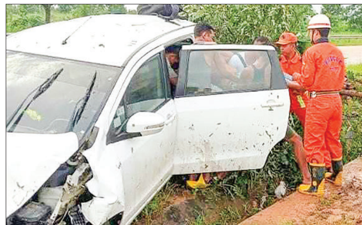
Fire brigade members are seen conducting rescue operations at the scene of an accident.

To ensure strict adherence to the expressway's speed limitations and traffic regulations, the Nay Pyi Taw Expressway Police Commander's Office has strategically deployed speed-measuring apparatus and is conducting vehicle inspections to bolster compliance with traffic norms. — TWA/KZW