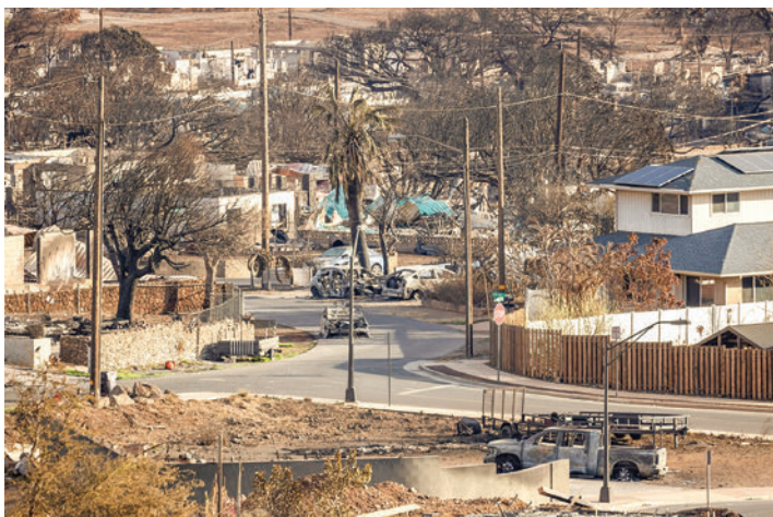
Charred remains of a burned neighbourhood is seen in the aftermath of a wildfire, in Lahaina, western Maui, Hawaii on 14 August 2023.