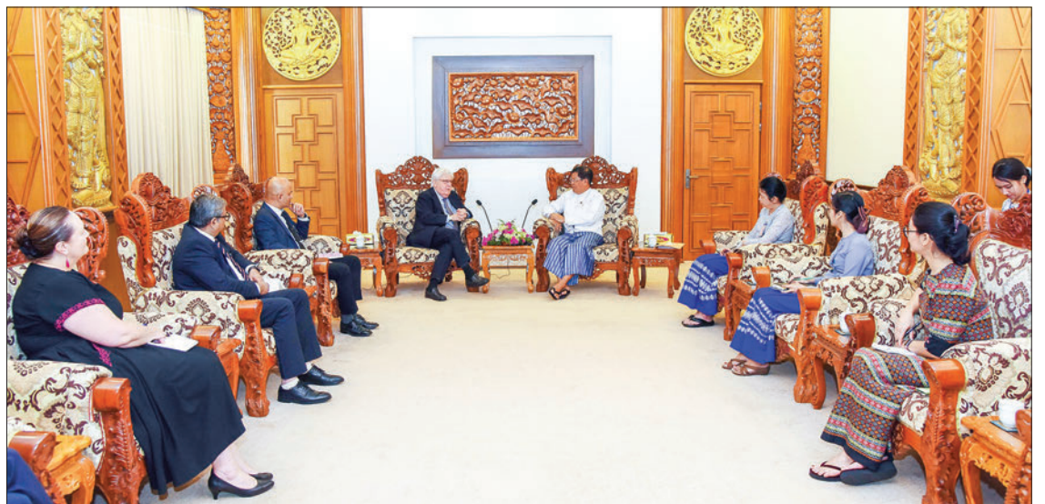
Mr Martin Griffiths UN Humanitarian Chief and his delegation calls on Deputy Prime Minister MoFA Union Minister U Than Swe yesterday in Nay Pyi Taw.

During the meeting, they exchanged views on the current cooperation between Myanmar and the United Nations and facilitation for the provision of humanitarian assistance to the needy population. — MNA