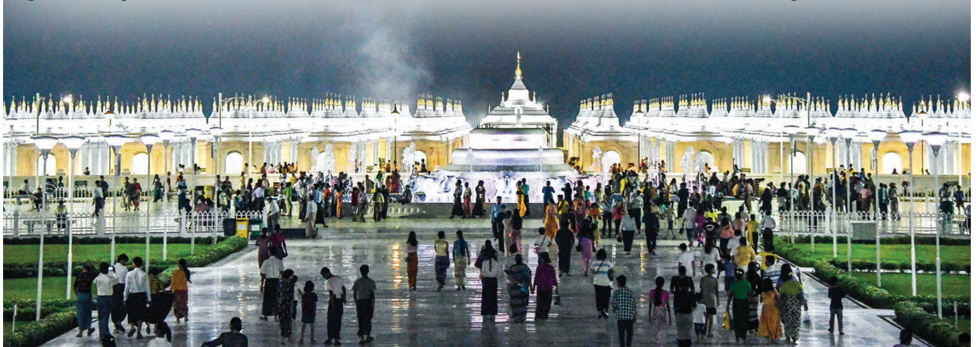
Devotees are seen gathering to pay homage to and worship the Maravijaya Buddha Image yesterday in Nay Pyi Taw.

For additional information, please visit the Maravijaya Buddha Image's official website at mbiw.myannet.com , as well as their Twitter account and Telegram channel. — MNA/KTZH