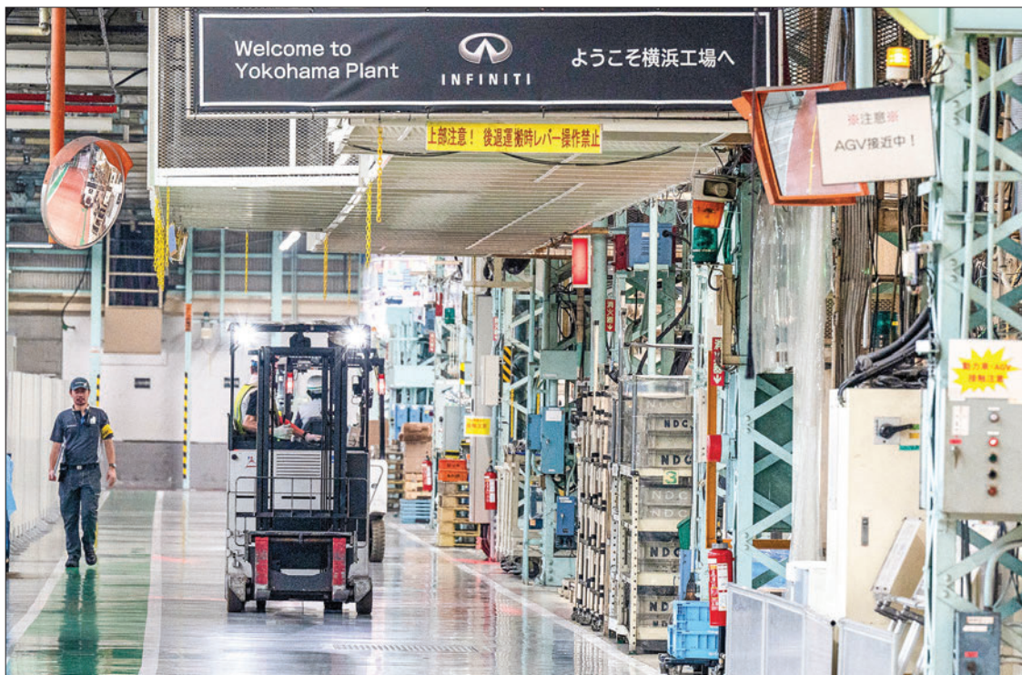
Employees (C) operate vehicles during a media tour of Japanese automaker Nissan's engine plant in Yokohama, Kanagawa prefecture on 19 July 2023, after the company marked in June the production of its 40 millionth engine since commencing operations in 1935.

On an annualized basis, growth was 6.0 per cent, more than double the market expectation of 2.9 per cent, and giving Japan three-straight quarters of growth.