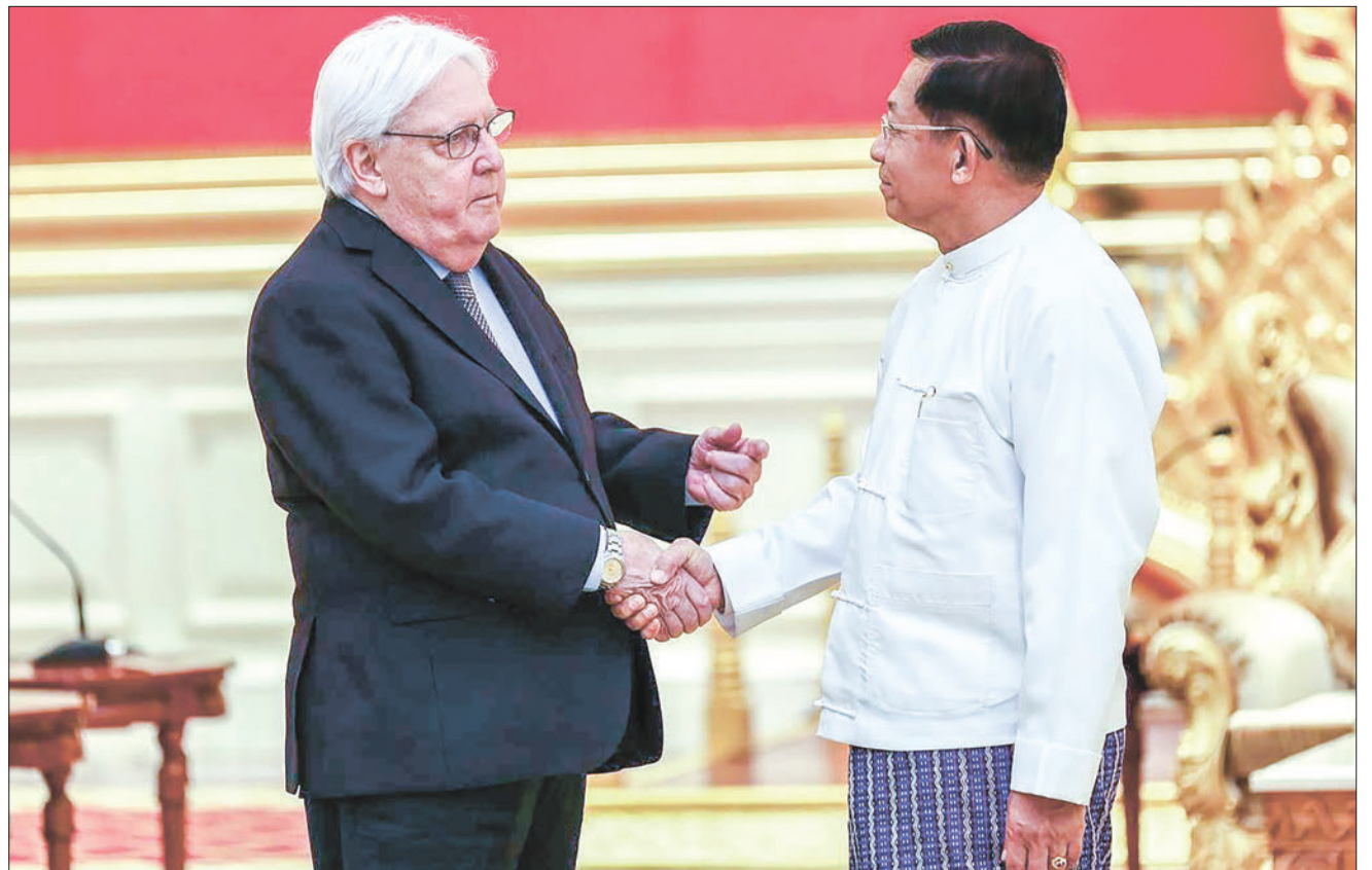
SAC Chair Premier Senior General Min Aung Hlaing extends a warm welcome to UN Humanitarian Chief Mr Martin Griffiths during the latter's courtesy call yesterday in Nay Pyi Taw.

They frankly exchanged views on political progress in Myanmar, State responsibilities being taken by the Tatmadaw under the Constitution (2008) for occurrences of voting fraud in the 2020 multiparty democratic general elections, endeavours of the State Administration Council to continue strengthening the multiparty democratic system the people aspire to, restoration of internal peace, requirements for undertaking the development of ethnic areas, spreading misinformation on various situations of Myanmar in the international community, the need for the international community to know actual conditions in Myanmar, lesser aid of international organizations including the United Nations for Myanmar in the period when the Covid-19 broke out and storm Mocha hit, and further cooperation in humanitarian aid. — MNA/TTA