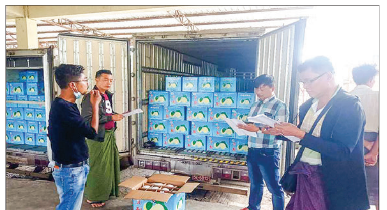
Export and import cargoes are seen on the Myanmar-China border.

According to the MACCS system, as of the second week of August, the exchange rate stood at K293.0825 per Chinese yuan, and the current status of the trade route remains favourable. — ASH/CT