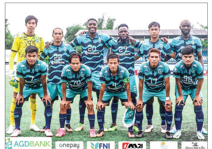
The Yangon United Football Club is seen posing for a group photo.

If Yangon gets past the Bruneian club DPMM FC, they will have to compete against the Indonesian club PSM Makassar in the next round to qualify for the group stage. — TWA/KZL