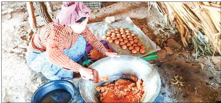
The photo shows a woman making palm sugar.

The domestic consumption of edible oil is estimated at 1 million tonnes per year. The local cooking oil production is just about 400,000 tonnes. To meet the oil sufficiency in the domestic market, about 700,000 tonnes of cooking oil are yearly imported through Malaysia and Indonesia. — NN/EM