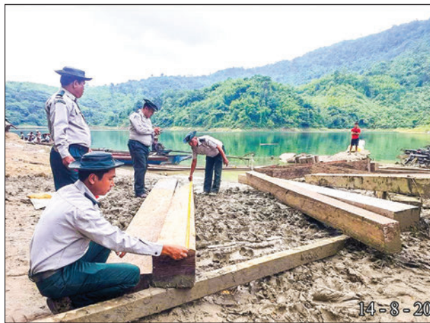
Officials inspect confiscated illegal timbers in the left photo while the above right photos show seized illegal items under scrutiny.

THE combined teams under Magway Region Illegal Trade Eradication Task Force impounded nine smuggled oxen worth K8.18 million near a monastery in Thaeday village in Thayet township and an unregistered Toyota Mark X (approximate value of K5 million) in Theinga ward in Magway township on 14 August. The action was taken under the Essential Goods and Services Law and the Export and Import Law.