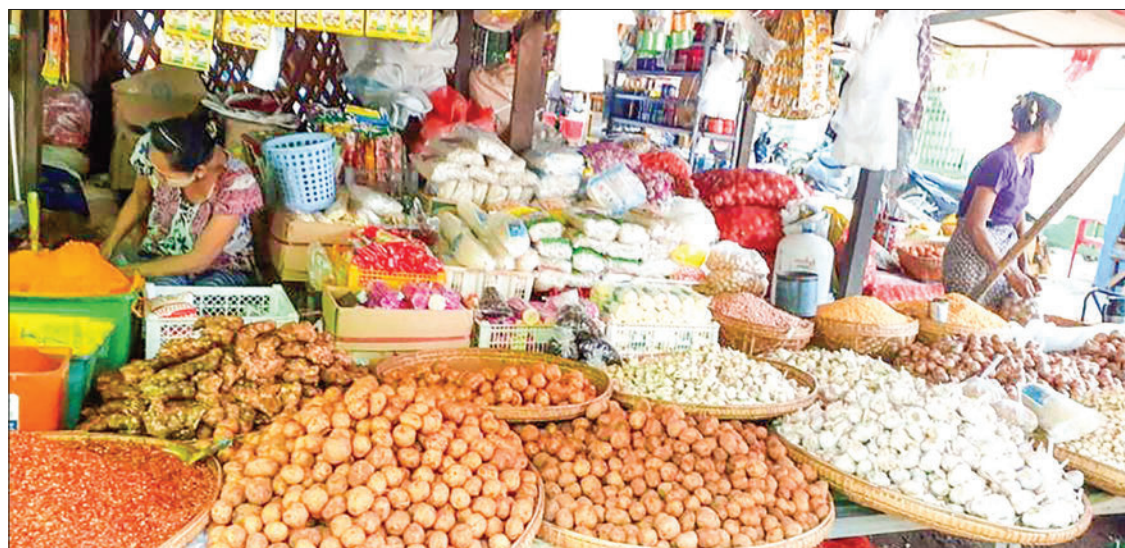
Vendors are seen organizing kitchen groceries for sale at the retail outlet in Yangon.

In the second week of August, black gram fetched K2,399,000 per tonne for RC and K2,589,000 per tonne for SQ/RC. Green gram (Kayan Shwewah variety) stood at K3,500 per viss, Pakokku variety ranged from K3,665 to K3,750 per viss, and half of chickpeas commanded prices between K5,800 and K6,200 per viss. — TWA/CT