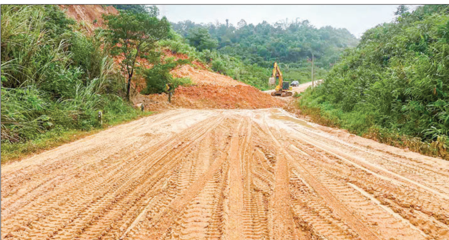
The photo captures the ongoing repair work on the Myawady-Kaw Kareik road section.

T HE clean-up activities were completed after the landslide on the Myawady-Kaw Kareik section of Asia Highway and the stranded vehicles passed using a single-lane road on 15 August, according to the Road Department under the Ministry of Construction.