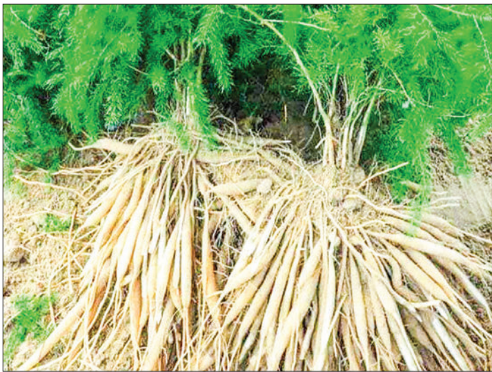
In 2023-2024FY, the Southeast Asian country exported 650 visses of Shatavari root to Busan, South Korea in July.

MYANMAR has launched a new export item Shatavari root to South Korea exporting 650 visses in July of this FY,