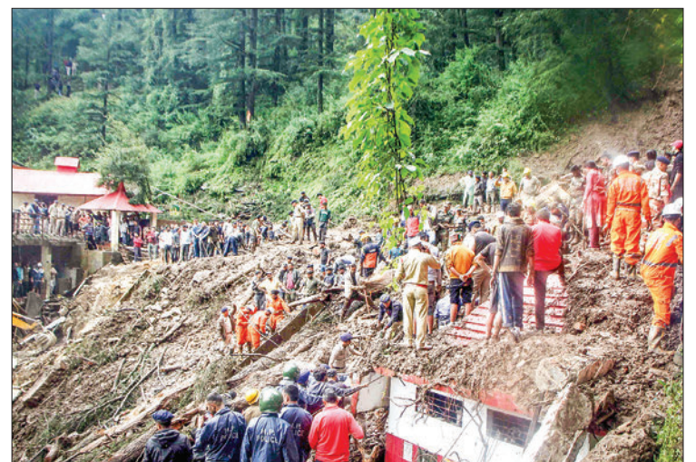
National Disaster Response Force (NDRF) personnel search for victims at the site of a landslide after a temple collapsed due to heavy rains in Shimla on 14 August 2023.

"Ecuador is going through its bloodiest period," said Gonzalez, a close former associate of Correa. She called the government inept and said the country has been taken over by organized crime gangs. — AFP