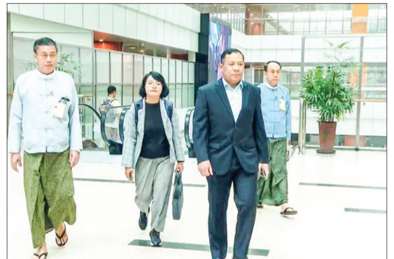
The MRTV delegation is seen before leaving for China at Yangon International Airport yesterday.

Senior information officials from Mekong countries including China, Cambodia, Laos, Myanmar, Thailand and Viet Nam, Heads of television stations and representatives of media organizations, and media representatives from South Asian countries will join the event. — MNA/KZL