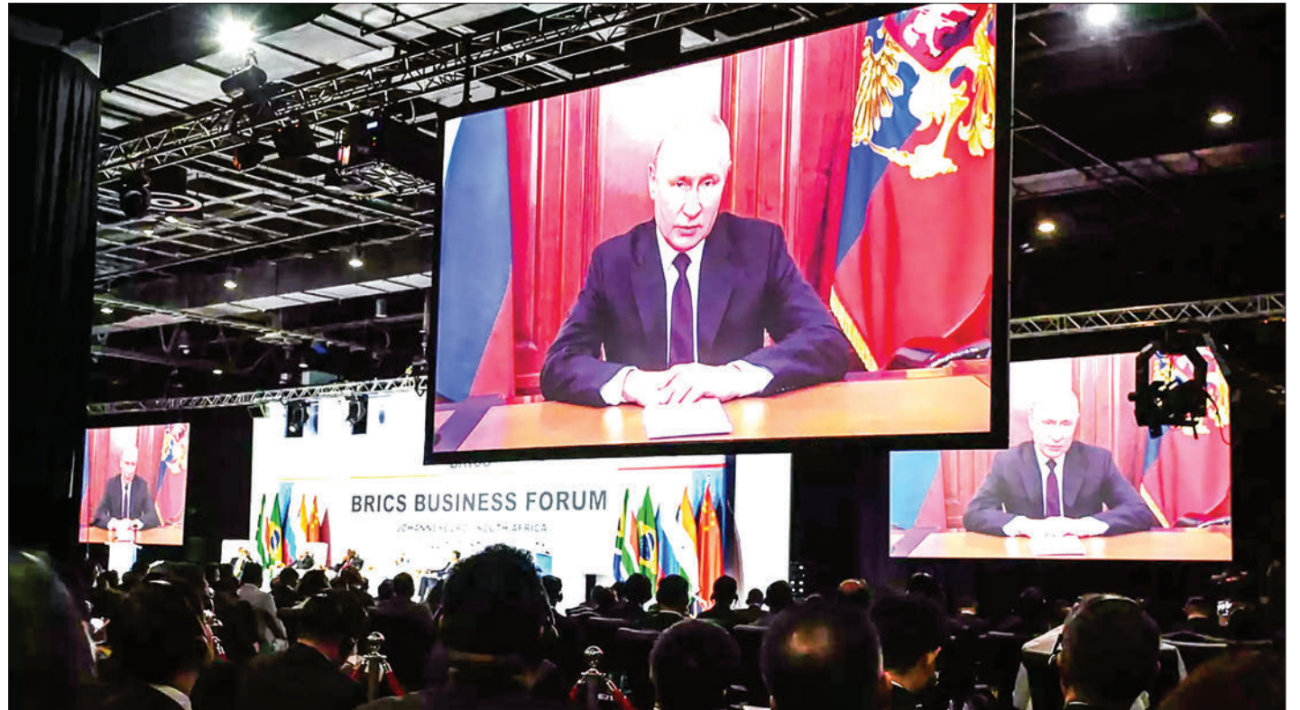
Russian President Vladimir Putin advocated for the establishment of a permanent transport commission within the BRICS framework, focused on advancing logistics.

The Russian President underscored the importance of BRICS nations expanding settlements using their respective national currencies and fostering increased cooperation among their banking systems.