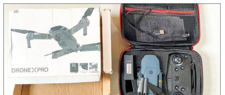
Smuggled Drone X Pro (drone with battery) worth K300,000 without official documents seized at the EMS international express on — 22 August 2023.

A total of six arrests were made on 22 August, with an estimated value of K250,383,603, as reported by the Illegal Trade Eradication Steering Committee. — MNA/MKKS