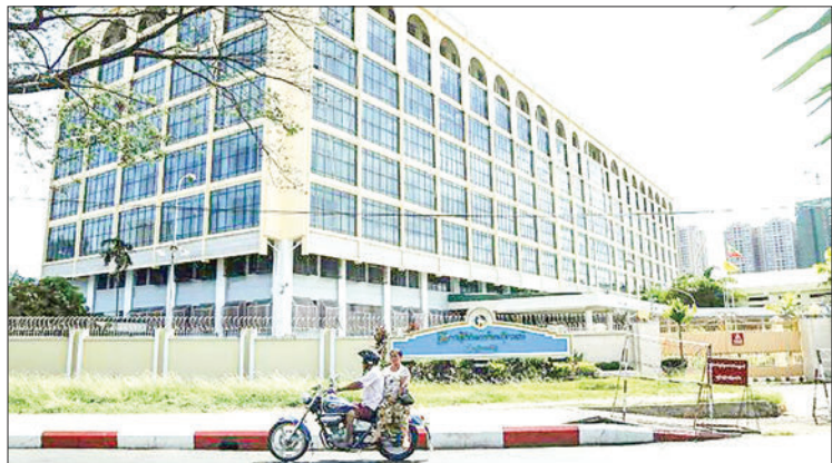
General view of the office of the Central Bank of Myanmar (Yangon branch).

The 134th Canton Fair will be held on online and offline platforms, featuring quality products with 74,000 booths. In particular, EVs, agricultural products, machines and electrical appliances, household devices and technological gadgets will be showcased. For further details, please visit www.cantonfair.org.cn . — NN/EM