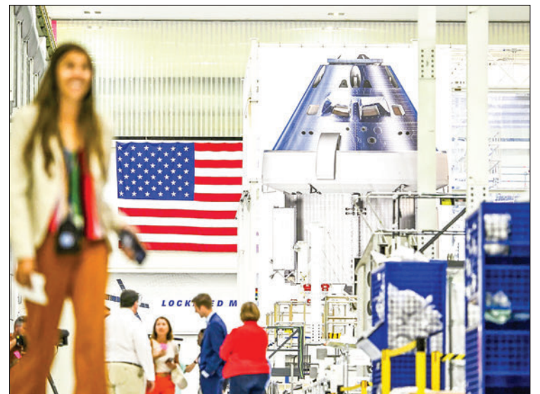
Officials and media personnel are seen inside the Operations and Checkout Building (O&C) at the Kennedy Space Centre in Cape Canaveral, Florida.