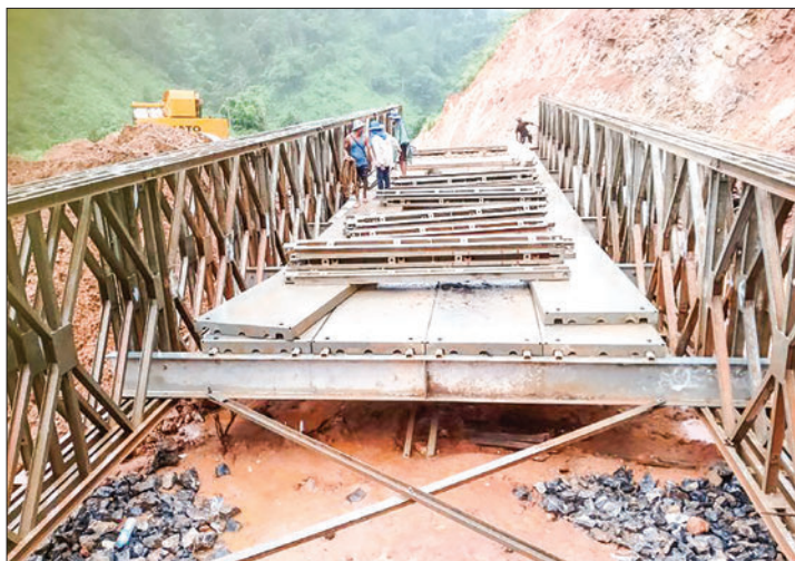
Efficient machinery and skilled manpower combine to restore Myawady-Kawkareik Road's damaged section.

AFTER heavy rains triggered a landslide on the Myawady-Kawkareik section on Asian Highway in Kayin State on 7 August, disrupting traffic, swift action was taken. The Kayin State government and the State Highways Department initiated the construction of a temporary Bailey bridge on 10 August. Currently, the bridge is 70 per cent complete.