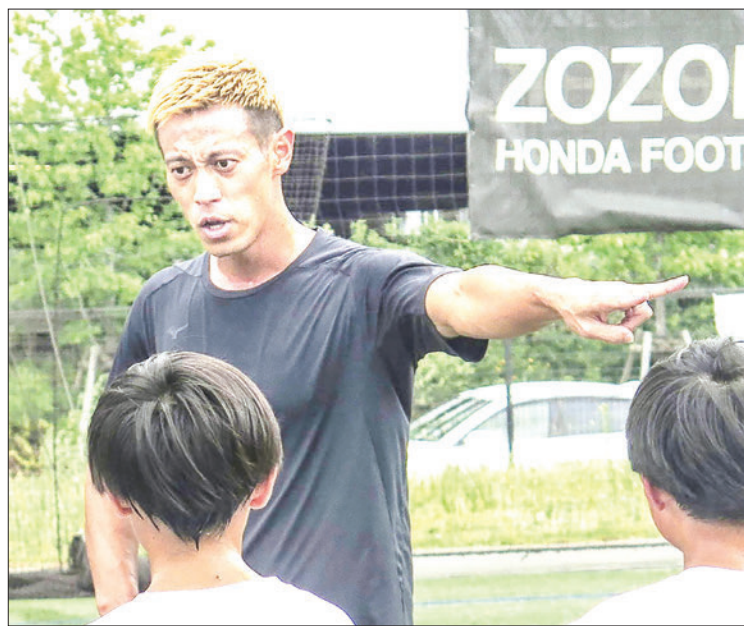
Former Japan international Keisuke Honda instructs young football players in the eastern Japan city of Chiba on 1 August 2023, after announcing the organization of a national competition for the Under-10 age group.

As Honda aims to “support challengers,” losing teams get to enter other tournaments as many times as they want. — Kyodo