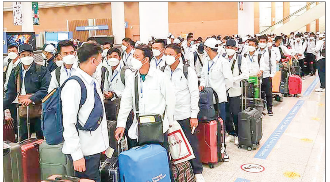
Myanmar migrant workers are seen going for work abroad at the airport.

THE Ministry of Labour plans to reduce the duration of a course on regional knowledge of a certain country being provided to locals who are about to work abroad, according to the ministry.