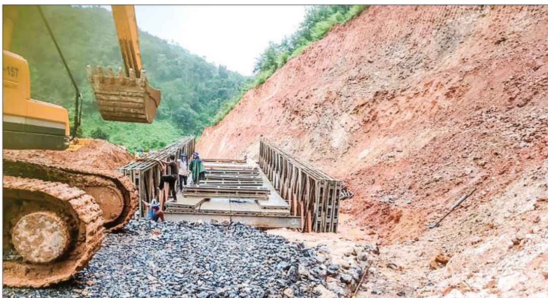
Progress underway: Construction of Bailey bridge in full swing.

goods vehicles to resume passage as construction advances. Concurrently, the efficient construction of the bridge approach and the temporary Bailey bridge's pavement on the Myawady-Kawkareik section on Asian Highway is ongoing. To ensure smooth operations, a security team led by a lieutenant-colonel from the Kawkareik station is providing tight security. — IPRD/KZW