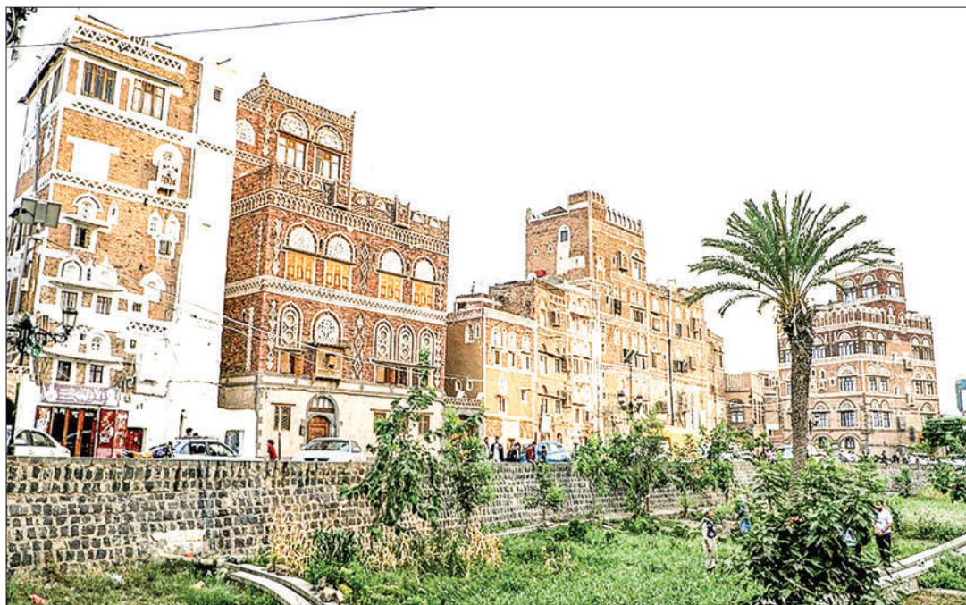
A picture shows a view of Unesco-listed buildings in the old city of the Yemeni capital Sanaa 12 July 2023.

DOAA al-Waseai spent many happy years working as a tour guide in the Old City of Yemen’s capital Sanaa, showing foreigners its hidden hammams and markets teeming with silver and spices.