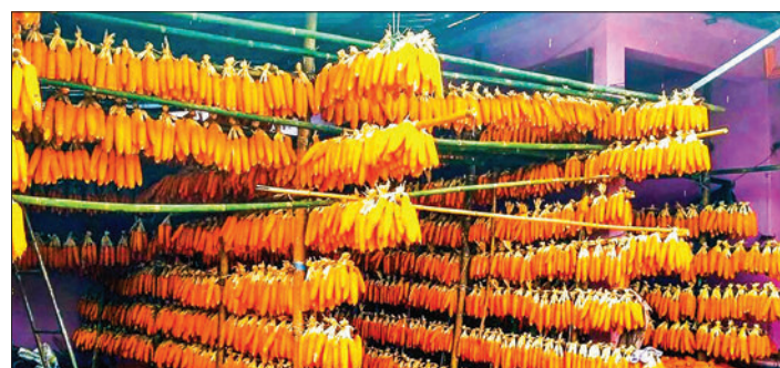
Systematic storage of corns seen at a residence not to lose quality of fruits.