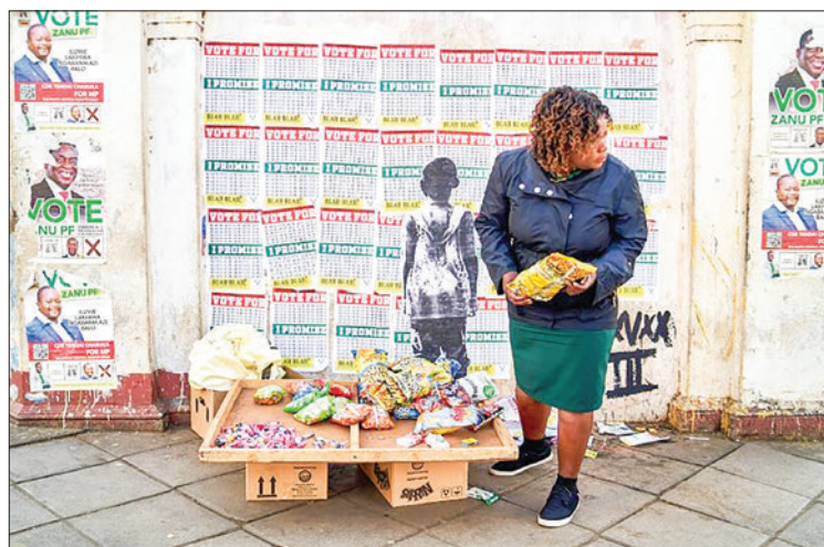
The opposition party has complained about being unfairly targeted by authorities. PHOTO: AFP

The opposition is hoping to ride a wave of discontent over the southern African country's economic woes that include high inflation, unemployment and widespread poverty. — AFP