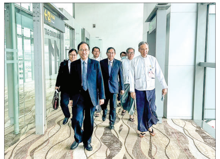
Union Minister Dr Thet Khaing Win and his delegation are seen before departing for Indonesia.

AT the invitation of the Republic of Indonesia, the ASEAN Alternate Chairman, the Myanmar delegation led by the Union Minister for Health Dr Thet Khaing Win embarked on a flight from Yangon to Indonesia yesterday morning to attend the ASEAN Finance and Health Ministers Joint Meeting and the ASEAN Health Ministers Meeting to be held in Jakarta, Indonesia, on 24-25 August.