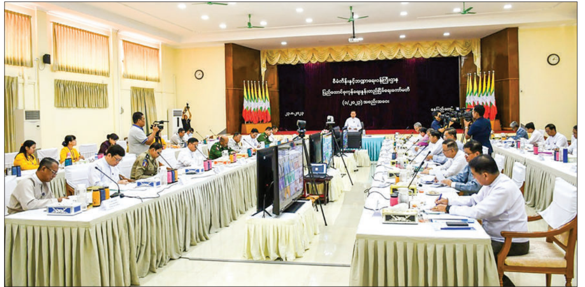
Deputy Premier and Union Planning & Finance Minister U Win Shein chairs Union Price Stability Committee's 1/2023 meeting yesterday.

He then urged the relevant committees and organizations to provide the farming and livestock sectors, support the manageable scale industry and work together with region/state departmental organizations to ensure price stability. — MNA/KTZH