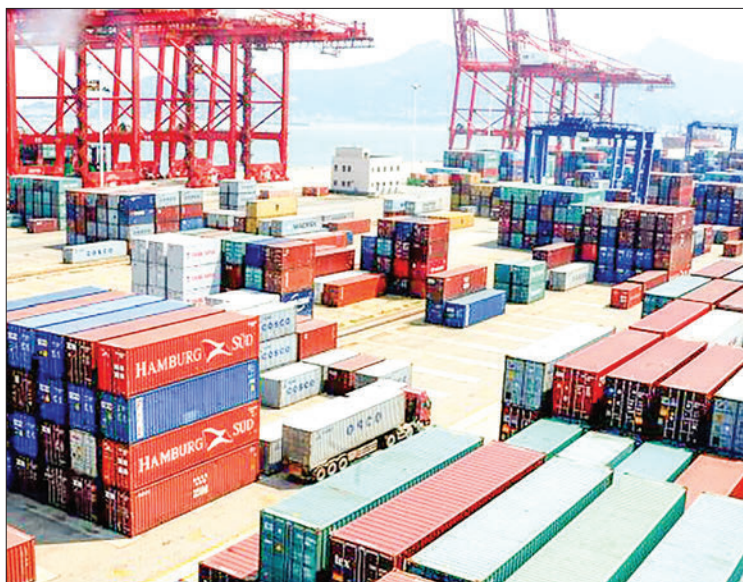
Containers at a cargo port.

The deputy minister highlighted a growth of 2.4 per cent during the six-month minibudget period, with an additional increase of 3.4 per cent observed in the 2022-2023 financial year. — TWA/CT