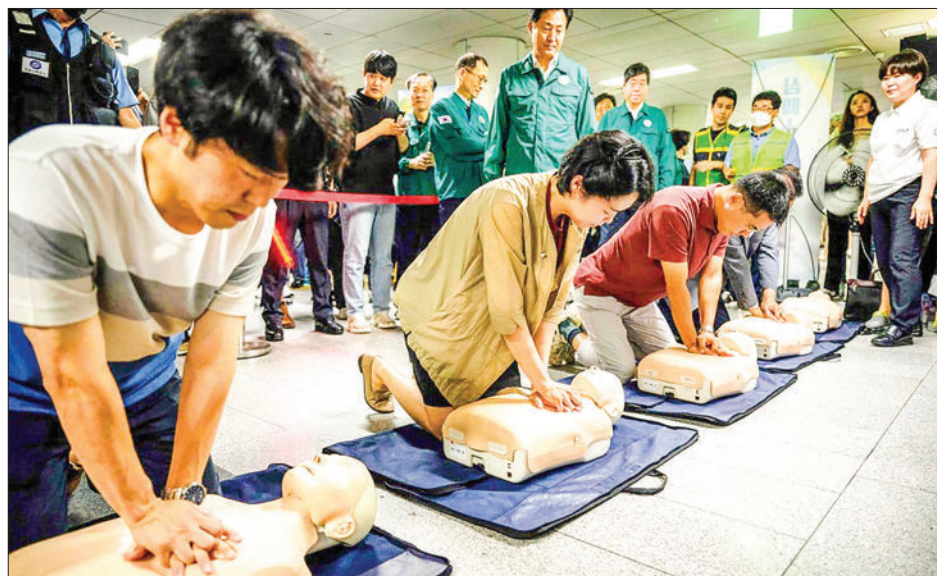
People receive CPR training, practicing on dummies, during a civil defence drill against possible attacks by North Korea, in an underground train station in Seoul on Wednesday.

"God has granted me a second life," the 15-year-old said. — AFP