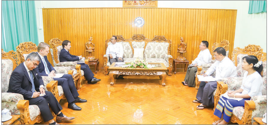
Union Minister for Labour U Myint Naung receives Chief of Mission of the International Organization for Migration (IOM) Myanmar Mr Dragan Aleksoski at the Ministry of Labour, Nay Pyi Taw on 23 August 2023.

processes under the MoU between the Department of Labour and IOM as well as MoU between the ministry and the IOM. Their discussion also included opportunities to cooperate between them and the support of the IOM to the people of Myanmar in the field of migration and cooperation between the two sides.