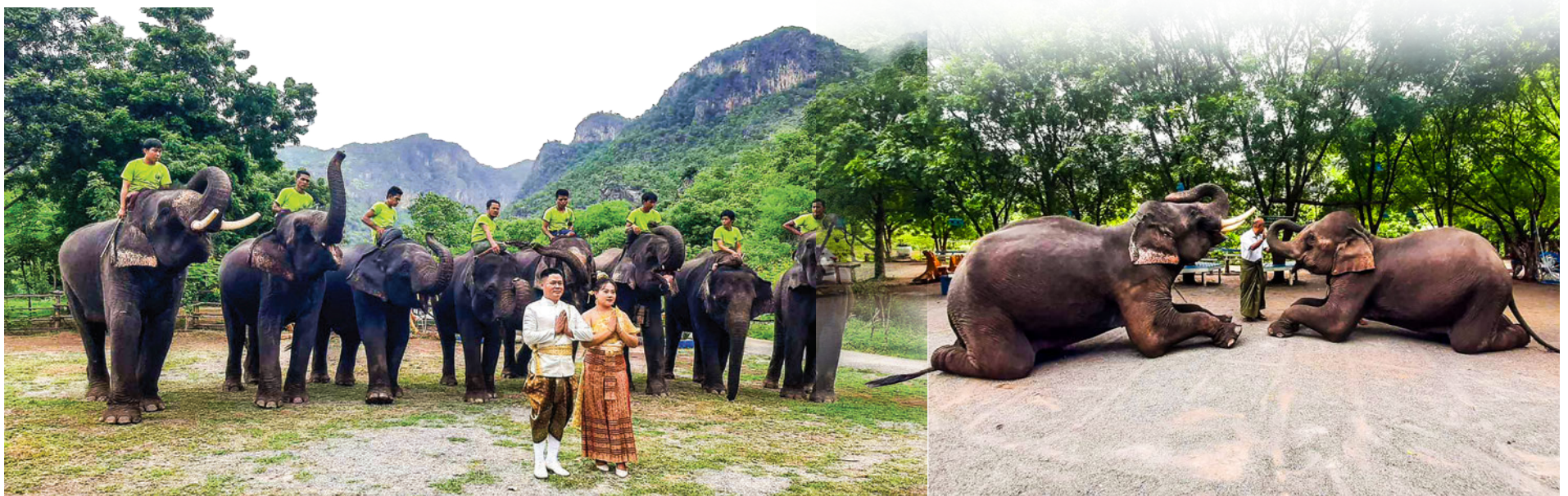
Wahnet elephant camp completes its preparations to welcome visitors who come to have joyful and relaxing experience during the upcoming domestic tourism season (top and above photos).

The entrance fee to the elephant camp is set at K1,000 per person, K3,000 for the short journey, K5,000 for the long journey, K10,000 for foreigners and K10,000 for short and long journey for elephant riding service. Free entry is set for children, monks and nuns.