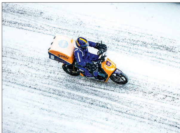
Getir has been downsizing since reaching its zenith during the coronavirus pandemic.

The layoffs will come in five countries where Getir intends to maintain operations — Türkiye, Britain, Germany,