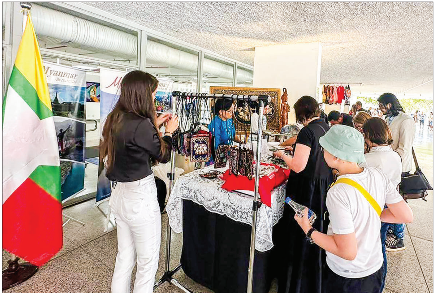
Enthusiastic visitors are seen exploring Myanmar's traditional food and handcrafted treasures at the Asian Food and Culture Bazaar in Brazil in the third week of August.

The AOLA will donate the funds to orphanages, nursing homes for elderly citizens, the disabled and poor communities in Brazil via the philanthropic organizations. — ASH/KTZH