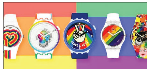
Swatch is a Swiss watchmaker known for its colourful and innovative designs.

In May, authorities raided Swatch stores at 11 malls across Malaysia, confiscating 172 watches they described as having "LGBT elements". — AFP