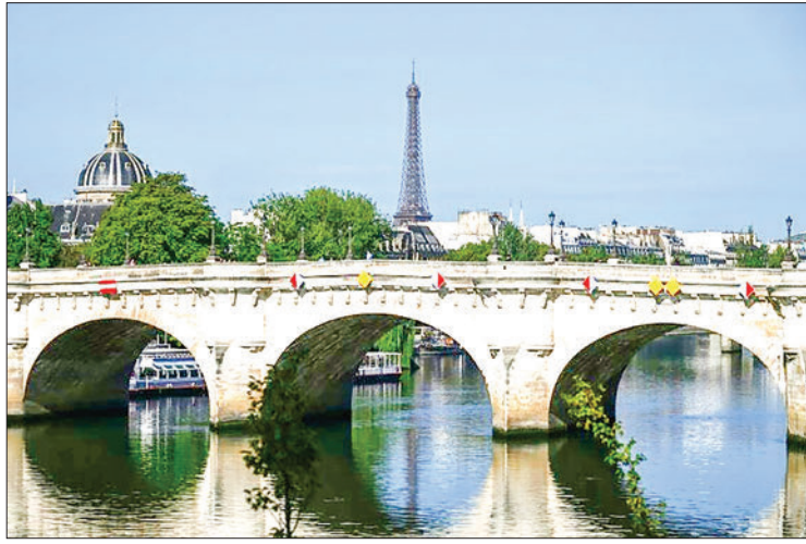
Downturns in the European Union's biggest economies, France and Germany, have led to an overall decline in activity in the eurozone.