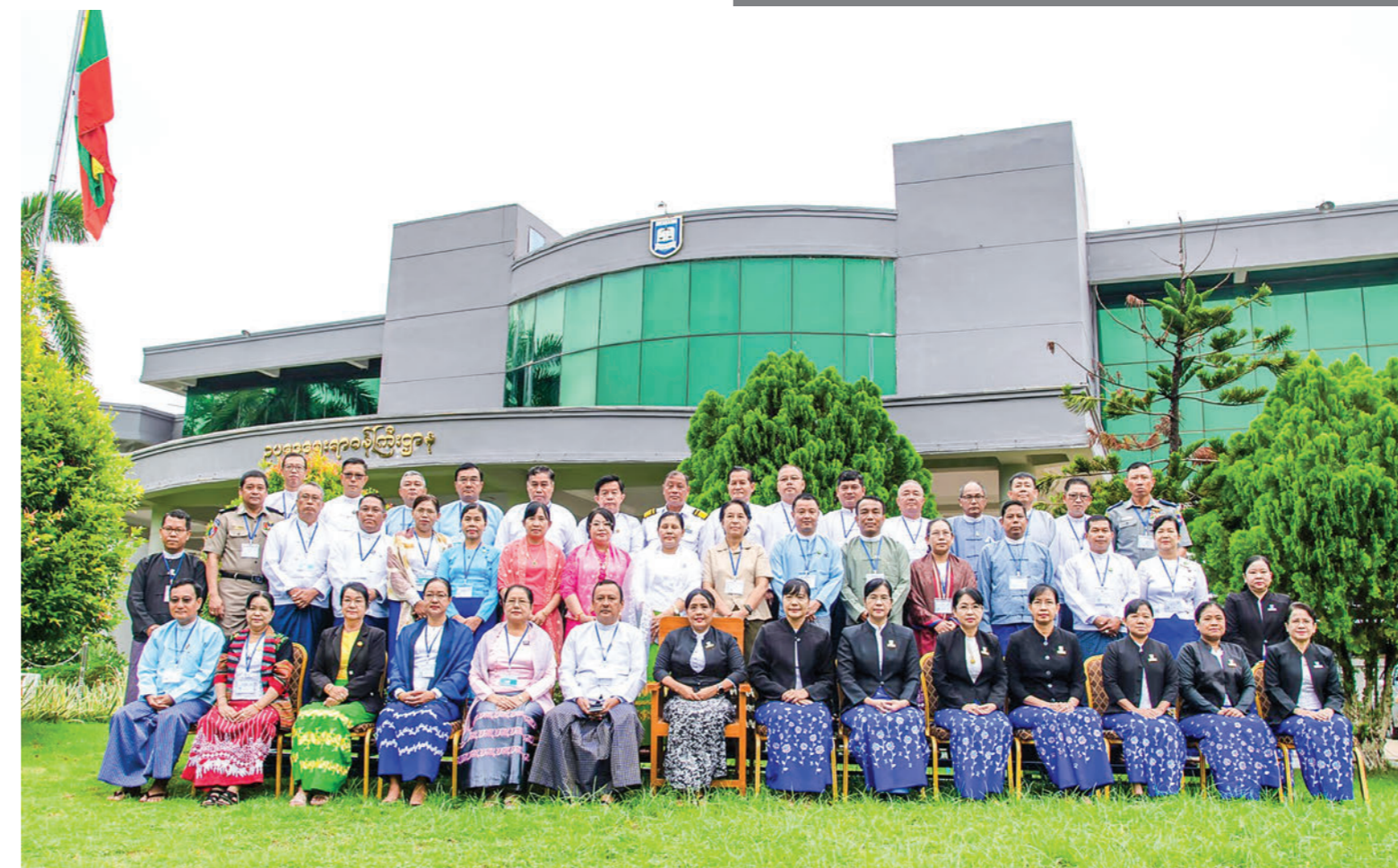
The trainers and trainees from Legal Advocacy Training No 3.

Organizations on Anti-Money Laundering and Combating the Financing of Terrorism, Notice, Writ of Habeas Corpus, Writ of Mandamus, Writ of Quo Warrant, Writ of Certiorari, Writ of Prohibition, Legal General and etc.