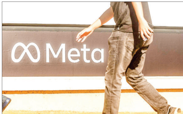
US tech heavyweight Meta formally requested a Norwegian court to postpone the implementation of a ban on behavioural marketing reliant on users’ personal data.

On 1 August, the social media giant said it would ask users in the European Union, Norway, Iceland, Liechtenstein and Switzerland to give their consent before allowing targeted advertising on its networks. — AFP