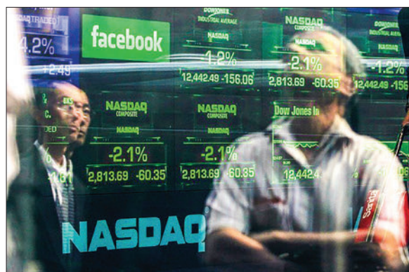
Arm will soon get its moment in the IPO spotlight.

That would be the largest listing on the tech-oriented Nasdaq since electric vehicle manufacturer Rivian went public in 2021 with a market value of $68 billion. — AFP