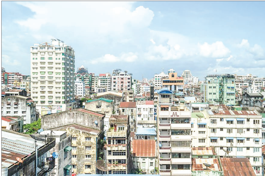
Capturing Yangon City's Urban Landscape: A glimpse of towering high-rise structures

"First, the opening price was K55 million. Then, the price jumped to 60 million. The owner of the apartment seems to de-