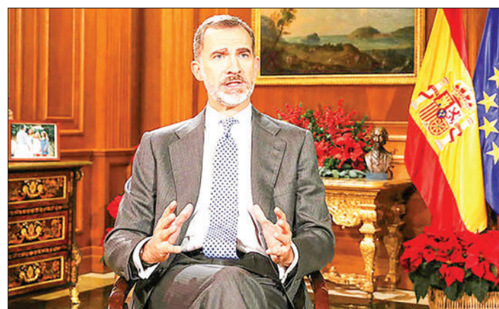
Seeking to resolve a political impasse, King Felipe VI received PP prime ministerial hopeful Alberto Nunez Feijoo at the Zarzuela Palace in Madrid.

SEEKING to break a political impasse, Spain's King Felipe VI on Tuesday called on Alberto Nunez Feijoo to seek to form a new government, despite his conservative Popular Party not having a majority.