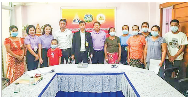
Families of Myanmar seamen are seen receiving compensation.

ACCORDING to the labour attache's office, compensation has been granted to four out of the seven families of Myanmar seamen affected by the oil tanker explosion during maintenance in a Mekong River tributary in Samut Sakhon Province, Thailand.