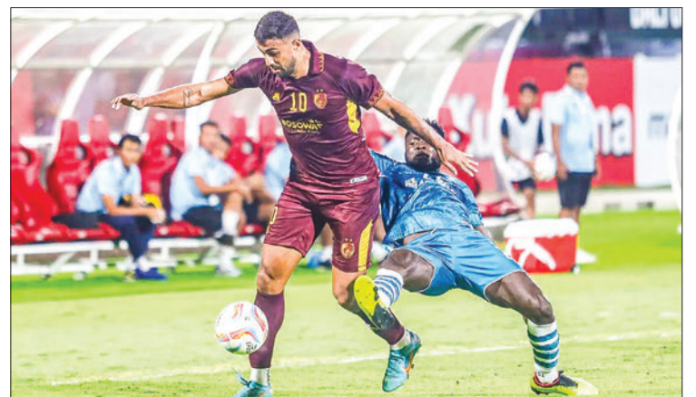
A PSM Makassar player (red) blocks Yangon United player during the AFC Cup ASEAN Zone Qualifier Play-off match played on 23 August 2023.

The Yangon team previously qualified for the play-off stage by defeating Brunei club DPMM at home by 2-1, but lost to the Makassar team and failed to advance to the final round of the tournament.