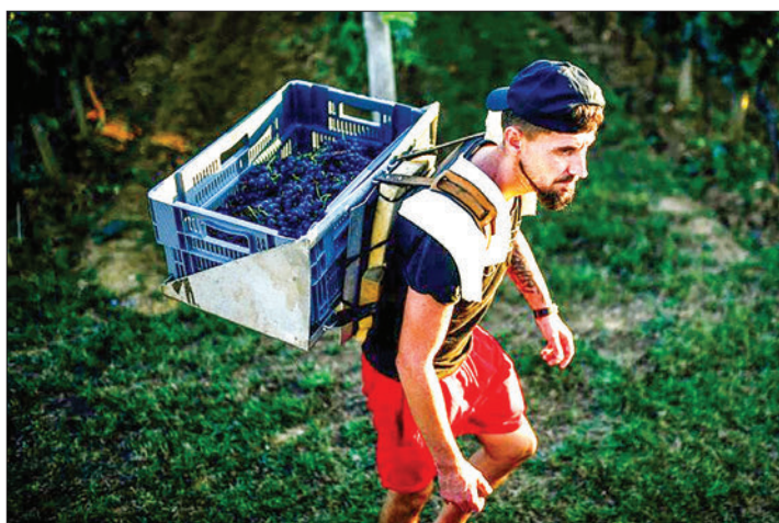
Some grape pickers have suffered health problems as a result of the heat.

GRAPE-PICKERS were out in French vineyards Tuesday bringing in this year's harvest in "torrid" conditions as temperatures shot past 40C in some areas of the country during a "heat