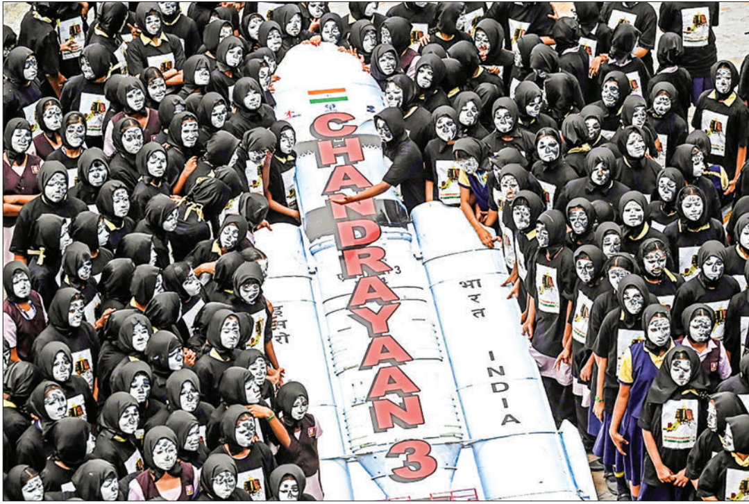
Students with painted faces surround a replica of the Chandrayaan-3 spacecraft in Chennai on 22 August 2023.