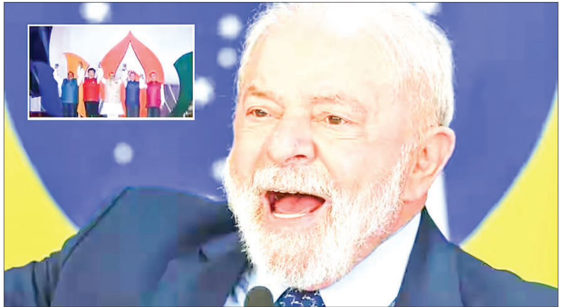
Brazilian President Luiz Inacio Lula da Silva has called for the creation of a shared trading currency among BRICS countries as a countermeasure to the dominance of the US dollar.

In April, he proposed possibly creating a common regional