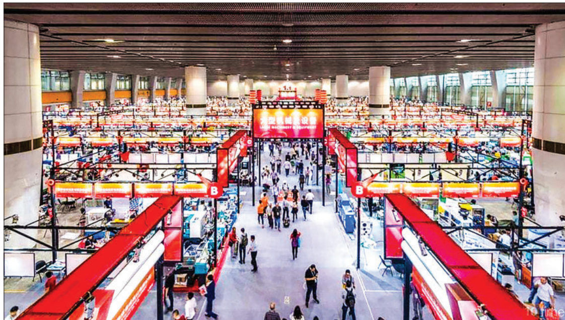
Canton Fair 2023 - The 133rd International Trade Fair in progress.