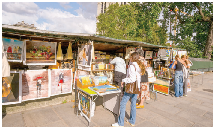
People look at books and posters as they walk past 'bouquinistes' stands selling antiquarian books and old posters near Notre Dame Cathedral on the left bank of the Seine River in Paris on 28 August 2023.

"There is a much simpler solution, which is to bring in bomb squads, seal the boxes and then reopen quickly afterwards," he said.