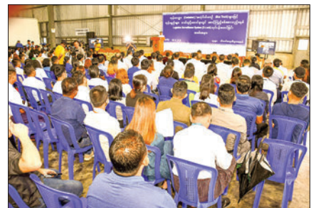
Thilawa SEZ introduces E-Lock system to enhance trade facilitation, counter illicit trade