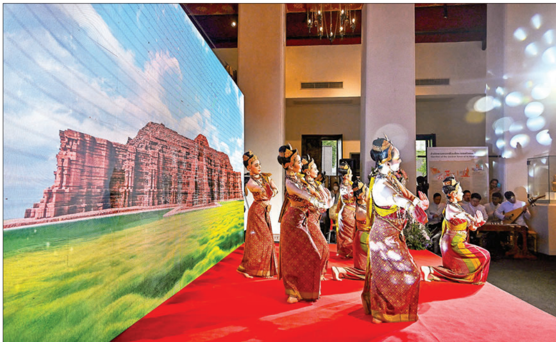
Classical Thai dancers perform during an event to celebrate Si Thep historical park's nomination in the UNESCO's cultural world heritage list, at the National Museum of Siam in Bangkok on 19 September 2023.