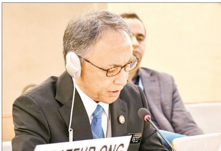
Okinawa Denny Tamaki delivers a speech at a UN Human Rights Council meeting in Geneva on 18 September 2023.

OKINAWA Gov Denny Tamaki sought international backing Monday for his opposition to a Japan-US plan to relocate a