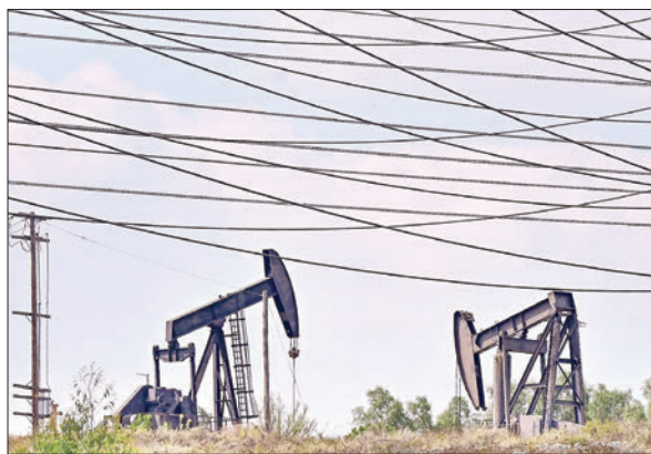
Working pumpjacks are seen at the Montebello Oil Field in Montebello, California, on 18 September 2023.

However, while more than a year of tightening is close to an end, there is a growing concern that rates will be held elevated around two-decade highs for longer than initially anticipated. — AFP