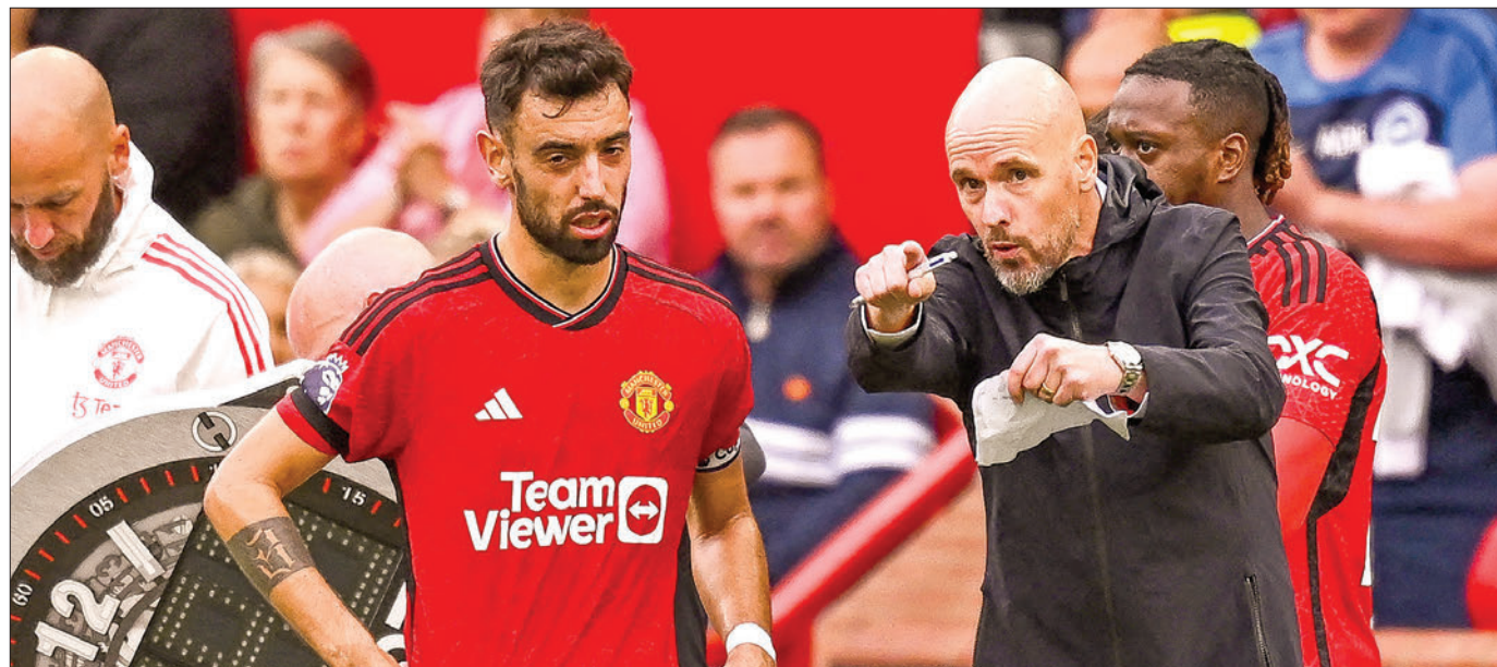
Manchester United's Dutch manager Erik ten Hag (R) gives instructions to Manchester United's Portuguese midfielder Bruno Fernandes (L) during the English Premier League football match between Manchester United and Brighton and Hove Albion at Old Trafford in Manchester, north west England, on 16 September 2023.