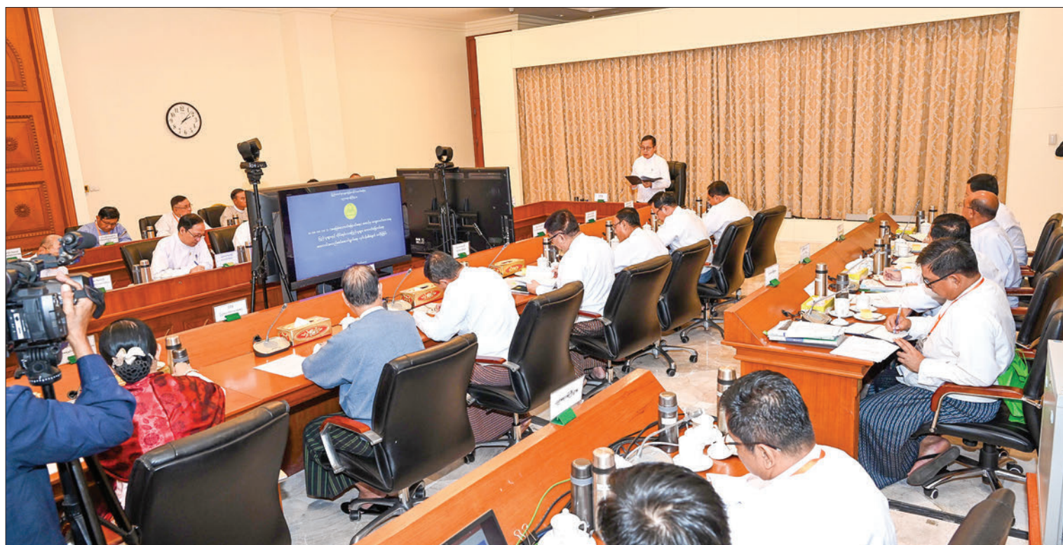
State Administration Council Vice-Chair Deputy Prime Minister Vice-Senior General Soe Win addresses the coordination meeting on the literacy campaign yesterday.

The Vice-Senior General underlined that only when the people are literate will they have adequate knowledge to analyze the persuasion of others. The literates will have a keenness to read literature. If so, they will have the knowledge to adjust all things for