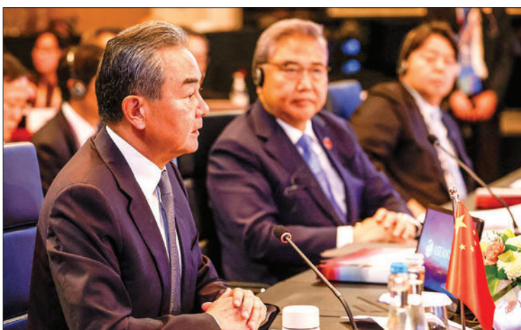
Director of the Office of the Foreign Affairs Commission of the Communist Party of China’s Central Committee Wang Yi (L) speaks as Japan’s Foreign Minister Yoshimasa Hayashi (R) and South Korea’s Foreign Minister Park Jin (C) look on during the Association of Southeast Asian Nations (ASEAN) Plus Three Foreign Ministers’ Meeting in Jakarta on 13 July 2023.

JAPAN, China and South Korea are set to hold a meeting of senior officials next week in Seoul, the Japanese and South Korean governments said Tuesday, in a move that could lead to a first trilateral summit between the nations in four years.