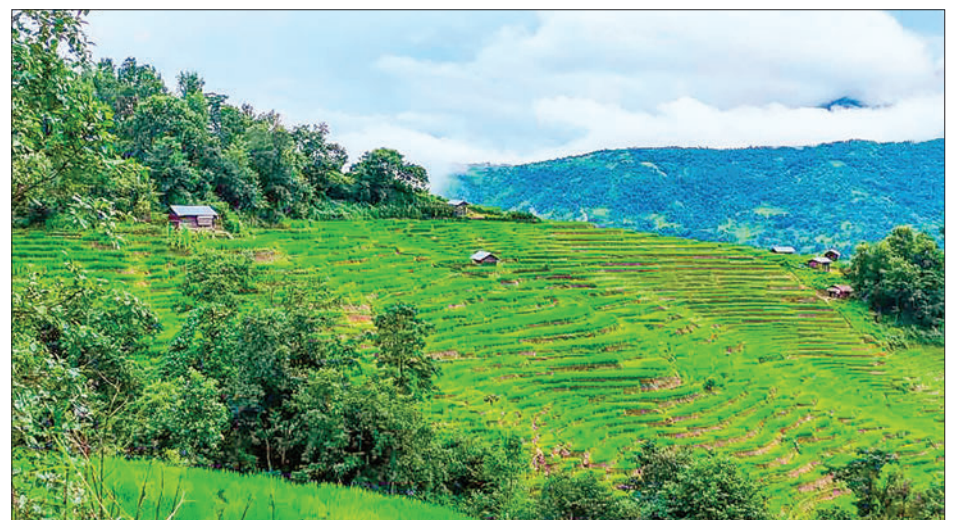
A panoramic view of thriving agricultural fields in the Naga Self-Administered Zone.