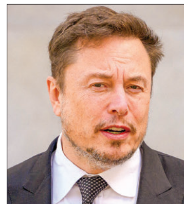
X (formerly Twitter) CEO Elon Musk leaves a US Senate bipartisan Artificial Intelligence (AI) Insight Forum at the US Capitol in Washington, DC, on 13 September 2023.

ELON Musk has sparked outrage among fans of his social media platform X by suggesting he might introduce a monthly fee for all users, in what would be the biggest shake-up since he took over the site then known as Twitter last October.