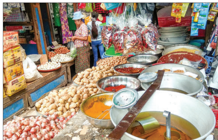
Consumers shop kitchen groceries at the retail outlet.

Green gram stays between K3,080-3,580 per viss, and gram (chickpea) is priced at K5,850-K6,100. — TWA/KZW