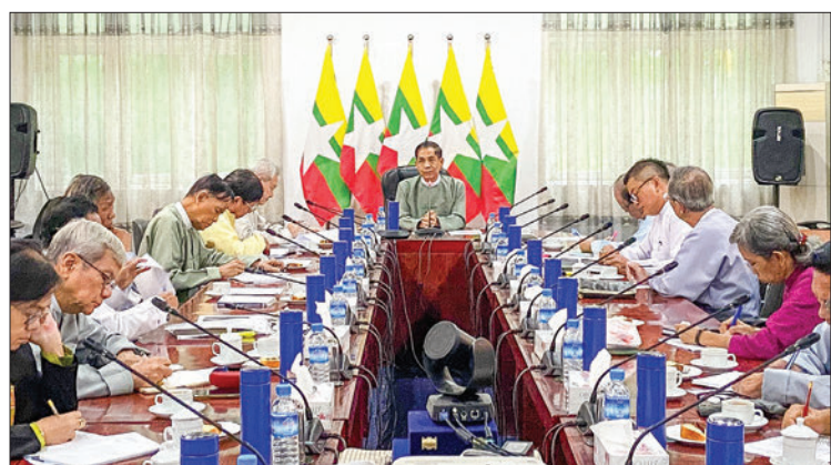
Union Minister U Ko Ko Hlaing meets the MISIS officials in Yangon yesterday.

Moreover, as Sayagyi U Thaug Tun submitted the Burmese Way to Literacy at the literacy conference held in West Berlin, Germany in 1984 and disseminated the information on the mass movement of Myanmar's literacy campaign without budget to the world, elders' text for international literacy campaign and publications, the UNESCO awarded Noma literacy prize to Myanmar as a wonderful victory of Myanmar. — MNA/TTA