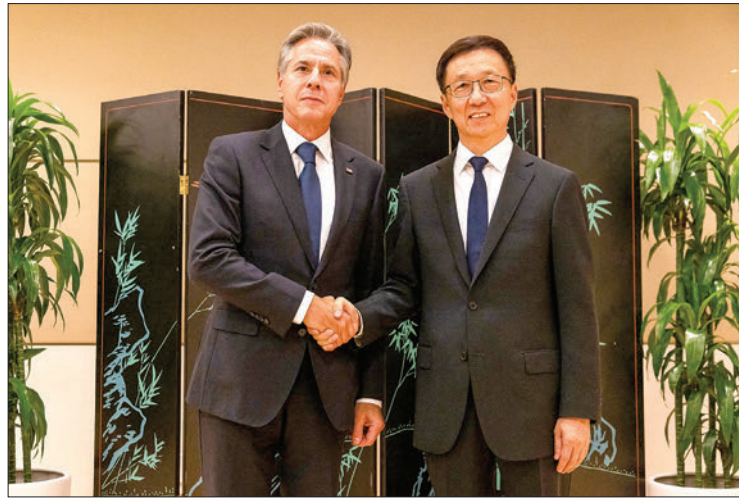
US Secretary of State Antony Blinken and Chinese Vice-President Han Zheng shake hands while meeting in New York City on 18 September 2023 ahead of the 78 th United Nations General Assembly.

For his part, Guterres thanked China for its firm support for the UN cause, and spoke highly of the important initiatives proposed by the Chinese