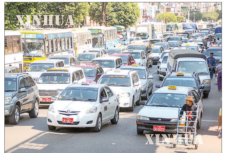
City taxis are seen operating on the road in Yangon.

For the registration of taxi vehicles, fees include K1,200 for the side sticker number, K3,000 for the registration fee, K600 for the driver's license fee, and K3,500 for the driver's license card system. — TWA/CT