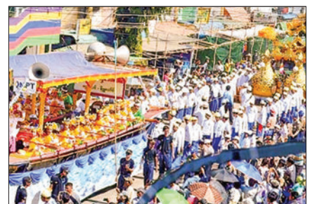
Pyay Shwesandaw to hold Buddha Pujaniya Festival, Tour of Sacred Tooth Relic of Buddha