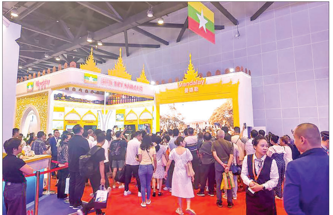
Myanmar's booths are seen being packed with visitors at the 20 th China-ASEAN Expo in Nanning, China, yesterday.

Chinese entrepreneurs interested in doing business with Myanmar visit the Business Matching Area at the Myanmar Commodity Gallery, where the Myanmar Trade Promotion Organization holds business meetings to discuss opportunities for Myanmar-China trade and investment cooperation. Officials from the Myanmar Trade Promotion Organization provide explanations and answer their