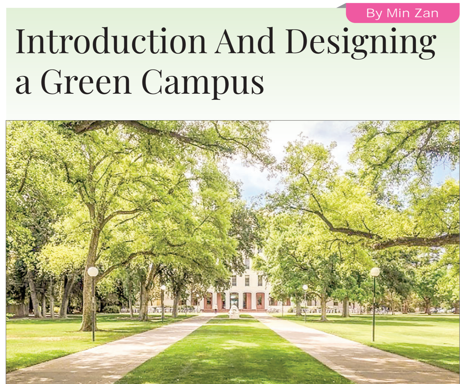
Community engagement: A green campus can serve as a hub for sustainability activities within the local community. By hosting workshops, events, and outreach programmes, the campus can inspire and educate the surrounding community about sustainable practices.

Cost savings: Sustainable practices such as energy conservation, waste reduction, and water efficiency can lead to cost savings for the institution. Investing in energy-efficient technologies and renewable energy sources can lower utility bills over time,