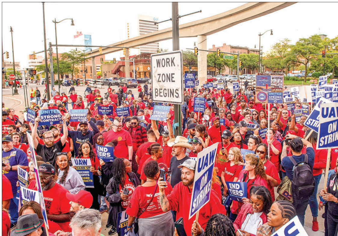
(FILES) Members of the United Auto Workers (UAW) union march through the streets of downtown Detroit following a rally on the first day of the UAW strike in Detroit, Michigan, on 15 September 2023.

Fain had told MSNBC Monday morning that the two sides remained "far apart."