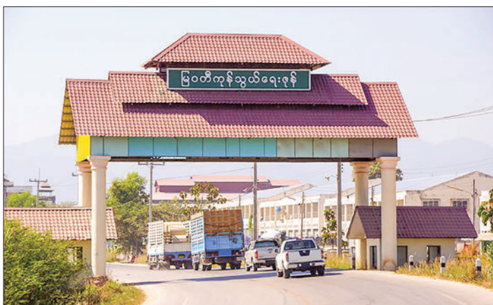
The entrance of the Myawady Trade Zone.

perishable goods such as fisheries products and green commodities (onions and chilli pepper) in issuing a licence and screening the goods at the Muse border.