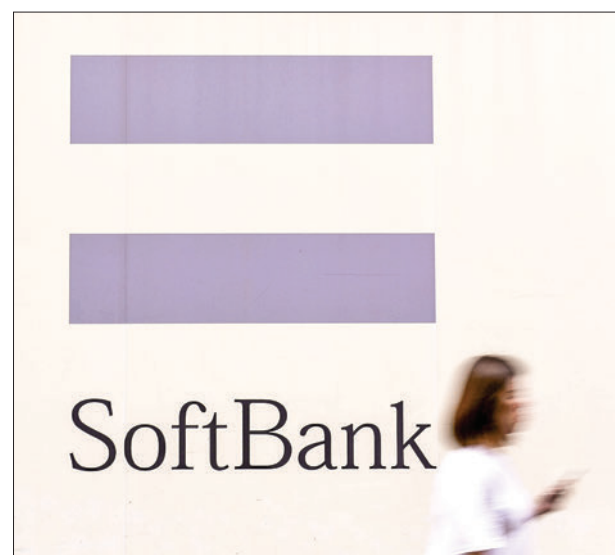
File photo taken in Tokyo on 30 May 2019 shows the logo of Japanese telecom giant SoftBank.

Analysts said the share sale, together with the recent market recovery, could accelerate SoftBank's investment in AI-related venture firms as it has become easier for the Japanese company to raise funds using Arms shares as collateral. — Kyodo