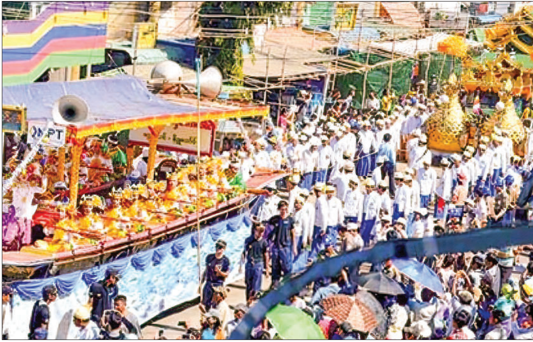
The Buddha Pujaniya Festival and the Tour of the Sacred Tooth Relic of Buddha of the Pyay Shwesandaw Pagoda was held in 2018.