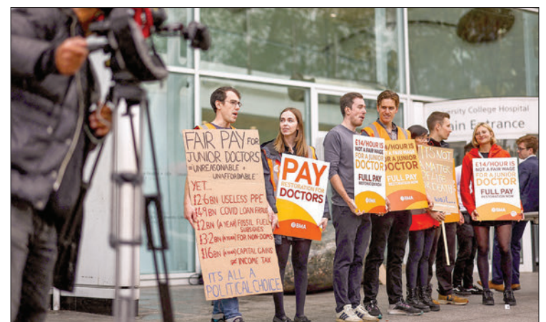
People hold placards calling for better pay for junior doctors on a picket line outside University College Hospital in central London on 14 August 2023 during a strike by junior doctors — physicians who are not senior specialists but who may still years of experience.

At the start of the year when UK inflation was about 10 per cent, the Conservative party leader pledged to halve the rate by the end of 2023.