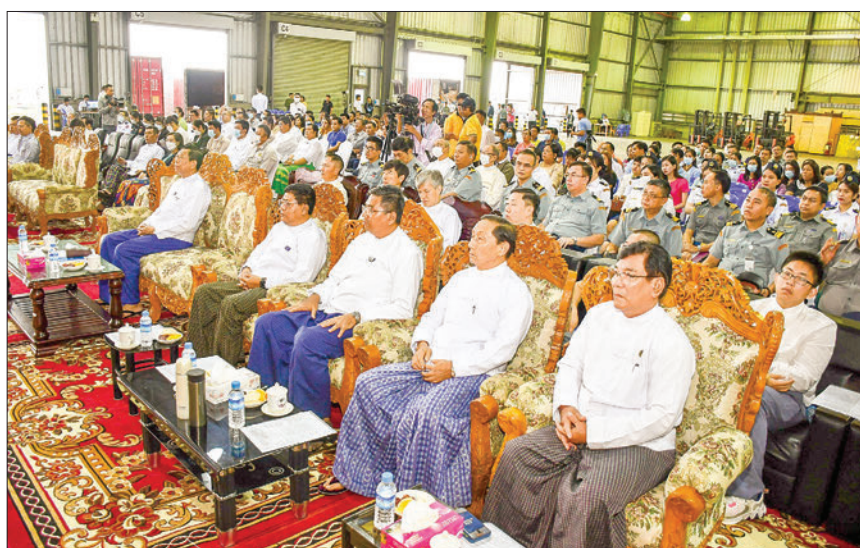
The launch of the logistics surveillance system (E-Lock) in progress at the Thilawa Special Economic Zone in Yangon Region yesterday.

system to facilitate the movement of goods across ASEAN borders.