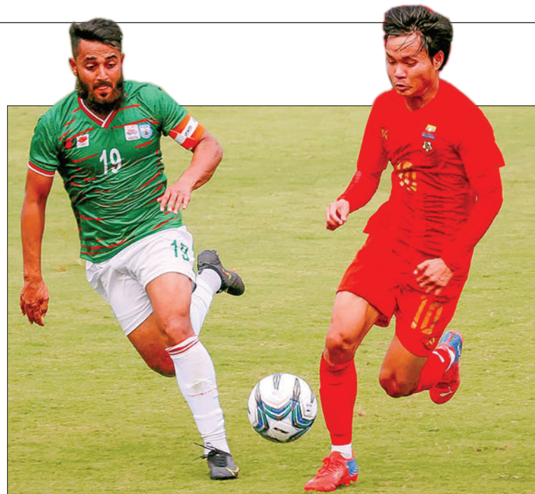
A Myanmar player (red) tries to pressure the Bangladesh player during opener of the Asian Games in Hangzhou, China on 19 September 2023. PHOTO: MFF

Myanmar will play second group match against China on 21 September. — Ko Nyi Lay/KZL