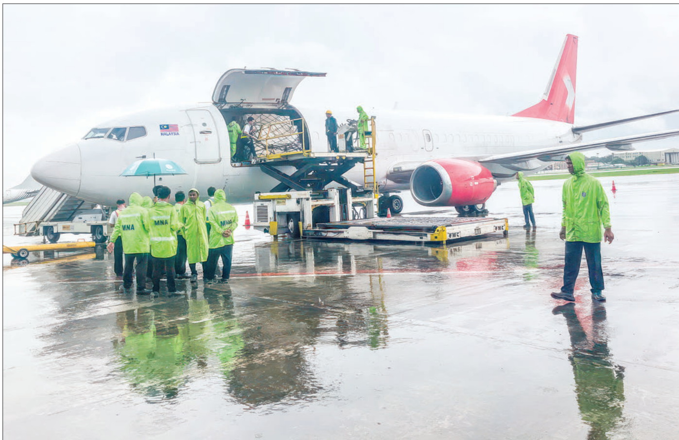
MNA's Boeing 737-400 cargo aircraft loading goods for transport to Thailand at Yangon International Airport yesterday.

State-owned Myanmar National Airlines (MNA) currently operating passenger flights debuts its cargo flight from Yangon to Thailand.