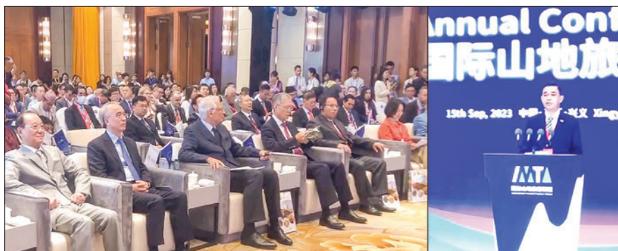
The 2023 International Conference on Mountain Tourism and Outdoor Sports in progress, in China spoken on the occasion by Deputy Minister U Phyo Zaw Soe.

Although Myanmar is mainly engaged in culture-based tourism, nature-based tourism activities can also be implemented. As China is one of Myanmar's main tourist markets, we are working to make it easy for Chinese tourists to visit Myanmar. Visas on arrival for Chinese tourists have been granted since 30 August 2023,