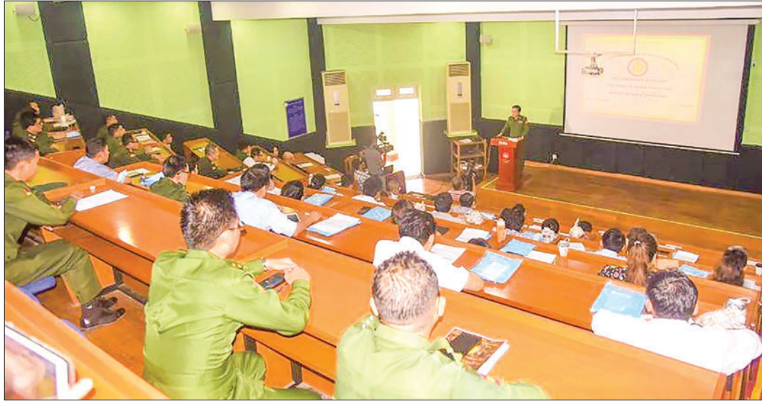
The workshop on flap surgery in combat medical care in progress yesterday in Yangon.

A pre-conference workshop on flap surgery in combat medical care before the 30 th Myanmar Tatmadaw Medical Conference took place at the Defence Services Medical Academy in Mingaladon Township of Yangon yesterday, with attendance of more than 150 medical experts, physicians, professors and postgraduate students.