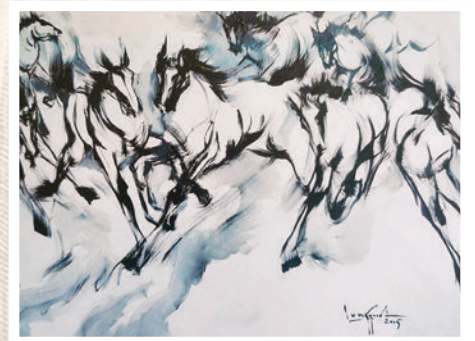
Some of the Sayagyi’s artworks.