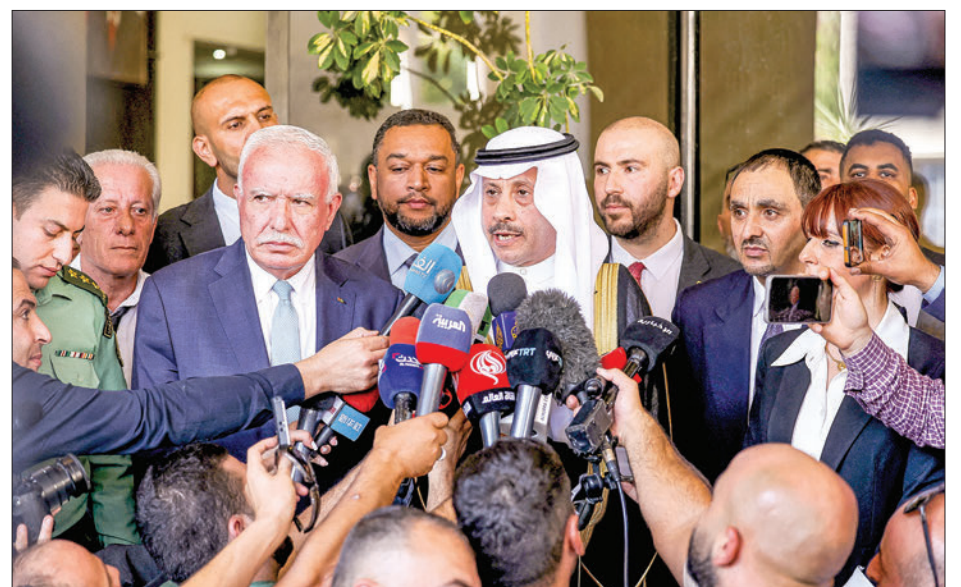
Nayef bin Bandar al-Sudairi (C), Saudi Arabia's Ambassador to Palestine, speaks to journalists while accompanied by Palestinian Foreign Minister Riyad al-Maliki (C-L) at the Palestinian foreign ministry headquarters in Ramallah in the occupied West Bank on 26 September 2023.

The talks include security guarantees for Saudi Arabia and assistance with a civilian nuclear programme, according to officials familiar with the negotiations who spoke to AFP on condition of anonymity. — AFP