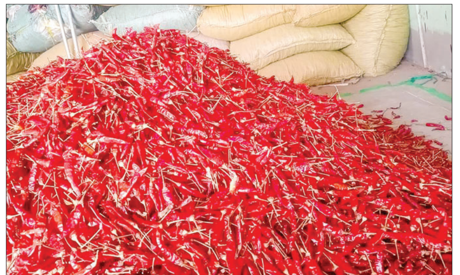
The photograph depicts a shipment of chilli pepper bags arriving at a warehouse.

Although the chilli pepper hit a record high at the end of 2022, the prices in late 2023 are expected to stay lower than those recorded in the corresponding period last year. — TWA/KK