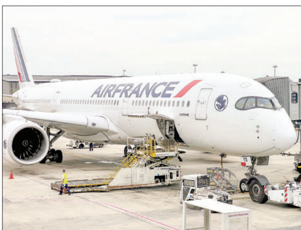
An Air France Boeing 777 plane is seen at gate in Paris Charles de Gaulle international airport (CDG) on 17 September 2023

The statement said the order was “an evolutionary order, providing