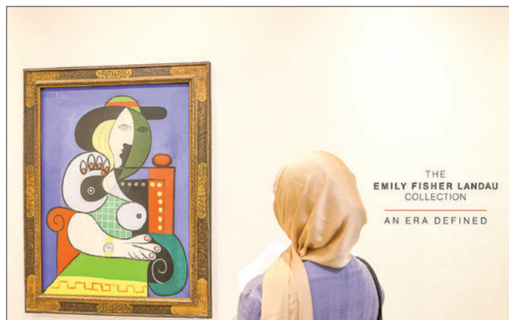
A visitor looks at Pablo Picasso’s painting ‘Femme à la montre’ displayed for viewing at Sotheby’s Dubai on 25 September 2023.