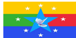
The flag design of the Union Peace and Unity Party