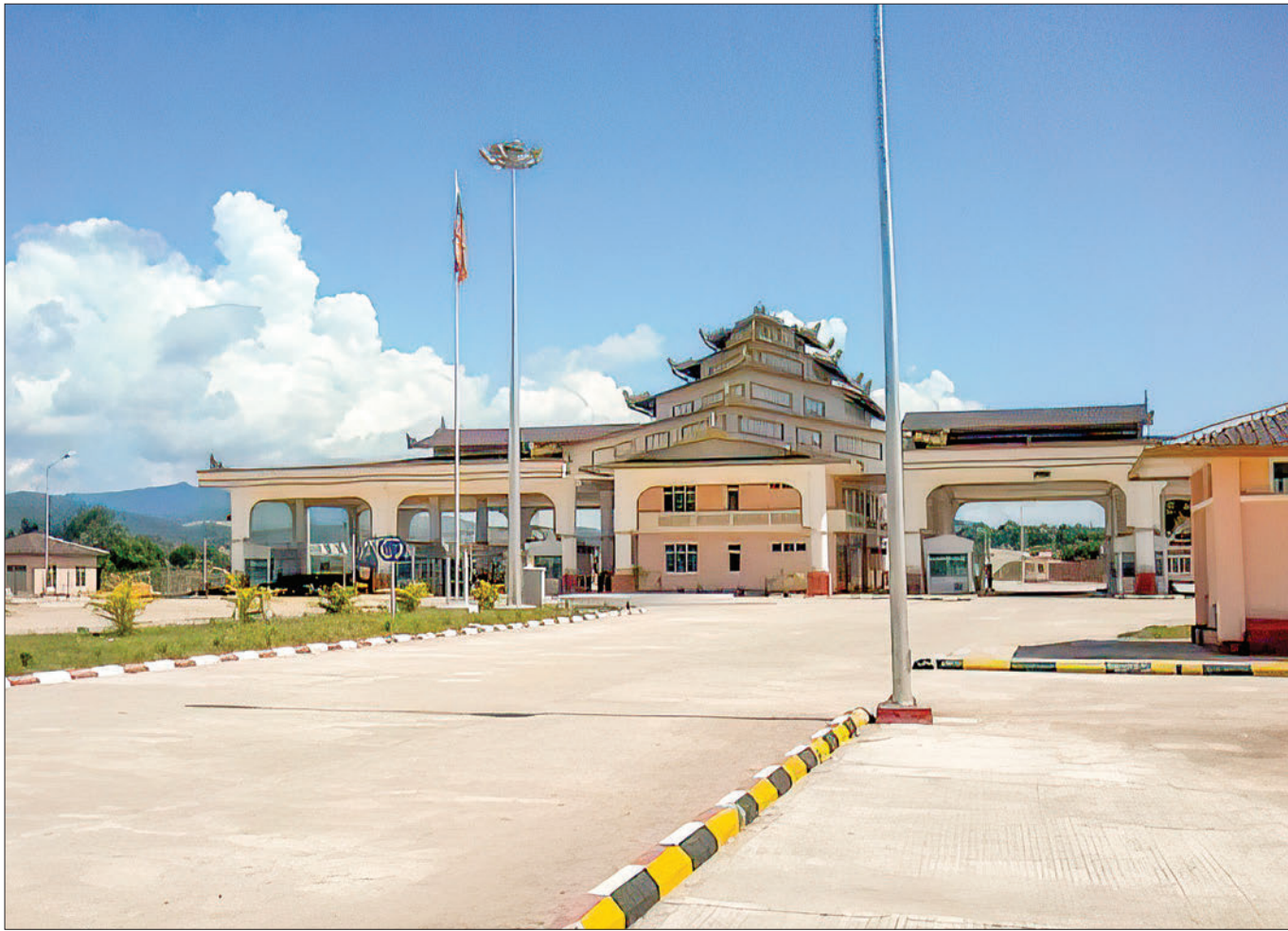
A panoramic view of the Kenglat checkpoint along the Myanmar-Laos border.