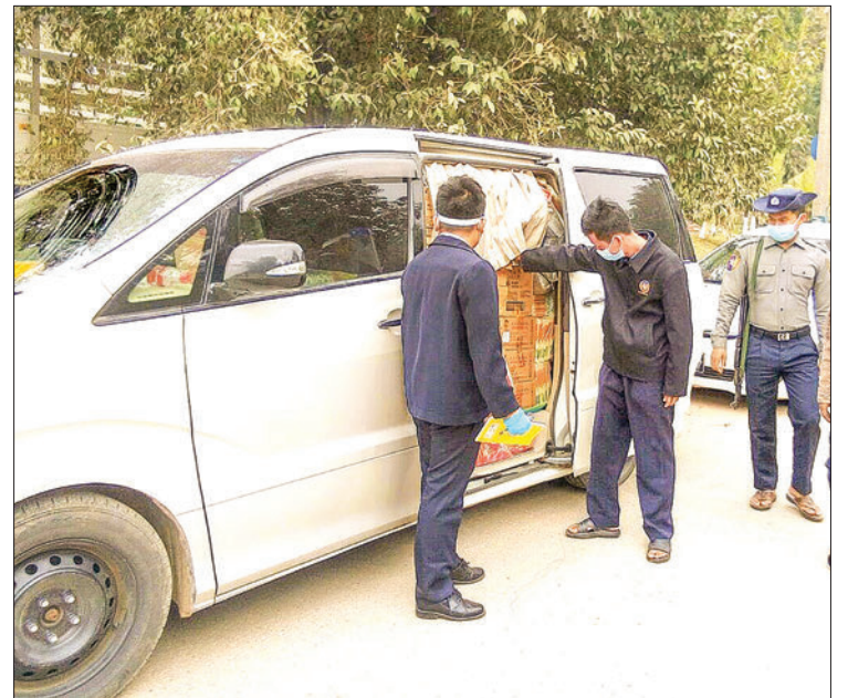
A vehicle laden with smuggled commodities was seized at the Chinshwehaw trade post in 2022.

The Customs Department seized smuggled goods with an estimated value of K10.589 billion from 333 cases in August, goods worth over K9 billion in July, goods worth nearly K6 billion in June, goods worth over K9 billion in May, goods worth over K4 billion in April, goods worth over K11 billion each in March and February and goods worth K6.221 billion in January respectively. — NN/EM