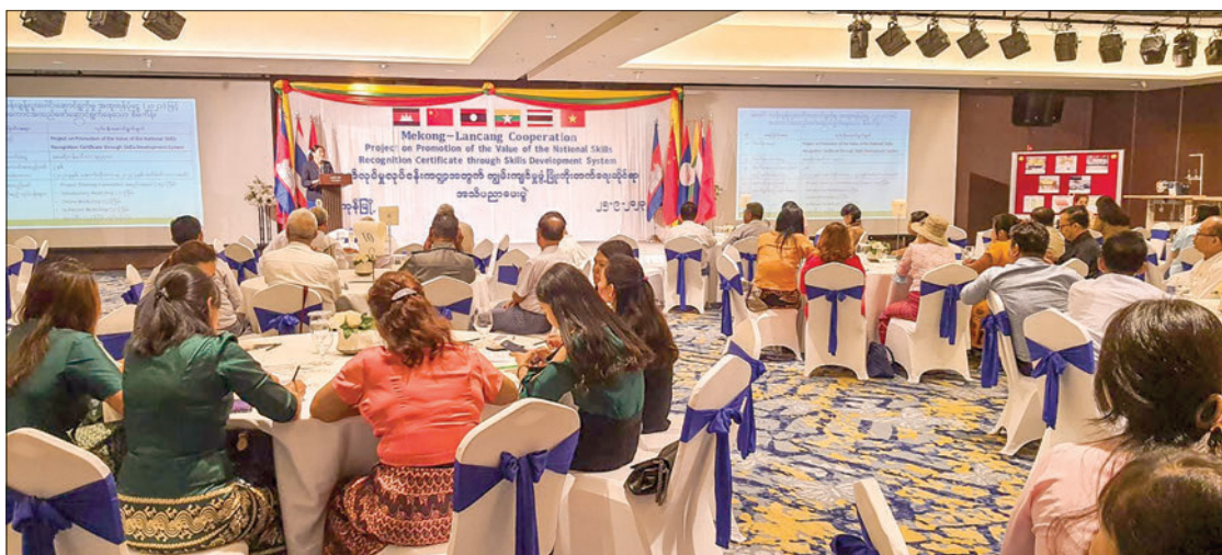
An awareness event for promoting skills development in progress on 25 September in Yangon.