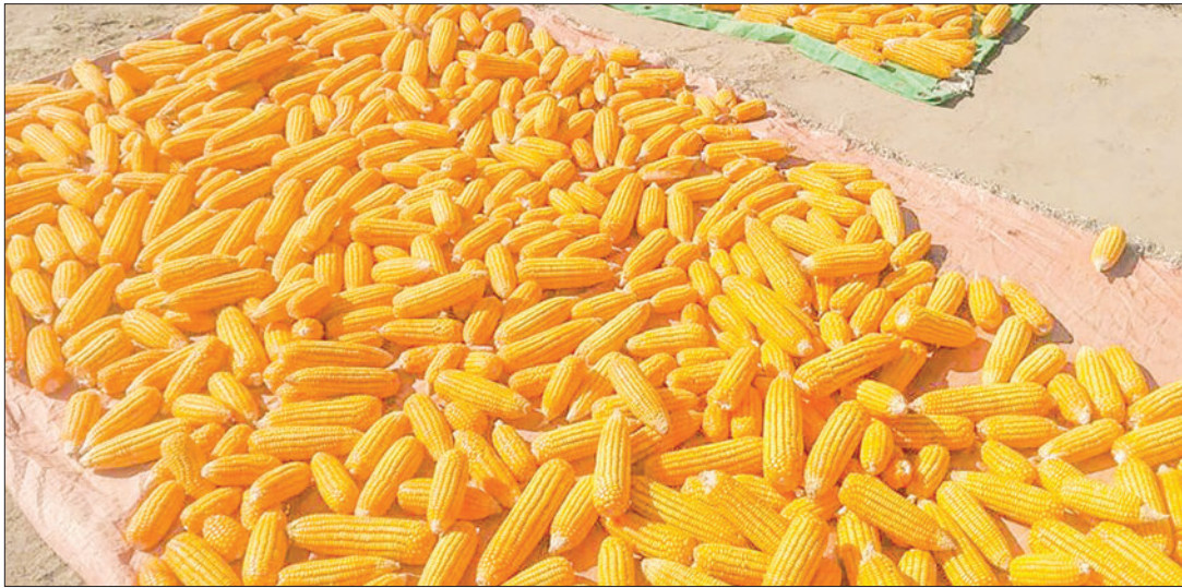
The corn is cultivated in Shan, Kachin, Kayah and Kayin states and Mandalay, Sagaing and Magway regions. The picture shows the harvested corn.