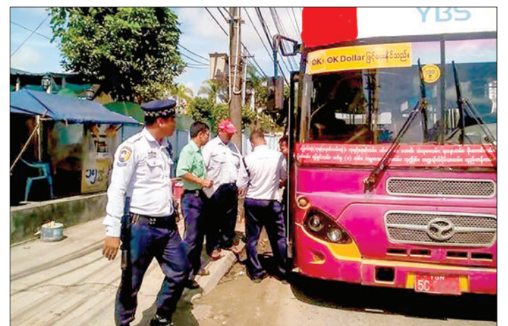
A YBS vehicle is seen being inspected by traffic police.

sized that running red lights is the most serious traffic offence, and YBS companies have been instructed to dismiss drivers who commit this offence three times. The objective is not merely to impose fines but to ensure the safety of passengers. — TWA/CT