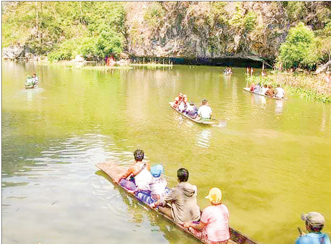
Some home-grown tourists are seen visiting the ancient historical Maha Sadan Cave near Kotwarsuu Village in Hpa-an, Kayin State.

THE Kayin State Chief Minister stated during the September 2023 meeting of the Kayin State Regional Tourism Committee that Kayin State, boasting nu-