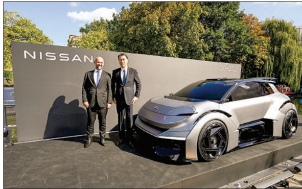
Makoto Uchida (R), CEO of Nissan Motor Co, is pictured with a new Nissan concept car in London on 25 September 2023.

NISSAN Motor Co said Monday it will make all of its new models sold in Europe fully electric by 2030 as part of efforts to accelerate a shift away from gasoline-run vehicles and adhere to strict environmental regulations in the region.