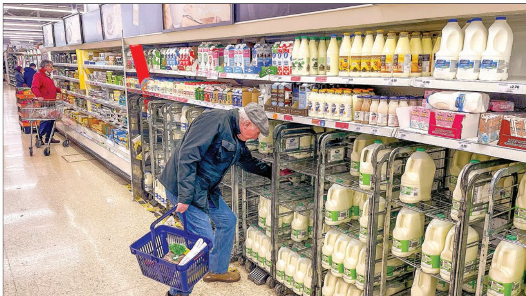
A customer shops for milk inside a Sainsbury’s supermarket in east London on 20 February 2023. PHOTO: AFP

The collected data was then used to model various potential future outcomes on life expectancy and inequalities for the UK as a whole if different mitigating policies were implemented. — AFP