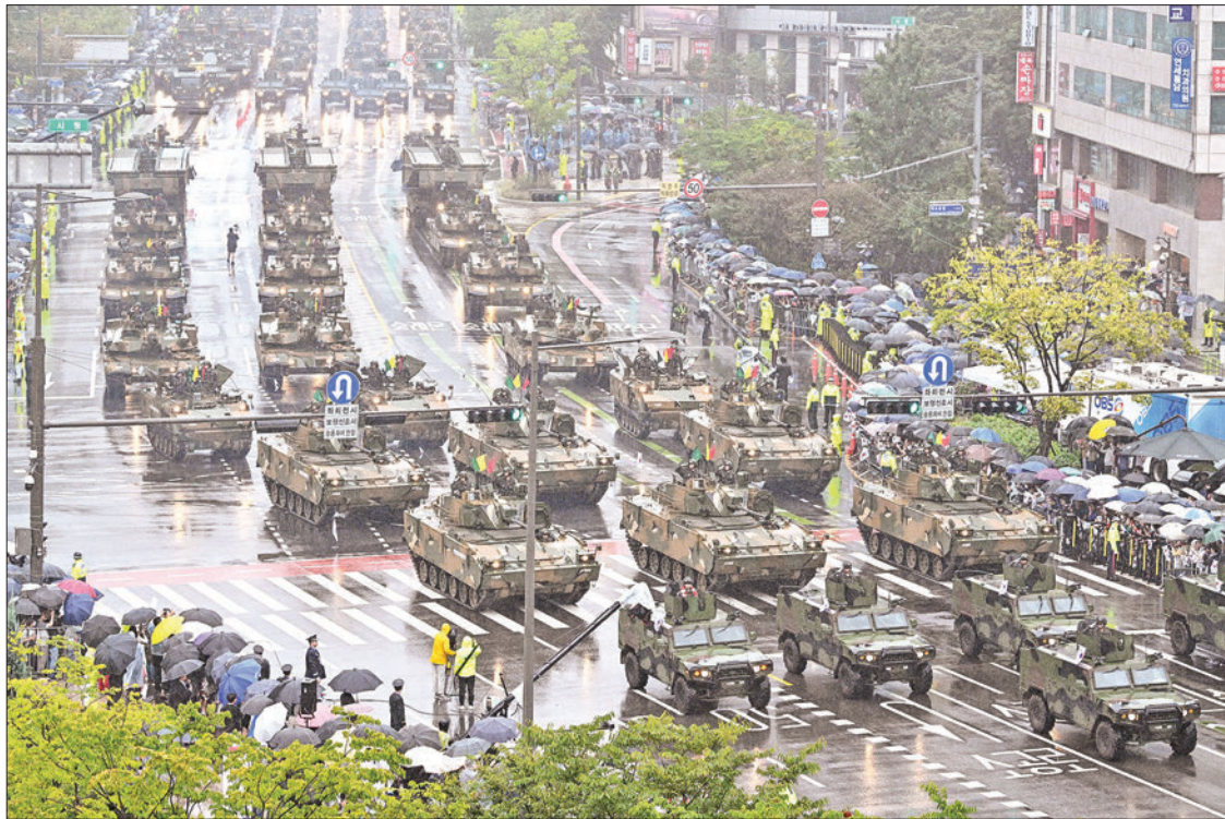
Military vehicles take part in a military parade to celebrate South Korea's 75 th Armed Forces Day in Seoul on 26 September 2023.

They were accompanied by 340 pieces of military equipment, including air and sea