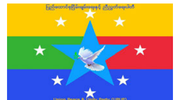
The emblem of the Union Peace and Unity Party