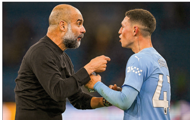
Manchester City's Spanish manager Pep Guardiola speaks with Manchester City's English midfielder (47) Phil Foden at the end of the English Premier League football match between Manchester City and Newcastle United at the Etihad Stadium in Manchester, north west England, on 19 August 2023.

"But if he believes that, I will not be the guy to let him think the opposite." — AFP