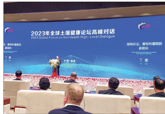
The 2023 Global Forum on Soil Health in progress on 19-20 September in China.

The deputy minister and party visited the soil development galleries and modern agricultural industries and the trade fair held by Shanghai Cooperation Organization member countries in Yangling on 21 September and returned to Yangon on 23 September. — MNA/KZL