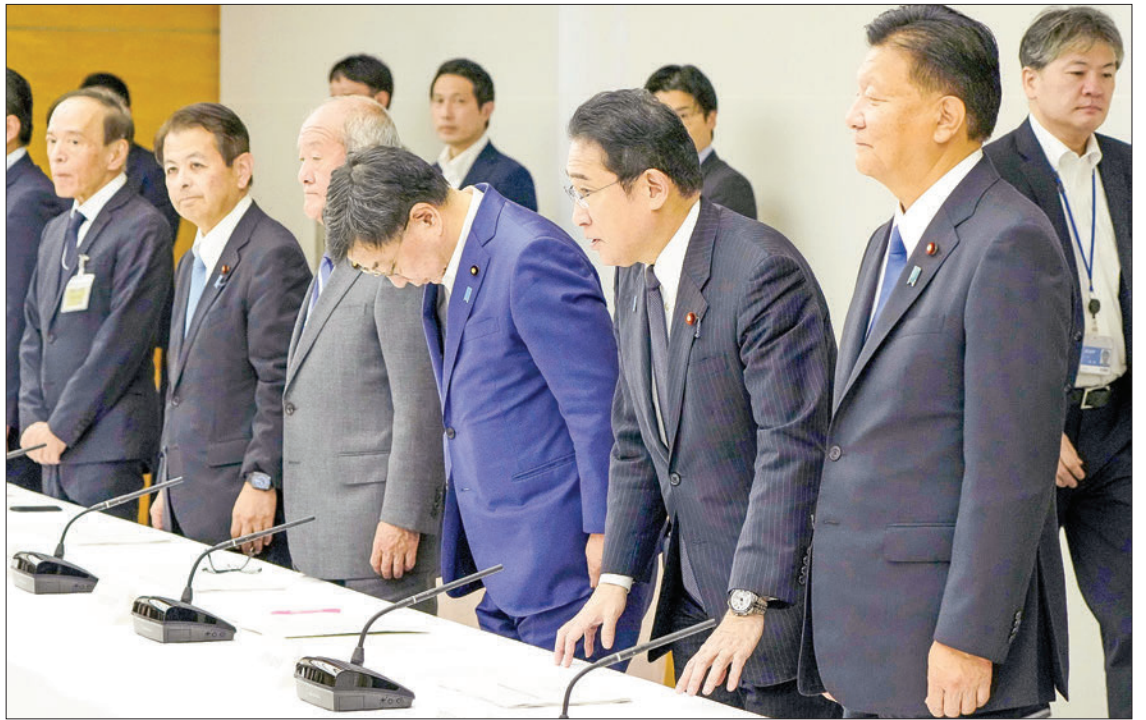
Japanese Prime Minister Fumio Kishida (2 nd from R, front row) prepares for a meeting on the government’s monthly economic report in Tokyo on 26 September 2023.

The report retained assessments on other key components of the economy. Private consumption and capital investment are both “picking up”. Exports, which have aided the recent economic recovery, show “movements of picking up”. China’s slower-than-expected economic recovery since the end of its “zero-COVID” policy and troubles in the real estate sector have raised concerns about growth prospects for the global economy. — Kyodo