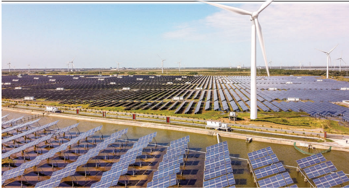
Solar panels and wind turbines work in an integrated power station in Yancheng city, in Jiangsu province, on 14 October 2020, during a media tour organized by the local government.