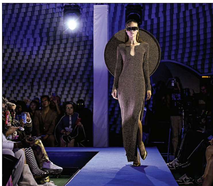
A model walks the runway of the Pierre Cardin show during the Paris Fashion Week Womenswear Spring/Summer 2024 in Paris on 25 September 2023.

Armed robbers seized the clothes on their way from Charles de Gaulle Airport to Balmain’s Paris headquarters, leaving creative director Olivier Rousteing racing to pull together a replacement collection.