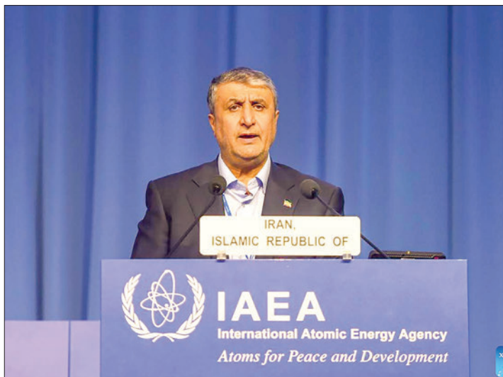
President of the Atomic Energy Organization of Iran (AEOI) Mohammad Eslami delivers a speech at the 67 th General Conference of the International Atomic Energy Agency (IAEA) in Vienna, Austria, on 25 September 2023.

IRAN'S atomic chief said on Monday that despite the unilateral cruel sanctions, the country will continue "peaceful" activities in the field of nuclear science and technology to promote the well-being of the Iranian people.