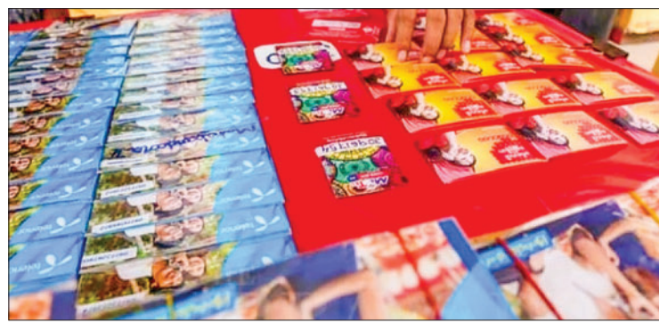
SIM cards available for purchase at a vendor shop in Yangon.

New SIM cards registered for more than two cards using citizenship scrutiny cards or Passports issued by applicable law and SIM cards not registered with correct information are being closed.