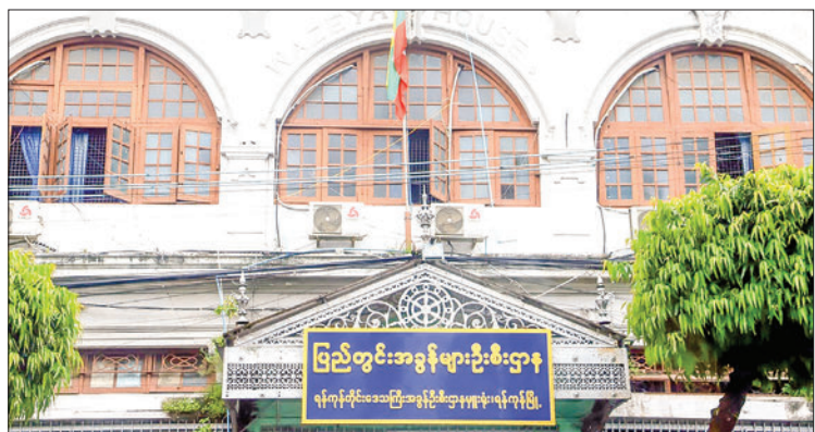
The general view of the IRD Office.

THE Internal Revenue Department of the Ministry of Planning and Finance released a statement not to collect two per cent of income tax from the healthcare receivers.