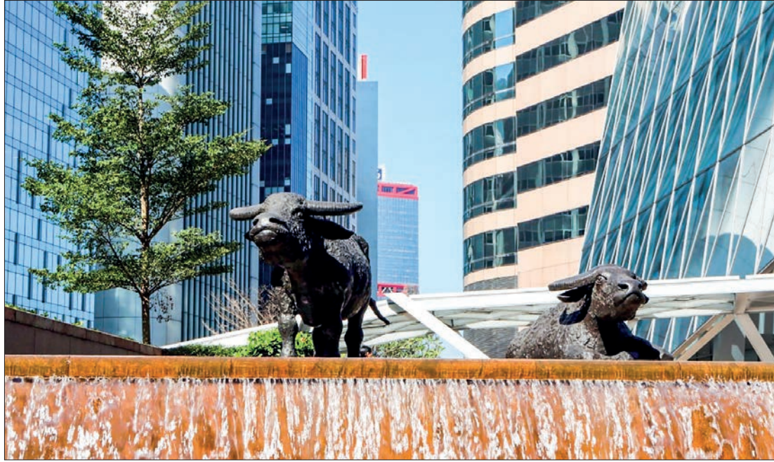
The ox statues at the Exchange Square in Central, Hong Kong.

Among them are the lowering of down payments for some mortgages and the introduction of tax incentives for people to