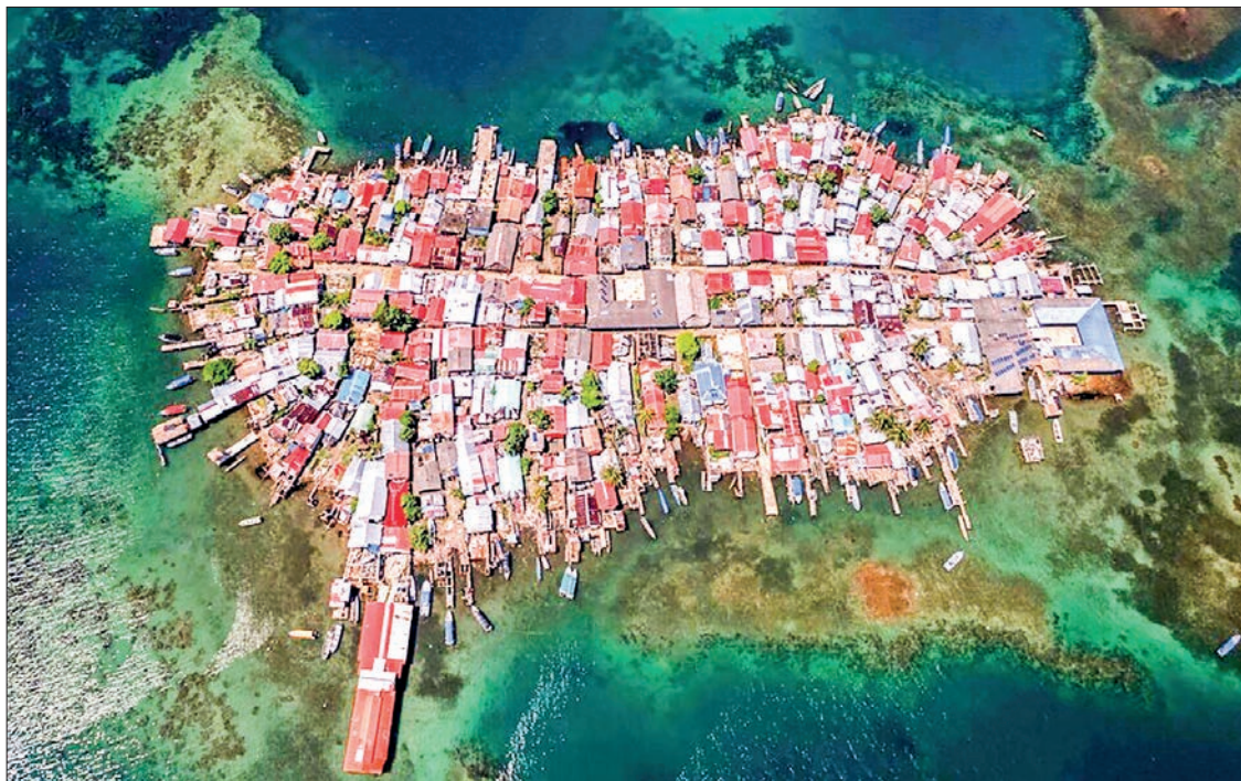
On a tiny island in the Caribbean, hundreds of people are preparing to pack up and move to escape the rising waters that threaten to engulf their homes in coming decades.

It is not an easy life, with intense heat and a lack of public services adding to the discomfort of overcrowded conditions on