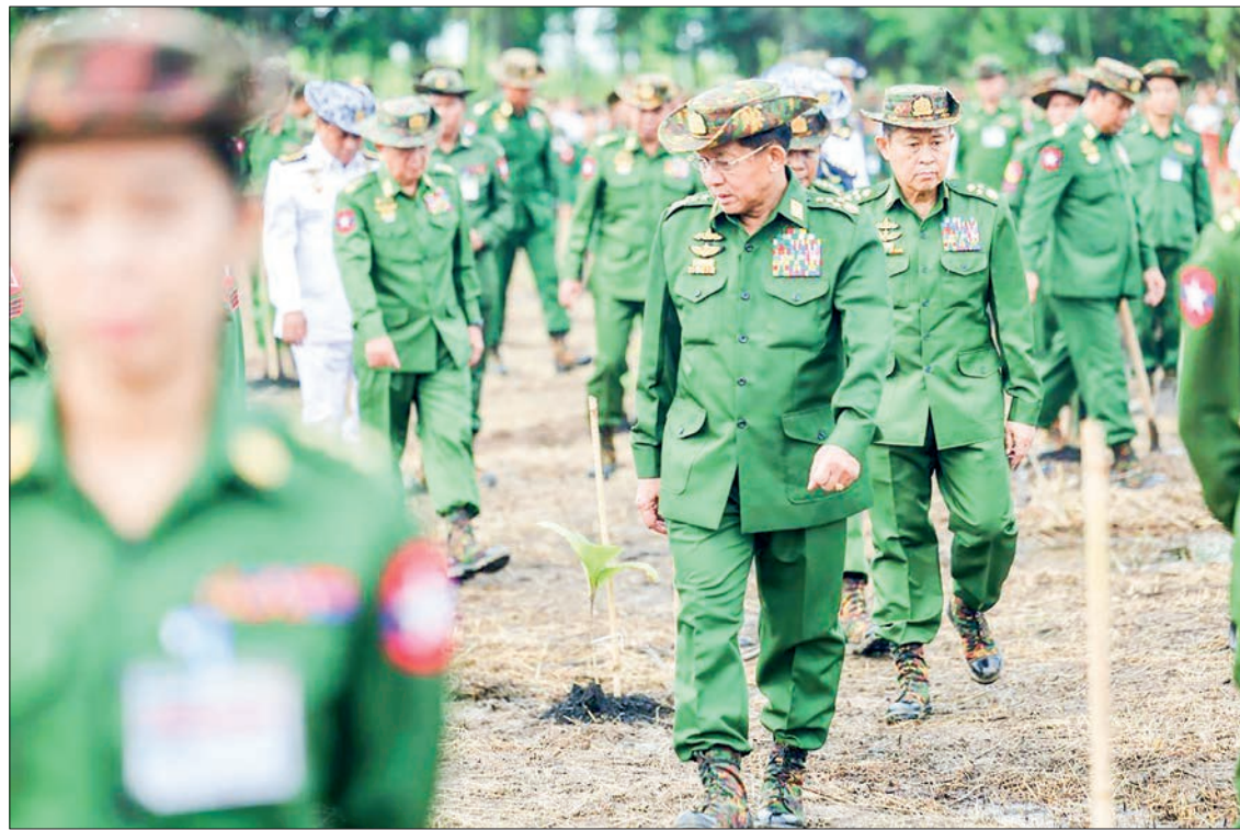
The Senior General views the monsoon tree-growing ceremony yesterday.

The Senior General and his wife grew a teak tree and then