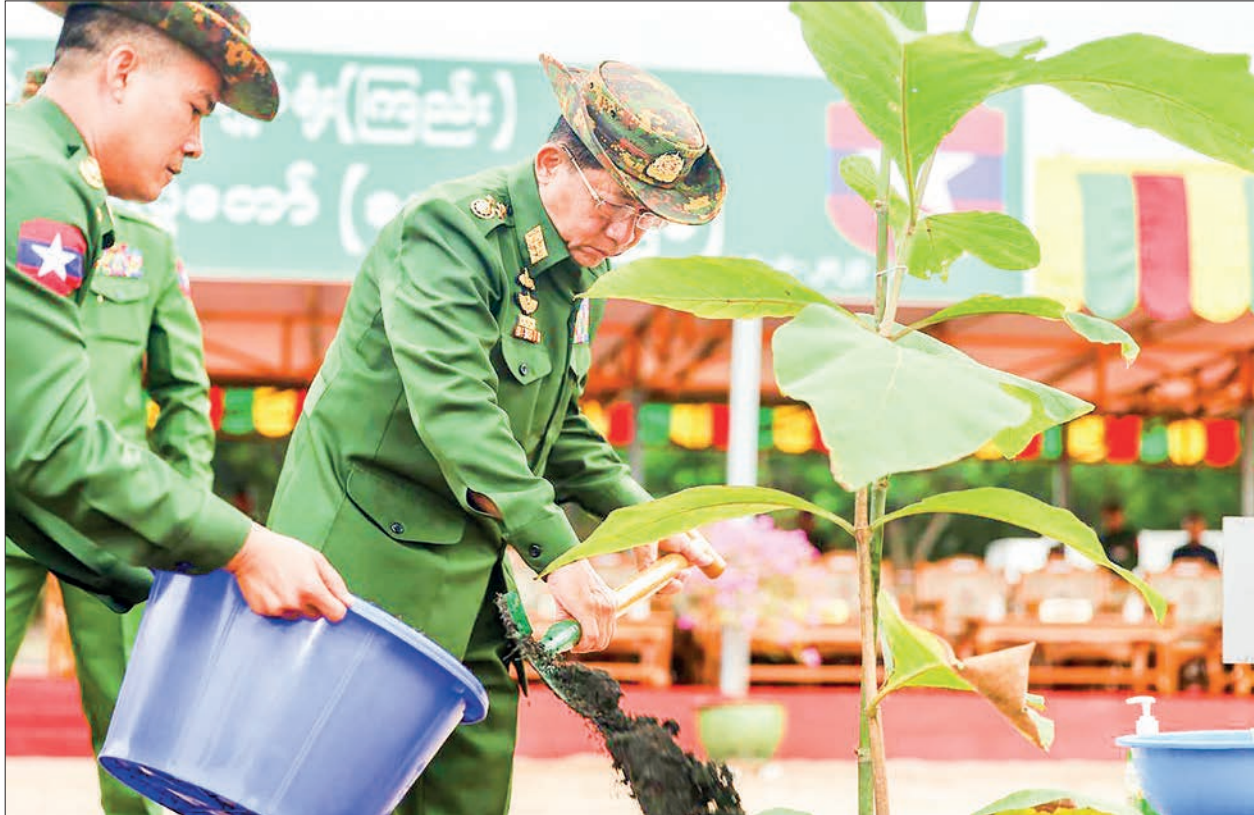
State Administration Council Chairman Commander-in-Chief of Defence Services Senior General Min Aung Hlaing is pictured growing the teak tree yesterday.