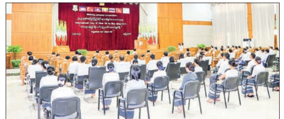
International Day of Clean Air for Blue Skies marked in Nay Pyi Taw