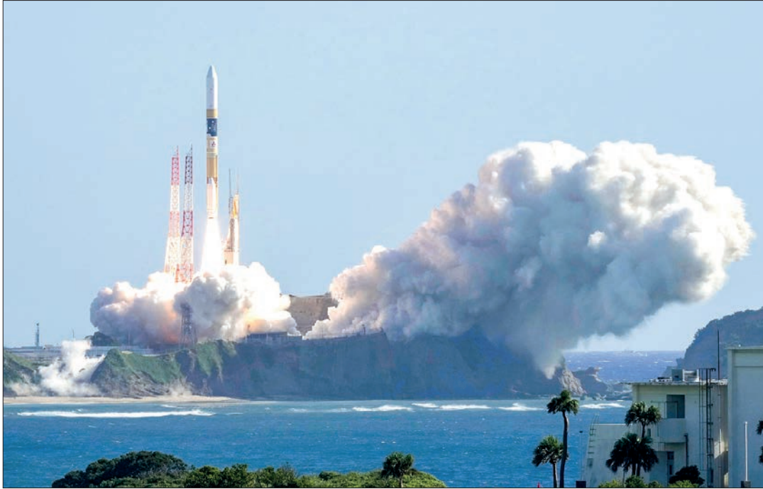
An H2A rocket carrying the Japanese space agency's lunar lander lifts off from Tanegashima Space Centre in Kagoshima Prefecture on 7 September 2023.

Japan launched its lunar lander aboard an H2A rocket, marking its first major domestic rocket liftoff since March amid the global space race.