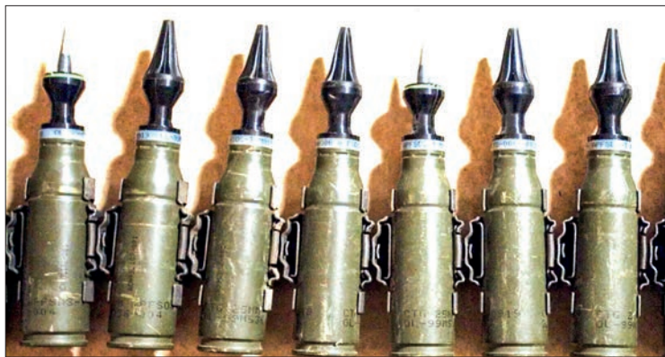
The United States will supply depleted uranium ammunition to Ukraine.

Scientists emphasize the danger of depleted uranium as radioactive dust and soil pollution with radionuclides.