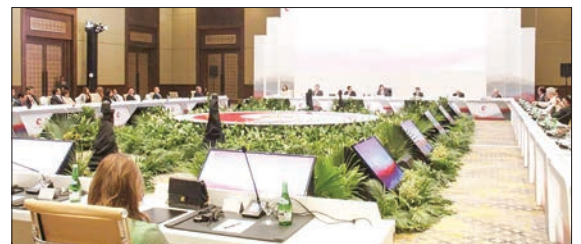
ASEAN-BAC Philippines, ASEAN-BAC Myanmar ink MoU for agriculture, MSME development