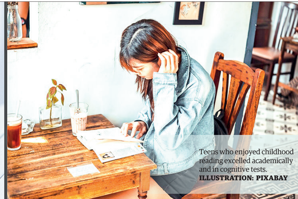
Teens who enjoyed childhood reading excelled academically and in cognitive tests.