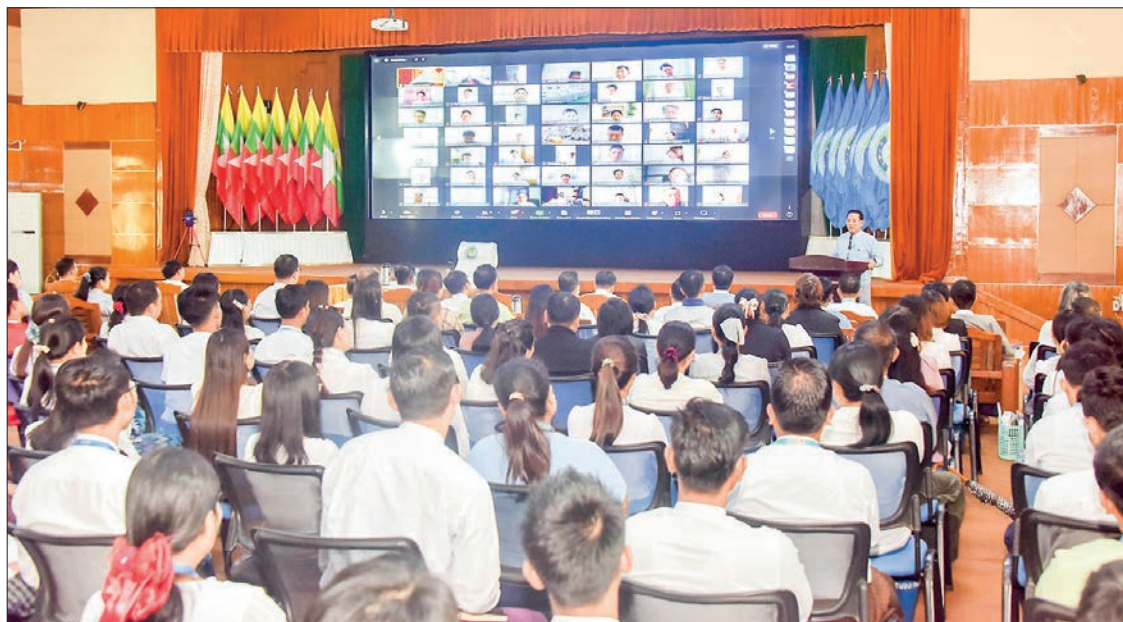
Union Minister U Maung Maung Ohn addresses the meeting with departmental staff of the Ministry of Information yesterday.

He continued that the Prime Minister carries out