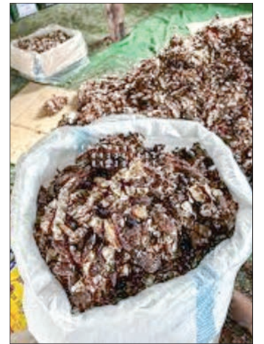
The photo shows tamarind stocked at a warehouse for sale.

has returned to normal right now but the prices of foodstuffs and related items have not come down. — TWA/MKKS