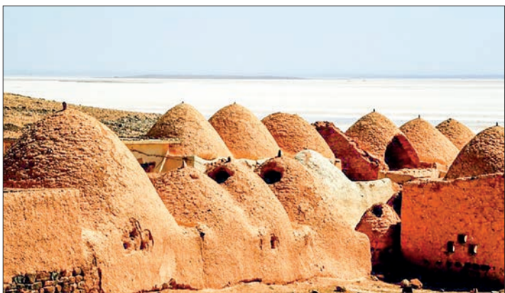
Also known as 'beehive houses', the conical adobe structures keep cool in the blazing desert sun, while their thick walls also retain warmth in the winter. PHOTO: AFP

Umm Amuda Kabira village in Aleppo province is among a handful of places where residents long used to live in the small domed houses, made of mud mixed with brittle hay. "Our village once had 3,000 to 3,500 residents and some 200 mud houses," said Mahmud al-Mheilej, standing beside deserted homes with weeds growing out of the roofs. — AFP