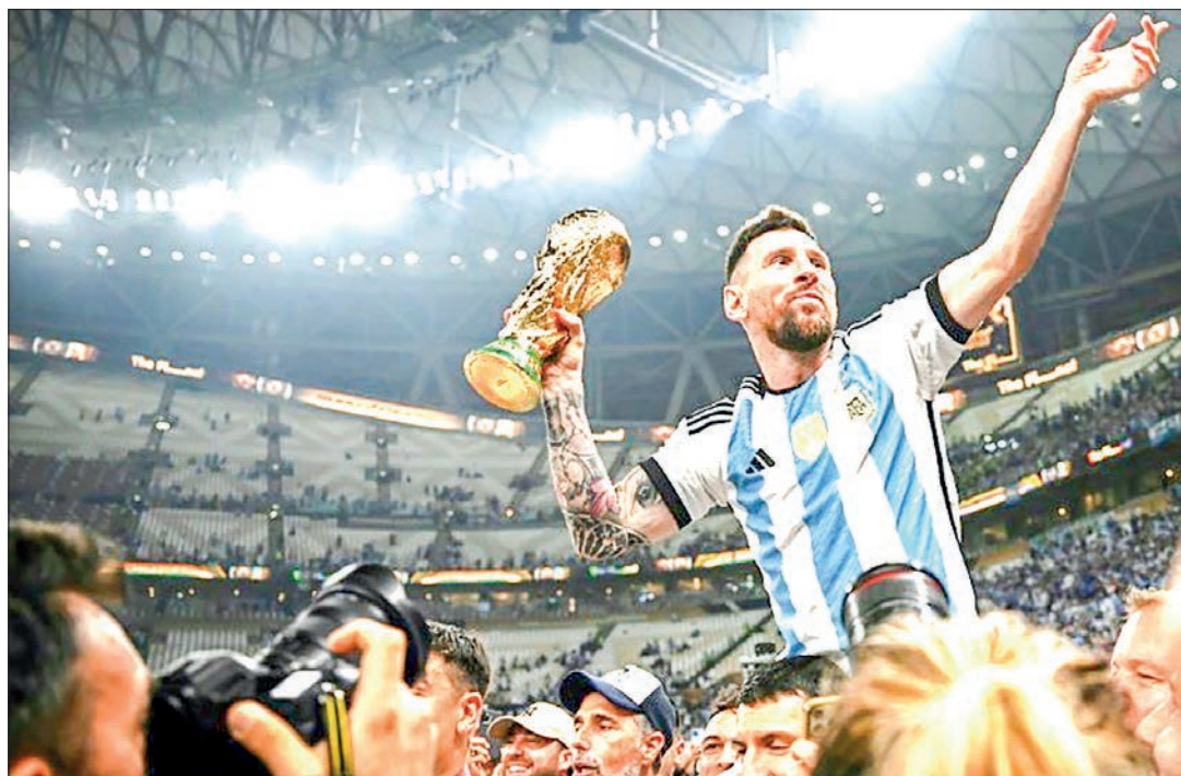
Lionel Messi could win his eighth Ballon d'Or on the back of a season in which he led Argentina to World Cup glory.

LIONEL Messi and Erling Haaland are among the leading contenders to win this year's men's Ballon d'Or, while Spain World Cup star Aitana Bonmati leads the nominees announced on Wednesday for the women's prize.