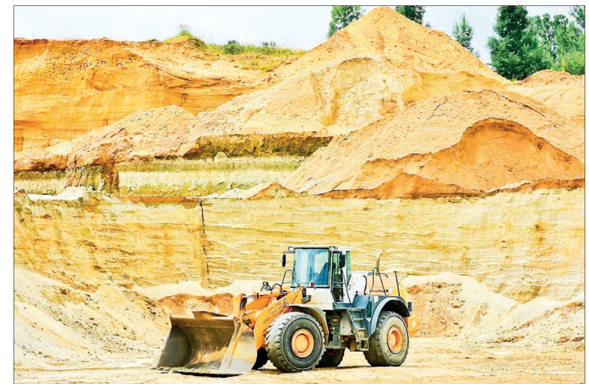
Sand and gravel play a pivotal role in the construction industry, serving as fundamental building blocks for countless projects worldwide.