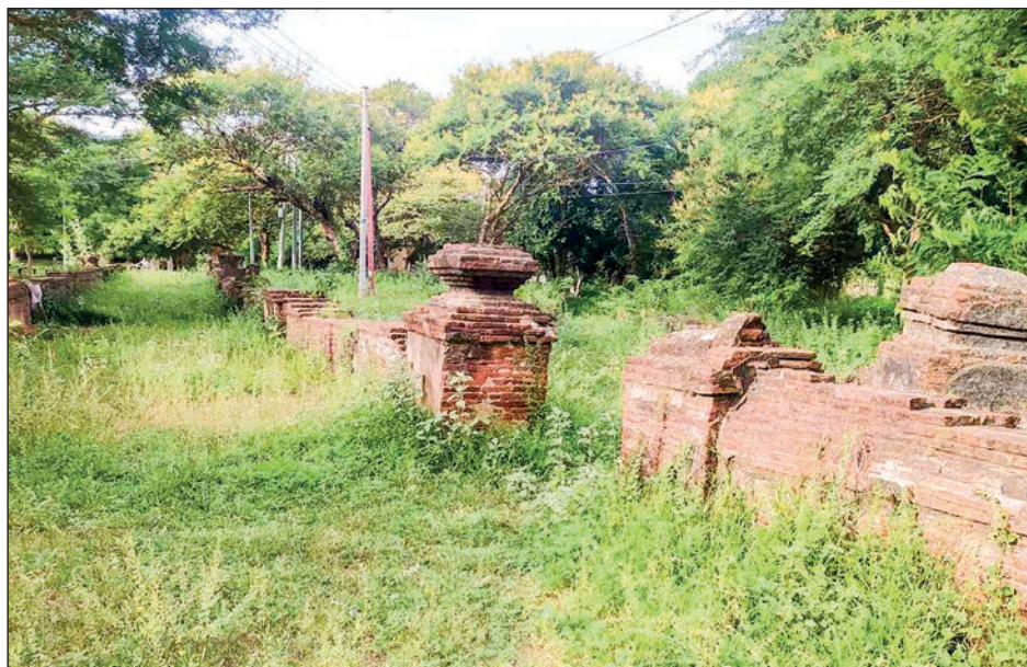
Photos show the southern brick pavement of the Shwezigon Pagoda.

THE people can study the brick pavement and undamaged stupas, lion statues and other sculptures on the wall