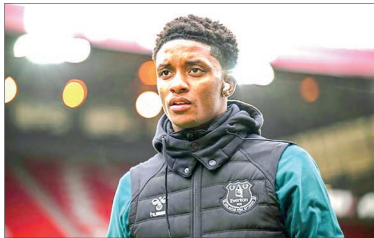
Everton's Demarai Gray has joined Saudi club Al-Ettifaq.

The Jamaica international said in a statement that he would be "forever proud" to have played for Everton, who are in the relegation zone after a poor start to the season.