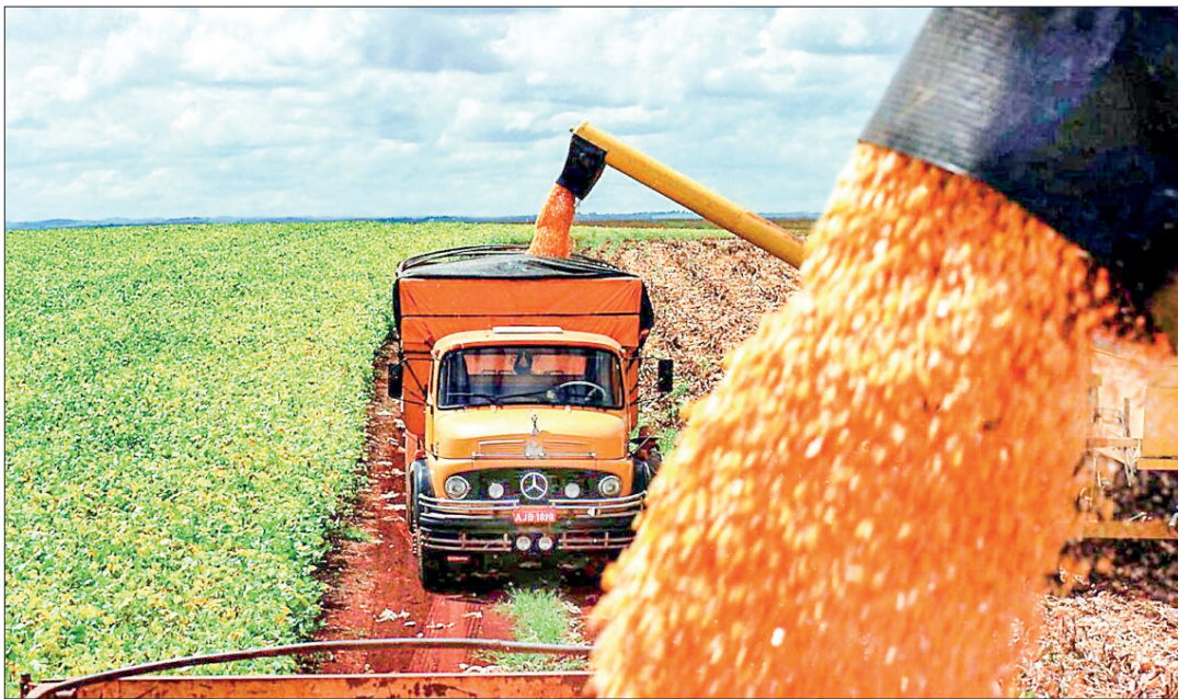
In this file photo taken on 12 May 2003 trucks harvest corn grains at a farm in Guarapuava, Brazil.