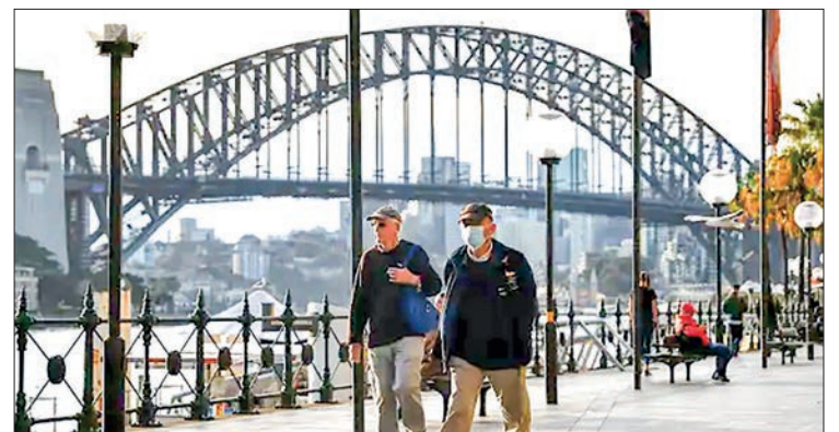
A man wearing a face mask walks before the Harbour Bridge in Sydney, Australia on 22 July 2020.

AUSTRALIA'S economy grew more than expected in the second quarter, data showed Wednesday, despite the "unrelenting pressure" of interest rate hikes and global turmoil.