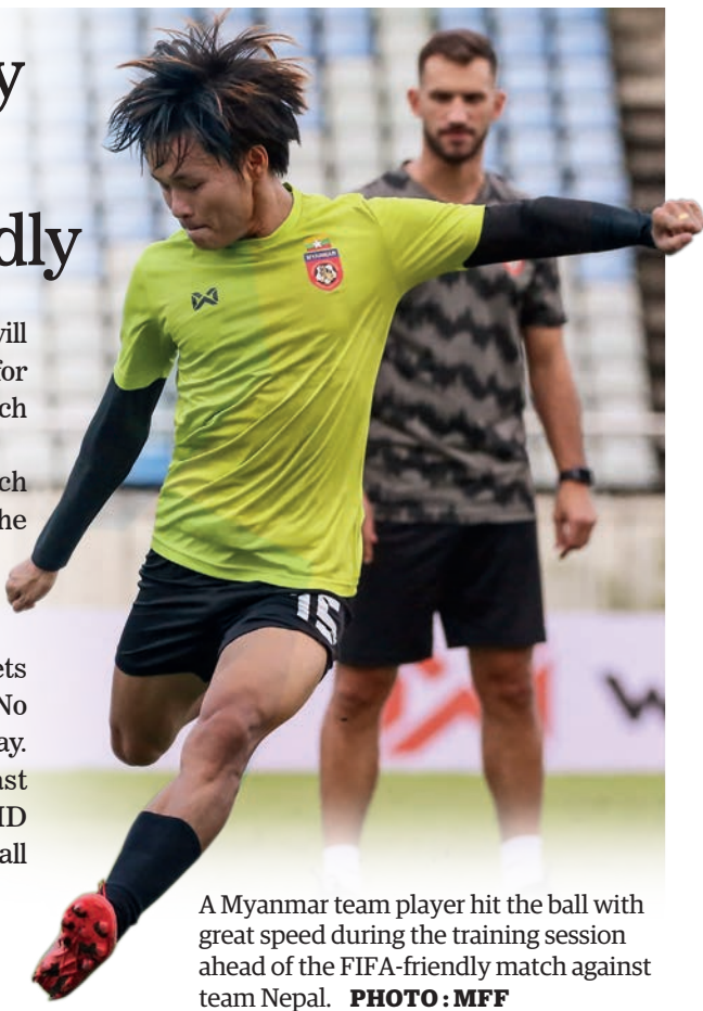
A Myanmar team player hit the ball with great speed during the training session ahead of the FIFA-friendly match against team Nepal.