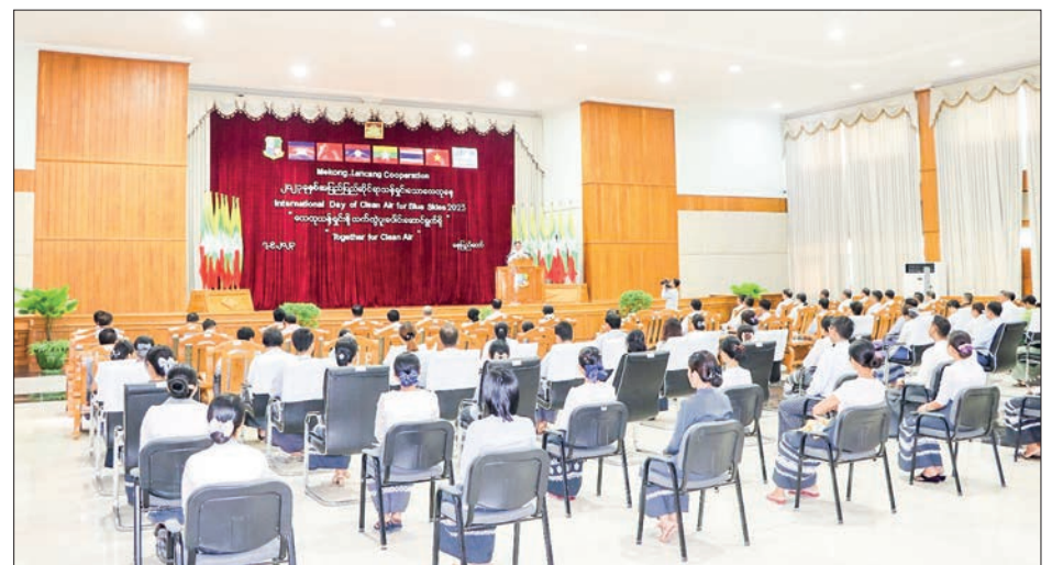
The event of International Day of Clean Air for Blue Skies in progress.

Reducing greenhouse gas emissions that cause climate change along with air pollution; use of renewable energy sources; Development of green economic sectors and clean air for fu-