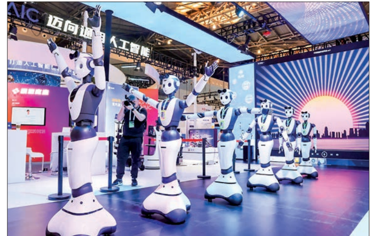
Robots are displayed at the opening of the three-day 2023 World Artificial Intelligence Conference in Shanghai on 6 July 2023. PHOTO: GLOBAL TIMES

It even exceeded the latter when answering questions from the Chinese university entrance exam, he said. AFP was not able to independently verify the claims. — AFP