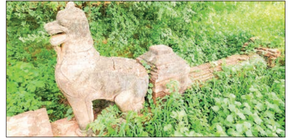
Southern brick pavement of Shwezigon Pagoda in Bagan