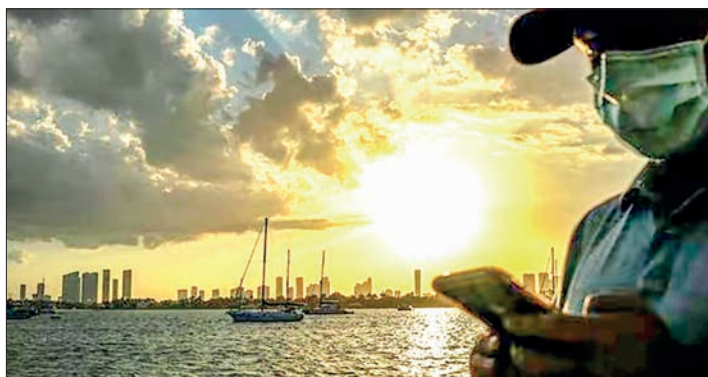
Temperatures reached record-breaking highs during the year across multiple continents.

In 2022, there were on average 417 parts per million (ppm) of the planet-warming gas in the air, up 2.2 ppm from the year before, according to the annual State of the Climate report led by scientists from the US National Oceanic and Atmospheric Administration. This is 50 per cent more than pre-industrial levels and "the highest in the