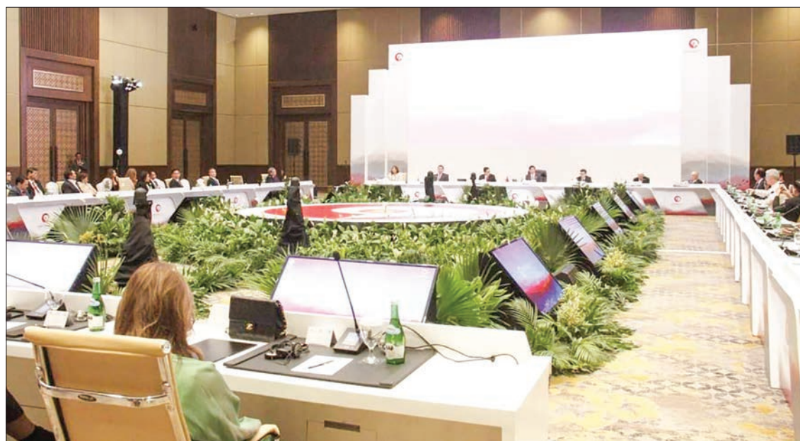
The ASEAN Business Advisory Council holds the roundtable dialogue in Jakarta, Indonesia.

ASEAN Business Advisory Council Myanmar (ASEAN-BAC Myanmar) was formed in 2003 after approval at the 7 th ASEAN Summit, to serve the voice of the