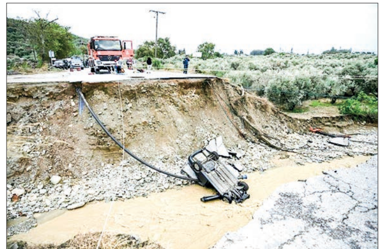
Flooding near the central Greek city of Volos caused damage.

The channel showed footage of houses underwater. At least 14 people have been killed by the downpours in Greece, Türkiye and Bulgaria countries. Such extreme weather is becoming more frequent and more intense as a result of human-induced climate change. — AFP