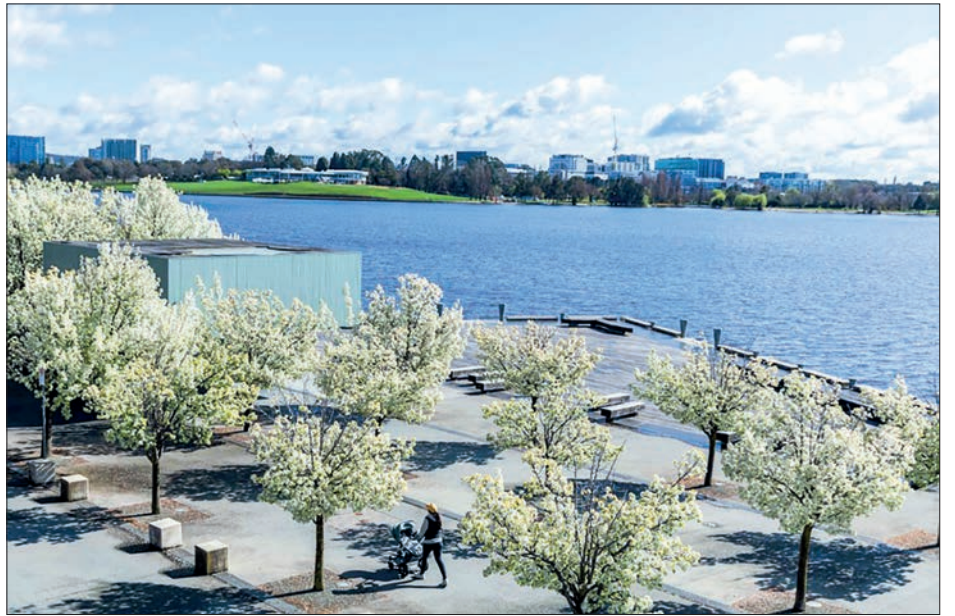
Photo taken on 16 September 2022 shows blooming flowers in early spring by the Lake Burley Griffin in Canberra, Australia.

fering group tours to a longer list of countries and regions, including Japan, Britain, the United States and Australia. Harrison regarded the coming back of Chinese group travelers as "good news for the Australian tourism industry" which would help to support the ongoing recovery of the country's visitor economy. — Xinhua