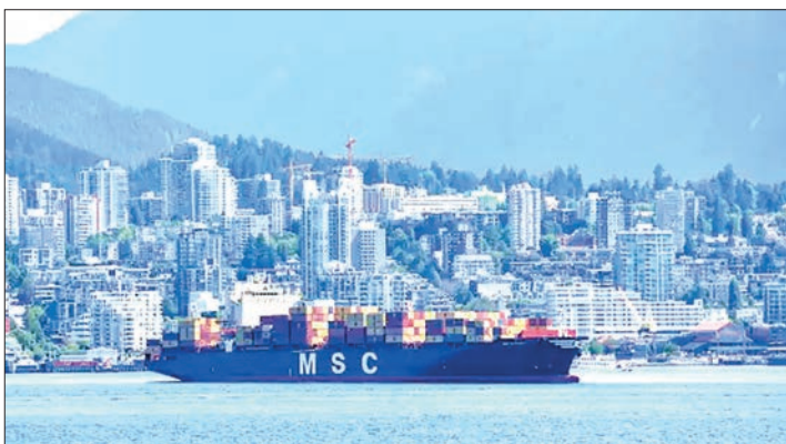
A container ship sits in Burrard Inlet in front off the coast of North Vancouver, 11 July 2023.

July saw exports of aircraft almost double, due to increased sales of private jets and commercial aircraft to the United States, Britain, Austria, Cyprus and France. Exports of canola more than doubled, with higher volumes sent to China and Mexico. Grains shipments were not impacted by the British Columbia ports strike. However, lower sales of refined gold to the United States and Britain dragged down exports of unwrought gold. — AFP