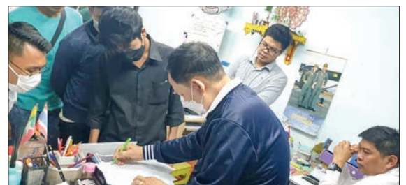
Swift turnaround times offered for U-Turn procedures in Kawthoung, Myawady