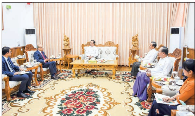
The Bangladeshi ambassador calls on Union Minister Dr Thet Khaing Win yesterday.

UNION Minister Dr Thet Khaing Win of the Ministry of Health met the delegation led by Dr Md Monwar Hossain, Ambassador of the People's Republic of Bangladesh to the Republic of the Union of Myanmar, at the ministry's reception hall in Nay Pyi Taw yesterday morning.