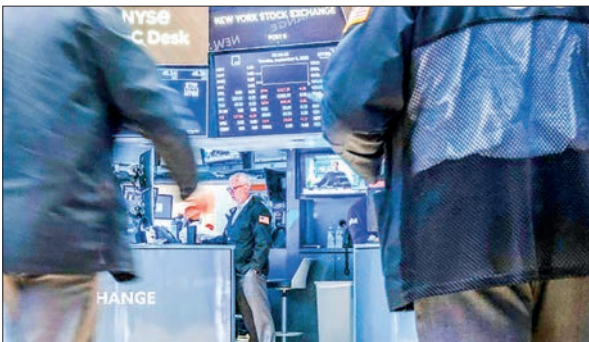
US interest rates are already at a two-decade high and some analysts warn that further increases could risk tipping the world's top economy into recession.

WALL Street and European stock markets retreated on Wednesday on fears of more interest-rate hikes as oil prices climbed, stoking fresh concerns about high inflation. Crude futures jumped Tuesday after key OPEC+ producers Russia and Saudi Arabia extended supply cuts to the end of the year in efforts to boost their revenues. Markets remained on edge on Wednesday as oil prices wobbled. Wall Street's three main indices were lower in late morning trading, with data showing activity