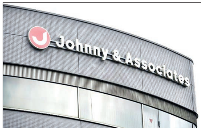
The president of Japanese talent agency Johnny & Associates has admitted that its late founder sexually abused young aspiring stars.

THE president of Japan's biggest and most successful boyband agency admitted on Thursday that its late founder