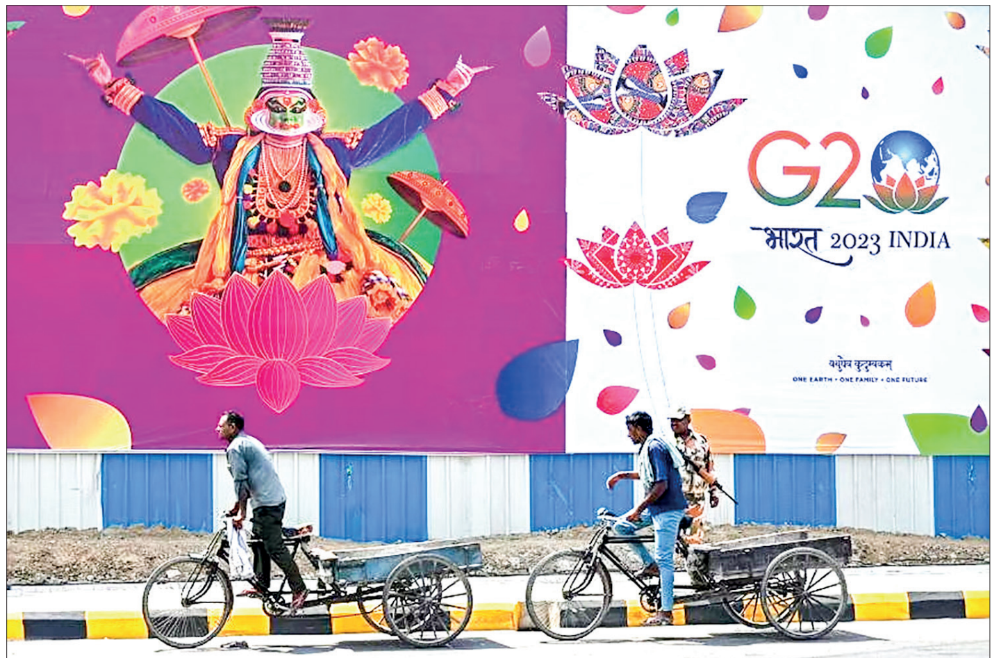
India's G-20 presidency strives to bridge divides, dismantle barriers, and sow seeds of collaboration.

The G20, representing a significant portion of global GDP and carbon emissions, is urged to take meaningful actions on climate finance and technology transfer.