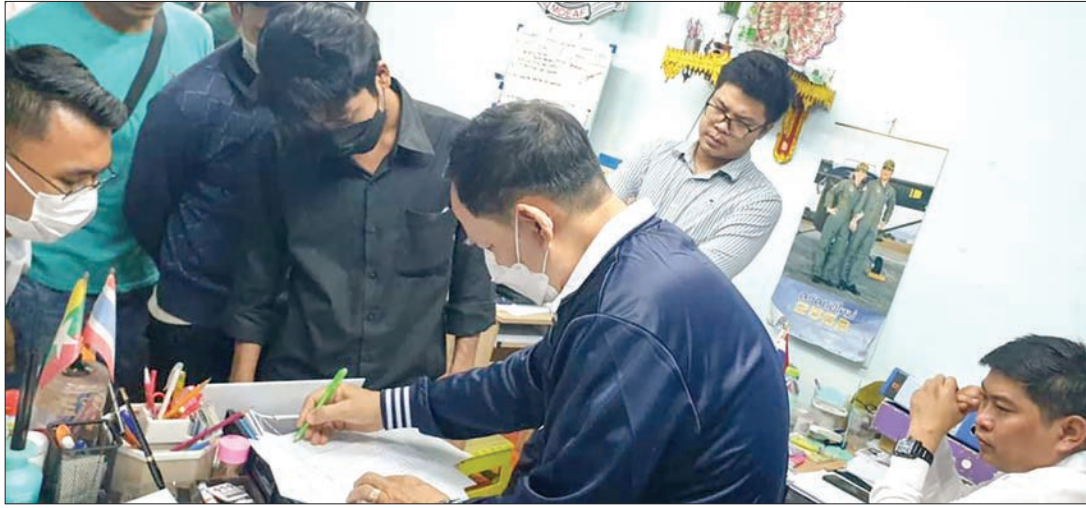
An official from the Myanmar Labour Attache Office is seen serving a labour issue.

To perform the U-Turn process within a day, the Ministries of Labour of the two countries have already instructed the one-stop service team to serve