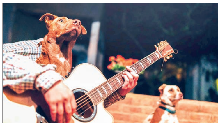
Live dog performances in orchestras for this piece are unusual, with recorded sound typically used instead.