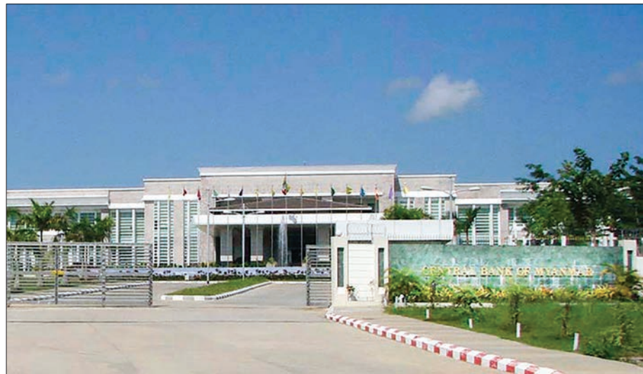
The front view of the office of the Central Bank of Myanmar-CBM.