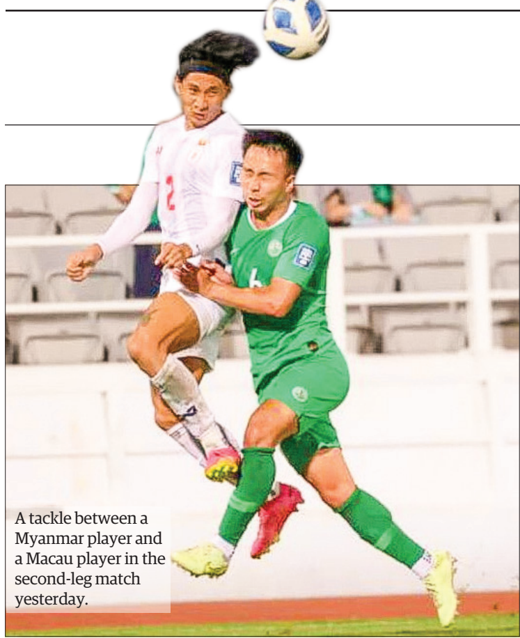
A tackle between a Myanmar player and a Macau player in the second-leg match yesterday.