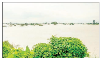
Floods damage 4% of 2.6 mln acres of paddy in Bago Region