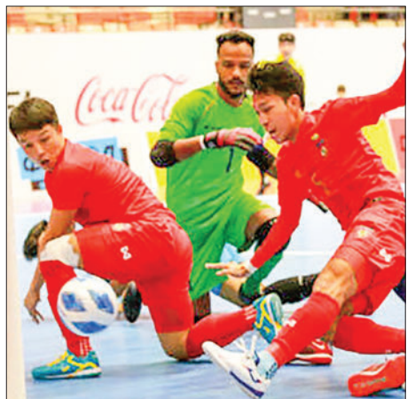
Team Myanmar (red) competed in the previous AFC Futsal Asian Cup 2024 Qualifiers against India.