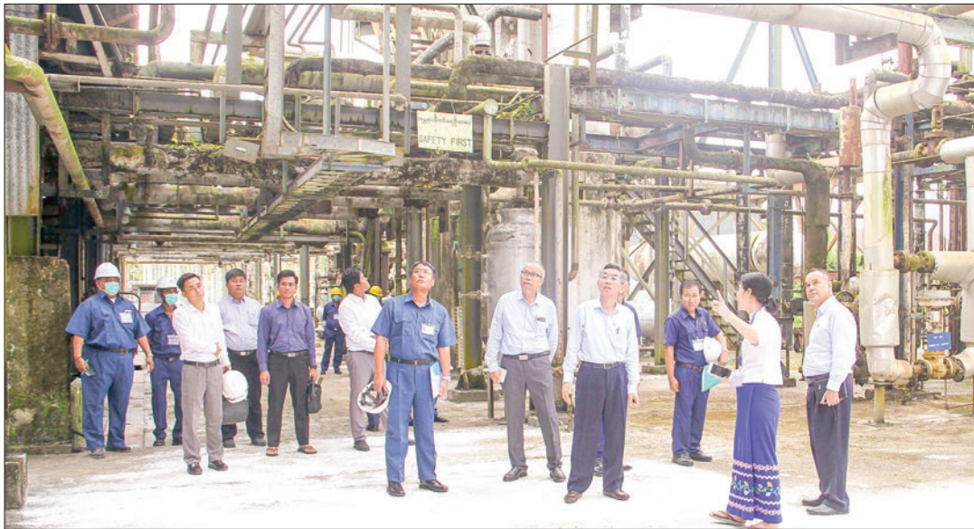
Union Minister U Ko Ko Lwin views round the No 1 Oil Refinery in Thanlyin of Yangon Region yesterday.

UNION Minister for Energy U Ko Ko Lwin inspected the No 1 Oil Refinery (Thanlyin) yesterday.