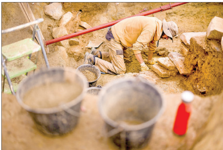
An archaeology student excavates a burial mound in Leuhan, western France, on 11 October 2023. This burial mound dating from ancient Bronze age was discovered in 1900 by French archeologist Paul du Chatellier. On this site du Chatellier also found a carved granite slab that could be the oldest map in Europe. The actual searches are conducted to understand the architecture of the tumulus and the way it was built. A new piece of the old slab was also found during these searches.

Ancient sites are more commonly uncovered by sophisticated radar equipment, aerial photography or by accident in cities when the foundations for new buildings are being dug. — AFP