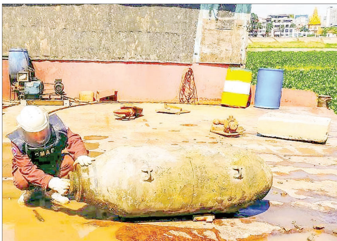
This handout photograph taken and released by the Cambodian Mine Action Centre (CMAC) on 5 May 2022 shows a CMAC staff examining a 2000-pound US-made bomb after it was uncovered from a river bed opposite to the Royal Palace in capital Phnom Penh.

CAMBODIA hosted the third global conference on assistance to the victims of mines and other explosive ordnance here on Tuesday.