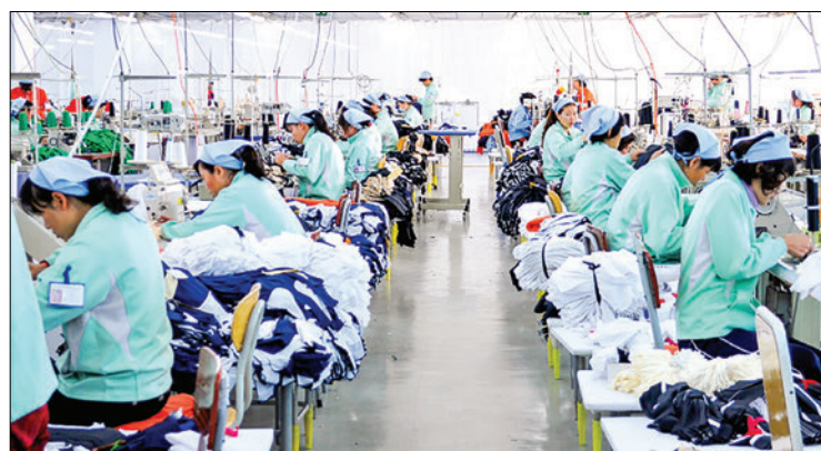
Myanmar CMP workers primarily produce clothes, footwear, bags, sports wear and sports shoes that are mainly exported to foreign countries.

“Currently, Japan and Korea are the key countries that purchase Myanmar garments under the CMP, with 37.5 per cent of orders from Japan and