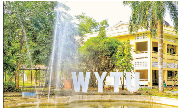
A view of West Yangon Technological University.

Application forms can be downloaded from the website of the Department of Technical, Vocational Education, and Training or obtained from the nearest government technical college and school starting from the date of the announcement. All applications must be submitted to the nearest government technical colleges, institutes, and high schools by 11 November. — TWA/KZW