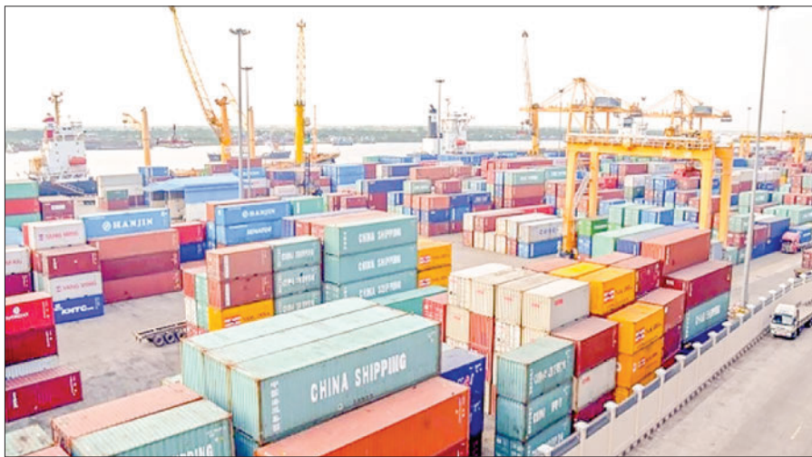
A general view of the container yard at Yangon Port.

The drop in exports was attributed to weak foreign demand in finished garment products, rice, broken rice, green gram, sesame and rubber, US dollar appreciation against the Kyat and illegitimate trade, the Union minister highlighted.