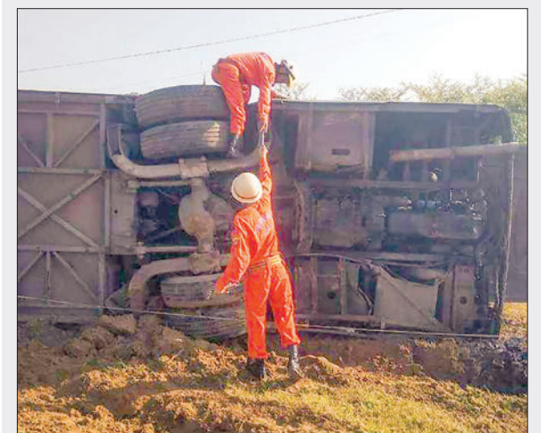
An express vehicle was seen overturned due to rain between mileposts 352/1 and 352/2 on the Yangon-Mandalay Expressway on 15 October.

Compared to the same period last year, the number of deaths due to traffic accidents in regions, states, and the Yangon-Mandalay Expressway was higher in Magway Region, Shan State, and the Yangon-Mandalay Expressway, while it decreased in Nay Pyi Taw and other regions and states. — TWA/CT