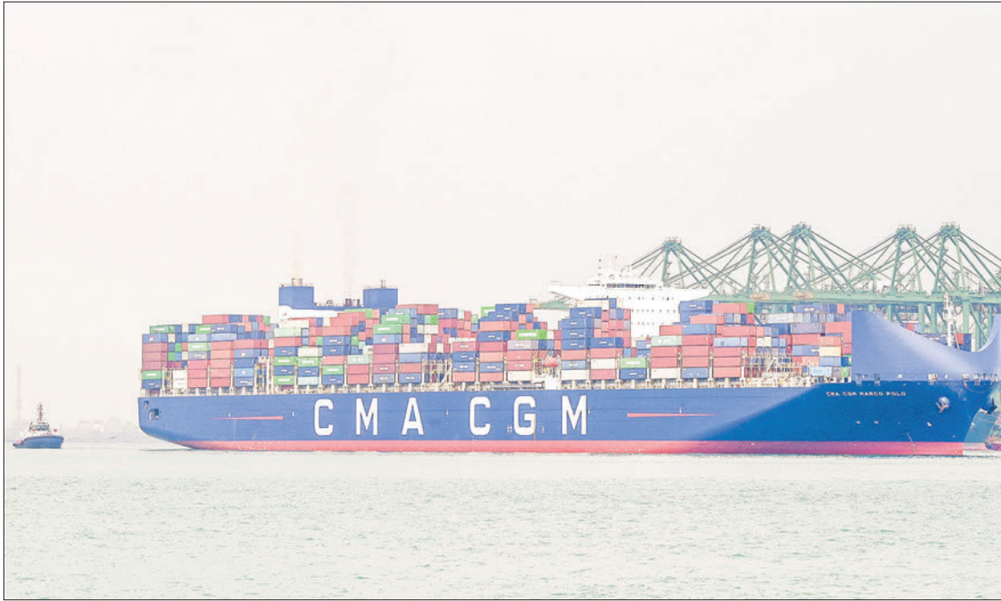
A pilot boat (L) guides a container vessel to dock at the Pasir Panjang port terminal in Singapore on 30 August 2023.