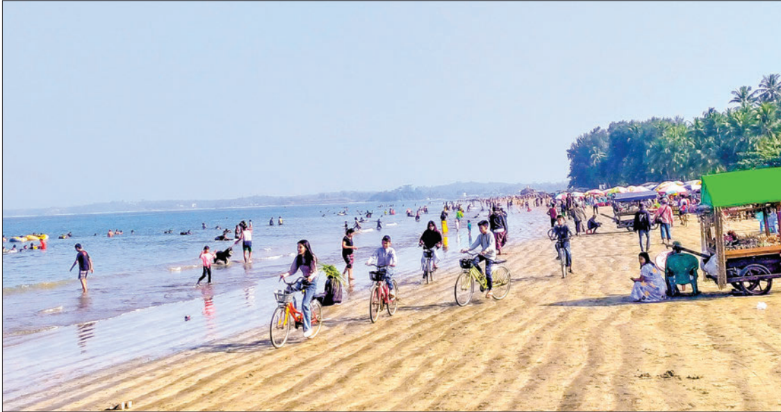
Joyful beachgoers enjoy a day at Chaungtha Beach in Ayeyawady Region.