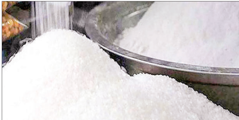
The photo shows old sugar stocks at a retail outlet in Yangon.

"Some warehouses no longer cut the price. The prices stayed the