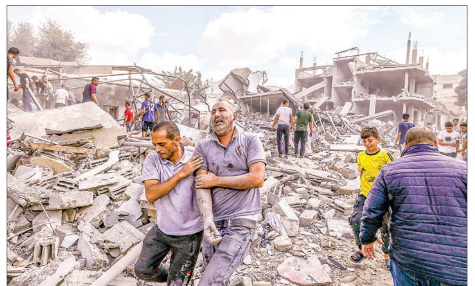
A Palestinian reacts as he is helped across the rubble following an Israeli airstrike on buildings in Rafah, in the southern Gaza Strip on 17 October 2023 amid the ongoing battles between Israel and the Palestinian group Hamas. PHOTO: AFP

Gaza-based Hamas fighters broke through Israel's heavily fortified border on 7 October, killing more than 1,400 people, most of them civilians. — AFP