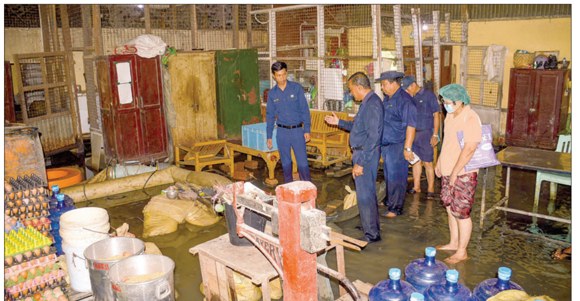
The deputy mayor inspects the Mental Health Hospital in Dagon Myothit (East) Township yesterday.

They proceeded to Dagon Myothit (Seikkan) Township and inspected the canal that flows into the Bago River. They also investigated the issue of garbage accumulation at the Ngamoeyik sluice gate and assessed the situation regarding the recovery and clearance of debris. — MNA/KZW