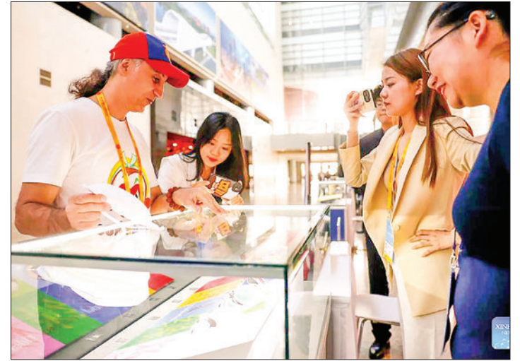
Journalists look at exhibits of Chinese intangible cultural heritage at the Media Centre of the third Belt and Road Forum for International Cooperation in Beijing, capital of China, 16 October 2023.

Energy storage, energy conservation and recovery, and clean energy were the top three sectors in terms of the number of filed patent ap-