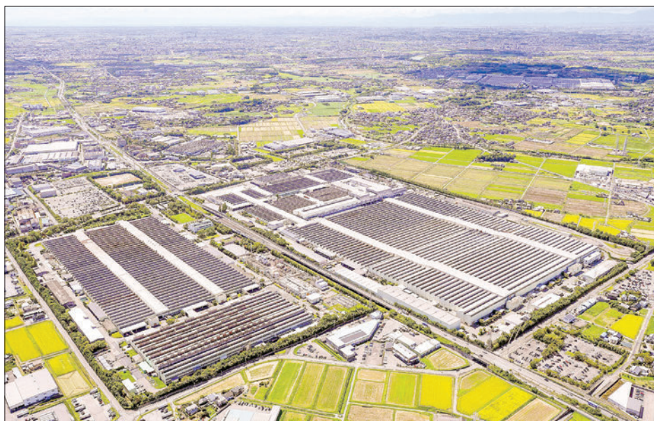
File photo taken in August 2023 shows Toyota Motor Corp's Tsutsumi plant in Toyota, Aichi Prefecture.

The explosion damaged part of the supplier's facility, including its drying furnace, and the cause of the accident is still being investigated, Chuo Spring said. Toyota has 14 assembly factories across Japan which produce cars for both domestic and overseas markets. The affected lines include those that assemble the popular Land Cruiser and RAV4 sport utility vehicles. — Kyodo