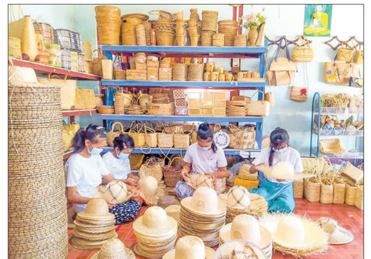
Skilled female artisans craft cane and bamboo creations in Ayeyawady Region.

Moreover, in addition to the handmade crafts, the Ay-