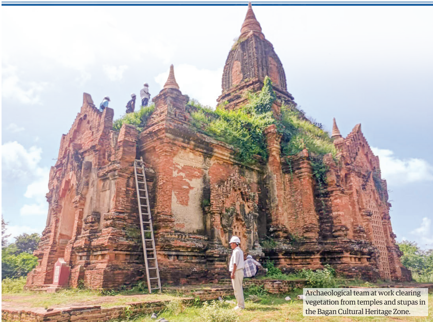
Archaeological team at work clearing vegetation from temples and stupas in the Bagan Cultural Heritage Zone.