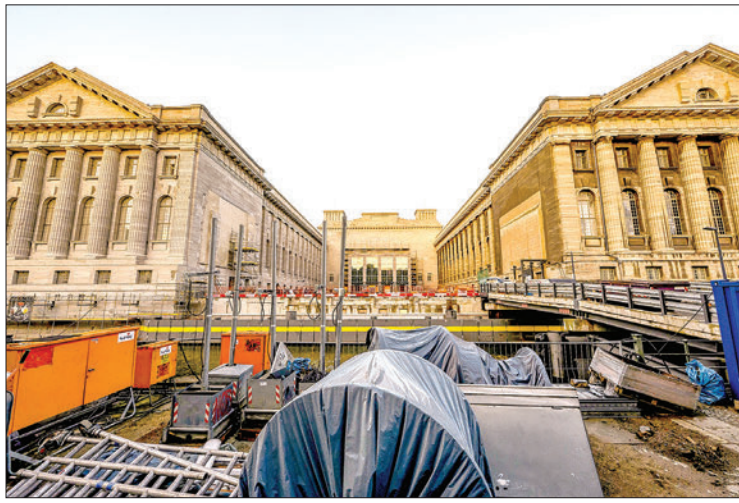
A general view shows the main entrance to The Pergamon Museum in Berlin on 5 October 2023 as renovation work progresses

The museum, which opened in 1930 and was named for the Ancient Greek masterpiece, attracts more than one million visitors a year when all its exhibits