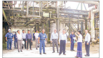
MoE Union Minister inspects No 1 Oil Refinery (Thanlyin)