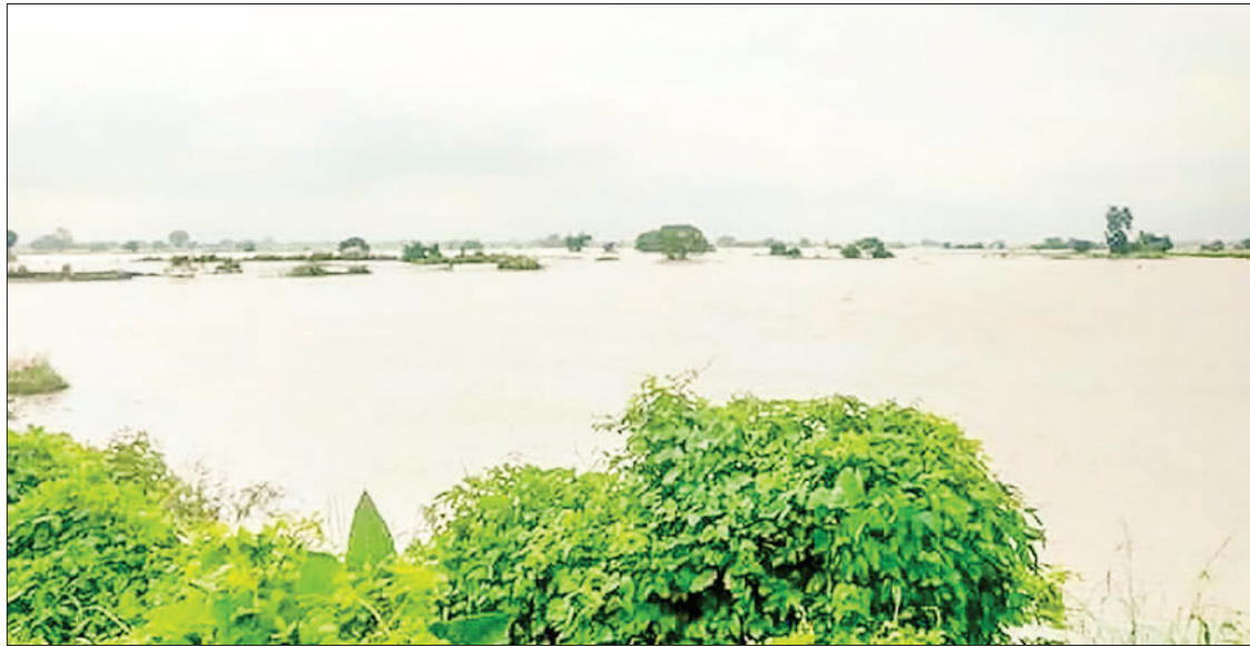
Paddy fields are seen being submerged due to floods in Bago Region.

Ripe paddy fields are usually damaged by being submerged in water for one day. At the begin-