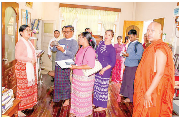
Preparations underway for the smooth transformation.