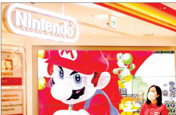
(FILES) An employee wearing a face mask stands next to a screen displaying characters from the Nintendo video game Super Mario at a store for Japanese games giant Nintendo in Tokyo on 3 February 2022. Nintendo and Sony have a lot riding on two new releases on 20 October 2023, "Marvel's Spider-Man 2" for the PlayStation 5 and "Super Mario Bros Wonder" on the Switch.

"side-scrolling" games allowing horizontal movement in an evolving landscape. The charac-