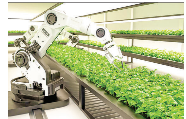
Smart robotic farming and artificial intelligence (AI) are transformative technologies that are revolutionizing the agricultural industry in several ways.

By introducing a multilingual AI tool available on mobile phones, farmers will have access to decision-making assistance to help them optimize crop management, increase