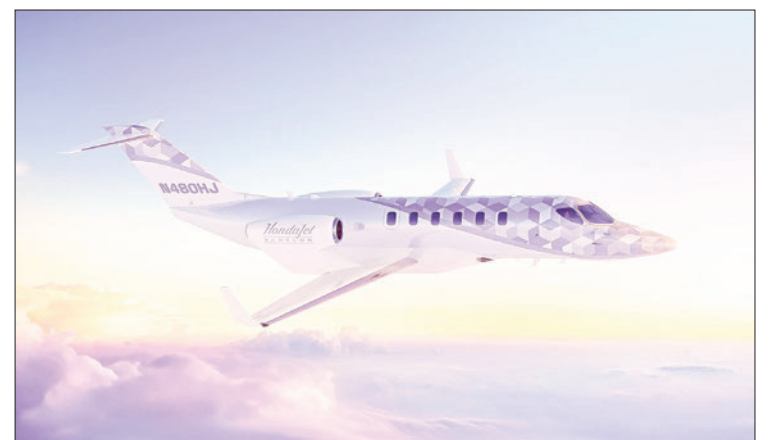
A rendered image shows a HondaJet Echelon business aircraft.

"Negative factors such as the Israel conflict — cited by some respondents as a reason for revising their growth forecasts downward — had only limited impact on the overall more optimistic outlook," he added. — AFP