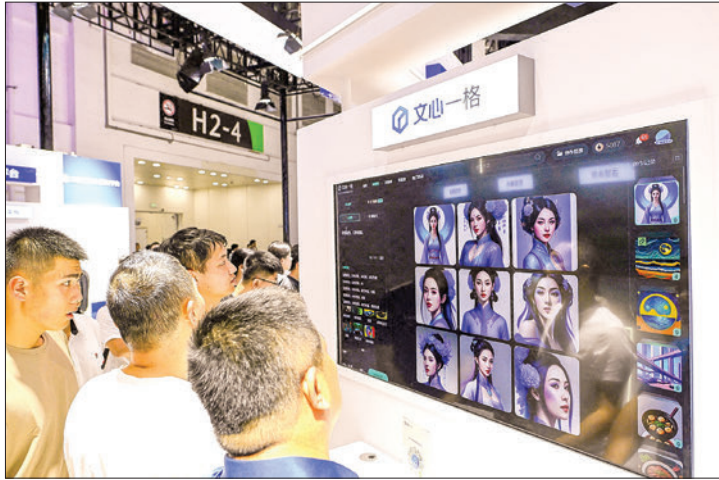
People examine an AI product of Baidu during the World Artificial Intelligence Conference (WAIC) in Shanghai on 6 July 2023.

CHINESE internet giant Baidu unveiled the newest version of its AI chatbot ERNIE on Tuesday, claiming it rivals the capabilities of OpenAI's latest ChatGPT.