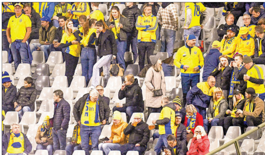
Swedish supporters wait in the stand during the Euro 2024 qualifying football match between Belgium and Sweden at the King Baudouin Stadium in Brussels on 16 October 2023 after an 'attack' that targeted Swedish citizens in a street of Brussels.

"Our thoughts go out to all the relatives of those affected in Brussels," a