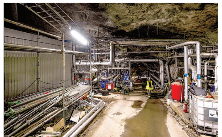
A worker walks at the site of a former oil storage cavern on 11 August 2023 in Västerås, Sweden, which is repurposed by Swedish energy company Mälarenergi and to be turned into a hot water storage facility. Mälarenergi, a Swedish energy company that provides various energy services to the region surrounding Lake Mälaren, is repurposing the former oil storage cavern into a massive energy storage facility for district heating, set to become Europe's largest hot water storage at temperatures reaching 95 degrees Celsius, with a capacity of 300,000 cubic metres, upon its 2024 completion. PHOTO: AFP

The caverns are close to Malarenergi's combined heat and power plant, which supplies electricity and especially heat via district heating, to Vasteras' 130,000 or so inhabitants. — AFP