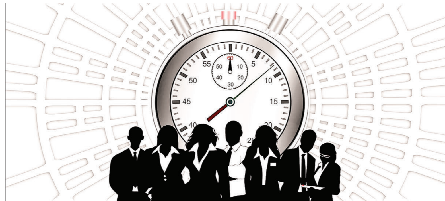
Investing time in self-care and smart time management is a recipe for a more fulfilling and successful life.

Managing our time effectively and efficiently requires a distinction between what is important and what is urgent. Not all the most important tasks are the most urgent ones, but we like to allow the urgent to dominate our lives. Those activities in our daily lives are categorized into four quadrants in a time management matrix: urgent, not urgent, important, and not important. The activities that are both urgent and important must be done, needless to say. Less time should be spent on unimportant activities regardless of their urgency to gain ample time to focus on those activities that are not urgent, only impor-