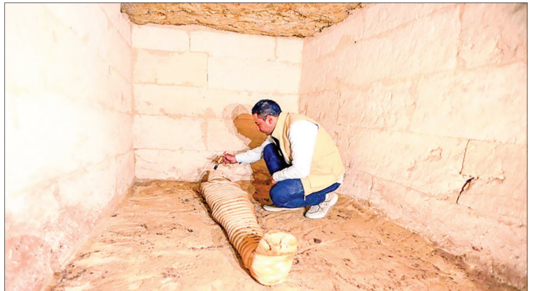
An archaeological worker cleans a mummy inside a rock-cut tomb at a cemetery in Minya Governorate, Egypt, 15 October 2023. A cemetery dating back to the New Kingdom of ancient Egypt was unearthed at Tuna El-Gebel necropolis in southern Egypt's Minya governorate, the Egyptian Ministry of Tourism and Antiquities announced on Sunday