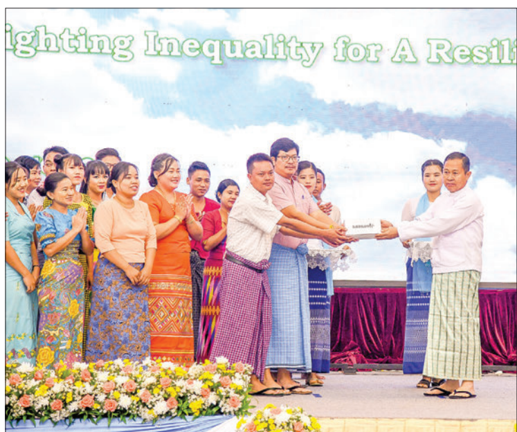
The Vice-Senior General presents cash awards to the personnel of the Disaster Management Department yesterday.

tional Disaster Management Committee and relevant governments in addition to local and foreign well-wishers.