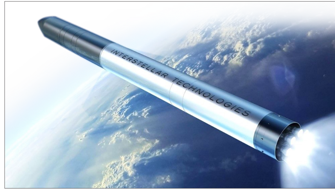
A rendering of Interstellar Technologies' rocket, Zero, is expected to be fuelled by liquefied biomethane produced by Air Water.

This revelation heralds a sustainable future by turning waste into fuel, revolutionizing space propulsion with broad-reaching potential through a fusion of science, technology, and sustainability.