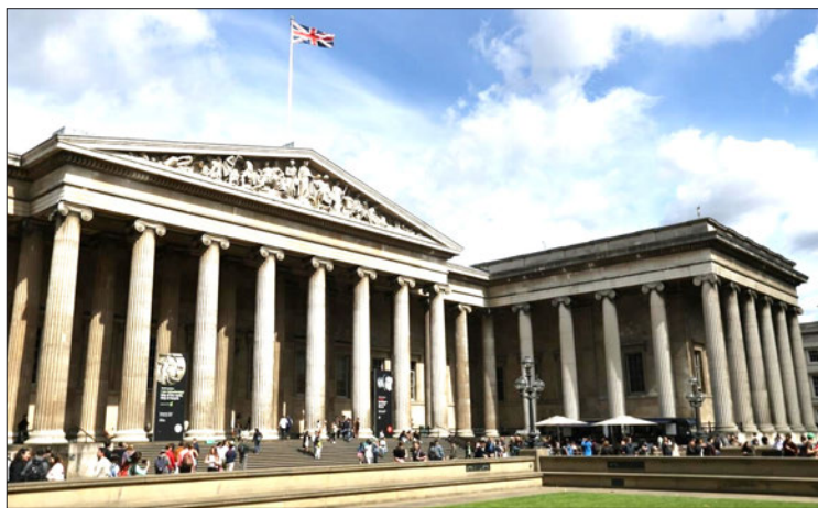
The museum plans to put the recovered items on display in a previously unplanned exhibition.

THE British Museum in London has recovered 350 of approximately 2,000 artefacts believed to have been stolen from its collection by an ex-employee, chairman George Osborne said Wednesday.