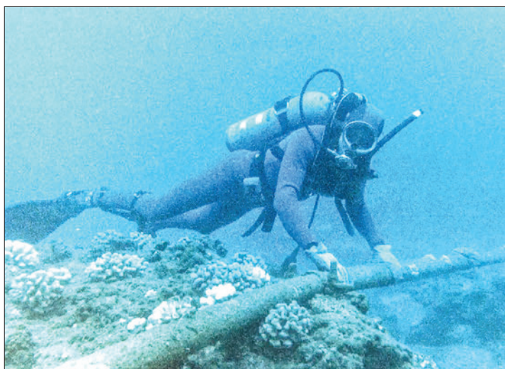
Diver checking underwater protection of cable.

T HE communication cable connecting Sweden and Estonia sustained damages in the Baltic Sea, Swedish Minister for Civil Defence Carl-Oskar Bohlin said on Tuesday. “So far we are not exactly sure what damaged the cable,” a Finnish news agency quoted the minister as saying at a news conference. Bohlin indicated the details regarding the damage to the Swedish-Estonian cable are similar to damages identified last week that affected the Balticconnector gas pipeline, which connects Estonia and Finland. However, the government official noted the cable remained