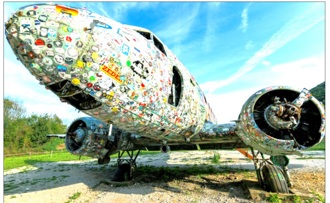
An old DC-7 Dakota covered with stickers at the abandoned Zeljava underground airbase on Croatia’s border with Bosnia.

“It was the then best military and civilian technology.” — AFP