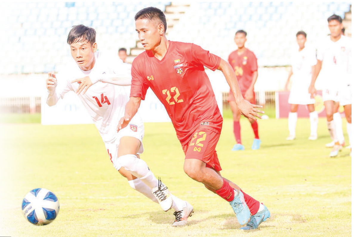
The Myanmar U-19 team player (red) attempts to pass the Inter-State & Region team player (white) during a friendly match played at Thuwunna Stadium in Yangon on 31 August 2022.