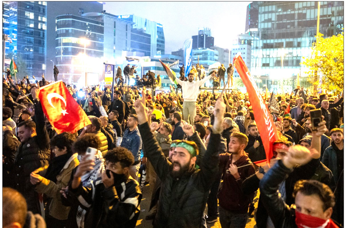
Several countries in the Middle East and North Africa saw protesters march after hundreds of people died in an explosion at a hospital in Gaza. People take part in a protest outside the Israeli consulate to show solidarity with Palestinians, in Istanbul early on 18 October 2023.

Kluge said the WHO was “very, very worried” about the situation. At least 200 people were killed Tuesday in a strike on the Al Ahli Arab Hospital in central Gaza, the health ministry in the Hamas-run Palestinian territory said. — AFP