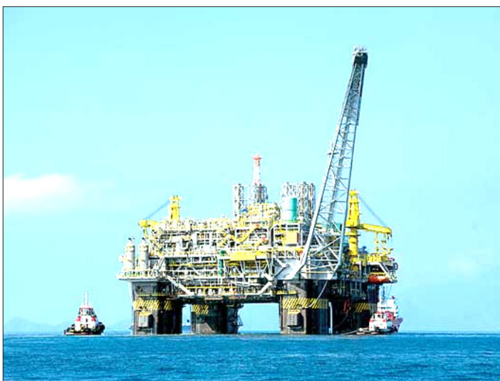
Oil prices surged on Wednesday as tension escalated in the Middle East.

ASIAN equities retreated and oil prices rallied Wednesday on fears that the Israel-Hamas conflict could spill over into a regional war after a strike on a Gaza hospital dealt a blow to President Joe Biden's diplomatic drive.