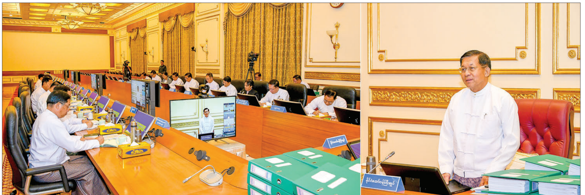
State Administration Council Chairman Prime Minister Senior General Min Aung Hlaing addresses the Economic Committee Meeting 8/2023 in Nay Pyi Taw on 18 October 2023.

Senior General Min Aung Hlaing gave guidance at the Economic Committee Meeting 8/2023 of the Republic of the Union of Myanmar.