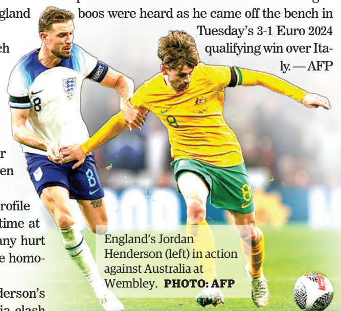
England's Jordan Henderson (left) in action against Australia at Wembley.

but a vocal minority audibly jeered when he was replaced in the second half and a smattering of boos were heard as he came off the bench in Tuesday's 3-1 Euro 2024 qualifying win over Italy. — AFP