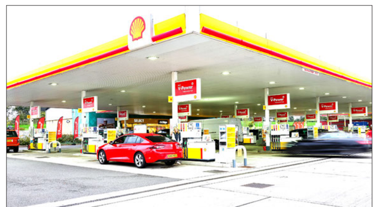
Fuel prices rose by 7.6 per cent between August and September, with the cost of 95-octane petrol in some areas reaching a 13-month high.

Fuel prices rose by 7.6 per cent between August and September, with the cost of 95-octane petrol in some areas reaching a 13-month high.