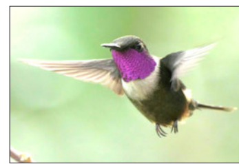
The tool has some limitations, including the relatively few bird calls available with which to train the computer model.

The recording from the forest in Ecuador is part of new research looking at how artificial intelligence could track animal life in recovering habitats.