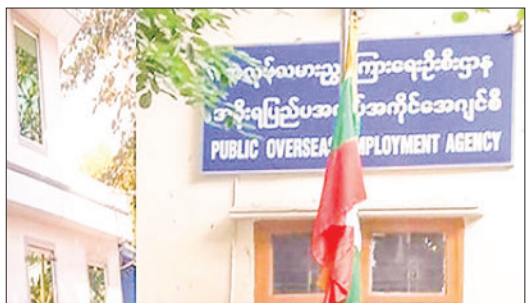
The office sign of the Public Overseas Employment Agency.

ACCORDING to the Public Overseas Employment Agency of the Ministry of Labour, seasonal workers, including female workers, will be sent to South Korea in October under the G-to-G Programme as part of the Myanmar-Korea inter-governmental agreement.