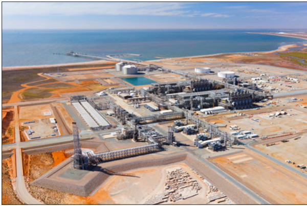
The Wheatstone facility operated by Chevron in Pilbara Coast, Western Australia, is one of the largest gas liquefaction plants in the world.

The alliance said it had cancelled its notification of industrial action after members endorsed three new enterprise