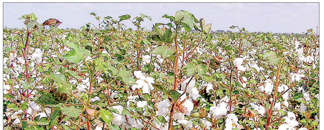
The photo shows a thriving cotton field in Myanmar.

directly to the Department of Human Resources for Health by 16 November. For more information, applicants should visit the Ministry of Health website at www.moh.gov.mm and the Department of Human Resources for Health website at www.hrh.gov.mm . — TWA/KZW