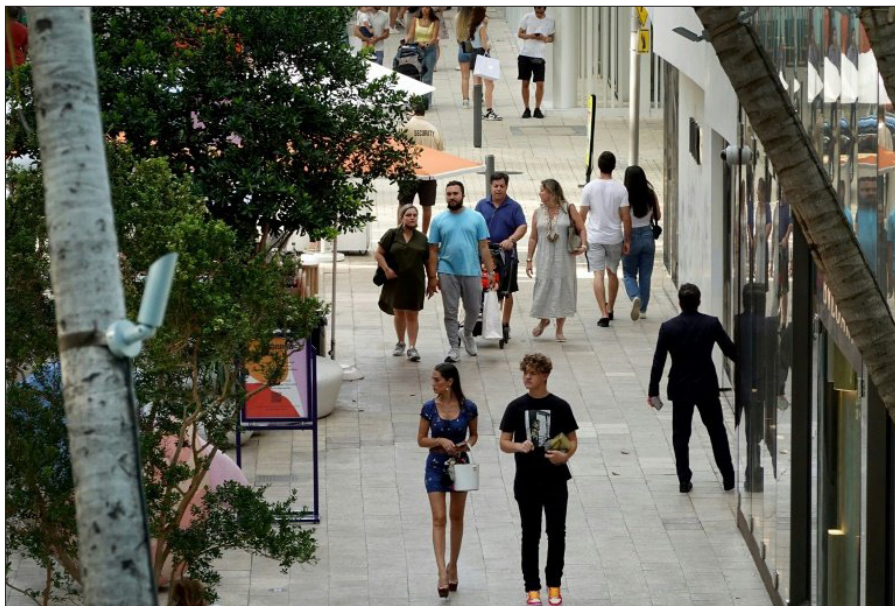
US retail sales was much stronger than expected in September, likely supported by a still resilient job market. PHOTO: AFP

The Federal Reserve lifted the benchmark lending rate rapidly, increasing the cost of borrowing and lowering demand by making it pricier to get funds for big-ticket purchases or business expansion. — AFP