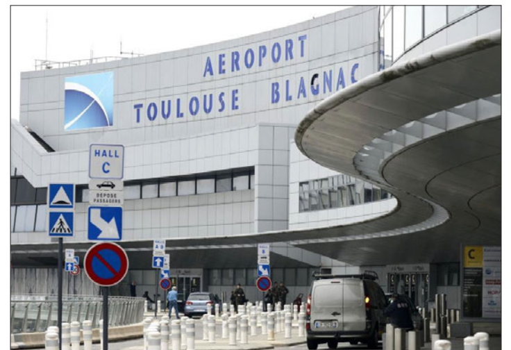
Authorities reportedly evacuated the airports of Lille (LIL), Lyon (LYN), Nantes (NTE), Nice (NCE), Paris-Beauvais (BVA), and Toulouse (TLS) due to bomb threats on the morning of 18 October.

In Lille, an airport spokeswoman said three flights had been diverted, while a post on its X account said security forces were on the scene. — AFP