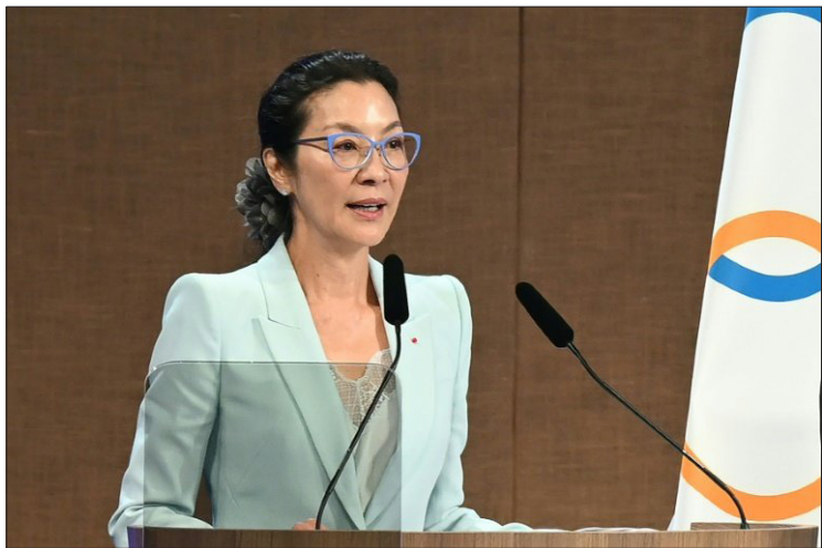
Michelle Yeoh, the first Asian woman to win an Academy Award, was one of eight new members voted in on the final day of the 141 st IOC session.