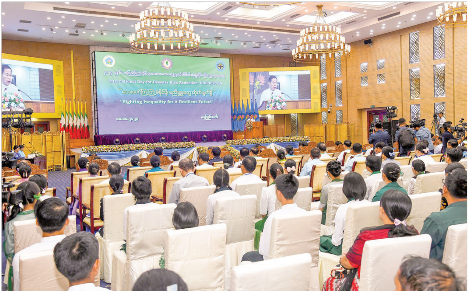
State Administration Council Vice-Chair Deputy Premier Vice-Senior General Soe Win speaks on the commemorative occasion of the International Day for Disaster Risk Reduction 2023 yesterday in Nay Pyi Taw.

In a clarification on rehabilitation at storm-hit areas, the Vice-Senior General recounted that these areas could return to normal in a short time thanks to the guidance of the SAC Chairman, the leadership of the Na-