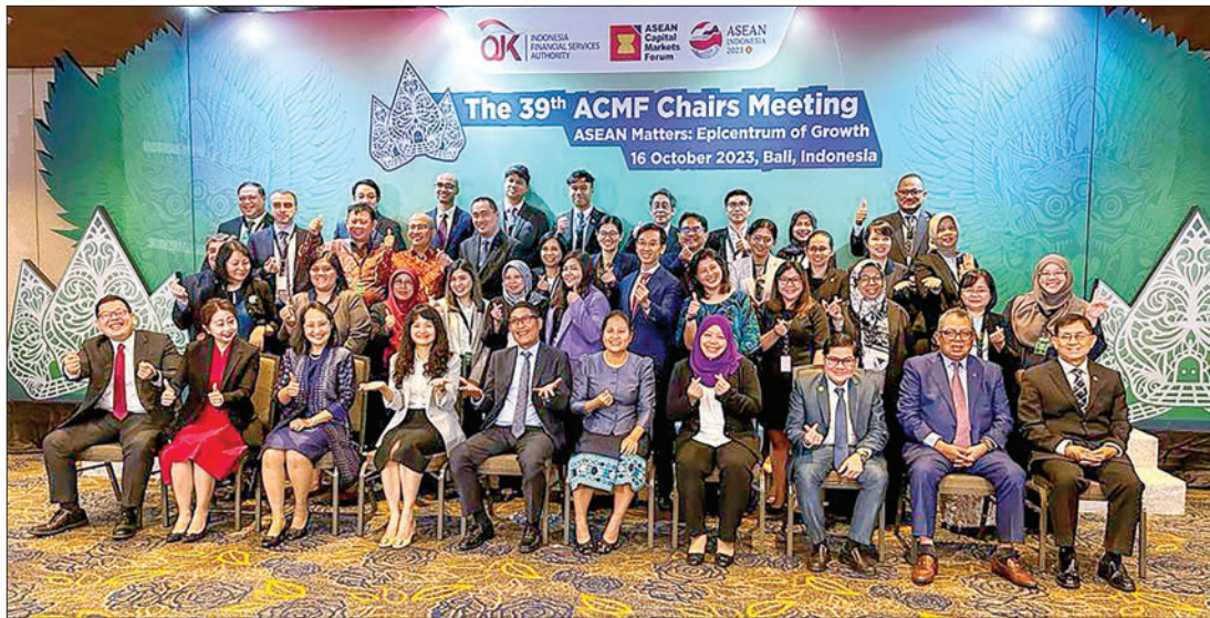
The group documentary photograph of the 39th ACMF Chairs Meeting held in Indonesia on 16-18 October 2023.