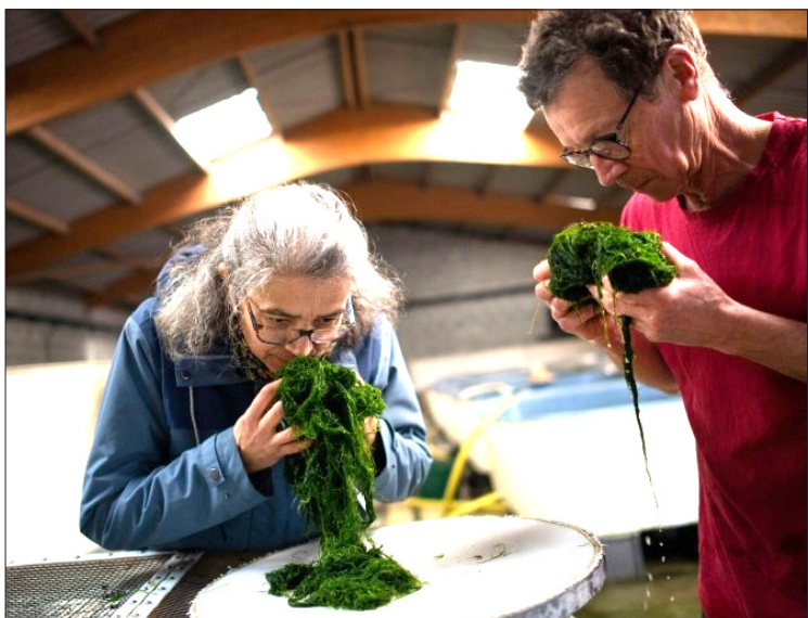
While seaweed is a staple in Japan, it has long been shunned by traditional Western diets. PHOTO: AFP/FILE

“Sports was very much part of my life growing up, I was very much involved with squash, athletics, swimming and diving.” — AFP