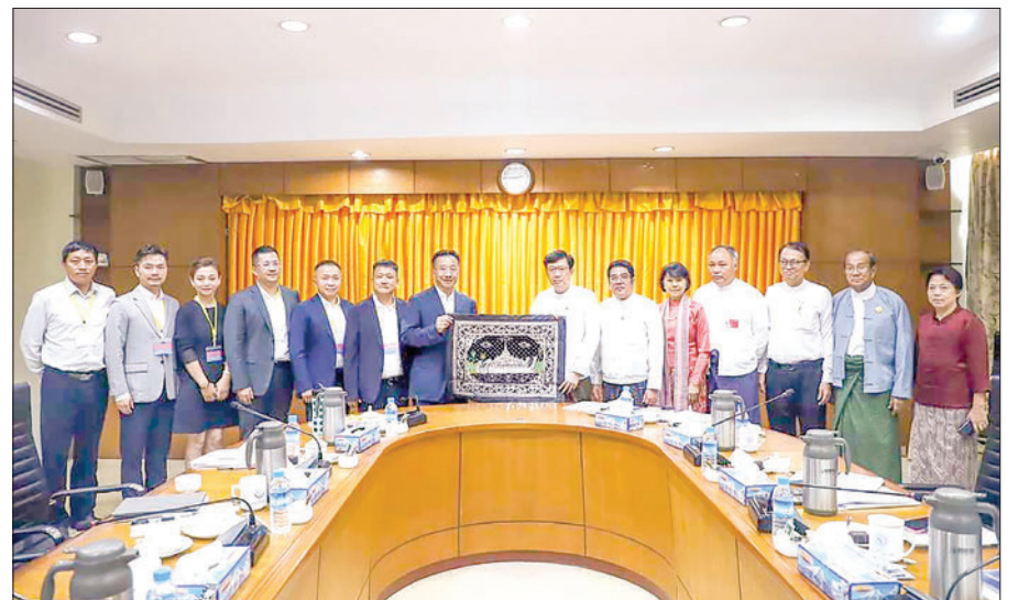
Officials from UMFCCI and YPGCC exchange gifts at the bilateral economic cooperation and trade meeting in Yangon on 17 October 2023.

Additionally, a Memorandum of Understanding to implement the Myanmar-China Economic Corridor (CMEC)