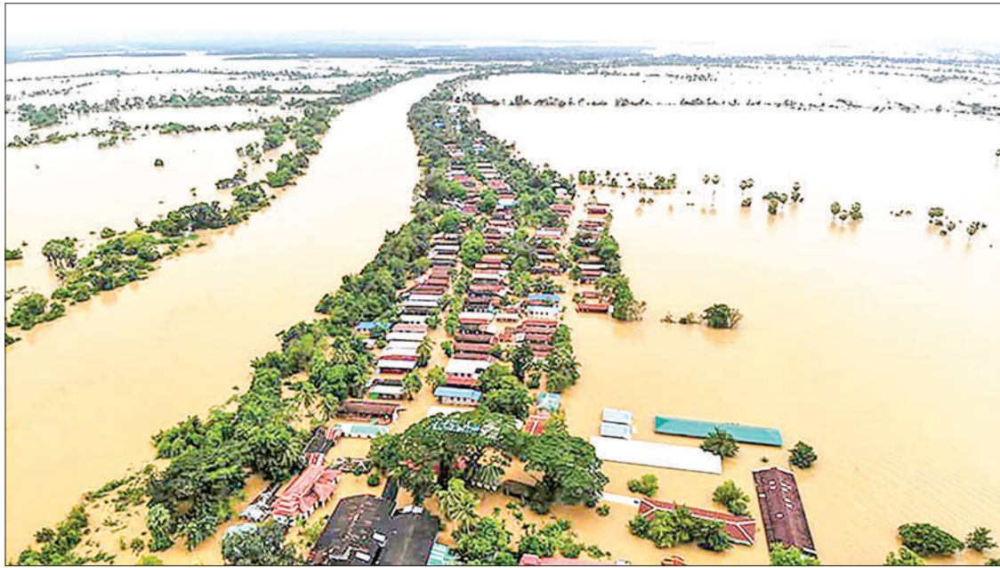
A flooded farm and houses are pictured in Bago Region recently. MRF earmarks K50 million financial support for flood-torn farmers in Bago Region.

THE Myanmar Rice Federation (MRF) has earmarked about K50 million to help the farmers whose paddy fields in the eastern part of Bago Region have been flooded, according to the central executive committee of the federation.