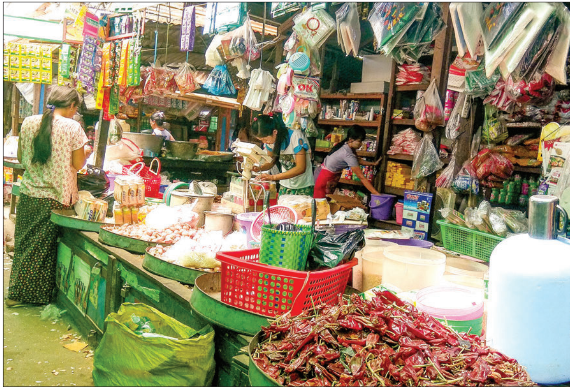
The photo shows shoppers and vendors at a kitchen grocery retail outlet in Yangon.

The Yangon potato market only published the price of Chinese potatoes on 18 October, with