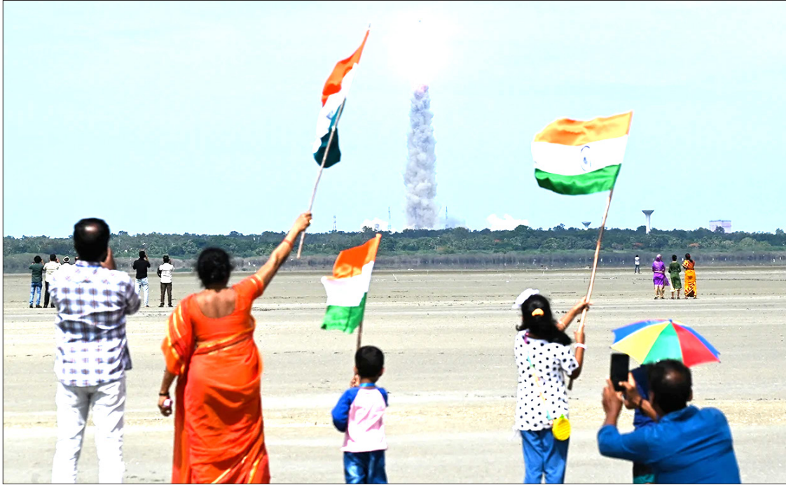
A rocket carrying Chandrayaan-3 lifts off from the spaceport in Sriharikota.

INDIA plans to send a man to the Moon and set up a space station by 2040, Prime Minister Narendra Modi said, as the country ramps up its space programme.