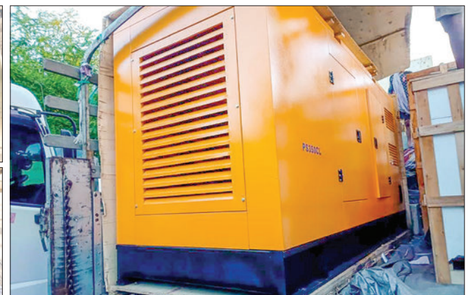
Confiscated illegal items are seen in Mandalay Region.