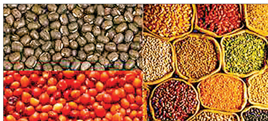
Various kinds of beans are seen at a market.

THE black gram price was moving upwards, reaching a record high of around K2.7 million per tonne.