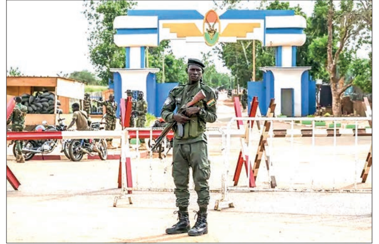
A Nigerian National Police officer stands guard as supporters of Niger's National Council of Safeguard of the Homeland (CNSP) protest outside the Niger and French airbase in Niamey on 30 August 2023 to demand the departure of the French army from Niger.

"This third blow in less than two years against the presence of French military forces in Africa is the most serious setback for the head of state on the continent since his election in 2017," said France's Le Monde daily. — AFP