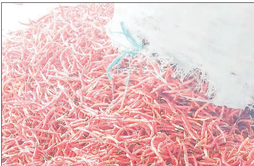
The photo shows a new supply of dried chilli pepper (Moehtaung variety).

THE prices of long dried chilli pepper (Moehtaung variety) and dried bell pepper are down by K5,000-10,000 per viss in Yangon's market in the third week of October compared to those registered in the year-ago period.