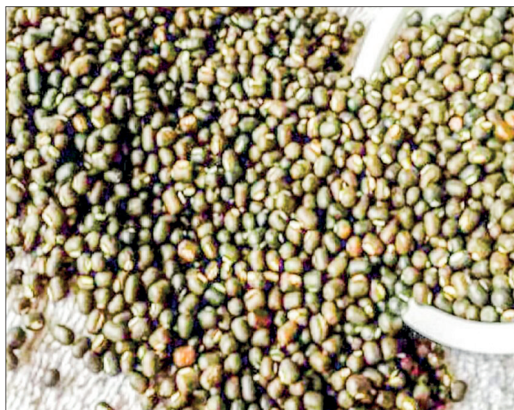
Black grams are seen for sale at the market.

Black grams that India primarily purchases are commonly found only in Myanmar, whereas pigeon pea, green gram and chickpeas are grown in African countries and Australia, Myanmar Pulses, Beans, Maize and Sesame Seeds Merchants Association said. — NN/EM