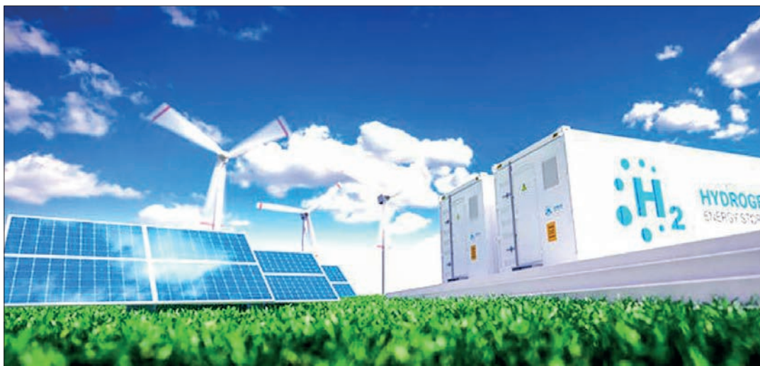
Low-carbon electricity for hydrogen production included nuclear power. PHOTO: AFP

to join the H2Med project to bring hydrogen from the Iberian peninsula to the rest of Europe. Discussions are ongoing between EU member states on a package of regulations that will determine whether volumes of the gas produced with nuclear power can be considered "green". — AFP