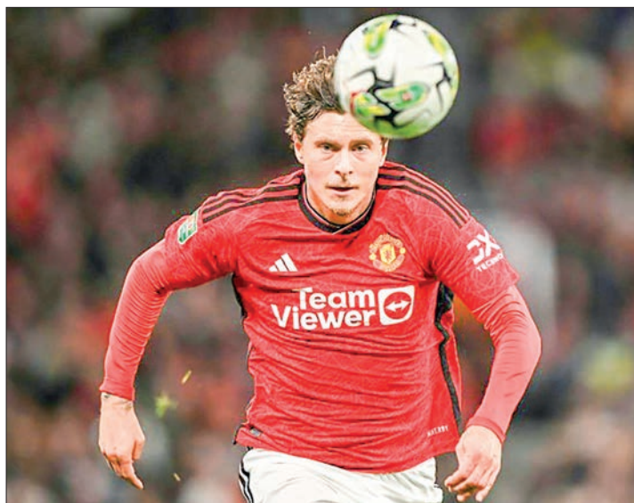
Manchester United's Swedish defender Victor Lindelof.

UEFA stated the match won't be replayed, and points will be shared.