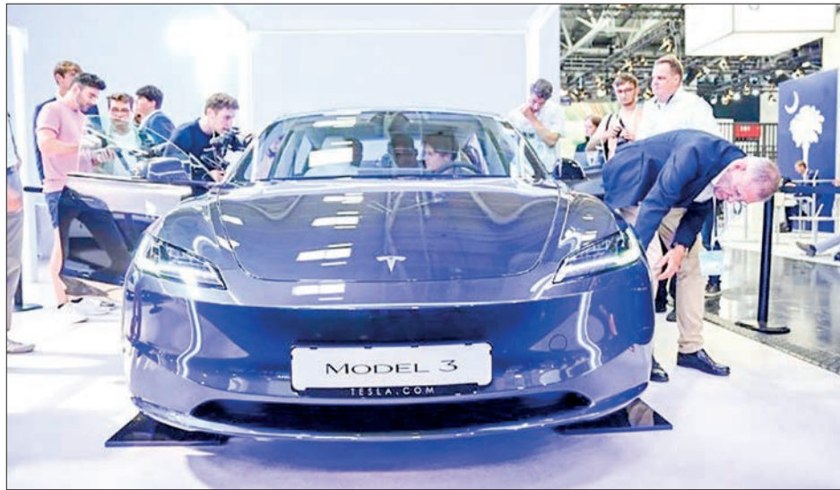
Visitors inspect a Tesla model 3 car on display at the International Motor Show held in Munich, southern Germany, on 4 September 2023.

The price cuts have made investors nervous