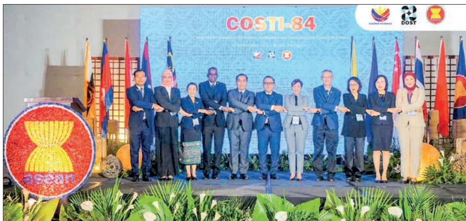
The group documentary photograph of the COSTI-84 in the Philippines on 16-20 October 2023.