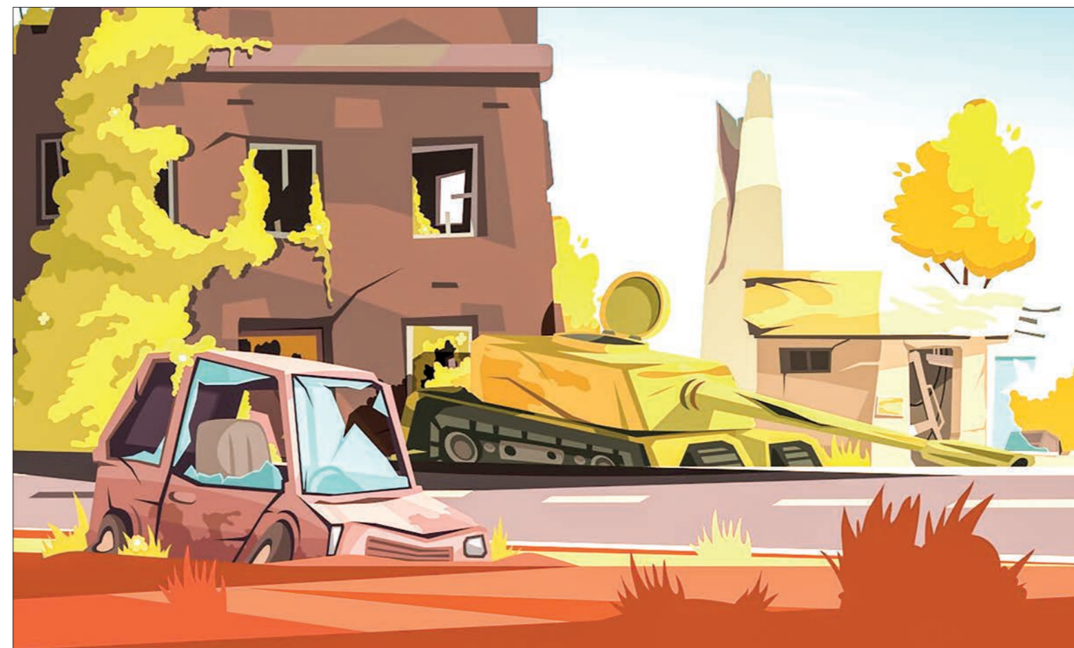
Ongoing conflicts in the Middle East have been particularly intense and long-lasting. The Israel war has broken out amid the Ukraine war.

Gaza Strip again would be a "big mistake", US President Joe Biden said, and we all should notice his unrealistic words.