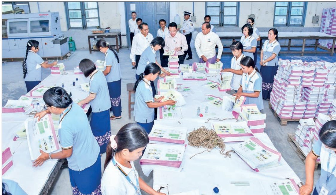
Union Minister U Maung Maung Ohn inspects the printing process for school textbooks in Chanmyathazi Township, Mandalay Region on 20 October 2023.

During the knowledge augmentation, the Union minister highlighted the progress in the current political, economic and social sectors of the country, efforts of the government for prosperity and food security of the nation, the construction of the Maravijaya Buddha Image, the 75 th Anniversary of Union Day, Diamond Jubilee Independence Day, State-level ceremonies, exhibitions, competitions and festivals, rehabilitation activities after Cyclone Mocha under the