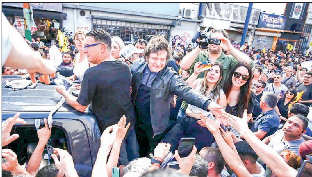
Javier Milei (center) greets supporters during a campaign rally on 16 October in Lomas de Zamora, Buenos Aires province, Argentina.

The presidential election on Sunday is happening while Latin America's third-largest economy is struggling with nearly 140% annual inflation and 40% of the population living in poverty.