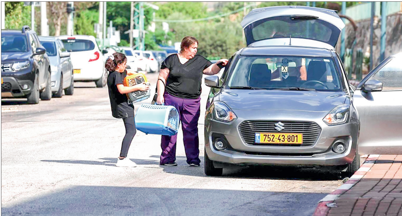
A woman and a girl hold pet carriers and other belongings as they prepare to depart from Kiryat Shmona in northern Israel near the border with Lebanon on 19 October 2023.

Israeli authorities are evacuating northern frontier communities, with an influx of reservists, tanks, and armoured vehicles into the region.