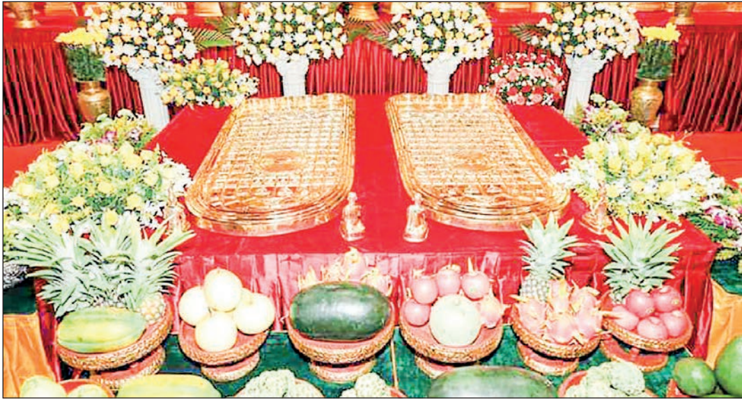
The two Nawalawha Yadanapada Buddha's Footprints.