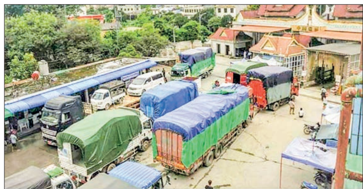
Export cargo loaded lorries are pictured on the Myanmar-China border.

The main export items are green gram, onion, cotton, eel, peanut, zinc mineral, gum karaya, corn, frozen crab, crab, broken rice, rice, cashew nut, sesame and plum. Meanwhile, vehicles and machinery, motorcycle parts under a Semi-knocked-down system, petrol, nickel, iron rods, batteries, battery cycle, footwear and carbon powder are primarily imported into the country. — NN/EM