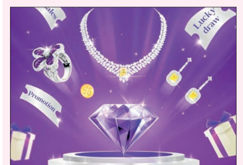
An advertisement for the jewellery festival to be held in Times City.

Shops will offer special discounts, ranging from 3 to 50 per cent, as part of their customer promotion efforts. Additionally, the festival organizers will include valuable lucky draw prizes to express their gratitude to the buyers who take part in the jewellery fair. — TWA/CT