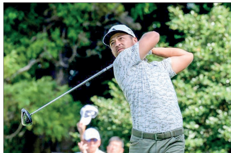
Xander Schauffele had three bogeys before hauling himself back in contention at 4-under.

Schauffele had three bogeys before hauling himself back in contention at 4-under, and the Tokyo Olympics champion said the conditions were "hard" to deal with. "It seemed to be a lot of crosswinds on most of the holes — made it hard to hit it close," he said. — AFP