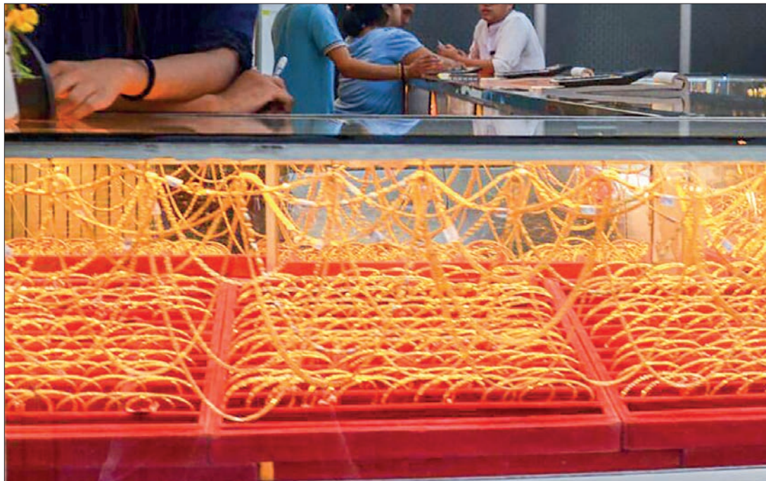
A snapshot of gold jewellery items at the gold outlet in Yangon.

THE spot gold price rallied to US$1,980 per ounce, prompting the Yangon Region Gold Entrepreneurs Association (YGEA) to set the reference price at another high of around K3.1 million per tical (0.578 ounce or 0.016 kilogramme) on 20 October.