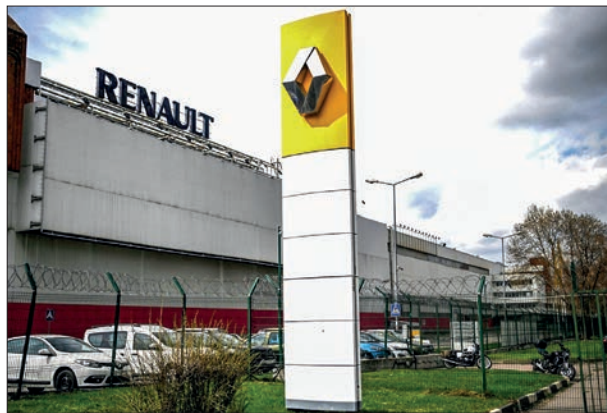
Renault confirmed its outlook for 2023, with cash flow equal or above 2.5 billion euros and an operating margin of between seven and eight per cent.

as the group's third-quarter sales performance disappointed investors.