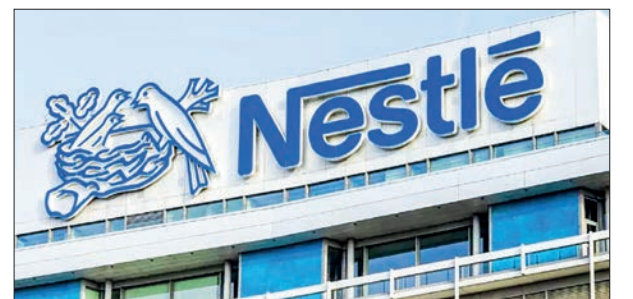
Nestle has slowed its price increases as they reached 8.4 per cent over the nine-month period after rising by 9.5 per cent in the first six months of the year. PHOTO: AFP

growth — which excludes currency fluctuations and acquisitions — rose 7.8 per cent as the company raised prices. — AFP