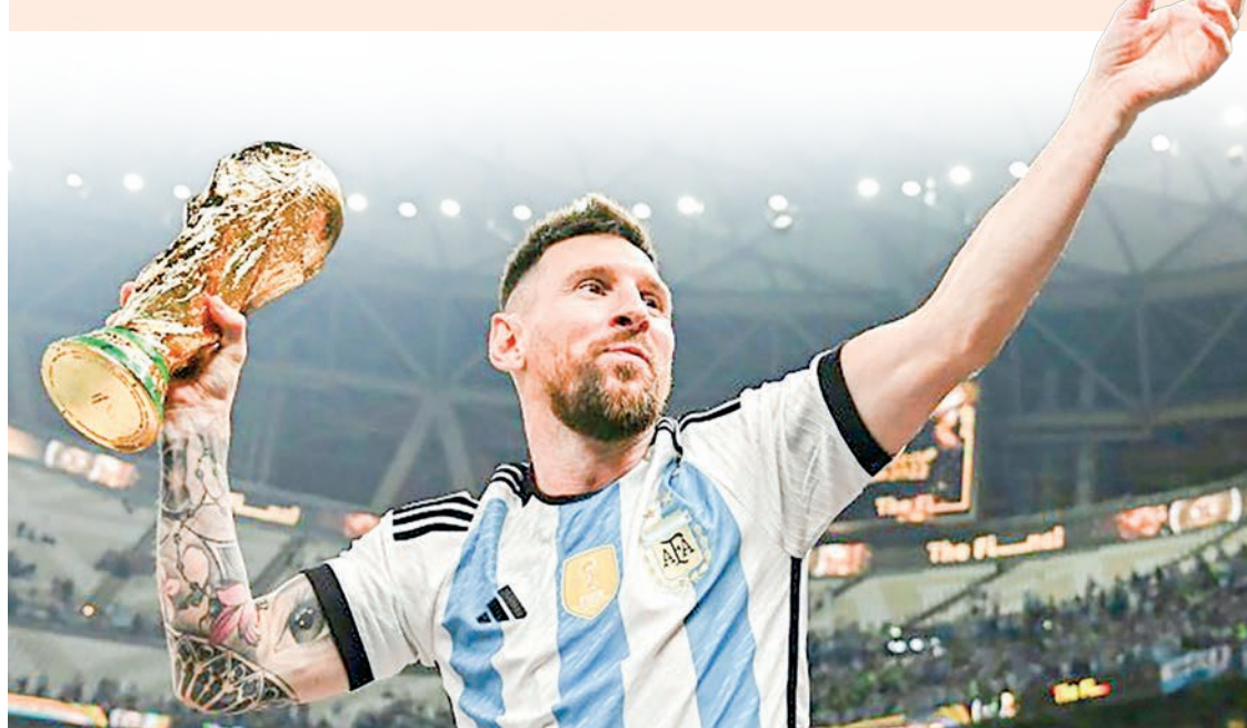
Lionel Messi poses with the World Cup trophy.

Messi, who moved from Paris Saint-Germain to Inter Miami, is the favourite to win the Ballon d'Or for an eighth time, having led Argentina to World Cup victory. Haaland is a strong contender, with 52 goals in 53 games for Manchester City's treble-winning season.