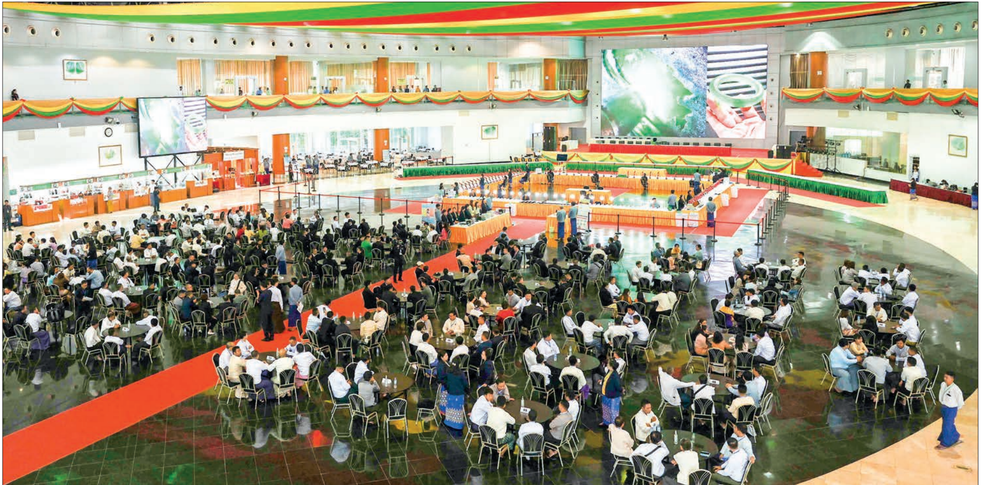
A sweeping overview of the Mid-Year Myanmar Gems Emporium 2023 in Nay Pyi Taw, unfolding on 20 October 2023.