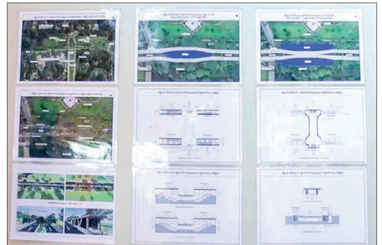
The scale model of the underpass to be built was shown in photographs at the groundbreaking ceremony held on 19 October.