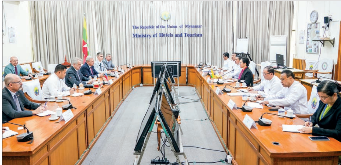
The Russian delegation calls on Union Minister Dr Thet Thet Khine yesterday in Nay Pyi Taw.

tourism cooperation, cooperation on human resource development, visiting tourist