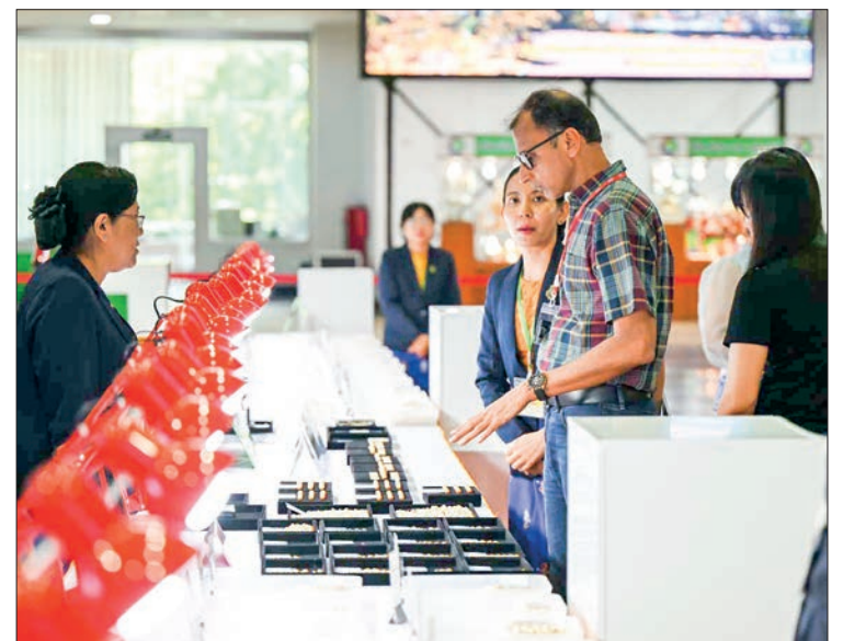
A gem trader viewing pearl lots at the Mid-Year Gems Emporium 2023 yesterday in Nay Pyi Taw.

At the emporium, 300 pearl lots, 160 gem lots, and 4,025 jade