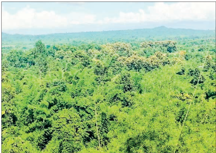
An aerial view of the Monghein Forest.

Best International Travel and Agency is a company that promotes tours for Thai tourists to Myanmar and tours to more than 30 countries around the world. It also records local television videos of Myanmar's trips and televises on Thai media such as Thai Channel 5, Thairath, Workpoint and Mono 29. — MNA/TS