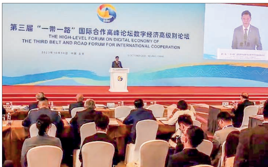
Deputy Prime Minister MoTC Union Minister General Mya Tun Oo speaks on the occasion of the High-Level Forum on Digital Economy in Beijing on 18 October.

tended the opening ceremony of the forum at China Great Hall and delivered a keynote speech on 18 October. At noon, the Myanmar delegation attended the High-Level Forum on Digital Economy held at the China National Convention Centre (CNCC).