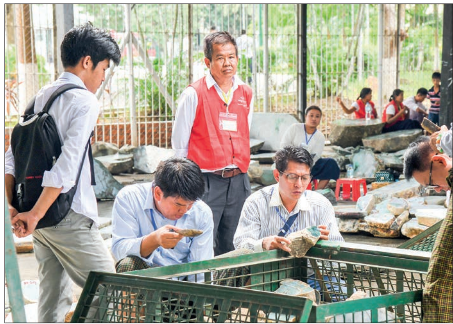
Gem merchants evaluating jade lots at the emporium yesterday.

The deputy minister, the director-general, senior officials and a total of 120 staff members joined this programme.— MIFER