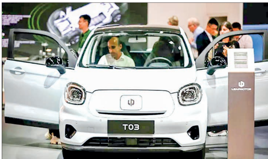
Stellantis will pay China's Leapmotor $1.6 billion for a 20 per cent stake.

The two firms will also establish a Stellantis-led joint venture, Leapmotor International, which will hold "exclusive rights for the export and sale, as well as manufacturing, of Leapmotor products outside Greater China", Stellantis said. — AFP