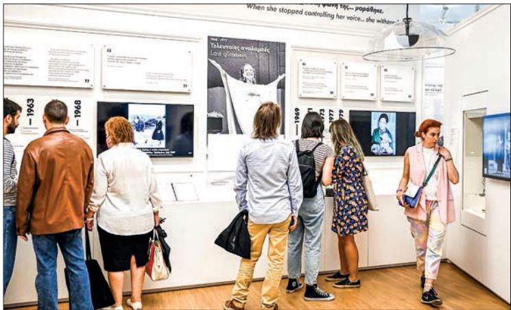
Visitors stand in one of the rooms of the Maria Callas Museum during its official opening.

A listed four-storey building from the 1920s that previously housed a hotel, the custard-coloured museum near central Syntagma Square took over a decade to complete at a cost of 1.5 million euros ($1.6 million). — AFP