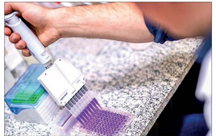
Scientists say the vaccine is aimed at recovering addicts who are off cocaine and want to stay that way.

The project won top prize last week—500,000 euros