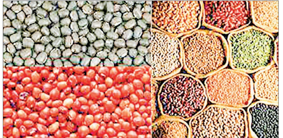
The photo shows various beans including black grams and pigeon peas being organized for sale in the market.

gram, green gram and pigeon peas to foreign markets. Of them, black gram and pigeon peas are mostly shipped to India while green grams are exported to China and Europe.