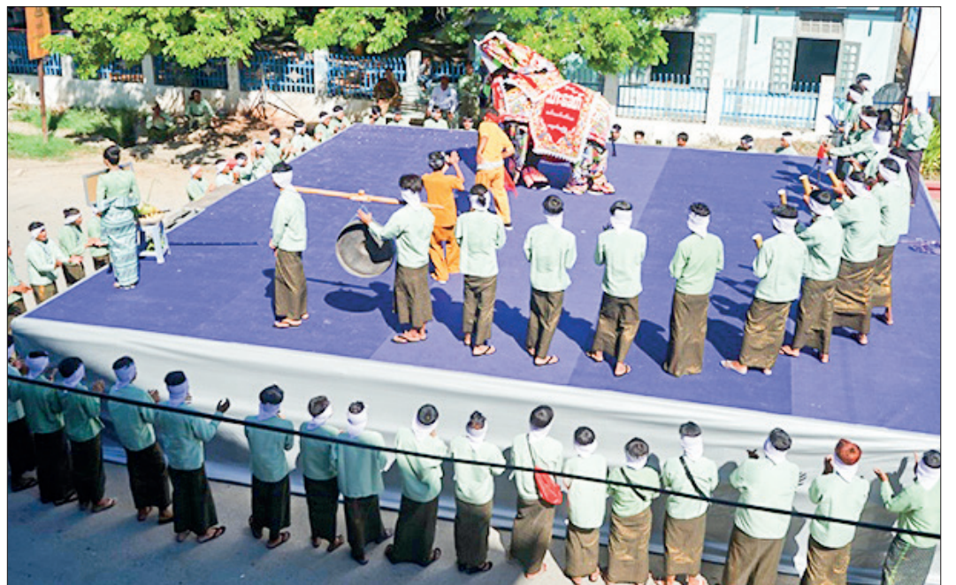
The Elephant Dance Festival was held in the previous year in Kyaukse.

A total of 17 elephant dummies will participate in the competition, and the winning teams will be awarded prizes and certificates of honour after the competition, according to the festival organizing committee.