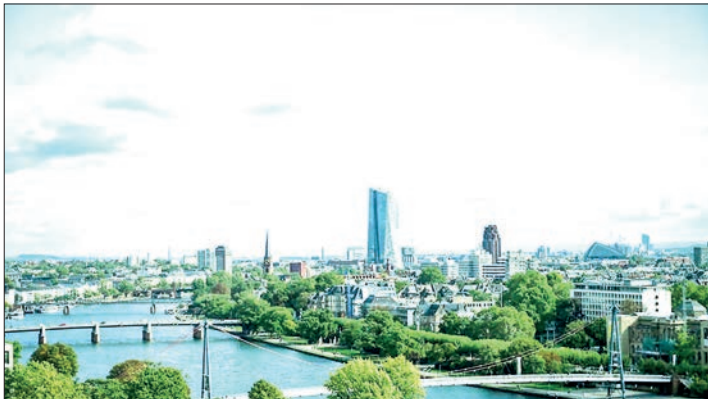
The ECB has cranked rates up by 450 basis points to tackle inflation since July 2022.

EUROPEAN Central Bank policymakers are widely expected to leave interest rates unchanged when they meet in Athens on Thursday, as their previous policy moves seemed