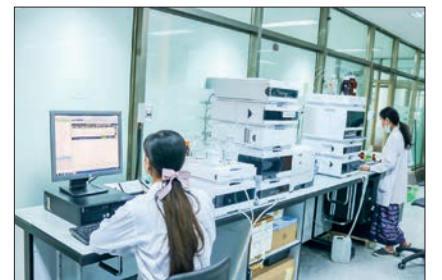
Import Health Certificate for imported food obligatory: FDA