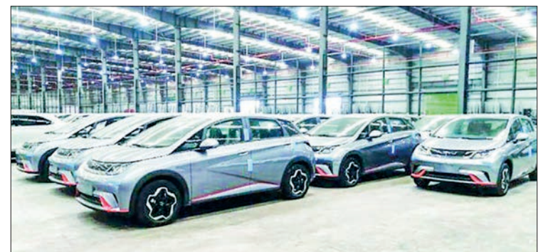
Imported electric vehicles seen in August 2023.