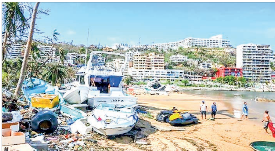
View of damages in the beach area following the passage of Hurricane Otis in Acapulco, Guerrero State, Mexico, on 26 October 2023.

The storm was the most powerful to ever make landfall on the Central American nation, and broke records with its rapid intensification in the hours before striking the Guerrero coast.