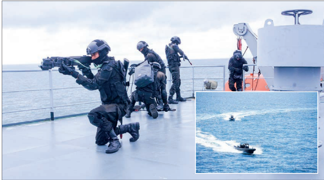
The photo shows the naval exercise named Sea Shield-2022 conducted on 5 July 2022.