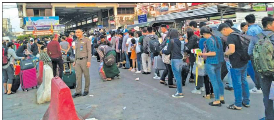
Myanmar nationals and workers are seen waiting to enter Thailand through the Myawady border.

According to the decisions made by the Thai government in early October, Myanmar migrant workers in Thailand have been allowed to live and work temporarily from 1 October 2023 to 13 February 2025.