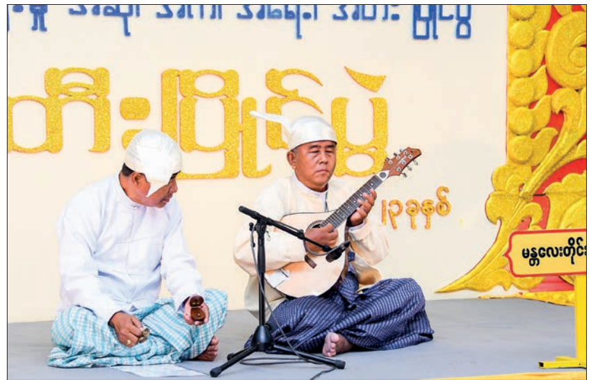
At the mandolin competition.