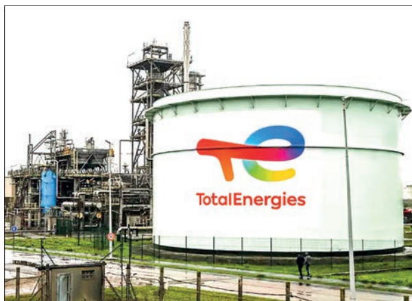
While oil prices are still high in historical terms, the main crude oil contract was down 14 per cent last quarter compared to the same period last year, TotalEnergies.

"This quarter again demonstrates the relevance of TotalEnergies' profitable transition strategy," said chief executive Patrick Pouyanne. — AFP