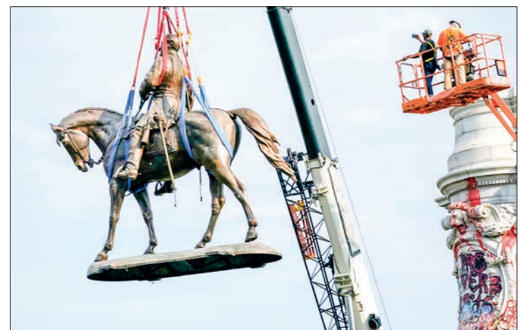
The towering bronze statue of General Robert E Lee, who commanded the Army of Northern Virginia during the bloody 1861-65 conflict, was removed in July 2021 from a public park in Charlottesville, Virginia.

The Charlottesville violence gave new life to a campaign to remove Confederate symbols which first gained momentum following the June 2015 murders in South Carolina of nine black churchgoers by another white supremacist. — AFP