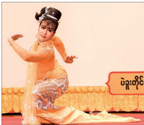
At the dancing competition.