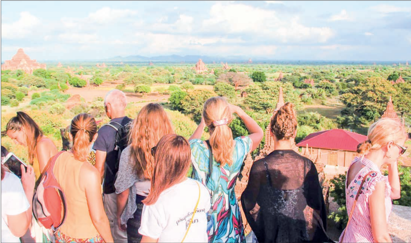
Foreign tourists admire panoramic twilight view at the Bagan Ancient Cultural Zone pagoda.