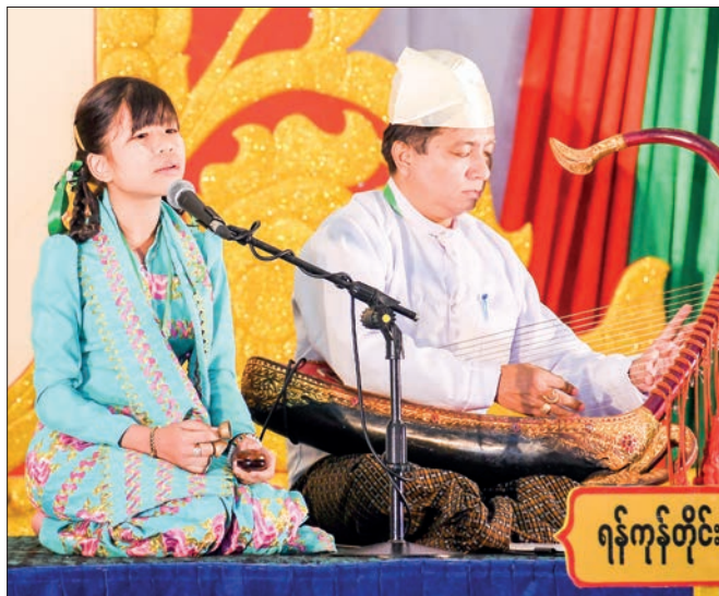
At the Maha Gita singing contest.

State Administration Council members, the chairman of the Constitutional Tribunal of the Union, Union-level officials, deputy ministers, ministers for Ethnic Affairs and Ministers for Social Affairs of regions and states, advocates-general, relevant officials, departmental staff