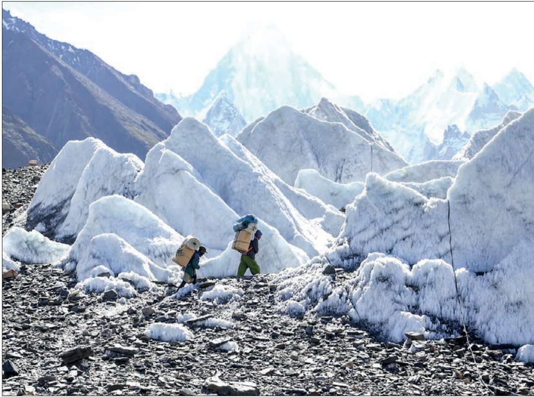
Pakistani porters hike the Baltoro Glacier, 14 July 2023.