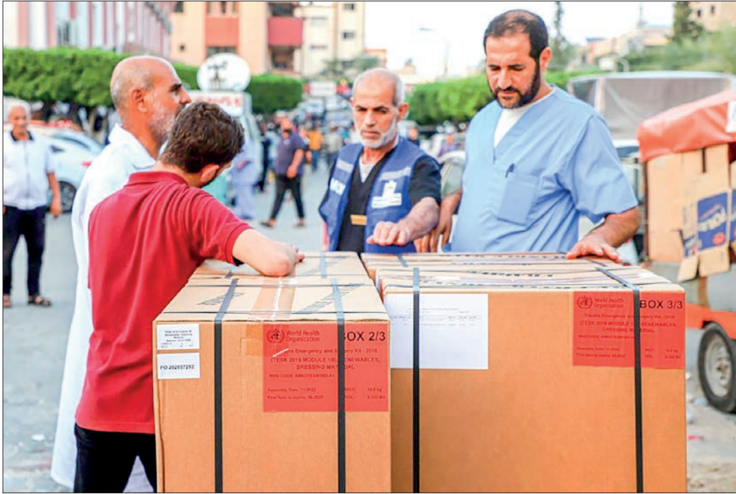
People receive a batch of humanitarian supplies that entered Gaza from the Rafah crossing in Khan Younis, southern Gaza Strip, on 23 October 2023.

HERE are key developments from the past 24 hours: