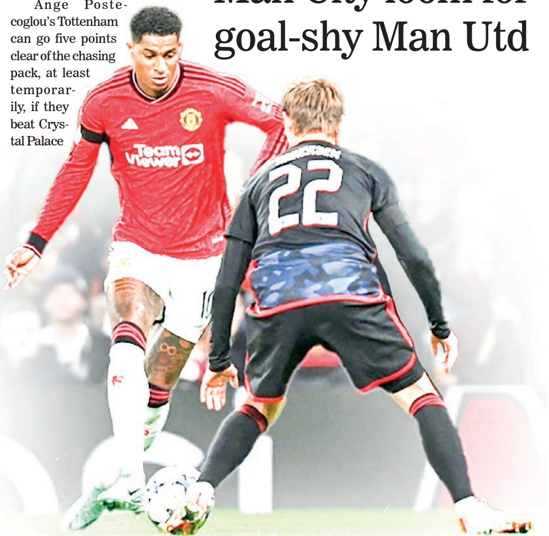
Manager Erik ten Hag predicted earlier this month that Rashford would soon be "on fire", but the 25-year-old has failed to score for United since then, though he netted for England at Wembley.