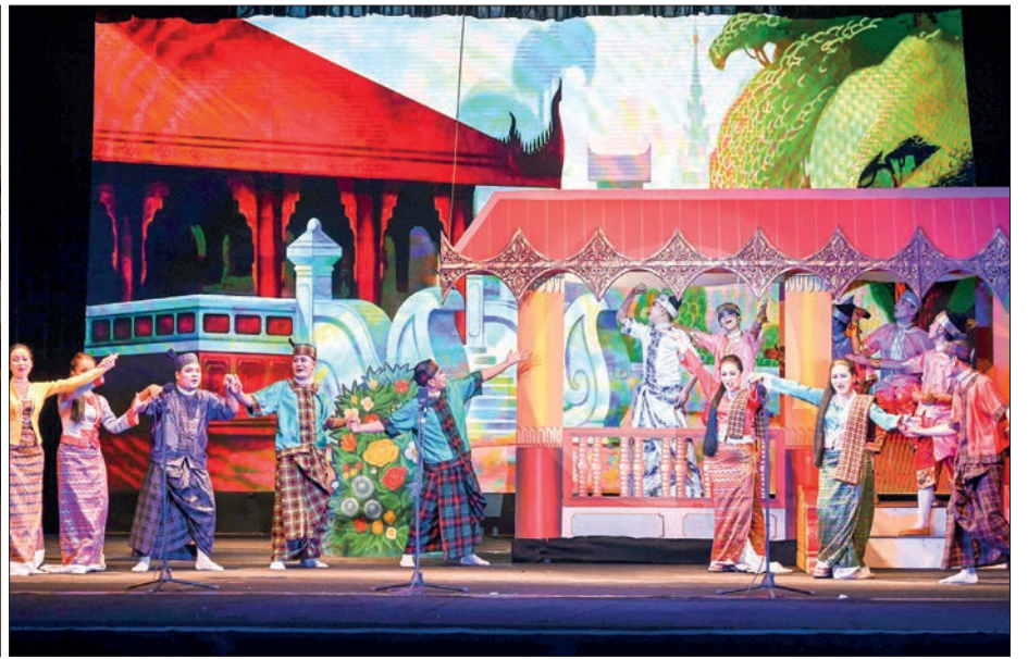
State Administration Council members and dignitaries watch the Mahawthahta drama competition performed by the Ayeyawady Region cultural troupe yesterday.

The 24 th Myanmar Traditional Cultural Performing Arts Competition (Central Level) continued for the fourth day at designated venues in Nay Pyi Taw yesterday.