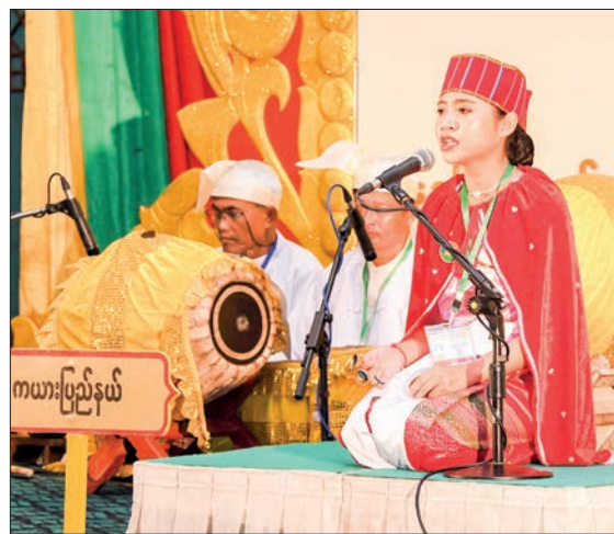
At the singing contest.

and parents of contestants attended the competitions.