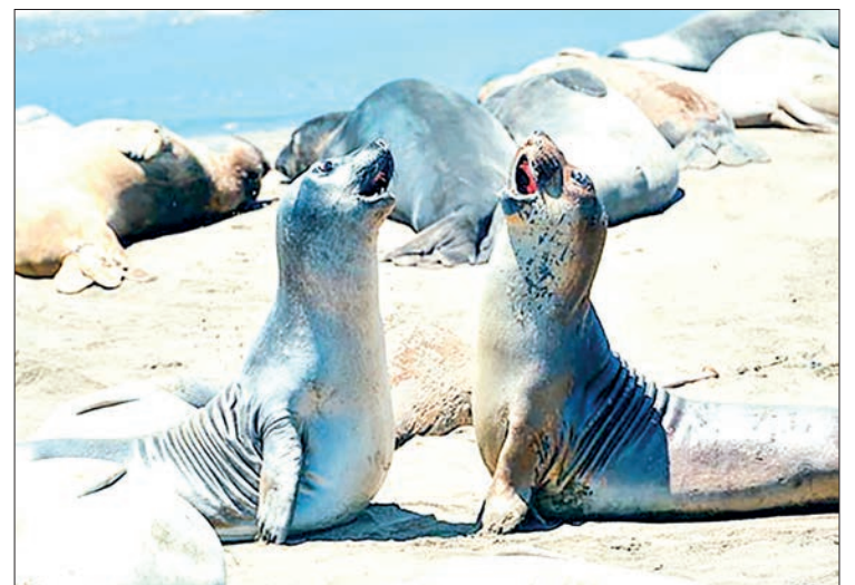
Animals near Brazil's border with Uruguay also recently reported hundreds of seals and sea lions killed by avian flu. PHOTO: AFP

The Rio Grande do Sul agriculture department said the dead seals and sea lions had been found at various points along its coast. — AFP