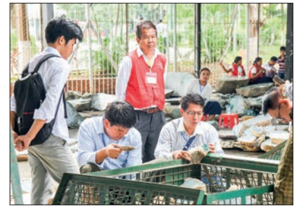
8 th Day of 2023 Mid-Year Gems Emporium: 999 jade lots sold out