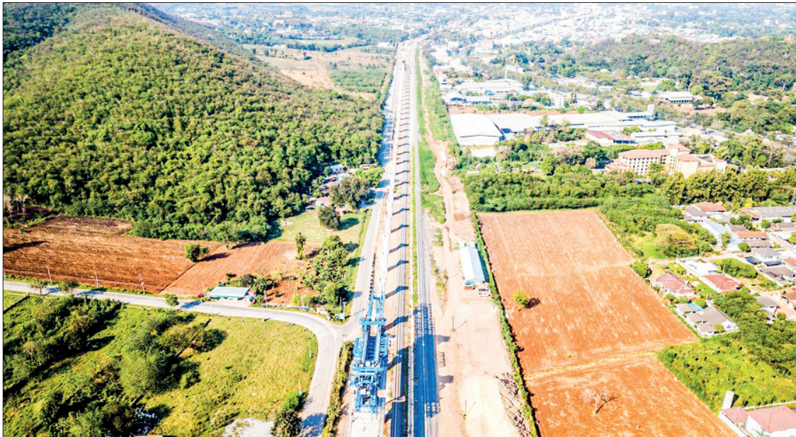
This aerial photo taken on 23 February 2023 shows a construction site of the China-Thailand railway in Nakhon Ratchasima province, Thailand.

Thailand plans to build a train system connecting Bangkok to Khon Kaen, Nong Khai, and reaching China, in support of the Belt and Road Initiative.