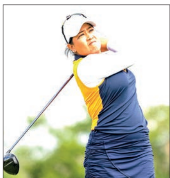
Jasmine Suwannapura of Thailand.

Suwannapura's 12-under 132 through two rounds kept her one shot ahead of American Rose Zhang, who shot up to second after shooting a 68 on day two. France's Celine Boutier shot the lowest score of the round with a 64 courtesy of nine