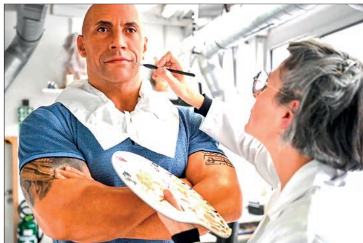
An employee at the Grevin Museum adjusts the skin tone on the wax effigy of Dwayne "The Rock" Johnson.

Dwayne Johnson, who is of Samoan and black origin, took to Instagram to joke about the Grevin Museum's wax figure.