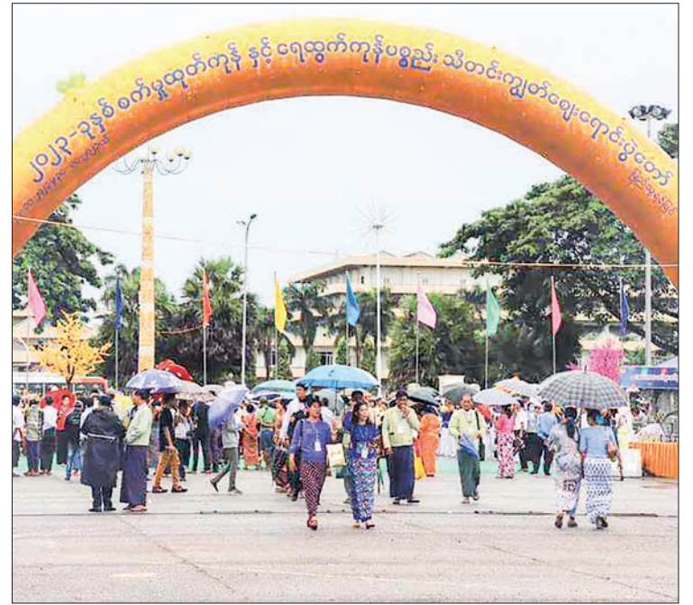
The opening ceremony of the Thadingyut Festival Expo is seen.

THE Yangon Region chief minister said that products produced by businesses in the region and state can be purchased in one place at a low price at the People's Square Thadingyut Festival Expo.