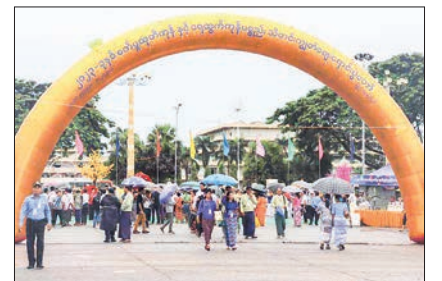
Local products to be sold at fair prices at Thadingyut Festival Expo