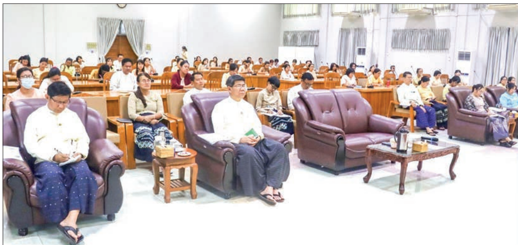
Union Minister Dr Kan Zaw opens the 35 th Friday Talk yesterday in Nay Pyi Taw.

The Union minister pointed out that the title of the 35 th Friday Talk is the topic “The Importance of Knowledge Sharing Programme and Factors Influencing the Knowledge Sharing Programme”, and most people accept that knowledge is the connection between humans and psychology. He emphasized that newly developing countries are striving to achieve food security similar to developed countries. They prioritized industrialization for national economic devel-