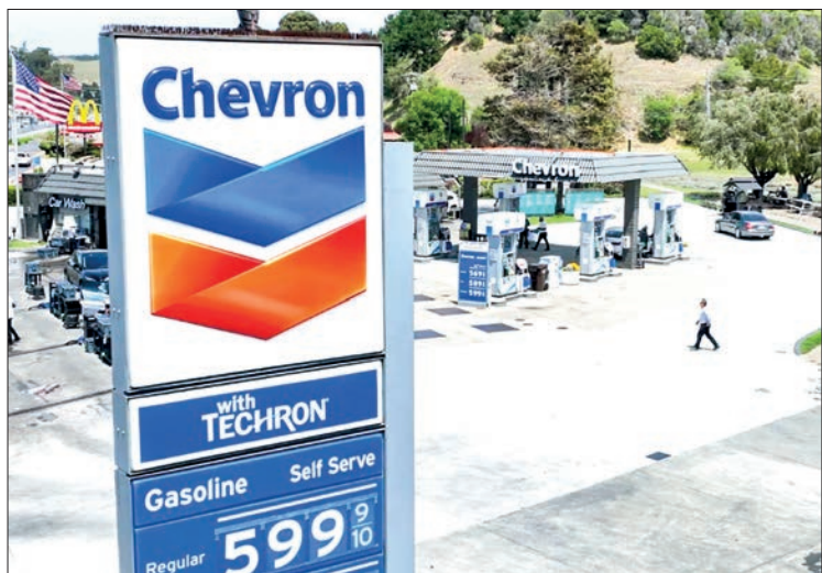
Chevron scored profits of $6.5 billion, down 42 per cent from the year-ago level.

EXXONMOBIL and Chevron reported lower profits Friday compared with the year-ago blowout quarter as the oil giants touted recent acquisitions they said balance economic and environmental priorities.