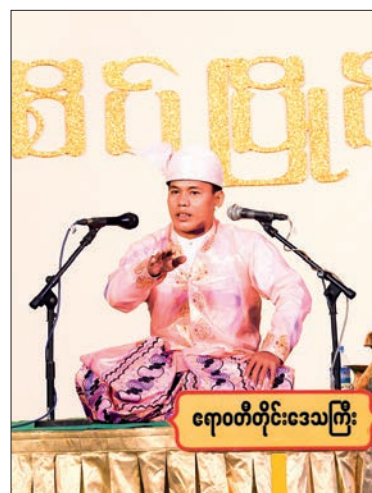
In the second-class amateur narration of stories competition.

Myanmar orchestra troupe competition, “Narration of religious or historical stories” competition, marionette troupe competition, and Mahawthahta drama competition which took place at designated venues yesterday.