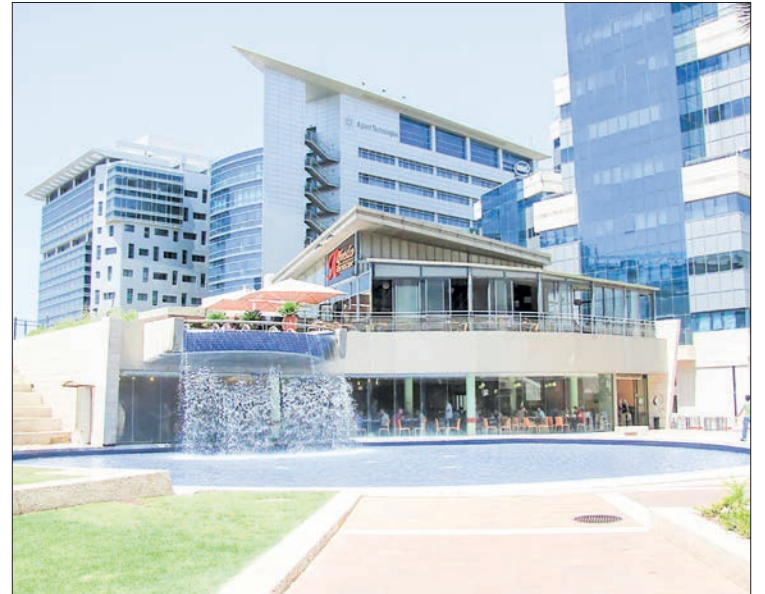
Part of Azorim High-Tech park in Kiryat Arie industrial area, Petah-Tikva, Israel. PHOTO: PIX FOR VISUAL PURPOSE/ WIKIPEDIA

From software development to chip manufacturing, all of the global players in the industry are present to tap into the country's rich ecosystem. — AFP