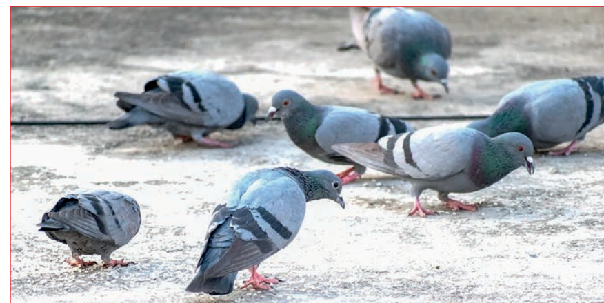
A recent study revealed that pigeons tackle problems similarly to artificial intelligence, enabling them to excel in challenging tasks that might stump humans.

are remarkably similar to the same principles that guide modern machine learning and AI techniques," Turner