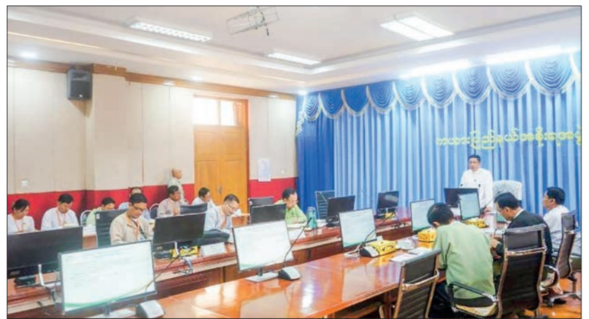
The file photo shows the Kayah State Investment Committee's 3/2023 meeting being held on 25 August 2023.

The state chief minister said that priority should be given to investment in modern livestock industries, and efforts should be made to produce, distribute and sell quality local products. — TWA/KZL