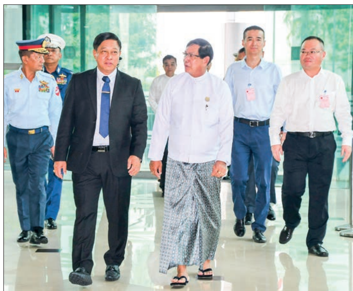
Union Minister Admiral Tin Aung San seen before leaving for China yesterday.