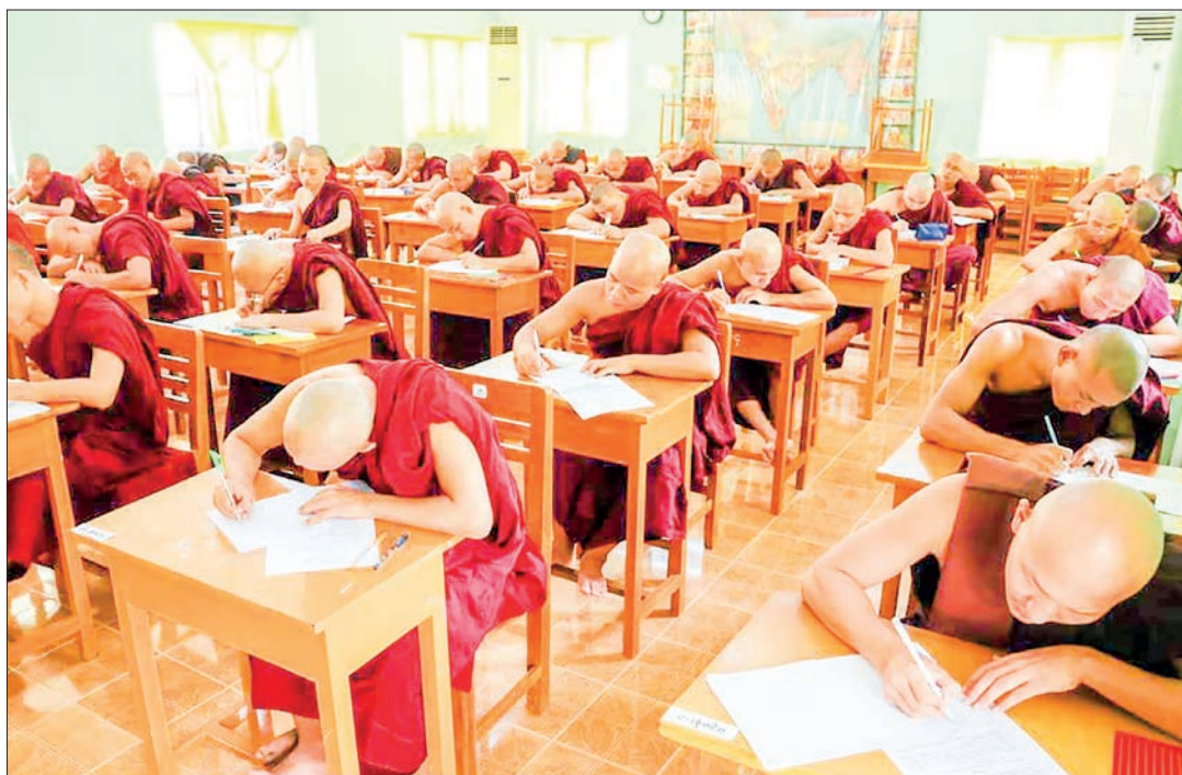
Members of Sangha take Sasana Taksila Dhamma Cariya exam for the 1384-1385 ME (2022-2023) academic year at the State Pariyatti Sasana University (Mandalay).

ADMISSION applications for the 2023-2024 academic year at the State Pariyatti Sasana University (Yangon and Mandalay) will be available starting from 7 November, as announced by the Department of Promotion and Propagation of the Sasana.