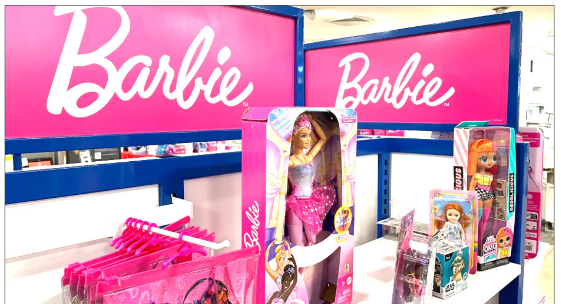
Barbie merchandise is displayed at a Macy’s store on 25 July 2023 in Corte Madera, California.

The third-quarter results surpassed analyst expectations, driven by the success of the “Barbie” franchise.