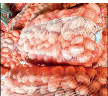
Kyukok garlic, China's potato prices on the rise