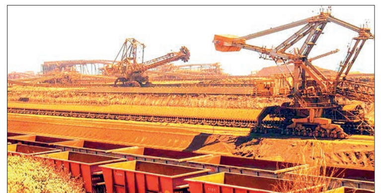
File image of an Australian iron ore mine.

In July, the two parties failed to reach an agreement during talks in Brussels, with Australia saying it had not been guaranteed "significant" access to the European market for its agricultural products. — AFP