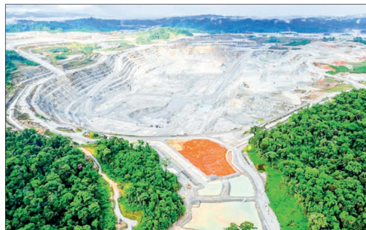
The Cobre Panama mine in Panama.

In a televised address, the president said the government had issued a decree "declaring a ban on granting new metallic mineral concessions throughout the country." Cortizo made no mention of the controversial contract with First Quantum Minerals, the Vancouver-based company whose Caribbean copper mine sparked demon-