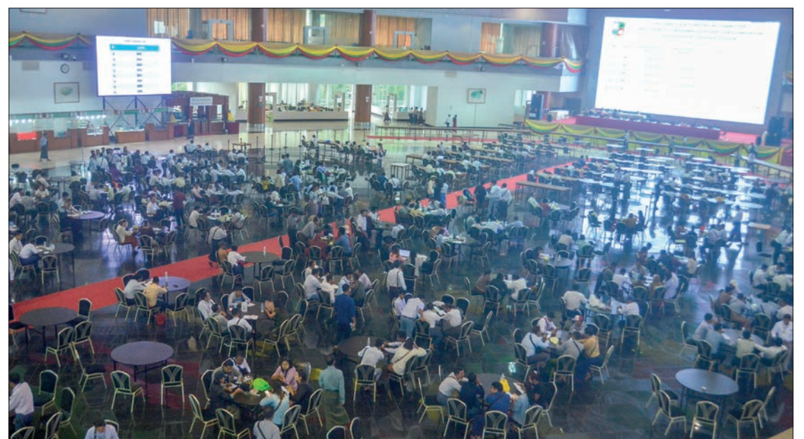
The general view of the 2023 Mid-Year Gems Emporium at its concluding event yesterday.

The 2023 Mid-Year Myanmar Gems Emporium was successfully organized by the Myanmar Gems Emporium Central Committee from 20 to 28 October at Maniyadana Jade Hall, aiming to not only generate foreign income and economic benefits for the country but also to improve the MSME industries. — MNA/MKKS