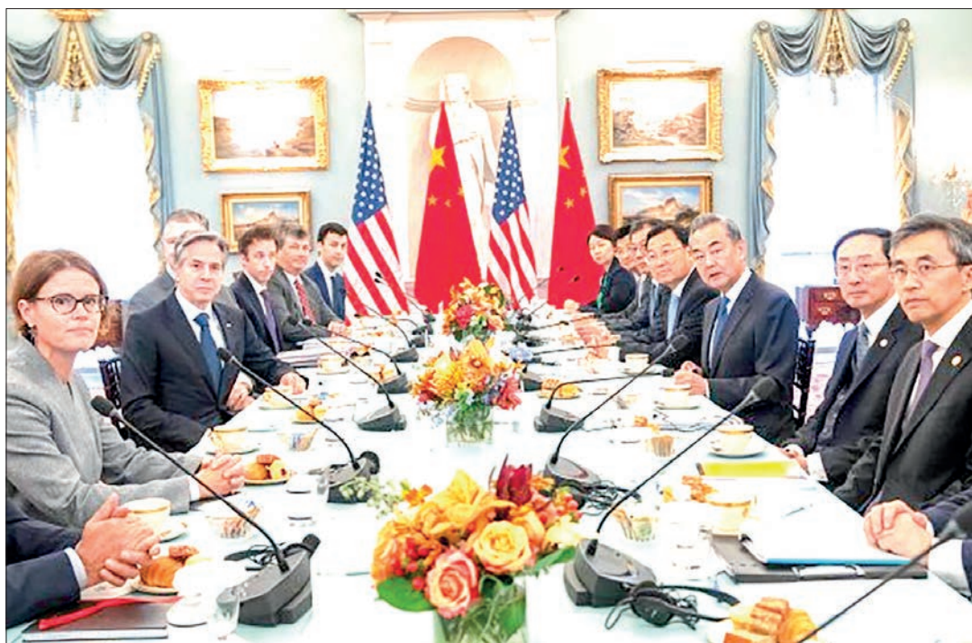
Wang Yi, a member of the Political Bureau of the Communist Party of China Central Committee and Chinese foreign minister, held two rounds of talks with US Secretary of State Antony Blinken in Washington, DC, the United States, on Thursday and Friday.