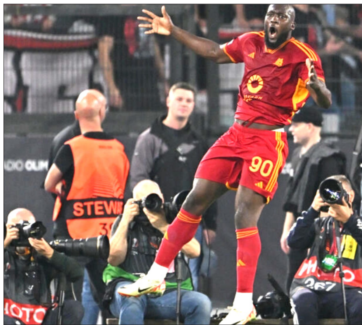
Romelu Lukaku has been in fine form for Roma scoring eight goals since joining on loan in the summer.

Inter Milan fans are prohibited from distributing whistles to make noise in response to Romelu Lukaku's return with Roma, citing public safety concerns, despite their readiness to create a commotion at the game.