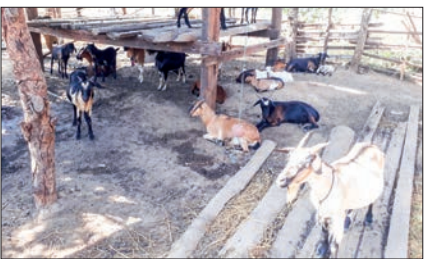
National livestock census set for Nov in 215 townships of 13 states/regions