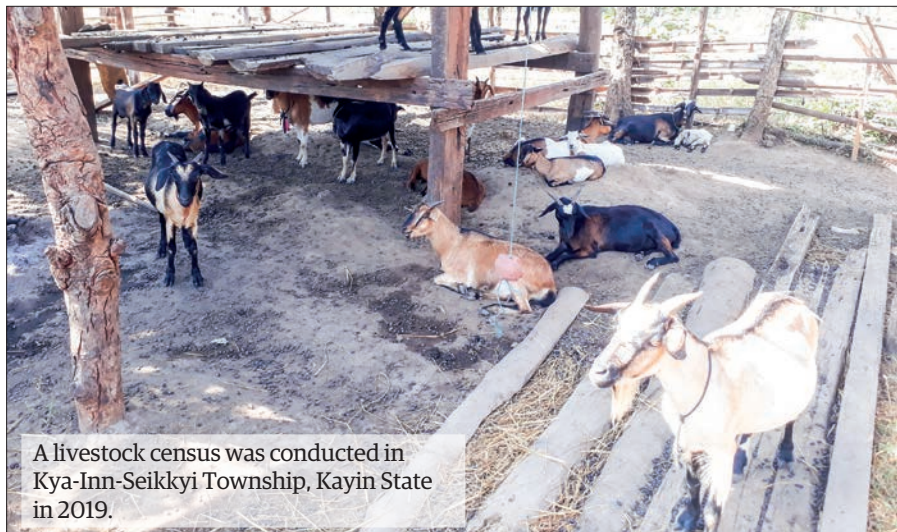
A livestock census was conducted in Kya-Inn-Seikkyi Township, Kayin State in 2019.

THE national livestock population census will be enumerated in 215 townships in 13 regions/states in November. This information comes from the National Livestock Census Central Committee in the Ministry of Agriculture, Livestock and Irrigation.