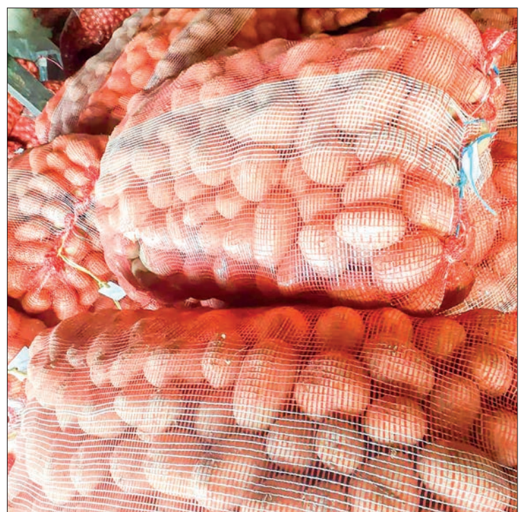
The photo shows bags of Chinese potatoes.

The Sinphyukyun potatoes are especially grown in October and November and harvested in January and February.