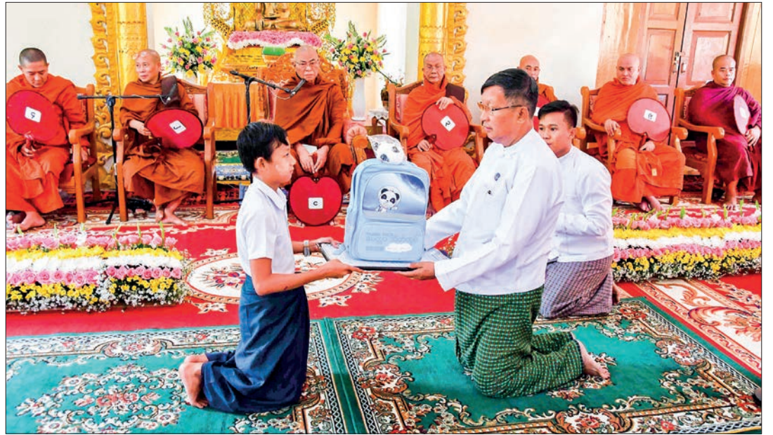
Union Minister U Tin Oo Lwin presents a panda pack to the schoolboy from the monastic school in Nay Pyi Taw yesterday.

At the ceremony, the Union minister and party also offered a day meal to Sayadaws.