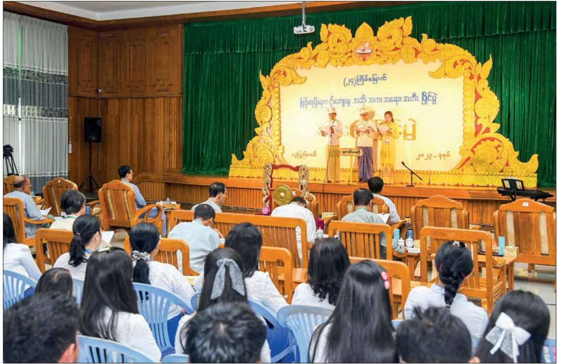
At the Basic Education level (aged 15-20) song composing competition in Nay Pyi Taw yesterday.

THE 24 th Myanmar Traditional Cultural Performing Arts Competition (Central Level) continued for the fifth day at designated venues in Nay Pyi Taw yesterday.