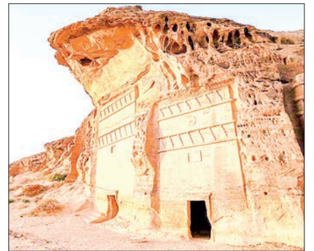
Thales and Afalula collaborate to provide 24/7 surveillance and control for Al'Ula's public sites and archaeological buildings.

Group member Seungri retired from show business in 2019 amid mounting criminal investigations, and was later sentenced to 18 months in prison for offering up women to potential investors for sexual services, among other charges. — AFP