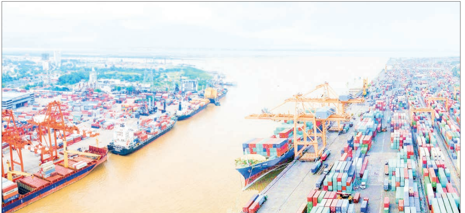
An aerial view of Yangon Port with container vessels loading and discharging export and import cargoes on the Yangon River.

After the new navigation channel (Kings Bank Channel) accessing the inner Yangon Riv-