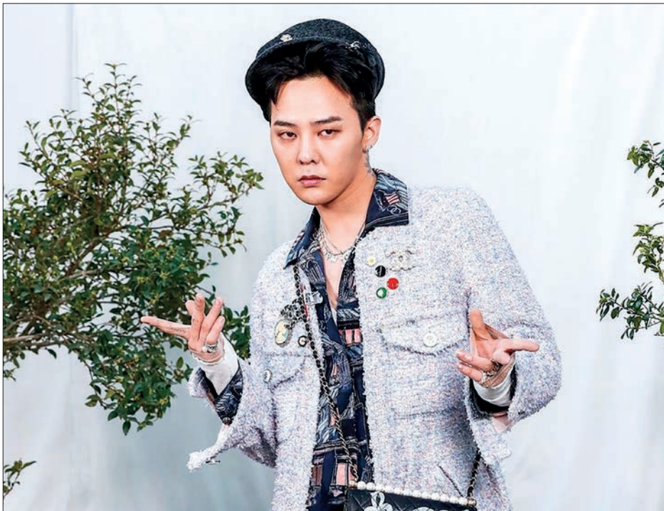
K-pop star G-Dragon from BIGBANG is being investigated for alleged drug use.

K-pop star G-Dragon — of the wildly successful but problem-plagued band BIGBANG — is under investigation for alleged drug use, police said Thursday, becoming the latest in a string of South Korean entertainers to face such a probe.