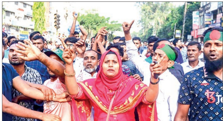
Bangladesh Nationalist Party (BNP) supporters rally in Dhaka, demanding that Prime Minister Sheikh Hasina step down to allow a free and fair election under a neutral government on 28 October 2023.

Hasina — daughter of the country's founding leader — has been in power for 15 years and has overseen rapid economic growth with Bangladesh overtaking neighbouring India in GDP per capita, but inflation has risen and her government is accused of corruption and human rights abuses. — AFP