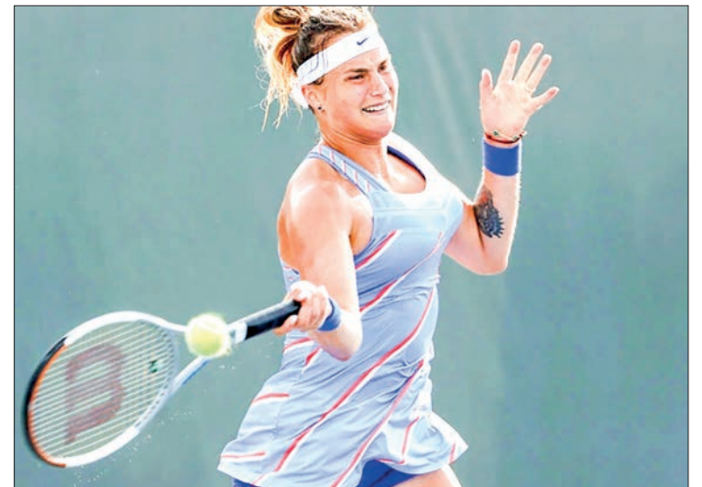
Top-ranked Aryna Sabalenka of Belarus will try to claim the year-end world number one ranking at the WTA Finals in Mexico

TOP-RANKED Aryna Sabalenka will try to hold off Poland's second-placed Iga Swiatek for the year-end world number one spot when the WTA Finals begin Sunday at Cancun, Mexico.