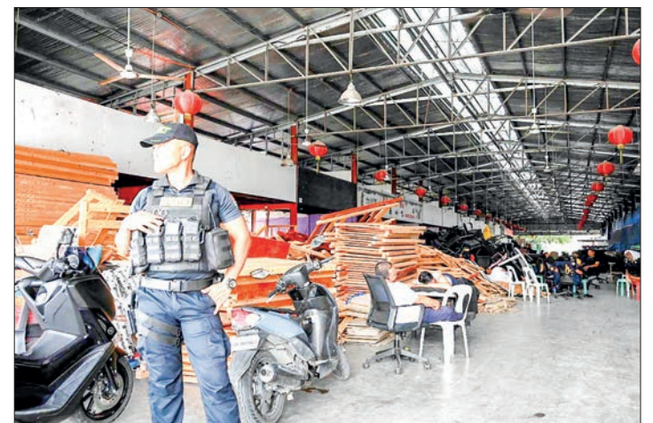
A policeman stands guard inside a compound, where police raided buildings in Metro Manila on 27 June 2023.

The Chinese embassy has been asked to help to identify nine people suspected of run-