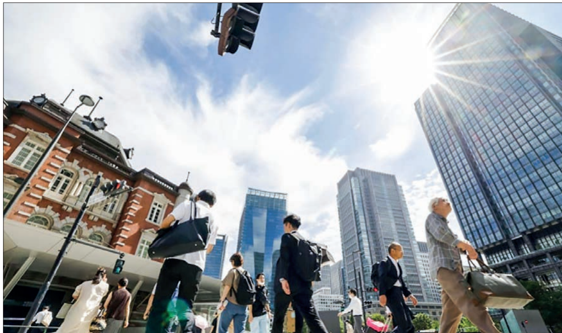
Approximately 93 per cent of Japanese companies increased employee wages in 2022 to retain them in the face of labour shortages.

The think tank said about 68 per cent of respondents implemented wage increases in a bid to improve the motivation of workers and enhance their benefits, while around 42 per cent of the firms answered that salary raises were necessary to address staff shortages. Among companies that did not boost wages, 70 per cent of them attributed their decision to business sluggishness, the think tank said, adding that some of them suffered an economic slump amid the COVID-19 pandemic that began in 2020. — Kyodo