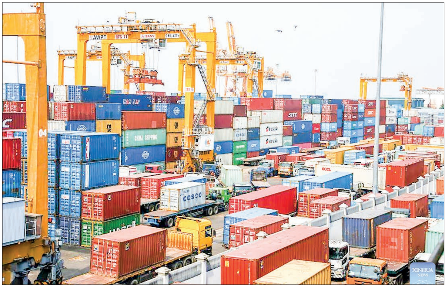
A panoramic scene of Yangon Port's container yard with terminals in the background.