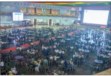
2023 Mid-Year Gems Emporium winds down