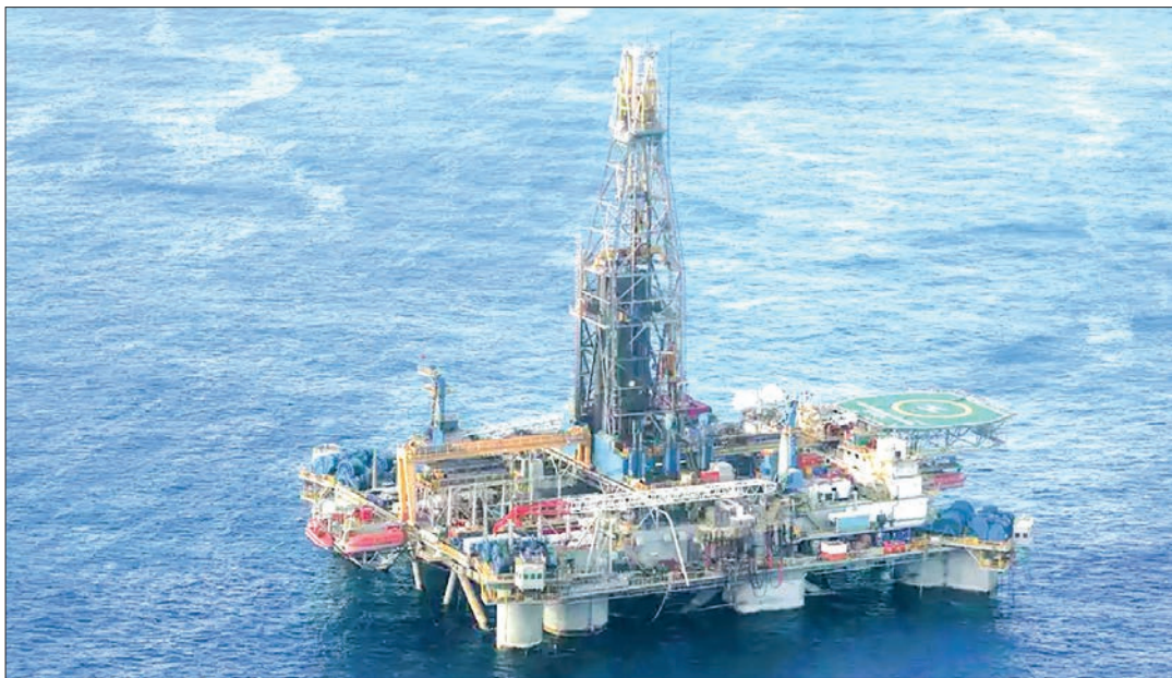
US energy giant ExxonMobil has discovered a huge natural gas reserve off the coast of Cyprus, Cypriot authorities said on 28 February 2019, a find that could raise tensions with nearby Türkiye.

GUYANA on Thursday announced a "significant" new oil discovery in an area claimed by neighbouring Venezuela and said it had awarded bids to eight companies, foreign and local, to drill for crude in its waters.