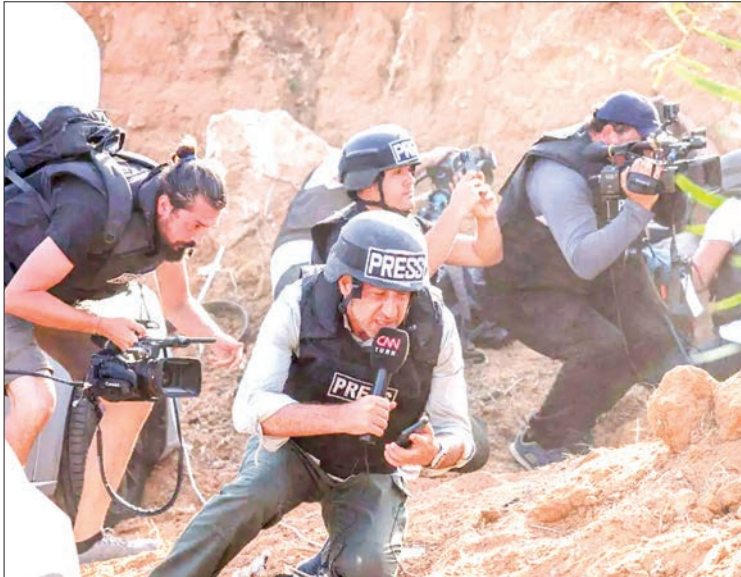
Reporters take cover upon hearing sirens warning of an incoming rocket attack from Gaza, in the southern Israeli city of Sderot, on 23 October 2023.

Lavrov emphasizes the importance of not destroying Gaza, as it would result in a humanitarian catastrophe for the civilian population there.