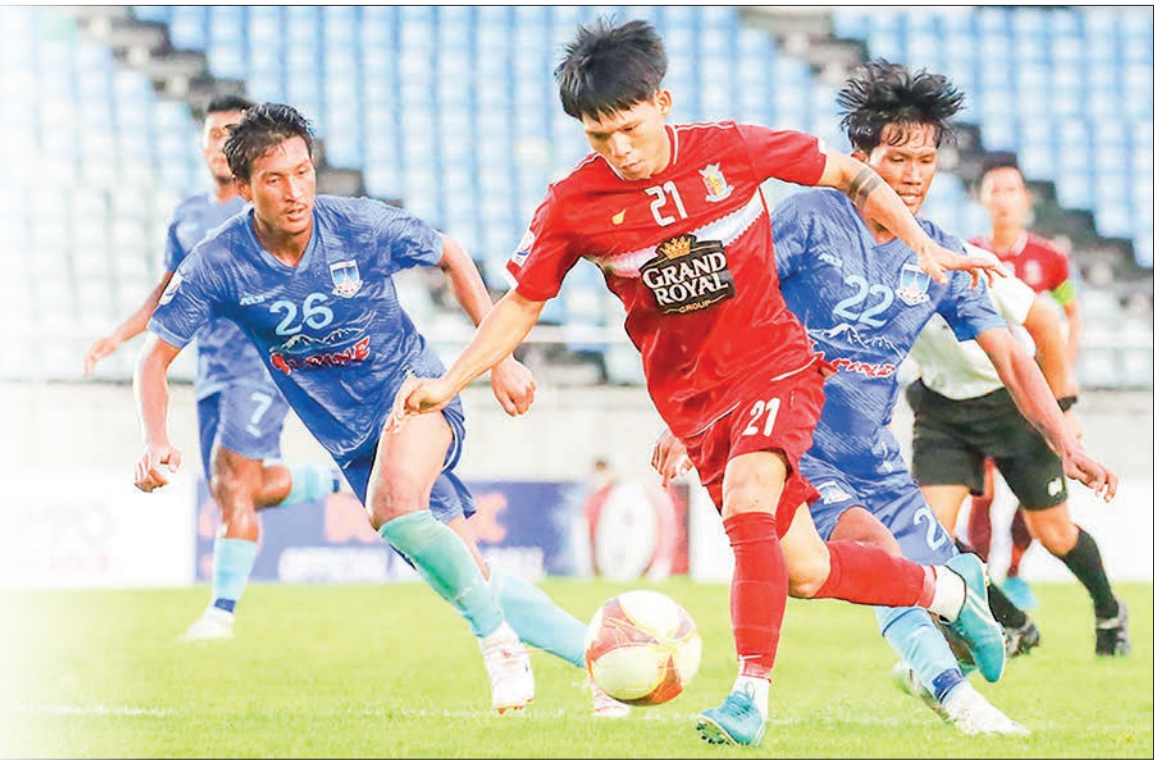
A Hanthawady player (red) passes the rival players with football skills during the Week-18 match of the Myanmar National League at Thuwunna Stadium in Yangon on 28 October 2023. PHOTO: MNL

Myawady FC will take on Rakhine United today at Thuwunna Stadium for the fourth match of the Week-18 Myanmar National League. — Ko Nyi Lay/KZL