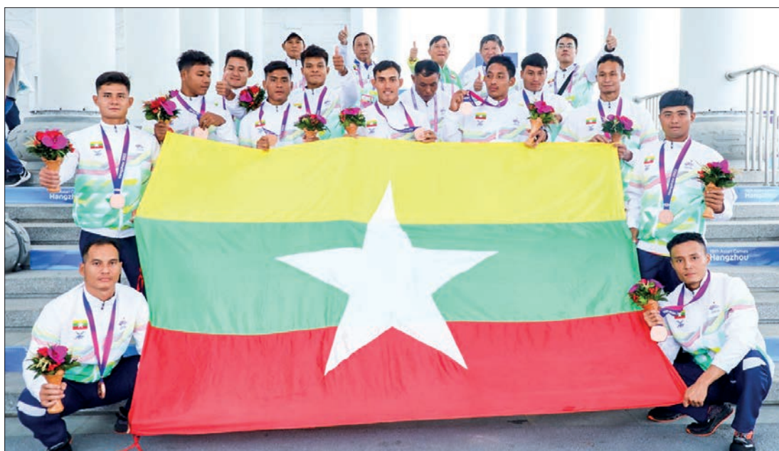
Team Myanmar is seen celebrating the victory.

Next, the men's Sepak Takraw tourney was held at