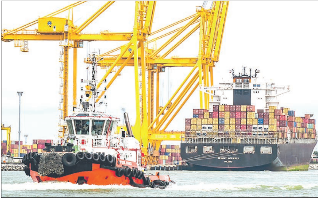
The volume of world merchandise trade is now expected to grow by 0.8 per cent this year.