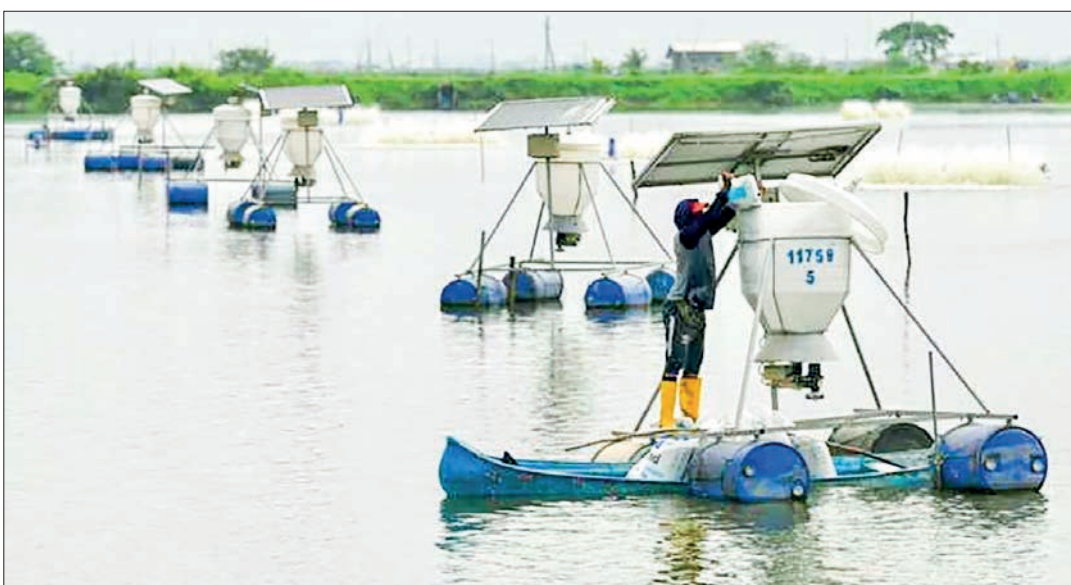
An industry association says shrimpers have spent $100 million on security this year alone.

farmers are being forced to shell out millions of dollars in private security, which could impact the industry's competitiveness compared to countries like India or Viet Nam where production is cheaper. — AFP