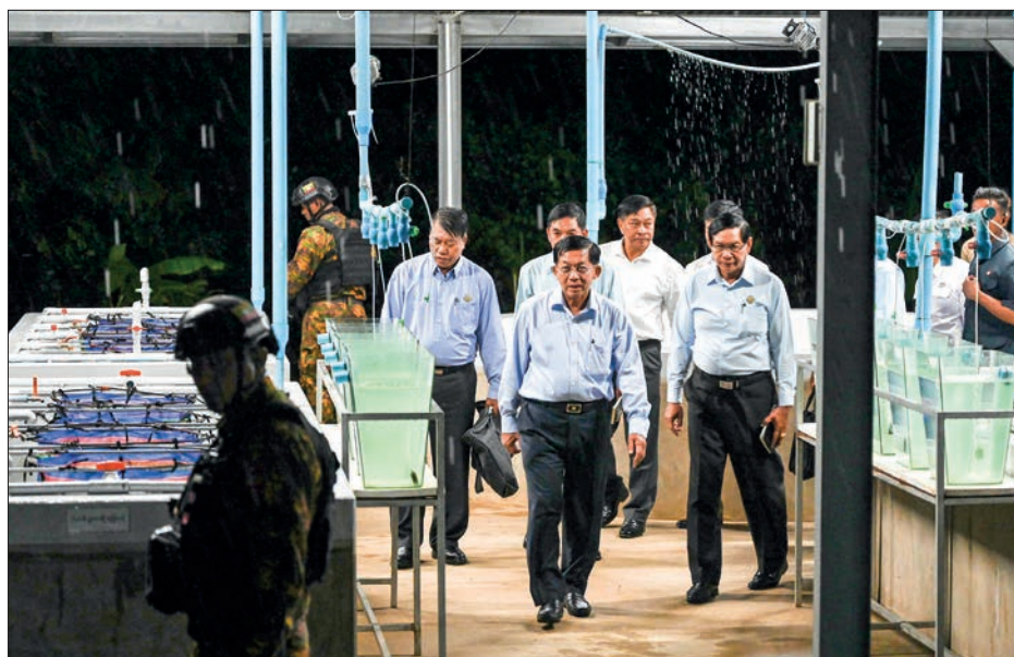
SAC Chair Premier Senior General Min Aung Hlaing views round the Thilawa multi-agriculture and livestock zone yesterday.

The Senior General urged officials to apply experiences and techniques