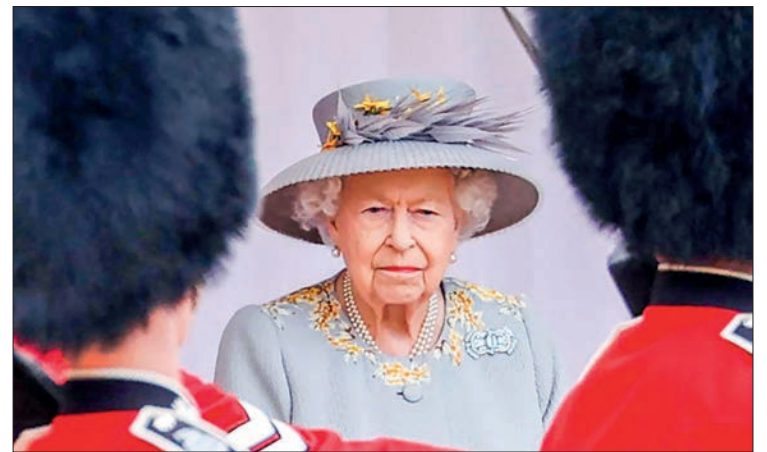
Queen Elizabeth II.

Speaking to AFP, the head of the Norwegian Nobel Committee urged Iran to release Mohammadi, a call immediately echoed by the United Nations. — AFP