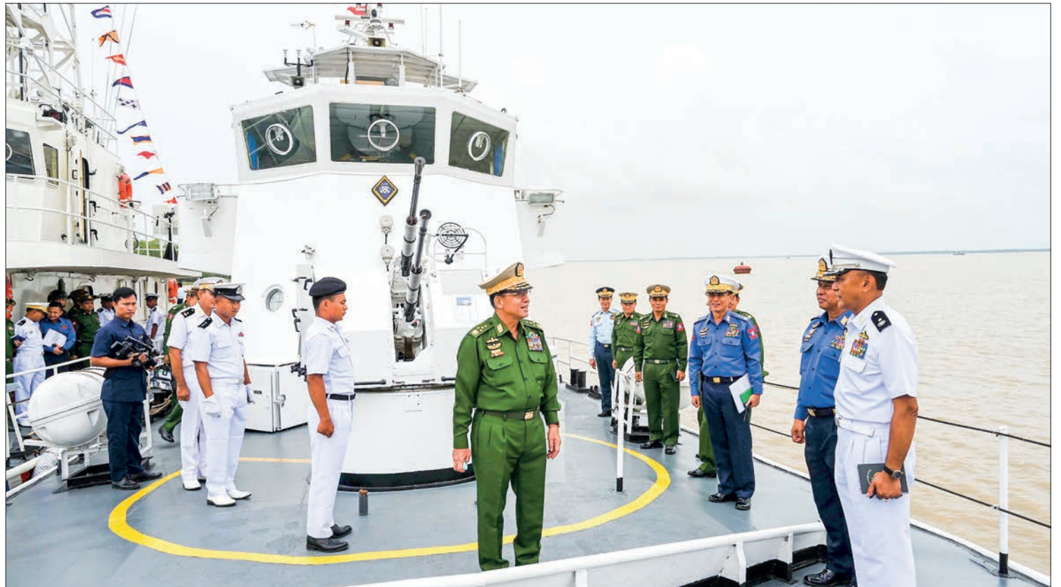
State Administration Council Chairman Commander-in-Chief of Defence Services Senior General Min Aung Hlaing pays inspection tours at the headquarters of the Myanmar Coast Guard on its second anniversary yesterday.