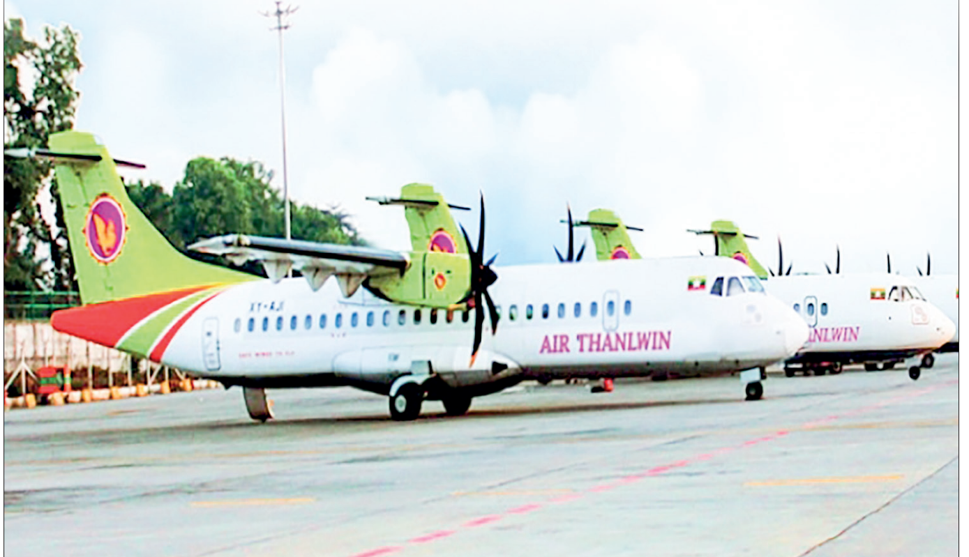
The picture shows a fleet of aircraft from Air Thanlwin that will operate Nay Pyi Taw-Yangon and Nay Pyi Taw-Lashio flights.

NEW Nay Pyi Taw-Yangon and Nay Pyi Taw-Lashio flights have been extended since 2 October by Air Thanlwin Airlines.