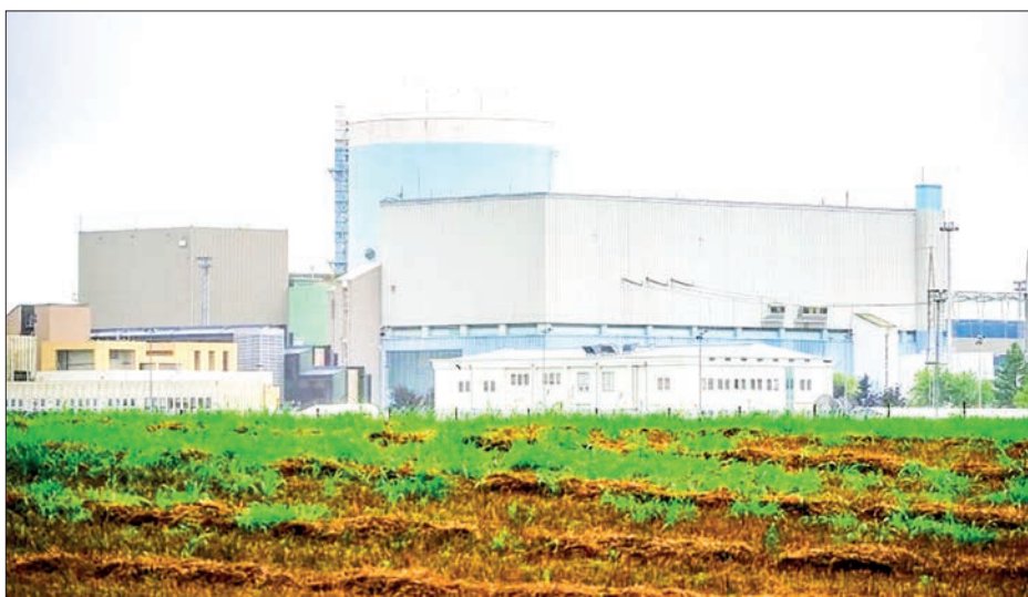
The last precautionary shutdown at Krsko occurred in 2020, after an earthquake that shook neighbouring Croatia, killing seven people.

In service since 1983, the 700-megawatt reactor at the plant provides about