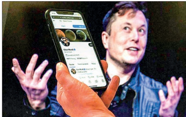
Musk, who increased his Twitter ownership before acquiring the company for $44 billion, missed a planned SEC deposition in September.

US market regulators on Thursday asked a judge to order Elon Musk to