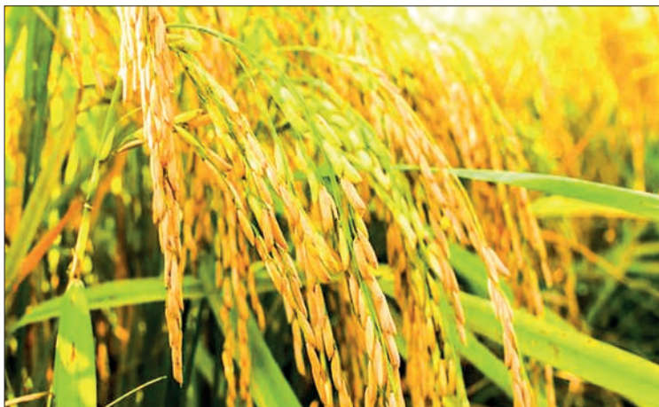
The photo shows a monsoon paddy field in Moeny Township, Bago Region where over 48,600 acres of monsoon paddy cultivation are annually registered.

The rice warehouses in Bayintnaung depot saw low stocks compared to that of the previous years, the GNLM quoted Ko Kyaw Kyaw, a rice trader from Padauk Street, as saying. — TWA/EM