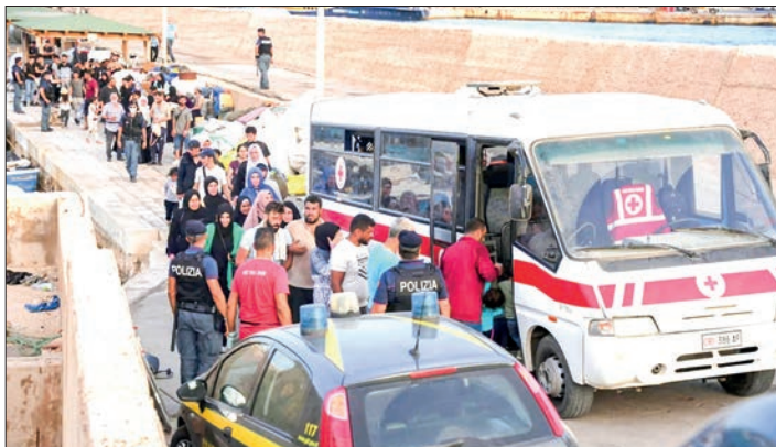
Language in the Granada declaration is much harder on the topic of migration than in a previous version from late September.

After a tense day of talks at Thursday's European Political Community summit, EU leaders began an informal council meeting in the southern city of Granada, with migration topping the agenda. Poland's populist government, facing a general election next week, lashed out at Europe's plans