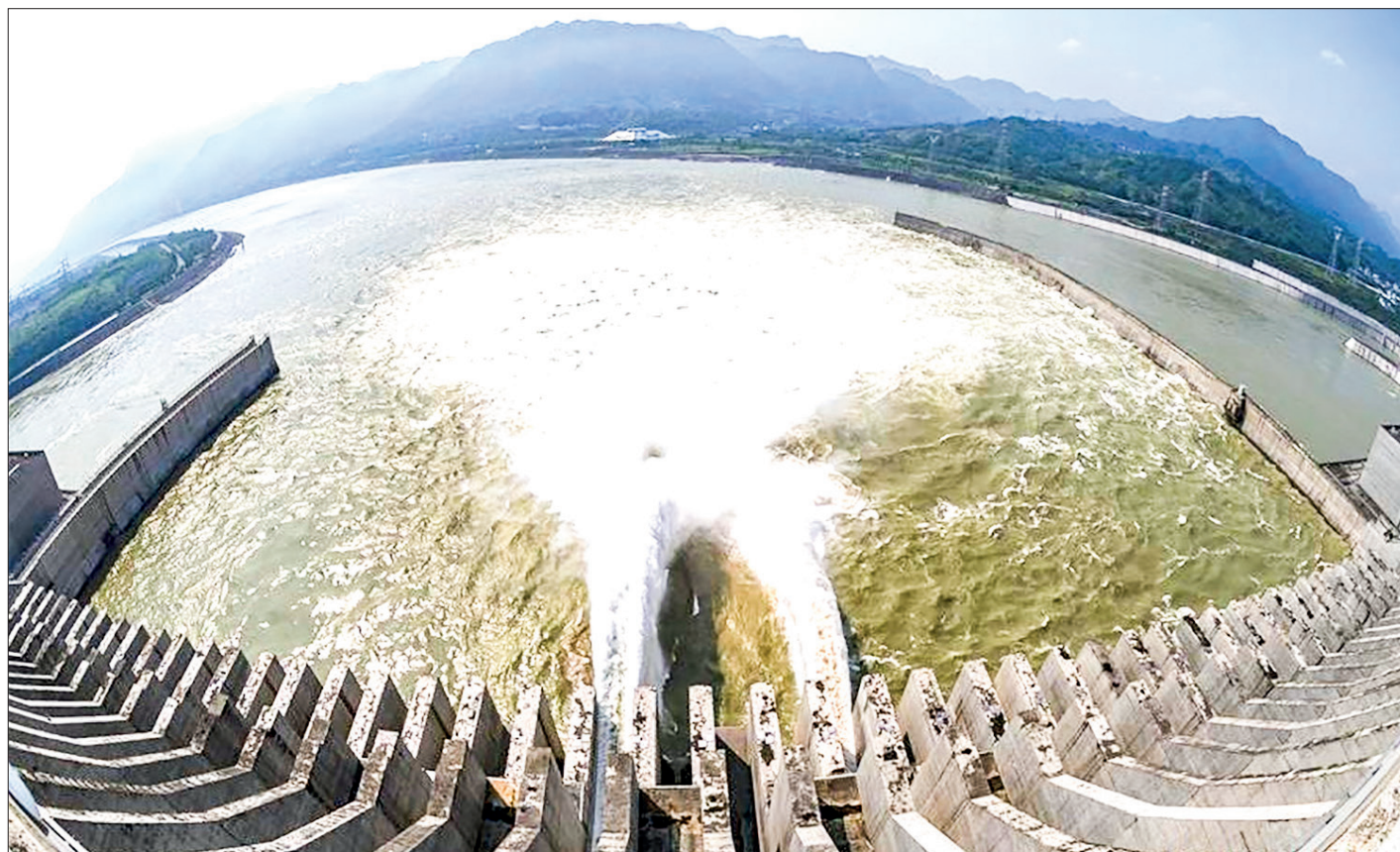
Photo taken on 23 June 2019 shows water discharging from the Three Gorges Dam, a gigantic hydropower project on the Yangtze River, in Yichang City, central China's Hubei Province.

Ember warns that the decline in hydropower generation could hinder the shift to cleaner energy.