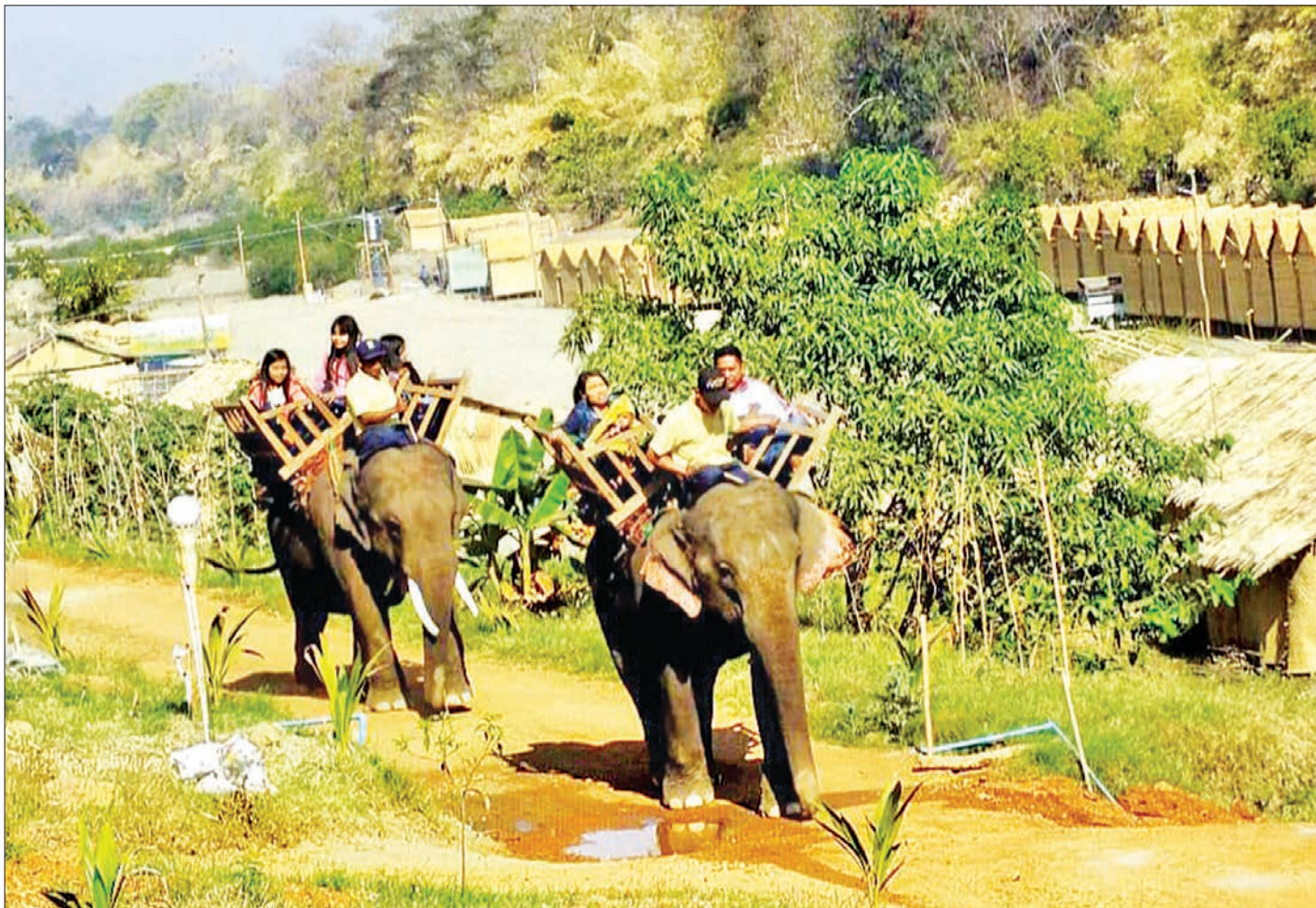
Travellers enjoy elephant rides at the Shwesettaw Manchaung Resort in Minbu Township, a highlight in Magway Region.

Min Aung Hlaing delivered an address in honour of the second anniversary of the Myanmar Coast Guard yesterday. SEE PAGE-3