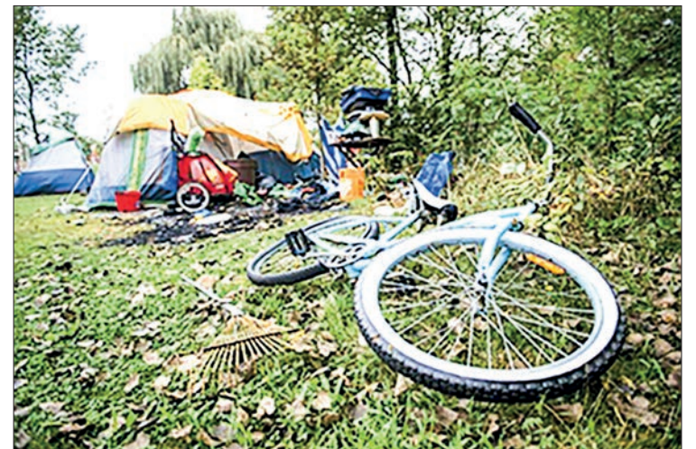
A makeshift homeless encampment has been set up in a park in Granby, Canada which is struggling to deal with a surge in homelessness.

A few blocks away, a park has been transformed into a makeshift encampment for men and women of all ages, some of them employed like Brodeur-Cote. — AFP