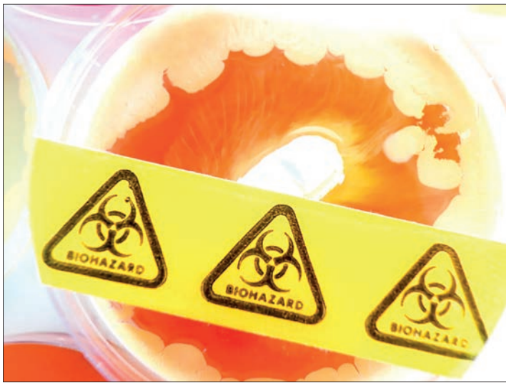
A biohazard refers to a biological substance or agent that poses a threat to human health or the environment.

The new commission focuses on countering modern biological threats, taking over from the disbanded commission that dealt with protecting against new infections.