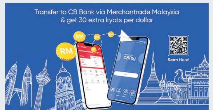
An advert of CB Bank's Merchante Malaysia.

Additionally, users can use their favourite services using the CB Pay application. — PP/KZL