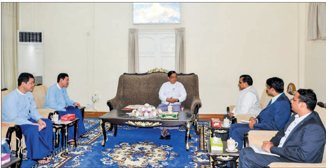
The Hindustan Machine Tools International Ltd delegation calls on Union Minister Dr Charlie Than yesterday in Nay Pyi Taw.

ence, Python Programming Language, Text Classification and Semantics. — MNA/KTZH