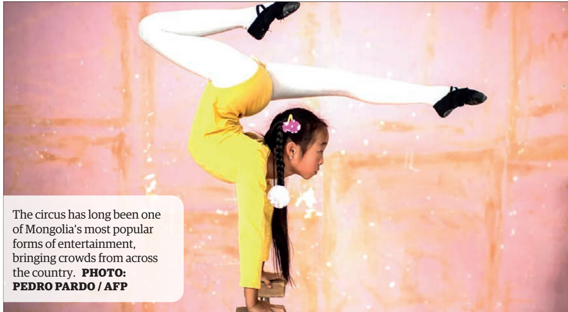
The circus has long been one of Mongolia's most popular forms of entertainment, bringing crowds from across the country.

This venue, located at the Mongolian Circus School, is one of the few places left for these performers to train if they aspire to travel the world with Mongolia's renowned circus shows.