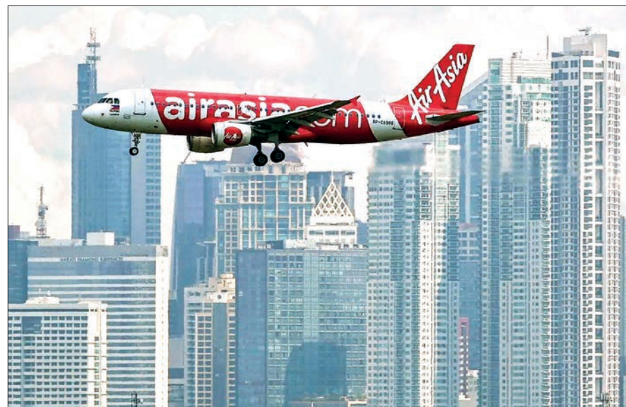
An Air Asia Airbus prepares to land at Ninoy Aquino International airport.

Eric Apolonio, spokesman for the aviation authority, told AFP: "No bombs have been found". — AFP