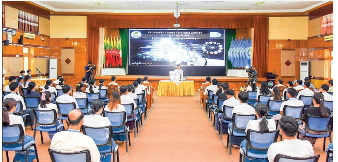
Union Minister U Maung Maung Ohn inaugurates the Foundation Course for Public Opinion Mining Analysis (Artificial Intelligence-AI) yesterday in Nay Pyi Taw.