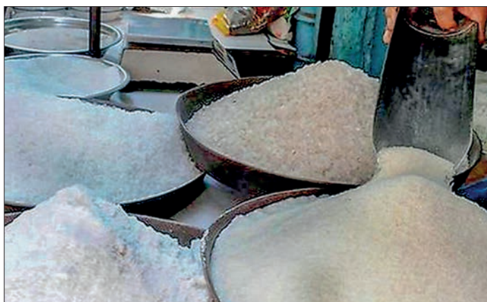
Sugar are seen in the market

The sugarcane is grown in December-January. It can be harvested from November to February of the following years. The sugarcane growing rotation cycle lasts four years in Myanmar. — NN/EM