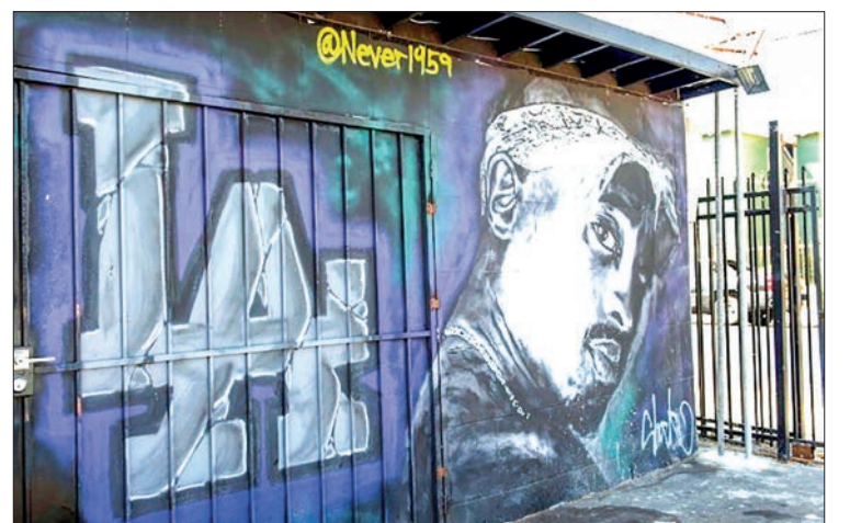
A wall dedicated to the memory of US rapper Tupac Shakur is seen in Los Angeles, California in 2016.