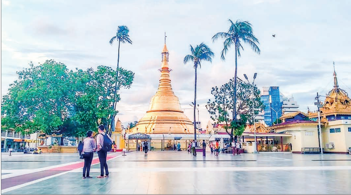
The photo captures the serene beauty of the Botahtaung Pagoda at the background.