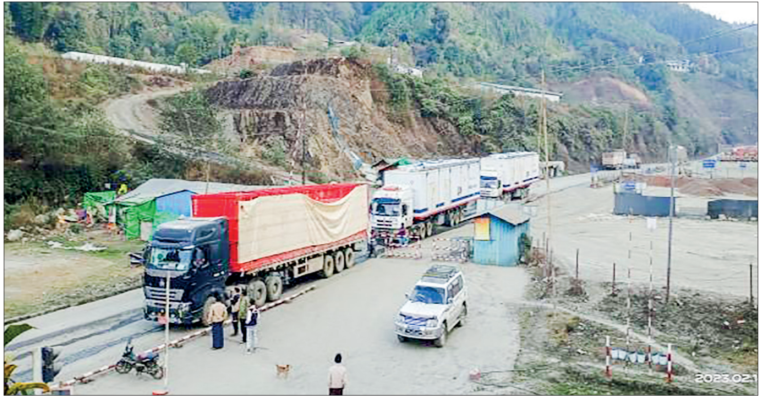
Cargo-laden lorries are seen at the Kampaiti border.

No rental vehicles are used for the transportation of exports and imports at the camp, and vehicles owned by the respective companies are used to convey truckloads of bananas and imports. — TWA/CT