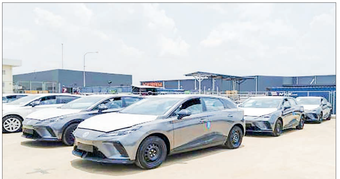
New arrivals of battery electric vehicles are seen at Yangon Port.

From 2022 to September 2023, a total of 3,065 various types of EVs were registered across the country, it is reported. EVs were imported with the approval of the National-level Steering Committee on Development of Electric Vehicles and Related Industries. — ASH/MKKS