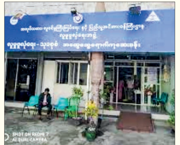
A social security clinic open to workers.

Private hospitals and clinics in Myingyan Township in Mandalay Region; DaikU Township in Bago Region; Kawlin, Katha, Sagaing, Kalay, and Salingyi townships in Sagaing Region; Wakema, Myanaung, Pathein, Htonbo, Bogale, Hinthada, Kyangin, Myaungmya, and Mawlamyinekyun townships in Ayeyawady Region; and Loikaw Township in Kayah State can join the provider-purchaser split system, and inquiries can be made at the head office of SSB in Nay Pyi Taw for detailed information.