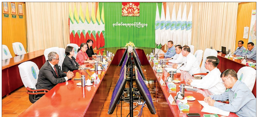
Union Minister Lt-Gen Tun Tun Naung holds talks with UNHCR Representative Ms Noriko Takagi yesterday in Nay Pyi Taw.

They frankly discussed matters of the completion of preparations for re-examination, acceptance and resettlement of displaced persons in line with the Myanmar-Bangladesh bilateral agreement, the implementation of enhancing stability and peace in Rakhine State while improving the socioeconomic conditions of its residents, activities of the National Committee on Resettlement of Internally Displaced Persons and the Closure of Temporary Shelters and humanitarian aid.