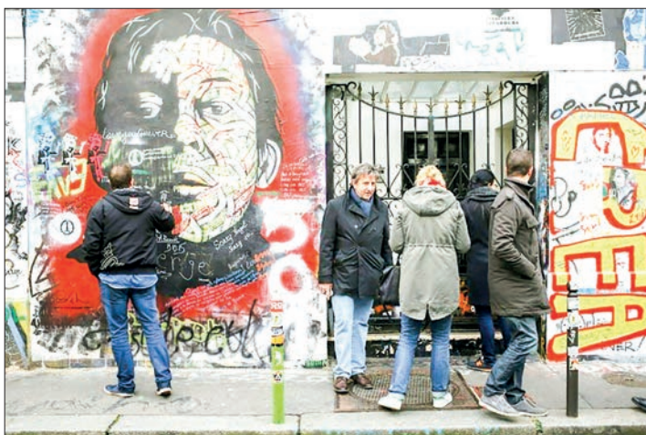
Gainsbourg's house is opening to the public 32 years after his death.

The ashtrays have finally been cleared and protective barriers put up, but the singer's weird and wonderful bric-