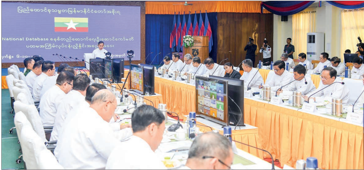
The first meeting of the National Database System Implementation Leading Committee in progress yesterday, presided over by SAC Vice-Chair Deputy Prime Minister Vice-Senior General Soe Win.