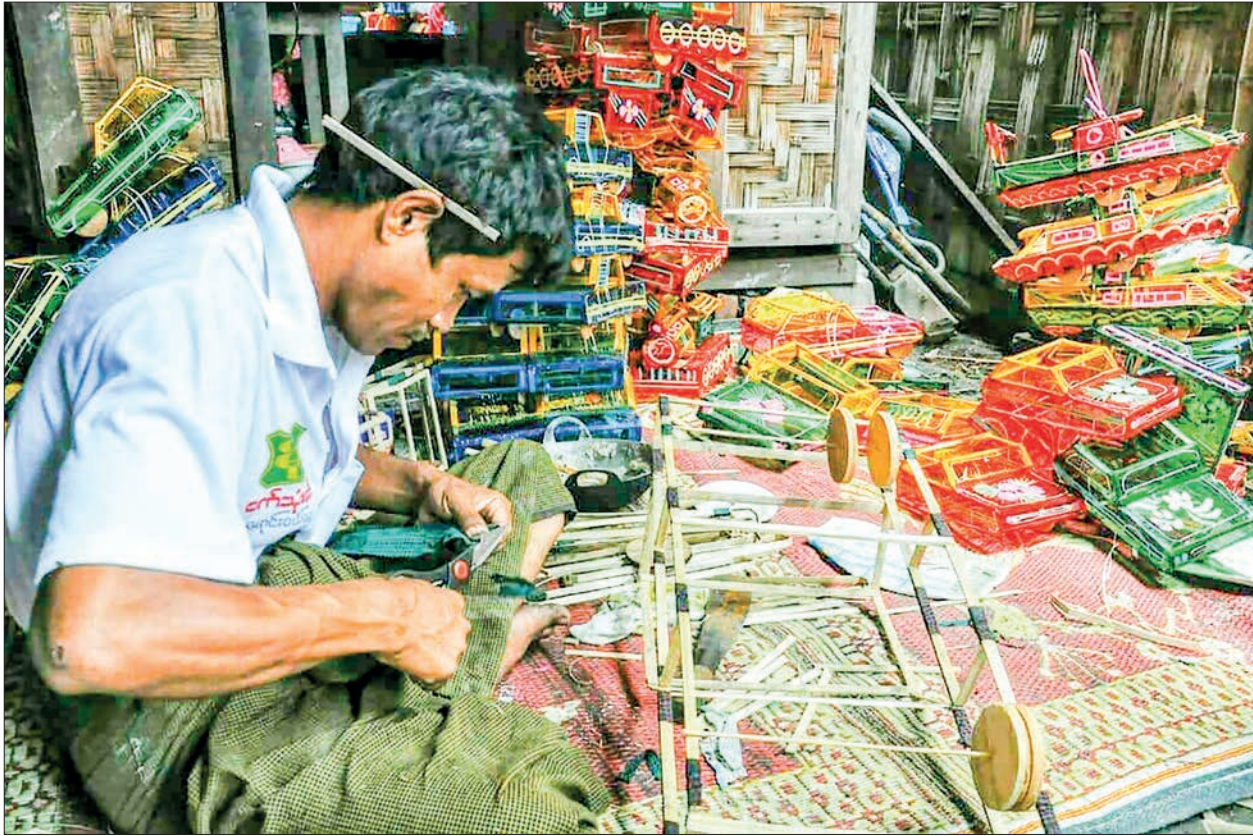
A worker skillfully crafting lanterns at the home workplace.