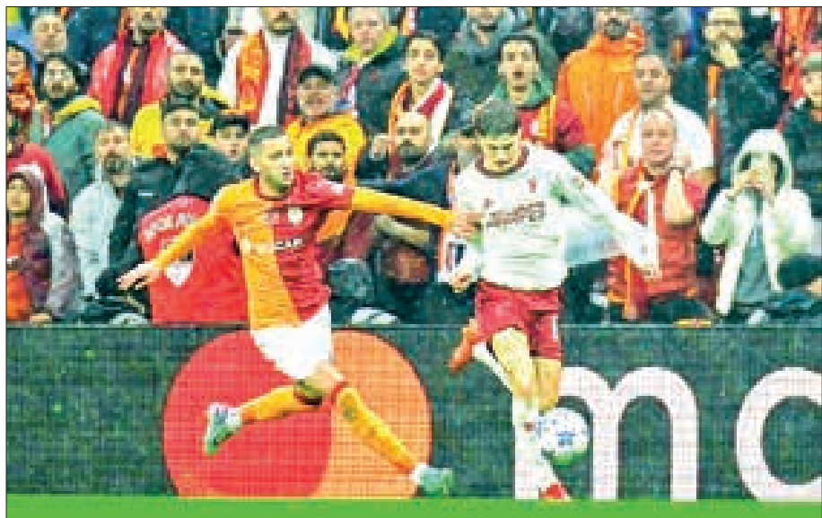
Galatasaray and Manchester United played out a thrilling 3-3 draw that leaves the English side on the verge of going out of the Champions League.

MANCHESTER United are facing elimination from the Champions League in the group stage after squandering a two-goal lead to draw 3-3 with Galatasaray in Istanbul on Wednesday, while Arsenal and PSV Eindhoven se-