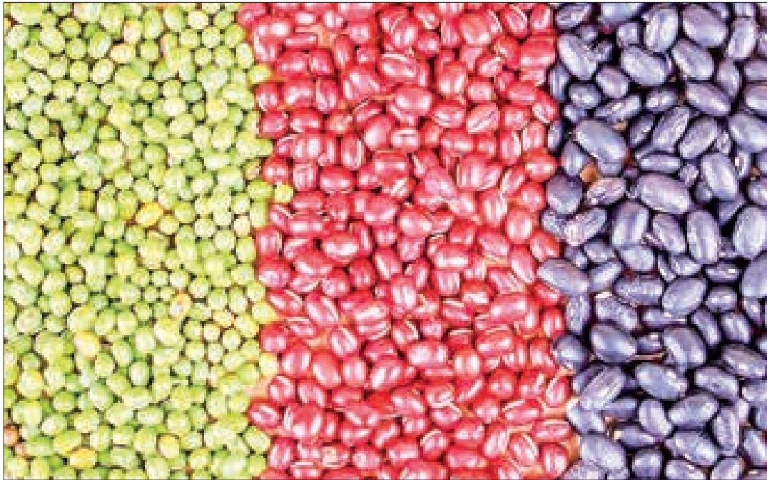
A close-up view of Myanmar's pulses and beans in the market.

WITH the FOB prices moving down, black gram and pigeon peas prices have fallen.