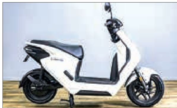
"For the electrification of its motorcycles, Honda is investing 100 billion yen over the five-year period from 2021 to 2025, and will invest an additional 400 billion yen over the five-year period from 2026 to 2030," Honda said.

The world's largest two-wheeler manufacturer plans to introduce 30 new electric models by 2030, with a 50% reduction in the current cost of electric motorcycles.