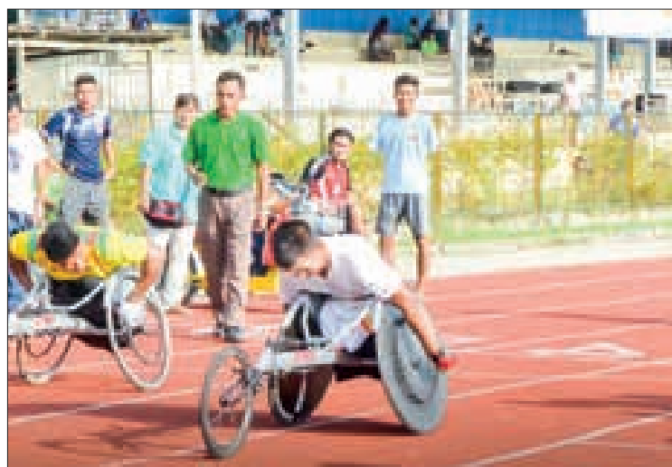
A very competitive and high-performance sport contested by the PWDs.