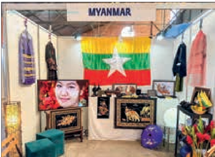
A Myanmar booth seen at the event in Cuba on 26 November 2023.

MYANMAR'S traditional crafts and cultural items were showcased at the International Bazaar organized by the Association of Spouses of Diplomats Accredited in Cuba (ACDACU) at the Cultural Exhibition