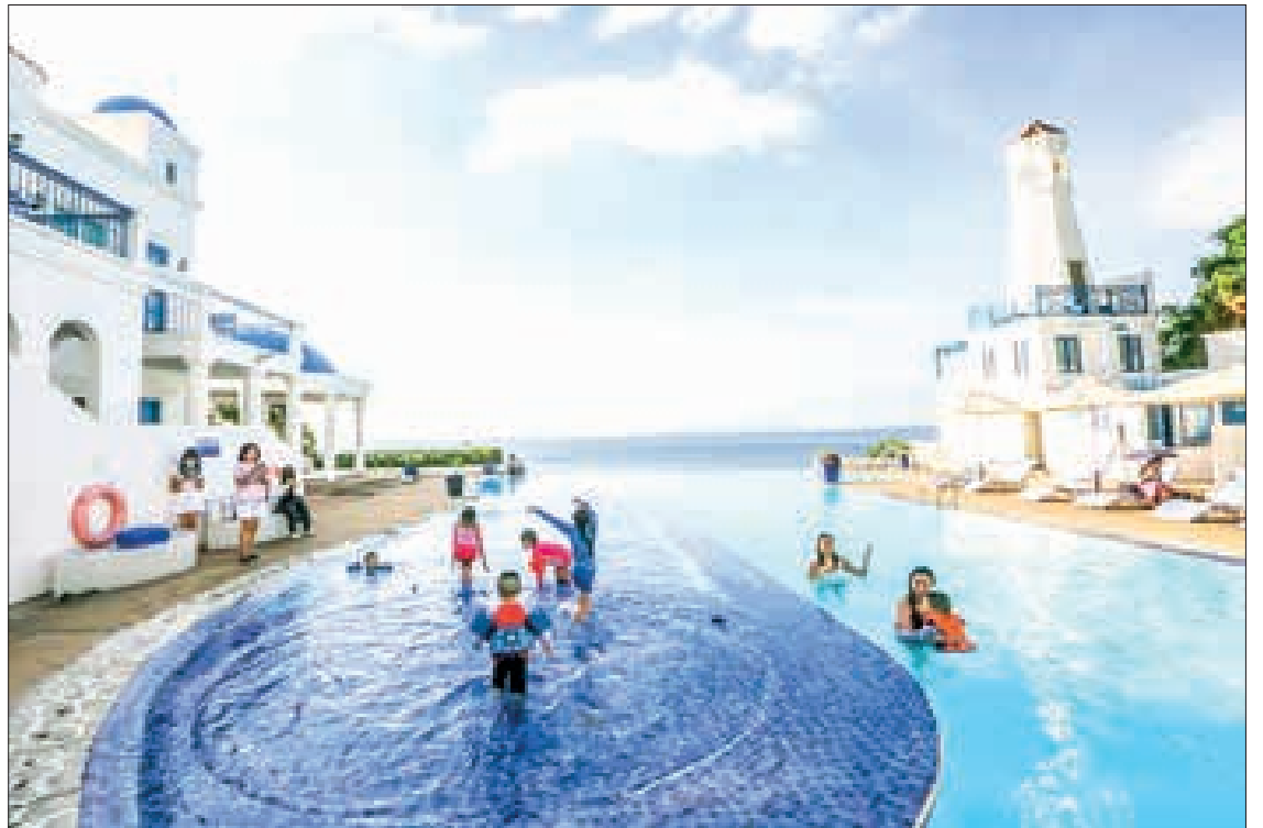
Tourists are seen at a resort in Batangas Province, the Philippines, on 18 November 2021.

As a key economic driver in the Philippines, tourism contributed 6.2 per cent of the country's gross domestic product in 2022, with at least 2.65 million inbound foreign visitors. — Xinhua