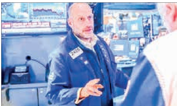
Traders work on the floor of the New York Stock Exchange (NYSE) on 15 November 2023 in New York City.

THE world economy is likely headed for a soft landing next year, the OECD said Wednesday as it pared back its growth forecast, but warned the Israel-Hamas conflict could throw a spanner in the works.