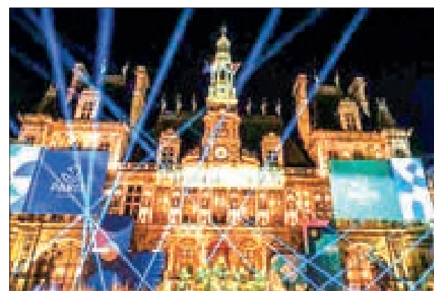
Some politicians are unhappy with tight security at the Paris Olympics.

Laurent Nunez stated that residents near Olympic venues must apply for a QR code to bypass police barriers.