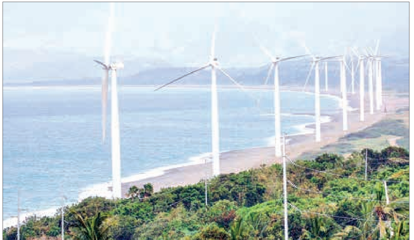
Transmission lines climb above the hills of Bangui Bay to deliver electricity generated by windmills in Bangui Bay, Ilocos Norte, northern Philippines.

To achieve global carbon neutrality by mid-century, credible plans emphasize a substantial increase in renewable energies like wind, solar, hydroelectric, and biomass.