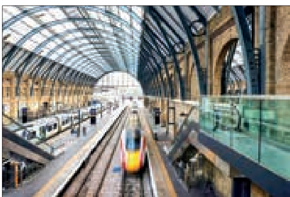
The repeated strikes by rail staff have been mirrored across the public and private sectors in Britain.

A new series of rolling strikes across the country are scheduled to go ahead from this