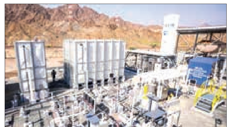
The ADNOC carbon capture facility in Fujairah in the UAE.

Using novel technology developed by Omani start-up 44.01, the solar-powered plant will suck carbon dioxide from the air, dissolve it in seawater and inject it deep underground, where it will mineralise over a period of months. The new site on the Gulf of Oman is funded by state oil giant ADNOC, whose CEO Sultan Al Jaber is president of the UN's COP28 climate talks and chairman of Masdar, a renewable energies company.