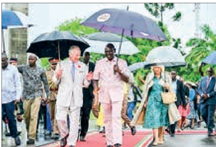
Kenyan President William Ruto wears a safari-style suit as he bade farewell to King Charles III and his wife Queen Camilla earlier this month.

According to the Speaker's Rules, "a proper dress for men means a coat, collar, tie, long-sleeved shirt, long trousers, socks and shoes or service uniform". — AFP