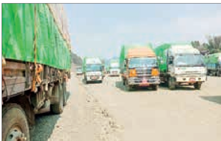
Lorries laden with export cargoes seen on the Sino-Myanmar border.

iron sheets, iron pipes, artificial grass, apples, tangerines, ceramic tiles and consumer goods. Imports of 180 tonnes of capital goods worth $0.356 million, 759 tonnes of intermediate goods worth $0.708 million and 389 tonnes of consumer goods worth $0.418 million were registered then.