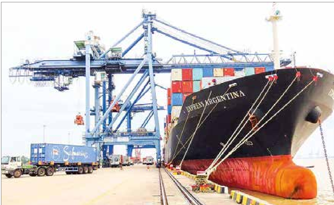
An overseas container vessel docks at Yangon Port for loading and unloading.

A ccording to the Myanma Port Authority, Yangon Port is bound to handle 49 container vessels in December.