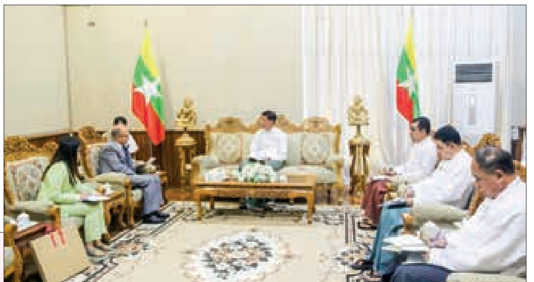
Nepali Ambassador Mr Harishchandra Ghimire calls on SAC Member Deputy Prime Minister MoTC Union Minister General Mya Tun Oo yesterday.

Deputy Minister for Transport and Communications U Aung Kyaw Tun, departmental heads and officials attended the meeting.