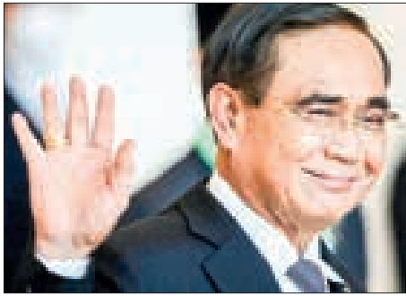
Thailand's former prime minister Prayut Chan-o-cha.