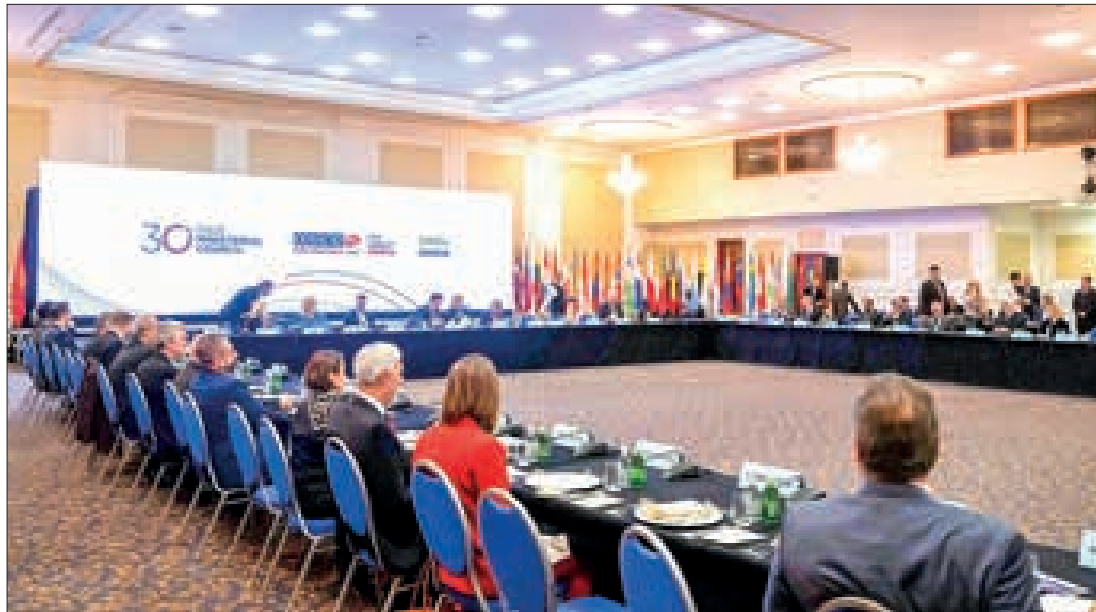
OSCE foreign ministers and other officials are gathering in Skopje, North Macedonia, Thursday and Friday.

It is Lavrov's first visit to Europe since the beginning of Russia's special military oper-