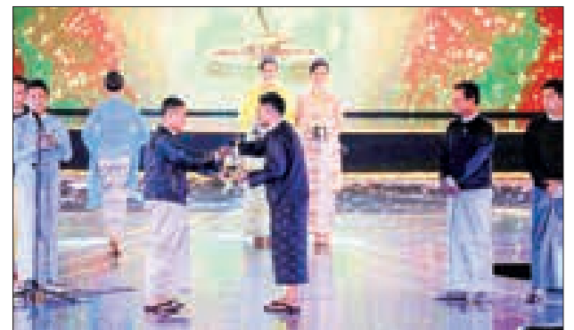
Receptionists at the events of the 2019, 2020 and 2022 Myanmar Academy Awards.

Application forms will be available for pickup starting 1 December at the Myanmar Motion Pictures Organization, No 16, Wingaba Road. The deadline for submitting applications is the evening of 15 December. — TWA/TKO