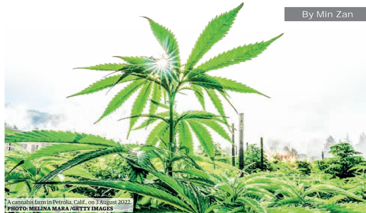
A cannabis farm in Petrolia, Calif., on 3 August 2022.