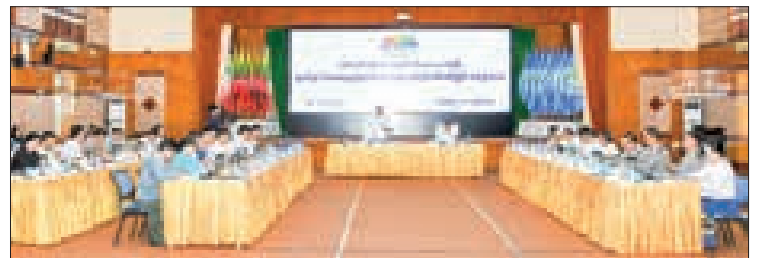
The coordination meeting of the organizing committee on Youth and Literary Arts Festival in progress yesterday.