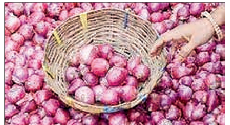
A shopper sorts onions to purchase them at the market in Yangon.

The Philippines imports onions from China, India, Australia, South Korea, the Netherlands and New Zealand. There are 168 authorized onion-importing companies in the country. Onions export to the Philippines through the G-to-G pact is the only accessible way for now. — NN/EM