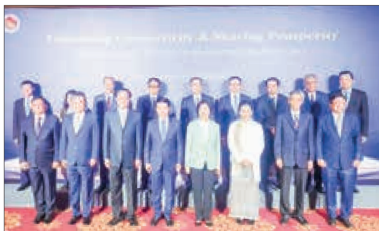
Union Minister Dr Thet Thet Khine poses for the documentary group picture at the event in Laos on 26-29 November.

On 27 November, Deputy Prime Minister and Minister of Foreign Affairs of Laos, Vice Chairperson of the National Committee of the Chinese