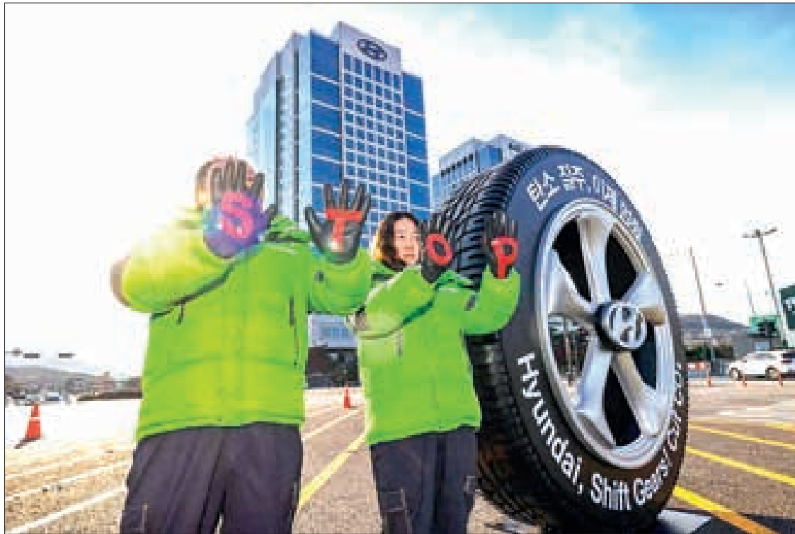
Environmental report shows growth of over 150 per cent in SUV sales offsets climate progress for Toyota, Volkswagen, and Hyundai.

The environmental advocacy group calls for the auto industry to halt the trend, highlighting the increased carbon footprint not only from SUV tailpipe emissions but also from the manufacturing process, which involves greater steel consumption.