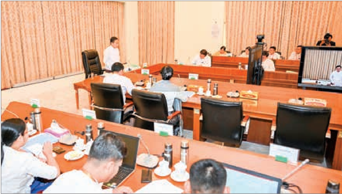
State Administration Council Vice-Chair Deputy Prime Minister Vice-Senior General Soe Win chairs the coordination meeting on Union's additional budget submission for the 2023-2024 financial year yesterday.

also systematically verified by the Union and Region State Budget Advance Scrutiny Committee formed under the guidance of the Head of State.