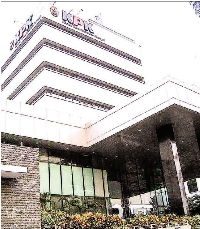
The Indonesian government to pass a law in 2002 creating KOMISI PEMBERANTASAN KORUPSI (KPK), or the Corruption Eradication Commission with a far-reaching mandate to free Indonesia from corruption.

The allegations against Bahuri are linked to Limpo's case. The KPK chief has denied the accusations on several occasions in the past. — AFP