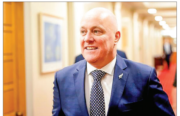
New Zealand's incoming Prime Minister Christopher Luxon expects the agreements to form a three-party coalition government to be signed on Friday.

"At which point, I'll talk again to the governor-general and formally confirm that we're