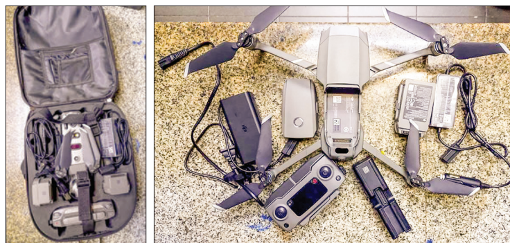
(L & R): Unmanned aerial vehicles (UAVs) or drones and remote controls.

At the exhibition, officials from 12 famous universities in Thailand will hold direct discussions with visitors, and Myanmar students who want to attend universities in Thailand will be able to choose and study the information provided by the universities displayed at the exhibition in one place. — ASH/TKO