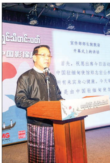
Union Information Minister U Maung Maung Ohn unveils the Chinese Film Week event yesterday in Yangon.

Union Minister U Maung Maung Ohn stated that Myanmar and China have built sig-