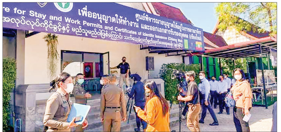
The photo shows the certificate of identity (CI) issuing office in Thailand.

Out of nearly 500 agencies that have obtained licences to send workers abroad from Myanmar, 150 agencies of which are authorized to send workers to Thailand. — TWA/MKKS