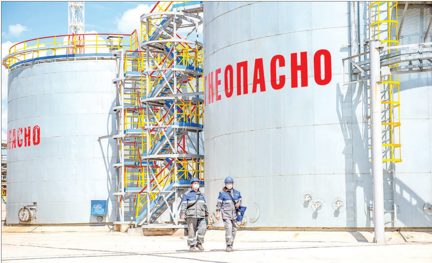
Russia is a major supplier of energy commodities, including oil and gas, contributing significantly to the global energy market.