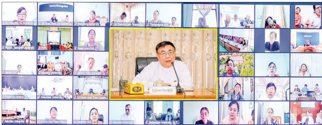
Union Minister Dr Nyunt Pe meets university rectors and degree college principals online yesterday.

Union Minister Dr Nyunt Pe announced the opening of all universities and degree colleges, emphasizing the commencement of studies. He urged faculty members to serve their teaching duties, emphasizing cooperation in