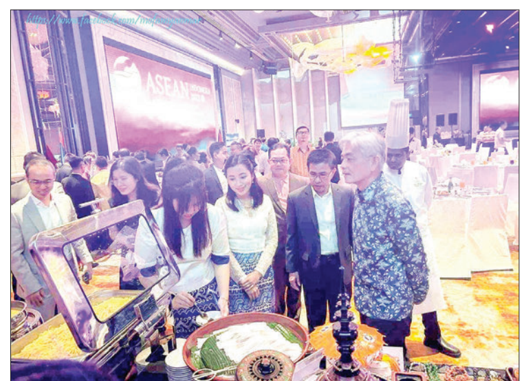
Myanmar's traditional products were showcased at ASEAN Gala Night 2023.