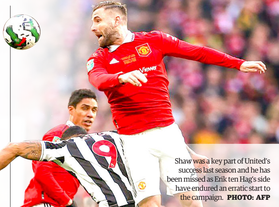
Shaw was a key part of United's success last season and he has been missed as Erik ten Hag's side have endured an erratic start to the campaign.

Political opponents lashed out at the Socialist mayor, who has been under pressure this month after it emerged she extended a low-key official trip to a French Pacific territory in October with a two-week private visit in the holiday paradise. — AFP