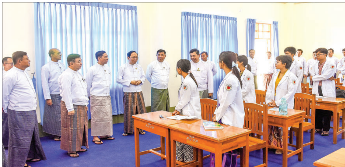
Union Ministers and officials greet the students of the Faculty of Medicine at the Naypyitaw State Academy yesterday.