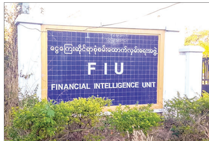
The Financial Intelligence Unit - FIU Office (Nay Pyi Taw).

The four critical factors encompass adherence to the supervisory guidelines of the Mobile Financial Services Supervisory Committee by mobile banking service providers. Additionally, prosecuting entities must take action against accounts discovered to be linked with counterfeit citizenship scrutiny cards. Suspicious financial transactions are to be reported to the Financial Intelligence Unit (FIU), and a list of bank accounts and mo-