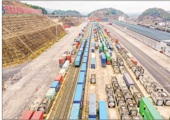
This aerial photo taken on 9 February 2023 shows a China-Europe freight train at Dulaying Station in Guiyang, southwest China's Guizhou Province.

yuan, while imports decreased 4.8 per cent to 18.59 billion yuan, according to Guiyang Customs. From January to October, the province's private enterprises saw rapid growth in their foreign trade volume, which increased 16.5 per cent year on year to 33.93 billion yuan.—Xinhua