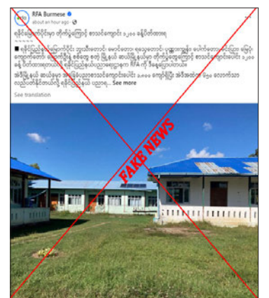
A screenshot exposing false information on school closures in Rakhine State.

spread online by anti-government media and some pro-terrorist news outlets. Parents will need to continue encouraging the education of their children. — MNA/ZN