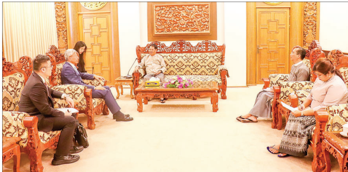
Deputy Prime Minister MoFA Union Minister U Than Swe receives Chinese Ambassador Mr Chen Hai yesterday.

U Than Swe, Deputy Prime Minister and Union Minister for Foreign Affairs of the Republic of the Union of Myanmar, received Mr Chen Hai, Ambassador of the People's Republic of China to Myanmar, yesterday at the