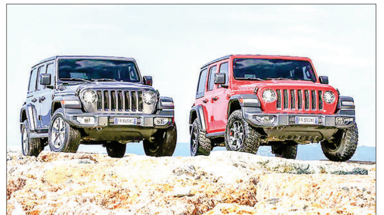
It is estimated that the defect may be present in one per cent of the 2021-2024 Wrangler 4xe models covered by the recall.

"The vehicles may be driven. However, the Company is advising owners to refrain from recharging these hybrid vehicles, and to park them away from structures and other vehicles,