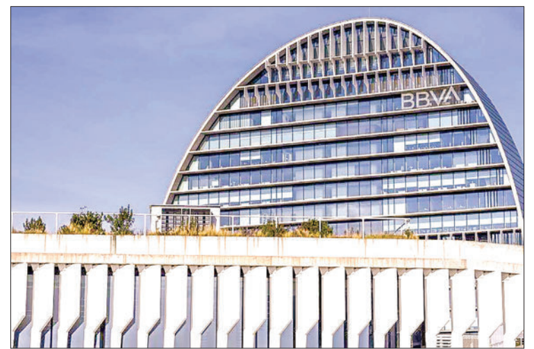
La Vela (the sail) building which houses the head office of Spanish bank BBVA (Bilbao Vizcaya Argentaria Bank) in Madrid.

The study found that all 20 have set green finance targets but only four — Barclays, BNP Paribas, ING, and Intesa Sanpaolo — have published partial information on how they have calculated some of their green finance targets. — AFP