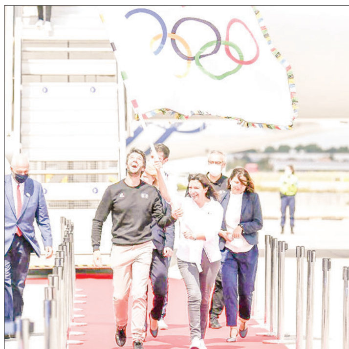
Head of the organizing committee for the 2024 Paris Olympics Tony Estanguet (L) and Paris Mayor Anne Hidalgo with the Olympic flag mark the handover from Tokyo to the French capital.

In terms of transportation, there are still ongoing issues with daily transport, and they have not yet attained the level of comfort and punctuality required for Parisians.