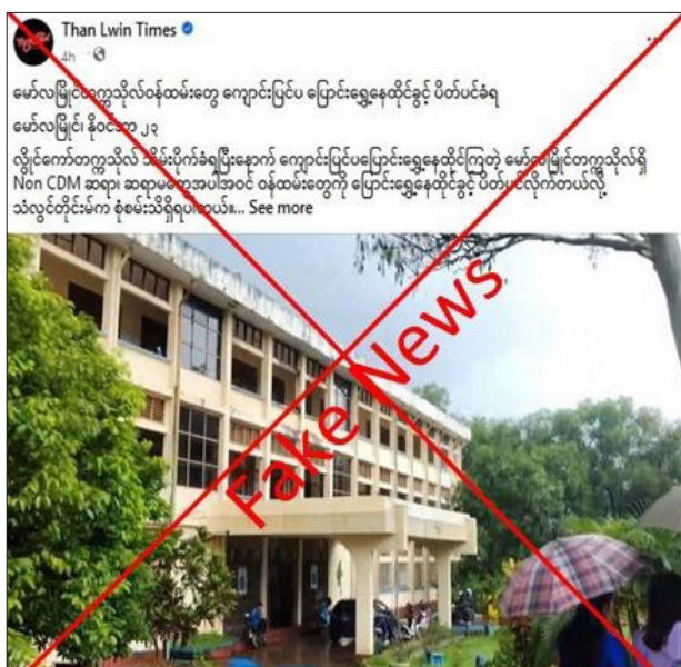
A screenshot of misleading report regarding Mawlamyine University.

Contrary to these claims, the meeting held on 16 November was a routine gathering, and there was no decision to restrict faculty members' movement. The misinformation being spread on social media platforms appears to be a deliberate attempt to cre-