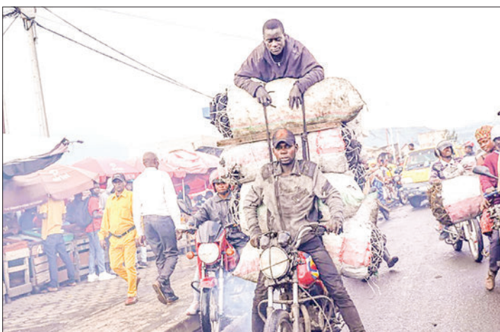
Charcoal is commonly used for cooking in DR Congo and local supplies must now take a long road through militia-riddled areas to reach the regional capital Goma.

DR Congo's president, who is seeking re-election, came to