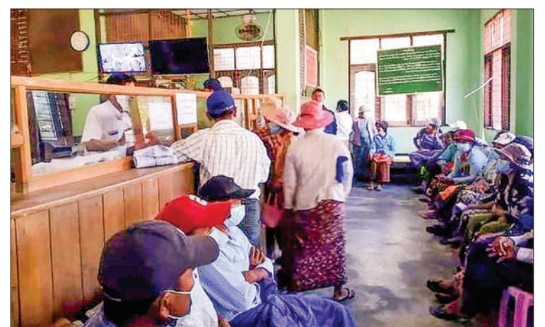
Farmers seen waiting to take out loans at the MADB.

Each farmer can borrow up to K70 million, with repayments available through short-term instalments spanning three years and long-term instalments of five years. — TWA/NT