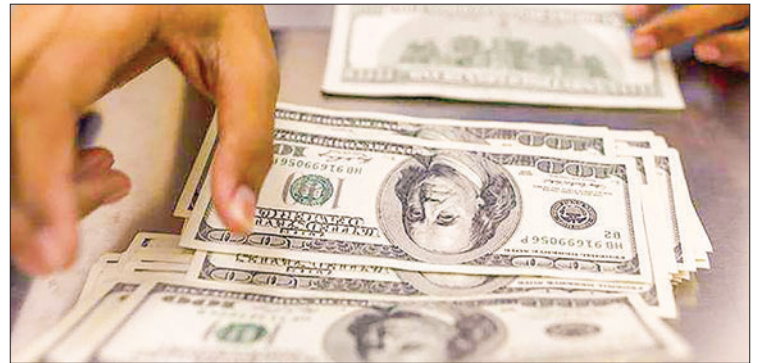
US dollars being counted at a money changer in Yangon.

Despite a large price gap between the reference rate of the CBM and the unofficial market rate, there is no way for the CBM