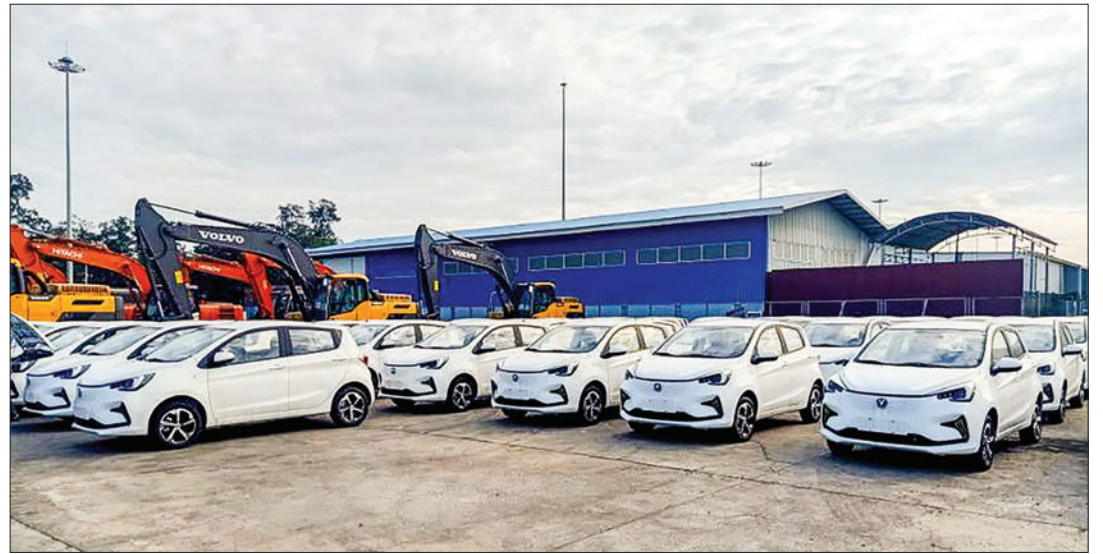
Newly arrived battery electric cars unveiled at Yangon Port.

CHINA-MADE Neta U, Neta V EVs, Leapmotor T03 (Luxury) EVs, BYD Atto3 EVs, Aiqar Arrizo E EVs and Changan Benni E-Star EVs, imported with the approval of the Steering Committee on National-Level Development of Electric Vehicles and Related Industries, arrived at Yangon Port yesterday. These battery electric cars were imported by Grand Sirius Co Ltd, NPK Motors Co Ltd, Essential Motors Co Ltd, Myanmar Great Motor Co Ltd and Myanmar Arr Thit Man Motor Co Ltd. They were claimed by the importers following the required procedures. — MNA/MKKS