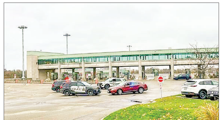
Canadian police secure the area near the Rainbow Bridge border crossing after a car exploded at the US-Canada checkpoint.

The blast happened at the major Rainbow Bridge cross-