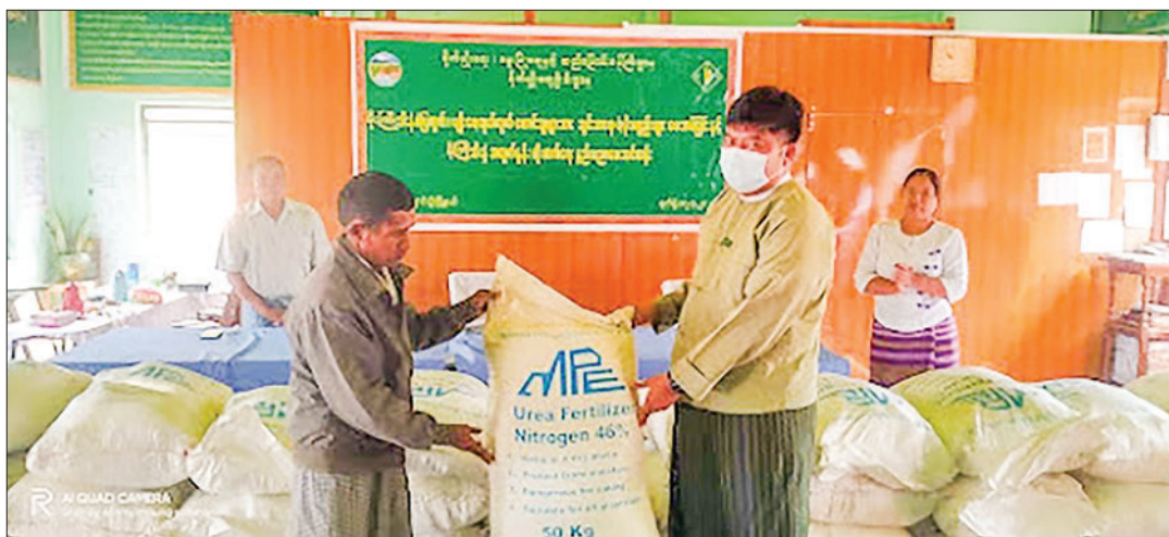
The Agriculture Department in ChaungU Township sells chemical fertilizer and quality seeds to farmers.

COOPERATIVE societies sold K5.09 billion worth of chemical fertilizers, seeds and pesticides to farmers in 78 townships in October, according to the Ministry of Cooperatives and Rural Development.