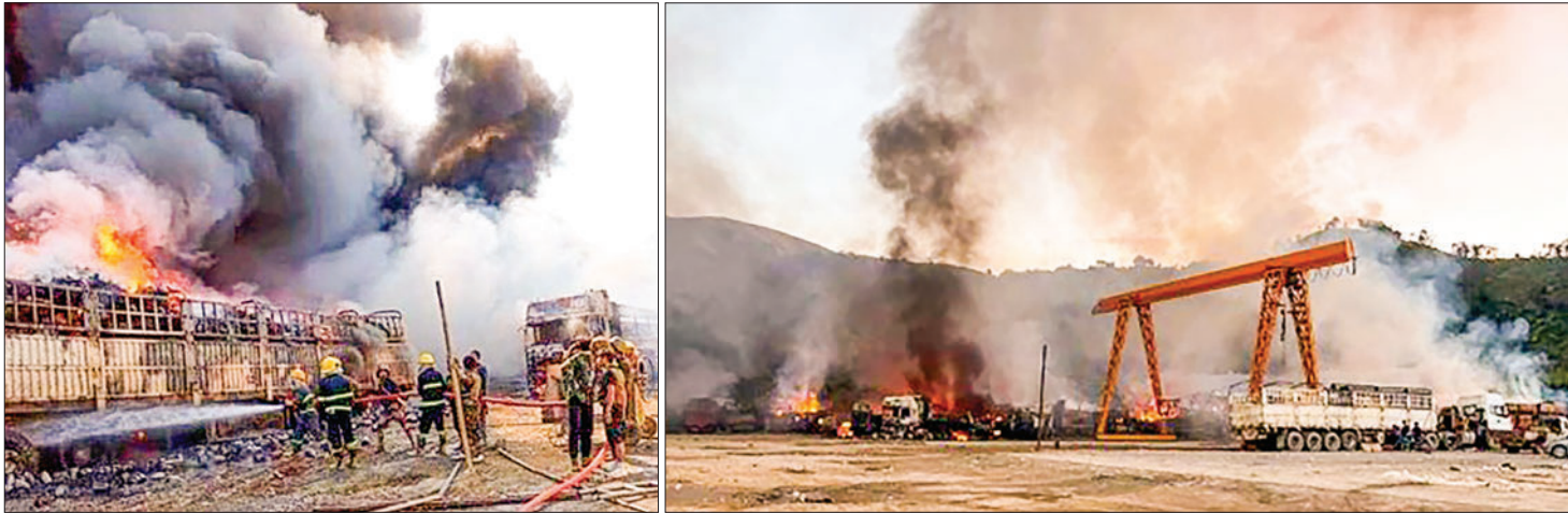
(L & R): Firefighters battle flames and debris after terrorist attacks on the Sino-Myanmar border.

MNDAA, TNLA and PDF terrorists are utilizing drop bombs in attacks to stop the flow of goods in the Shan State (North) and to undermine the peace and stability of the region by firing and attacking non-military targets.