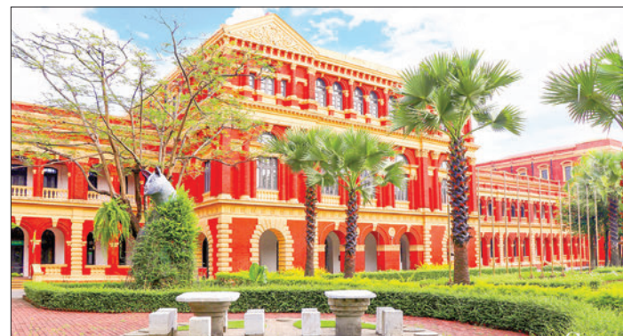
The former Secretariat building in the centre of Yangon.