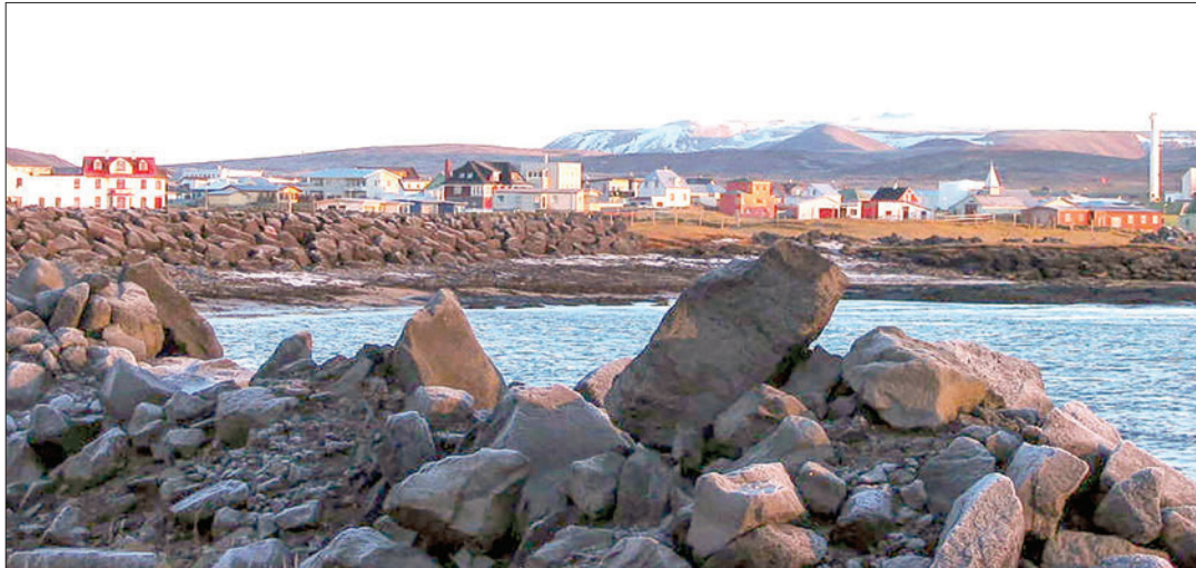
This photo shows the town of Grindavik, Iceland.