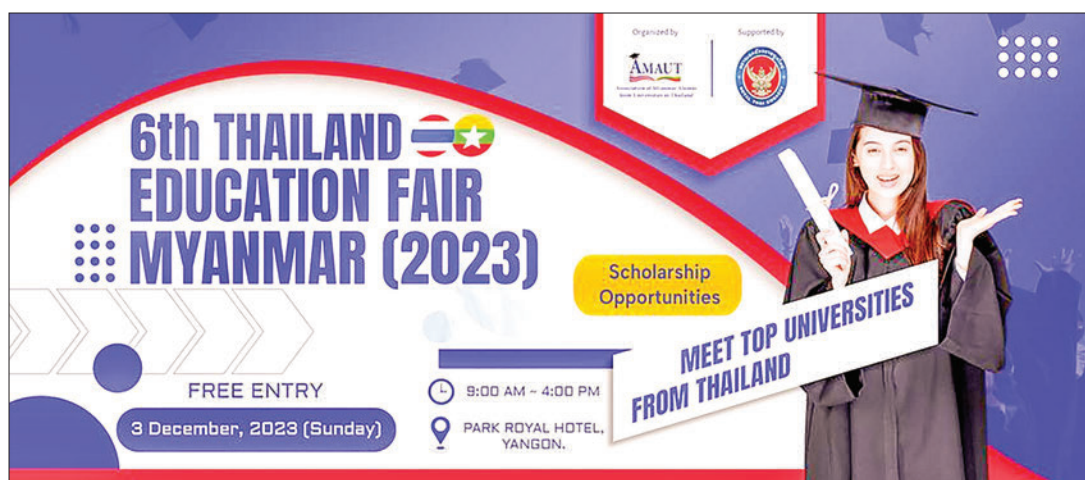
An advert of the Sixth Thailand Education Fair Myanmar 2023.

sponse to these potential threats, supermarkets, electronic stores, and shops are explicitly prohibited from selling, possessing, or facilitating unauthorized flights of drones and the use of drone accessories. Strict enforcement measures will be applied upon the detection of unauthorized flights. Violation of these prohibitions or orders will result in actions taken under Section 188 of the Code of Criminal Procedure, as outlined in the statement. The violations of Section 188 of Code of Criminal Procedure will be charged with one to six months of imprisonment. — TWA/TKO