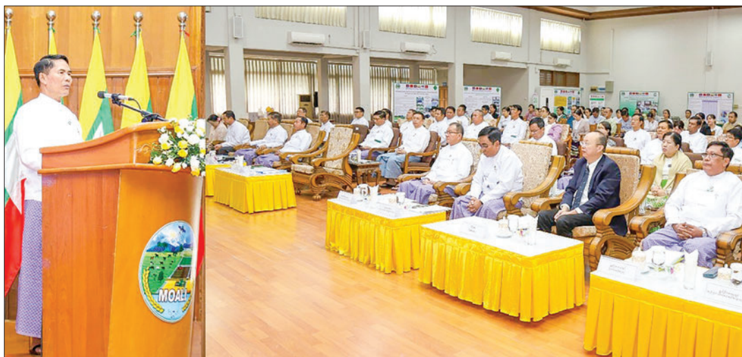
Union Minister U Min Naung speaks on the occasion of projects launched with the sixth LMC Fund yesterday in Nay Pyi Taw.

THE launching ceremony of the projects to be implemented with the sixth special fund of the Lancang-Mekong Cooperation was held at the Ministry of Agriculture, Livestock and Irrigation in Nay Pyi Taw yesterday morning.