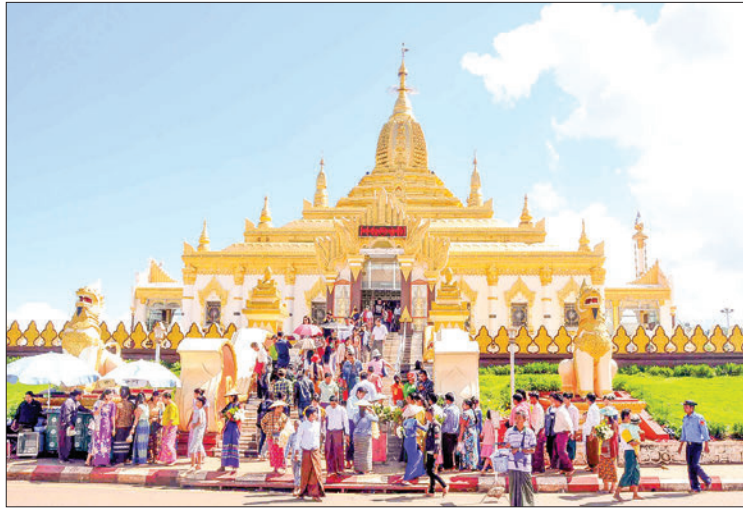
A glimpse of crowded pilgrims at Maha Anthtoo Kantha Pagoda.