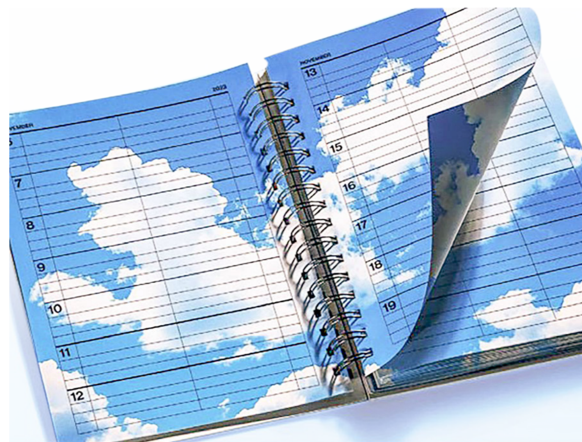
Your retirement should be a time of freedom, allowing you to embrace your true self and live a life that brings happiness and contentment.

retirement. “When you’re retired, you’re a ‘was.’”