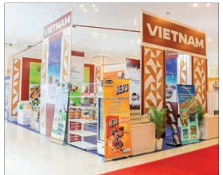
The exhibition booth displayed by Viet Nam seen at the 15 th Cambodia Import-Export Goods Exhibition held in 2022.

Two booths are provided free for Myanmar businesspersons. Yet, they have to bear flight tickets, accommodation costs, food, transport and other costs themselves. The information of those enthusiastic businesspersons who are willing to join the expo must be sent to the trade