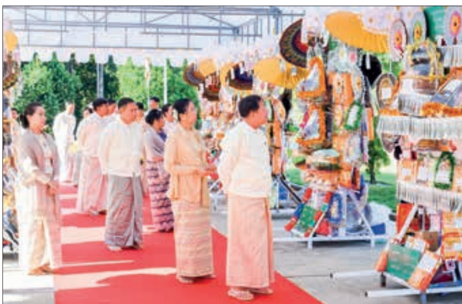
The Senior General and wife look into Kathina robes and alms exhibited for monasteries at the event yesterday.

mander-in-Chief of Defence Services Commander-in-Chief (Army) Vice-Senior General Soe Win and his wife Daw