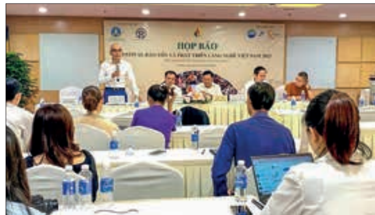
The festival is introduced at a press conference held in Hanoi on 26 September 2023.

Those who wish to join the festival can send information about participants to the trade development division of the Myanmar Trade Promotion Organization through the phone number 067 3408622 and email event.td.myantrade@gmail.com. — NN/EM