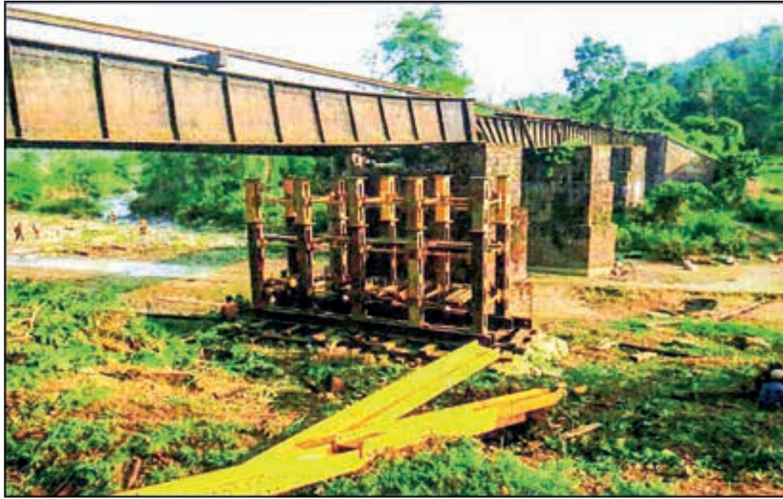
The damaged section of the Myitkyina-Mandalay railway is seen after the mine explosion by KIA.

In blowing up railways, the KIA blew up the 120-foot long Bridge No 555 on Myitkyina-Mandalay Railroad, two miles to the north of Morhan Village in Mohnyin Township on 17 April 2021, the 320-foot long Nanchwin Bailey Railroad Bridge about 800 metres to the north of Ngamile Village in Kyargyikwin Village-tract on 6 October 2023, the 80-foot long Yaypoutkyi railroad bridge