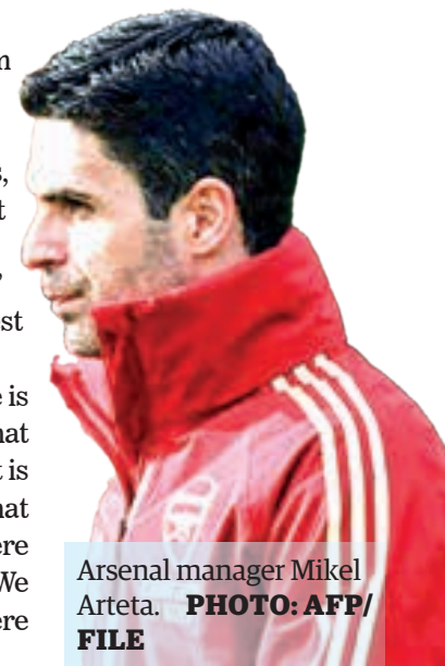
Arsenal manager Mikel Arteta.

"We've done it and there is nothing new to it, we know what we're expecting," he said. "It is very clear what they do, what their strengths are, and where the opportunities are for us. We will try to take the game where we want." — AFP