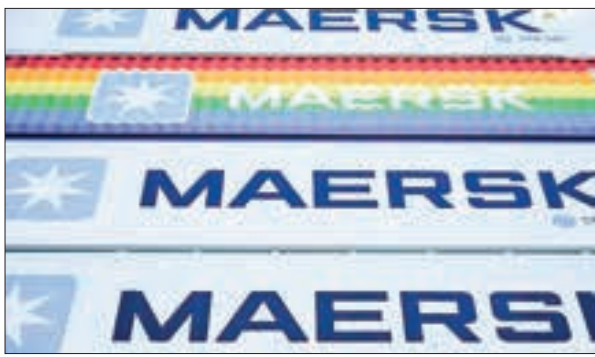
Maersk had already begun cutting costs and reducing staff levels.

"Maersk is intensifying those measures and today introduce plans to further decrease the workforce by 3,500 positions, with up to 2,500 to be carried out in the coming months and the remaining to extend into 2024," the company said. — AFP