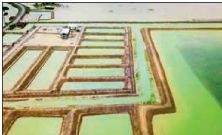
A fish farm near the Minbya-Pauktaw road in Rakhine State.

In addition to the hotel and tourism industry and the oil and gas industry, the future economy of Rakhine State offers good opportunities in maritime trade and cross-country trade. — ASH/MKKS