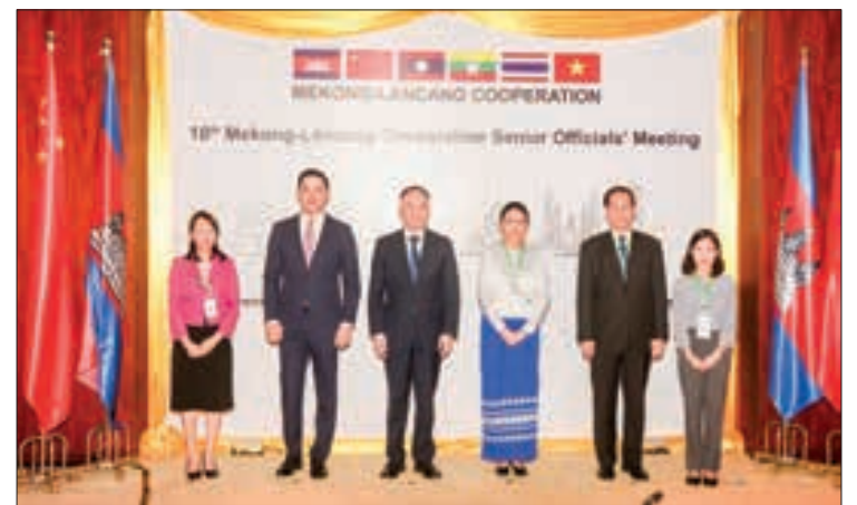
The documentary photo of the 10 th Mekong-Lancang Cooperation Senior Officials' Meeting held in Nay Pyi Taw yesterday.

The Meeting was successfully concluded after delivering the closing remarks by Heads of Delegation of Co-chairs, Myan-