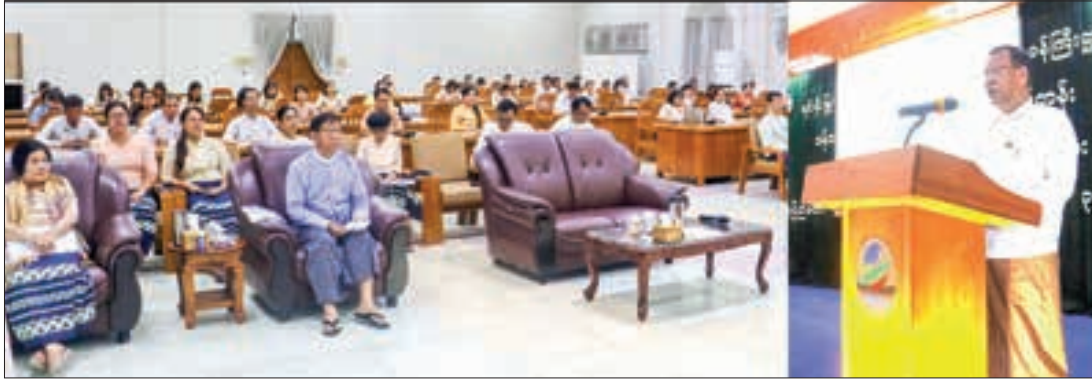
Union Minister Dr Kan Zaw addresses the 36 th Friday's Talk yesterday.

MINISTRY of Investment and Foreign Economic Relations (MIFER), aiming to develop human resources and to improve the capacity of staff, the 36 th ceremony of Friday's Talk of Knowledge Sharing Programme (KSP) was held in Nay Pyi Taw yesterday. Union Minister for Investment and Foreign Economic Relations Dr Kan Zaw attended and delivered the opening remarks.