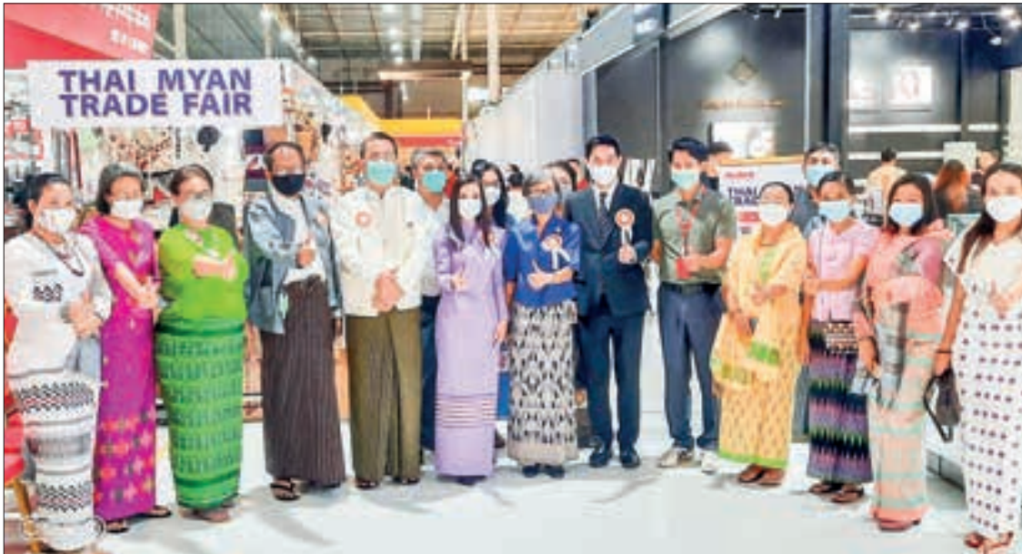
The group documentary photo of Myanmar's Arts and Crafts Association members at the Thai Myanmar Trade Fair held in Bangkok, Thailand, in the previous year.

MYANMAR handicraft stores will be opened to revive the market in promotion areas of shopping centres in Yangon Region, according to U Thardu, patron of Myanmar's Arts and Crafts Association.