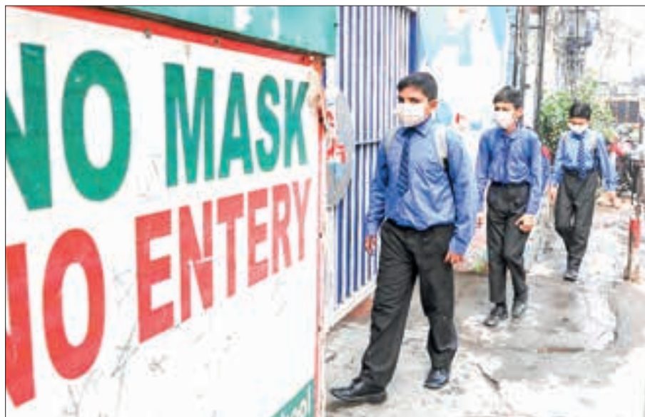
Students wearing facemasks arrive at a school in Lahore on 2 November 2023, following Punjab's government announcement to use facemasks due to severe smoggy conditions.

populous metropolis and close to the border with India, is consistently ranked in the top 10 cities globally with the worst air quality by monitoring firm IQAir. — AFP