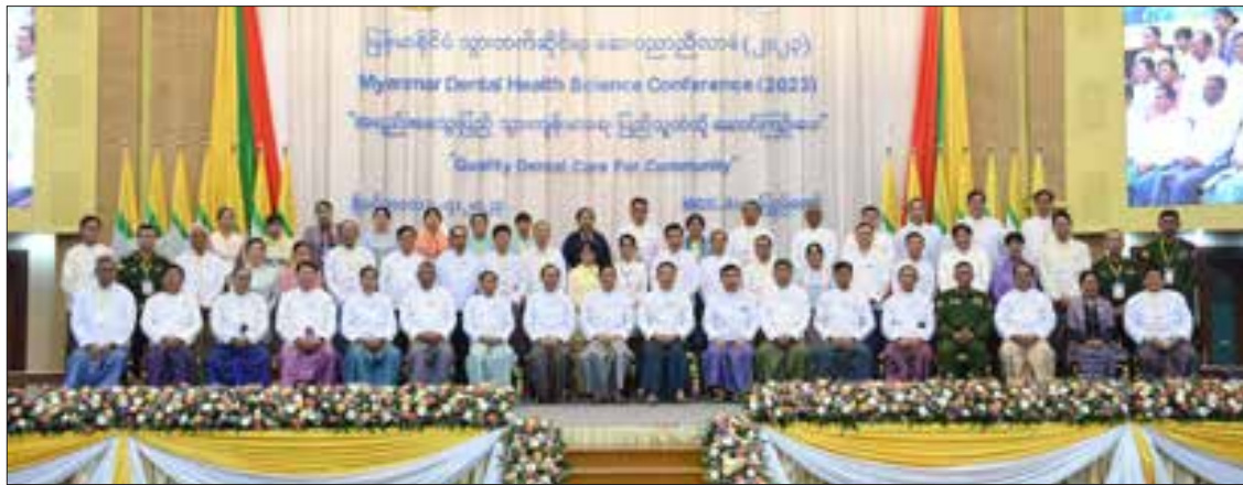
The group documentary photograph of the Myanmar Dental Health Conference 2023 held in Nay Pyi Taw yesterday.

He also stressed the instructions of the SAC Chairman Prime Minister to save the lives of people as nothing is more important than human life, saying