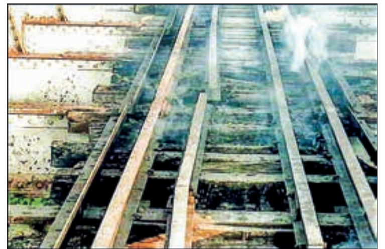
The debris of the 60-foot-long steel-frame Bailey bridge after the KIA's mine blast.

Similarly, they blew up the 50-foot long concrete Tawetchaung bridge on the Mohnyin-Hopin-Mogoung-Myitkyina between mile-posts 356-367 4,000 metres north Hopin and 20-foot long Tawetchaung Railroad Bridge on 27 April 2021, the 50-foot long Paungnet Chaung Bridge between ward 2 and ward 3 in Shwegu on 4 May, Kaukkyaw creek concrete bridge between Chaungwa Village in Katha Township and Minkyaunggon Village in Shwegu Township on 9 May 2021, and the 60-foot-long steel-frame Bailey bridge No 722 on the Myitkyina-Mandalay road near Naungpon Village in Nankway Village-tract in Myitkyina on 30