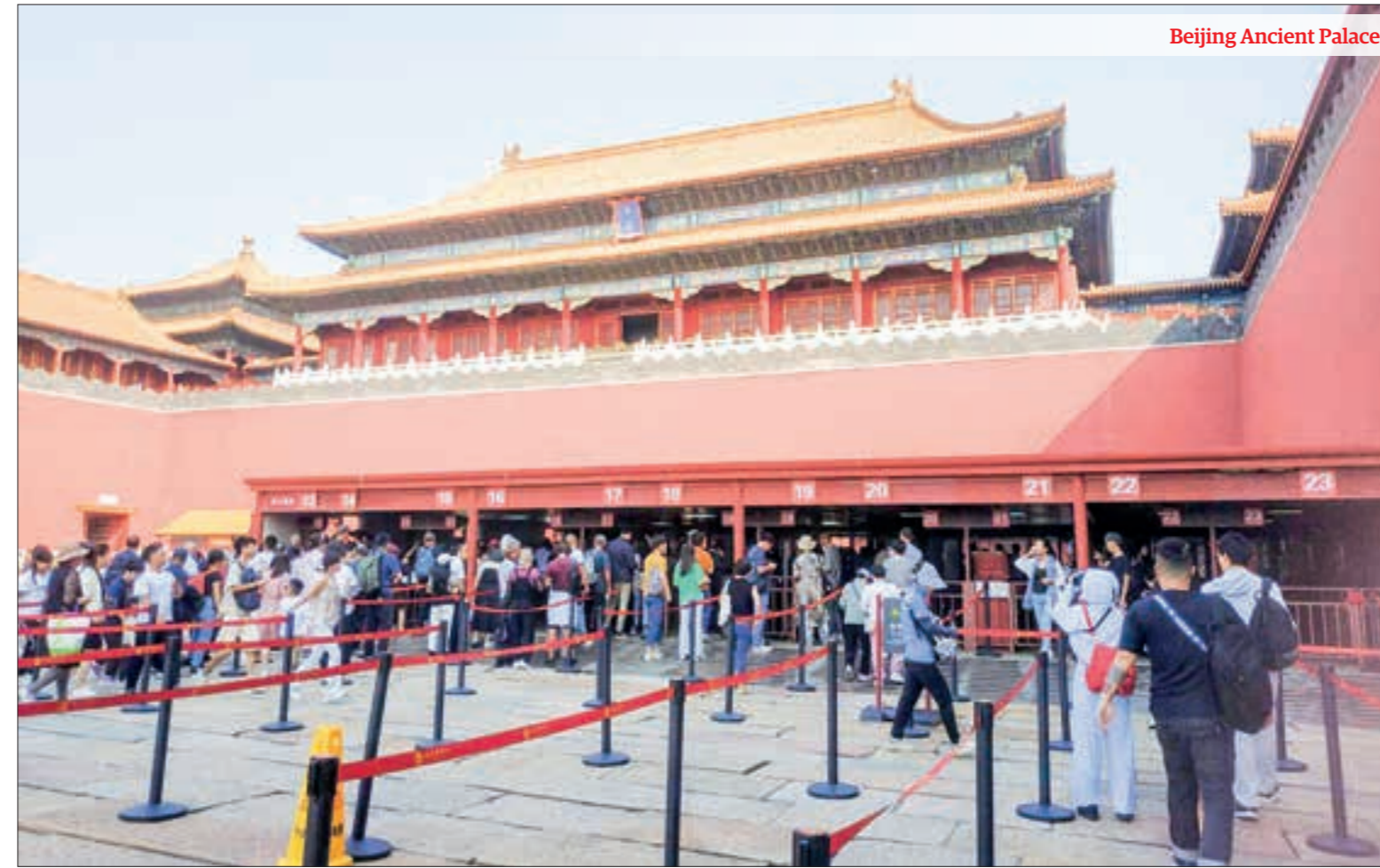
Beijing Ancient Palace