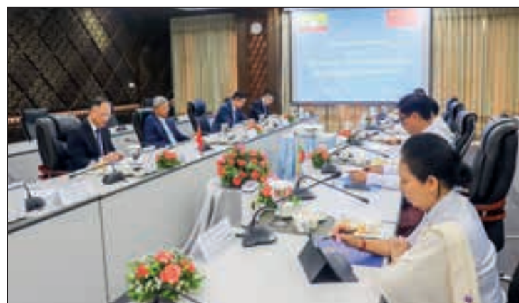
Myanmar-China bilateral consultations in progress yesterday.