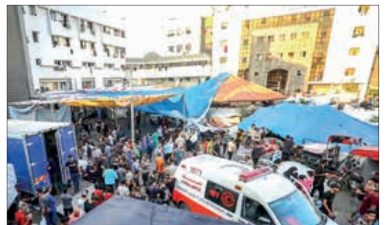
An ambulance arriving at al-Shifa hospital in Gaza City.

It further added that the centre's capacity was about 40 people. — ANI