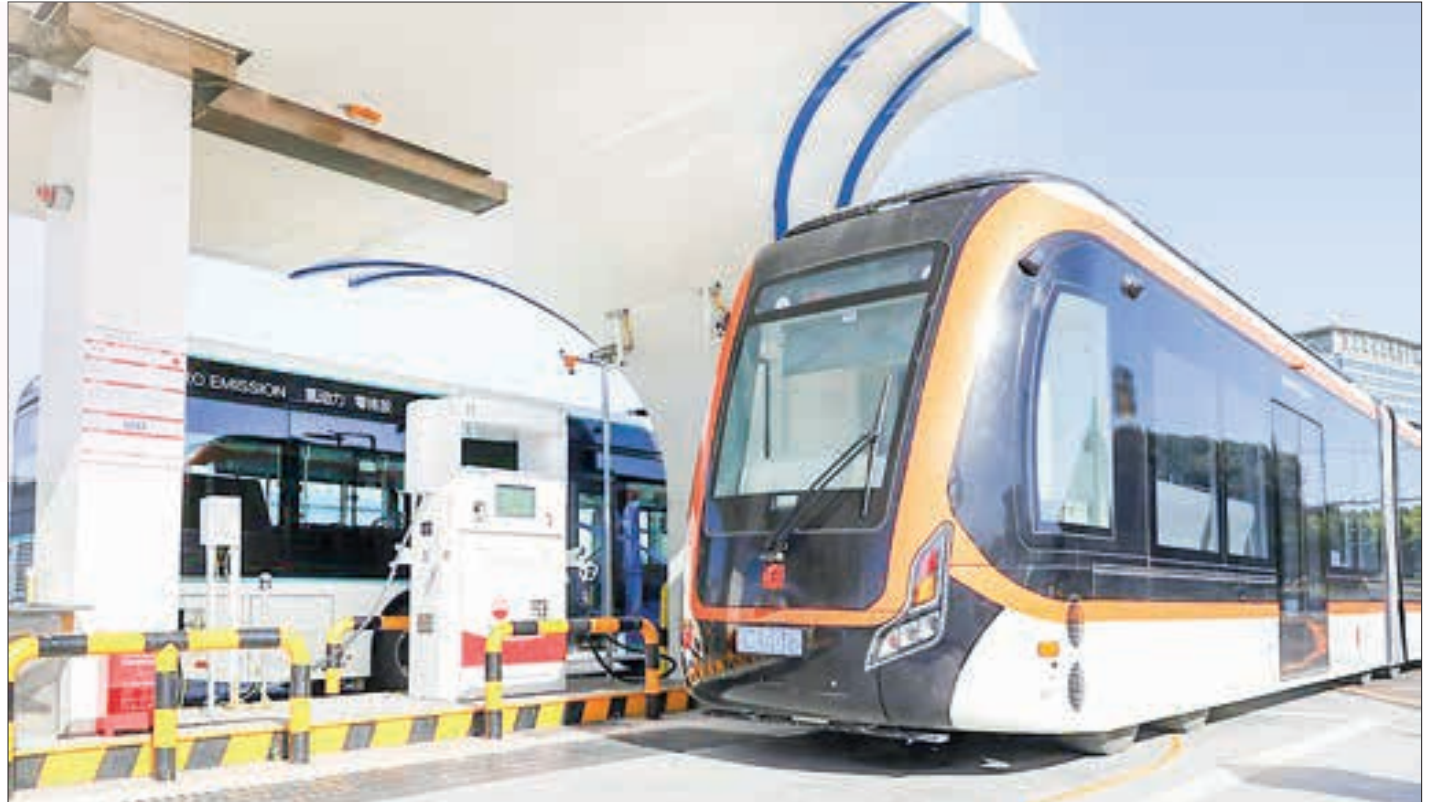
A medium-capacity hydrogen fuel cell-powered public bus (R) approaches a hydrogen refuelling station in Lingang new area of Pudong New Area in east China's Shanghai, 15 December 2022.

The two sides will exchange in-depth views on actions and cooperation against climate change, as well as support for the United Nations climate change conference in Dubai, said the ministry. — Xinhua