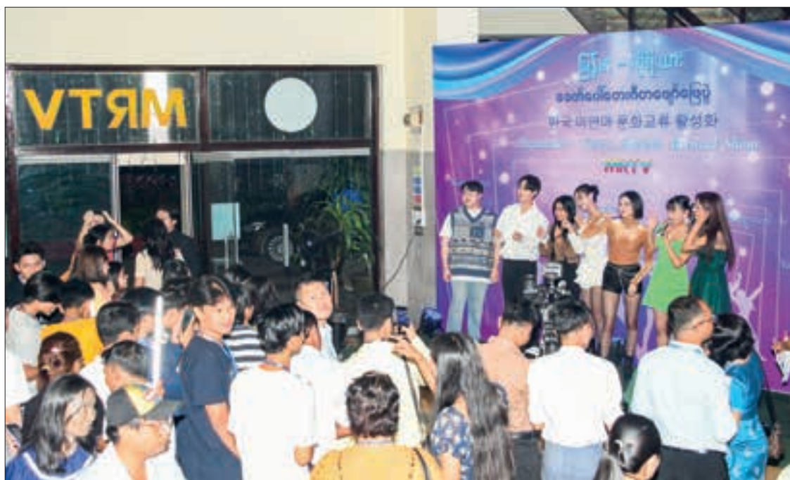
The Myanmar-Korea Musical Show in progress yesterday at MRTV in Yangon.

MRTV presents creative and active entertainment programmes like Friday Night Live Show to entertain the public every Friday, and the replay of this week will be at 10:30 am on 5 November, Sunday. — Nyein Thu/Maung Thiha (MNA)/KTZH