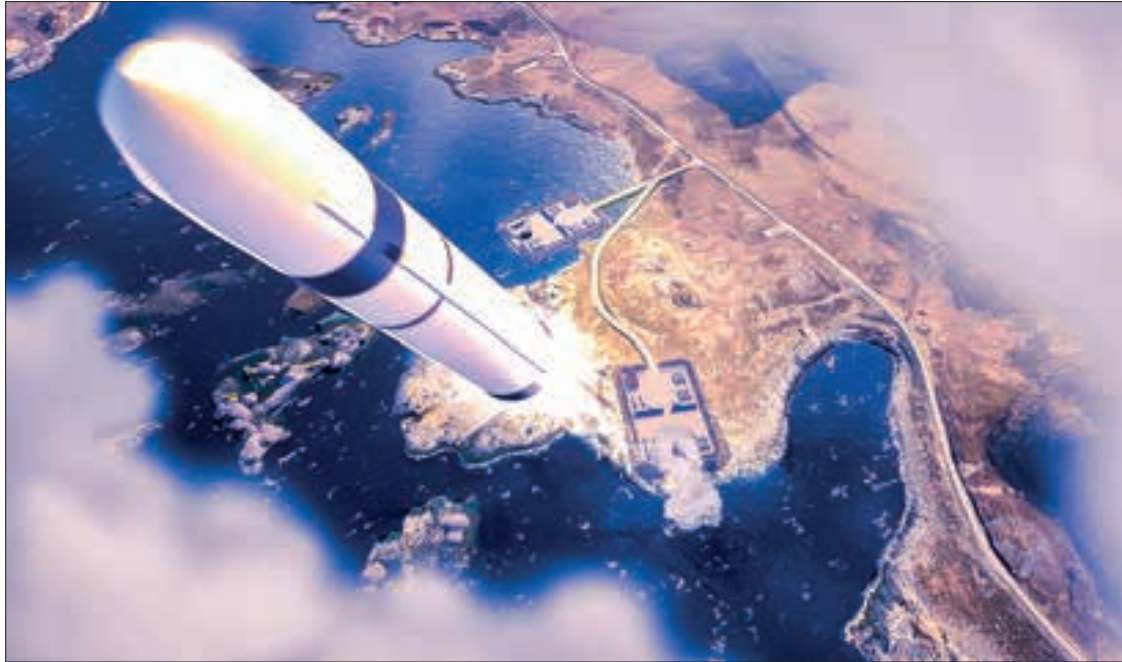
The date of the first launch is not yet known, but Isar Aerospace says it is targeting sending a first launcher to Andoya "within this year" with a first test flight "as soon as possible".

Isar Aerospace plans to complete Europe's first operational orbital spaceport at Andoya, north of the Arctic Circle.