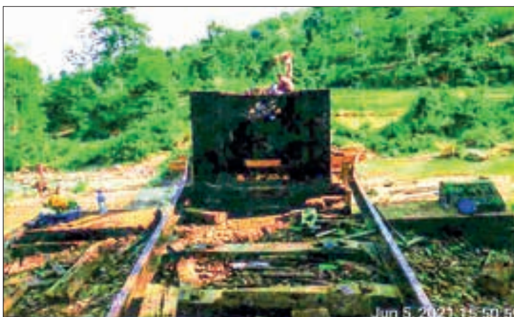
(Above & Right) The debris and damaged sections of roads and bridges in the aftermath of mine blasts by KIA.