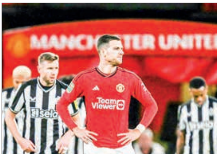
Manchester United defender Diogo Dalot during their loss to Newcastle.