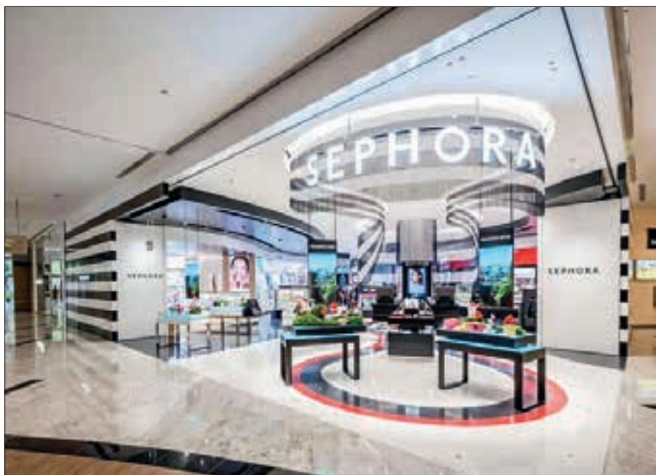
Sephora ties up with Reliance Retail Ventures to transform India's beauty retail segment.

"We are tremendously excited to partner with the largest retail group in India to step-change our business. Rising affluence, increasing urbanization and the proliferation of social media have driven greater awareness of self-care and beauty, unlocking major opportunities for prestige beauty. — ANI