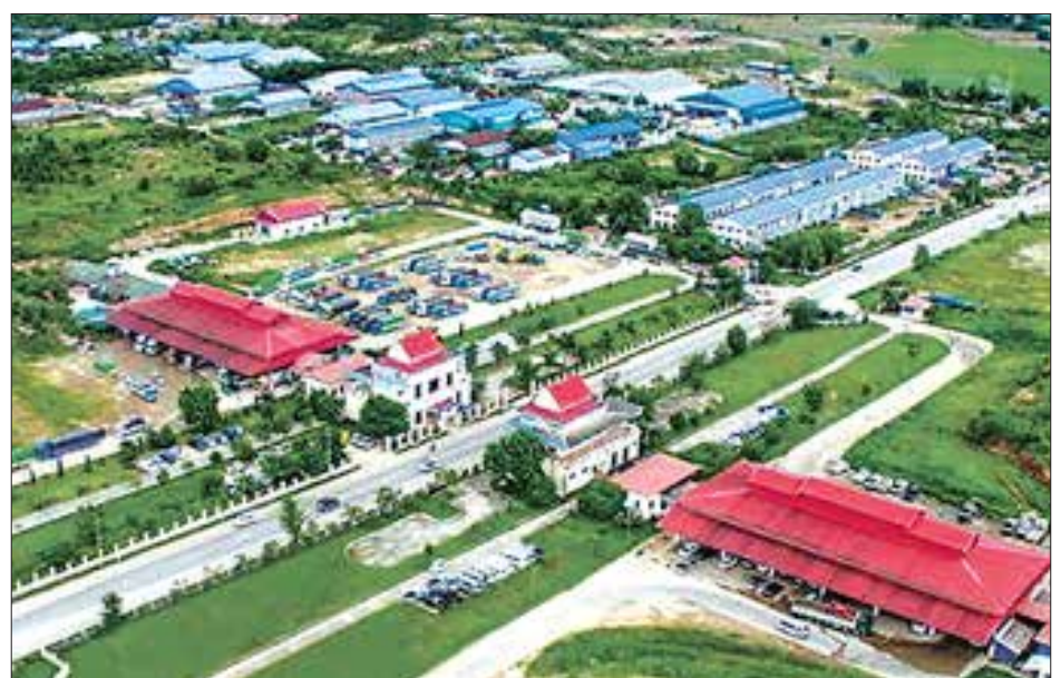
An aerial view of the Myawady Trade Zone in Kayin State.

Meanwhile, feedstuffs, bicycles, clothes, stationery, automobile parts, construction materials, machinery, bicycle parts, electronic devices, food products, cosmetics, CMP raw materials, pharmaceuti-