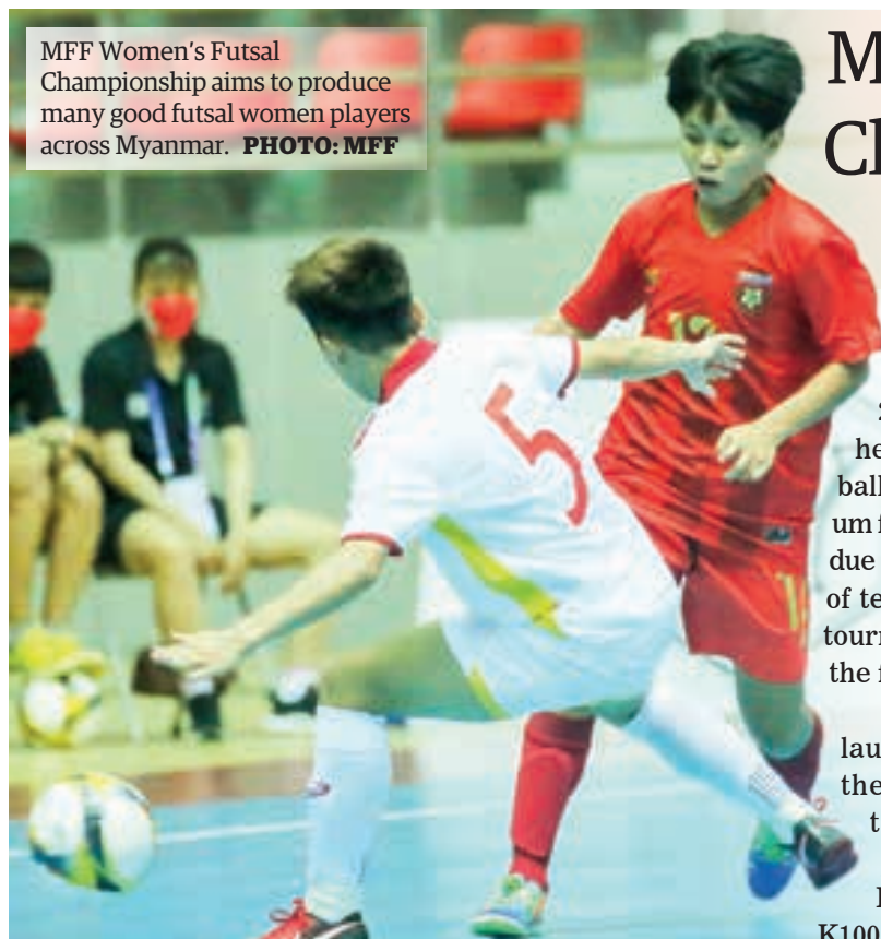
MFF Women's Futsal Championship aims to produce many good futsal women players across Myanmar.

"The session he had with us, you can see when he is with the boys he is fine, he is OK, but you could see he didn't sleep a lot. — AFP