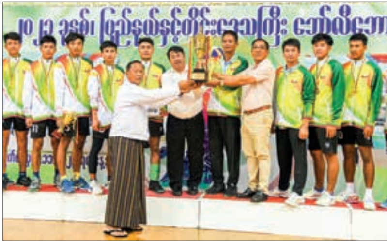
(L & R) : State Administration Council members present championship trophies to the Mandalay Region team (women's) and the Shan State team (men's) respectively yesterday in Nay Pyi Taw.

THE 2023 Inter-State and Region (Men's/Women's) Volleyball Tournament Final and Awarding Ceremony was held yesterday at Wunna Theikdi