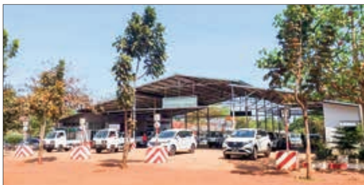
Vehicle inspection underway in the previous year.

The vehicle licence renewals are being processed without inspecting vehicles, as implemented since the outbreak of COVID-19, and licence renewals continue to be extended without vehicle inspections. — TWA/MKKS