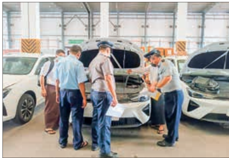
Officials checking new arrivals of battery electric vehicles at Yangon Port.

THE China-made Dayun Yuehu (VIP edition) EVs, the China-made MG, MG5 EVs and the China-made GAC Toyota BZ4X EVs arrived at the Yangon Port yesterday with the approval of the Steering Committee on National-Level Development of Electric Vehicles and Related Industries.