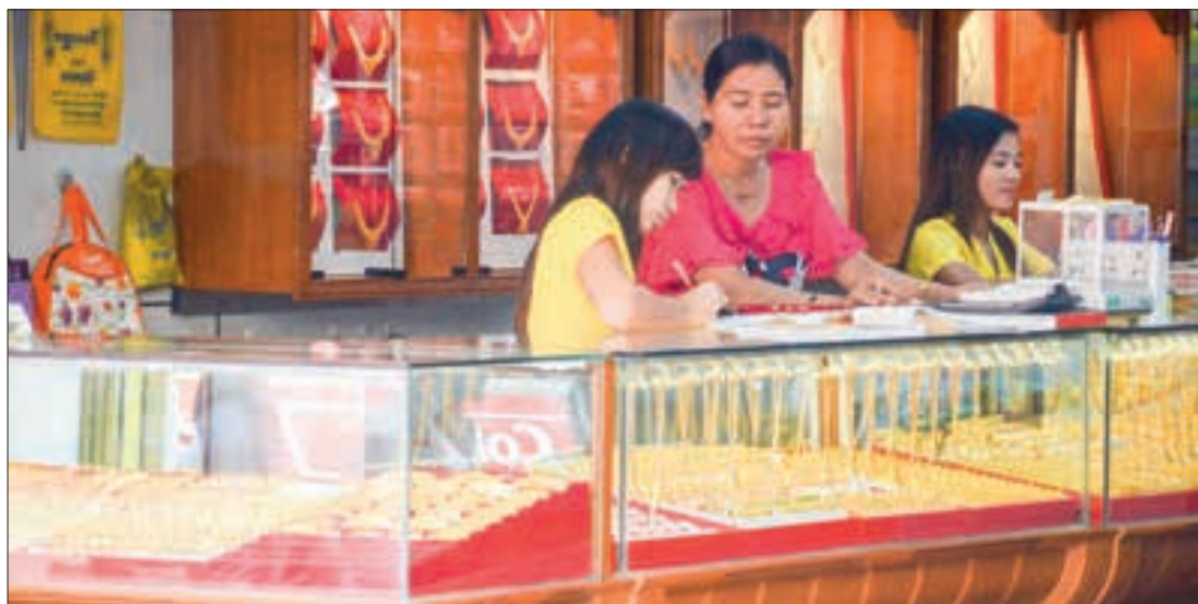
The picture shows a gold jewellery outlet in Yangon.

THE price of pure gold surged to K3.55 million per tical (0.578 ounce or 0.016 kilogramme) in the grey market tracking the rise in spot gold price to US$1,990 per ounce.