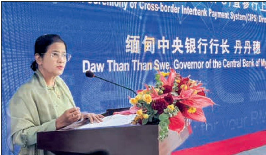
Central Bank of Myanmar Governor Daw Than Than Swe addresses the launching ceremony of the cross-border inter-bank yuan payment system (CIPS).

CENTRAL Bank of Myanmar Governor Daw Than Than Swe said that the connection of the RMB Cross-border Interbank Payment System (CIPS) will increase bilateral trade and investment between Myanmar and