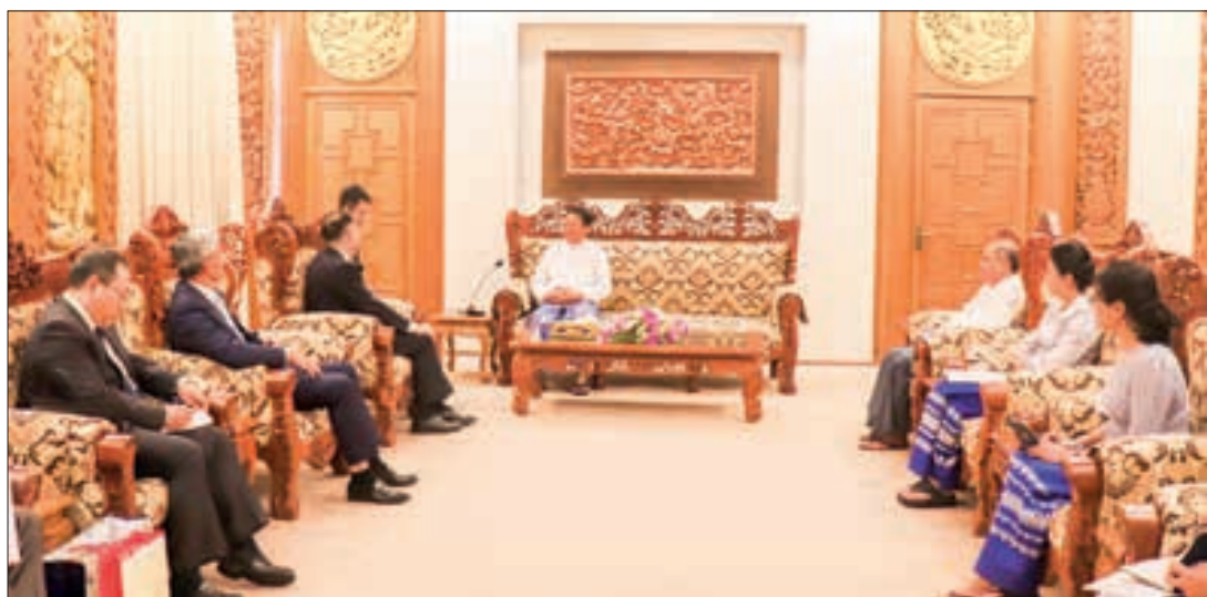
Chinese Assistant Minister for Foreign Affairs Mr Nong Rong calls on Union Minister U Than Swe yesterday in Nay Pyi Taw.

DEPUTY Prime Minister and Union Minister for Foreign Affairs U Than Swe received the Co-chair of Mekong-Lancang Cooperation and Head of Delegation of China, Mr Nong Rong, Assistant Minister for Foreign Affairs at the