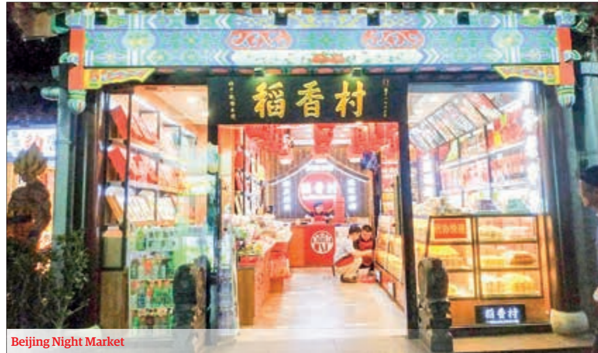
Beijing Night Market

We visited the ASEAN China Centre on the morning of 13 September. The officials explained the objectives, performances and future prospects of the ACC. The ACC is to promote investment, trade, education, culture, and tourism, and enhance exchanges and cooperation in information technology and media sectors between ASEAN and China. Afterwards, we left for People's Daily HQ and officials concerned showed news archives and Live broadcasting studios and also demonstrated how they broadcast Live, programmes through videos. People's Daily is the official newspaper run by the CCP, accumulating over two million copies daily. Although the rise in digital media and social media trends impacted the print media, the People's Daily can run with the largest million copies daily. This is a big inspiration to us.