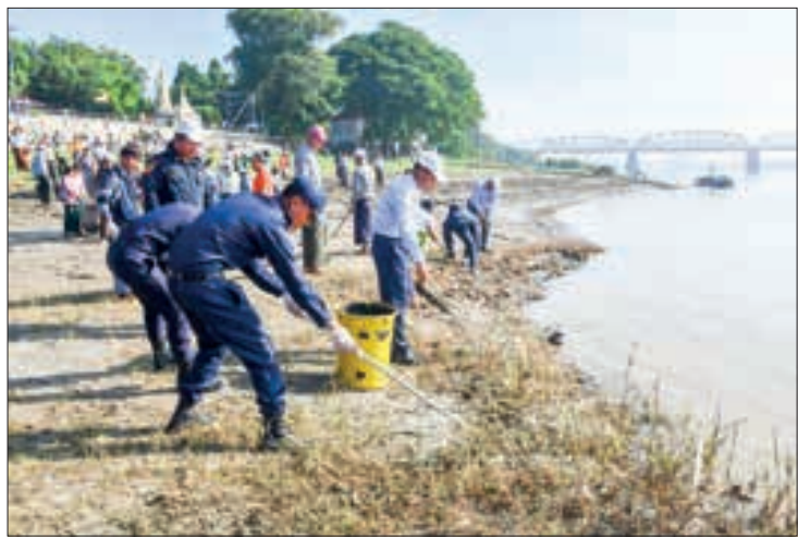
Locals and departmental personnel carrying out collective plastic garbage collection activities in Sagaing Region.

THE Sagaing Region Environmental Conservation Department under the Ministry of Natural Resources and Environmental Conservation is collaborating with the Sagaing Region Development Committee to remove plastic waste while restricting the disposal of plastic into the Ayeyawady