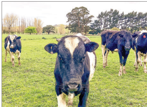
This picture taken on 27 September 2023 shows cattle grazing on the farm of Kate Wyeth, a sheep and beef farmer, near Wellington.

A new report advised New Zealand dairy, meat and seafood exporters to keep up with rapidly evolving agri-food sustainability policies in