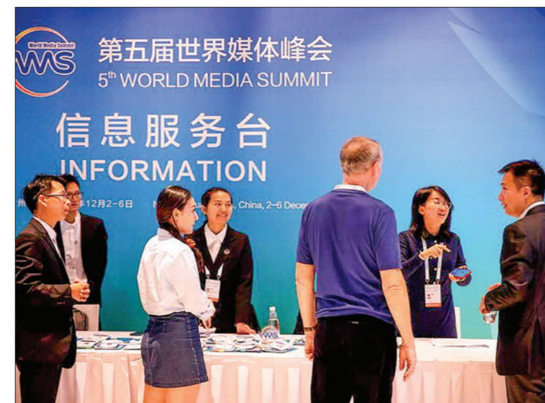
Staff members provide service for guests at the venue of the 5 th World Media Summit in Nansha Bay Marina Convention Centre in Guangzhou, south China's Guangdong Province, 2 December 2023. The fifth summit hosted by Xinhua News Agency has started from 2 December in China's Guangzhou city of Guangdong Province and Kunming city of Yunnan Province.