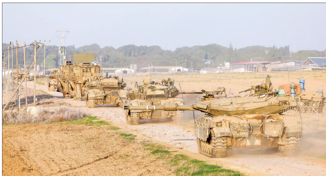
Israeli military tanks roll near the border with the Gaza Strip on 3 December 2023 amid continuing battles between Israel and the militant group Hamas.

Its military branch also said it had fired rockets towards Beersheba in southern Israel on Tuesday, while the Israeli military said rocket warning sirens sounded there. — AFP