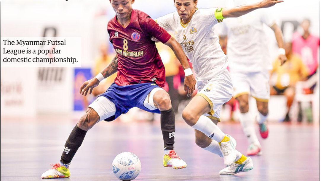
The Myanmar Futsal League is a popular domestic championship.

The fixtures for both leagues will be released in the coming days. — Shine Htet Zaw/KZL