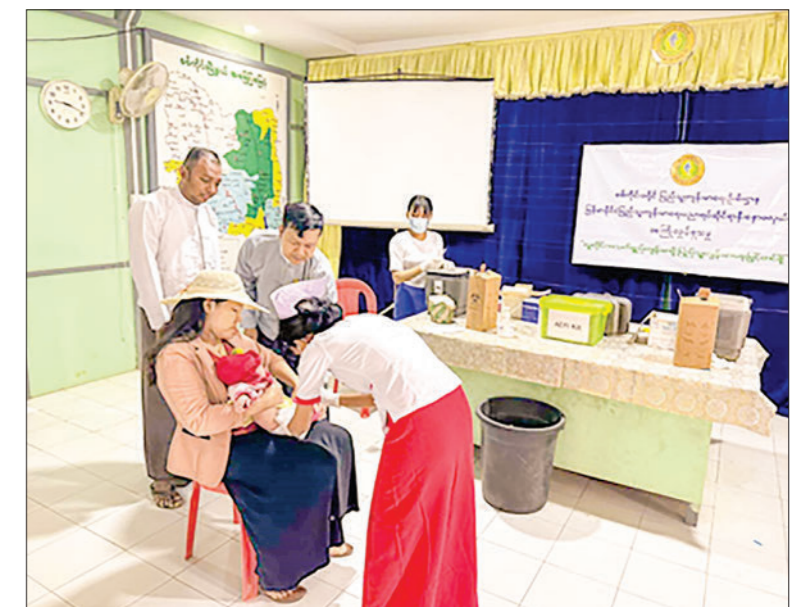
Immunization session in Sagaing Township Public Health Department.

Additionally, this MPHC 2023 will support as a hub for knowledge exchange, networking, and collaboration, ultimately contributing to the improvement of public health practices as well as the well-being of communities and efforts will be taken to build a significant milestone of the Ministry of Health.