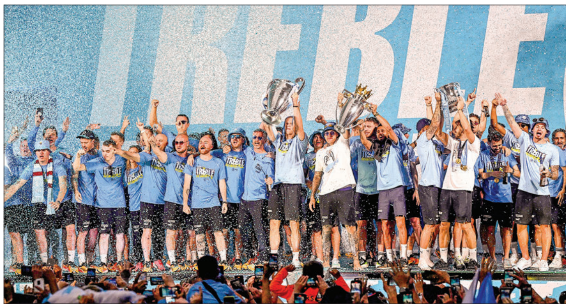
Manchester City's players celebrate on stage with their trophies following an open-top bus victory parade for their European Cup, FA Cup and Premier League victories, in Manchester, northern England on 12 June 2023.

Sky will screen a minimum of 215 live matches per season while TNT will broadcast 52. BBC Sport will continue to broadcast highlights via its Match of the Day programme.