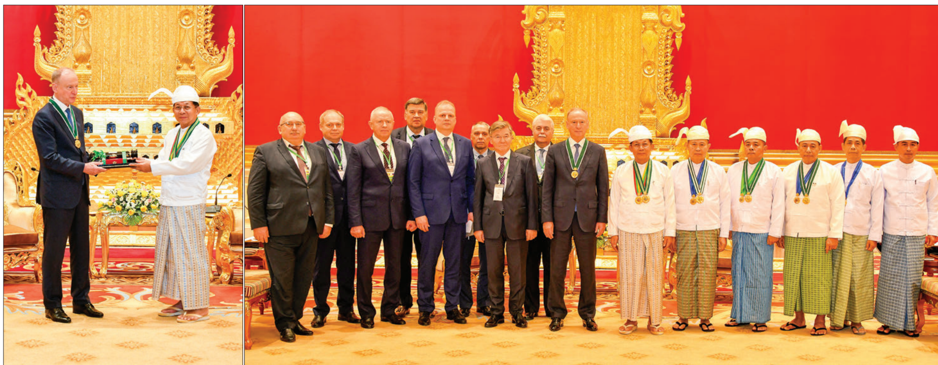
(L&R): Senior General Thadoe Maha Thray Sithu Thadoe Thiri Thudhamma Min Aung Hlaing presents the Thray Sithu title to Russian Security Council Secretary Mr Nikolai Patrushev, and the documentary group picture taken at the event yesterday in Nay Pyi Taw.

C HAIRMAN of the State Administration Council Prime Minister Senior General Thadoe Maha Thray Sithu Thadoe Thiri Thudhamma Min Aung Hlaing conferred the honorary title of Thray Sithu on Mr Nikolai Patrushev, Secretary of the Security Council of the Russian Federation, for his excellent performance in strengthening