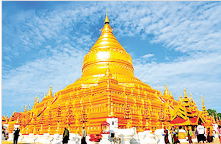
Pilgrims seen at the Shwezigon Pagoda in Bagan.