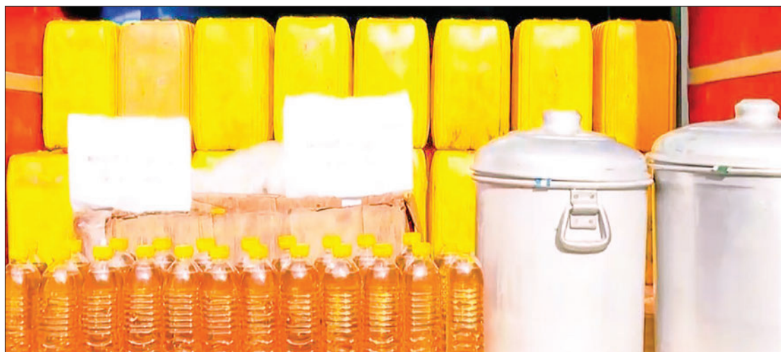
A shop sells cooking oil in retail and wholesale.

distribution amount for eight districts in Ayeyawady, districts like Patheingyi, Pyaw, and Maubin received about 500 drums for the day, where the daily number of drums is 950.