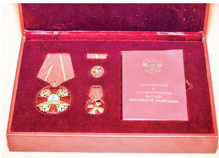
The decoration of the Order of Alexander Nevsky – one of the highest honours in Russia.