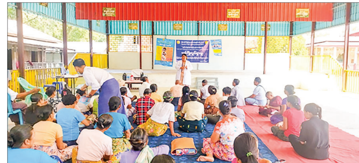
Health education session in Pynmataw village, Yamethin Township.

non-communicable diseases, etc., all over the country.