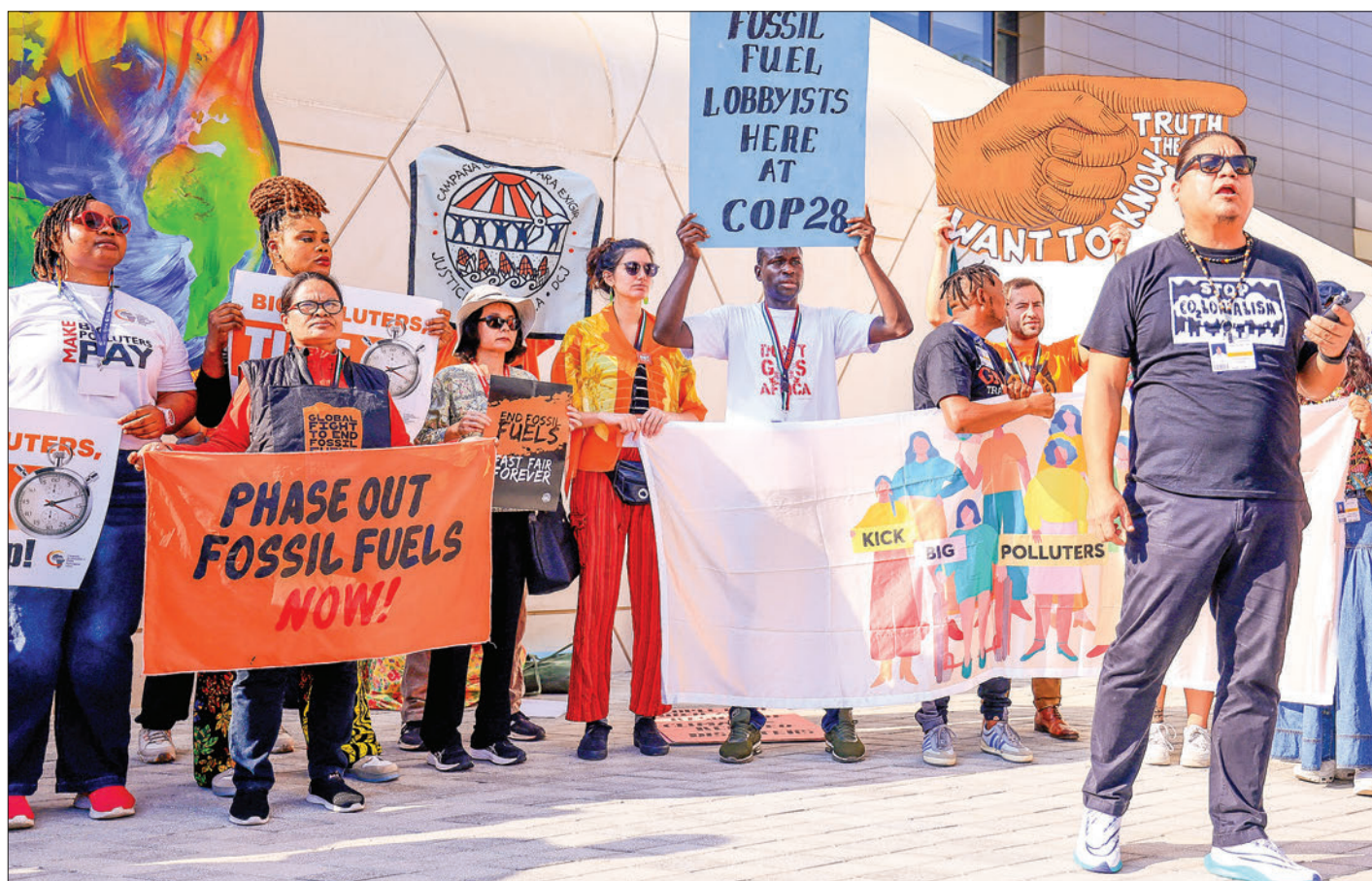
Environmental activists display placards during a demonstration at the venue of the COP28 United Nations climate summit in Dubai on 5 December 2023.

THE UN released the latest draft of a global climate agreement on Tuesday presenting all options on fossil fuels — from phasing them out to not discussing them at all.