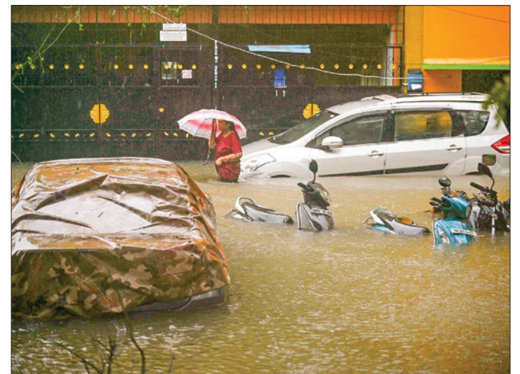
A resident wades through a flooded street after heavy rains in Chennai on 4 December 2023.

Apple iPhone manufacturers Foxconn and Pegatron and automaker Hyundai suspended their operations in Tamil Nadu due to the storm, local media reported. — AFP