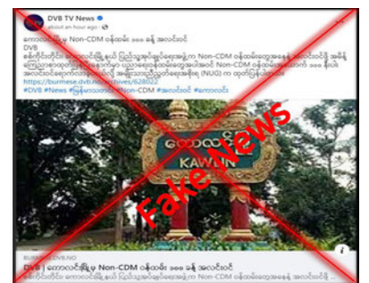
Screenshot validates false claims.

Malicious media are spreading misinformation in order to threaten the civil servants who are fulfilling their national duties and the local people who want to live in peace. — MNA/KZL