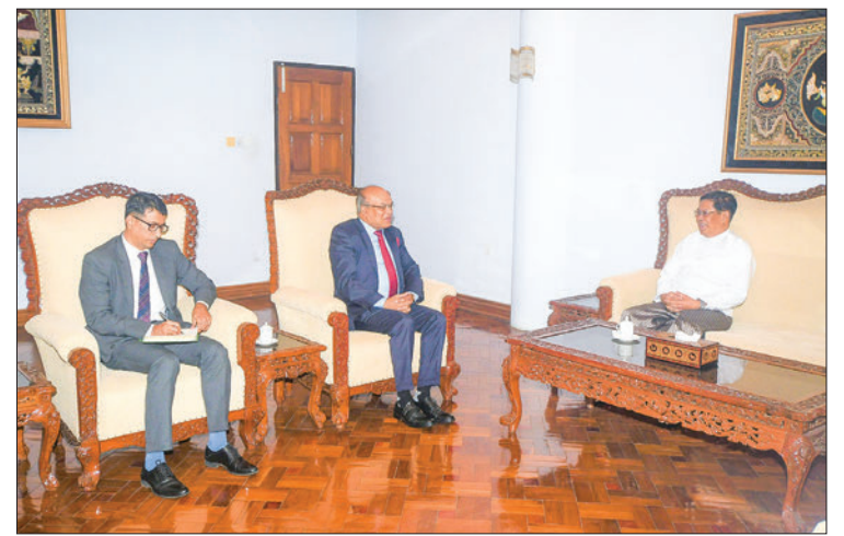
The Bangladeshi ambassador calls for Deputy Premier MoFA Union Minister U Than Swe yesterday in Yangon.

of bilateral relations between the two countries, expansion of mutually beneficial cooperation in various areas, including bilateral trade, investment and connectivity, successful commencement of repatriation of verified displaced persons from Rakhine State, and regional and international matters of common interest. — MNA