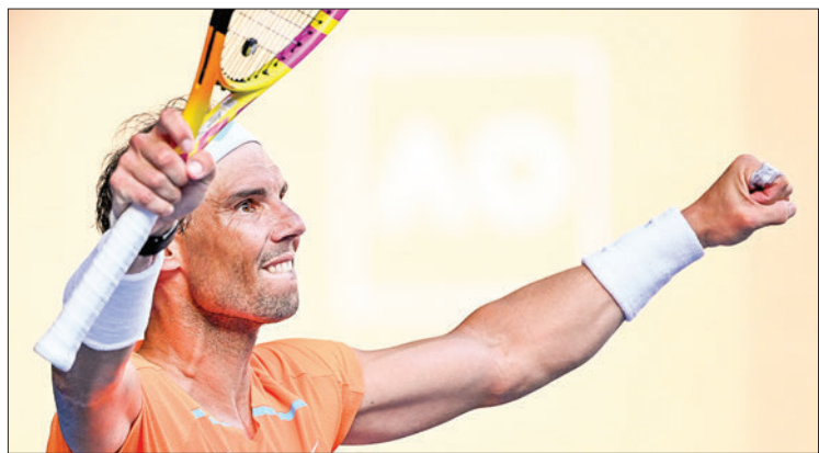
(FILES) Spain's Rafael Nadal celebrates after winning against Britain's Jack Draper during their men's singles match on day one of the Australian Open tennis tournament in Melbourne on 16 January 2023.

FORMER world number one Rafael Nadal said on Monday he expects “nothing” from himself before his return to the courts next month. Nadal, 37, has been out with a hip injury since last January but is set to feature at Brisbane in the near year.