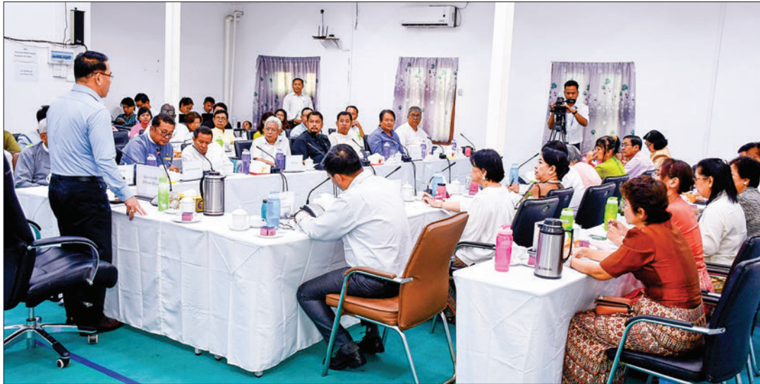
Union Information Minister U Maung Maung Ohn presides over the meeting on film and video censorship yesterday in Yangon.

UNION Minister for Information U Maung Maung Ohn attended a meeting regarding film and video censorship at the Film Development Centre in Yangon yesterday.