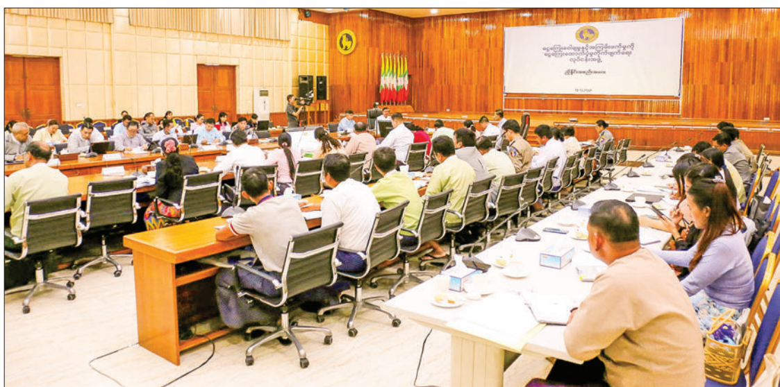
The meeting to identify the risk of money laundering associated with high-risk crimes in progress yesterday.

Identifying high-risk drug crimes, corruption, cross-border smuggling, and money launder-