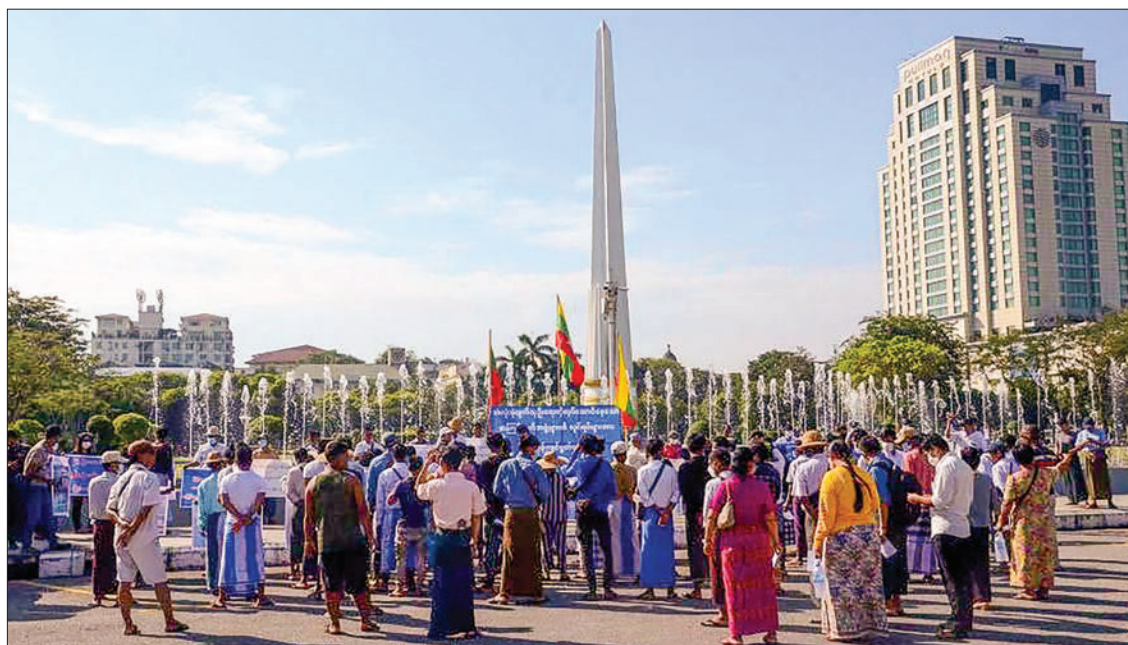
Counter-terrorism campaign in action yesterday in Yangon.

A protest took place yesterday in Yangon, the commercial capital of Myanmar, to denounce the acts of terrorist groups aiming for total destruction.