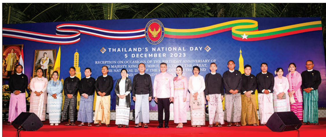
The documentary group photograph of the Thailand's National Day and Father's Day event yesterday in Yangon.

DEPUTY Prime Minister Union Minister for Planning and Finance U Win Shein and his wife attended the celebration of Thailand's National Day and Thailand's Father's Day, which is the birthday of His Majesty King Bhumibol Adulyadej of Thailand, held in the compound of the Thai ambassador's residence at No 94, Pyay Road, Dagon Township in Yangon yesterday evening.