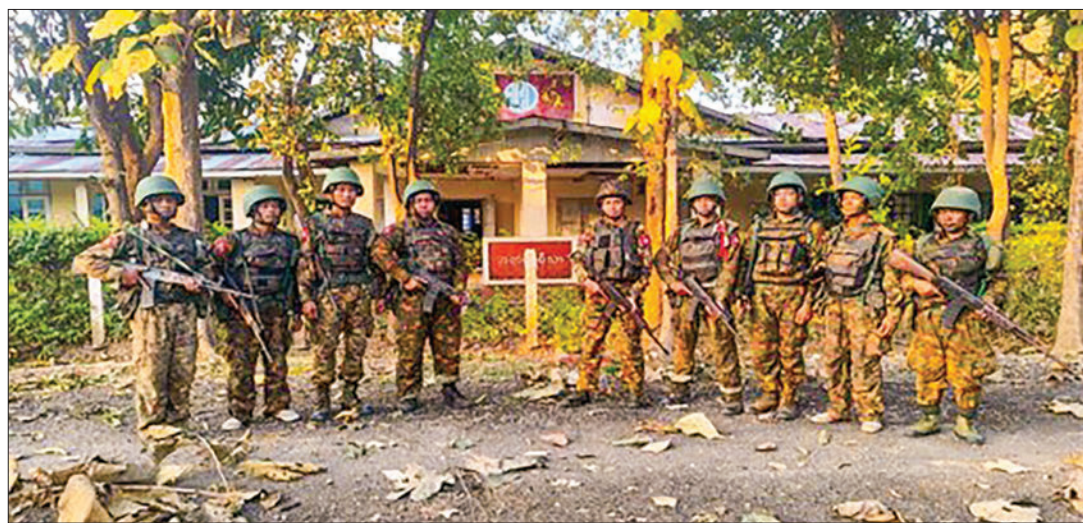
Tatmadaw members stand proudly in victorious combat uniforms outside the officers’ mess following successful counterattacks on KNLA and PDF terrorists.

MALICIOUS media outlets spread false information on social media that 1,500 members of KNLA and PDF terrorists attacked the regional bases and exploded the bridge in Mone, Kyaukkyi Township, Bago Region. They conquered Mone on 3 December.