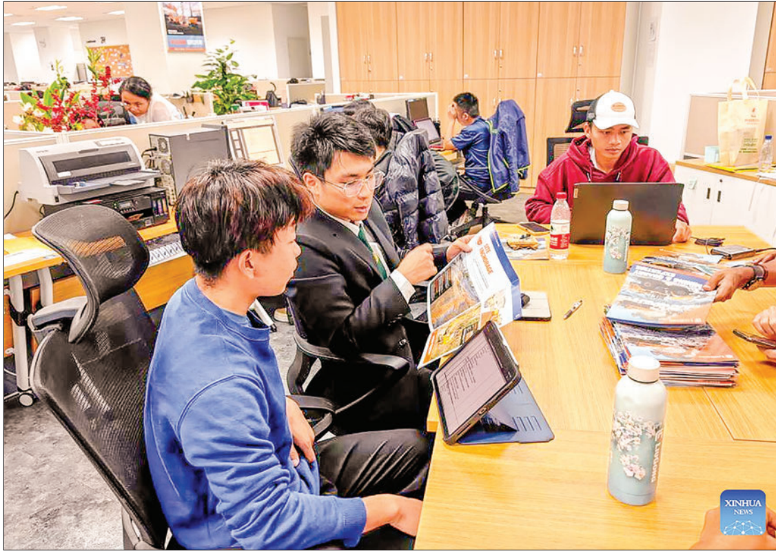
A Thai student (2 nd L) discusses the use of mining machinery with his colleagues at the Guangxi Liugong Machinery Co Ltd in Liuzhou, south China's Guangxi Zhuang Autonomous Region, 26 October 2023.

FOLLOWING teaching videos, groups of Indonesian students have been collaborating to assemble torque converters as part of their coursework at a vocational school in the city of Liuzhou, south China's Guangxi Zhuang Autonomous Region.