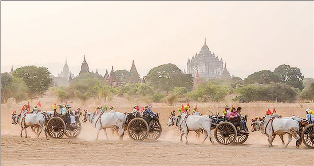
A serene pilgrimage scene featuring traditional bullock carts in the Bagan Ancient Cultural Heritage Zone.

The people are urged to receive vaccination of Covid-19 without fail as full-time vaccination of Covid-19 and receiving booster shots can effectively mitigate infection of the virus, severe suffering from the disease and increasing of death rate based on the disease.