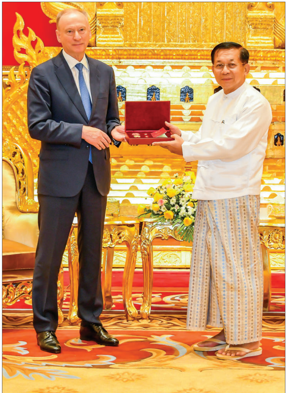
State Administration Council Chair PM Senior General Min Aung Hlaing receives the Order of Alexander Nevsky from Secretary of the Security Council of the Russian Federation Mr Nikolai Patrushev yesterday.