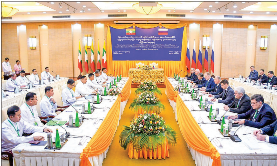
The Consultations between the Ministry of Home Affairs and the Security Council of the Russian Federation in progress yesterday in Nay Pyi Taw.

At the meeting, the two parties discussed the bilateral relations in the international arena, military cooperation, military-technical cooperation, international information security, interaction between law enforcement organizations, sector-wise cooperation and strategic cooperative partnership.