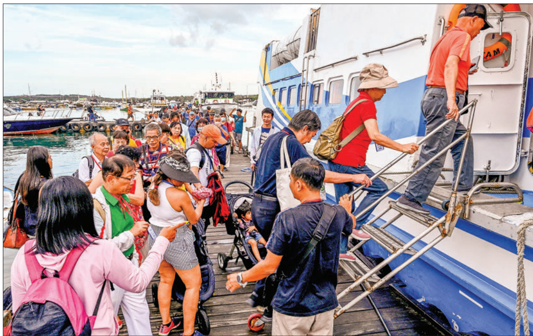
Tourists board a ferry at a pier in Denpasar on the Indonesian resort island of Bali on 2 December 2023.