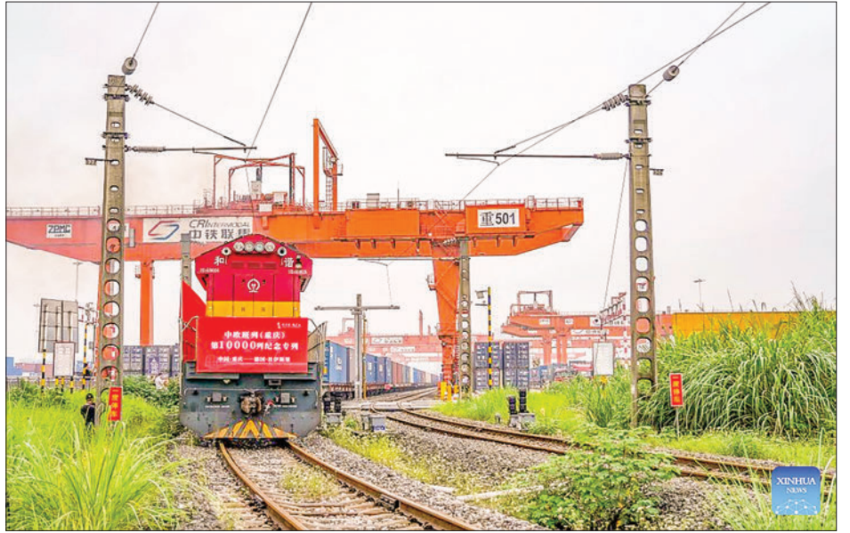
A cargo train marking the 10,000 th trip made by China-Europe freight trains operated by the China-Europe Railway Express (Chongqing), departs from Tuanjie Village Central Railway Station in Chongqing, southwest China, 23 June 2022.

The company said in a statement that it will work to improve the transport capacity and services of China-Europe freight trains in its efforts to build an international logistics brand, promote international economic and trade exchanges, and support the high-quality development of Belt and Road cooperation among nations. — Xinhua