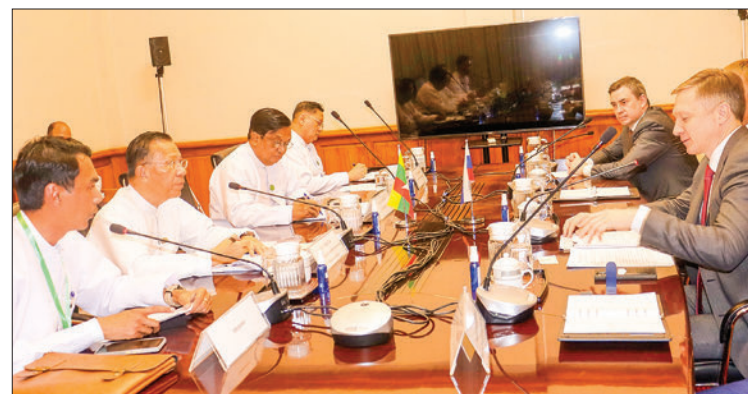
The discussions between the Union ministers and the Russian delegation underway yesterday.

The meeting was also attended by the deputy minister for Industry and senior officials from the Ministry of Investment and Foreign Economic Relations and the Ministry of Industry. — MNA