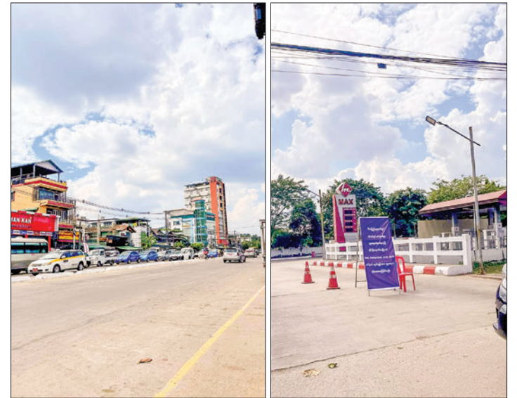
Cars waiting for refuelling at one of the petrol stations in Yangon.

U Aung Ko, a taxi driver from South Okkalapa Township, shared with the GNLM, "Cars have to wait from ear-