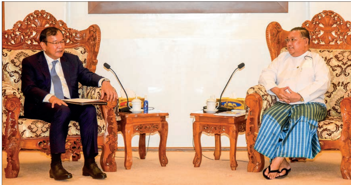
Union Minister U Wunna Maung Lwin receives Mr Prak Sokhonn, Deputy Prime Minister, Minister of Foreign Affairs and International Cooperation and special envoy of the ASEAN Chair Cambodia.

During the meeting, the Union minister exchanged views with the special envoy on the ongoing implementation of the five-point consensus, and way forward in delivering humanitarian assistance to Myanmar in cooperation with the AHA Centre, current ASEAN Chair, and the ASEAN Secretariat.