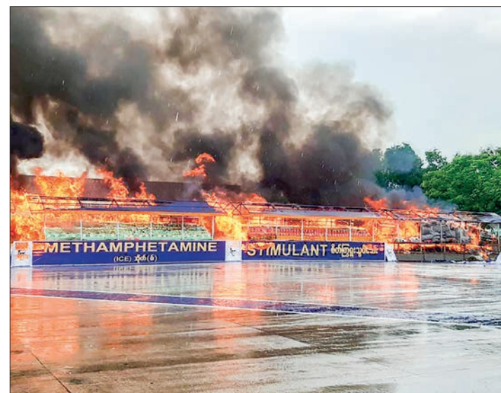
This photo taken on 26 June 2022 shows authorities are destroying the seized drugs.

On 26 June 2022, a total of 79 seized narcotics and precursor chemicals worth K118,882 billion (more than USD 642.60 million) were destroyed in Mandalay, Yangon, and Taunggyi. — TWA/GNLM