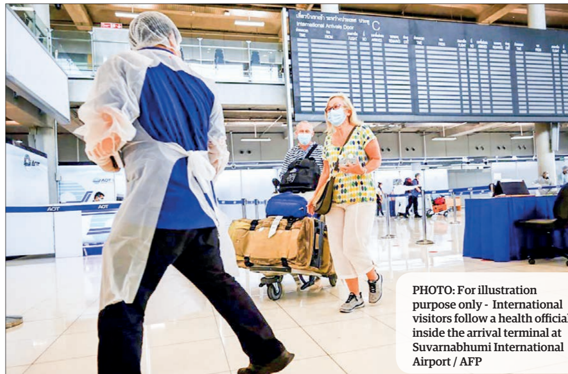
PHOTO: For illustration purpose only - International visitors follow a health official inside the arrival terminal at Suvarnabhumi International Airport / AFP

While expressing concerns over the sustained transmission of the virus the DG said that the children and pregnant women are at a high risk of catching the