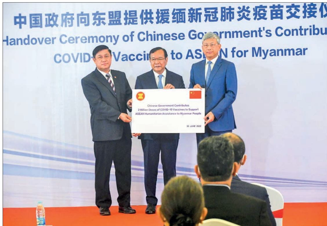
The Chinese ambassador presents two million vaccines donation to the special envoy of the ASEAN Chair and the ASEAN's deputy secretary-general yesterday.

THE handover ceremony of the Chinese Government's contribution of COVID-19 vaccines to ASEAN for Myanmar to the special envoy of ASEAN Chair on Myanmar was held at the residence of the Chinese ambassador to Myanmar in Yangon yesterday.