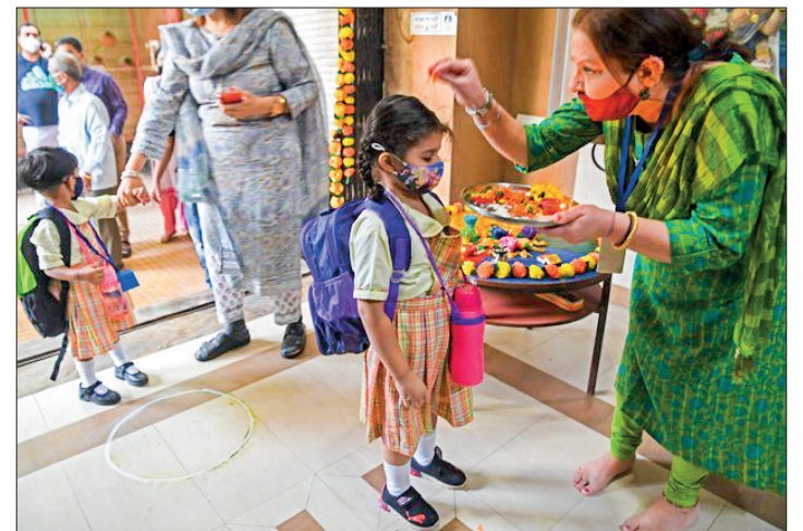
A teacher traditionally welcomes a student upon her arrival at a school in Mumbai on 24 January 2022, after schools were reopened that were closed as a preventive measure to curb the spread of the Covid-19 coronavirus.

Besides, 39 deaths due to the pandemic since Wednesday morning took the total death toll to 525,116. The daily positivity rate stood at 4.16 per cent, while the weekly positivity rate was 3.72 per cent, revealed the ministry. So far, 42,822,493 people have been successfully cured and discharged from hospitals, of whom 13,827 were discharged during the past 24 hours.—ANI