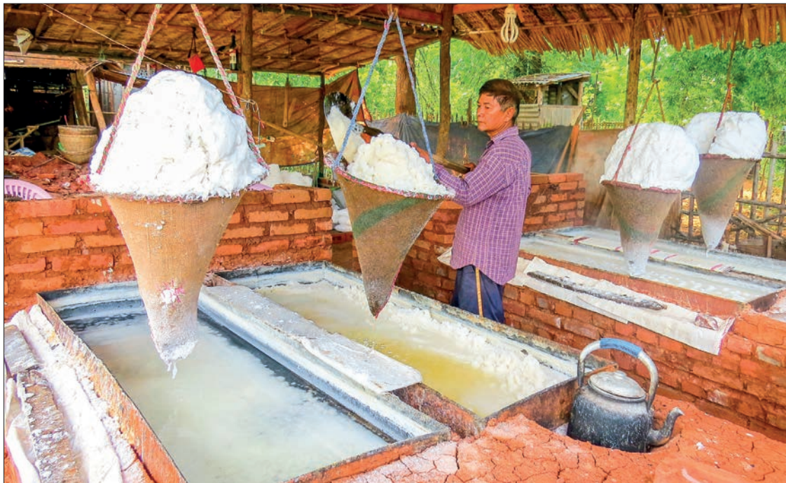
A worker is processing the seawater salt at one production farm in Mon State.

The prices of raw salt were worth K80-110 per viss in the