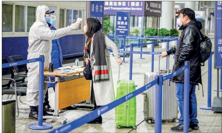
A security personnel checks the temperature of passengers arriving at the Shanghai Pudong International Airport in Shanghai on 4 February 2020.

DESPITE the palpable anger from the public, China on Wednesday retained its strict “zero-Covid” policy, while easing its quarantine policy for international arrivals from fourteen to seven days. China slashed the period by more than half in the biggest relaxation of entry restrictions in the country since the pandemic began, reported CNN.