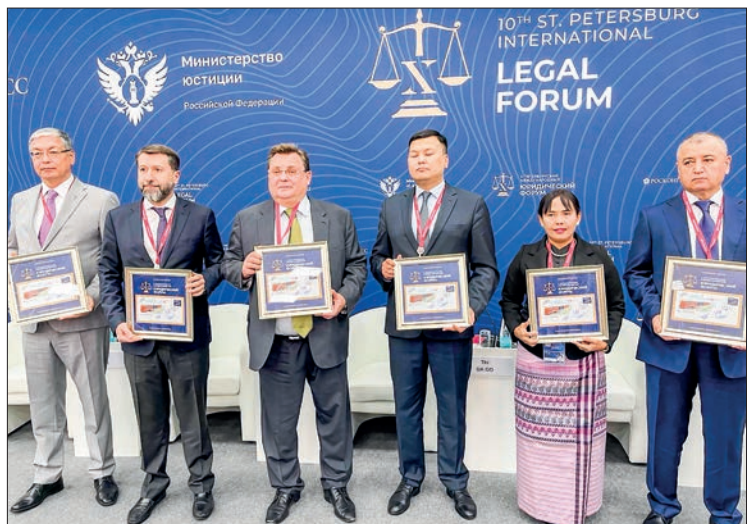
The Union Minister for Legal Affairs and Union Attorney-General takes the documentary photo at the forum.

A Myanmar delegation led by Union Minister for Legal Affairs and Union Attorney-General Dr Thida Oo attended the 10 th St Petersburg International Legal