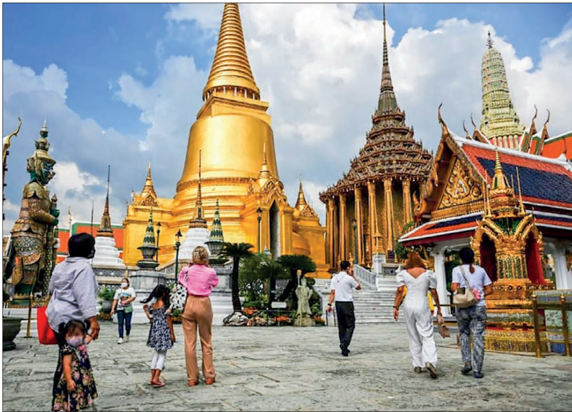
Local visitors enter the Grand Palace on the day of reopening in Bangkok on 1 Nov 2021, as Thailand welcomes the first groups of tourists fully vaccinated against the Covid-19 coronavirus without quarantine.