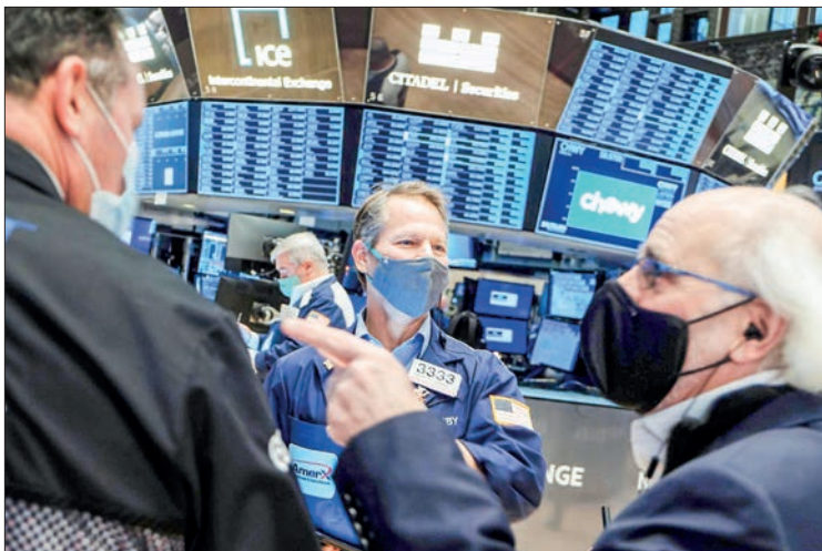
The US economy in the first quarter of 2022 shrank 1.5 per cent from the previous quarter on an annualized basis, according to the second estimate by the US Department of Commerce.

The United States is in a mild recession with anticipated negative GDP growth in the first half and the slowdown is going to continue into the third quarter, according to Siegel. The US economy in the first quarter of 2022 shrank 1.5 per cent from the previous quarter on an annualized basis, according to the second estimate by the US Department of Commerce.—Xinhua