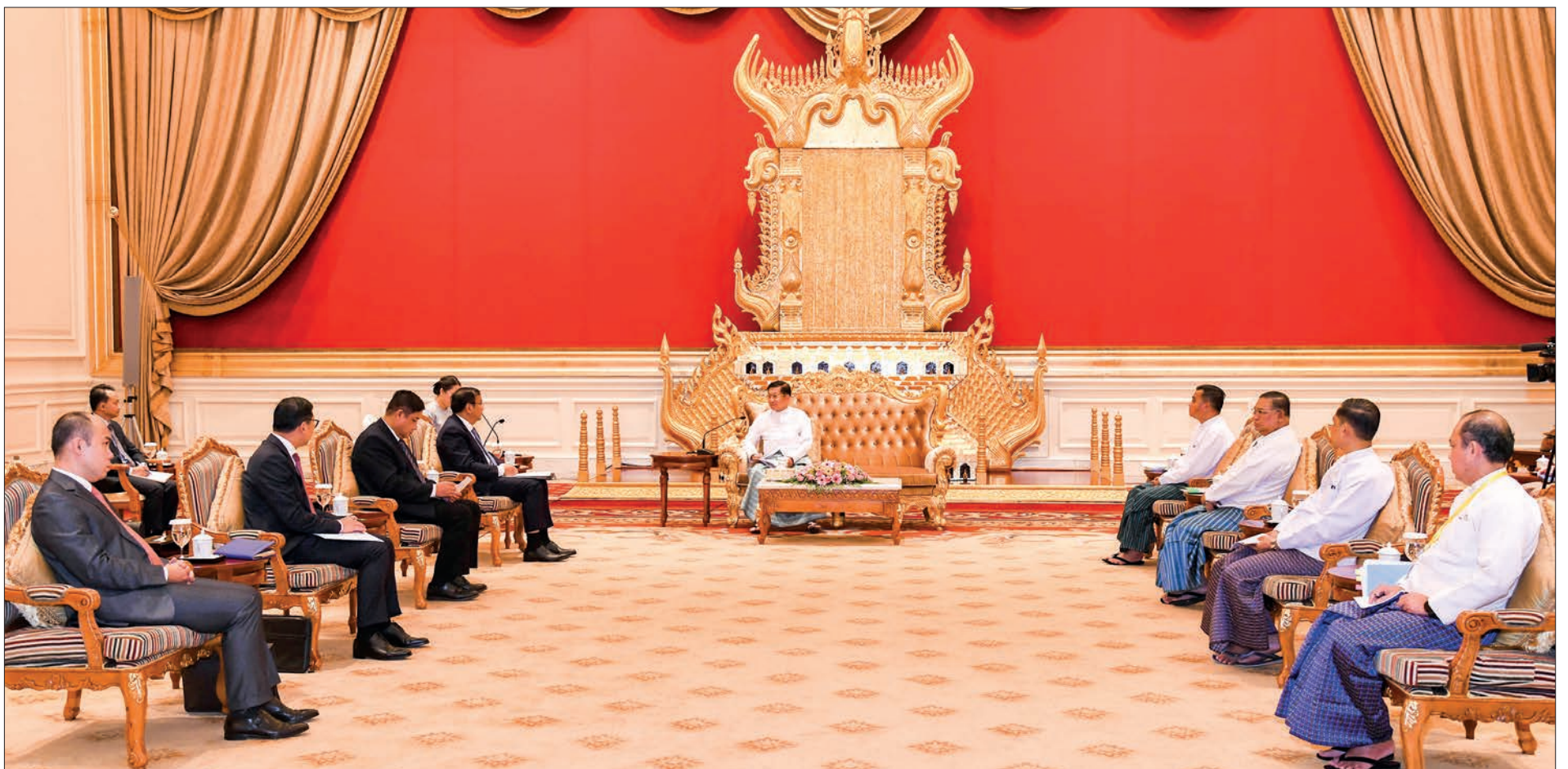
State Administration Council Prime Minister Senior General Min Aung Hlaing receives the delegation headed by Mr Prak Sokhonn, Special Envoy of the ASEAN Chair on Myanmar, Cambodian Deputy Prime Minister, Minister for Foreign Affairs and International Cooperation in Nay Pyi Taw on 30 June 2022.

CHAIRMAN of the State Administration Council Prime Minister Senior General Min Aung Hlaing received Mr Prak Sokhonn, Special Envoy of the ASEAN Chair on Myanmar, Cambodian Deputy Prime Minister, Minister for For-