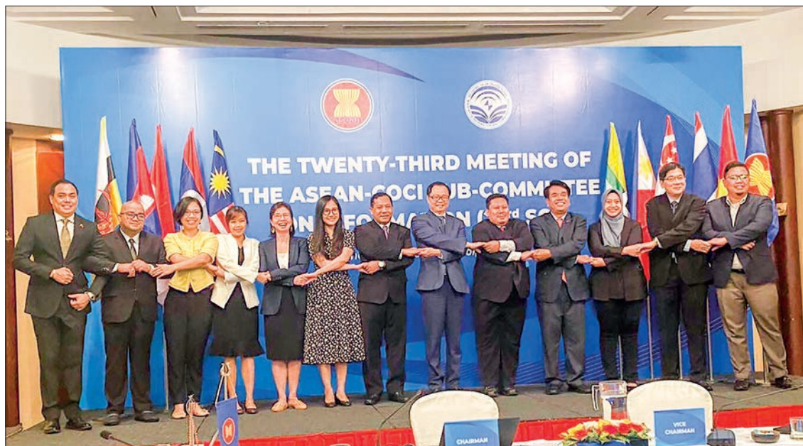
The MRTV D-G joins the 23 rd ASEAN SCI meeting in Hanoi, Viet Nam.