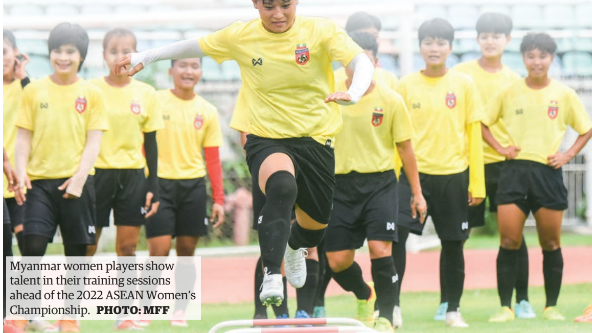
Myanmar women players show talent in their training sessions ahead of the 2022 ASEAN Women's Championship.

THE Myanmar women's team has announced the team finalists for the 2022 ASEAN Women's Championship, according to the Myanmar Football Federation.