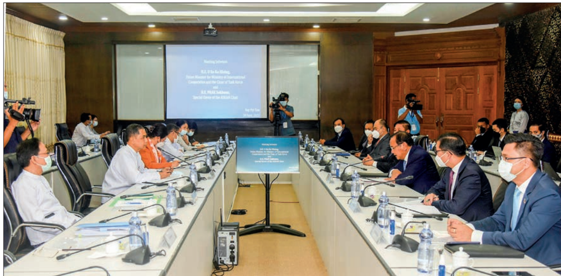
Union Minister U Ko Ko Hlaing meets Mr Prak Sokhonn, Deputy Prime Minister, Minister of Foreign Affairs and International Cooperation of Cambodia in Nay Pyi Taw yesterday.

The meeting was attended by Dr Thet Khaing Win, Union Minister for Health and Vice-Chairman of the Task Force, Dr Daw Thet Thet Khine, Union Minister for Social Welfare, Relief and Resettlement and Vice-Chairperson