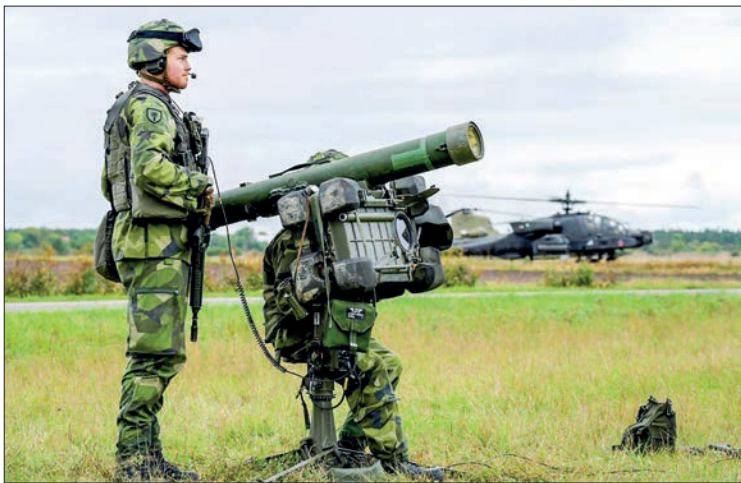
Swedish air defence practice for the first time against helicopters attack as part of the military exercise Aurora 17 on the Swedish island of Gotland, Sweden, on 19 September 2017.

Sweden and Finland have both decided to apply to join NATO after Russia launched its military operation in pro-Western Ukraine on February 24.— AFP