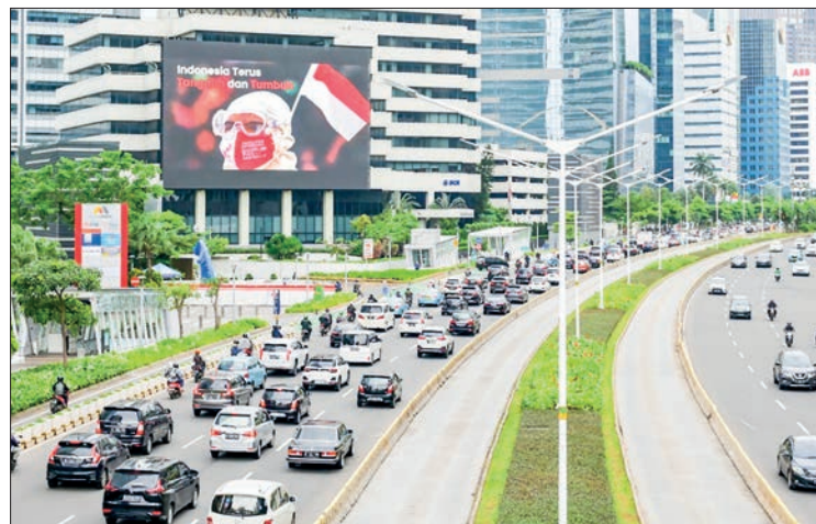
The death toll from the coronavirus in Indonesia rose by three to 156,728 on Wednesday, while 1,282 more people recovered during the past 24 hours, bringing the total number of recoveries to 5.91 million, according to the ministry’s data.

He made the prediction after observing South Africa, which first spotted the emergence of the sublineages. According to Sadik-