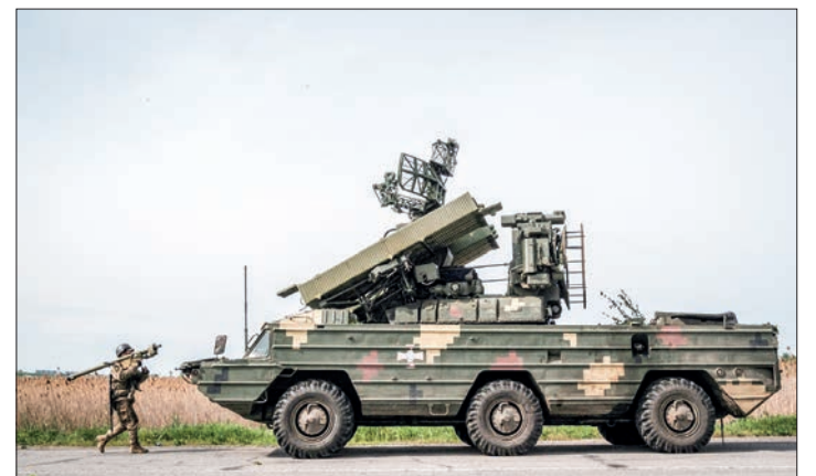
A Ukrainian soldier gestures past an anti aircraft missile system near Sloviansk, eastern Ukraine on 11 May 2022, amid the Russian invasion of Ukraine.

This is not the first time that the Syrian government, which since 2015 has been heavily backed by Russia in its own civil war, has supported Moscow's recognition of breakaway states.— AFP