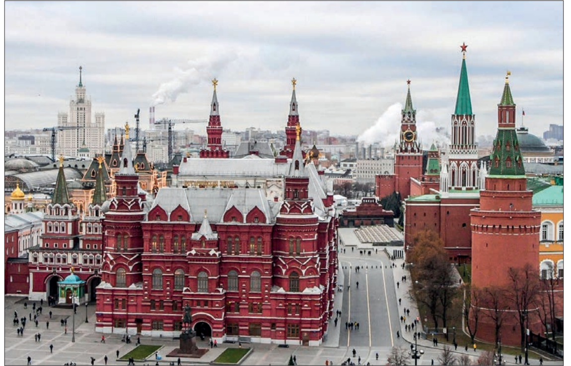
A view shows the State Historical Museum (C) and the Kremlin's Towers in Moscow. PHOTO: MLADEN ANTONOV / AFP/FILE

Moscow has stepped up efforts to stamp out dissent since President Vladimir Putin sent troops into Ukraine on 24 February.— AFP