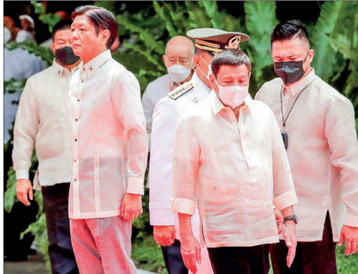
Incoming Philippine president Ferdinand Marcos Jr (left) and outgoing president Rodrigo Duterte (centre) take part in the inauguration ceremony for Marcos at the Malacanang presidential palace grounds in Manila on 30 June.

Duterte, 77, wore a mask and his traditional formal shirt, characteristically unbuttoned at the top and with sleeves rolled