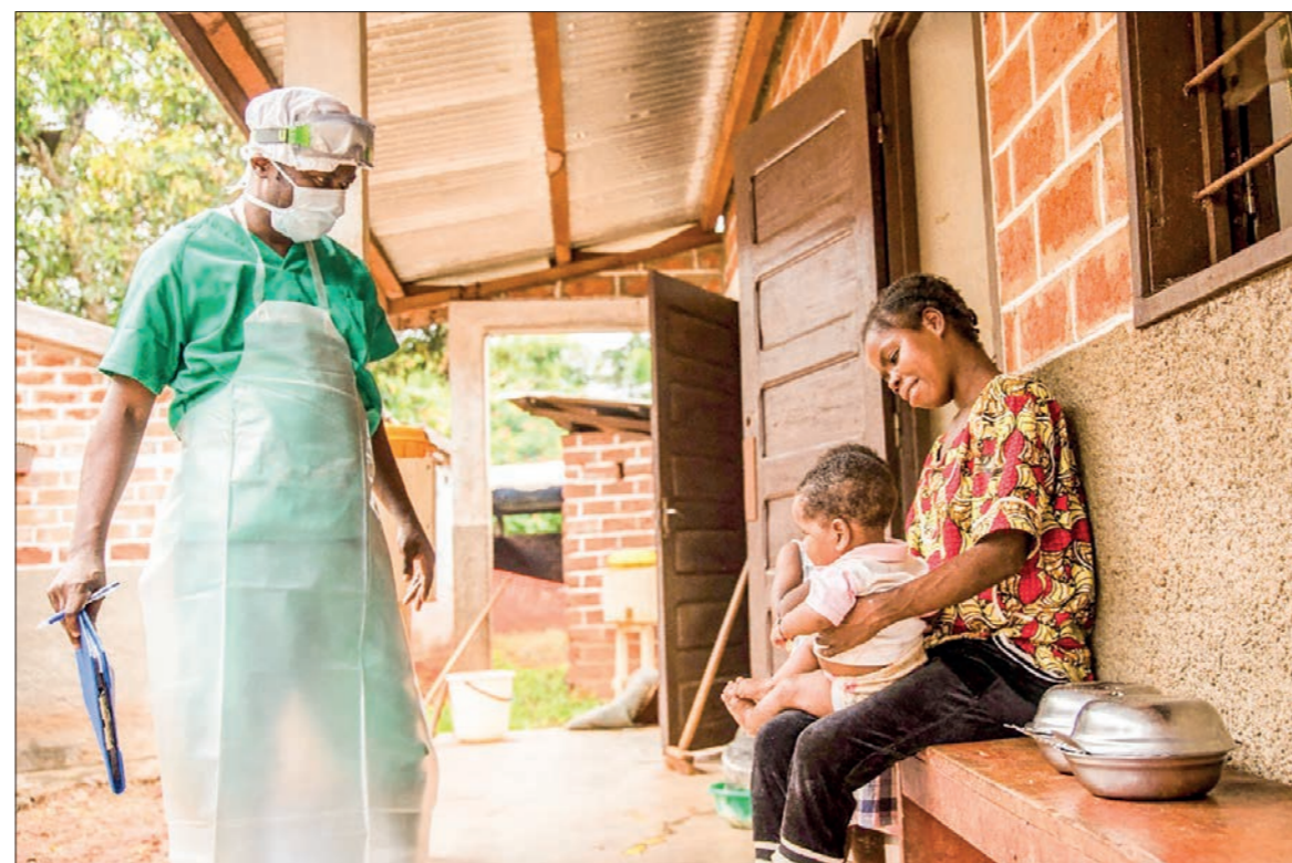
A woman and her child await treatment for monkeypox at a facility run by Doctors Without Borders in the Central African Republic in 2018.