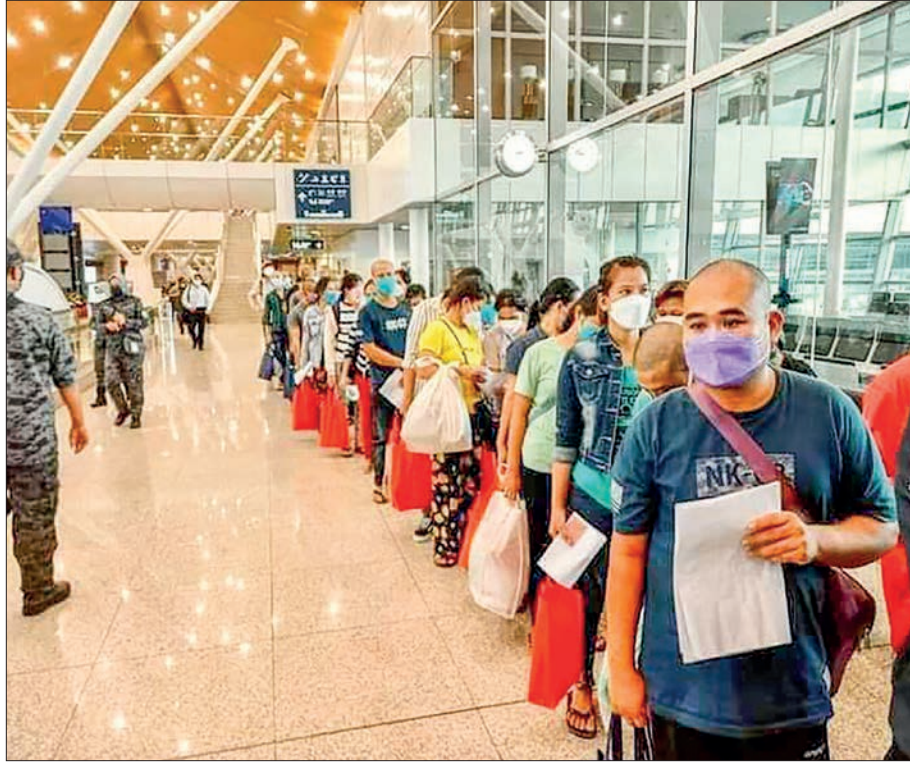
Myanmar nationals are seen at the Malaysian airport before repatriating to Myanmar.

Officials from the Myanmar Embassy to Malaysia help repatriate them to Myanmar by the Myanmar Airways International (MAI) relief aircraft.