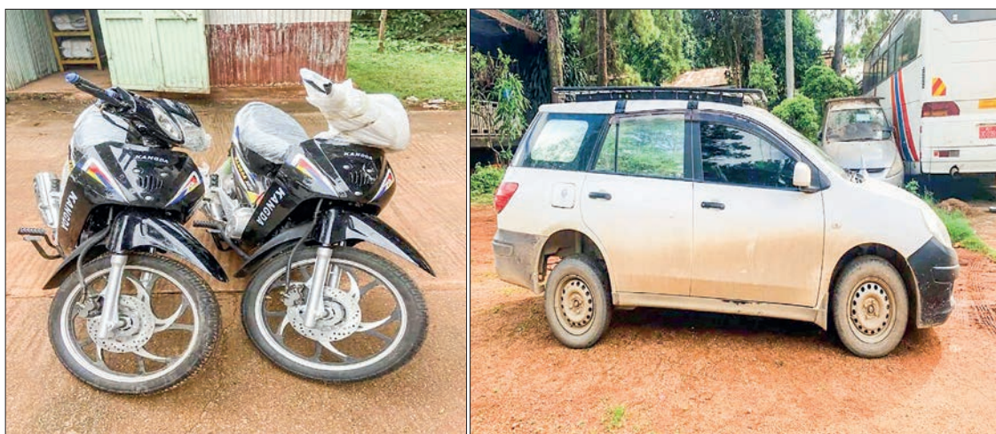
Seized motorbikes and a vehicle.

The suspects were prosecuted under the Narcotic Drugs and Psychotropic Substances Law, according to the Myanmar Police Force. — MNA