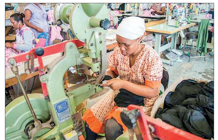
South Africa's gross domestic product grew by 1.9 per cent in the first quarter.

"The size of the economy is now at pre-pandemic levels, with real GDP slightly higher than what it was before the Covid-19 pandemic," it said. The report said manufacturing, finance, business services and trade made gains during the first quarter, while agriculture was subdued and mining and construction contracted.—AFP