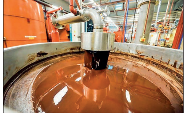
Barry Callebaut's plant in Wieze, Belgium, produces liquid chocolate in wholesale batches for 73 clients making confectionaries.

The scare comes a few weeks after a case of chocolates contaminated with salmonella in the Ferrero factory in Arlon in southern Belgium manufacturing Kinder chocolates.—AFP