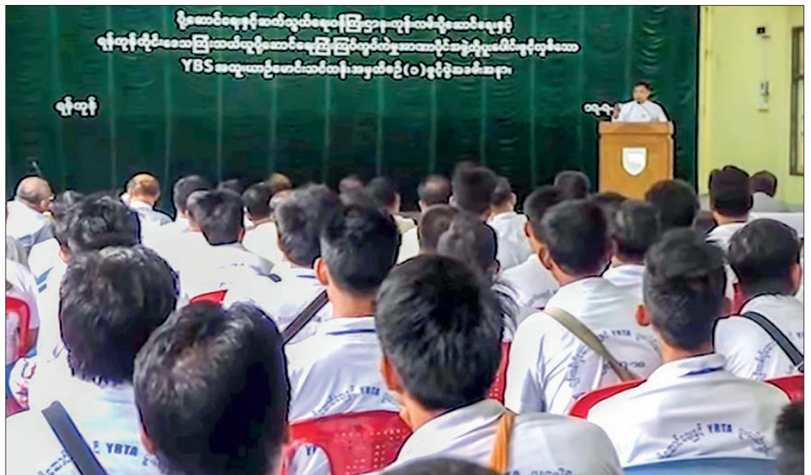
The first training for YBS drivers are progress in 2017.

For more information, candidates can call 01-8400042.