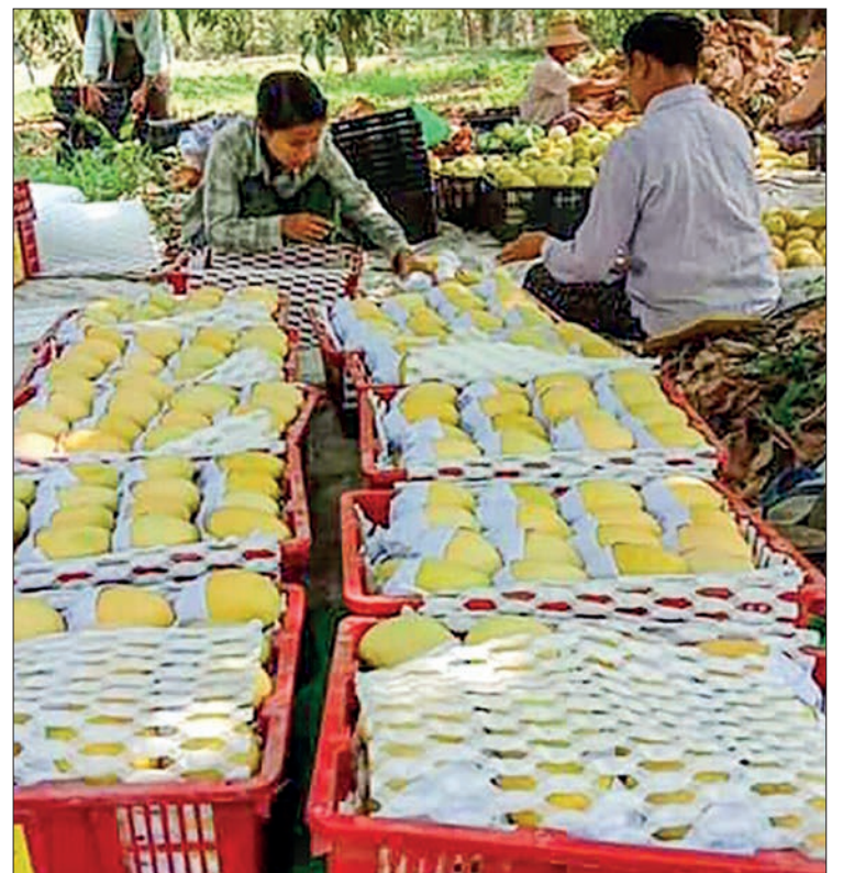
The agricultural exports were valued at $2.4 billion in the past mini-budget period (October 2021-March 2022).

The country requires specific export plans for each agricultural product, as they are currently exported to external markets based upon supply and demand. The G-to-G pact