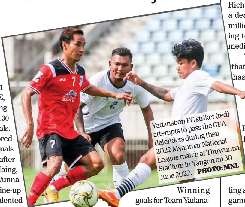
Yadanabon FC striker (red) attempts to pass the GFA defenders during their 2022 Myanmar National League match at Thuwunna Stadium in Yangon on 30 June 2022.

Yadanabon scored three goals in the first half. In the second half, they scored four goals and started the new season with a sweet victory.