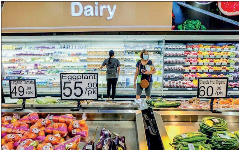
People shop at a supermarket in Manila, the Philippines on 5 September 2020.

it and lending facilities were increased by the same amount to 2.75 per cent and 3.75 per cent respectively.