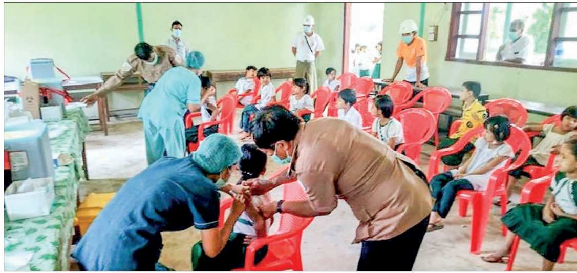
A student in Moenyo Township in Bago Region gets COVID-19 vaccine shot on 14 July.

COVID-19 vaccine is administered daily to target groups regardless of race or religion, including Buddhist monks and nuns, local people over the age of 40, students, religious leaders, prisoners, people with disabilities, ethnic armed groups, people with chronic diseases, people in IDP