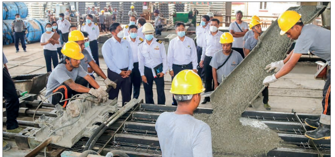
Union Transport & Communications Minister Admiral Tin Aung San inspects the Diesel Locomotive Factory in Sagaing Region.

The Union minister also inspected Concrete Sleeper Factory (Myitnge) and stressed the need to