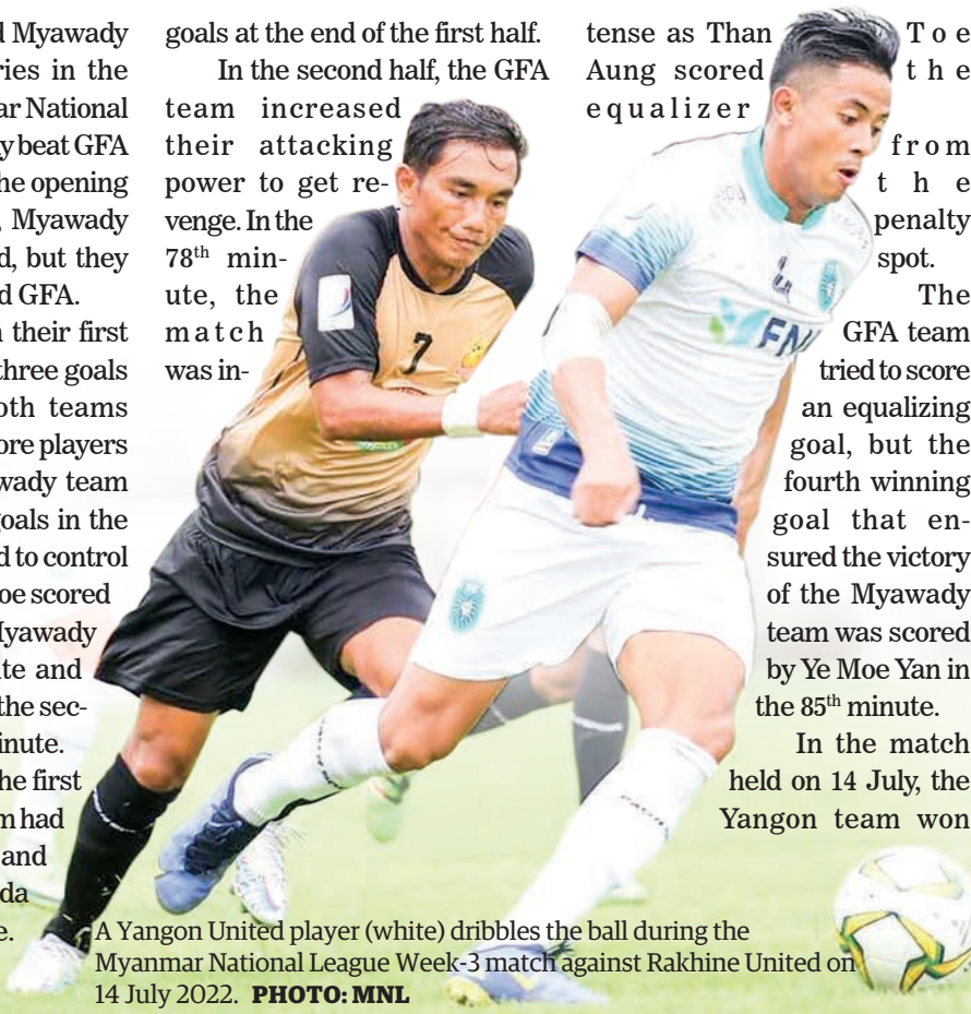
A Yangon United player (white) dribbles the ball during the Myanmar National League Week-3 match against Rakhine United on 14 July 2022.