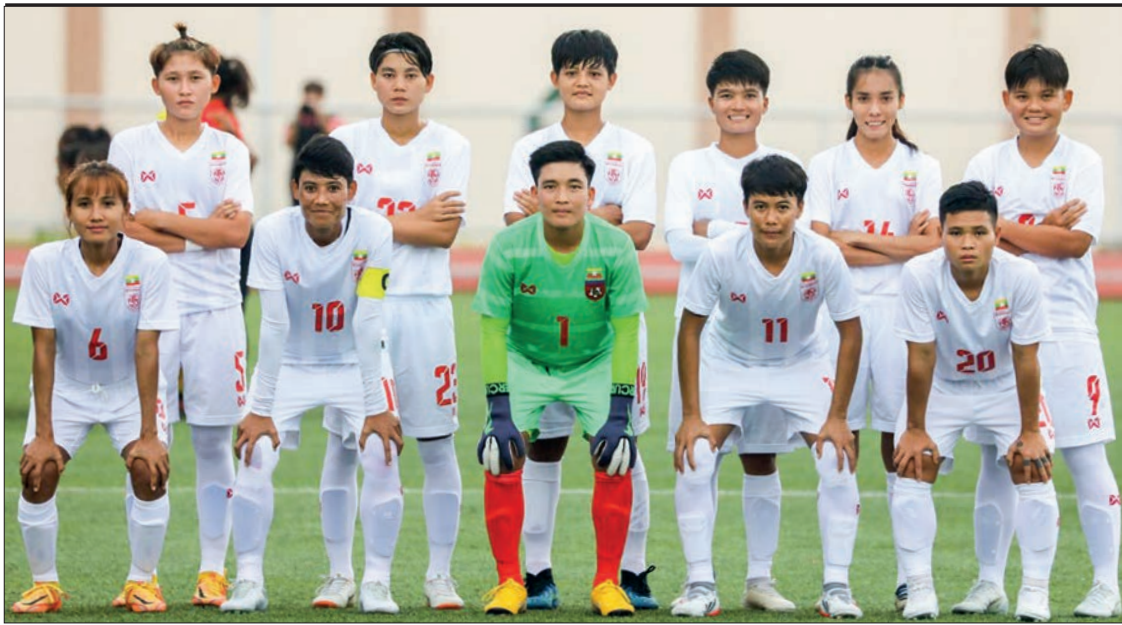
Myanmar national women's football team pose for a group photo.