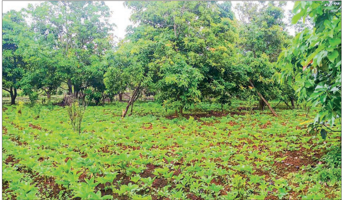
Experimental mixed-cropping of avocado plants with conjac reap fruitful results for the growers in Naungpi village-tract, Pinlaung Township of the Pa-O Self-Administered Zone in southern Shan State.

EXPERIMENTAL mixed-cropping of avocado plants with conjac reap fruitful results for the growers in Naungpi village-tract, Pinlaung Township of the Pa-O Self-Administered Zone in southern Shan State, said a local grower.