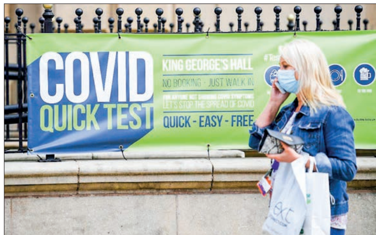
A pedestrian wearing a face covering walks past a sign for a walk-in Covid-19 testing centre in Blackburn, north west England on 16 June 2021.

With testing no longer free, data on cases is provided mainly through the ONS weekly infection survey, which showed in the latest release the percentage of people testing positive for coronavirus continued to increase across Britain, likely caused by increases in infections compatible with Omicron variants BA.4 and BA.5.—Xinhua