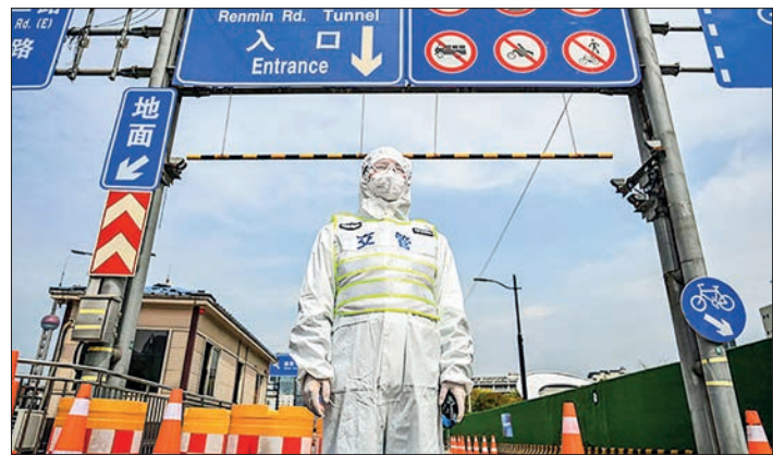
China’s National Health Commission says the decision was intended to ensure the stability of the industrial and supply chains and notes that under room temperature conditions, the novel coronavirus can only survive for a short time on the surface of most objects.

Refrigerated and frozen imports will continue to be tested under current rules. Scientists say there is little evidence that coronavirus carried on objects like cold-chain products can infect humans, although the United States’ CDC recommends disinfecting surfaces that have been touched frequently by Covid patients.—AFP