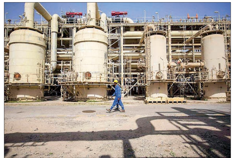
Rumaylah oil field, near the port city of Basra, southern Iraq.

The IEA now expects oil demand to rise this year to 99.2 million barrels per day (mbd) and to 101.3 mbd next year.—AFP