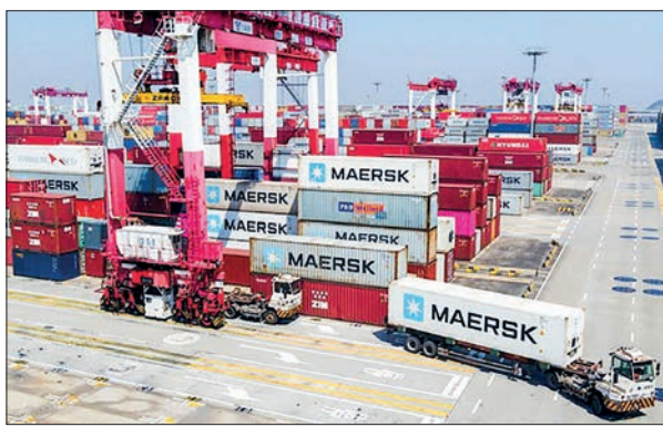
Aerial photo taken on 18 March 2020 shows the container dock of Yangshan port in Shanghai, East China.

Among the top 20 ports, the Shanghai port will have the most throughput capacity in 2022, the China Science Daily quoted the forecast as reporting on Wednesday, adding that most of China’s container ports hold growing demand for shipping services, includ-