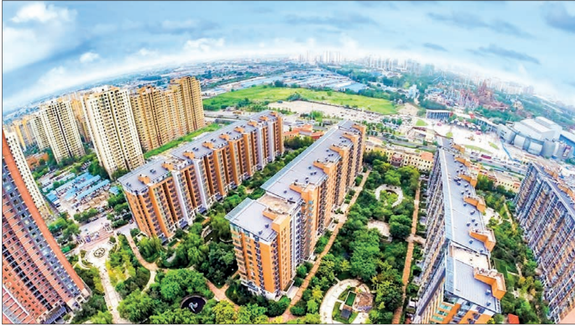
An aerial view of a residential compound in China.

CHINA'S economic expansion slumped in the second quarter to levels not seen since early 2020, an AFP poll of analysts found, owing to painful Covid lockdowns and lingering weakness in the real estate sector.