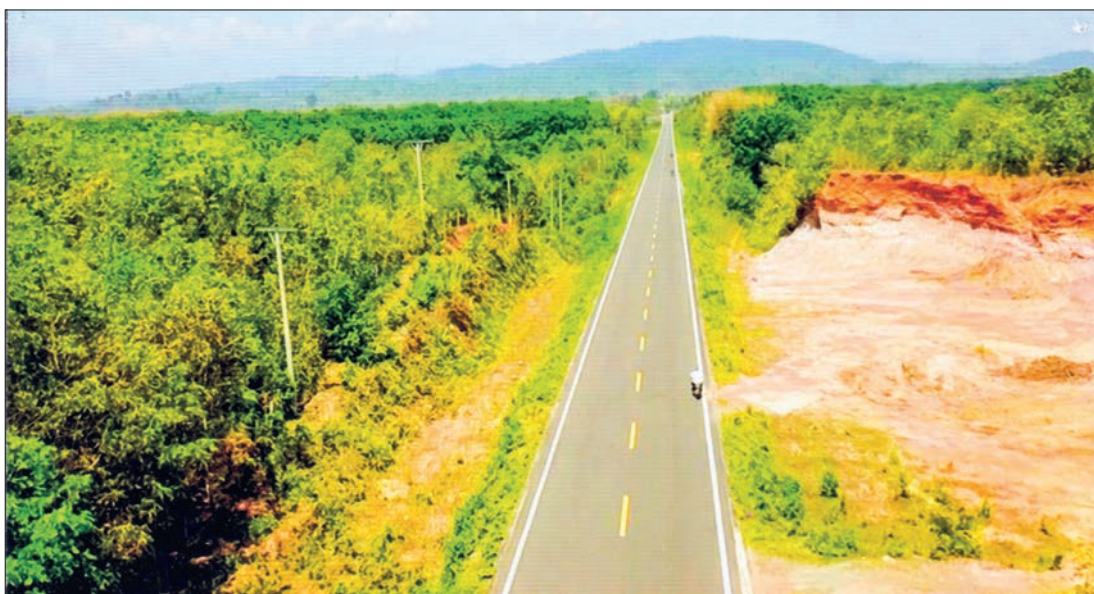
The photo shows an aerial view of one upgraded road in Kachin State.