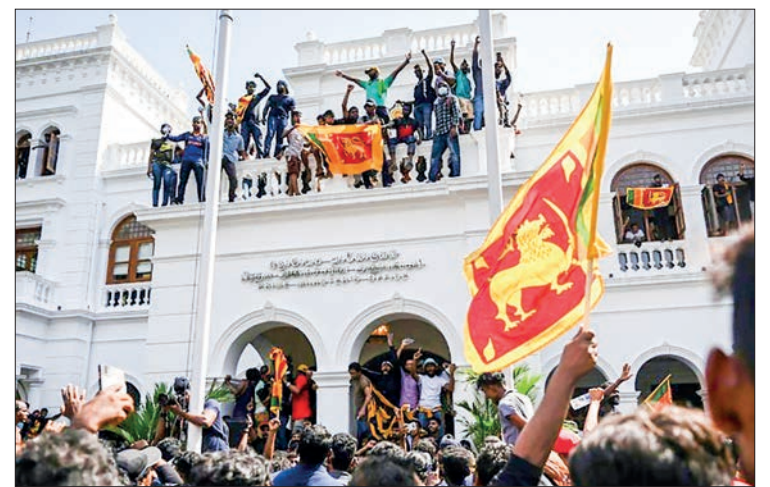
Activists on Wednesday stormed the office of Prime Minister Ranil Wickremesinghe.

drawing from the Presidential Palace, the Presidential Secretariat and the Prime Minister's Office with immediate effect, but will continue our struggle," a spokeswoman for the protesters said.