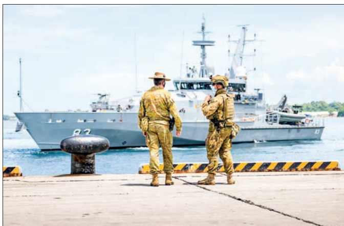
25 November 2021: Australia is sending peace keeping troops to the Solomon Islands, as riots rocked the capital city of Honiara for a second day.

The Solomons leader is attending the Pacific Islands Forum summit, the first gathering of the bloc since his country signed a security agreement with China – details of which have not been made public. China's security pact with the Solomons sparked concern in the Pacific region that it may lead to Beijing setting up a permanent military presence on the island, despite both countries denying such a plan.—AFP