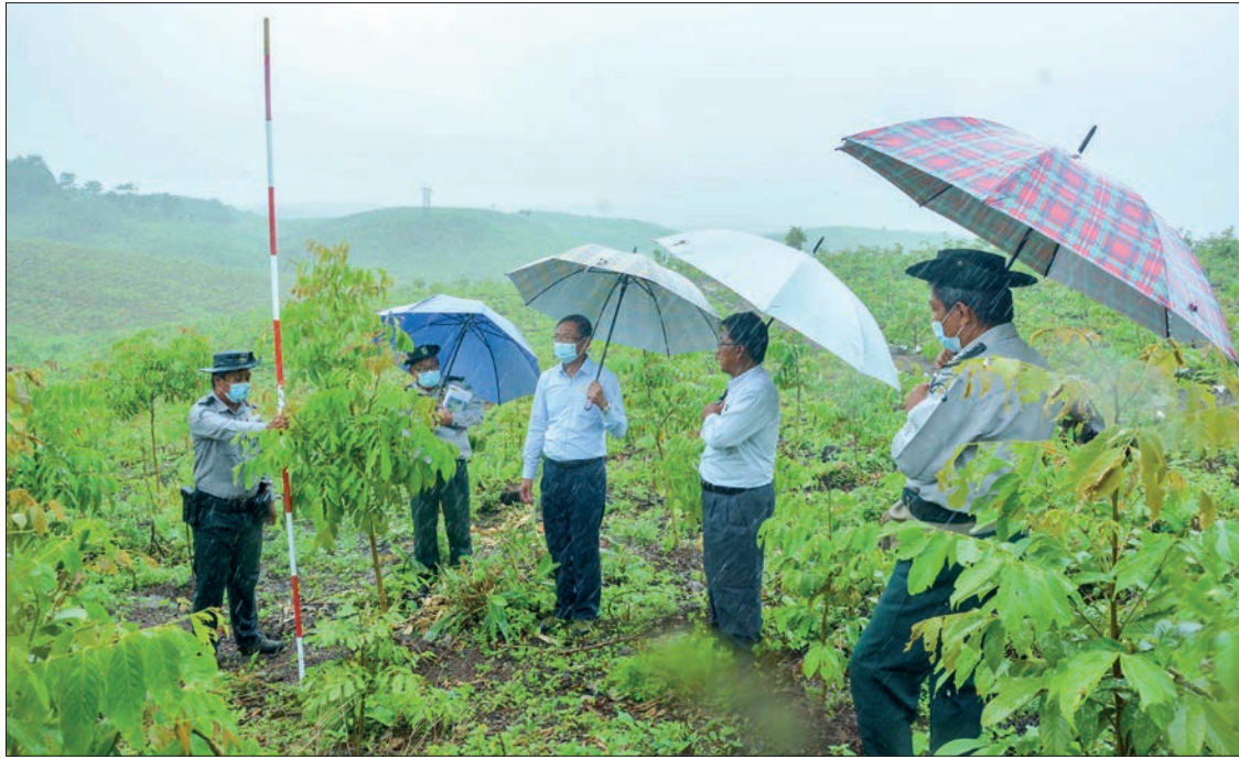
MoNREC Union Minister U Khin Maung Yi inspects round the ironwood plantation.

UNION Minister for Natural Resources and Environmental Conservation U Khin Maung Yi accompanied by officials met the chief minister and the region natural resources minister at the Ayeyawady Region government office in Patheingyi Township of Ayeyawady Region yesterday morning.