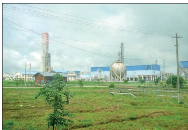
No 4 Fertilizer Factory (Myaungtaga)

The government imports 98 per cent of fertilizers for local consumption and the price of fertilizer ranges between K92,000 and K95,000 per bag in Yangon, farmers said. — TWA/GNLM