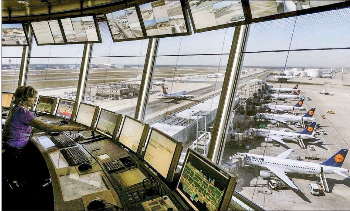
In June, passenger volume hit a new high since the start of the COVID-19 pandemic, but still remained 24.1 per cent below the pre-crisis level seen in June 2019.

PASSENGER numbers at Frankfurt Airport, Germany's largest, almost tripled in June year-on-year to 5 million people amid the ongoing travel chaos across Europe, operator Fraport AG said on Wednesday.