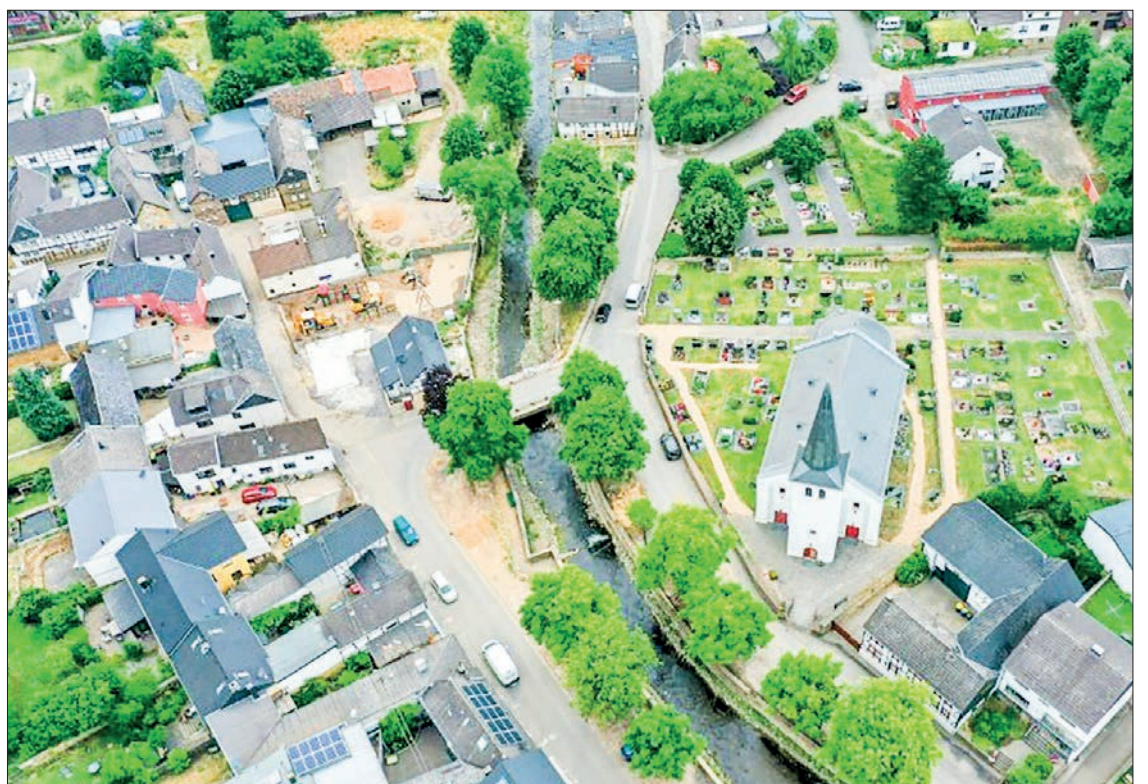
Germany is experiencing a north-south divide when it comes to weather this week, with southern regions seeing sweltering heat.