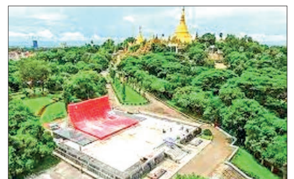
An aerial view of the Martyrs' Mausoleum at the corner of West Shwegondine and Arzani Road.

THE Engineering Department of the Yangon City Development Committee has completed the preparation of the Martyr's Mausoleum located at the corner of West Shwegondine Road and Arzani Road in Bahan Township.