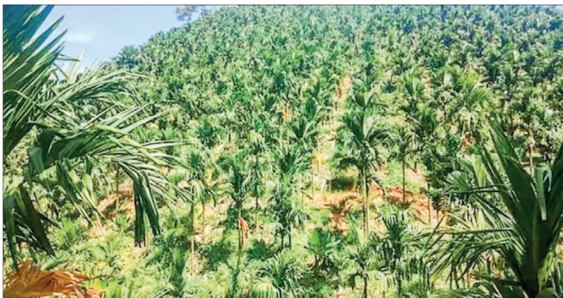
Normally, dried betel nuts were primarily exported to India. At the moment, betel nut exports to India have plummeted amid security concerns on the Kalay-Tamu trade route.

Starting from April, China's demand has made tender areca nut fruit market bustle, hiking the price from K30 to over K60