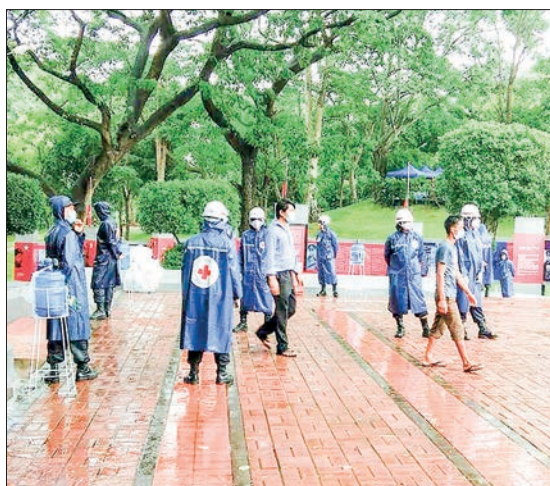
Red Cross workers are seen providing healthcare services on the 73 rd Martyrs' Day.

AUTHORITIES have released requirements for the visitors to the 75 th Martyrs' Day celebrations and memorials, including the Martyrs' Mausoleum, Secretariat (Former Ministers' Office), and Bogyoke Aung San Museum.