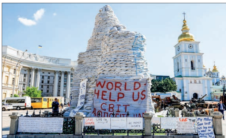
Pedestrians walk past banners reading 'World - Help us' during a trip of European leaders in Kyiv.

The Soviet Union and China were competitors during the Cold War and were at odds over interpretations and practical applications of Marxism-Leninism, the ideology of 20th-century communism.—Kyodo