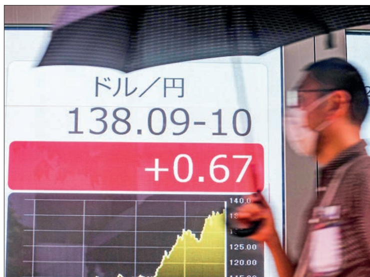
A financial data screen in Tokyo shows the dollar hitting the 138 yen level on 14 July 2022.

yen in New York and $1.0032-0034 and 137.48-52 yen in Tokyo late Wednesday afternoon.—Kyodo