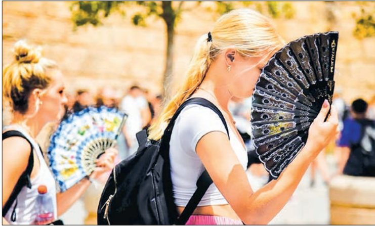
Two women use fans to fight the scorching heat during a heatwave in Seville, Spain.

THE heatwave sweeping across southwestern Europe was expected to peak on Thursday in Spain, with blistering temperatures already fuelling wildfires across the Iberian Peninsula and France.