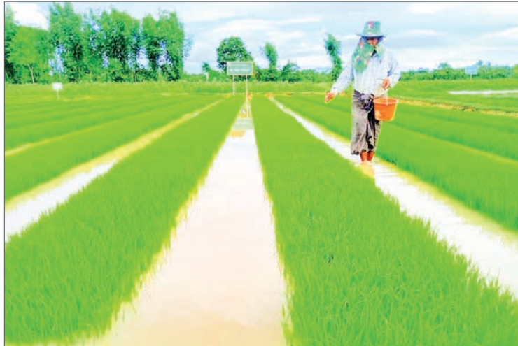
A farmer broadcasts fertilizers on the monsoon rice farm.

In the 2022 early monsoon, the unfinished rice price was about K30,000 per bag while the broken rice was K30,000 per bag. The prices were higher compared to the same period of last year. When the government