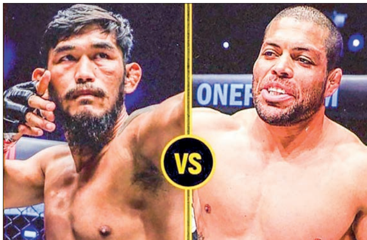
Former two-division ONE Championship World Champion Aung La N Sang (left) and former Brazilian jiu-jitsu Champion Andre Galvao (right).

The match will be held in four rounds, and the first and third rounds will be MMA rules. In the second and fourth