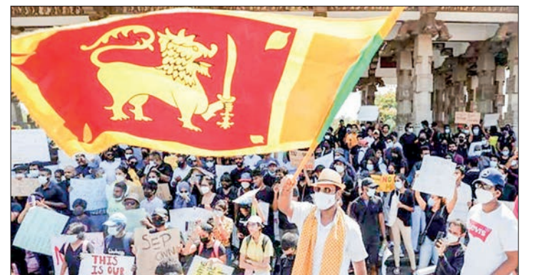
President Gotabaya Rajapaksa has fled Sri Lanka on a military jet, amid mass protests over the island's economic crisis.