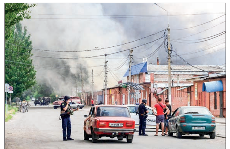
Security personnel halt motorists as smoke rises from the central market of Sloviansk, north of Kramatorsk on 5 July 2022, following a suspected missile attack amid the Russian invasion of Ukraine.

In recent years the label, which is reminiscent of the "enemy of the people" of the Soviet era, has been used extensively against opponents, journalists and human rights activists accused of conducting foreign-fund-