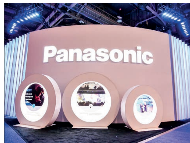
Panasonic aims to triple its battery manufacturing capacity by 2028.

The factory will be Panasonic's second electric car battery operation in the United States, joining