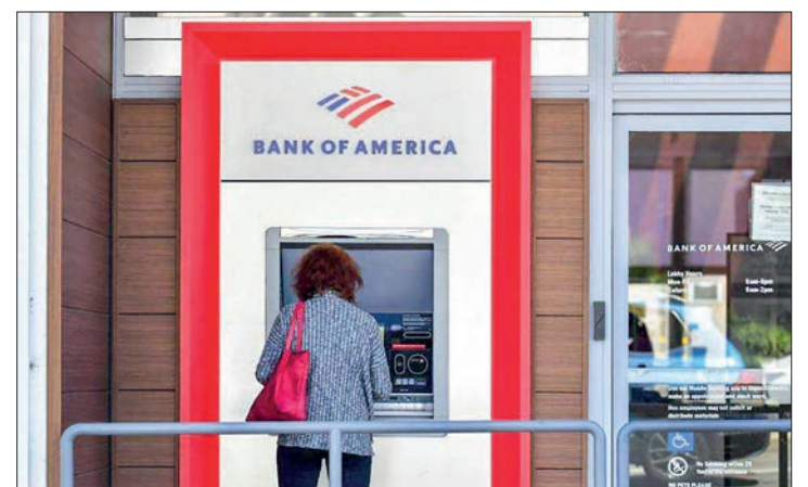
A woman uses a Bank of America ATM machine in Alhambra, California on 4 May 2022.

The consumer agency said BofA during the pandemic altered its practices for investigating debt card fraud, replacing a "reasonable" investigation with a fraud filter system that automatically triggered an account freeze. The bank further "made it very difficult" for people to unfreeze the accounts, the agency said. "The bank failed these prepaid cardholders by denying them access to their mandated unemployment funds during the height of the pandemic, and leaving these vulnerable consumers without an effective way to remedy the situation," said OCC Acting Comptroller Michael Hsu.—AFP