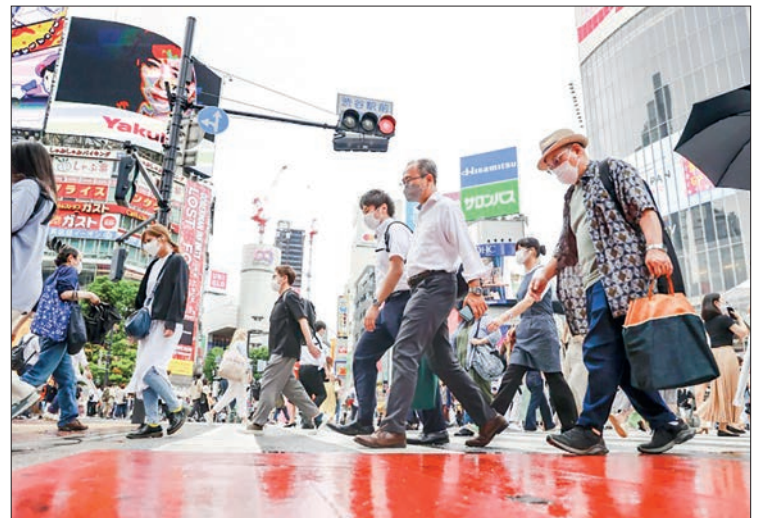
People wearing face masks walk in the rain in Tokyo's Shibuya district on 14 July 2022, as the Tokyo metropolitan government reports 16,662 COVID-19 cases the same day, doubling from a week earlier, amid a nationwide surge driven by the highly transmissible BA.5 subvariant of the Omicron variant.

It has taken only four months for the cumulative nationwide total to double, according to a Kyodo News tally, highlighting the accelerating pace of infections. After the first COVID-19 case was confirmed in Japan in January 2020, it took around 19 months to hit 1 million and another six months to reach 5 million.—Kyodo