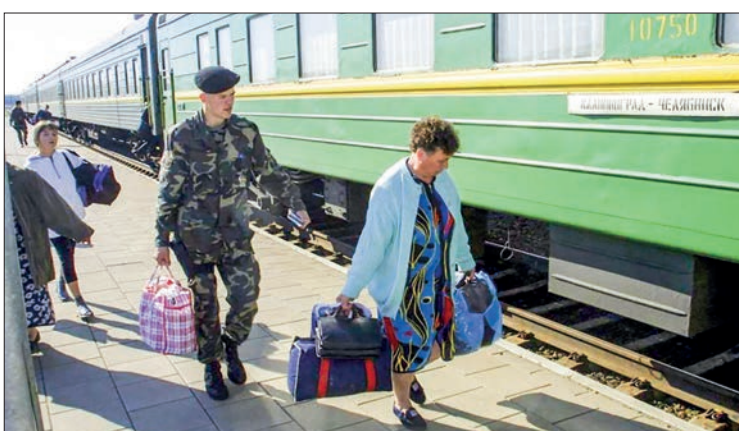
A Lithuanian border guard carries the luggage of Russian citizens who were taken off of the transit train from Chelabinsk to Kaliningrad en route from Chelabinsk to Kaliningrad.