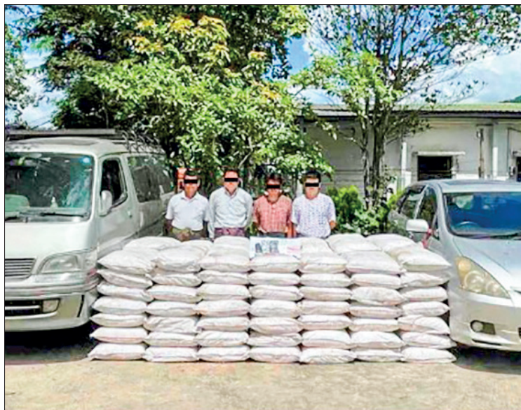
Four arrestees are seen along with seized chemicals and vehicles.

A total of 5.3 tonnes of the restricted chemical sodium acetate and other chemicals such as 2.4 tonnes of potassium sulphate, 6.75 tonnes of sodium carbonate, 380 kilos of sodium chloride, chemical odours, 18 chemical masks and 105 air filters were impounded. They are prosecuted under the law while investigating, the Myanmar Police Force stated. — MNA