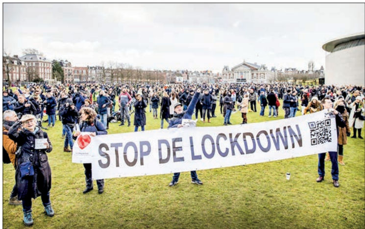
Protesters gathered in Amsterdam to demonstrate against the lockdown imposed on 21 January 2021.

THE Netherlands announced on Wednesday it has become the latest country to detect a case of the Covid Omicron subvariant BA.2.75, as experts expressed concern about the strain's rapid spread.