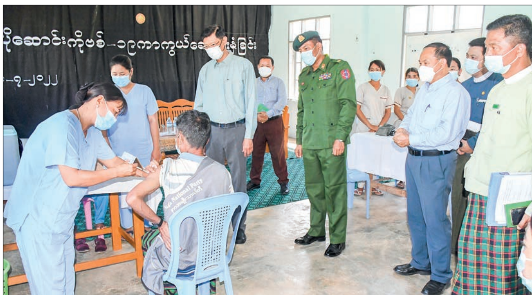
MoD Union Minister General Mya Tun Oo observes the COVID-19 vaccination at the Lahe People's Hospital.

STATE Administration Council member Union Minister for Defence General Mya Tun Oo, accompanied by the Sagaing Region chief minister and the commander of the Sagaing Command, met officers, other ranks and their families of the local station in Lahe of the Naga Self-Administered Zone, Sagaing Region, and provided food aids and COVID-19 prevention gear on 14 July.