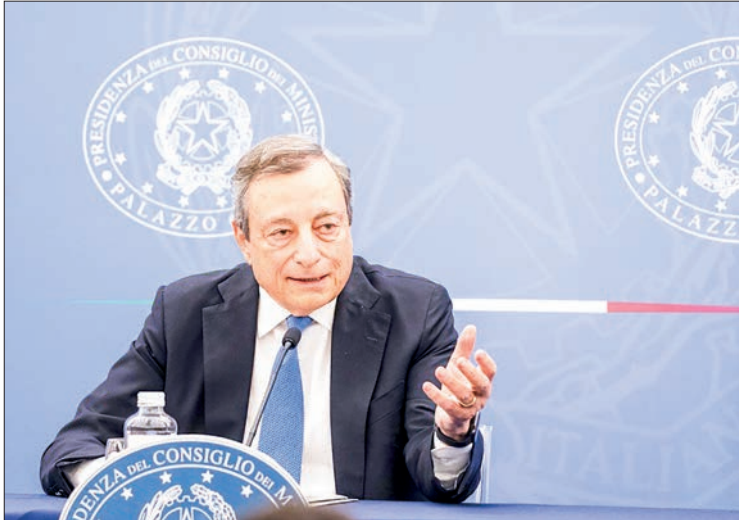
Italian Prime Minister Mario Draghi speaks at a press conference in Rome, Italy, on 12 July 2022.

ITALIAN President Sergio Mattarella rejected a resignation offer of Prime Minister Mario Draghi, after meeting him late on Thursday night.