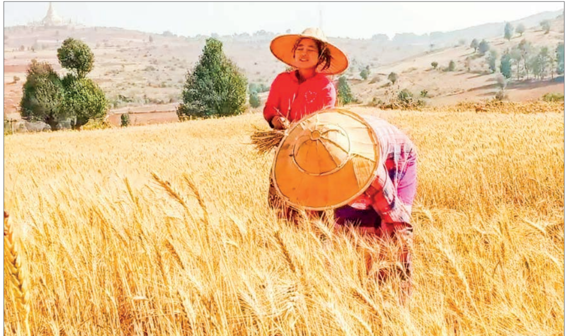
The wheat can be cultivated once a year. It cannot be grown anywhere in Myanmar, especially in Sagaing Region. It is commonly found in southern and northern Shan State, Chin State and Kayah State.

The wheat can be cultivated once a year. It cannot be grown anywhere in Myanmar, especially in Sagaing Region. It is commonly found in southern and northern Shan State, Chin State and Kayah State.