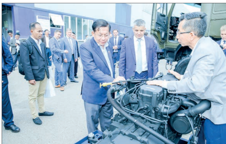
The Senior General looks into the UAV manufacturing workshop for agricultural purposes, military transport and battlefield bullet-proof vehicles and engines.

and it was one of the parts of the Russian Helicopters Company owned by the Rostac Corporation. Up to now, it has manufactured more than 12,000 Mi-4, Mi-8, Mi-14, Mi-17 and Ansat helicopters and exported them to more than 100 countries. The plant joined the Russian Helicopters Joint Venture Company which would be the main share-holder in 2007. Now, the plant is carrying out the pilot construction of the Mi-38 medium multipurpose helicopter and many productions. It has so far secured more than 27 certifi-