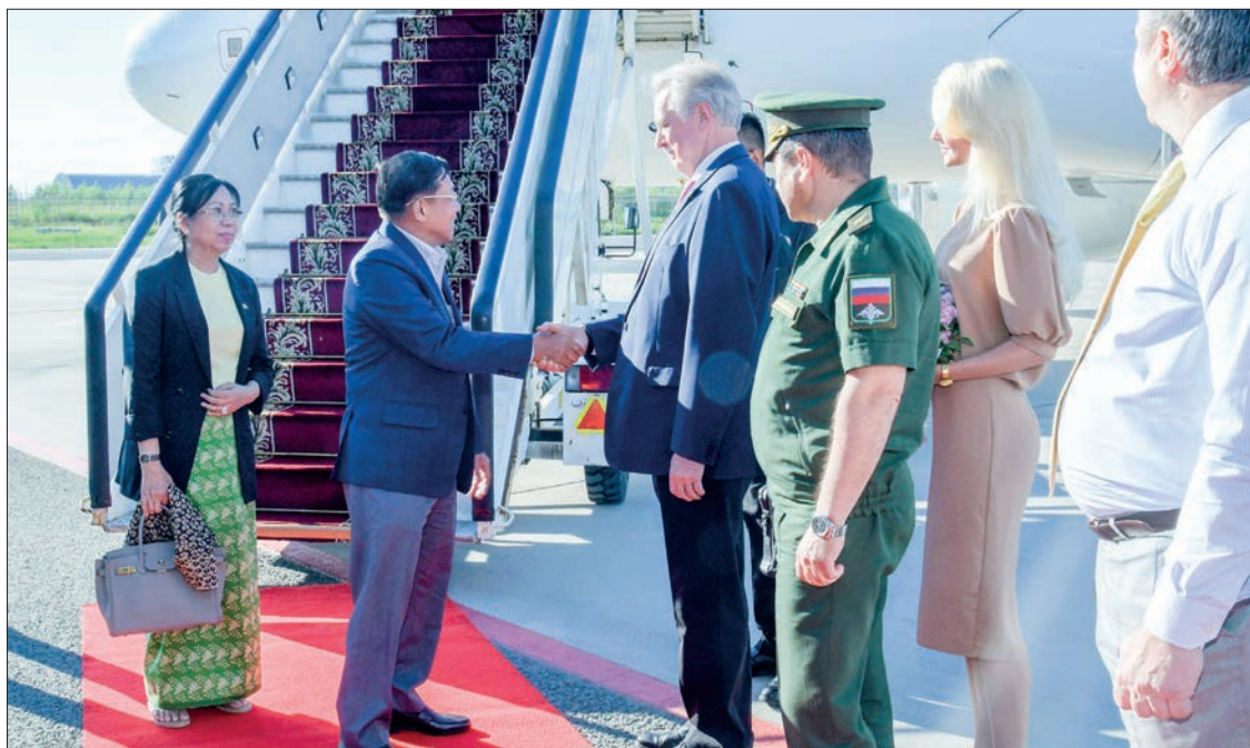
The Senior General and his wife are seen off at Kazan Airport before leaving for St Petersburg.

PJSC Kazan Helicopters Plant was established in 1940,