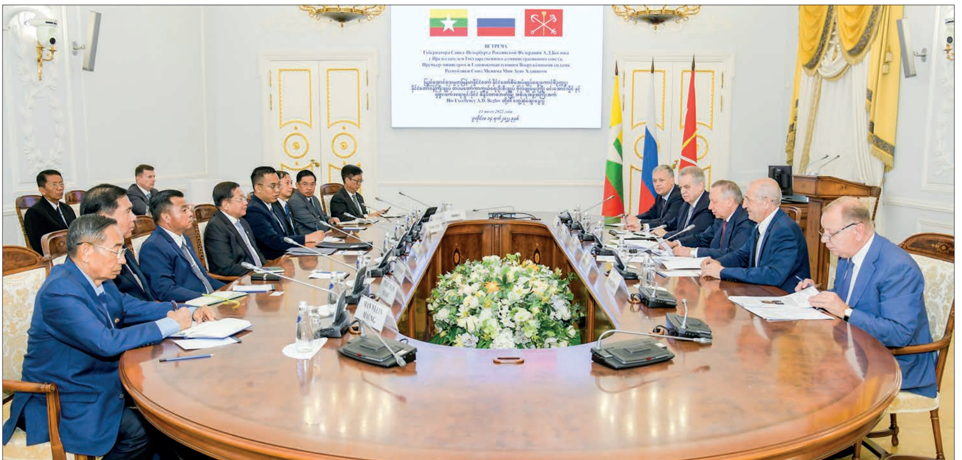
State Administration Council Prime Minister Senior General Min Aung Hlaing meets Head of the Government from St Petersburg Mr Alexander Beglov at the latter's office in St Petersburg on 14 July 2022.

CHAIRMAN of the State Administration Council Prime Minister Senior General Min Aung Hlaing, who is currently in the Russian Federation, held a meeting with Head of the Government from St Petersburg Mr Alexander Beglov at his office on 14 July.