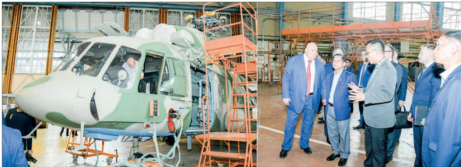
The Senior General views round the PJSC Kazan Helicopters Plant.

The Senior General viewed the UAV manufacturing workshop for agricultural tasks, military transport and battlefield bullet-proof vehicles and engines. At the Organic Plant to produce fertilizers, the Senior General visited and discussed the situation to do cooperation with the plant. In the evening, the Senior General and party left Kazan Airport of Kazan of the Republic of Tatarstan for Saint Petersburg by air. At Pulkovo International Airport of St Petersburg, the Senior General and party were welcomed by officials of the government office of St Petersburg. — MNA