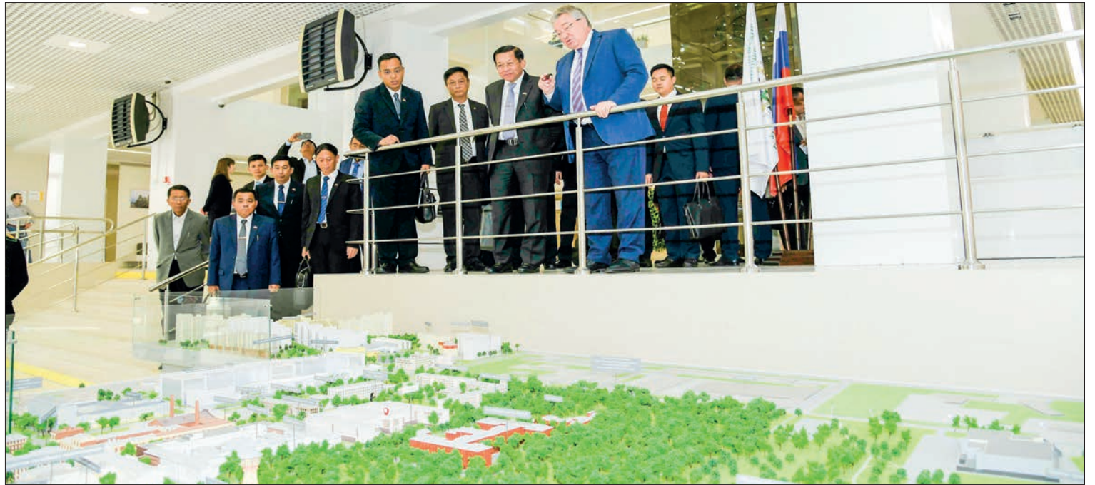
The Senior General looks into the layout plans of buildings on the campus of the State Polytechnic University in St Petersburg on 14 July.

While visiting the university, the Senior General heard clarifications on the capacity of