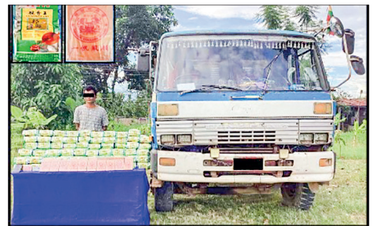
An arrestee is seen together with seized drugs and a lorry.

ONE hundred and fifty-nine kilogrammes of Ice (Methamphetamine) worth over 1.37 billion and seven kilogrammes of 20 heroin blocks were seized by the Myanmar Police Force in Kengtung Township, Shan State (East).