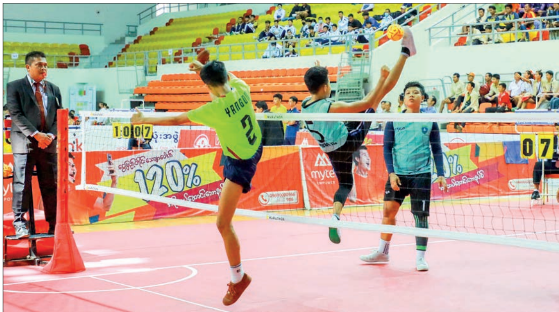
One match of the Inter-State/ Region Sepak Takraw finals is in action in Nay Pyi Taw yesterday.

After the competitions, the awarding ceremony was held. Union Minister for Ethnic Affairs U Saw Tun Aung Myint awarded the Mandalay Region