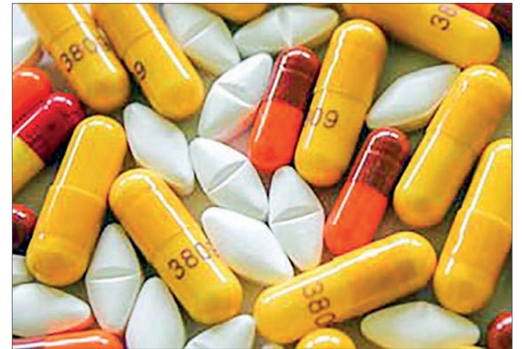
ART (Antiretroviral Therapy) medicines.

It is reported that the Ministry of Health and the Global Fund provide the needed funds to combat HIV in Myanmar. — TWA/GNLM