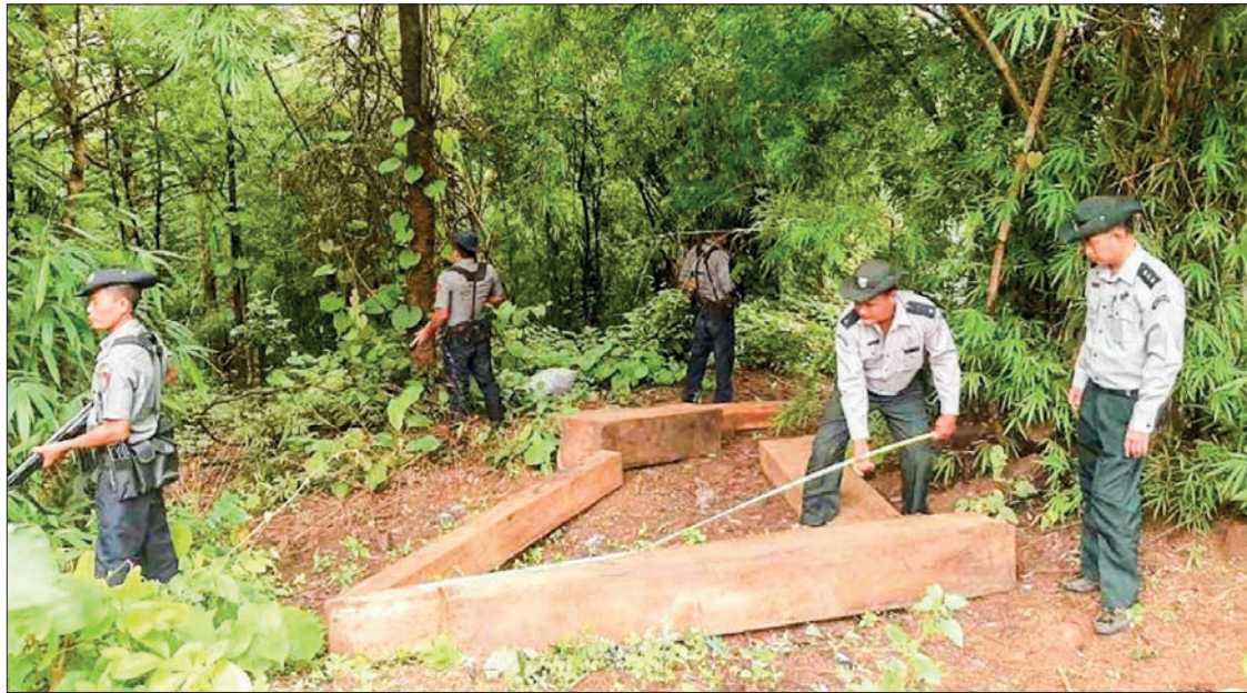
Officials check confiscated illegal timbers.

Similarly, a combined on-duty team under the supervision of the Customs Department at the container terminal