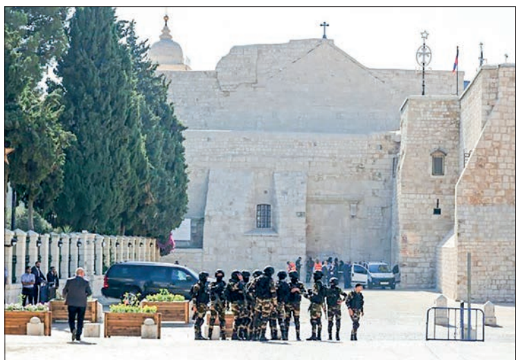
Palestinian security officers deploy near the Church of the Nativity in Bethlehem in the occupied West Bank, on 14 July 2022, ahead of US President Joe Biden's arrival.

US President Joe Biden will meet Palestinian leader Mahmud Abbas in the occupied West Bank on Friday, with talks expected to focus on economic measures but without striking any major diplomatic breakthrough.