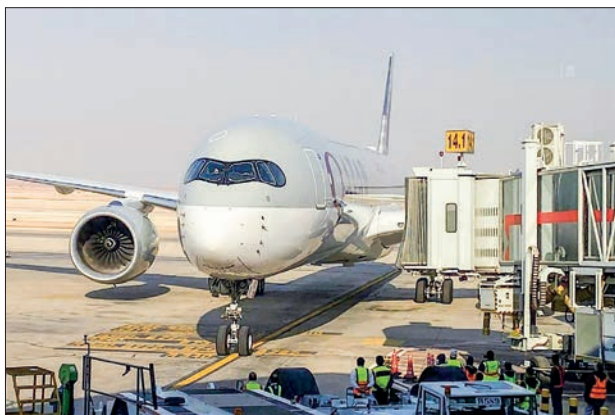
A Qatar Airways passenger jet is seen at Riyadh's King Khalid International Airport in this file picture taken on 11 January 2021.

Biden said in a statement later Friday that Riyadh's move came "thanks to months of steady diplomacy between my administration and Saudi Arabia", where he is set to travel in the afternoon as part of a Middle East tour.—AFP