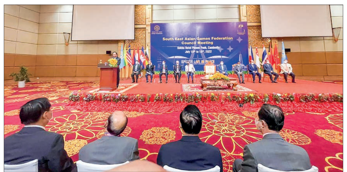
The 32 nd South East Asian Games Federation Council Meeting is underway in Cambodia from 11 to 13 July 2022.

On the morning of 13 July, Cambodian Deputy Prime Minister and Defence Minister Chairman of the 32 nd SEA Games