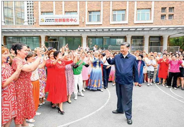
Chinese President Xi Jinping, also general secretary of the Communist Party of China Central Committee and chairman of the Central Military Commission, waves to people of various ethnic groups while visiting the community of Guyuanxiang in the Tianshan District in the city of Urumqi, capital of northwest China's Xinjiang Uygur Autonomous Region, July 13, 2022.

progress has been made since the Belt and Road Initiative was proposed.