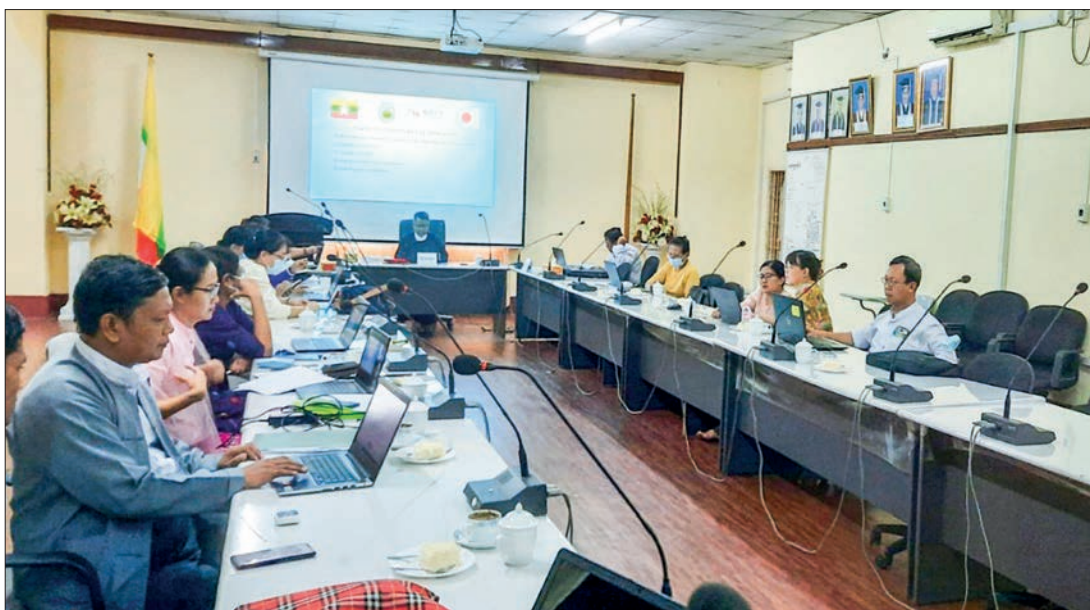
An MoU inking ceremony between Dagon University and Gifu University of Japan is in progress.

Later, both institutions signed the MoU and took a commemorative group photo together to record the event.