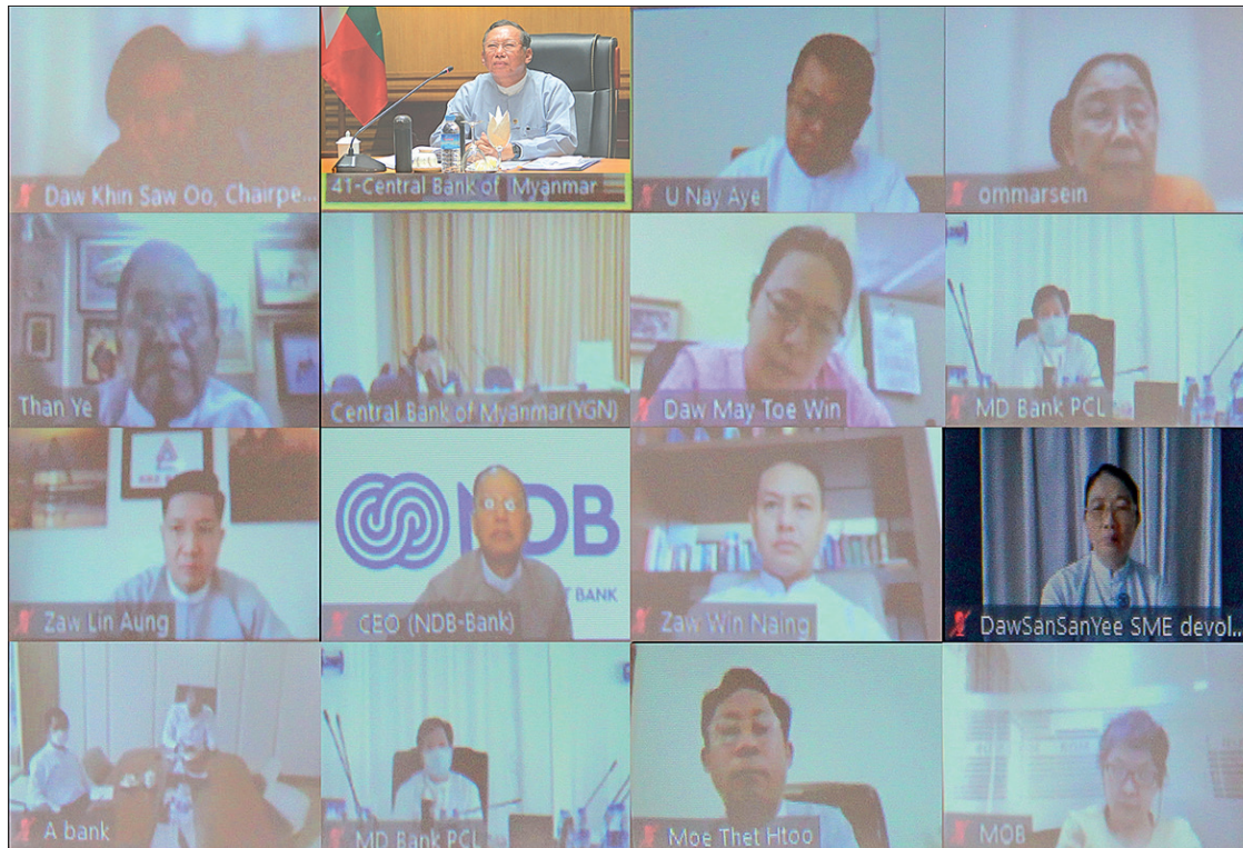
The meeting between the CBM Governor and the executive members of the Myanmar Banks Association is in progress virtually.

The financial and monetary policies for development are being implemented in a balanced manner to develop the banking sector stably, and as a result of all the banks working together to provide services, the use of banks has increased among the people and the confidence in the