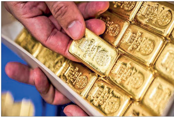
Gold bars are seen in the gold market.

THE closing price of gold in Yangon last week was K15,000 higher than the opening price this week, and the price is K2,060,000, according to Yangon Region Gold Entrepreneurs Association.