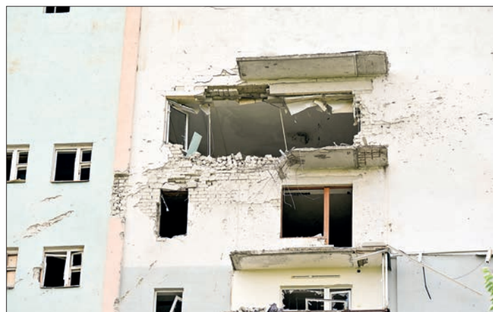
A photograph shows a building partially destroyed after shelling in the outskirts of the second largest Ukrainian city of Kharkiv on 18 July 2022.

"Rescuers found and recovered the bodies of five dead people in total. Three people were rescued from the rubble and one of them died in hospital," the emergency services said, adding their rescue operations had concluded. —AFP