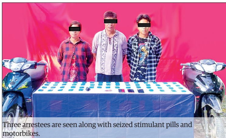
Three arrestees are seen along with seized stimulant pills and motorbikes.

According to the Myanmar Police Force, the suspects were prosecuted under the Narcotic Drugs and Psychotropic Substances Law. — MNA