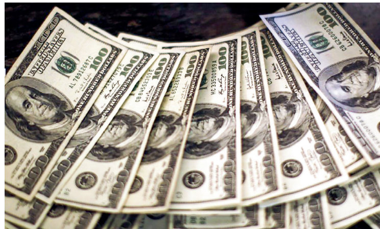
The unofficial exchange rate against the US dollar hit a high of K2,300 on the over-the-counter market although the Central Bank of Myanmar (CBM) set the reference exchange rate at K1,850, according to local forex traders.

Under the guidance of the Central Committee on Ensuring Smooth Flow of Trade and Goods,