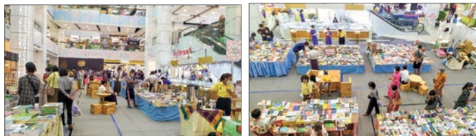
Let's Have a Book @ Book fair is being held at Junction Square promotion area from 18 July to 24 July. Innwa bookshop, Hsu Paing bookshop, Khit Sarpay, Twin Brother bookstore, Saw Oo Sarpay,