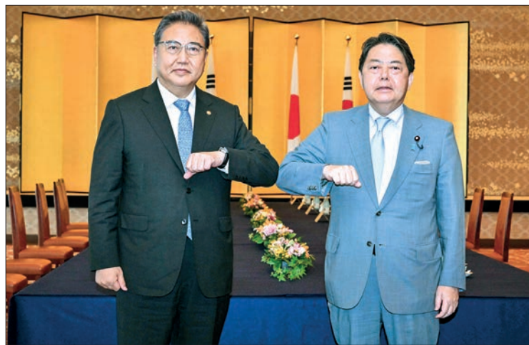
Japanese Foreign Minister Yoshimasa Hayashi (R) and his South Korean counterpart Park Jin meet in the Iikura Guest House in Tokyo on 18 July 2022.

Park told Hayashi he will make efforts to produce "desirable solutions" before the liquidation of Japanese corporate assets in South Korea that plaintiffs in