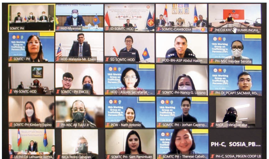
The 18 th SOMTC Working Group on Trafficking in persons meeting is in progress online on 18 July.

After that, the ASEAN member countries discussed the country-wise anti-human trafficking efforts, the development of the Boho Human Trafficking Action Plan (2.0), duties and powers of national representatives for the implementation of the ASEAN Convention against Trafficking in Persons, particularly women and children, and issues related to let Indonesia as the host country.