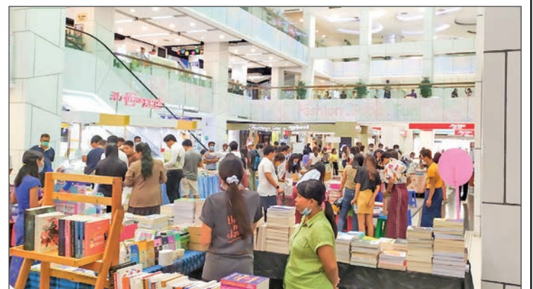
Thukhabon bookstore, Kaungsutha bookstore, Yetagon bookstore and Baby bookstore retail books at the fair, as well as the café shops are open in that area.