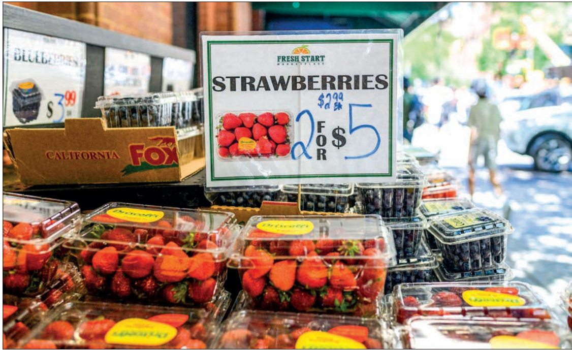
Fruit is sold at a supermarket on 13 July 2022, in New York City. US consumer price inflation surged 9.1 per cent over the past 12 months to June, the fastest increase since November 1981, according to government data released on 13 July. Driven by record-high gasoline prices, the consumer price index jumped 1.3 per cent in June, the Labour Department reported.