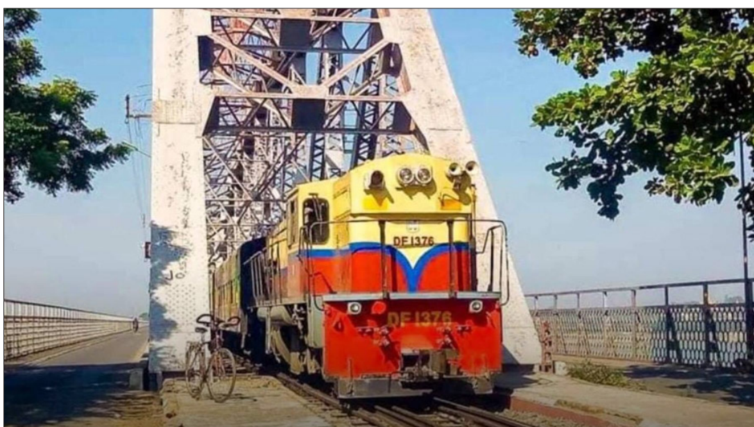
The Yangon-Mawlamyine-Yangon train.

THE Myanmar Railways will start resuming the Yangon-Mawlamyine-Yangon daily route on 25 July.