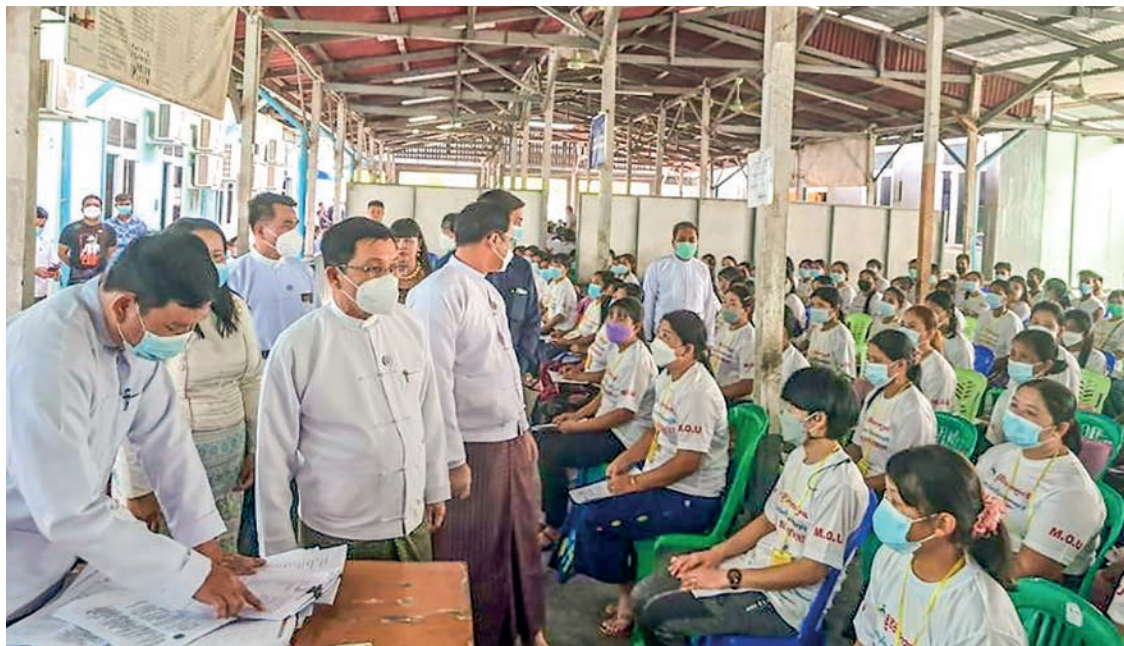
MoL Union Minister U Myint Kyaing inspects the signing of employment contracts.

THE application submission for the 2022 EPS-TOPIK exam will be accepted through the