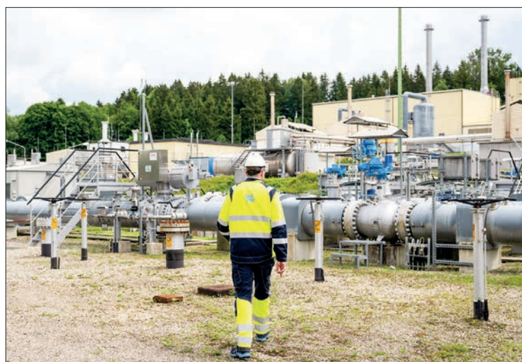
An employee of Uniper Energy Storage walks through the above-ground facilities of a natural gas storage facility at the Uniper Energy Storage facility in Bierwang, southern Germany on 10 June 2022.