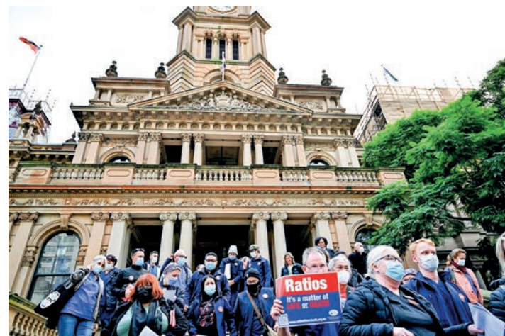
Healthcare workers leave Town Hall following their meeting with the New South Wales Ministry of Health to discuss budget, wages and conditions for nurses and midwives, in Sydney on 28 June 2022.

A spokesman for NSW Health told local media that there were 2,719 health workers in isolation across the state. During the peak of the outbreak in January, more than 6,000 staff were forced to isolate on a single day. —Xinhua