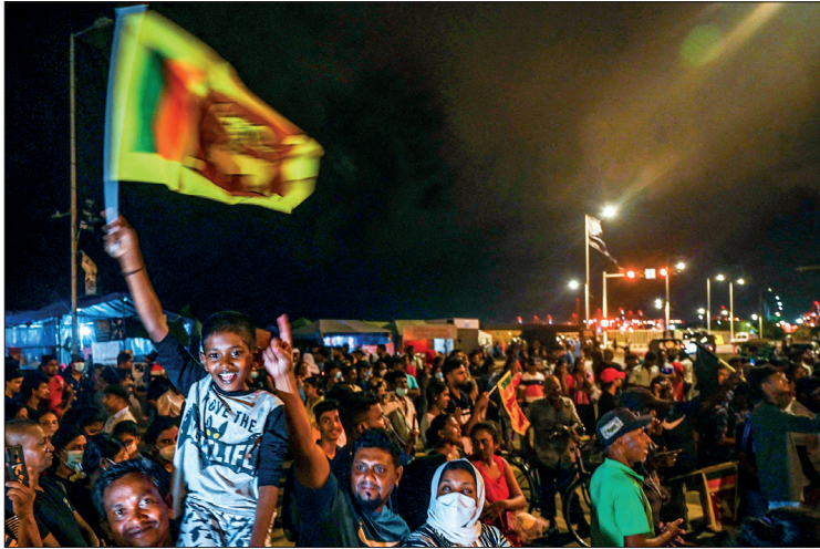
Demonstrators take part in a celebration as Sri Lanka's protest movement reached its 100 th day at the Galle face protest area near Presidential secretariat in Colombo on 17 July 2022.

SRI Lanka's acting president renewed the country's state of emergency Monday ahead of a parliamentary vote to pick a new head of state — a poll in which he is a leading candidate. Ranil Wickremesinghe automatically became acting pres-