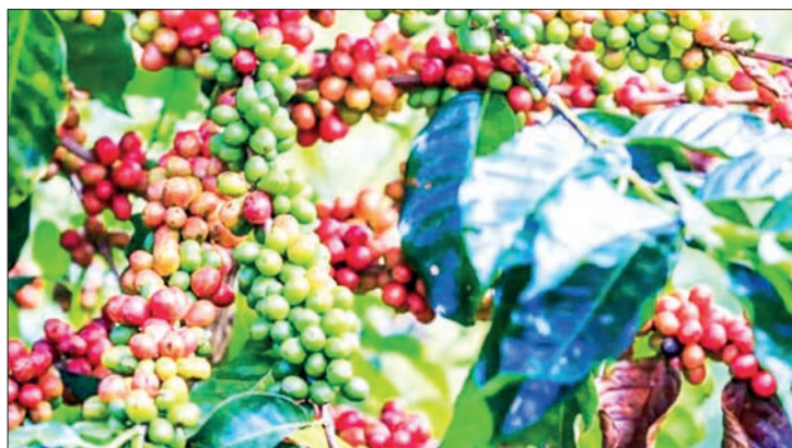
There are 40,000 acres of highland coffee (Arabica) plantations and about 10,000 acres under lowland coffee (Robusta) in Myanmar, totalling 50,000 acres.

ROBUST domestic and foreign demand for Myanmar's coffee beans pushed the price to US$5,000 per tonne, according to the Myanmar Coffee Association.