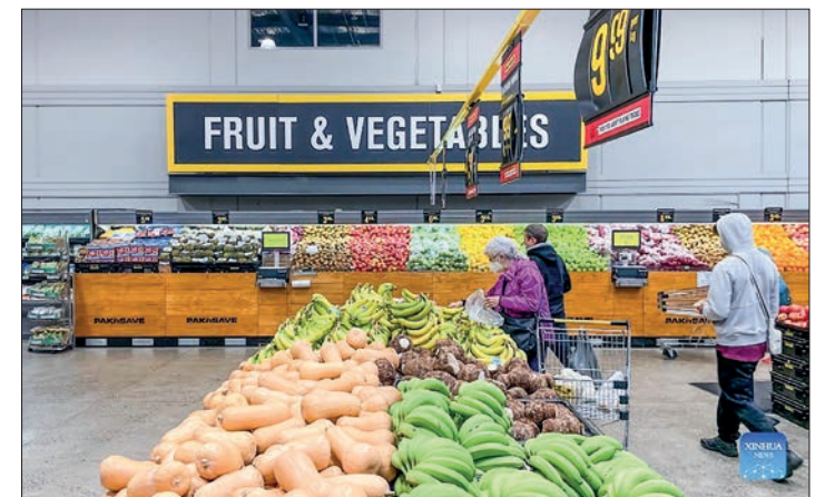
People shop at a supermarket in Wellington, New Zealand, 18 July 2022. New Zealand's consumers price index increased 7.3 per cent in the June 2022 quarter year-on-year, a 32-year high due to higher prices for construction and petrol, the country's statistics department Stats NZ said on Monday.

The 18-per-cent annual increase in the year to the June quarter follows an 18-per-cent jump in March and a 16-per-cent rise in December 2021, Attewell said. —Xinhua