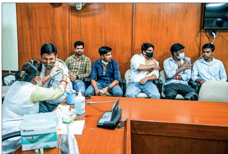
A health worker inoculates a man with a booster dose of the Covishield vaccine against the Covid-19 coronavirus at a vaccination camp in New Delhi on 15 July 2022.

According to the health ministry, the cumulative COV-