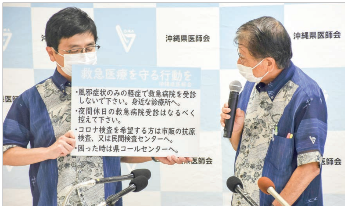
The Okinawa Medical Association holds an emergency press conference on 15 July 2022, in Haeburu, Okinawa Prefecture, to address the surge in COVID patients.

Hospital bed occupancy rates in Tokyo, which reported 17,790 new infections Sunday, have surpassed 30 per cent, with over 2,000 people hospitalized as of 12 July. Tokyo Gov. Yuriko Koike has ordered measures to reduce