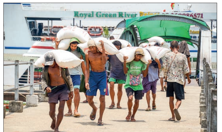
Myanmar has shipped over 550,000 tonnes of rice and broken rice to foreign markets in Q1 (April-June) of the current financial year 2022-2023, with over 510,000 tonnes via seaborne trade and over 33,000 tonnes via cross-border trade.

Myanmar also generated an income of US$700 million from export of two million tonnes of rice to foreign countries in the past 2020-2021 financial year.— NN/GNLM