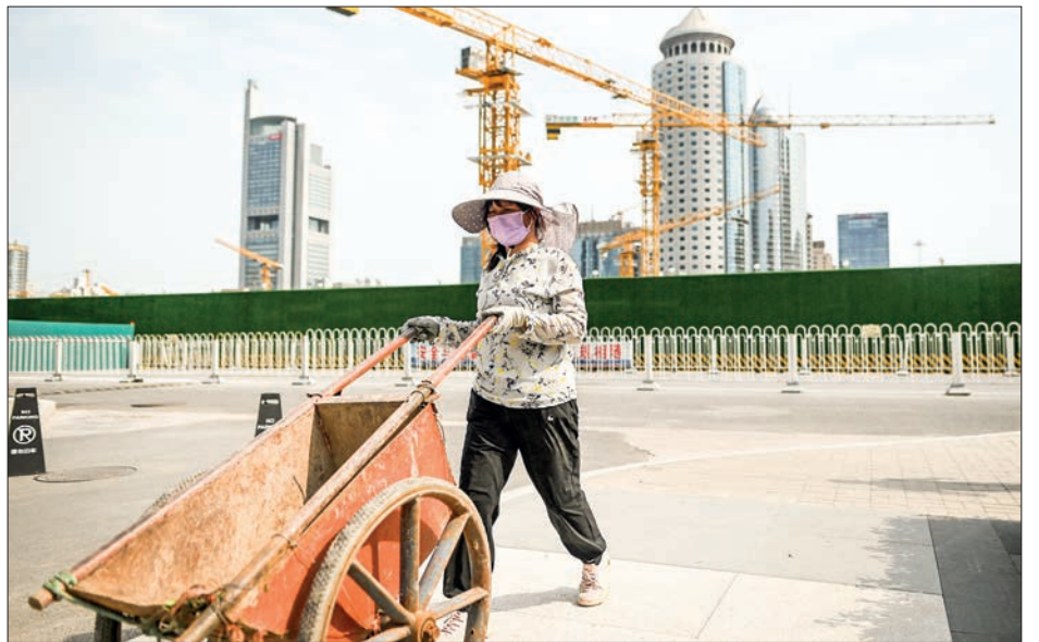
A worker pushes a trolley along a road outside a construction site in the central business district of Beijing on 8 July 2022.

China's Banking and Regulatory Insurance Commission urged banks to "effectively meet the reasonable financing needs of real estate companies, vigorously support rental housing construction" and support project mergers and acquisitions,