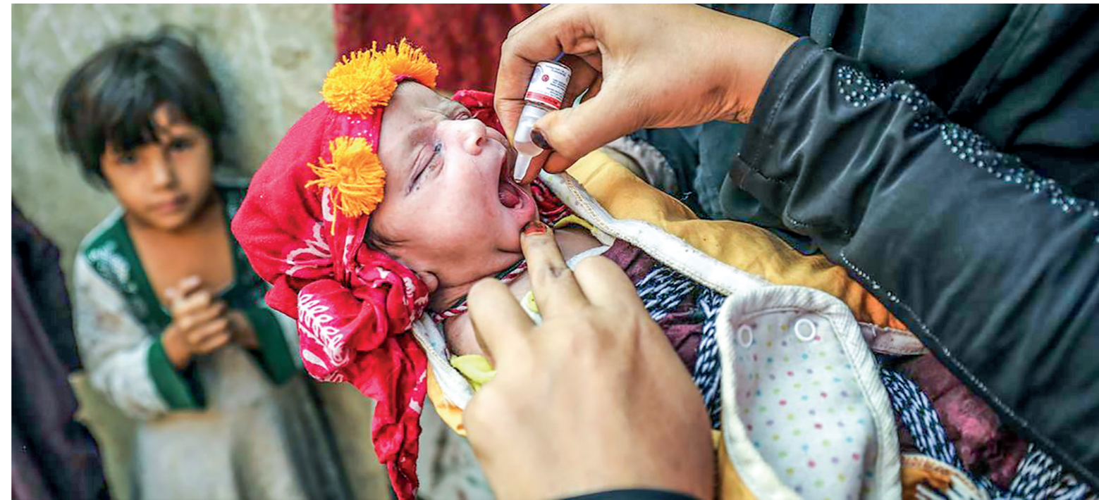
A 13-day-old baby receives the polio vaccine in Gadab town, Karachi Sindh Province, Pakistan.

New leaders of the State have been holding up the guidance of the national martyrs in successive eras in nation-building tasks since the time when the nation regained independence. Now is the best time for all national people to enjoy shared well-being and shared cause in working together. All the public desires must be implemented. If so, their endeavours will be the acts to pay back a debt of gratitude to the martyrs.