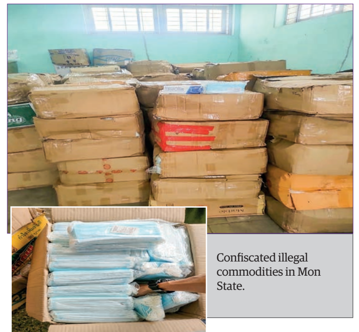
Confiscated illegal commodities in Mon State.

On 18 July, a Customs mobile inspection team by the