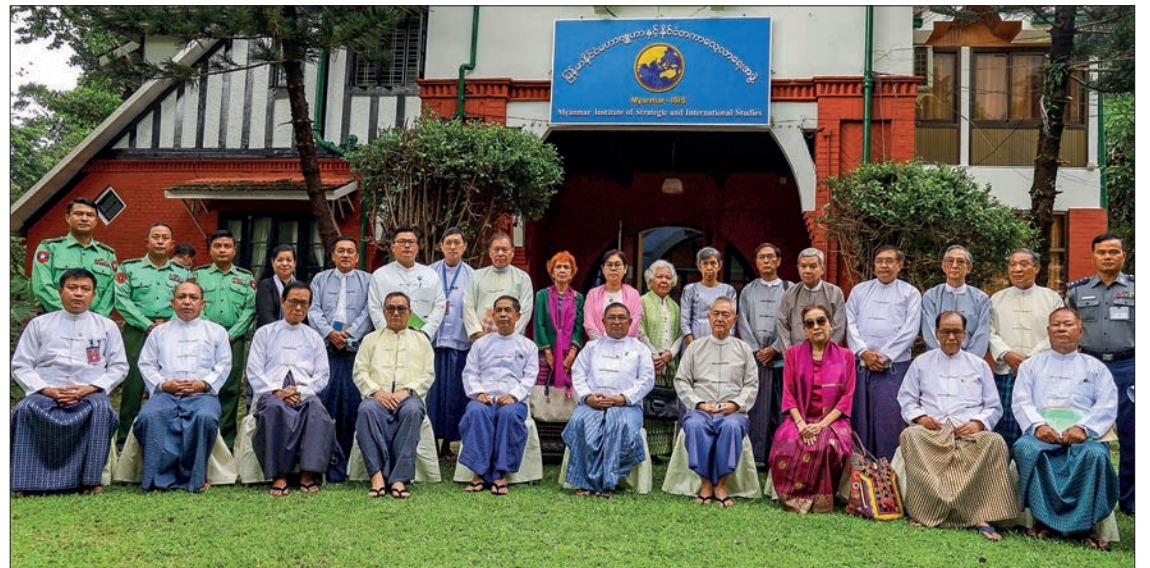
The documentary group photo of the Myanmar Institute of Strategic and International Studies-MISIS was taken at the front of its office yesterday.

Myanmar Institute of Strategic and International Studies (2022-2026) is firmly set up with former deputy ministers, retired Ambassadors, professionals, academicians and experts