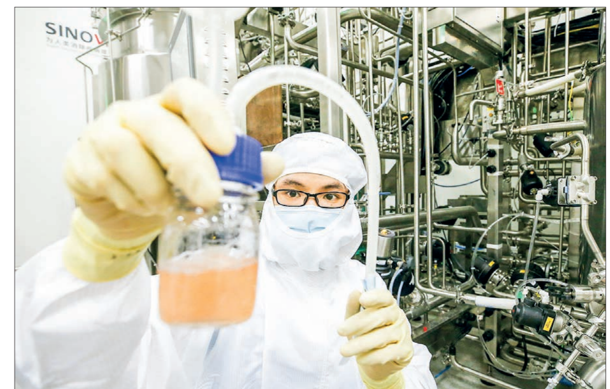
A staff member collects sample to check the condition of Vero cell culture at the COVID-19 vaccine stock solution workshop in trial operation at Sinovac Life Sciences Co., Ltd. in Beijing, capital of China, 15 July 2020.

Both methods preserve the quality, aroma, and flavour of the coffee. The most common way to prepare instant coffee is to add one teaspoon of powder to a cup of hot water. The strength of the coffee can easily be adjusted by adding more or less powder to your cup. Instant coffee also contains antioxidants, some nutrients, and slightly less caffeine, but more acrylamide. However, low-cost instant coffee cannot be genuine coffee these days as in the time everything is expensive, the manufacturers cannot afford to use genuine quality raw material in the instant coffee packs which will be sold at low prices such as a hundred kyat per pack. To sum up my account, my dear readers might agree with the title of this article. It will be according to your wish. But coffee has been consumed worldwide since the middle of the 15 th Century.