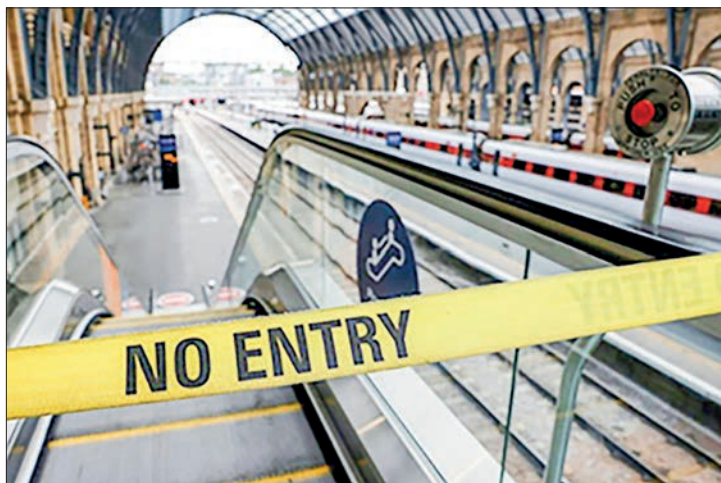
Only one in five trains operated as British railway workers stuck for higher pay and better working conditions.

“Network Rail have not made any improvement on their previous pay offer and the train companies have not offered us anything new,” he said.—AFP