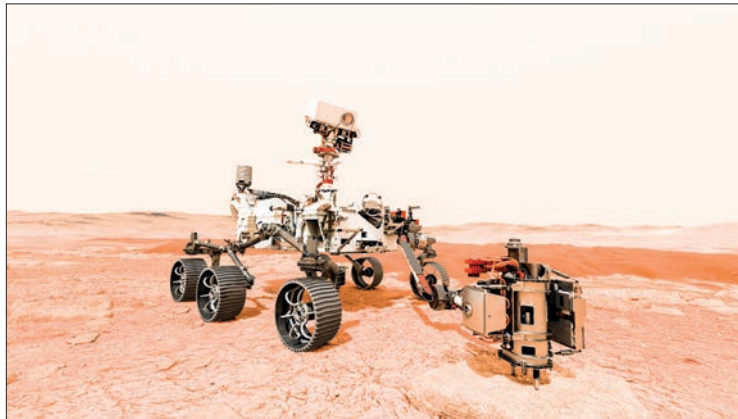
In this illustration, NASA's Mars 2020 rover uses its drill to core a rock sample on Mars.

Up until now, NASA was planning on sending another