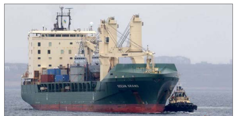
Ocean Grand cargo ship, carrying two former US Coast Guard patrol boats handed to Ukraine as part of military cooperation between the two countries, arrives at the port of Odessa on 23 November 2021.

Ukrainian President Volodymyr Zelensky published a video showing debris scattered around heavily damaged houses in Zatok, a popular resort village to the west of Odessa.—AFP