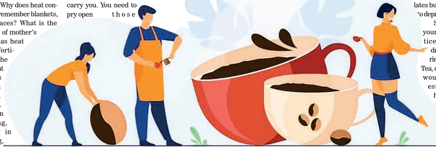
"Research", the paper of record concluded, "Found that those who drank moderate amounts of coffee, even with a little sugar, were up to 30 per cent less likely to die during the study period." If we can just knock out that remaining 70 per cent, we'll have something.