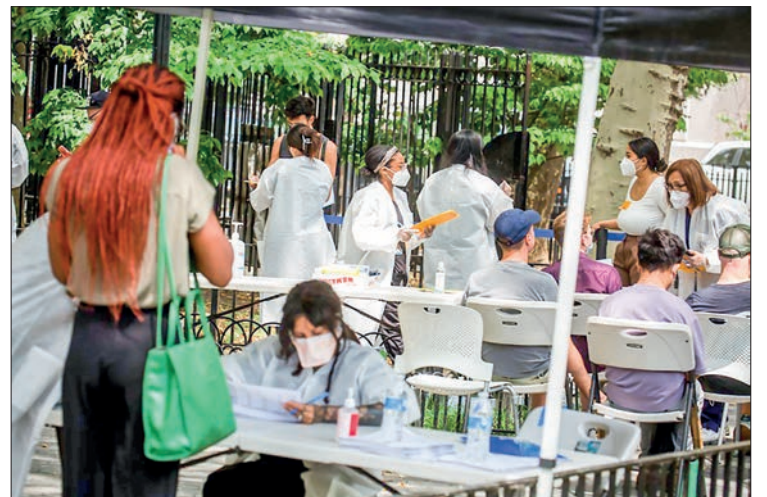
Healthcare workers assist people waiting to be vaccinated at a monkeypox vaccination site in New York, the United States, on 14 July 2022.

At the moment the outbreak is still mostly concentrated in