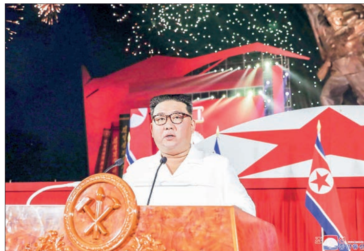
Photo distributed by the Korean Central News Agency shows North Korean leader Kim Jong Un giving a speech on 27 July 2022, at an event in Pyongyang marking the 69th anniversary of the Korean War armistice.

The report marked the first time that the North Korean leader has named South Korean leader Yoon, who took office in May. In marked contrast to his predecessor