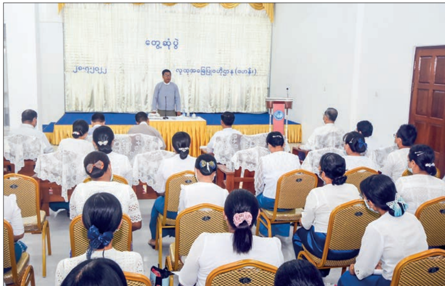
MoI Deputy Minister U Ye Tint meets IPRD officials and staff members at Bahan Community Centre.

DEPUTY Minister for Information U Ye Tint met officials from the Department of Information and Public Relations at the Community Centre on Shwegondine Road in Bahan Township, East Yangon District, at 9 am on 28 July.