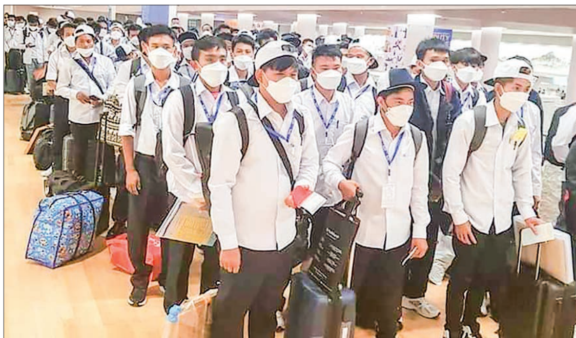
The photo shows some MoU workers who are going to work in South Korea.

MORE than 37,000 candidates have been eligible to sit for Korean Employment Exam to be held in August, according to the statement of the government's foreign employment agency POEA-EPS.