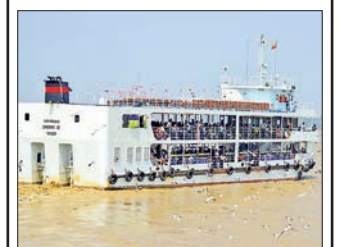
The Pansodan-Dala ferry "Cherry".

Cherry ferries from Pansodan-Dala jetties provide shuttle service to the public every day from 5:30 am to 9 pm every 20 minutes. — TWA/GNLM