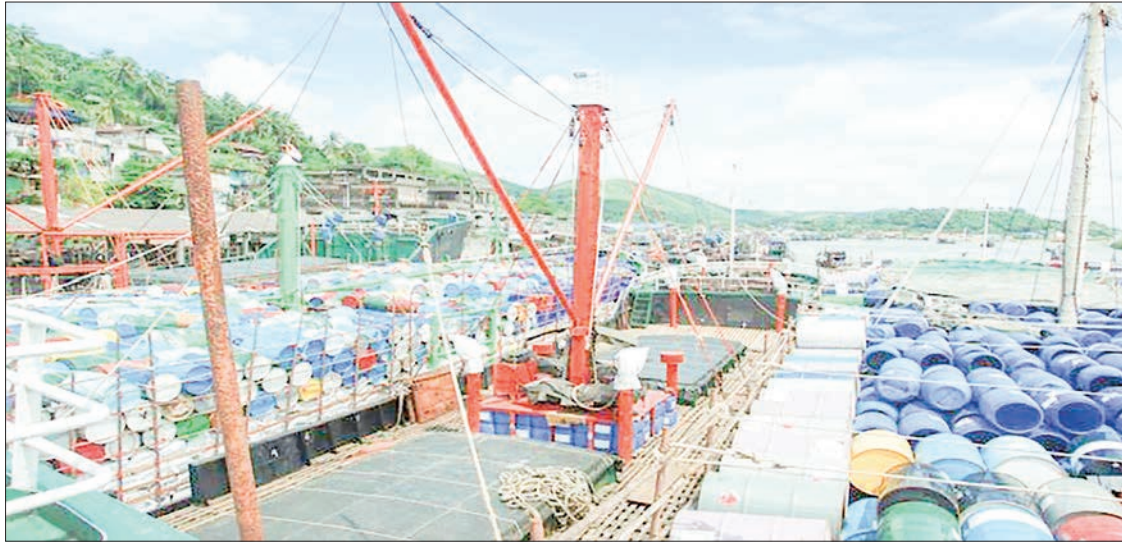
Export cargoes are loaded at the Kawthoung trade post.

As imports, more dry batteries, bicycle spare parts, medicines, and furniture were im-