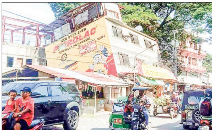
Five people were killed and more than 150 injured in the Philippines when a powerful quake struck Abra province.

The powerful quake rippled across the mountainous area, toppling buildings, triggering landslides and shaking high-rise