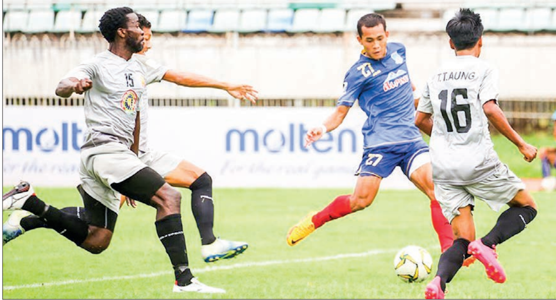
A Yadanabon FC player (blue) tries to touch the ball into the net during the MNL Week 5 match against Rakhine United at Thuwunna Stadium in Yangon on 28 July 2022.

THE final day of the Week 5 of Myanmar National League 2022 continued on 28 July, and Yadanabon FC defeated the Rakhine United by three goals and regained the victory.