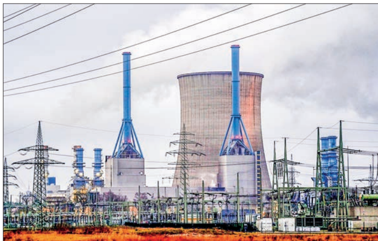
Ukraine started exporting electricity to the European Union via Romania in early July.

PRESIDENT Volodymyr Zelensky said Wednesday Ukraine will up its export of electricity to the European Union as the bloc faces an energy crisis sparked by Russia's invasion.