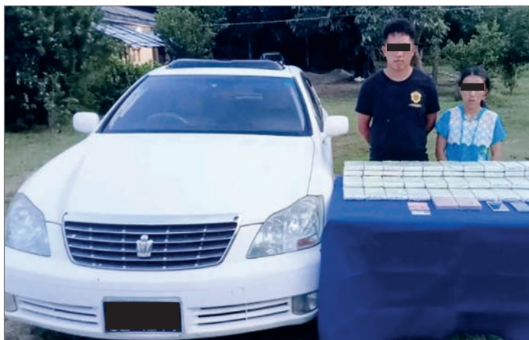
Two arrestees are pictured along with seized heroin and a saloon.

The suspects have been prosecuted under the Narcotic Drugs and Psychotropic Substances Law and Police is carrying out investigations to capture traffickers, it is learnt.