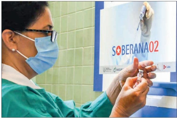
Soberana Plus is one of three covid vaccines developed in Cuba, none of which have yet been approved by the World Health Organization.

BELARUS has become the first European country to approve the emergency use of a Cuban-made Covid-19 vaccine, the centre that produces the jab said on Wednesday.