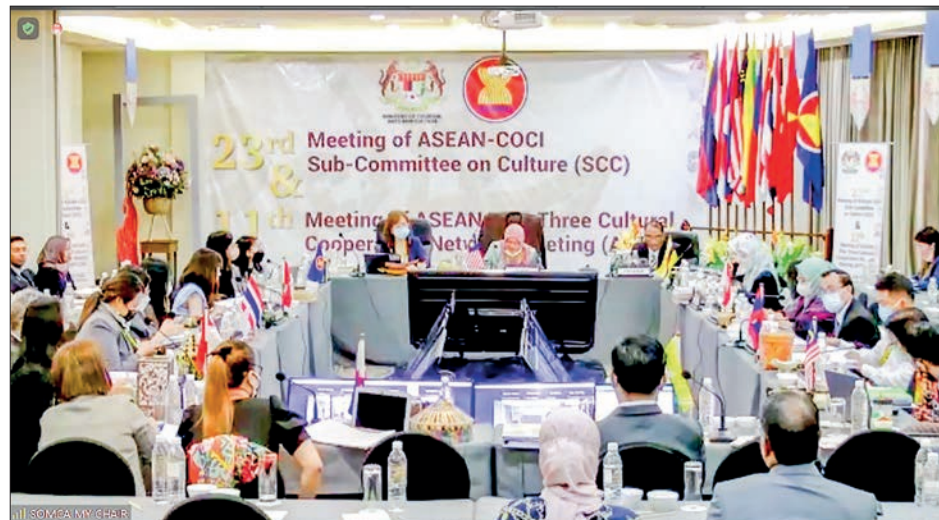
The 23 rd ASEAN SCC and the eleventh ASEAN+3 APTCCN meetings are underway.

Myanmar will hold the upcoming meeting of the 24 th ASEAN Sub-Committee on Culture (SCC) and the 12 th ASEAN Plus Three Cultural Cooperation Network-APTCCN as a host in 2023. — MNA