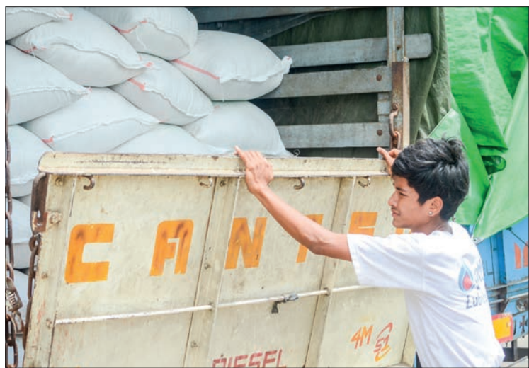
Myanmar daily conveys approximately 10,000 bags of rice and broken rice to China through the Muse border.

MORE than 10,000 bags of rice and broken rice are daily conveyed to China through the Muse border post, U Min Thein, vice-chair of the Muse Rice Wholesale Centre said.