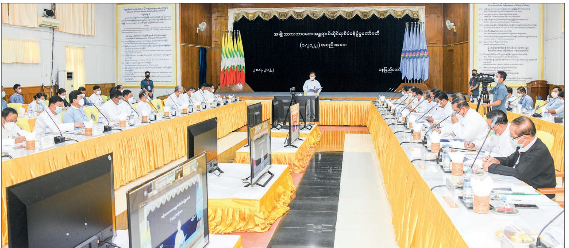
State Administration Council Vice-Chairman Deputy Prime Minister Vice-Senior General Soe Win chairs the meeting 1/2022 of the Natural Disaster Management Committee in Nay Pyi Taw on 28 July 2022.

FIRM organizational setup, proper work system and harmonious coordination are essential in natural disaster management, said Chairman of the National Natural Disaster Management Committee Vice-Chairman of the State Administration Council Deputy Prime Minister Vice-Senior General Soe Win at the meet-