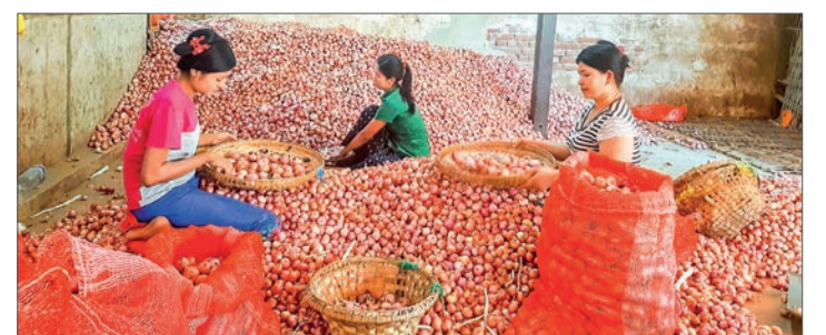
According to 2018-2019 FY's data from the Ministry of Agriculture, Livestock and Irrigation, there were over 170,000 acres of onion plantations.

According to 2018-2019 FY's data from the Ministry of Agriculture, Livestock and Irrigation, there were over 170,000 acres of onion plantations. The per-acre yield is estimated at over 3,600 visses per acre. Mandalay Region constitutes 36 per cent of overall production, followed by Sagaing Region with 32 per cent and Magway Region with 26 per cent.