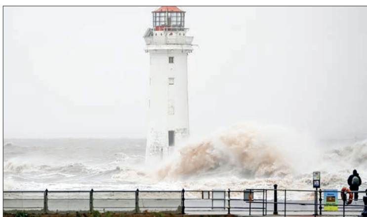
A person watches from the promenade as waves in break in a stormy sea alongside the lighthouse in New Brighton, north west England, on 8 December 2021, as Storm Barra swept over the country.

SEA levels are increasing around Britain at a far faster