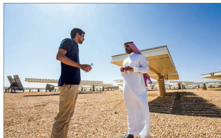
Saudi Arabia aims for 50% renewable energy by 2030. A Saudi man speaks to a journalist at a solar plant in Uyayna, north of Riyadh.

Prince Mohammed's trip to Europe comes less than two weeks after US President Joe Biden visited the Saudi city of Jeddah for a summit of Arab leaders and met one-on-one with the prince, greeting him with a fist bump.—AFP