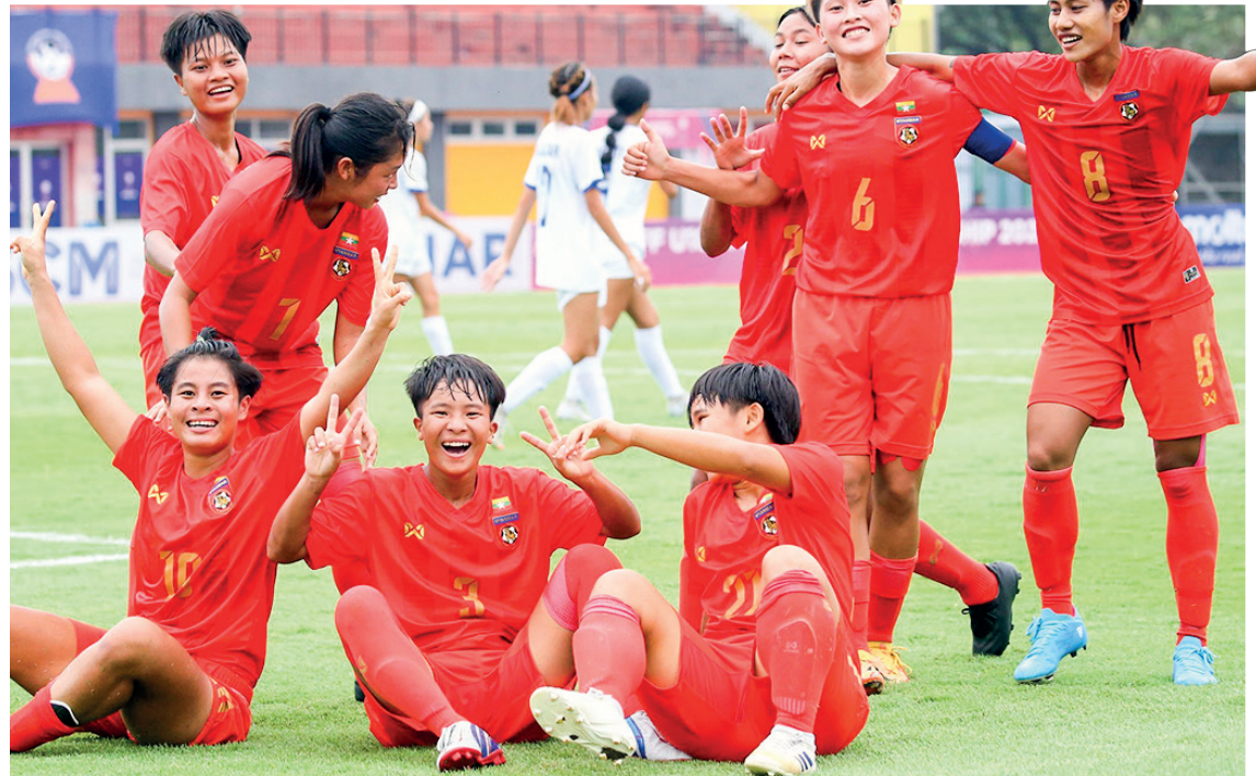
Myanmar U-18 women's players celebrate their victory at the previous group match against the Philippines on 27 July.