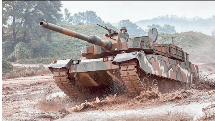
The K2 Black Panther main battle tank (MBT) is a completely new tank, developed and manufactured in South Korea.

"We're drawing lessons from what's happening in Ukraine," Defence Minister Mariusz Blaszczak told journalists after