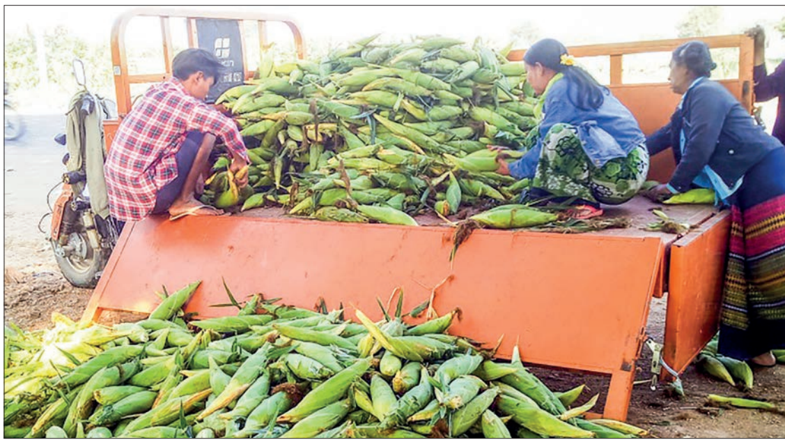
At present, corn is cultivated in Shan, Kachin, Kayah and Kayin states and Mandalay, Sagaing and Magway regions. The country produces 2.5-3 million tonnes of corn every year.

The drop in prices is attributed to the transaction policy changes. Earlier, export earnings for beans were allowed to be made with Yuan-Kyat or Baht-Kyat direct payment. Starting from 30 June, transactions for rice, corn, oil crops and beans and pulses are instructed to be paid in US dollars.