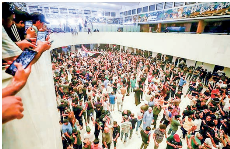
Supporters of Iraqi cleric Moqtada Sadr gather inside Iraq's parliament in Baghdad's high-security Green Zone on Wednesday night.

Prime Minister Mustafa al-Kadhemi called on the protesters to "immediately withdraw", warning that the security forces would ensure "the protection of state institutions and foreign missions, and prevent any harm to security and order".—AFP