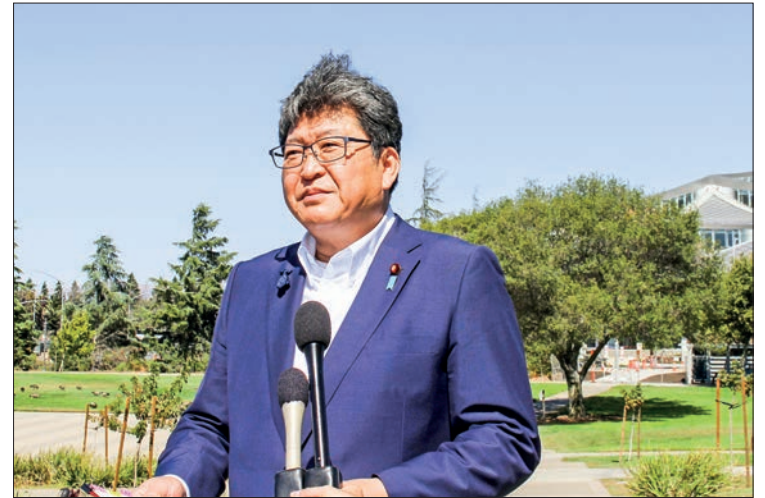
Koichi Hagiuda, Japan's minister of economy, trade and industry, speaks to the press after inspecting Google LLC's headquarters in Mountain View, California, on 27 July 2022.

The plan envisions sending 200 people from Japan to Silicon Valley annually starting in