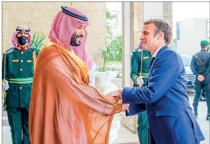
Crown Prince Mohammed bin Salman (L) receives French President Emmanuel Macron in the Saudi Arabian city of Jeddah in 2021.

possible power shortages due to the Russian invasion of Ukraine, as well as reining in the nuclear programme of Riyadh's top regional foe Iran. MBS -- who is portrayed at home as a champion of social and economic reform but seen by critics as a murderous tyrant -- arrives in France fresh from a trip to Greece to discuss energy ties. "I feel profoundly troubled by the visit, because of what it means for our world and what it means for Jamal (Khashoggi) and people like him," Amnesty International secretary-general Agnes Callamard told AFP, describing MBS as a man who "does not tolerate any dissent".—AFP