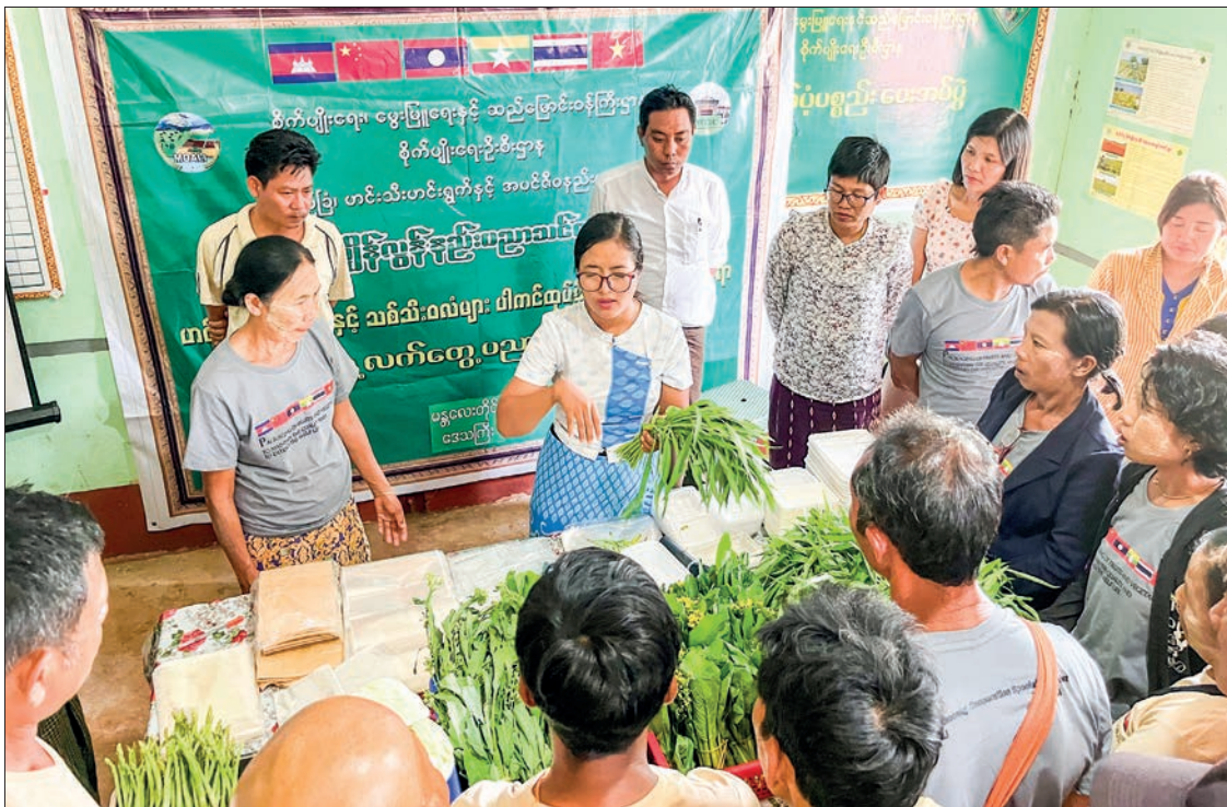
The training on the packaging of fruits and vegetables is in action.

As a consequence, the programme can help farmers understand the suitable packaging of fruits and vegetables and the ways to pack products safely. — GNLM