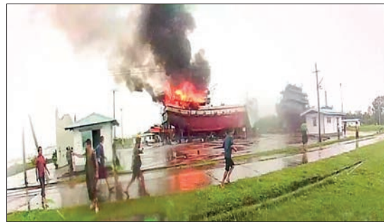
Fire brigade members are seen putting out the fire.

Fire brigade members from Kyimyindine Township on the Yangon side carried water pumps, generators and pipes by boats to the other side while putting out the fire.