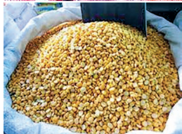
Potatoes and chickpeas are pictured being displayed in the market.

rose to K2,250 per viss in the last four months of 2000.