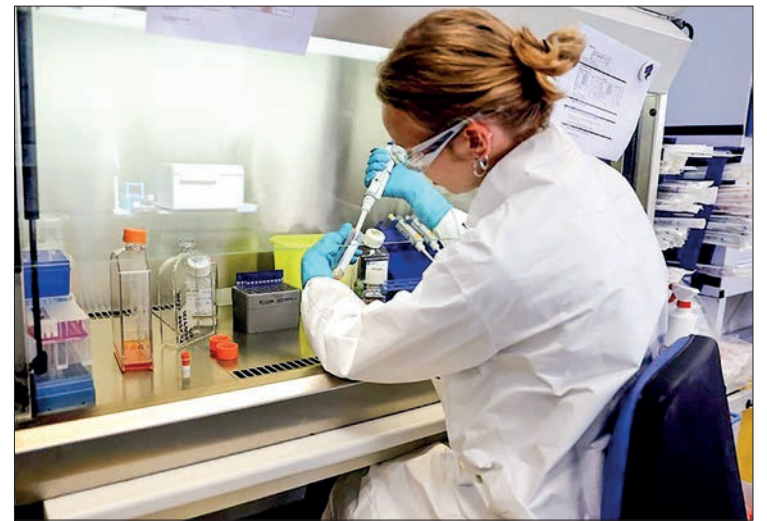
Britain has launched dispute procedures with the European Union over its exclusion from the bloc's scientific research programmes, using a mechanism set out in a post-Brexit deal.

The UK government said it has written to the European Commission to launch dispute resolution proceedings and expects “constructive engagement”.— AFP