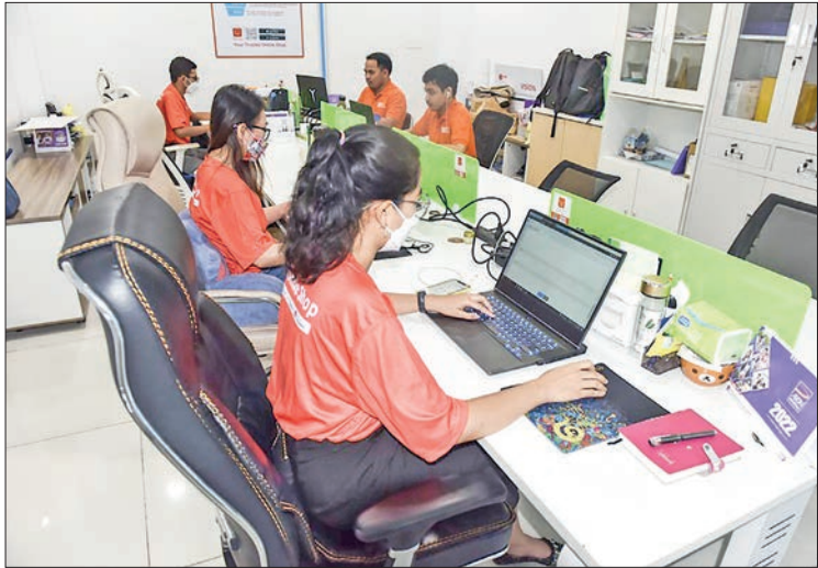
Employees work at online market Smile Shop in Phnom Penh, Cambodia, 21 Dec 2021.