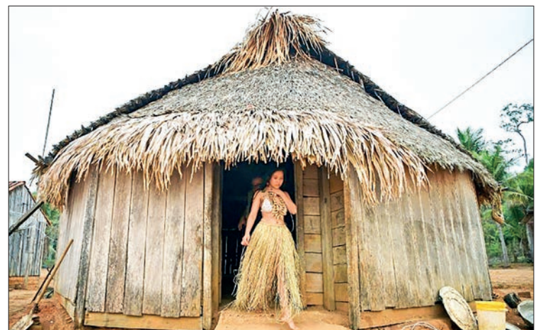
Fewer than 200 members remain of the Uru-eu-wau-wau tribe, traditionally hunter-gatherers who live in a protected area of Brazil's Amazon rainforest, surrounded and encroached upon by aggressive and illegal settlers, farmers and loggers.

“We had to have a conversation with him like, ‘Okay, are we done with the film? Do we have everything we need? Is there more? Should we start editing?’— AFP