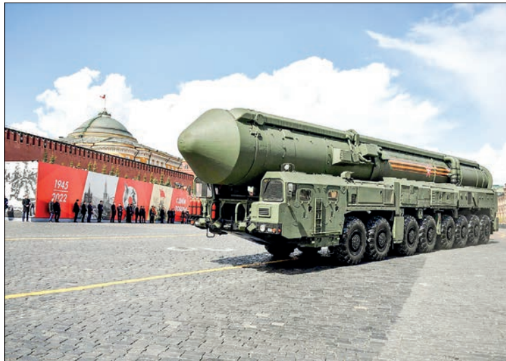
A Russian Yars intercontinental ballistic missile launcher parades through Red Square during the Victory Day military parade in central Moscow on May 9, 2022.

Soot injections totalling more than five million tonnes would lead to “mass food shortages, and livestock and aquatic food production would be unable to compensate for reduced crop output, in almost all countries,” said the team that carried out the study, including Lili Xia of Rutgers university in the United