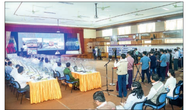
Maj-Gen Zaw Min Tun talks about the prices of basic foodstuffs.