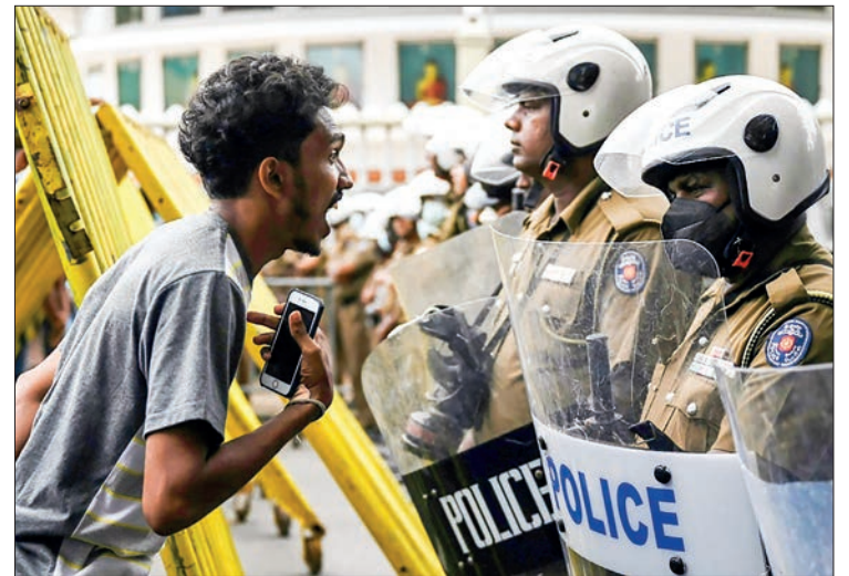
Emergency regulations allow troops and police to arrest suspects and detain them for long periods of time.

The country defaulted on its $51 billion foreign debt in mid-April and is in talks with the International Monetary Fund over a possible bailout.— AFP