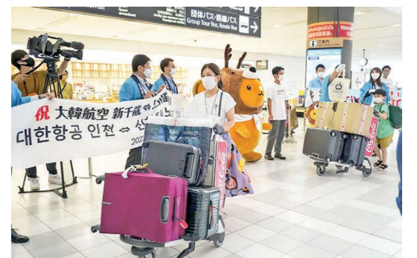
Passengers arrive at New Chitose Airport in Hokkaido, northern Japan, on 17 July 2022 as international flights resumed after a 28-month hiatus.