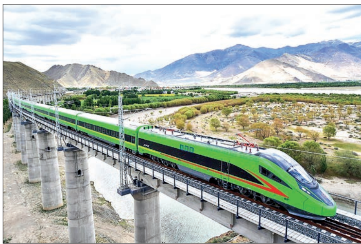
A Fuxing bullet train runs on the Lhasa-Nyingchi railway during a trial operation in Shannan, southwest China's Tibet Autonomous Region, 16 June 2021.

THE Tibetan Plateau will experience significant water loss this century due to global warming, according to research published Monday that warns of severe supply stress in a climate change “hotspot”.