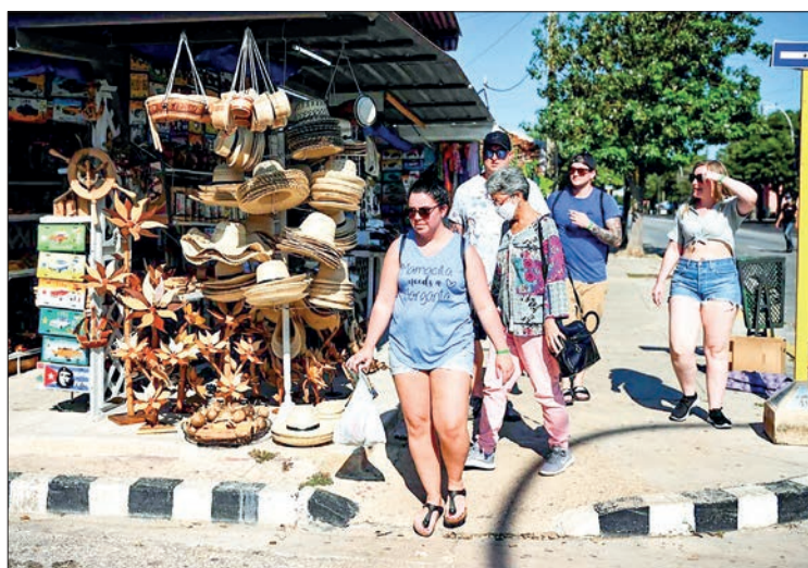
Tourists walk along a boulevard in Varadero, Matanzas province, Cuba, on 28 February 2022.

THE Cuban government has announced it will allow foreign investment in domestic wholesale and retail trade for the first time in 60 years, in a move aimed at addressing critical shortages of goods.