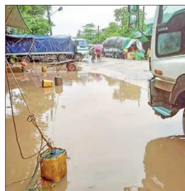
Flash floods hit warehouses and backstreets at the Bayintnaung market.

The freight forwarding service industry was unexpectedly hampered by heavy rainfalls and flash floods on 17 August.