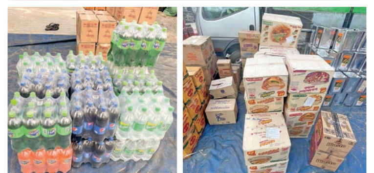
Confiscated items in Mandalay Region.