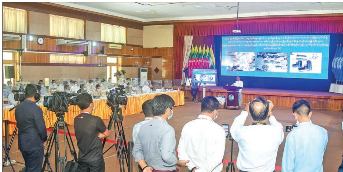
The 19 th Press Conference of the SAC Information Team is in progress yesterday.

First, Information Team Leader Maj-Gen Zaw Min Tun explained the holding of the National Defence and Security Council Meeting 2/2022 by SAC on 31 July 2022, undertakings of the tasks by SAC in accord with the adopted roadmap and future plans, implementation of two national visions and two political visions by the Council, holding of the coordination meeting on accomplishments of the Union government attended by Union ministers, region and state chief ministers and chairmen of self-administered zones, trans-