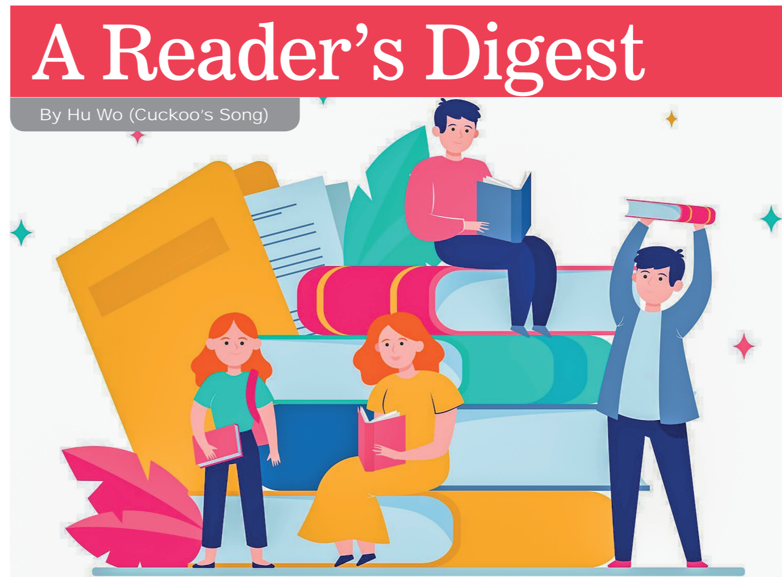
The effects of reading, or more specifically, digested reading, are enormous.

So, how to digest reading will be presented here as far as I am concerned. Firstly, by the time a book is read, readers should read the whole book, not excluding the writer's foreword, thanks, others' remarks, and further reading if they are included in the book. Such things may help the readers show the right way to read a book. Secondly, readers ought to take a look at the contents page. From the contents, they can not only guess which subject matter might be written in a book but also skim