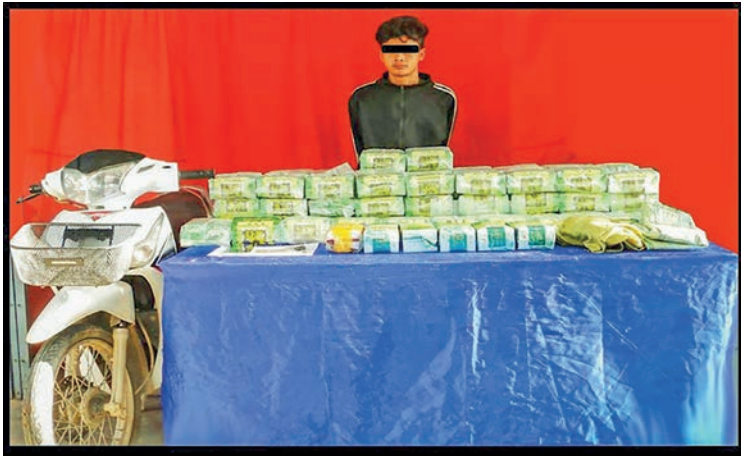
An arrestee is pictured along with seized drugs and a motorbike.

THE Myanmar Police Force stated that over K1.46 billion worth of Ice (Methamphetamine) weighing 120 kilogrammes and Ketamine weighing 59 kilogrammes were confiscated in Kengtung, Shan State (East).