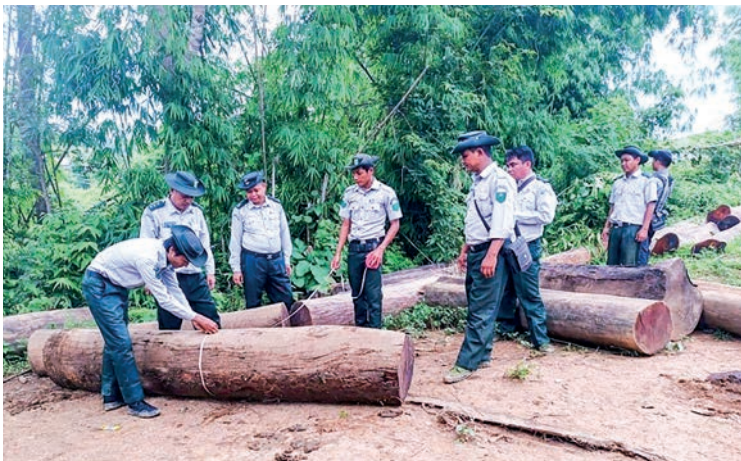
Officials check illegal teak logs in Bago Region.

SUPERVISED by the Anti-Illegal Trade Steering Committee, effective action is being taken to prevent illegal trade under the law.