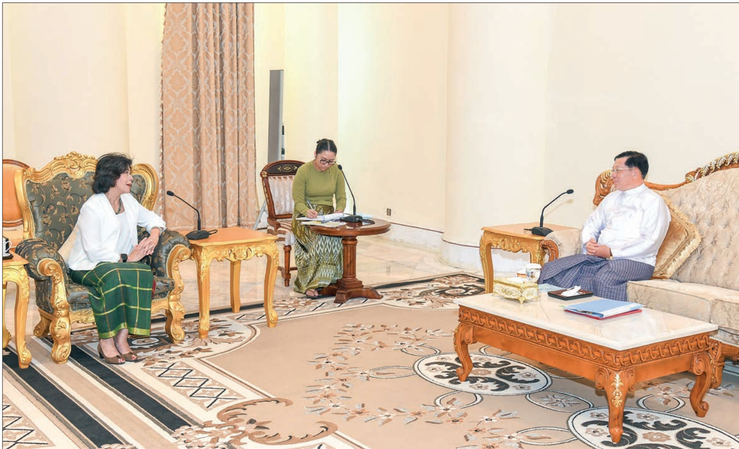
State Administration Council Chairman Prime Minister Senior General Min Aung Hlaing receives Special Envoy of the United Nations Secretary-General on Myanmar Ms Noeleen Heyzer in Nay Pyi Taw on 17 August 2022.

Chairman of the State Administration Council Prime Minister Senior General Min Aung Hlaing received Ms Noeleen Heyzer, Special Envoy of the United Nations Secretary-General on Myanmar, at the parlour of the SAC Chairman's Office in Nay Pyi Taw yesterday afternoon.