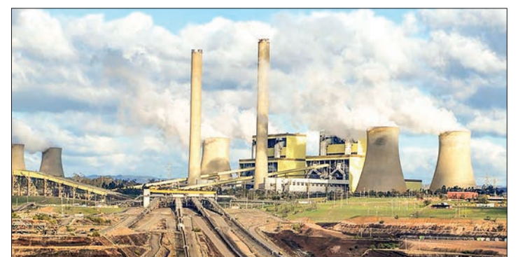
The Energy Legislation Amendment Bill 2022, announced on Monday, would bring forward the timeline for the closure of the state’s remaining coal plants.

The Greens remain a minor party in Australian politics. However, a swing of voters in the nation’s May federal election has increased their influence on Australia’s politics. The three coal plants are currently scheduled to close as late as 2048. The Greens said this is at odds with projections made by the United Nations that tackling the climate crisis would require the closure of all coal power stations by 2030.—Xinhua