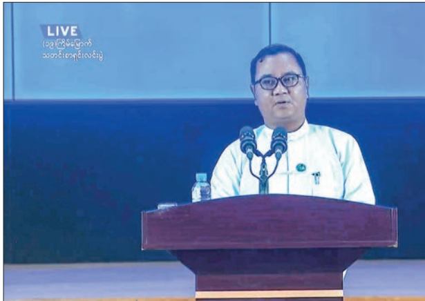
Maj-Gen Zaw Min Tun answers the question of a reporter.

THE State economic promotion funds (K400 billion) including the fund for agriculture are from the COVID-19 fund and not the newly printed banknotes, said Maj-Gen Zaw Min Tun, leader of the Information Team during the 19 th Press Conference of the State Administration Council.