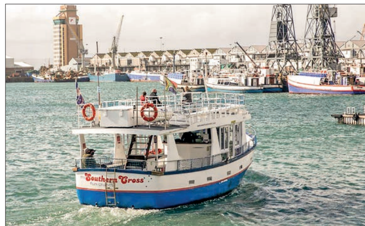
People enjoy a boat trip in Cape Town, South Africa, 30 June 2021.

interview with Xinhua that the department was concerned about the increasing number of monkeypox cases, but stressed there was no need to panic. According to him, a 28-year-old man from the Western Cape province has been identified as the fourth case of monkeypox. The patient returned to South Africa from Spain in the second week of August. “A polymerase chain reaction (PCR) test was performed in a private pathology laboratory. The samples were submitted to the National Institute for Communicable Diseases (NICD) for sequencing analysis,” Mohale said, noting the health department has instituted public health response measures including contact tracing to prevent the spreading of the monkeypox virus.—Xinhua