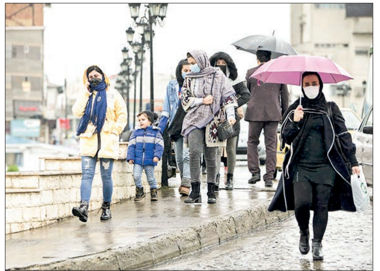
People wearing face masks walk on a street in Tonekabon, northern Iran, 6 Dec 2020.