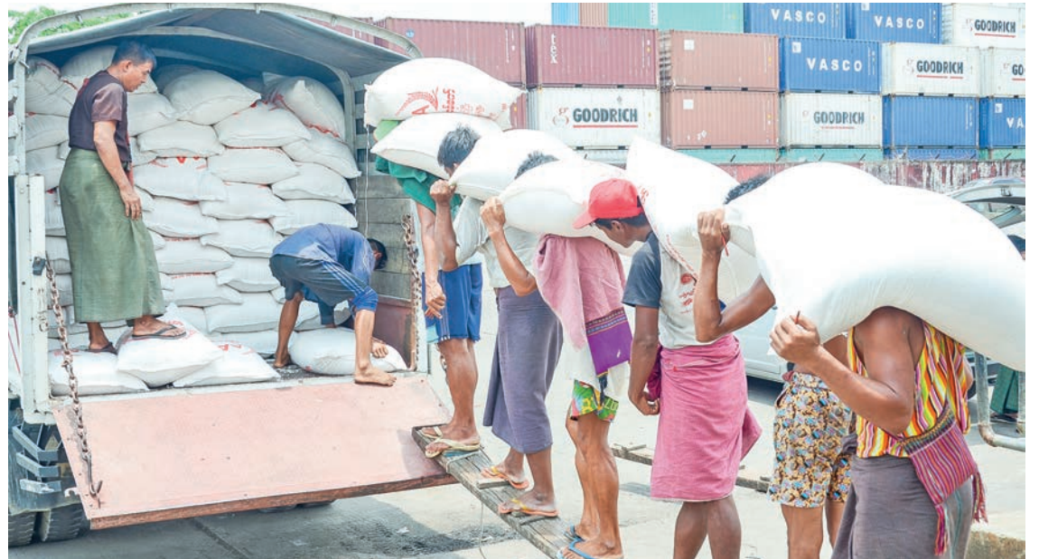
Prices of high-grade Pawsan rice variety from Shwebo Township rose by K24,000 per bag in domestic markets. Rice bags are loaded onto the lorry.

The prices will stand at K75,000-77,000 per bag of Shwebo Pawsan, K52,000-55,000 per bag of Ayeyawady Pawsan, K55,000-60,000 per bag of Kyapyan, and K35,000-37,000 per bag of short-matured rice varieties