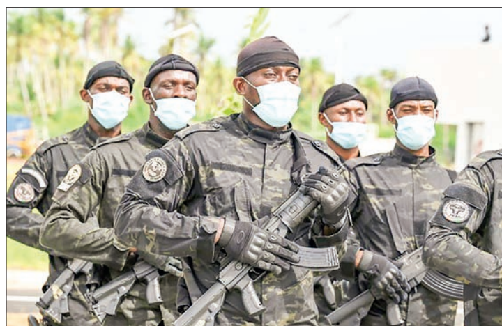
Ivory Coast last year inaugurated a training school for West African militaries fighting jihadism — the International Academy for Combatting Terrorism (AILCT).

"This test launch is part of routine and periodic activities intended to demonstrate that the United States' nuclear deterrent is safe, secure, reliable and effective," the Air Force said in a statement. "Such tests have occurred more than 300 times before, and this test is not the result of current world events."—AFP