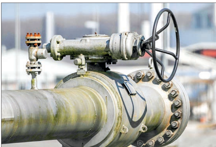
Spain hails Berlin call for Europe gas link.

Madrid has for years championed the idea of a pipeline across the Catalan Pyrenees with France to significantly increase transfer capacity and insisted such link could be built within months.—AFP