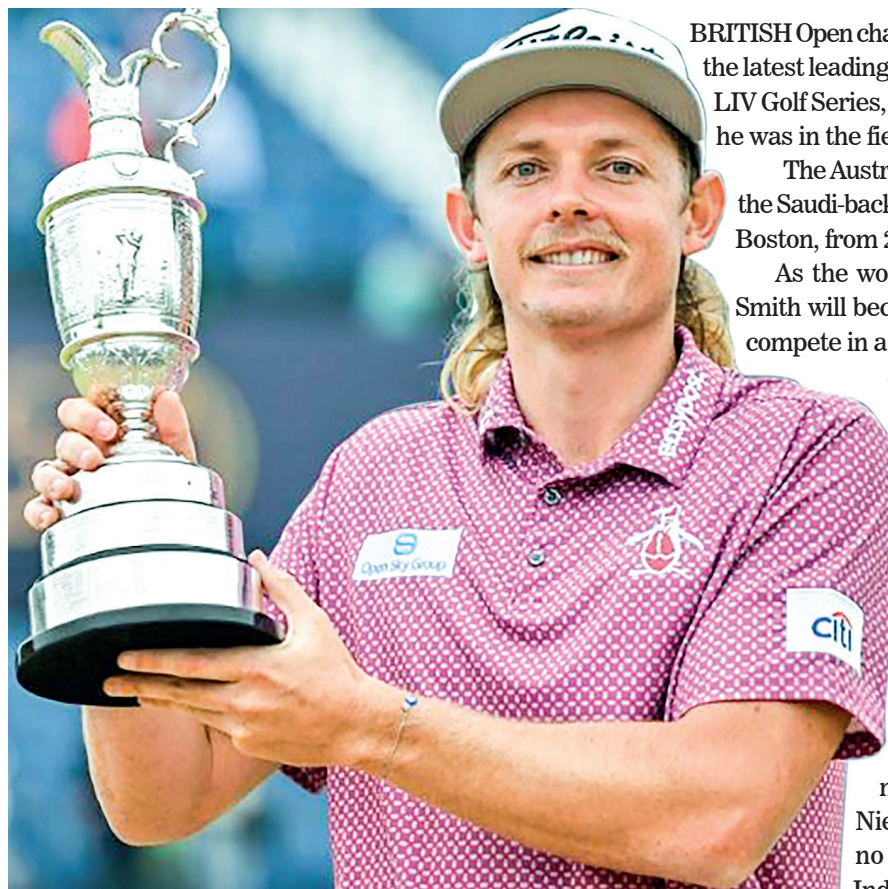
Cameron Smith with his British Open jug.

BRITISH Open champion Cameron Smith has become the latest leading player to sign up to the breakaway LIV Golf Series, which on Tuesday announced that he was in the field for its next event.