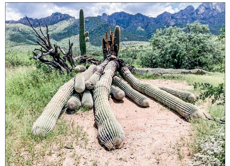
An undated image courtesy of Arizona State Parks and Trails shows a 200-year-old Saguaro cactus at Catalina State Park after it was felled by heavy rains. PHOTO: ARIZONA STATE PARKS AND TRAILS/AFP

"Thankfully this giant has fallen off the trail and will stay where it landed, providing habitat and food for many creatures as it decomposes," Arizona State Parks said.—AFP