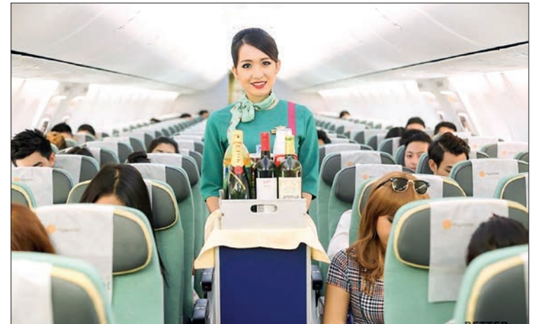
An MNA flight attendant is pictured serving the passengers.

According to the provisions stipulated in section 11, 12 and 13 of the Foreign Exchange Management Law, all the foreign cur-