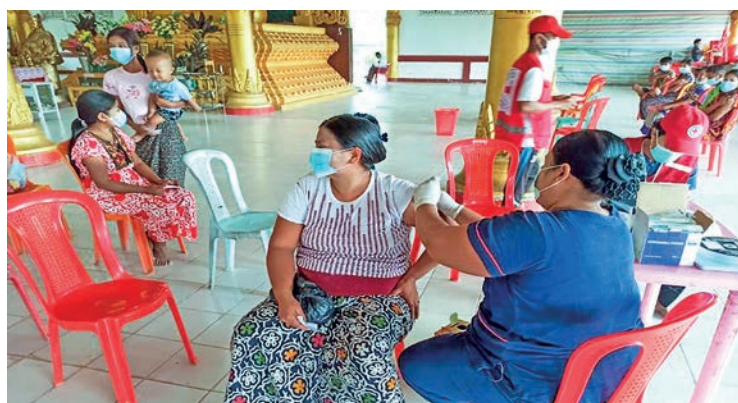
A local in Ponnagyun Township, Rakhine State gets COVID-19 vaccine shot on 31 August.

Yesterday, doctors and nurses from public hospitals, medical teams from the Tatmad-