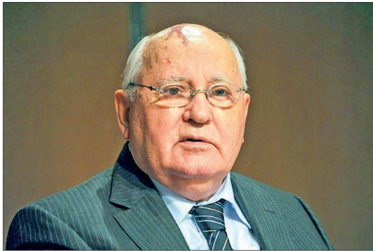
Mikhail Gorbachev, who helped bring US-Soviet relations out of a deep freeze, was the last surviving Cold War leader.

His life was one of the most influential of his times, and his