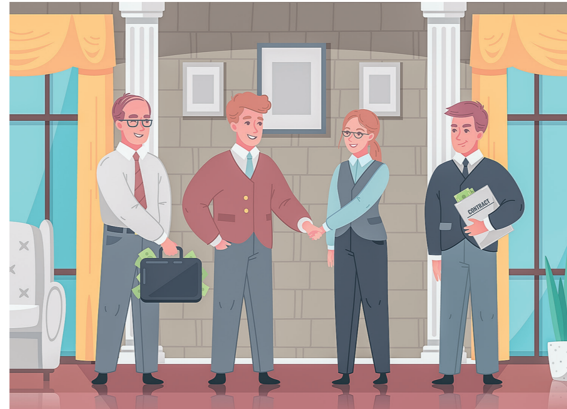
Only when a society which is free from corruption emerges, will the people have a safe life not face losses in corruption and not become victims of corruption cases.

In the fourth amendment to the law on 21 June 2018, a definition mentioned anyone who is