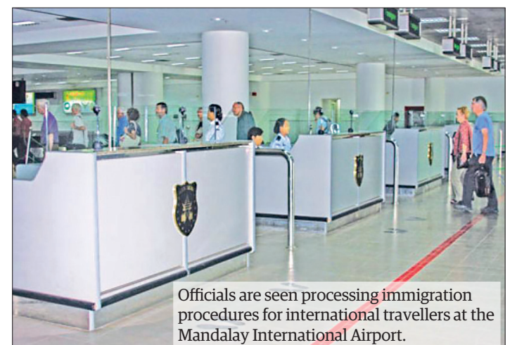
Officials are seen processing immigration procedures for international travellers at the Mandalay International Airport.

The MoH rules includes wearing on face masks and receiving full COVID-19 vaccination plus booster shots as a few genetic mutations of COVID-19 have been found in Myanmar. — TWA/GNLM