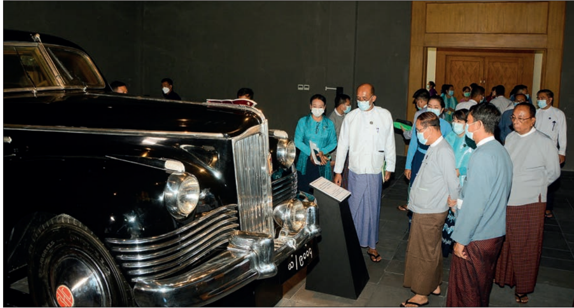
The MoRAC Union Minister and dignitaries look into the vehicles that were belong to ex-presidents of Myanmar.

Speaking at the event, the Union Minister said the people can study the changing artworks of Buddha images of Myanmar people from the Pyu era to date and pay homage to the images, and they can improve their knowledge regarding the