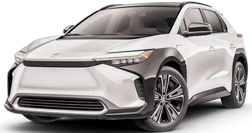
The increased capacity will be the equivalent of battery packs for 560,000 of Toyota's bZ4X electric crossover sport-utility vehicle that was recently launched.

lion yen is part of the four trillion yen that Toyota plans to spend to help meet a goal of selling 3.5 million EVs worldwide and raising battery output capacity to 280 gigawatt-hours by 2030.