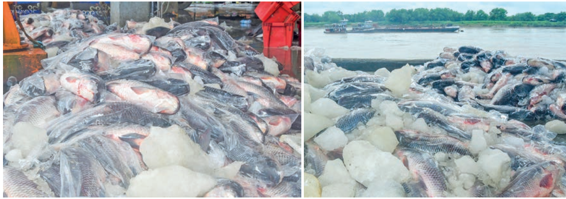
Myanmar has conveyed 6,132.4 metric tons of fishery products to Bangladesh between 1 April and 26 August in the current financial year 2022-2023, with estimated earnings of US$7.785 million.

Myanmar delivered 362.97 MT of fishery products worth $23.387 million via two border posts (Sittway and Maungtau) in the previous mini-budget period. As of 26 August, Myanmar exported 823.4 MT of fishery products valued at $1.18 million via the Sittway border and $6.605 million worth of 5,309 MT of fishery products via Maungtau. The fishery exports to Bangladesh accumulated $7.785 million in nearly five months.