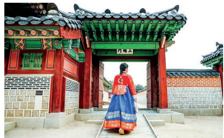
Photo taken on 2 November 2019 shows a tourist wearing a traditional Hanbok dress visiting the Gyeongbokgung Palace in Seoul, South Korea.

In a related development, South Korea said it will no longer require that visitors to the country take PCR tests before departure and show a negative result.—Kyodo