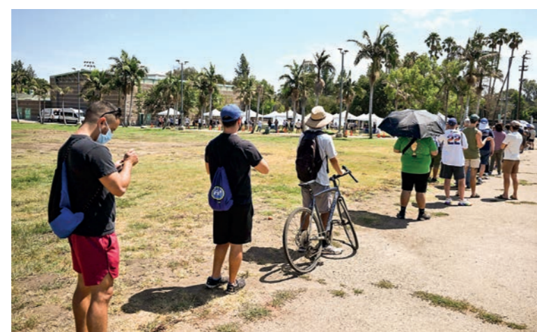
People wait in line for the monkeypox vaccine at the Balboa Sports Centre in the Encino neighbourhood of Los Angeles, California, on 27 July 2022.

So far, United States has seen 18,100 cases of monkeypox. The number of new infections appears to have recently slowed slightly, according to data from health authorities.