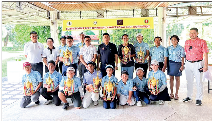
Professional golfers pose for a group photo after receiving trophies at the Golf Open Junior and Professional Tournament awarding ceremony.