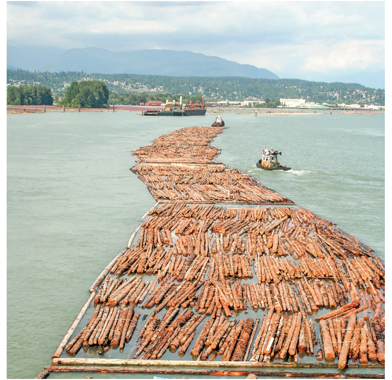
Log driving in Vancouver.

The minister said taking legal action under CUSMA represents another step in Canada's ongoing defence of its forestry sector. The softwood lumber industry is a key driver of economic activity across Canada and an essential component of the country's forestry sector, which contributed more than 34.8 billion Canadian dollars (28 billion US dollars) to its GDP in 2021 and employs some 205,000 workers, according to the statement.—Xinhua