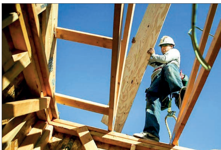
Wood is known to be the least carbon-intensive building material.

HOUSING people in homes made from wood instead of steel and concrete could save more than 100 billion tonnes of carbon emissions while preserving enough cropland to feed a booming population, research suggested Tuesday.