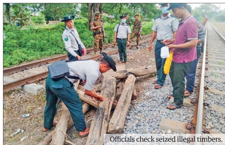
Officials check seized illegal timbers.

SUPERVISED by the Anti-Illegal Trade Steering Committee, effective action is being taken to prevent illegal trade under the law.