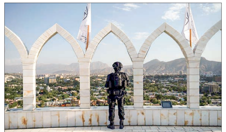
A Taliban fighter stands guard in Kabul on the eve of the first anniversary of the end of the war with US-led foreign forces. PHOTO: AFP

“The burden of the war in Afghanistan, however, went beyond Americans,” the US military said Tuesday. Two weeks before the end of last year’s withdrawal, the Taliban seized power following a lightning offensive against government forces.—AFP