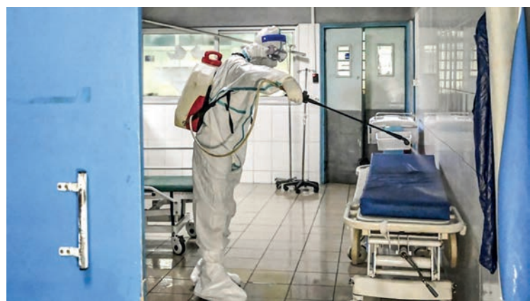
A cleaner wearing a personal protective equipment (PPE) suit disinfects a hospital bed.

HALF of the world’s healthcare facilities lack basic hygiene services, putting nearly four billion people at greater risk of infection, the United Nations said Tuesday.