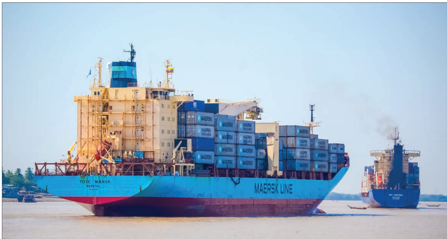
Overseas-going merchant vessels with loaded containers are pictured cruising along the Yangon River.

T HE Ministry of Commerce stated that the country pocketed over US$13 billion from international trading in four and a half months of the 2022-2023 financial year.