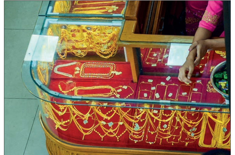
The pure gold price reached a fresh new peak of K3.5 million per tical (0.578 ounce or 0.016 kilogramme) in the markets, said gold traders.

The objectives of the committee are inspecting and pros-