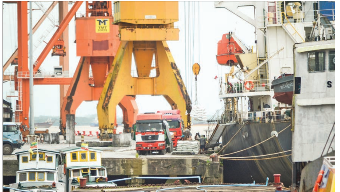
Export rice is loaded onto the overseas-going cargo vessel.

Myanmar earned $6.895 million from 18,610 tonnes of rice and broken rice exports. The