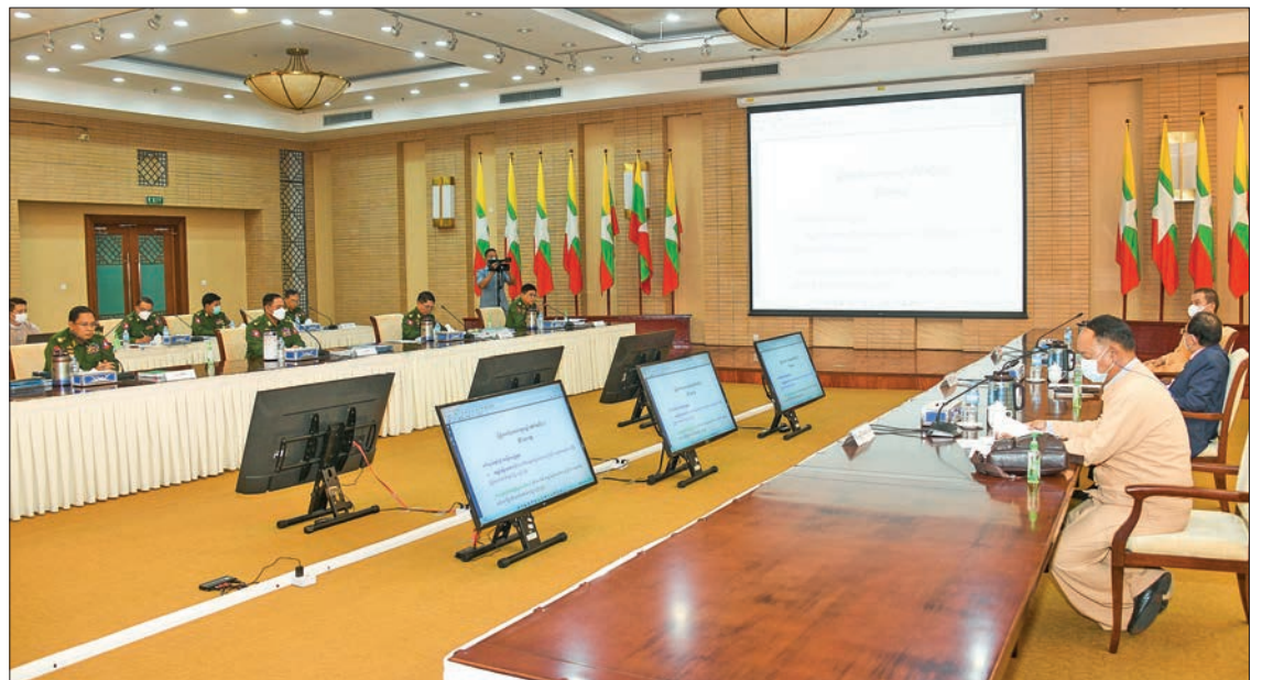
The second-day meeting between the State Peace Talks Team and the RCSS delegation is in progress yesterday.

The third-day meeting will be held at the National Solidarity and Peacemaking Centre on 1 September. — MNA