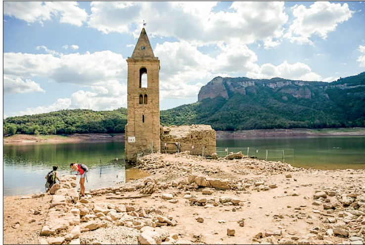
The receding waters have exposed the ruins of an 11th-century church in the usually submerged village of Sant Roma de Sau.

"It has been years since (water levels) are as low as they