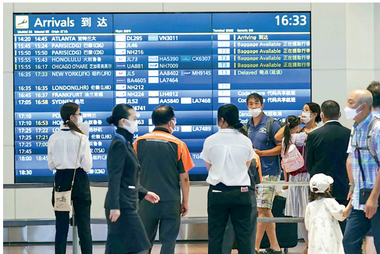
Photo shows an international arrival lobby at Haneda airport in Tokyo on 23 August 2022.

“To make the entry of people as smooth as other Group of Seven nations, we will further ease our border control measures by taking into account the infection situation at home and abroad, the needs (of travelers) and border measures taken by other nations,” Kishida said. He did not elaborate when such eas-