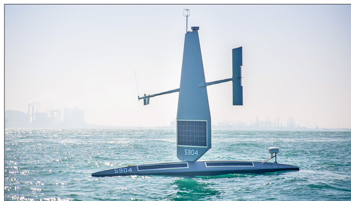
The US Central Command’s 5th Fleet said a support ship from Iran’s Islamic Revolutionary Guard Corps Navy, the Shahid Baziar, was spotted towing the seven-metre (23-foot) Sairdrone Explorer unmanned surface vessel (USV) late Monday. The US Navy’s Sairdrone Explorer unmanned surface vessel in the waters of the Arabian Gulf on 27 January 2022.

“IRGCN’s actions were flagrant, unwarranted and inconsistent with the behaviour of a professional maritime force,” said Vice-Admiral Brad Cooper, commander of US Naval Forces Central Command, in a statement.—AFP