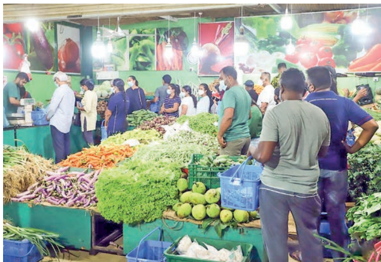
People buy vegetables from a market after the authorities relaxed the curfew for a few hours in Colombo, Sri Lanka, 12 May 2022. Sri Lanka imposed a nationwide curfew following violent clashes in the capital Colombo on 9 May.

SRI Lanka's president announced further tax hikes and sweeping reforms on Tuesday, saying that bailout talks with the International Monetary Fund