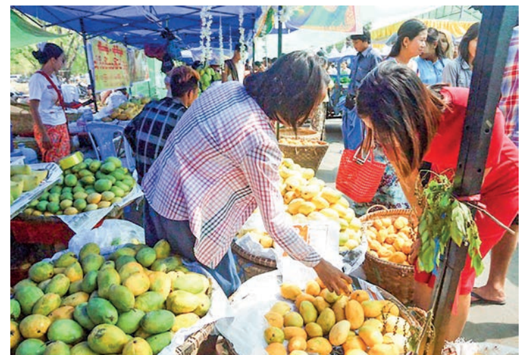
A shopper is pictured buying mangoes in the market.

Farmers said that there is little profit in the mango market this year over the situation of not being able to export to China and not buying it.