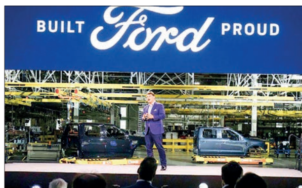
Ford is cutting spending on traditional vehicles as it switches its focus to electric cars. PHOTO: AFP/FILE

The restructuring involves 2,000 salaried positions and 1,000 contractors mostly in the United States, Canada and India but does not affect factory workers, a spokesman told AFP.—AFP