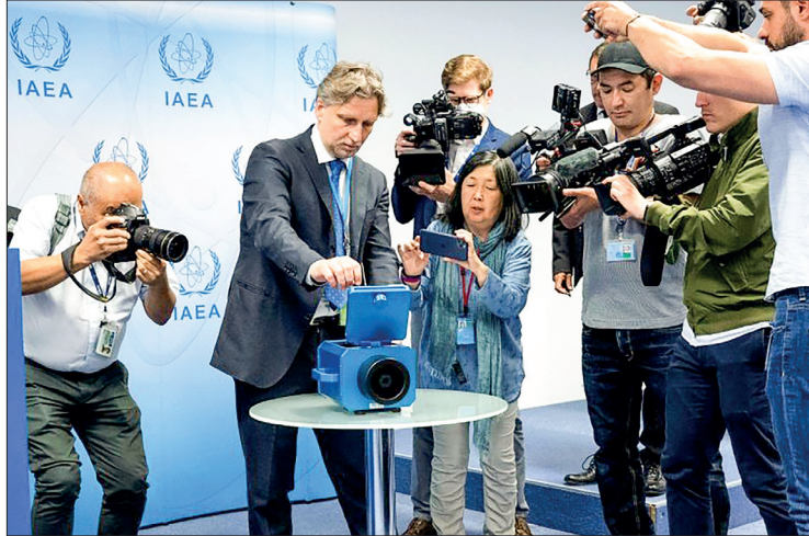
Media watch a demonstration of a monitoring camera used in Iran during a press conference of Rafael Grossi, director-general of the International Atomic Energy Agency (IAEA), in June 2022.

US officials said Iran dropped demands to block some UN nuclear inspections after also relaxing on insist-