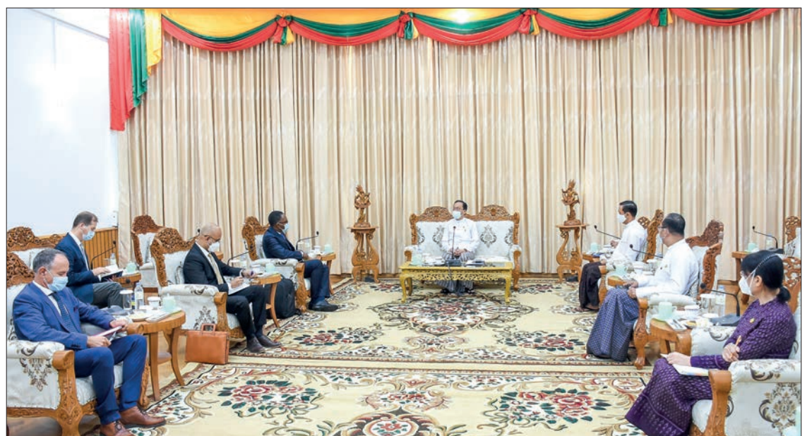
The GAVI-The Vaccine Alliance delegation calls on MoH Union Minister Dr Thet Khaing Win in Nay Pyi Taw yesterday.