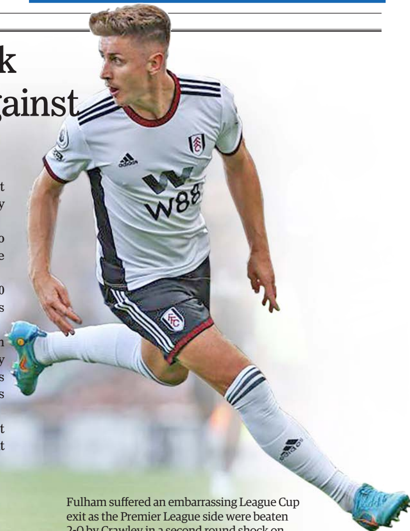
Fulham suffered an embarrassing League Cup exit as the Premier League side were beaten 2-0 by Crawley in a second round shock on Tuesday.

Silva handed debuts to Issa Diop, Marlon Fossey and 17-year-old academy graduate Luke Harris, while Shane Duffy and Kevin Mbabu made their first starts.—AFP