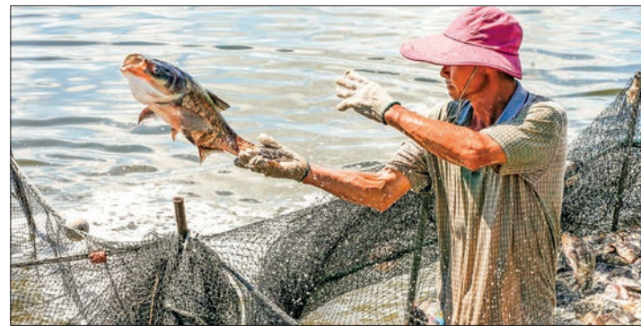
To reduce epidemic's impact on fishermen, the province decided to gradually allow fishing boats back to the sea in batches.

Wenchang, Haikou, Qionghai, Chengmai and Changjiang will be the first to restore their fishery production at sea as the pandemic situation in those areas has been effectively curbed, according to the provincial department of agriculture and rural affairs.—Xinhua