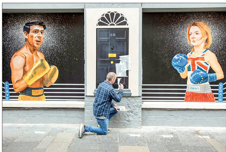
Rishi Sunak and Liz Truss are vying to succeed Boris Johnson as leader of the UK's ruling Conservative party.

WITH double-digit inflation and an economy teetering on the brink of recession, the cost-of-living crisis has dominated the race for Downing Street.