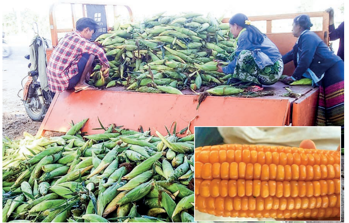
This year, China is also officially planning to import corn, and many companies are preparing to obtain export licences to China, so they hope to be able to export.

In 2022, corn farmers will have to double their agricultural inputs and spend an average of K800,000 per acre on purchase of inputs, so they need to make a profit without the price falling.—TPT/GNLM