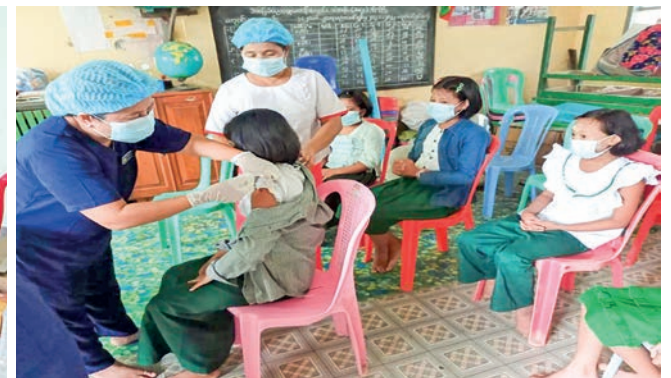
A student in Kyaukphyu Township, Rakhine State is seen receiving a vaccine for COVID-19 on 23 August.