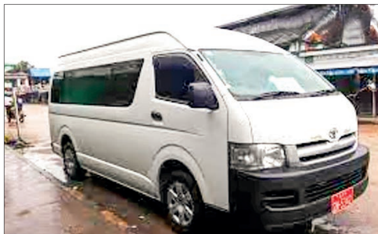
A highway van is pictured running for the Yangon-Mawgyun trip.

Nonetheless, transport costs of diesel-fuelled trucks and ferries are higher due to the price hike of diesel, highway truck operators and ferry commuters said. —TWA/GNLM