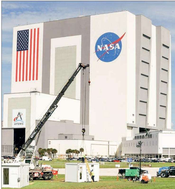
Temporary work spaces are set up near the Vehicle Assembly Building ahead of the Artemis 1 moon rocket launch at the Kennedy Space Centre in Florida.

The objective of the flight, baptized Artemis 1, is to test the