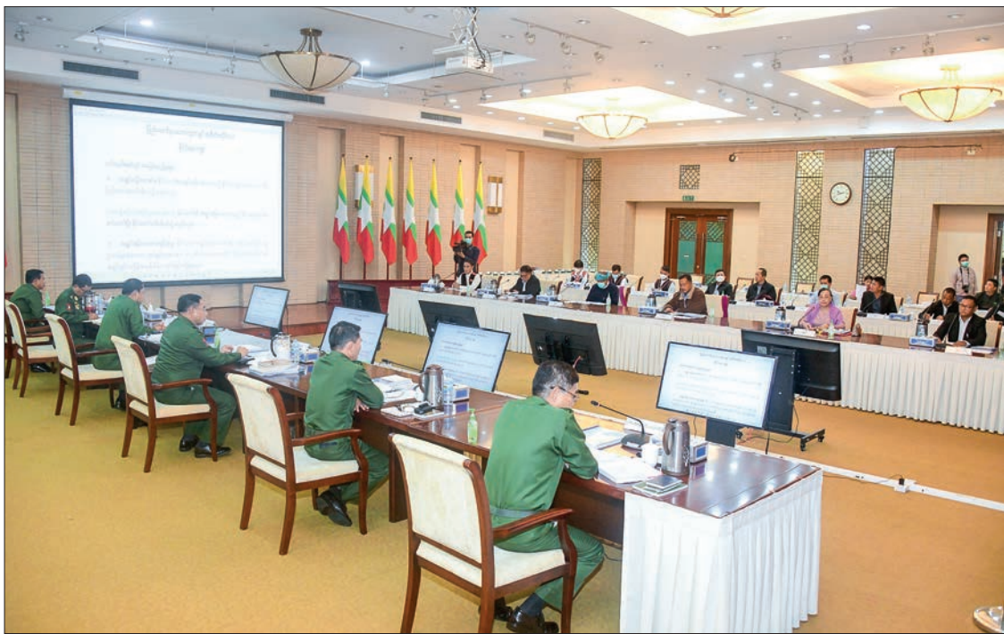
The second-day meeting between the State Peace Talks Team and the delegation of PNLO, LDU and ALP is in progress in Nay Pyi Taw yesterday.

THE second-day meeting between the State Peace Talks Team and the peace delegation of PNLO, LDU and ALP was held at the conference hall of the National Solidarity and Peacemaking Centre in Nay Pyi Taw on 24 August.