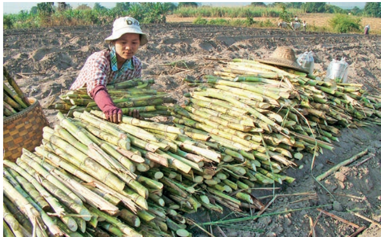
A female worker is seen collecting the harvested sugarcane.

THE price of sugarcane is quoted at K80,000 per tonne for the upcoming sugarcane season, U Win Htay, vice chair of Myanmar Sugar and Sugarcane Related Products Association told the Global New Light of Myanmar (GNLM).