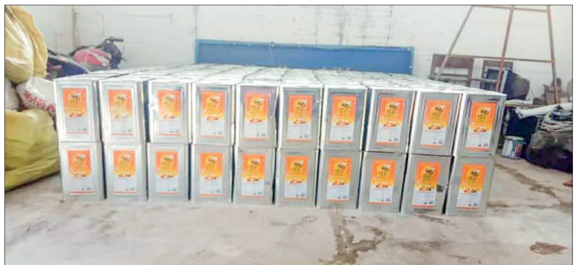
Confiscated illegal foodstuffs in Taninthayi Region.

team made inspections at the warehouse of Yangon International Airport and captured K11,035,250 worth of industrial material parts that had arrived 92 days before an approved licence and K10.5 million worth of an X-ray machine and related materials that had arrived 65 days before an approved licence. The action was taken under the Customs Procedures.