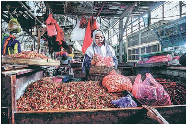
A chilli vendor waits for customers at a market in Surabaya, Indonesia, where inflation is rising.

Its two other main rates were also raised by 25 basis points. Rates were hiked for the first