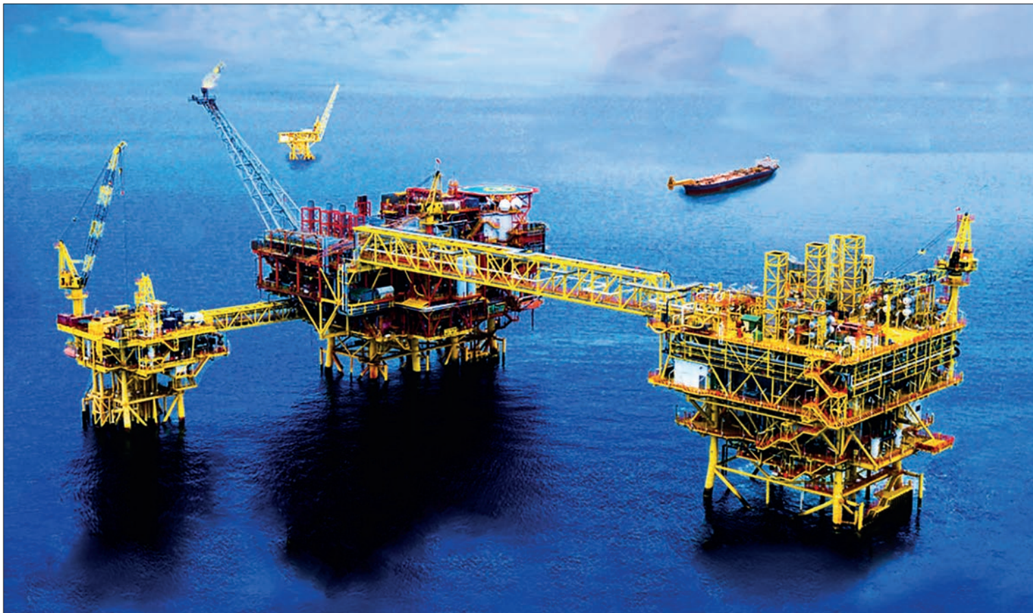
The photo shows the Yedagun natural gas production rigs.