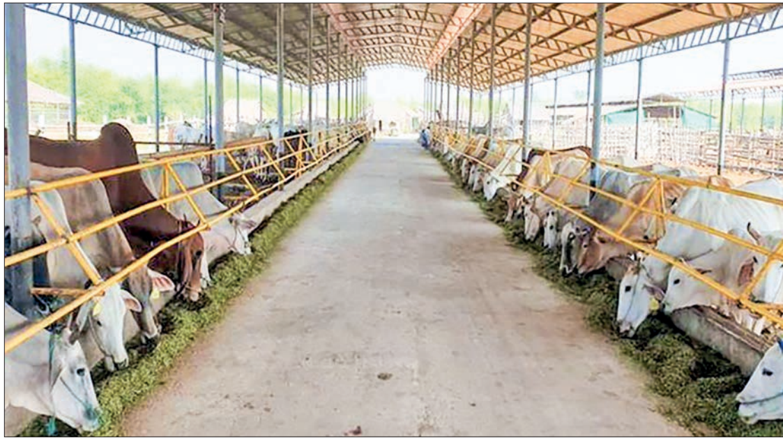
The Unit Plan project is underway for the expansion of cattle and buffalo farming in Yangon Region.

The department also grants a one-year loan to chicken/pig/