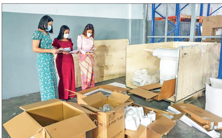
Seized items at Yangon International Airport.

They captured K15,119,000 worth of foodstuffs without official documents from a Mitsubishi Fuso 12-wheel truck (approximately K40 million) heading from Myawady to Yangon. The action was taken under the Customs Procedures. Therefore, 20 arrests (approximately K176,684,062) were made on 18, 21, 22, 23 and 24 August, according to the Anti-Illegal Trade Steering Committee. — MNA