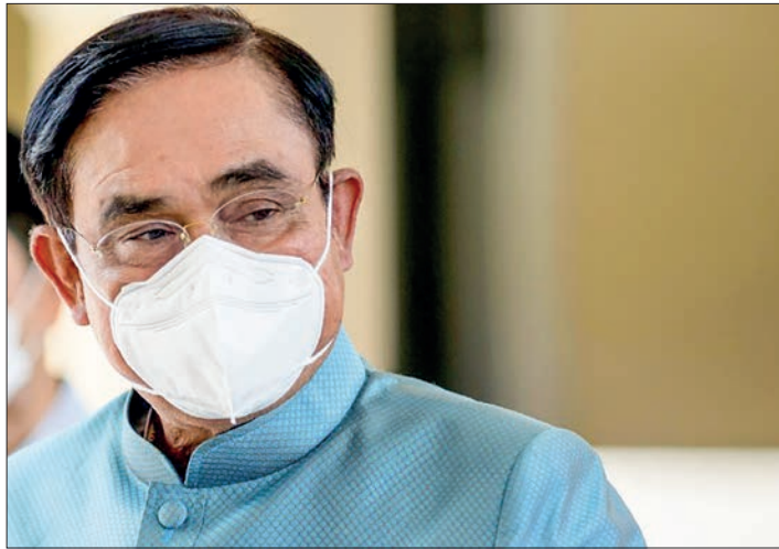
If the court agrees to hear the case, Prayut could be suspended and an acting prime minister appointed.

"Thus, a majority vote (five against four) for (Prayut) to be suspended as prime minister,