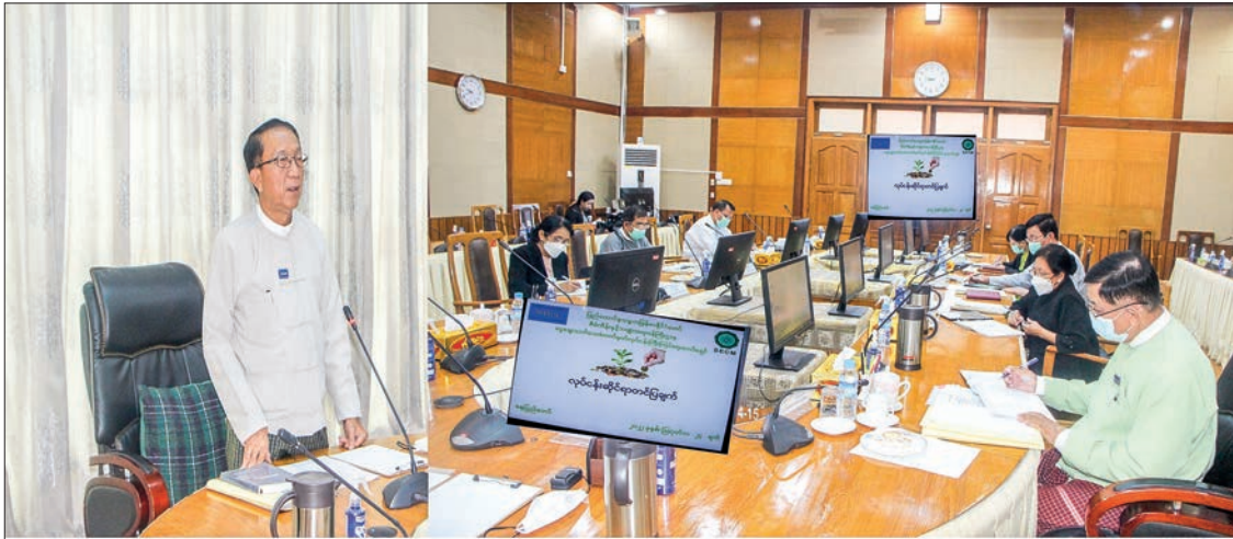
The seventh meeting of the Myanmar Securities and Exchange Commission is underway.

THE stock exchange accepts the public companies as listed companies to trade the shares and the business people should not rely only on bank loans and should establish more public companies in international standards, and the commission should keep eye on the opera-