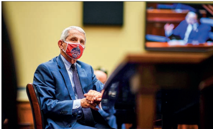
Anthony Fauci testifies during a House Subcommittee on the Coronavirus Crisis hearing.

The 81-year-old, who has served under seven presidents beginning with Ronald Reagan, said in a statement he would be leaving both his position as di-