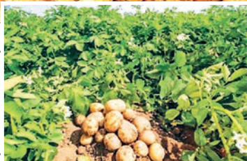
Potatoes are separated in lines by sizing at a farm.