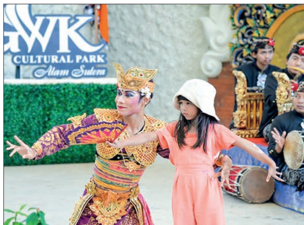
A dancer interacts with a girl during a traditional Balinese dance performance in a cultural park in Bali, Indonesia, 10 July, 2022.

The Indonesian government has recently expressed its optimism about an overall target of 3.6 million foreign visitors in the archipelago this year, although the country is still grappling with the FMD, which re-emerged