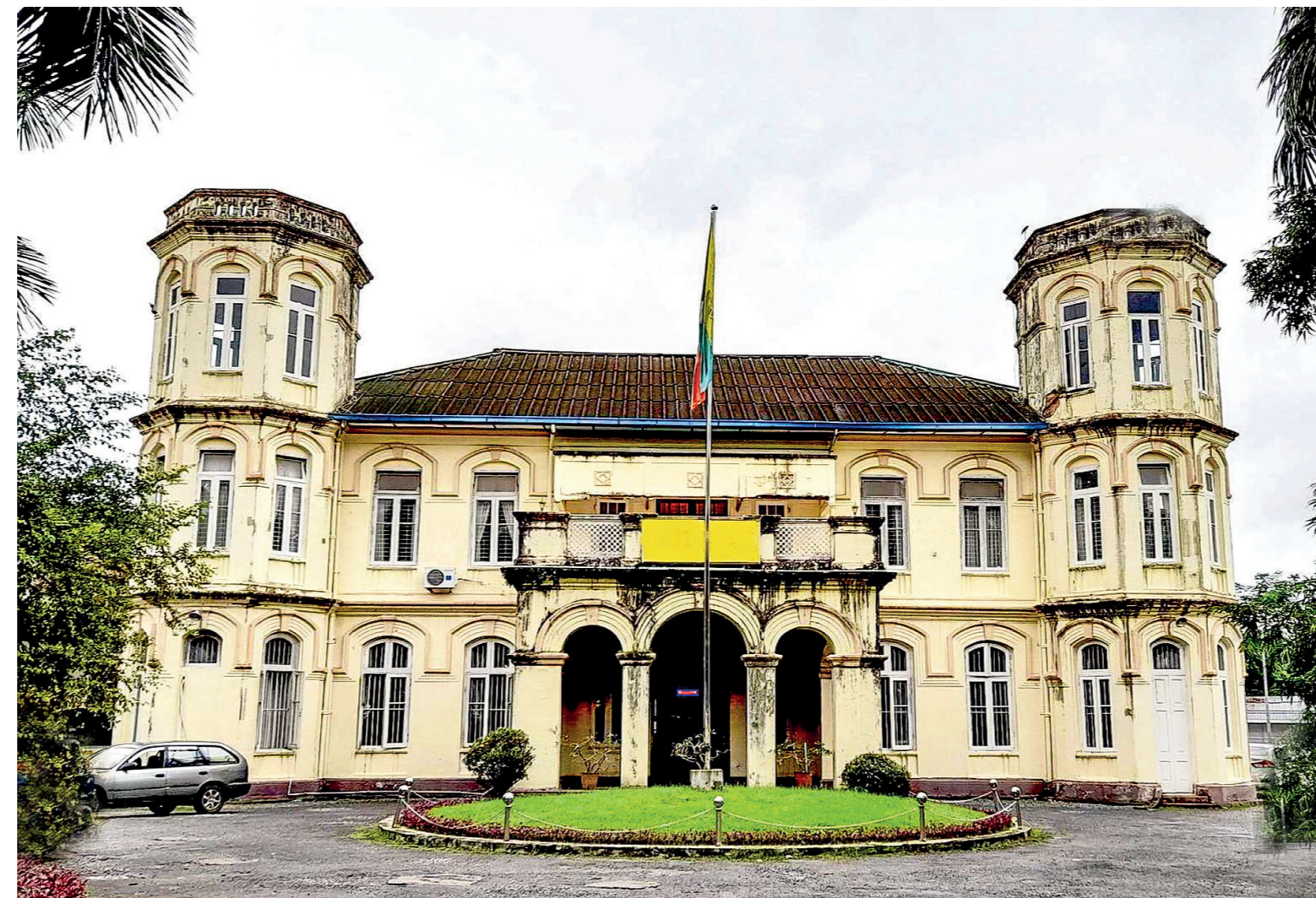
The “Sorrento Villa” came to be the venue of the Burma Translation Society as well as its printing and publishing facility in its early days of formation.

In 1957, Sarpay Beikman was host to a four-nation UNESCO Seminar on the production of