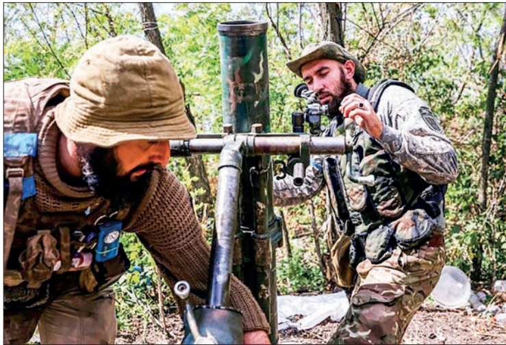
Ukrainian volunteer fighters prepare a mortar launcher at a position along the front line in the Donetsk region.

SIX months into war, Ukrainian President Volodymyr Zelensky vows that Ukraine will fight until it gains all its territory back.