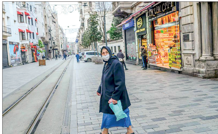
A Turkish woman walks from pharmacy on the Istiklal avenue, the main shopping street of Istanbul.

Elaborating on the COVID-19 cases in Türkiye, Koca