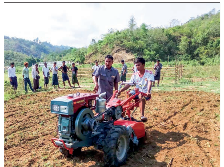
The walking tractor driving training course is in action in the Myaukchaung village of Buthidaung Township in Rakhine State.

It has permitted to allocate 75 machines to ideal villages in nine regions/states including Nay Pyi Taw under Union Budget and