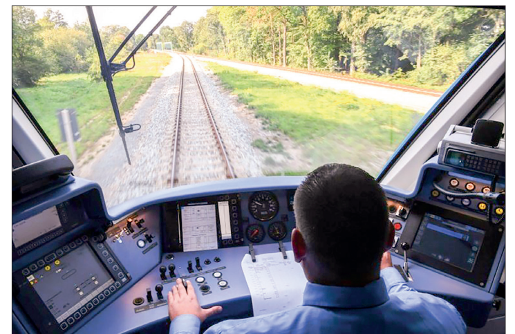
The trains will initially use hydrogen derived from fossil fuels, but the hope is hydrogen made using renewable energy will become available.

Designed in the southern French town of Tarbes and assembled in Salzgitter in central Germany, Alstom's trains — called Coradia iLint — are trailblazers in the sector.—AFP