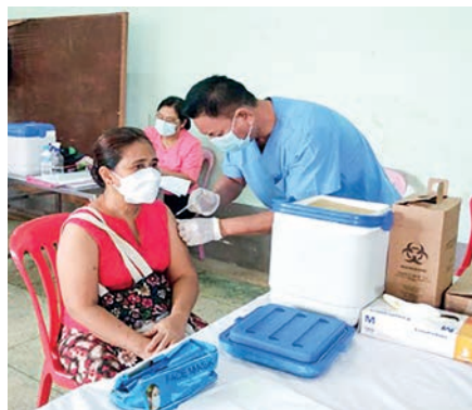
A local in Tamway Township, Yangon Region gets a COVID-19 vaccine shot on 24 August.

It is reported that officials from the respective Military Commands visited the site and coordinated the necessary work. — MNA