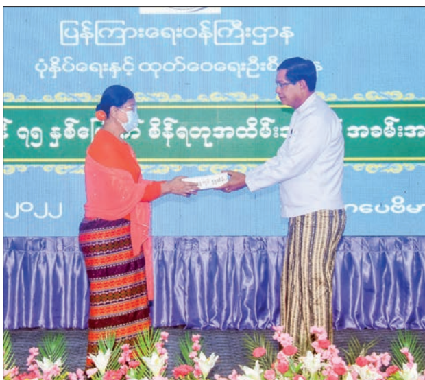
The Yangon Region chief minister presents K7.5 million donation to the literary fund.

people's lives by publishing school textbooks, People's Handbook Series, Myanmar Encyclopaedia, Thuta Padetha or Magazine of General Knowledge, Shwe Thway or Children Journal, translation and so on. — MNA