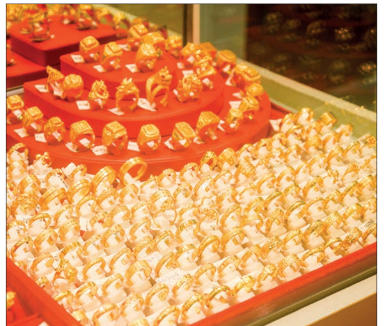
Gold jewellery is seen at one gold outlet in Yangon.

The objectives of the committee are inspecting and prosecuting market manipulation, checking if there is compliance with payment rules in the domestic market, proceedings against those unscrupulous traders who intend to interfere with the free and fair operation of the market under the existing laws, by-laws and regulations in line with the official directives, illegal foreign currency holding, illegal trade and taking legal actions against price manipulators. — NN/GNLM