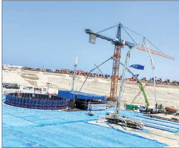
Under the deal worth three trillion won ($2.25 billion), a South Korean company will reportedly supply the equipment and a Russian firm will be in charge of constructing the reactors at Egypt's first nuclear power plant in the northern city of El Dabaa. The first concrete is poured for unit 1 of the El Dabaa plant.

President Yoon Suk Yeol, who took office in May, has pledged to export 10 atomic power reactors to other countries by 2030, as he reversed the nuclear phase-out policy set by the administration of his predecessor Moon Jae In. — Kyodo