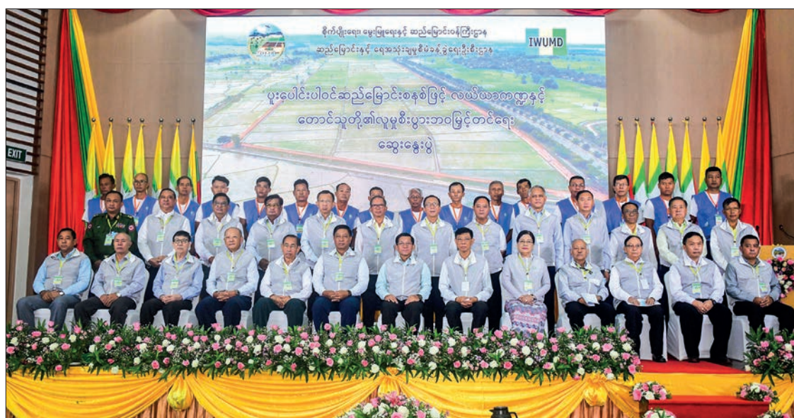
The Senior General takes the documentary group photo with attendees at the event.

They will participate in the roundtable discussions under the title of enhancement of agriculture sector and socioeconomic life of farmers by Participatory Irrigation Management, joined the leadership course and agricultural research lecture and courses on dam management and role of water user farmers, and crops and land utilization. — MNA