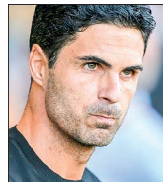
Arsenal manager Mikel Arteta.

MIKEL Arteta said on Friday Arsenal could sign a replacement for Nicolas Pepe after the Ivory Coast winger left the Premier League leaders to join Nice.