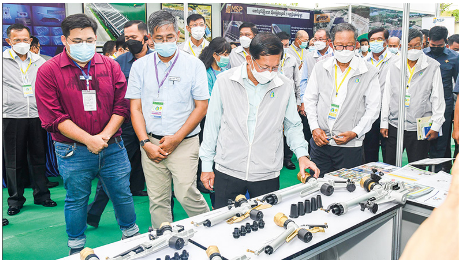
State Administration Council Chairman Prime Minister Senior General Min Aung Hlaing views round the booths at the inauguration event to discuss the enhancement of the agriculture sector and socioeconomic life of farmers by Participatory Irrigation Management in Nay Pyi Taw yesterday.

There are 25.517 million acres of rainfed and irrigated farmlands, some 15 million acres of monsoon paddy and some three million acres of monsoon paddy.