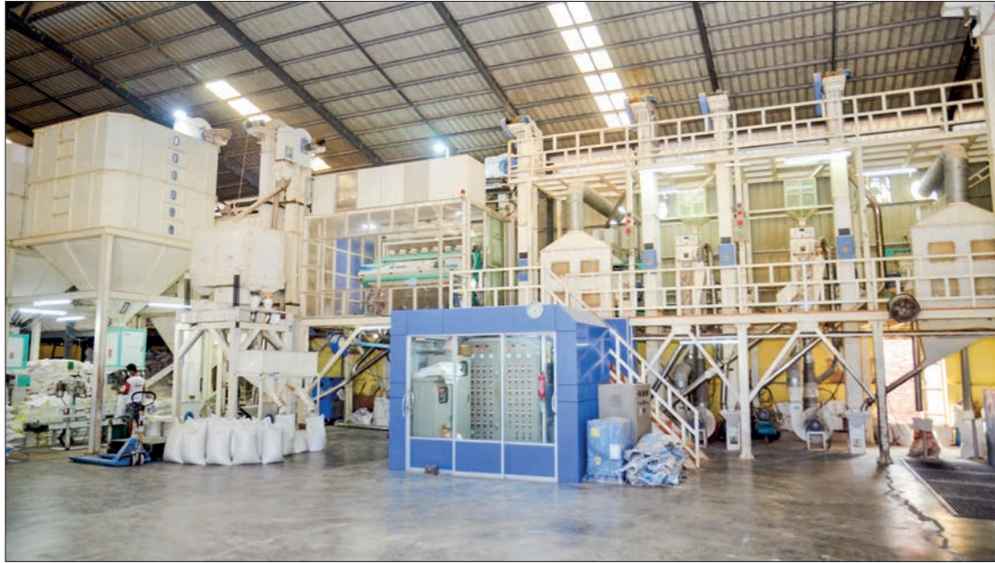
The prices of Ayeya Pawsan paddy soared to over K1.4 million per 100-basket (46 pounds), according to Ayeya Trade Centre. Rice bags are produced at one rice mill in the picture above.

Following higher paddy prices, rice prices have also gained