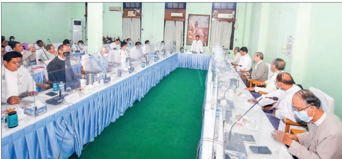
MoI Union Minister U Maung Maung Ohn addresses the meeting 2/2022 with the National Literary Award Selection Committee and the Sarpay Beikman Manuscript Award Selection Committee yesterday in Yangon.

UNION Minister for Information U Maung Maung Ohn met members of the National Literary Award Selection Committee and the Sarpay Beikman Manuscript Award Selection Committee at the meeting hall of the Printing and Publishing Department on the Theinbyu