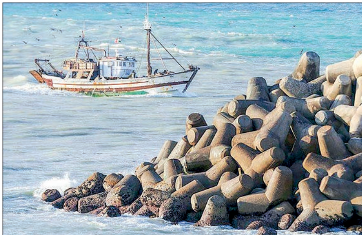
After the catch. A fishing boat sails off the coast of the Moroccan city of Larache.

Such costly research at sea is largely the prerogative of rich nations, but developing countries do not want to be left out of potential windfall profits drawn from marine resources that belong to no one.—AFP