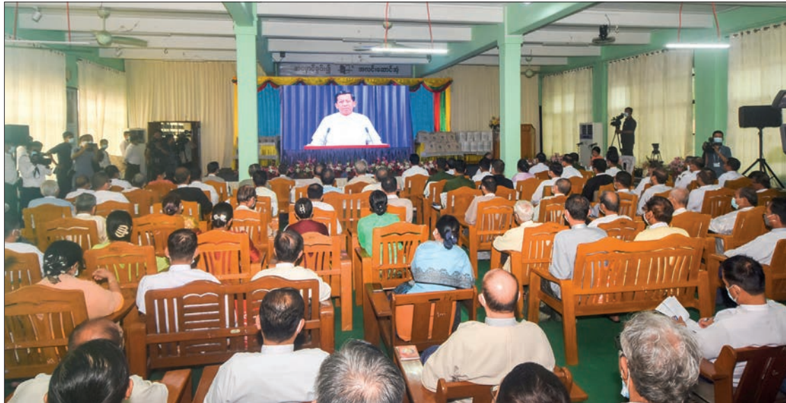
The event plays the video message sent by State Administration Council Chairman Prime Minister Senior General Min Aung Hlaing.