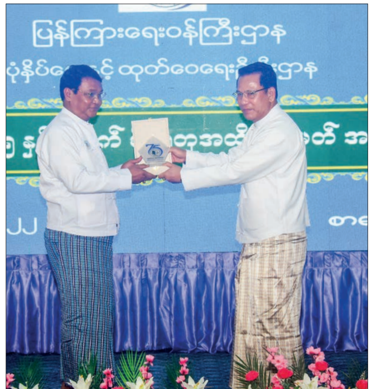
The MoI Union Minister gives the honorary gift.

Sarpay Beikman created its milestones in the history of literature by serving its duties as per the motto "Light, where darkness was". It supported