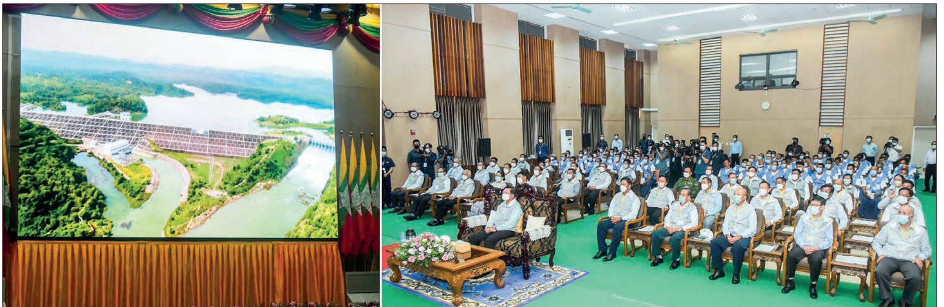
The Senior General watches the video clip on the enhancement of the socioeconomic life of farmers and the agriculture sector through Participatory Irrigation Management.