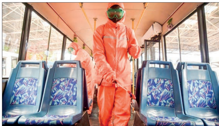
Experts and the World Health Organization have long questioned North Korea's Covid statistics and its claims to have brought the outbreak under control.

“All the fever cases... in Ryanggang Province were ones with influenza,” KCNA said, citing data from the state emergency epidemic prevention headquarters.