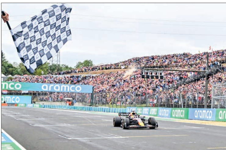
German car giant Audi are to enter Formula One for the first time in 2026 as an engine supplier saying it is the right fit as a global stage for their brand.