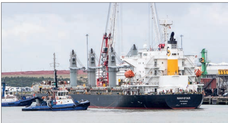
The Panama-flagged Navi Star carrying 33,000 tonnes of grain, arrives at the Foynes Port in County Limerick, on 20 August 2022 after leaving southern Ukraine’s main port of Odessa two weeks ago.

GRAIN prices have dropped sharply from the record highs they reached following Russia’s invasion of Ukraine, but another menace to global food security