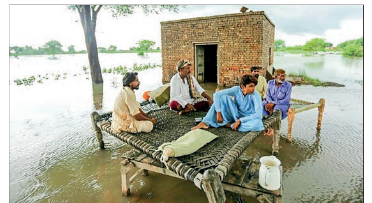
Rural residents sit on a traditional charpai bed in a flooded part of Rajanpur district.

HEAVY rain pounded parts of Pakistan Friday after the government declared an emergency to deal with monsoon flooding that it said had affected more than four million people.