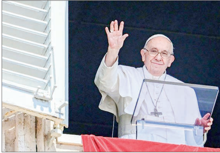
Pope Francis has asked Pyongyang to invite him to North Korea.

Moon, who is Catholic, said during a summit that Kim told him the pontiff would be "enthusiastically" welcomed.