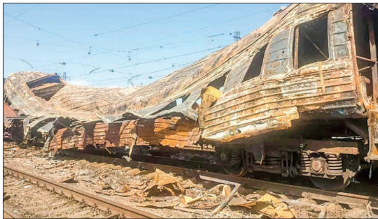
Ukraine’s state railway company said three of its employees were killed and four others injured.

It added that the train was “en route to combat zones” in the eastern Donbas region that