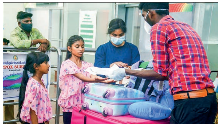
Passengers undergo monkeypox screening at the Chennai International Airport.