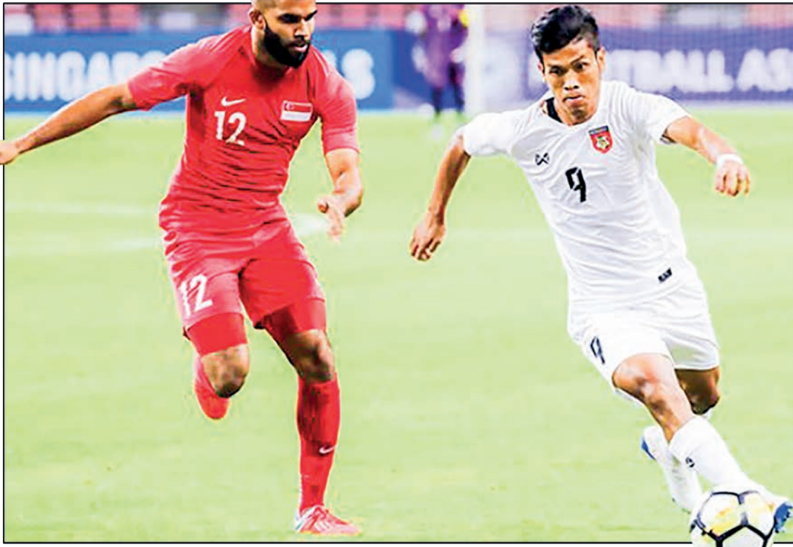
The file photo shows Myanmar star striker Aung Thu (No 9) carrying the ball during an international friendly match against Singapore on 11 June 2019.