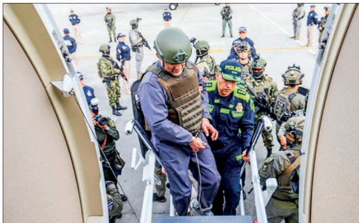
Colombian drug lord and head of the Gulf Clan, Dairo Antonio Usuga - also known as 'Otoniel' - boards a plane to the US on 5 May 2022.

drug trade, Colombia is still the world's largest cocaine producer and the United States is the biggest consumer of the drug.—AFP