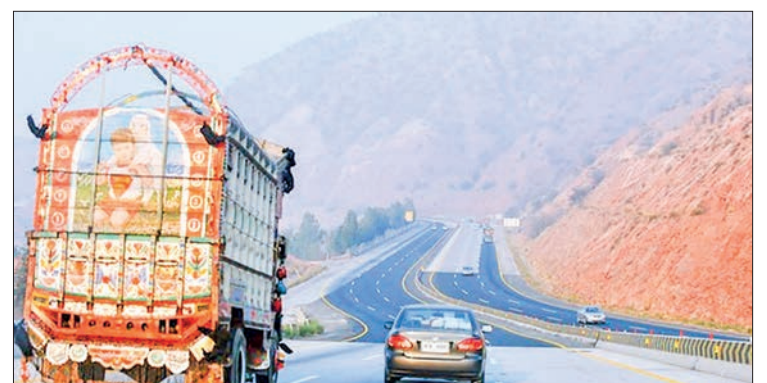
Pakistan has been scrambling for finance in recent months, and the International Monetary Fund (IMF) is due to meet next Monday to discuss reviving a suspended $6 billion loan programme.

brotherly and strategic relations between the two countries” and the need to bolster their economic partnership, an official Qatari statement said. “In this regard, the Qatar Investment Authority announced its intention to invest $3 billion in various commercial and investment sectors in the Islamic Republic of Pakistan,” it added.—AFP