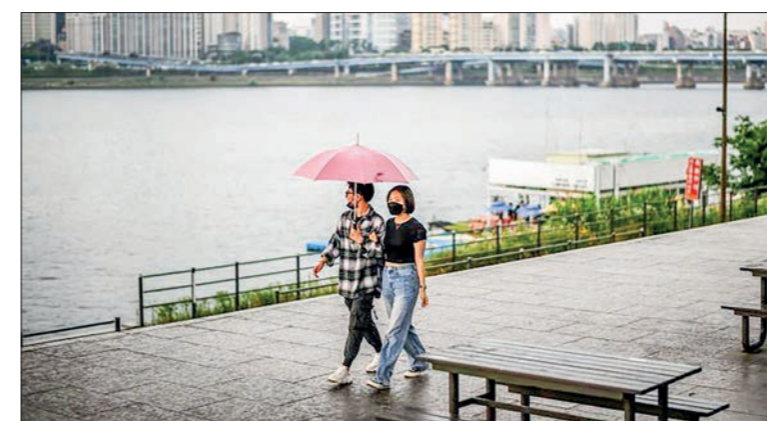
South Korea on 22 June 2022 confirmed its first case of monkeypox virus and pledged to strengthen monitoring and response systems. A couple share an umbrella as they walk along the Han River during a light rain shower in Seoul on 10 June 2022.

The countries with more than a thousand cases are the United States (15,877), Spain (6,284), Brazil (3,984), Germany (3,387), Britain (3,340), France (2,889),