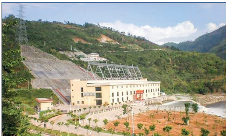
The Shweli Power Plant No 1 in Namhkam Township, Shan State.

MAINTENANCE work on the 230 kV Shweli-Mansan No 2 power line will be carried out on 27 August, according to the Yangon Electricity Supply Cooperation.