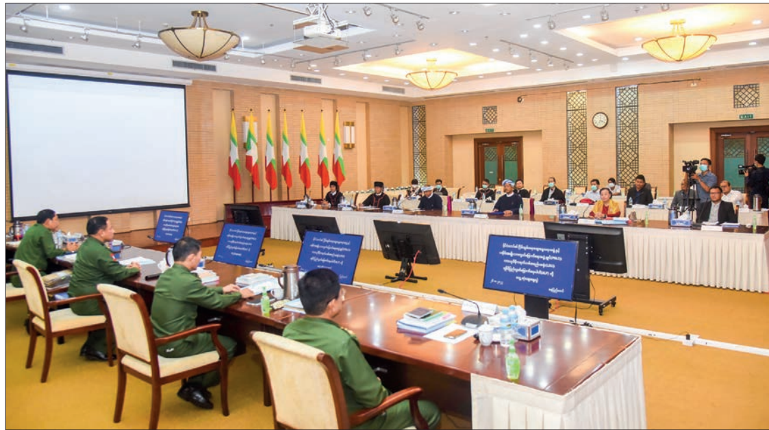
The National Peace Talks Team and the peace delegation of PNLO, LDU and ALP continue the fourth-day meeting yesterday.

was participated by SAC Member Union Minister at the Union Government Office National Solidarity and Peacemaking Negotiation Committee Chairman State Peace Talks Team Leader