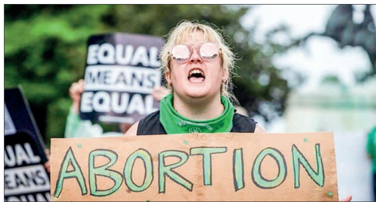
An abortion rights activist during a demonstration in front of the White House.

ABORTION became illegal in three more US states on Thursday, further restricting access to elective terminations for millions of women despite some signs of