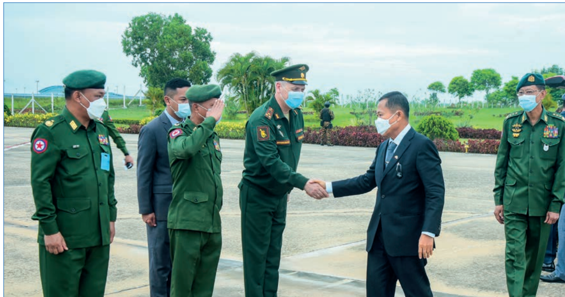
State Administration Council Vice-Chair Deputy Commander-in-Chief of Defence Services Commander-in-Chief (Army) Vice-Senior General Soe Win was seen off at the Airport on 25 August 2022.

The Vice-Senior General and party were seen off by Members of the State Administration Council General Mya Tun Oo, Lt-Gen Soe Htut, Secretary Lt-Gen Aung Lin Dwe, Joint Secretary Lt-Gen Ye Win Oo, Senior Officers of the Office of the Command-