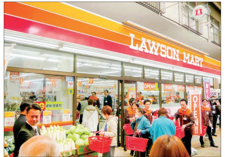
Customers shop at a newly opened Lawson Mart in Osaka last month.

The report said private consumption continues to pick up moderately, reflecting recovery in use of transportation during the summer holidays and the holding of major summer festivals for the first time in three years,