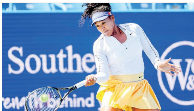
Naomi Osaka will attempt to defend her title at the Pan Pacific Open in Tokyo next month.

Osaka, a four-time major winner and former world number one, has slipped to 44 in the rank-