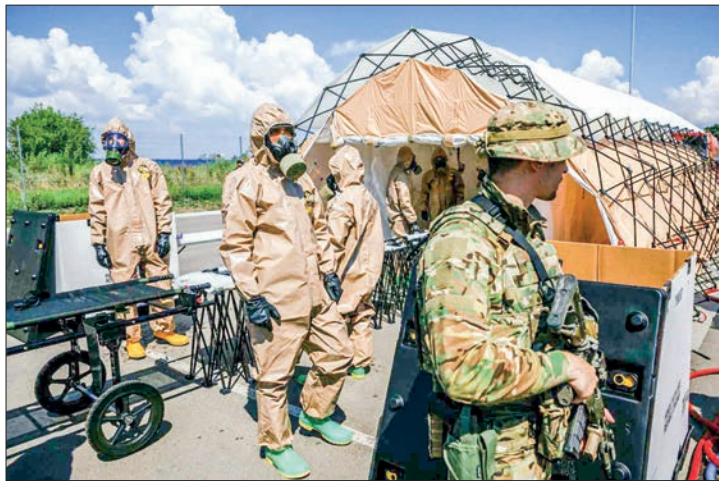
Ukrainian Emergency Ministry rescuers attend an exercise in the city of Zaporizhzhia on 17 August 2022, in case of a possible nuclear incident at the Zaporizhzhia nuclear power plant located nearby.

STAFF at Ukraine's Zaporizhzhia nuclear plant occupied by Russian soldiers were on Friday working to reconnect its reactors to the national power grid, the state energy operator said.