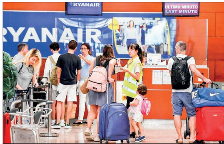
Passengers wait in Barcelona’s El Prat airport during the first wave of Ryanair strike action in July.

But Portway said in a statement the strike was “irresponsible” because it was taking place at an “intense time for aviation and tourism”, one of the main drivers of the Portuguese economy. In Spain, Iberia Express, the low-cost arm of the country’s national carrier, said it was cancelling 24 domestic flights from Sunday when its cabin crew starts a 10-day strike seeking higher pay.—AFP