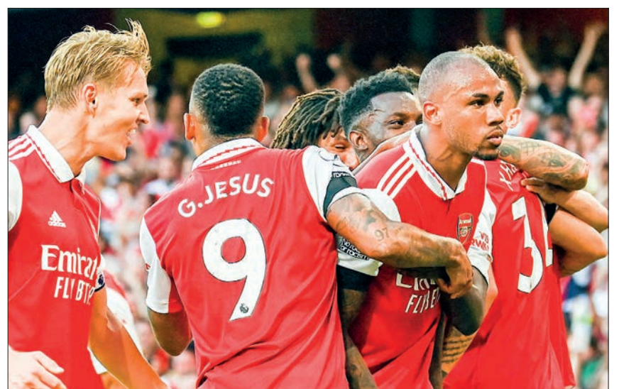
Arsenal's Brazilian defender Gabriel Magalhaes (R) celebrates scoring a late goal during the English Premier League football match between Arsenal and Fulham at the Emirates Stadium in London on 27 August 2022.

Former Arsenal goalkeeper Bernd Leno faced his old club on just his second start for Fulham, and the Germany international spread himself well to deny Bukayo Saka in the first half. —AFP