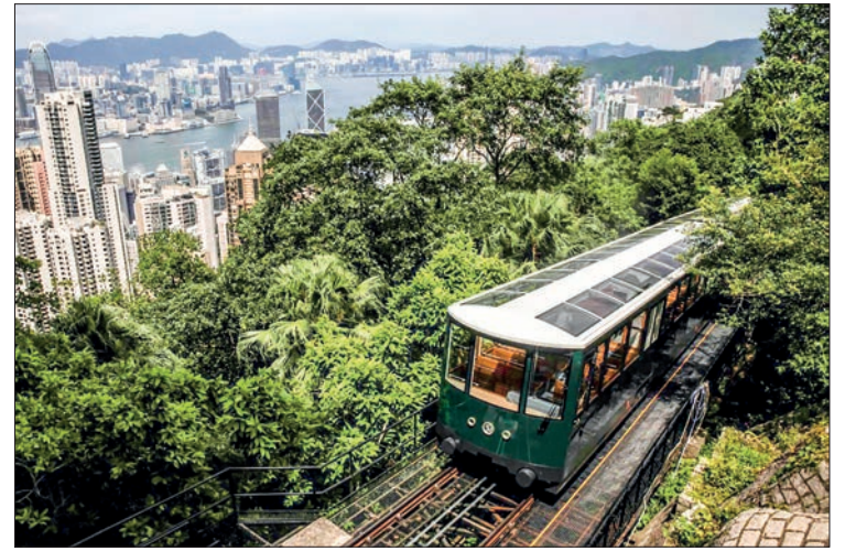
The Peak Tram reopened Saturday after a year-long $102 million facelift even as the city's coronavirus curbs continue to keep overseas visitors at bay. PHOTO:AFP

"We have to consider the increase in our operating costs and the long-term sustainability of our business." On Saturday morning, a woman surnamed Kwok and her young daughter were among a crowd of around a hundred waiting in line to try out the refurbished tram.—AFP