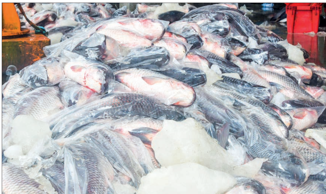
Rohita fish are seen being prepared to export them to Bangladesh.

"A truck carries 17 tonnes of marketable rohita fish from Twantay, Maubin, Sarmalauk of Ayeyawady Region and other areas to export to Bangladesh via Sittway, Buthidaung and Maungtaw trade camps daily. We export a fish weighing one viss and 30 ticals and three visses. Now, we find some difficulties. We used vessels for fish trucks in Maungtaw to shorten the duration in the past. Now, we have to go via Buthidaung. It takes us two or