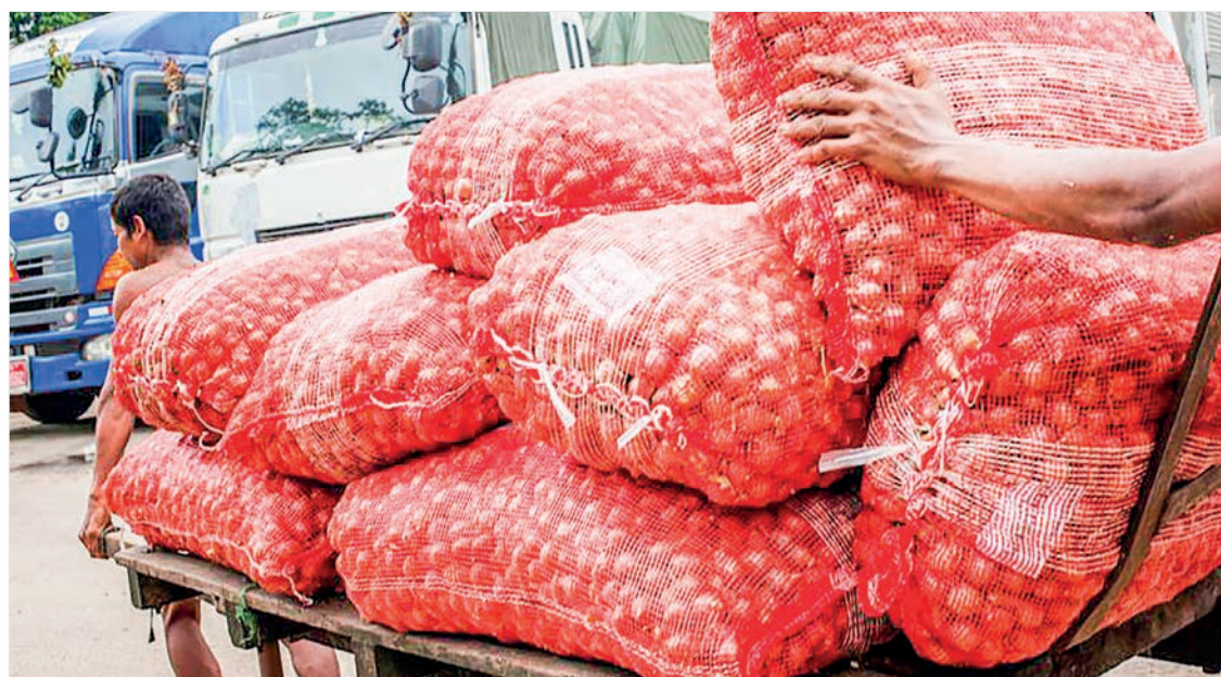
Onion bags are seen being carried at the Bayintnaung wholesale centre.