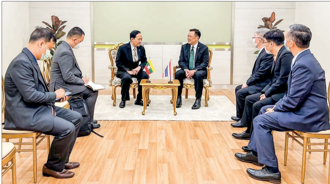
The MoH Union Minister meets the Thai Deputy Prime Minister and Minister of Public Health yesterday.

At the ceremony, Thailand Deputy Prime Minister and Minister of Public Health Mr Anutin Charnvirakul gave the opening speech. Along with