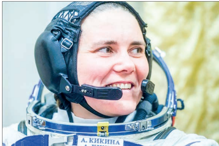
Russia's only active female cosmonaut, Anna Kikina, 37, will be only the fifth professional woman cosmonaut from Russia or the Soviet Union to fly to space.

for the flight. I will leave for America on 8 September for the final training session, pre-flight activities and procedures," Kikina told a press conference