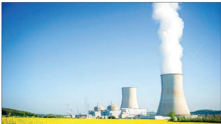
The shutdown of several nuclear reactors due to corrosion issues has contributed to the French electricity price increase.

EUROPEAN electricity prices soared to new records on Friday, presaging a bitter winter as