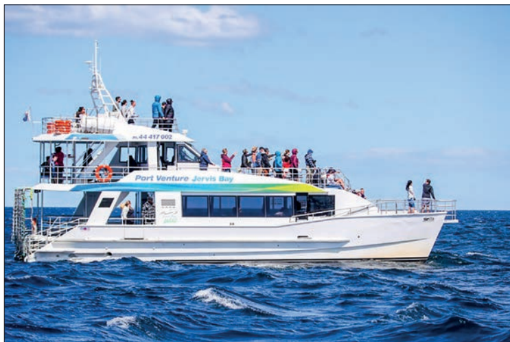
Tourists take a cruise boat for whale watching in Jervis Bay, south of Sydney, Australia, 23 September 2020.

AUSTRALIAN tourism operators have revealed the international market still need time to rebound about half a year after