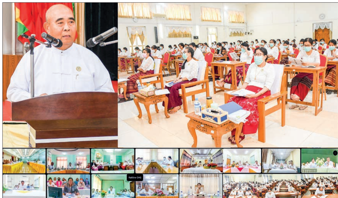
The Knowledge Sharing Programme on “Compliance Audit” is in progress both online and offline on 25 August.

THE Knowledge Sharing Programme No 20 on “Compliance Audit” was held at 2 pm on 25 August at the Assembly Hall of the Office of the Auditor-General of the Union, Nay Pyi Taw.