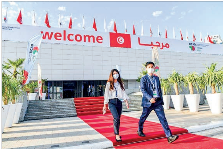
Attendees walk outside the Congress Palace, hosting the eighth Tokyo International Conference on African Development (TICAD8).

Some 30 heads of state and government are attending the event in the capital Tunis, at a time when the import-de-