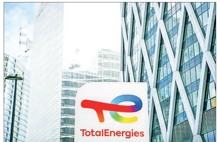
While most global energy giants have quit operating in Russia since its invasion of Ukraine, TotalEnergies has kept its lucrative natural gas operations in the country, though it has vowed to wind down purchases of Russian oil.

The other 51 per cent is held by Russian company Novatek, in which the French firm