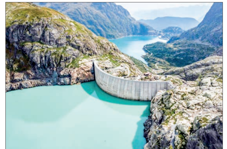
Switzerland's launch next month of a powerful pumped-storage hydroelectric plant is unlikely to help avoid problems this winter.

It usually depends on imports from the surrounding European Union, and especially of gas-derived electricity from Germany, but with the bloc wary about its own power supply, non-member Switzerland finds itself at the back of the queue. Compounding the problem, neighbouring France has been forced to halt production at half of its reactors, mainly due to corrosion problems, Stephane Genoud, an energy management professor at the Swiss HES-SO university, told AFP.—AFP