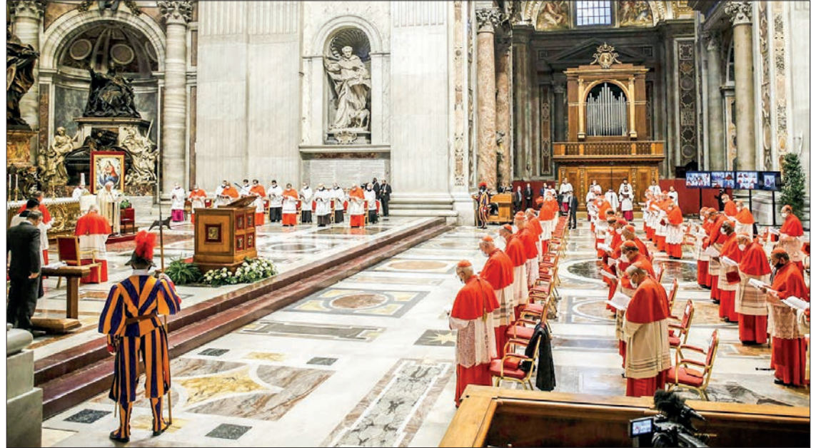
A general view shows cardinals as Pope Francis speaks during a consistory to create 13 new cardinals, on 28 November 2020 at St. Peter's Basilica in The Vatican.

He also suffers from sciatica, a chronic nerve condition that causes pain in his hip.—AFP