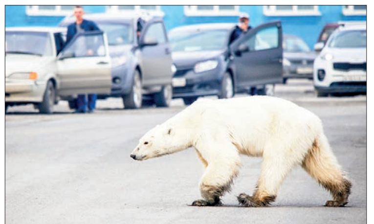
An exhausted-looking she-bear has been spotted wandering through the industrial zone of the Arctic city of Norilsk.

Blinken, at an Arctic Council meeting last year in Iceland, said that nations in the region had a "responsibility" to ensure "peaceful cooperation". —AFP