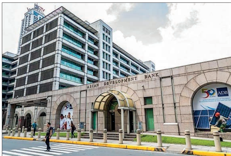
The ADB, whose head office is seen here in Manila, said some risks had become more acute over the past two years, such as job uncertainty, mental health deterioration, extreme weather, cybersecurity failures and infectious diseases.

The report said the pandemic interrupted a long trend of poverty reduction in Asia and the Pa-