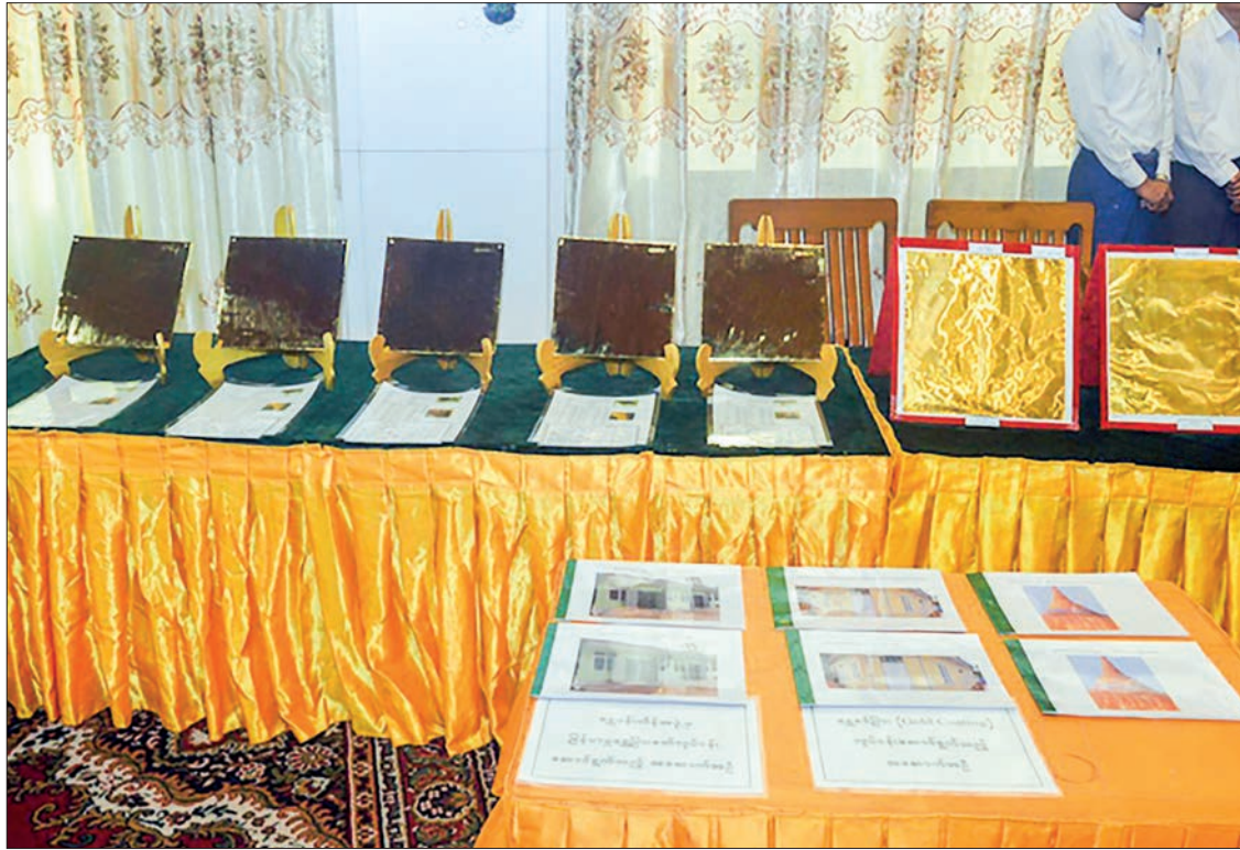
Gold plates were pictured being offered to the Shwedagon Pagoda in 2019.

It is planned to buy 10,000 two-inch industrial gold plates and 5,000 traditional hand-craft gold plates totalling 15,000 through a tender system for the Shwedagon Pagoda. — TWA/GNLM