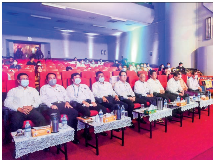
MoI Union Minister U Maung Maung Ohn views the singing demonstration and preparation for the music festival in Studio-A yesterday.

The Union minister said the ministry is making efforts to entertain the people by holding the singing competition (Season-2) and it is time for the artists to serve the people with their art skills. Season 1 jointly conducted by the minis-