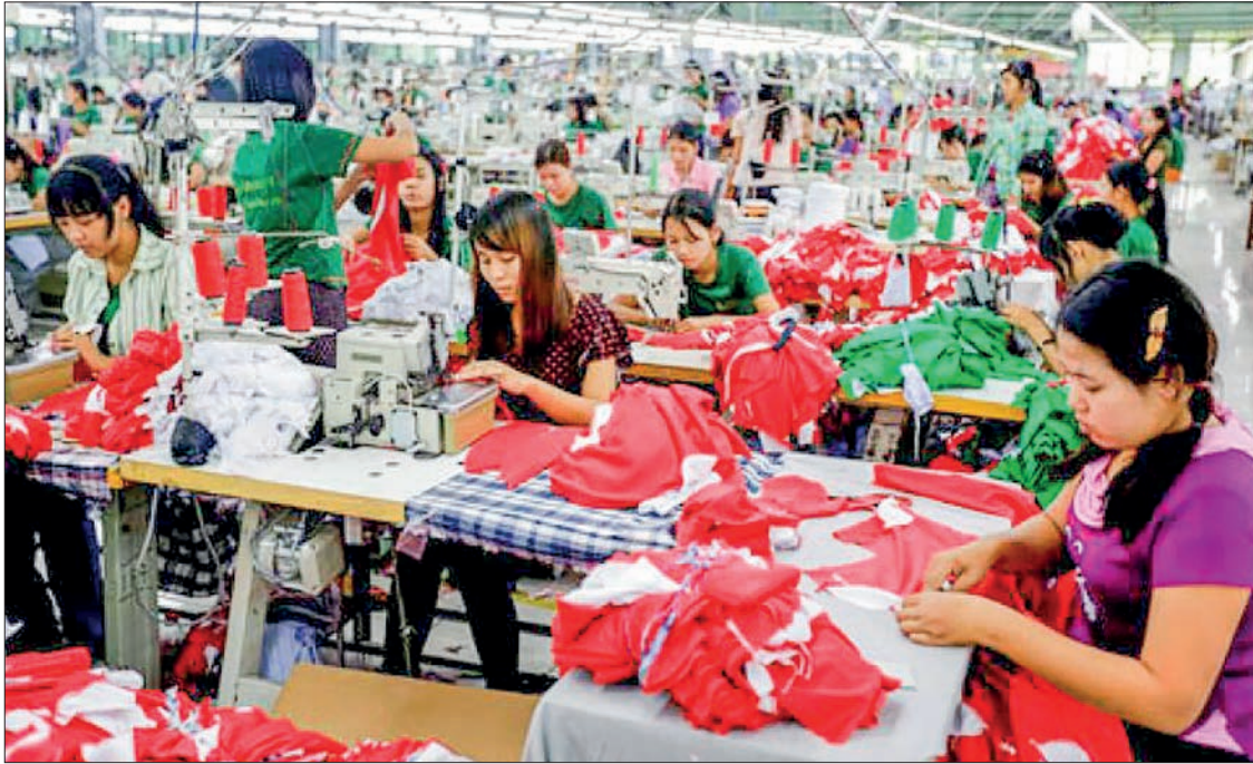
A garment factory running on a Cutting, Making, and Packing (CMP) basis is seen in Yangon Region.

THE Yangon Region Investment Committee (YRIC) endorsed four foreign enterprises in the manufacturing sector at the meeting held on 25 August, with an estimated capital of US$5.143 million. Those enterprises will create 2,369 jobs for residents.