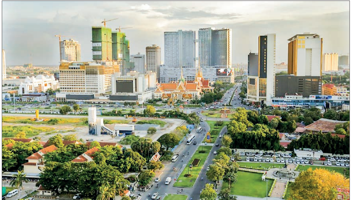
Photo taken on 8 November 2018 shows a view of central Phnom Penh, Cambodia.

“The government bonds are expected to be popular for trading on the Cambodia Securities Exchange (CSX) and will provide benchmark data for corporate securities trading and financial analysis as implemented in countries with an advanced securities sector,” he said.—Xinhua