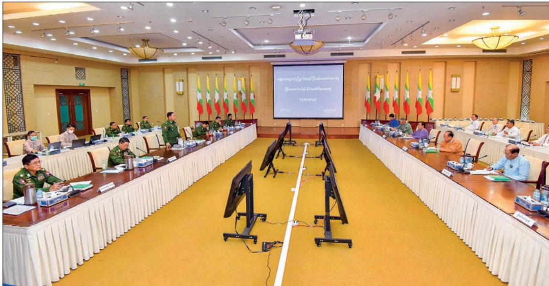
The meeting between the National Solidarity and Peacemaking Negotiation Committee and the working group of political parties is in progress.

SAC Member Union Minister at the Union Government Office National Solidarity and Peacemaking Negotiation Committee Chairman Lt-Gen Yar Pyae and committee members, leader of the working group of political parties Shan Nationalities Democratic Party (SNDP) Chairman U Sai Aik Pao and representatives of the working group attended the meeting.