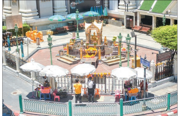
Vendors sell flowers in front of Erawan Shrine in Bangkok, Thailand, 12 July 2021. In an effort to curtail the spread of the virus, the Thai government on 9 July announced new curbs in hard-hit regions, including Bangkok and five nearby provinces.

After creating this spike protein, cells can recognize and fight the real virus, hailed as a major advancement in development of vaccines.—Xinhua