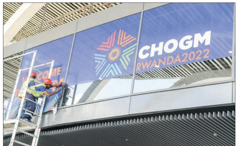
Workers are seen applying signage at the Kigali Convention Centre on 21 June 2022, the venue hosting the Commonwealth Heads of Government Meeting (CHOGM) till 26 June.

Mpunga said that Rwanda is working closely with partners to monitor the evolving situation of the monkeypox outbreak in different parts of the world.—Xinhua