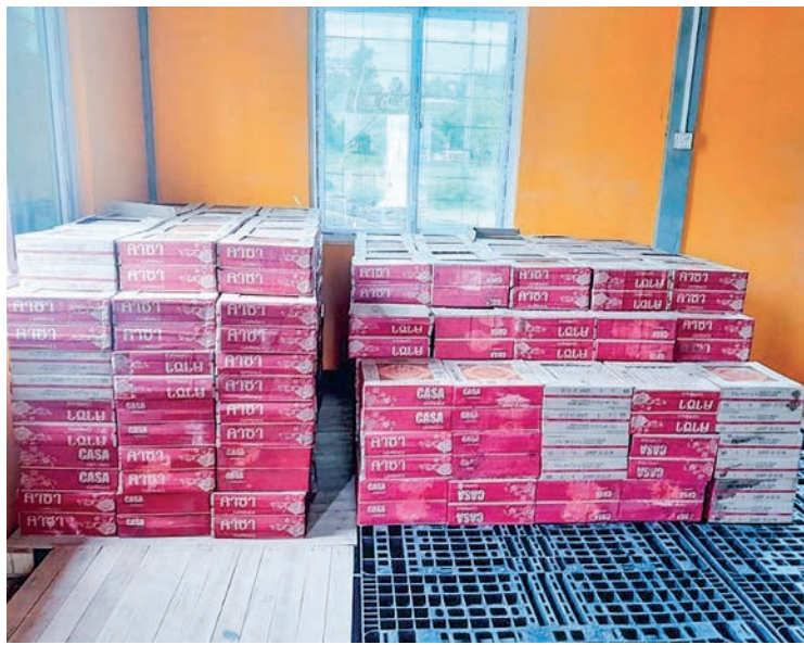
Seized commodities in Kayin State.

parts and raw teak temple worth K111,540. The action was taken under the Forest Law.