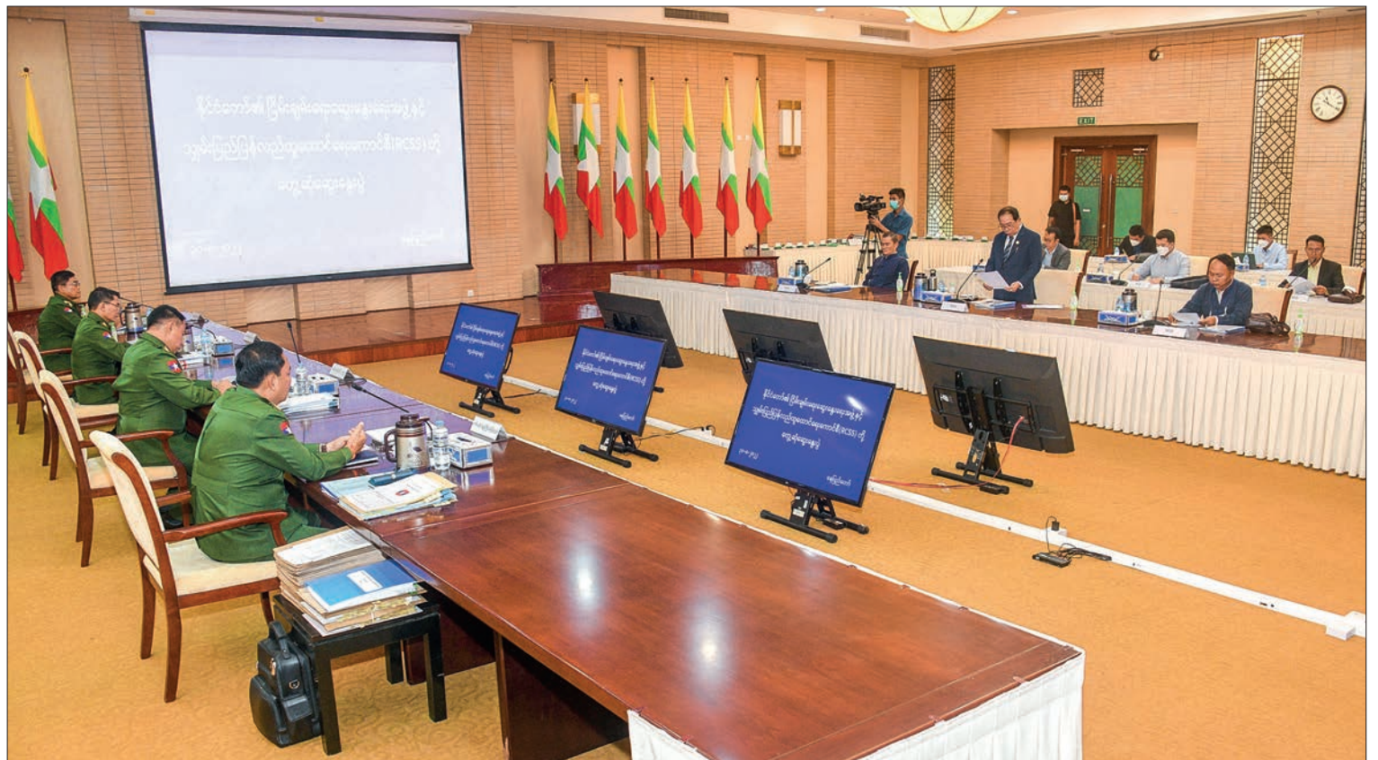
The meeting between the State Peace Talks Team and the peace delegation of the Restoration Council of Shan State-RCSS is in progress in Nay Pyi Taw on 30 August 2022.

ber Lt-Gen Win Bo Shein presented the list of Union legislation – Table 1 and the list of regional or state legislation – Ta-