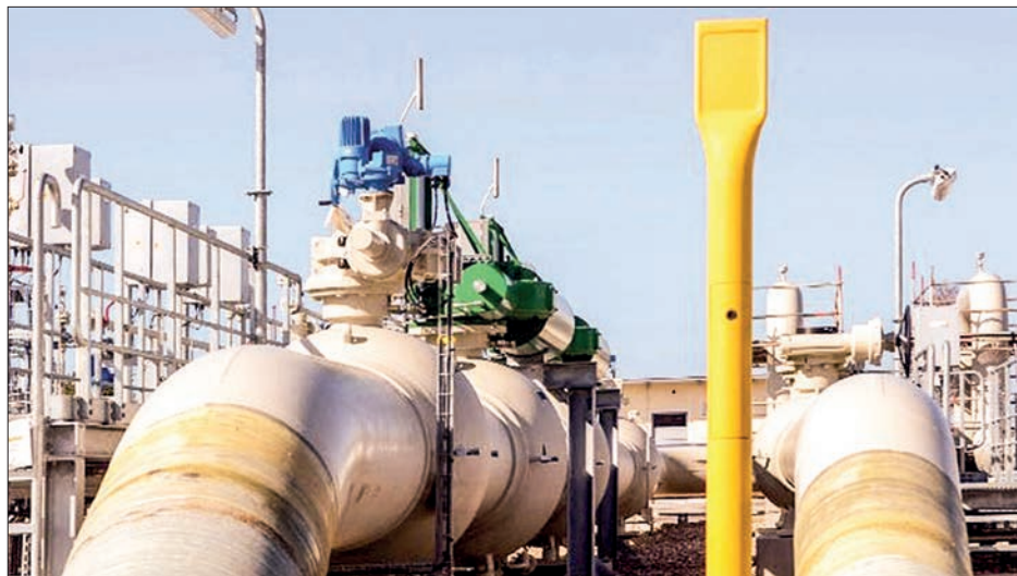
Many European countries are facing severe supply problems as Moscow turns off the gas taps in response to EU military and diplomatic backing for Ukraine.

Warnings from the French government have