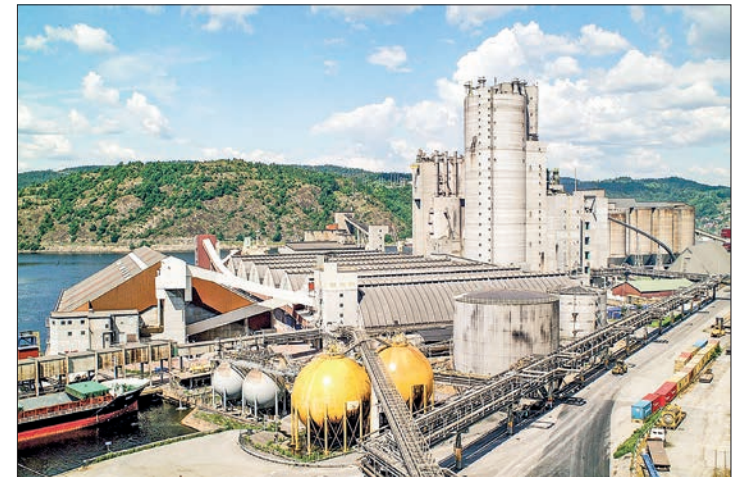
Northern Lights has agreed a deal to transport and store carbon dioxide captured from Yara Sluiskil, an ammonia and fertilizer plant in the Netherlands. Yara switched to green hydrogen at this ammonia plant in Porsgrunn, Norway.

Northern Lights managing director Borre Jacobsen said the agreement "will establish a market for CO2 transport and storage". —AFP