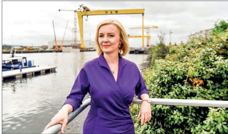
In this file photo taken on 17 August 2022, contender to become the country's next Prime Minister and leader of the Conservative party British Foreign Secretary Liz Truss poses for a photograph with the Harland and Wolff shipyard cranes at a Conservative Party leadership campaign event at Artemis Technologies in Belfast Harbour, Belfast.

It followed months of scandals that eventually triggered Sunak and dozens of other ministers to resign from government,