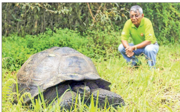
Giant tortoises can reach some 225 kilogrammes and are among the famous creatures of the Galapagos Islands.

A unit that specializes in environmental crimes is collecting testimonies from national park agents and appointing experts to carry out autopsies on