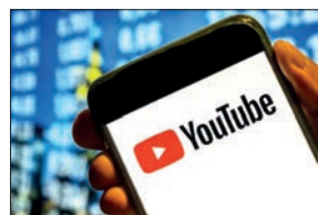
Photo illustration shows the Youtube logo on a smartphone screen.

Increased usage of the website due to the coronavirus pandemic has helped boost the economic impact