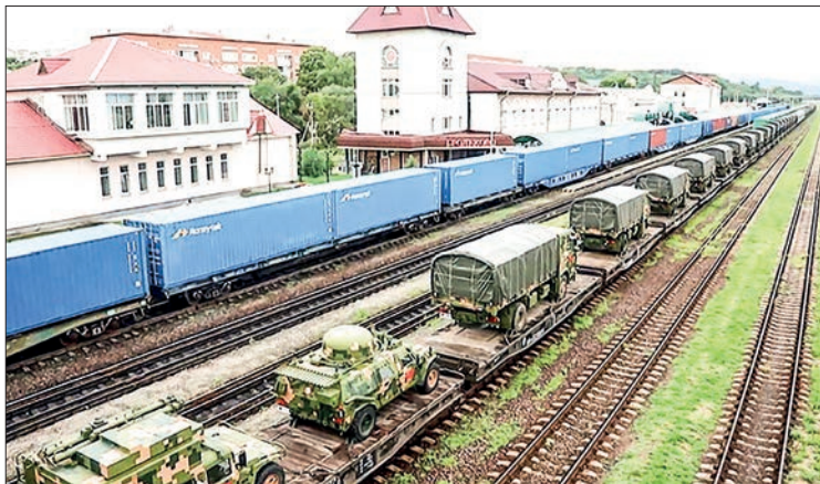
Military hardware arrives for 'Vostok-2022' exercises at the Sergeevsky training ground at Primorskiy Krai of the Russian Far East.

China's defence ministry confirmed earlier this month it would be taking part but did not say how many troops it is sending. Beijing insisted its participation in the joint exercises was "unrelated to the current international and regional situation". —AFP