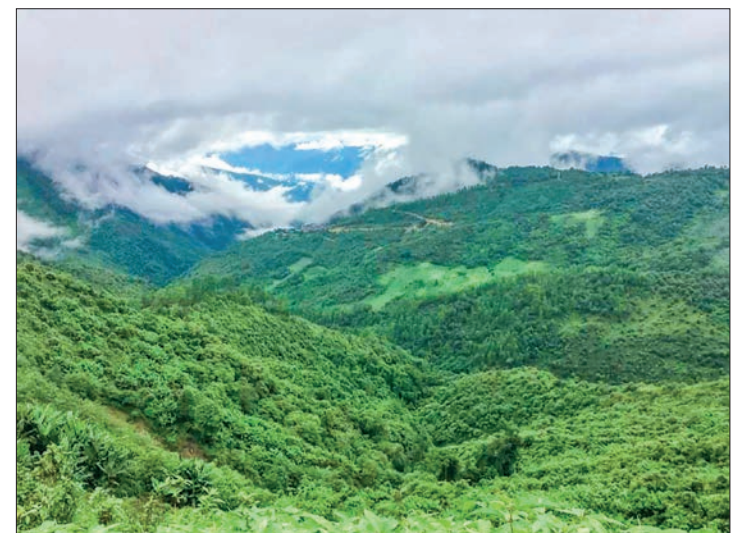
An aerial view of the Pale protected public forest.

The Pale Protected Public Forest is not only a place where various kinds of wood and valu-