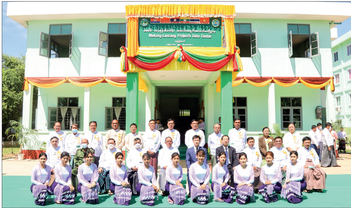
The MoALI Union Minister and dignitaries take the documentary group photo at the event.

The centre staff should draft the framework for capac-