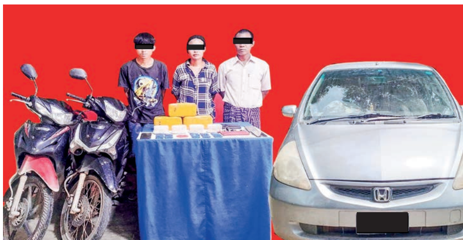
Three arrestees are pictured along with a saloon and two motorcycles.

They are prosecuted under the Narcotic Drugs and Psychotropic Substances Law, the Myanmar Police Force stated.