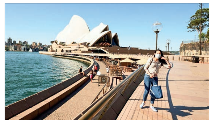
Thirty-seven people have died with COVID-19 and 1,834 people are being treated in hospital for the virus across New South Wales on August 30.

By Monday morning, Australia has recorded 9,976,582 confirmed cases and 13,648 deaths by the count of the national broadcaster ABC News, as the seven-day moving average of daily increase nears 12,000 cases per day. —Xinhua