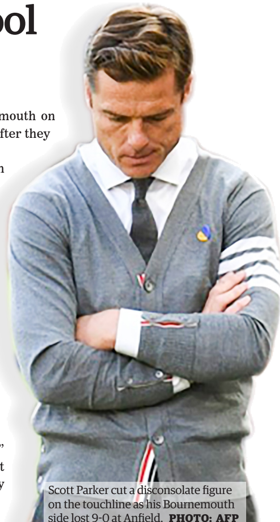
Scott Parker cut a disconsolate figure on the touchline as his Bournemouth side lost 9-0 at Anfield.

He was especially blunt following the Liverpool match, saying the Cherries were "ill-equipped" following a rout which came after a 4-0 loss at champions Manchester City and a 3-0 defeat by Arsenal. —AFP