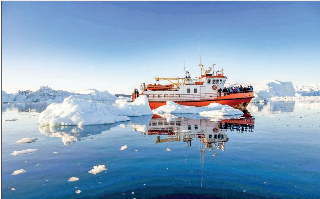
A boat carrying tourists floats near icebergs in Disko Bay, Ilulissat, in western Greenland.

EVEN without any future global warming, Greenland's melting ice sheet will cause major sea level rise, with potentially "ominous" implications over this century as temperatures continue to rise, according to a study published Monday.