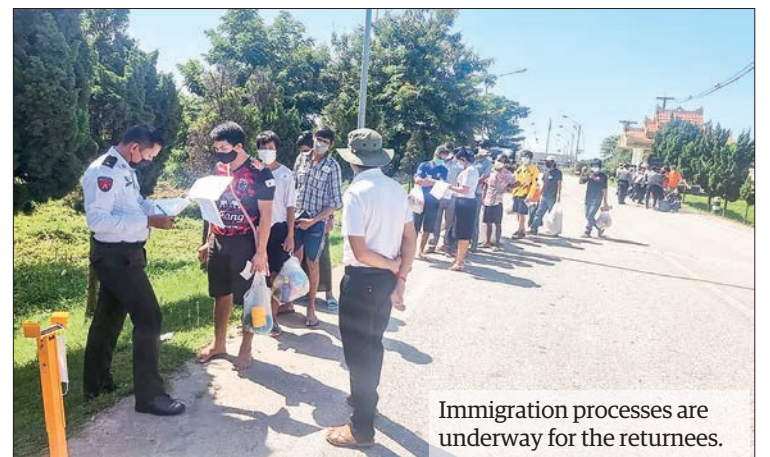
Immigration processes are underway for the returnees.

The prices of black gram and pigeon peas rebounded this week. On 30 August, pulses price stood at over K1,953,000 per tonne of black gram (Fair Average Quality/RC), K2,258,000 per tonne of black gram (Special Quality/RC) and K2,025,000 per tonne of pigeon pea (red gram) RC, whereas Chickpea prices rose to K4,300-4,500 per viss in the wholesale markets. — TWA/GNLM