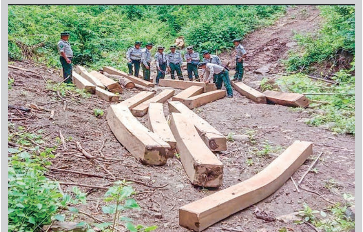
Officials measure the confiscated timbers.

THE Forest Department of the Ministry of Natural Resources and Environmental Conservation is implementing various ways and methods including the community monitoring and reporting system (CMRS) to control illegal timbers and forest products.