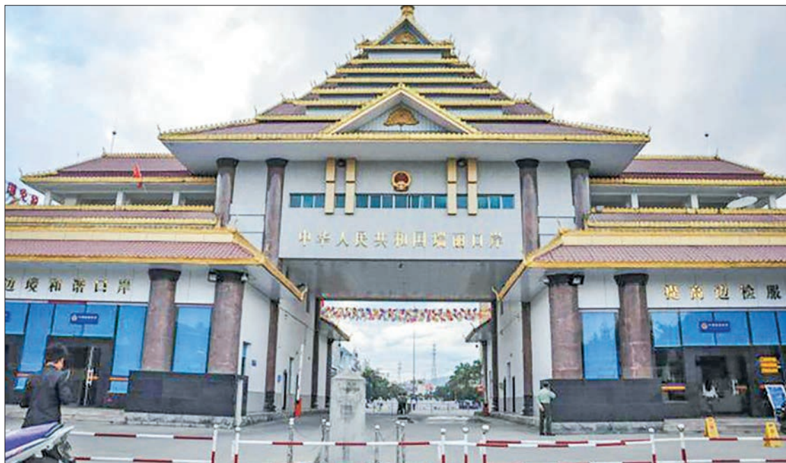
According to the Ministry of Commerce's statistics, China-Myanmar trade worth more than US$1 billion was transacted through the Wang Ding border.

TRADERS said that the trading activities have been closed since 26 August due to the de-