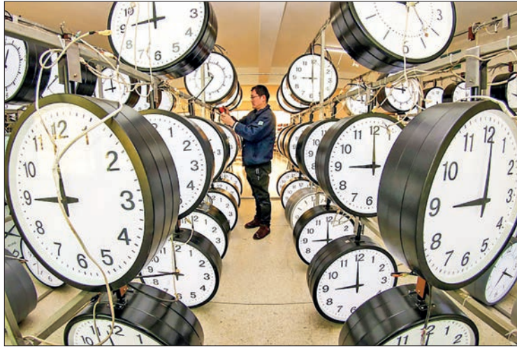
A technician checks hanging clocks at a workshop of a clock company in Yantai, Shandong province, China, on 15 December 2020.

lenges, (we have) decisively launched a package of policies to stabilize the economy. Their strength surpasses those of 2020," Premier Li Keqiang said during a Monday State Council conference. China's economy has also been battered by the two-month lockdown of Shanghai, a nationwide mortgage boycott, and a severe drought and heatwave which shut down manufacturing hubs and severely impacted the agricultural sector.