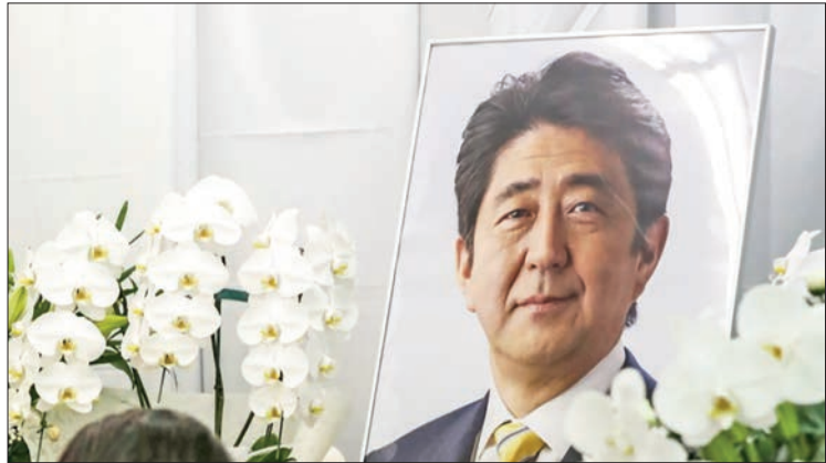
Kishida announced on 14 July his decision to hold a state funeral for Abe, who was fatally shot by a lone gunman on 8 July while giving an election campaign speech in the western city of Nara.

JAPANESE Prime Minister Fumio Kishida plans to hold a news conference Wednesday to explain his decision to hold a controversial state funeral next month for slain former Prime Minister Shinzo Abe, the top government spokesman said.