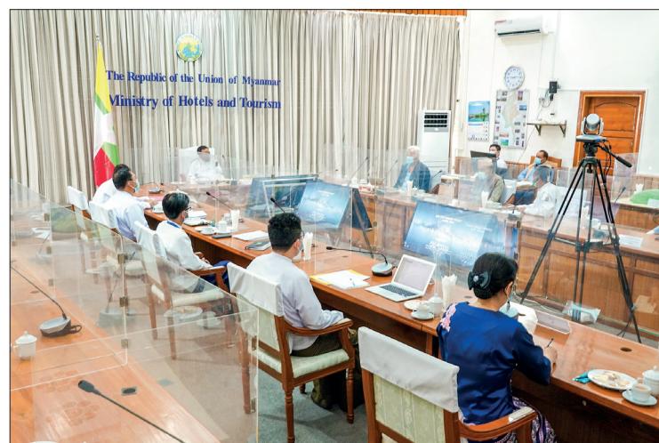
The MoHT Union Minister receives the delegation of Lumbini Garden Foundation in Nay Pyi Taw yesterday.

Afterwards, the Union minister urged the LGF chair to share his personal experiences when he arrives back in Spain after seeing the actual situation of the country during his visit to Myanmar. The ministry would continue its efforts