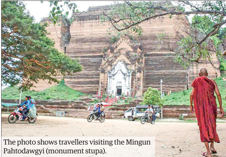
The photo shows travellers visiting the Mingun Pahtodawgyi (monument stupa).

The famous tourist sites are Sagaing Hill, Sun U Ponnyashin, Umin Thonze (30 tunnels) Temple, Kantalu Pagoda, Kyauknaga Pagoda and Sheinmakar area. Mingun Yokesone monastery, Mingun bell and Myatheintan Pagoda. It is the low season. Yet, a high number of homegrown visitors are seen. Most of them go on a day trip. Some go back to Mandalay and some continue their journey to Monywa. The hotels and lodges are not expensive as well," Ko Zaw