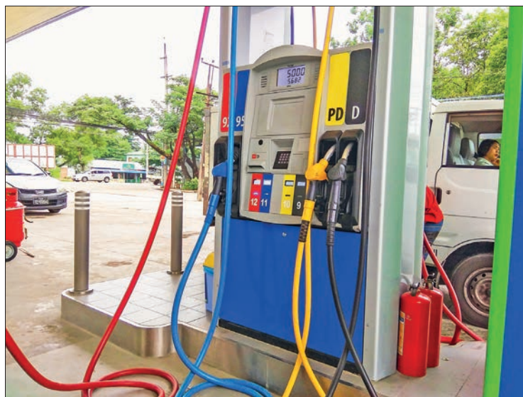
The fuel prices are spiking and indicating a sharp increase of K750-1,100 per litre within one month, according to the fuel market.

The committee has assured adequate fuel supply until this month. It is also working together with Myanmar Petroleum Trade Association to ensure a steady fuel supply in order for