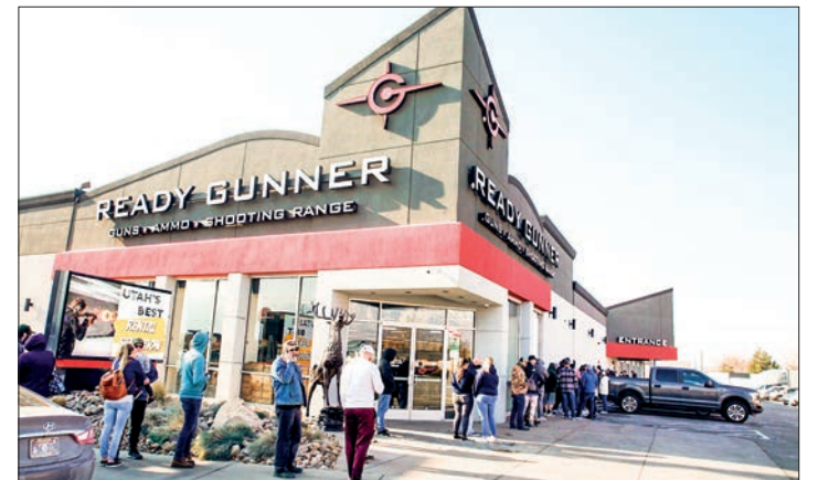
People line up in January 2021 to buy guns and ammunition at the Ready Gunner gun store in Orem, Utah.

The poll was conducted between 28 July and 1 August, after a string of deadly mass shootings and a 2020 spike in gun killings that have increased attention on the issue of gun violence.—Xinhua