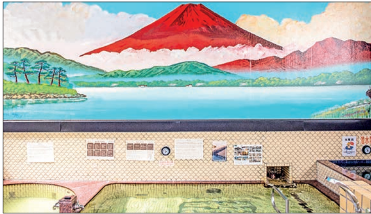
This picture shows a general view of the Kanamachi, which is a "sento" or public bath, in Tokyo.

But some such as Inariyu have been given a new lease on life through renovations, while others are reinventing themselves as trendy hangouts or using data analysis to boost