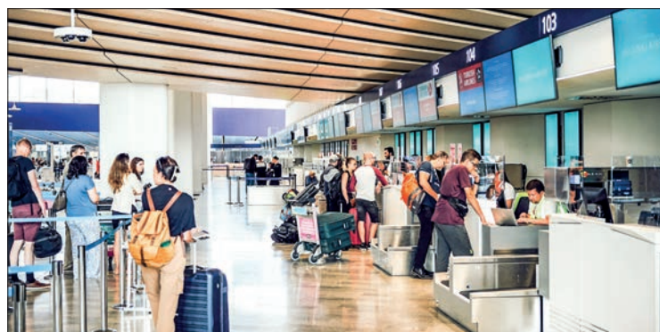
It would complicate the process of obtaining travel permission and could slow the flow of Russians travelling to Europe, increasing Moscow's international isolation. Helsinki Airport is the largest airport in Finland.

does not amount to a formal ban on tourism visas demanded by some of Russia's EU neighbours. — AFP