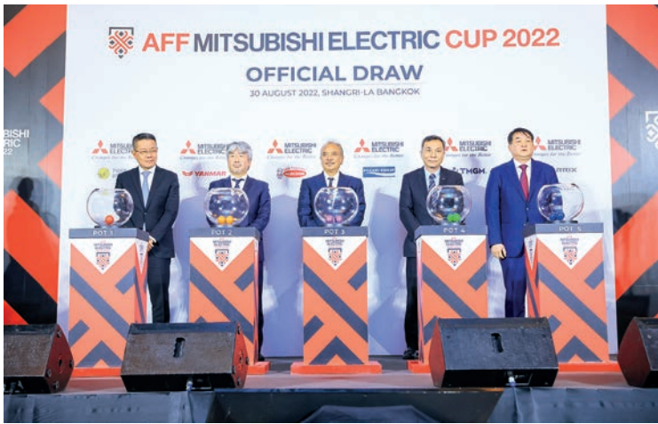
Myanmar is fixed in Group B of the AFF Mitsubishi Electric Cup 2022.

THE group draw of the AFF Cup 2022, the most advanced competition in the ASEAN region, was held on 30 August in Bangkok, Thailand, and the Myanmar team is placed into Group B.