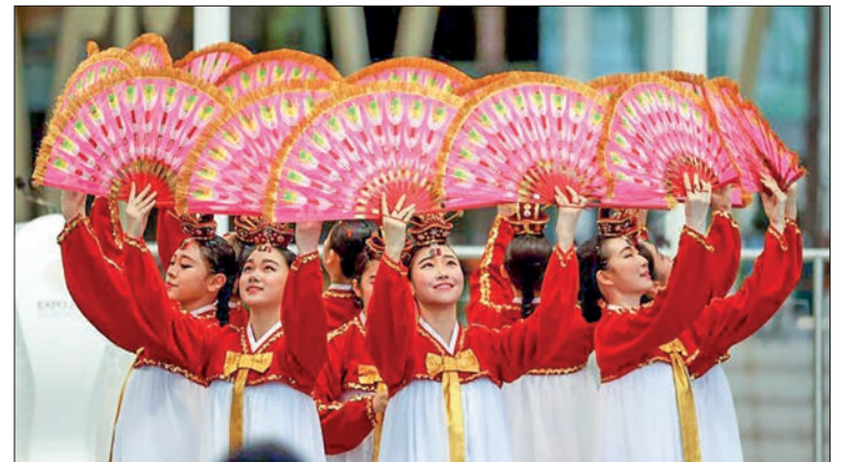
South Korean artists perform on Korea Day at the al-Wasl Dome of Expo, during the visit of their country's president, in the Gulf emirate of Dubai, on 16 January 2022.

SOUTH Korea on Tuesday proposed a budget of 639 trillion won (475.2 billion US dollars) for 2023 in the lowest fiscal spending growth in six years.