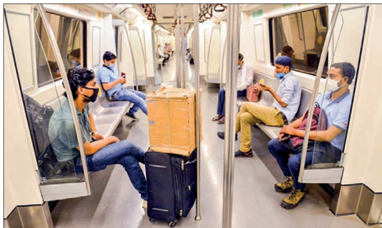
Passengers maintain social distance inside a compartment of a metro train in New Delhi, India, on 7 September 2020.

THE Managing Director of the Lok Nayak Jai Prakash Narayan Hospital (LNJP) confirmed the 8 th case of Monkeypox in Delhi, on Friday.