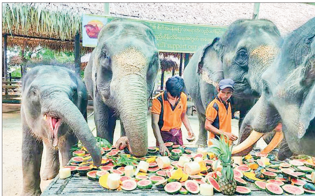
Elephants join elephant buffet at Palin Kanthaya elephant camp.

ELEPHANT lovers from across the country are feeding the elephants in Palin Kanthaya elephant camp online, according to the officials. The camp, located near the west Palin village beside the Myingyan-Pakokku road in NyaungU Township, was opened by the Myanma Timber Enterprise of the Ministry of Natural Resources and Environmental Conservation. During the closure of the elephant camp, the number of people feeding the elephant buffet has increased to more than 470 times, and there is more booking online.