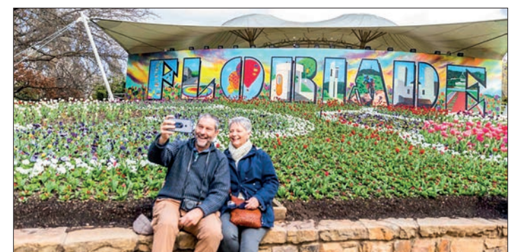
Visitors take a selfie at the festival event of Floriade in the Commonwealth Park in Canberra, Australia, 17 September 2022.