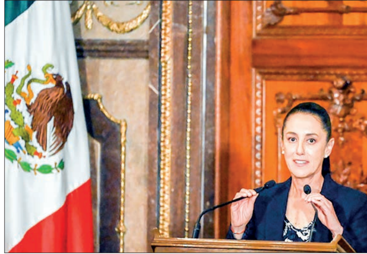
Mexico City Mayor Claudia Sheinbaum is hoping to become her country's first female president.

In the meantime, anyone can ask Ebrard, 62, questions on WhatsApp after he published