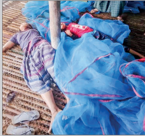
Photo shows dead bodies of five persons.

Regarding the murder process, the case was opened at the Anisakhan police outpost in PyinOoLwin. The police are still investigating the case to arrest the perpetrators.—TWA/GNLM