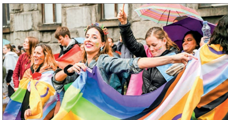
The event had been intended as the cornerstone event of the EuroPride gathering. But the interior ministry banned the march earlier this week, citing security concerns after right wing groups threatened to hold protests.

The event had been intended as the cornerstone event of the EuroPride gathering. But the interior ministry banned the march earlier this week, citing security concerns after right wing groups threatened to hold protests. Despite the official ban, demonstrators were able to