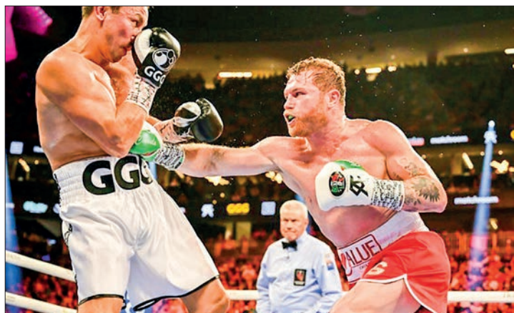
Mexican boxer Saul 'Canelo' Alvarez (R) goes for the body on the way to a unanimous decision over Kazakhstan's Gennady Golovkin in their super-middleweight world title fight.

"Thank you so much, my friend," Alvarez said to Golovkin in the ring after a bout whose build-up was marked by some bitter rhetoric.—AFP