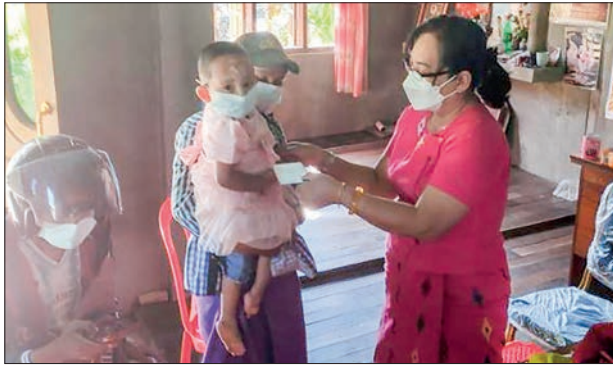
Official of District SWD office presents cash assistance to the person with disabilities in Ingapu Township of Ayeyawady Region in January 2022.

SUBSIDIES worth K135.441 million have been provided to 39,297 persons with disabilities from February 2021 to 13 September 2022, said Union Minister for Social Welfare, Relief and Resettlement Dr Thet Thet Khine at the event of grant giving to 650 persons with disabilities from Pobbathiri and Hlinethaya townships on 13 September.