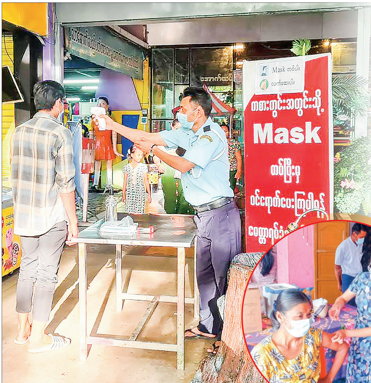
Health and security staff perform health care services for the people under the health protocols of Ministry of Health.

T HE Ministry of Health announced on 17 September 2022 the rules that must be followed by people in crowded areas due to the increase in the number of cases of COVID-19 in the country.