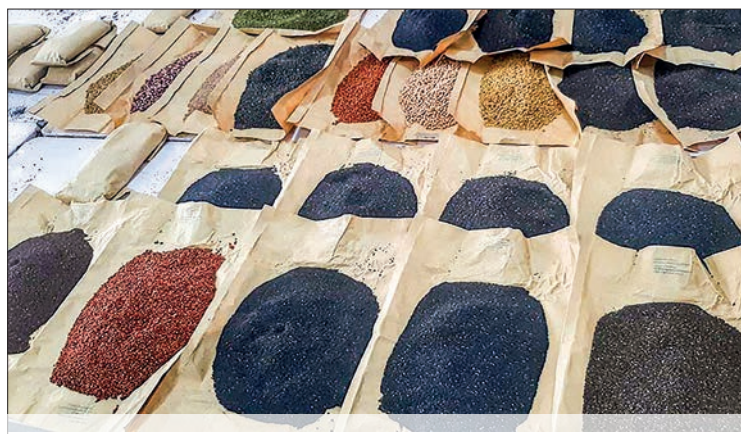
Samples of black gram and other beans are seen at wholesale centre of the market.

current market price is possibly to inch higher following dollar rate and gold price. However, there is a gap between the reference exchange rate and the unofficial rate when export earnings are exchanged.