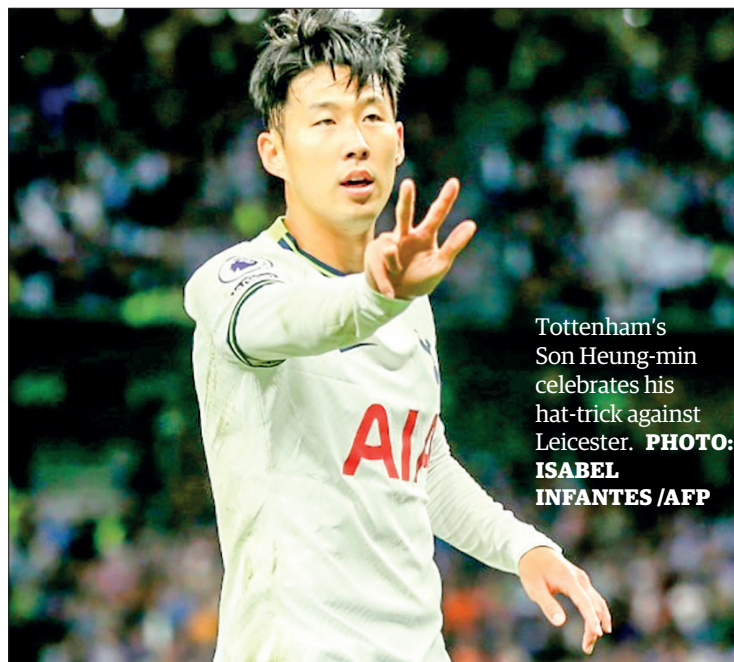
Tottenham's Son Heung-min celebrates his hat-trick against Leicester.

SON HEUNG-MIN ended his goal drought as the South Korea star responded to being dropped by hitting an incredible 13-minute hat-trick in Tottenham's 6-2 rout of Leicester on Saturday.