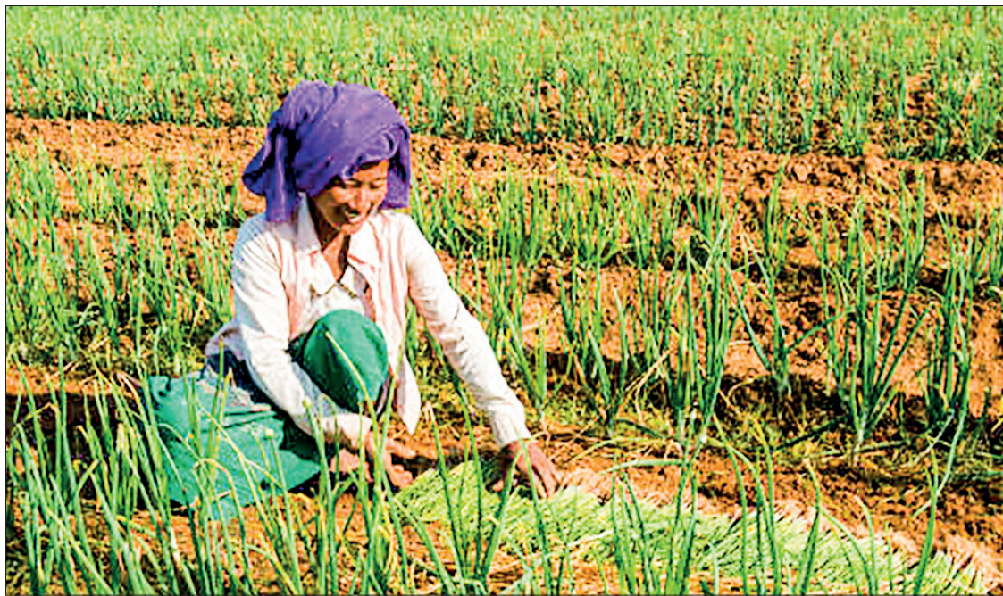
Pic shows a female grower in the green onion field.

Prior to 2020, Chinese onions will be as large as apples. This year, the size of Chinese onions is relatively similar to the local ones, a buyer U Shwe Win told the GNLM. For the local onions, the big one fetched the highest price in the domestic markets. The housewives prefer the medium ones of good