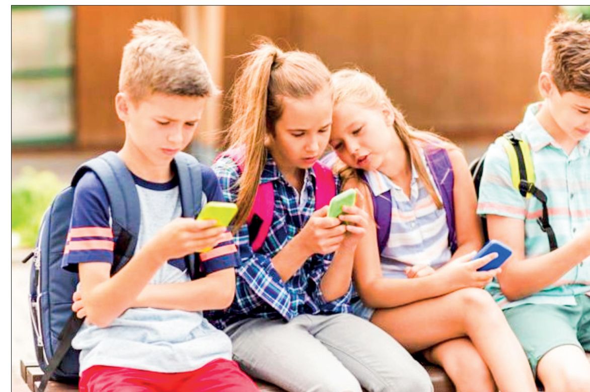
Exposure to blue light, via regular use of tablets and smartphones, may alter hormone levels and increase the risk of earlier puberty. PHOTO: REPRESENTATIVE IMAGE/AFP

FORECAST FOR MANDALAY AND NEIGHBOURING AREA FOR 19 September 2022: Isolated rain or thundershowers. Degree of certainty is (80%).