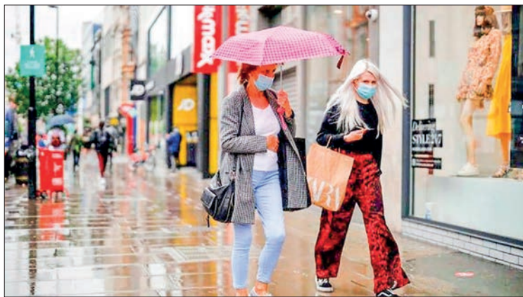
Shoppers walk through the rain on Oxford Street in London.

MANY things are on pause while Britain mourns Queen Elizabeth II, but the concerns of shoppers at a popular London market highlighted that the cost-of-living crisis was not among them.