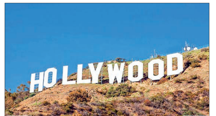
The Hollywood Sign, which is a US American cultural icon, is situated in Los Angeles, California.