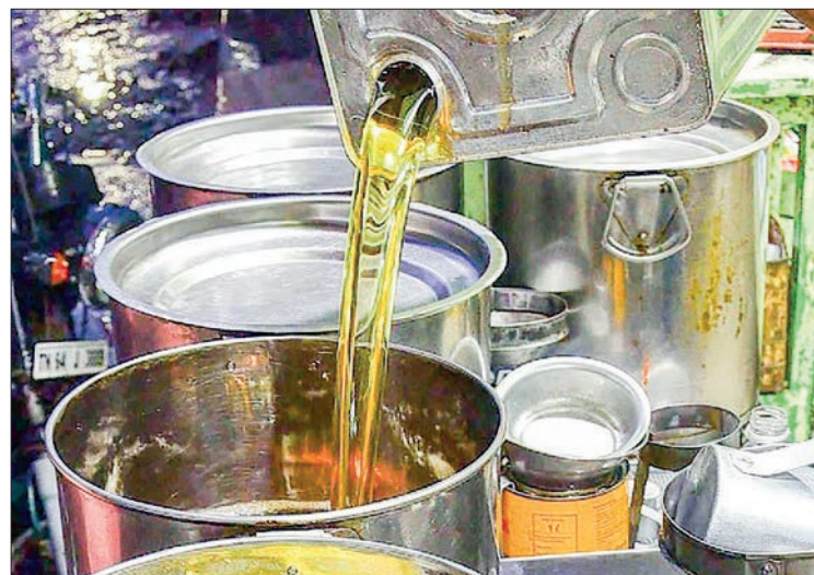
Palm oil to be sold in the market is seen.

Similarly, a tonne of palm oil was priced at 3,481 Ringgit on 9 September. When it is exchanged to local currency, palm oil is worth only K2,620 per viss. On 8 September, palm oil price hit 3,615 Ringgit. On 25 August, it soared