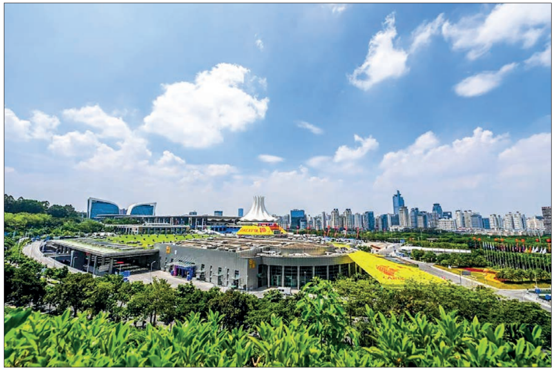
Photo taken on 16 September 2022 shows the view of Nanning International Convention and Exhibition Center and its surrounding areas in Nanning, capital of south China’s Guangxi Zhuang Autonomous Region.