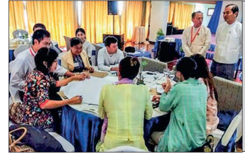
A workshop on promoting employment opportunities for people with disabilities in 2020.

BUSINESS and management diploma courses for the visually impaired in Myanmar will be offered free of charge from October, according to the Myanmar Association of the Blind.