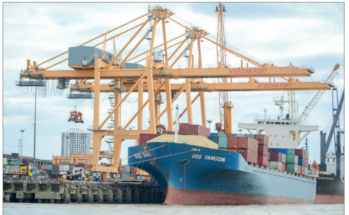
Hteedan Port in Yangon handles freight at ocean liners.

Earlier, the larger ships had draft problems preventing their sailing on the Yangon River. The draft extension is up to 10 meters with the new navigation channel accessing the inner Yangon River. Yangon inner terminals