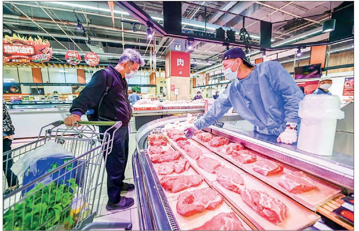
A resident buys meat at a supermarket in Songjiang District of east China's Shanghai, 10 May 2022.

The innovation of key and core technologies in poultry and aquaculture industries should be