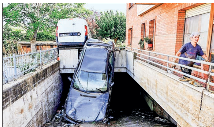
The civil protection agency said about 15.75 inches of rain — one third of the average annual amount — fell in a matter of two to three hours. PHOTO: ALBERTO PIZZOLI/AFP

The warehouse worker, 30, choked back tears as he picked his son's dinosaur toys out of the mud and tossed them onto the nearest pile of ruined sofas, beds and tables lining the street in Pianello di Ostra. —AFP