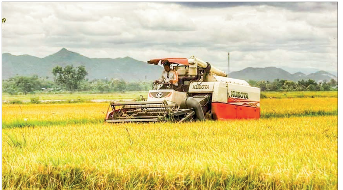
A combine harvester seen in operation at paddy farm.

As agricultural equipment can be purchased and used, the farmers will be able to carry out their work in a short period, as well as be able to plant on time during the planting season.