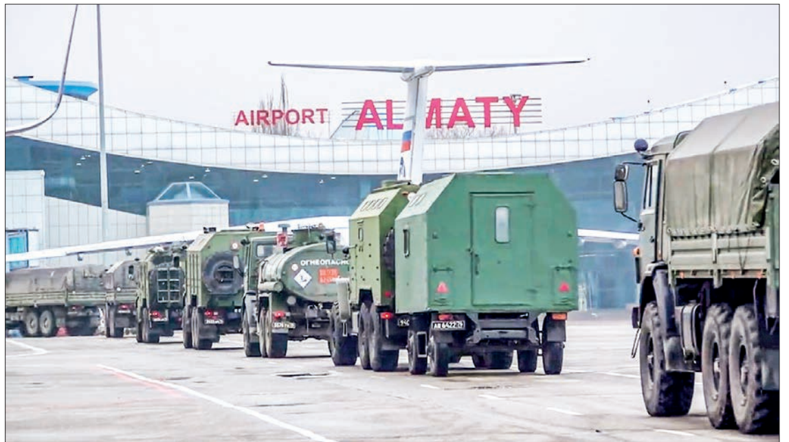
In January, riots erupted in the country, eventually leaving more than 200 people dead. Peacekeepers acting with Kazakhstan's law enforcement forces took control over the Almaty airport.

Tokayev has launched reforms and called for "completely new standards for a political system with fair and open rules of the game". In January, riots erupted