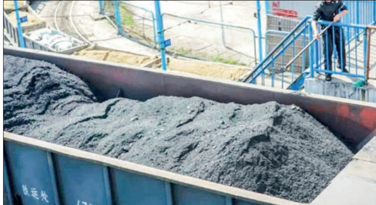
Coal loaded on trains at a coal plant in Huaibei, in China's eastern Anhui province, on 23 June 2022 — coal power still makes up most of China's energy supply.

China have fallen for four consecutive quarters on the back of an economic slowdown, research reported by climate monitor