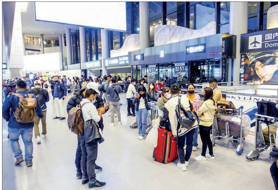
The coronavirus pandemic has hampered Japan's efforts to boost inbound tourism as an engine of economic growth.

Japan has raised its daily entry cap on arrivals to 50,000 from 20,000 in early September and has begun accepting foreign travelers on tours without a