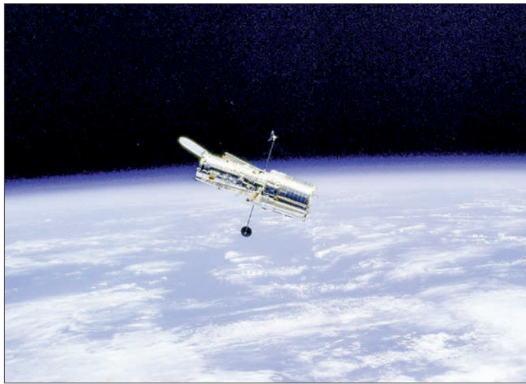
This 1997 NASA file image shows the Hubble Space Telescope as seen from the Space Shuttle Discovery.