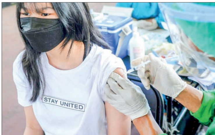
A young woman receives the AstraZeneca COVID-19 vaccine at a makeshift mass vaccination clinic on Indonesia’s resort island of Bali.

“The development... of a domestic vaccine is a pride for us Indonesians as a foundation and as the first step to achieve the nation’s independence in access to medicine,” head of the national food and drugs