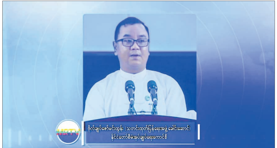
Maj-Gen Zaw Min Tun.

A: International countries and the whole world regard terrorist attacks on public transport such as passenger flights, trains, and buses as a direct threat to the public. It is a direct act of terrorism to the public. The case in Loikaw is an attack on a passenger flight which carries 63 passengers. It left Yangon and flew at a lower level to land at Loikaw airport and circled the airport at 8:45 am. Meanwhile, it passed the places in the northern part of the airport where the KNPP and PDF terrorists are stationed. At that time, they shot the flight. The bullet pierced through into the cabin of the plane and one passenger was injured. After we released the statement, the unscrupulous media outlets misled the case as the attack occurred at the airport. There is a reason why they did that. As they know that the terrorist attack on public transport is a huge criminal case, they want to conceal the truth which is unconcealable. What I want to say is that the security forces will take serious action against the perpetrators or groups that launch such brutal attacks. —MNA