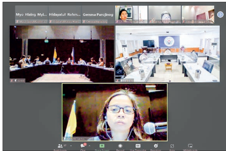
The second Technical Working Group Meeting of Southeast Asia National Human Rights Institutions Forum is in progress.

THE second Technical Working Group Meeting of the Southeast Asia National Human Rights Institutions Forum (SEANF), in which the Myanmar National Human Right Commission (MNHRC) is a full-fledged member, was hosted by the Commission on Human Rights of the Philippines, the alternate chairman for the 2022 forum, through a hybrid format on 28 and 29 September.