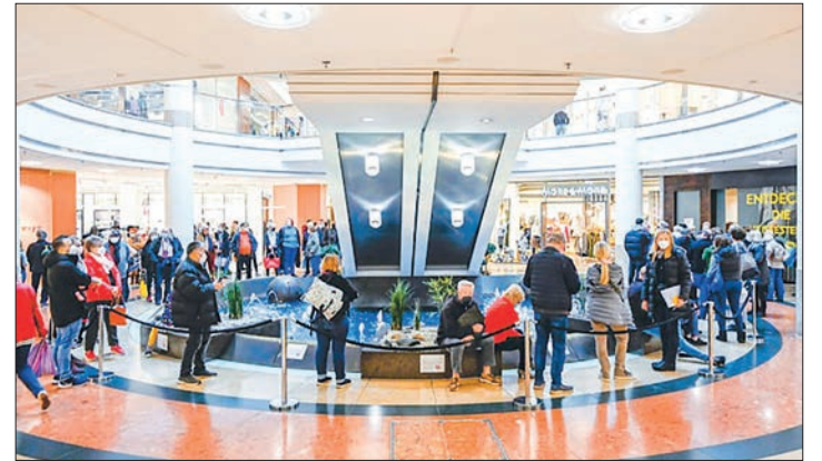
People queue for vaccination jabs at a shopping mall in southwestern Germany.

Despite financing extensive inflation relief packages, Federal Minister of Finance Christian Lindner wants to stick to the reintroduction of the debt brake next year. “Fighting inflation is different from fighting a COVID-19 pandemic,” he told public broadcaster ARD earlier this month.—Xinhua