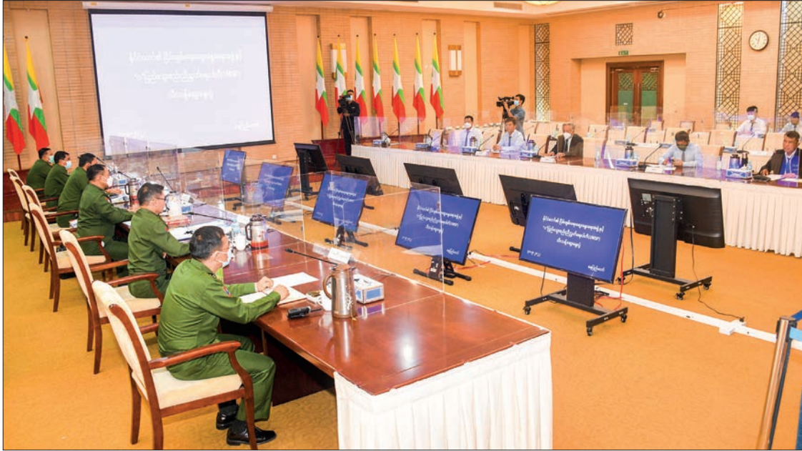
The fourth-day meeting between the State Peace Talks Team and the UWSP, NDAA and SSPP delegation is in progress yesterday.

THE fourth-day meeting between the State Peace Talks Team and the delegation led by the vice-chairman of the United Wa State Par-