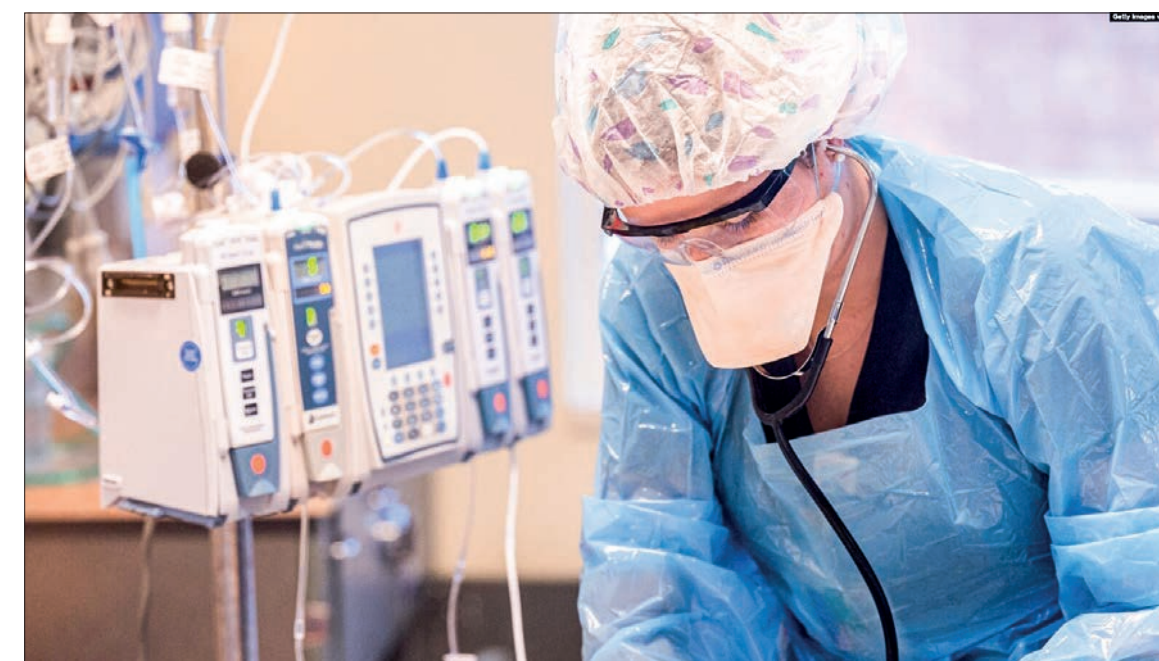
A healthcare worker tends to a patient on a ventilator in the Intensive Care Unit of Baptist Health Floyd on 7 September 2021 in New Albany, Indiana. PHOTO: AFP

UQ Diamantina Institute researcher Arutha Kulasinghe said that during the study the researchers couldn't detect viral particles in the cardiac tissues of COVID-19 patients, but they found tissue changes