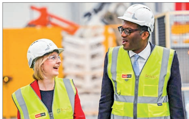
Liz Truss is under severe pressure after the markets reacted to her government's tax cuts by sending the pound to an all-time low against the dollar.

UK Prime Minister Liz Truss on Thursday defended her tax cutting policy after days of silence