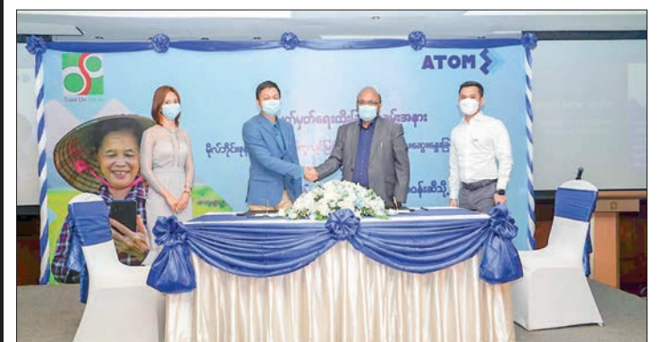
Officials are seen shaking hands after signing the agreement at the event.

It was reported that ATOM users may start the hotline 7887 or apply ATOM Store App for healthcare consultancy as of 10 October. The healthcare consultancy comprises consultancy on symptoms of disease, reproductive health, beauty and healthy lifestyle, daily health advice, and guides to hospitals and clinics. Especially, the service will take measures not to leak the data between medical doctors and patients.