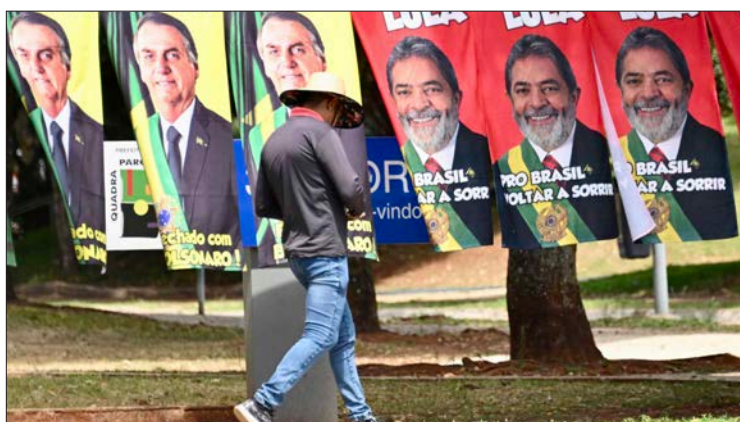
"What's at stake is democracy versus fascism," the gravelly voiced 76-year-old Luiz Inacio Lula da Silva told a cheering crowd decked out in the red of his Workers' Party (PT) at a rally last month.

Bolsonaro, the pugnacious ex-army captain whose popu-