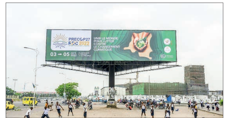
The informal talks in DR Congo's capital Kinshasa come ahead of the COP27 climate summit in Egypt from 6-18 November. PHOTO: AFP/FILE

The theme was also present during the 2021 COP26 climate talks in Glasgow, which ended with a pledge to keep global warming at 1.5 degrees centigrade compared to pre-industrial levels.—AFP