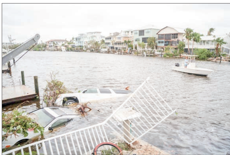
Vehicles float in the water after Hurricane Ian on 29 September 2022 in Bonita Springs, Florida. Hurricane Ian brought high winds, storm surge and rain to the area causing severe damage.

CLIMATE change increased the rainfall from Hurricane Ian by more than 10 per cent, according to a new quick-fire analysis, as one of the most powerful storms ever to hit the United States devastated parts of Florida.