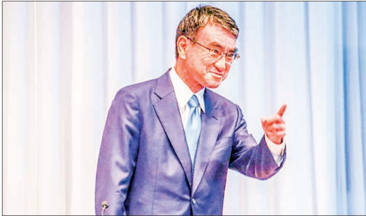
Kono is a political heavyweight who ran unsuccessfully for party leadership.

JAPAN'S media-savvy digital minister said Friday he's ready to take an iron-fisted approach to speed up the nation's slow embrace of online services at government offices and workplaces.