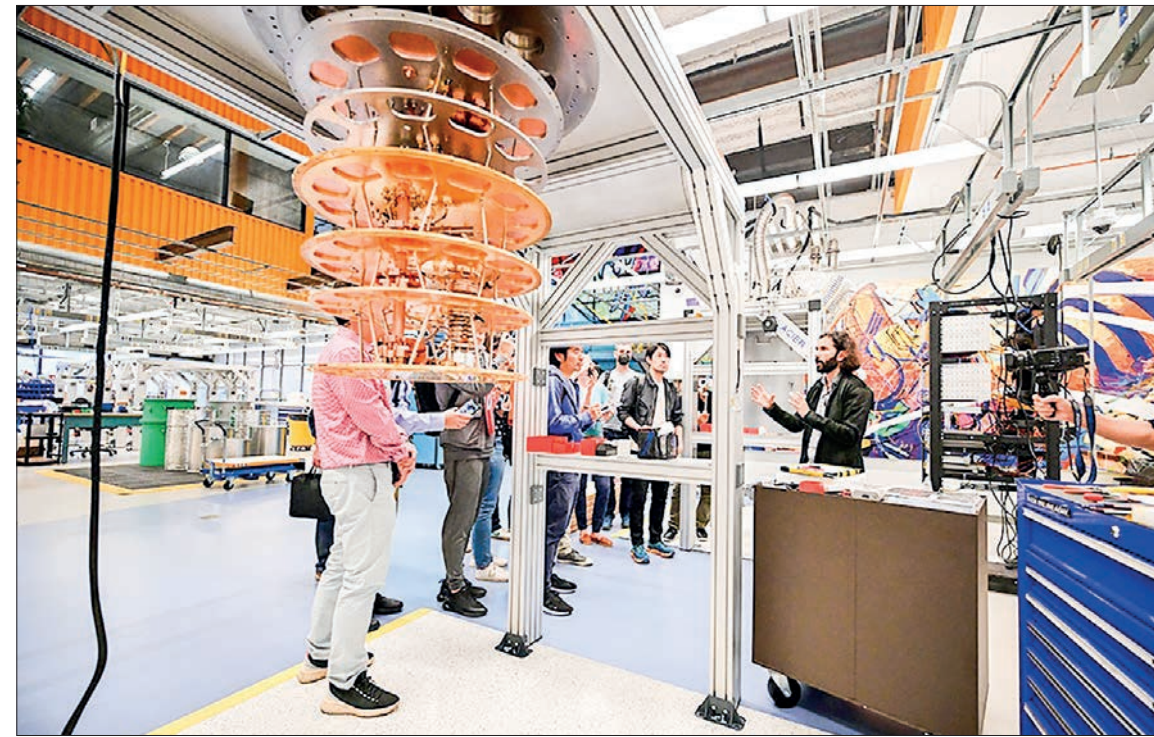
Dr Erik Lucero, Lead Engineer of Google Quantum AI, leads media on a tour of the Quantum Computing Lab at the Quantum AI campus in Goleta, California on 21 September 2022.

The top 10 still counts only Western countries, with the exception of Singapore in seventh position, and showed improved performance by the United States, which moved up one spot to second place, ahead of Sweden and Britain.