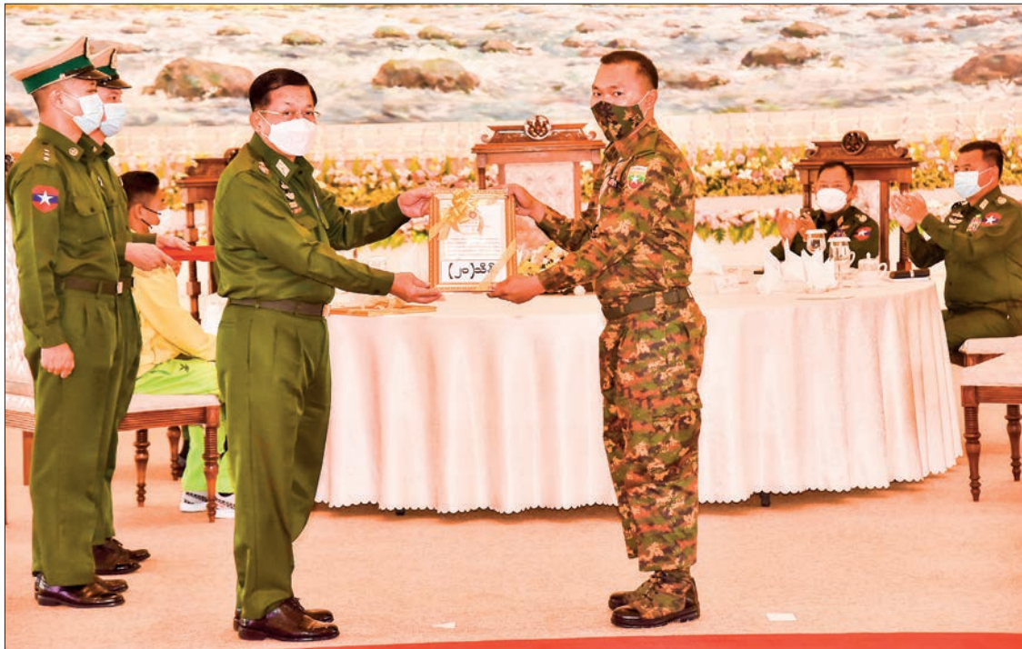
The Senior General gives the cash award to the winner.