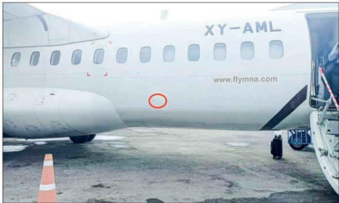
The aircraft in the aftermath of the terrorist attack.