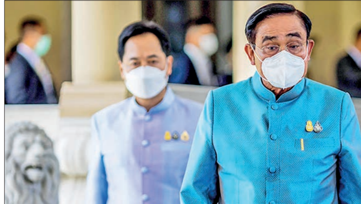
Under the 2017 Thai constitution, a prime minister cannot serve more than eight years in office, but Prayut's supporters and critics disagree as to when his term began.

Since the court on 24 Aug suspended Prayut from performing his duties as premier, Deputy Prime Minister Prawit Wongsu-