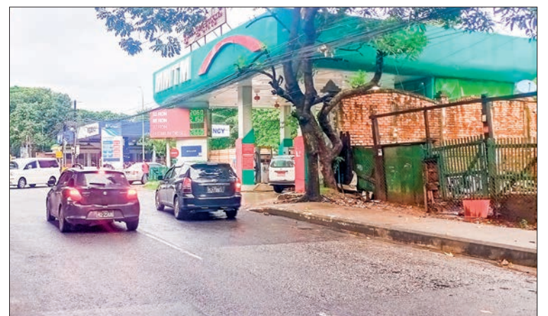
The photo shows a price sign at the petrol station in Yangon on 30 September.

In Yangon, prices of fuel do not drop below K2,000 per litre. On 30 September, 92 gasoline was priced at K2,060 per litre, 95 gasoline at K2,150 per litre, diesel at K2,575 per litre and premium diesel at K2,660 per litre, according to statistics. — TWA/GNLM