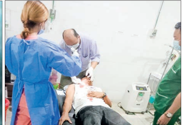
The injured is pictured receiving medical treatment.