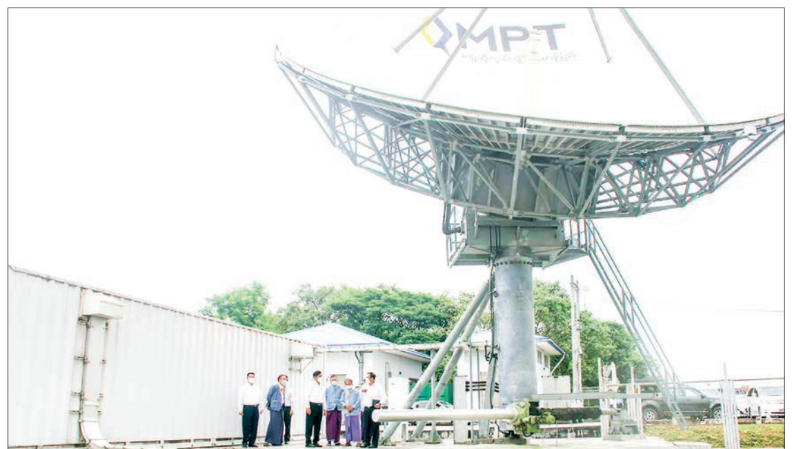
MoTC Union Minister Admiral Tin Aung San inspects the satellite earth station of MPT in Toegyaunggale.

At noon, the Union minister and party visited the Hanthawady Data Centre of MPT in Sangyoung Township and the Union minister highlighted the need to prepare the reserve power generators at the Data Centre in providing information, connect with the reserve cables, use the machinery as per the standards, draft the security plans for