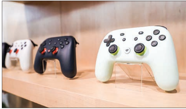
The new Google Stadia gaming system controller is displayed during a Google launch event on 15 October 2019 in New York.

fund purchases of Stadia hardware, such as controllers, as well as game