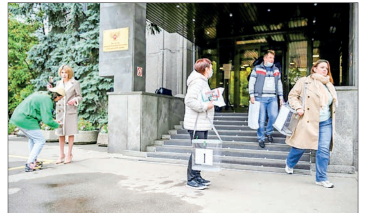
Four regions of Ukraine - Luhansk, Donetsk, Kherson and Zaporizhzhia - would be folded into Russia during a Kremlin ceremony attended by President Vladimir Putin.

The rhetoric built on his now famous phrase that the fall of the USSR was a tragedy, and he has recently suggested Moscow should again extend its influence over the former Soviet region.—AFP