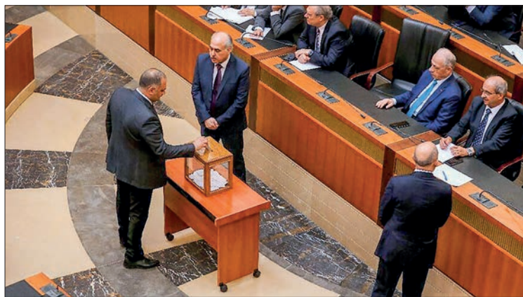
Lebanese lawmakers cast their ballots in a first round of voting for a successor to outgoing head of state Michel Aoun.

LEBANON'S parliament failed to elect a new president after a first round of voting Thursday amid deep divisions over a replacement for Michel Aoun whose term expires next month.