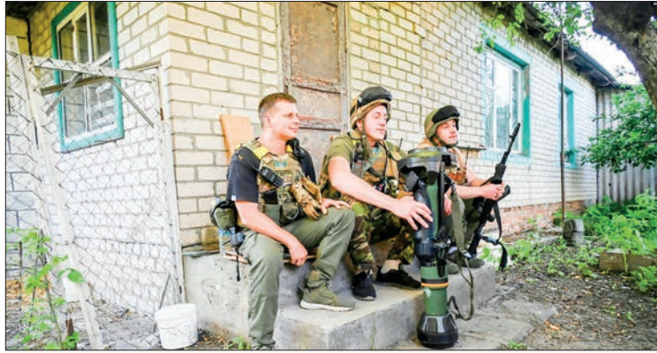
Ukrainian servicemen rest on their position not far from the Ukrainian town of Chuguiv, in Kharkiv region on 9 June 2022.

"They asked me to do something so that an exchange could be made," the pope said according to a transcript of the September 15 interview published by the Italian Jesuit magazine Civiltà Cattolica . "I immediately called the Russian ambassador to see if something could be done, if an exchange of prisoners could be expedited," he added, without