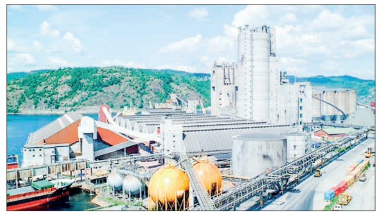
Norway's Yara, one of the world's largest fertilizer makers, is curtailing its ammonia and urea output in Italy and France due to the surge in natural gas prices.

"The current state of high gas and electricity prices bears the imminent risk of production losses and shutdowns of thousands of European companies," the business lobby wrote in an open letter to EU chief Ursula von der Leyen. "Urgently finding ways at EU level to mitigate the impact of crippling energy prices faced by European business is a matter of survival." The EU's executive and the bloc's 27 member states are scrambling to come up with ways to lessen the hit from