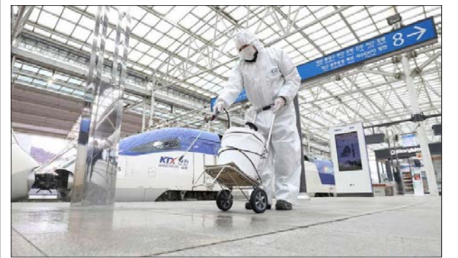
Staff members conduct disinfection operation at the platform of a railway station in Seoul, South Korea, 25 Feb 2020.

The BSI among manufacturers declined 6 points from a month earlier to 74 in September, while the index for non-manufacturers slipped 1 point to 81.— Xinhua