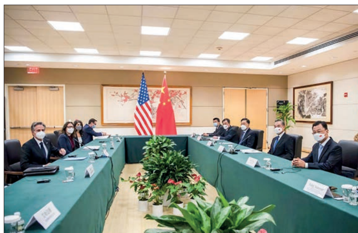
Chinese State Councillor and Foreign Minister Wang Yi (2 nd R) meets with US Secretary of State Antony Blinken (1 st L) at the site of the Permanent Mission of the People's Republic of China to the United Nations in New York, on 23 September 2022.

CHINESE State Councillor and Foreign Minister Wang Yi on Friday told US Secretary of State Antony Blinken that China-US relations have been severely impacted currently, and the lessons from which should