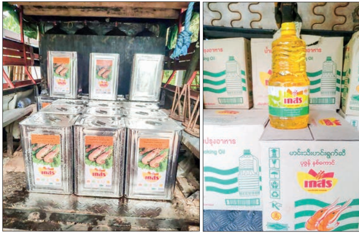
Seized illegal commodities at the Mayanchaung checkpoint in Mon State.

An on-duty team under the supervision of the Customs Department made inspections at the Asia World container checkpoint on 21 September. Officials found 13,600 kilogrammes of velvet elastic band that exceeded the Import Declaration (ID) and were worth K48,552,000. The team also seized electronic devices at an estimated value of K61,302,000, which were not declared in the ID in a container at the airport cargo warehouse at the Yangon International Airport on 22 September. The total worth of seizures amounted to K61,302,000 and the action