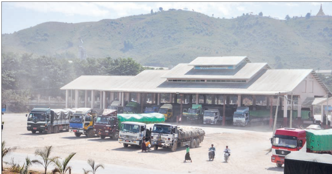
Myanmar daily conveys rice, broken rice, pulses, rubber, fishery products, foodstuffs, dried plum and chilli with 70 trucks to China.

change Supervisory Committee informed the merchants to make payment for rice, broken rice, bean, corn and oil crop exports to China via the Sino-Myanmar border trade point using the US dollar instead of the Yuan.