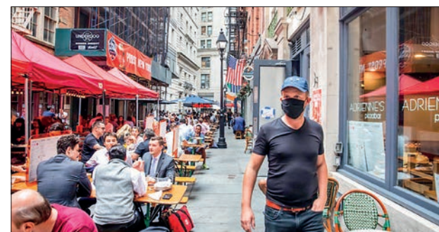
People dine at tables outside of bars and restaurants along Stone Street in New York, the United States, 25 September 2020.

"Increased pessimism around the broader economic environment and muted expectations for the future have contributed to this shift," said Ipsos' report about the index on Thursday. "Perhaps bolstering this economic uncertainty is widespread concern over inflation, which continues to be seen as the single big-