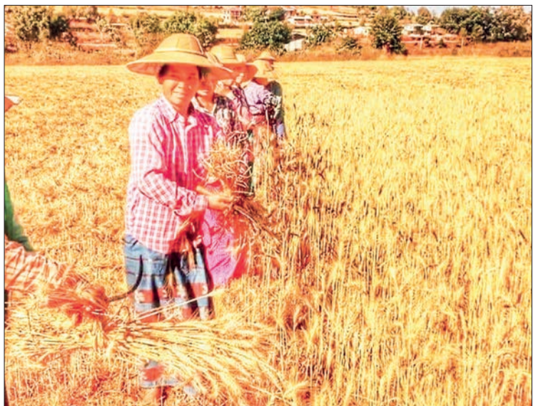
In Myanmar, wheat crops are grown mainly in Mandalay and Sagaing regions, and also in northern and southern Shan, Chin and Kayah states.

MYANMAR agricultural produce, wheat crops grown locally have a good yield this year and a bag of three baskets priced up to K200,000 at present, according to the pulses traders in Mandalay.