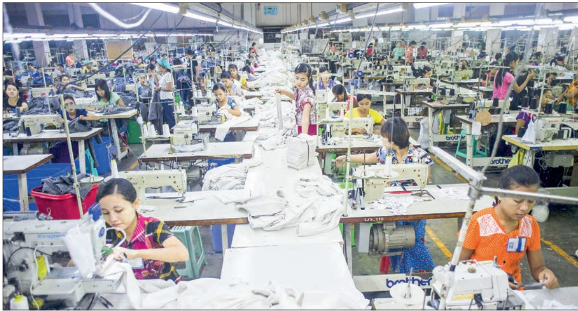
Employees work at the Shweyi Zabe garment factory in Shwepyitha Industrial Zone in Yangon.

Previously, according to the report of the World Bank, Myanmar's economy will develop more than before, ADB forecast. Currently, the export incomes from the garment in-