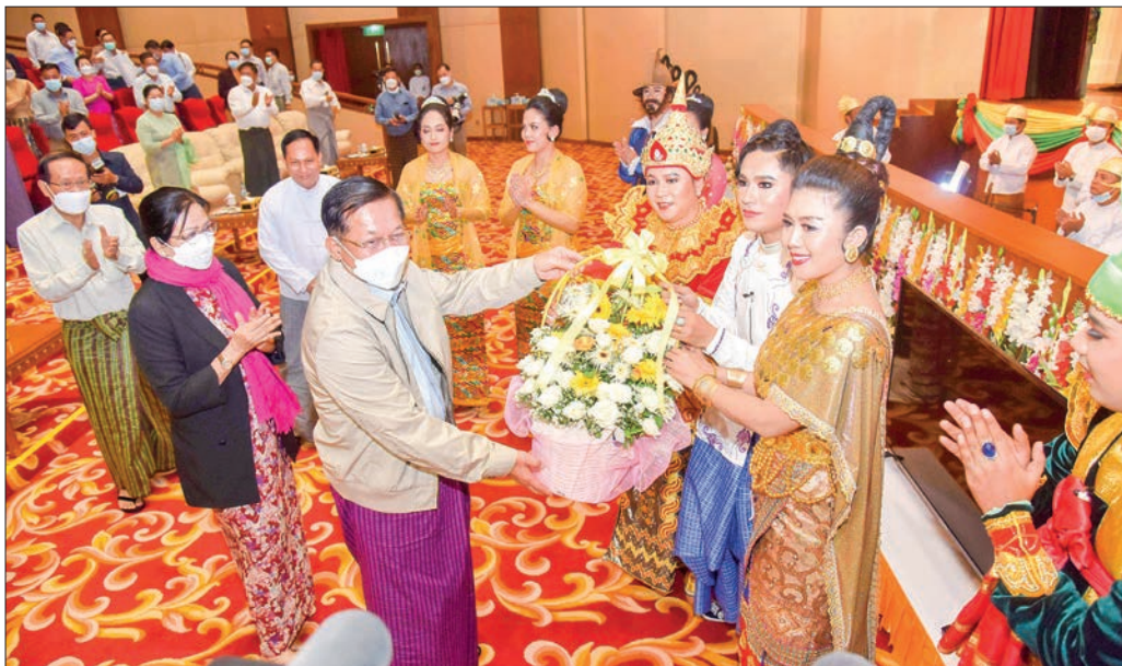
The Senior General presents the bouquet.