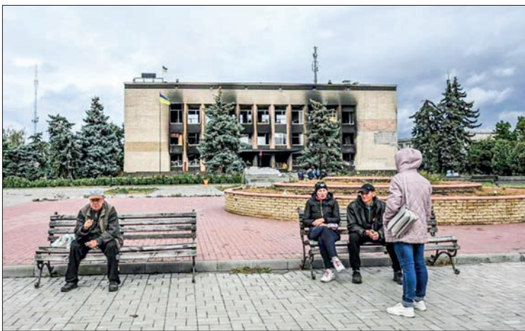
Local residents gather on a square in Izyum, eastern Ukraine on 14 September 2022.

A two-day meeting of trade ministers from the Group of 20 major economies on the Indonesian resort island of Bali ended Friday without a joint communique after they failed to reach a consensus