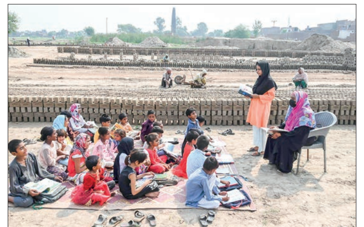
The devastating floods in Pakistan have interrupted the education of nearly 3.5 million children, the UN said in a report. Children of brick kiln workers attend a class at a brick kiln site in Lahore, Pakistan, 8 September 2022.

Sharif said injustice was inherent in the crisis, with his country of 220 million people at "ground zero" of climate change but responsible for less than one per cent of carbon emissions.—AFP