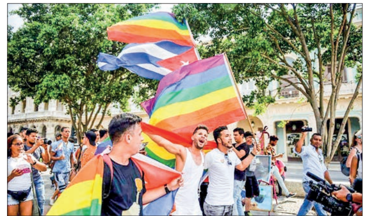
People participating in an unauthorized march to celebrate LGBT rights in the Cuban capital Havana.

freedom of expression, the family code would not only permit marriage and surrogacy (as long as no money is exchanged), but also adoption by same-sex couples and parental rights for non-biological mothers and fathers. If the law is approved, Cuba would become only the ninth country in Latin America to allow same-sex marriage, following in the footsteps of Argentina, Brazil, Colombia, Ecuador, Costa Rica, Chile, Uruguay and some Mexican states.—AFP