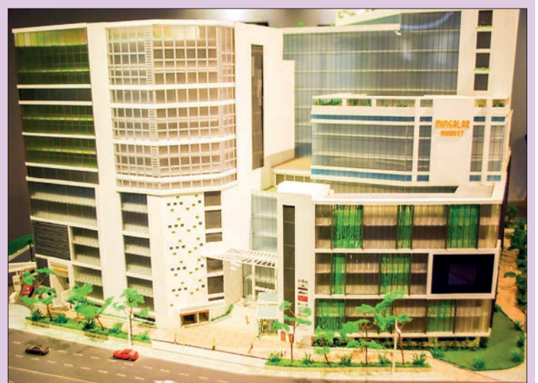
A miniature version of the new Mingala Market.

Construction of the new Mingala Market began in September 2019 and is scheduled to be completed in April 2023.