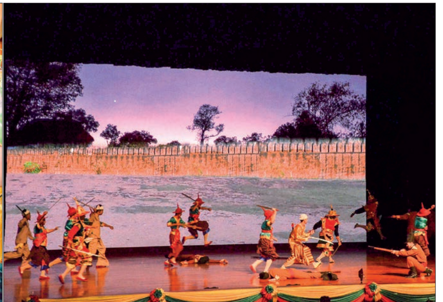
The play performance is in action.