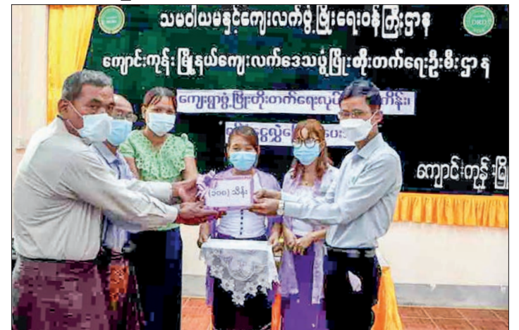
The MoCRD deputy minister hands over K10 million for the village Development Project (VDP) in Panpinchaung village.

PANPINCHAUNG village in Luthanchaung village-tract of Kyaunggon township in Ayeyawady Region received K10 million for socioeconomic development activities. Cooperatives and Rural Development Deputy Minister U Myint Soe together with officials handed over K10 million for the Village Development Project (VDP) in Panpinchaung village during an inspection tour of the Ayeyawady Region yesterday.