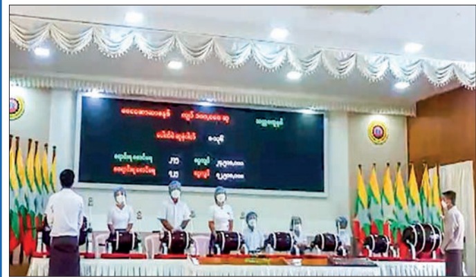
The 42 nd Aung Bar Lay Lottery.

On 1 September, the lottery ticket sales were over K3,000 million, the lottery prize was 70 per cent of the total ticket sales.