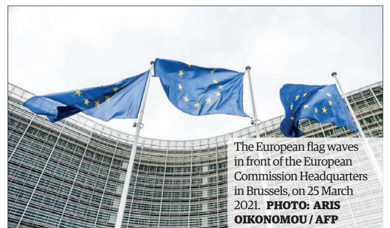
The European flag waves in front of the European Commission Headquarters in Brussels, on 25 March 2021.

Truss angered the EU when she was foreign minister by proposing to scrap parts of the post-Brexit trade deal governing Northern Ireland. —AFP