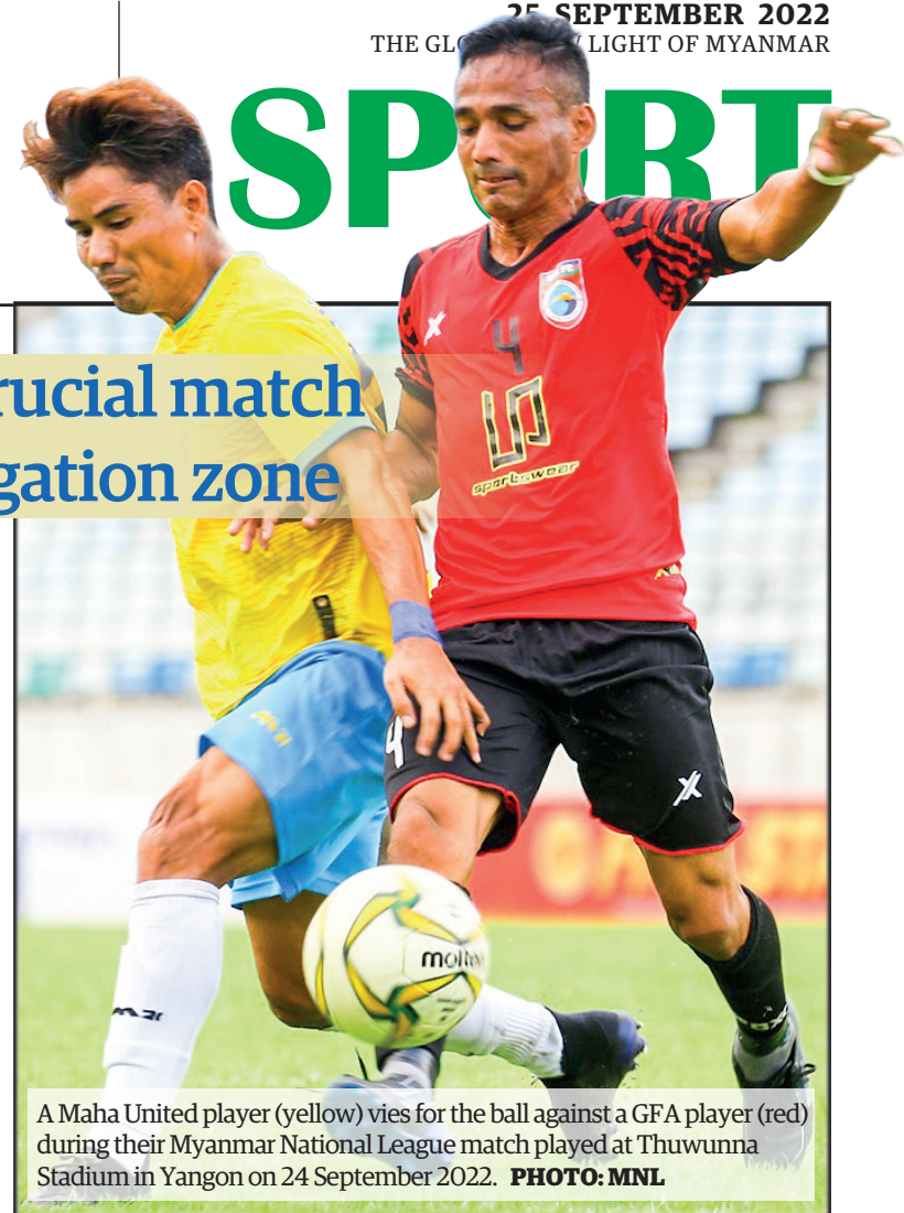
A Maha United player (yellow) vies for the ball against a GFA player (red) during their Myanmar National League match played at Thuwunna Stadium in Yangon on 24 September 2022.