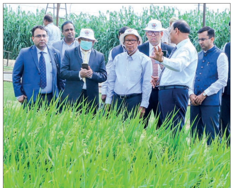
The Myanmar delegation observes the research plantation in India.

At the meeting, the Union minister said inter alia that Myanmar would like to sign a quota agreement between the Ministry of Commerce of Myanmar and the Ministry of Consumer Affairs, Food and Distribution of India under which Myanmar