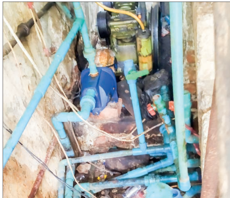
Water pump pipes are seen in an apartment in Lanmadaw Township.

YANGON was being supplied water by the Gyophyu, Phugyi and Ngamoeyeik reservoirs through pipelines. Most apartments in Lanmadaw Township encountered difficulties in filling water for being the last township to get water.