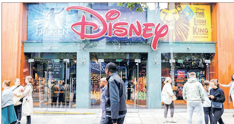
Pedestrians walk past shops closed as a mark of respect following the death of Queen Elizabeth II, on Oxford Street in London on 9 September.

Falling business activity indicates that the economy is likely in re-