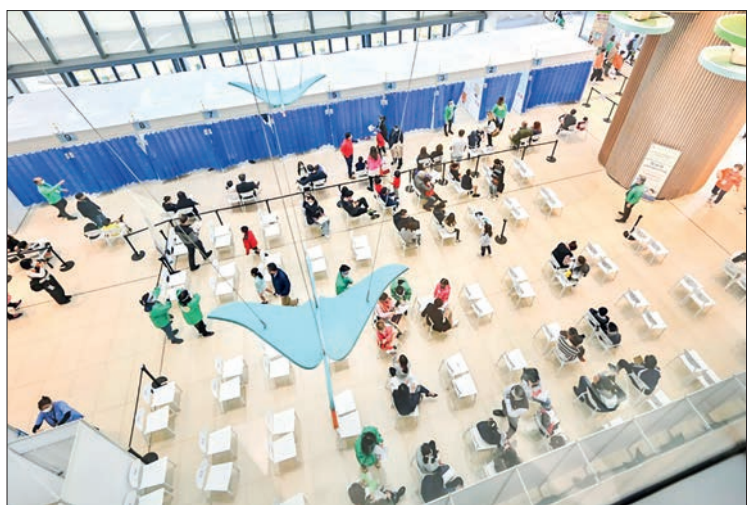
Children wait with their parents to receive COVID-19 vaccines at a community vaccination centre for children in Hong Kong, south China, 16 February 2022.

HONG Kong will scrap the mandatory hotel quarantine requirement for inbound travellers from next week after over two and a half years of stringent COVID-19 control measures, the city's leader said Friday.