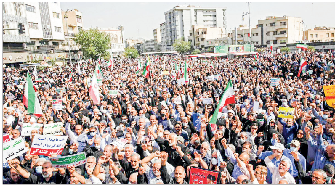
Thousands of people marched through Iran's capital during a pro-government counter-rally Friday.

PROTESTS flared in Iran for an eighth straight night Friday over the death of a young woman arrested by morality police, verified social media posts showed, hours after counter-demonstrations mobilized by authorities.