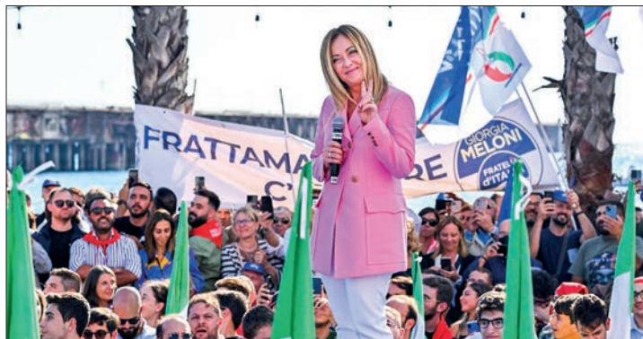
The last polls put Italian far-right leader Giorgia Meloni in the lead. Giorgia Meloni, leader of Italian far-right party Fratelli d'Italia (Brothers of Italy), flashes the victory sign as she delivers a speech at the Arenile di Bagnoli beachfront in Naples on Friday, closing her party's campaign for the 25 September general election.

"I'm a patriot... we are a party of the south, as well as of the nation," Meloni declared, vowing to work to help a region that has long suffered higher unemployment and poverty than elsewhere. The last official polls published two weeks ago gave Meloni and her right-wing alliance, including Matteo Salvini's League and Silvio Berlusconi's Forza Italia, an almost unstoppable lead.—AFP