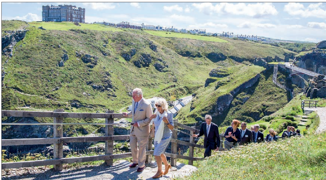
Tintagel Castle in Cornwall was visited by Britain's new king Charles III and his wife Camilla in 2020.