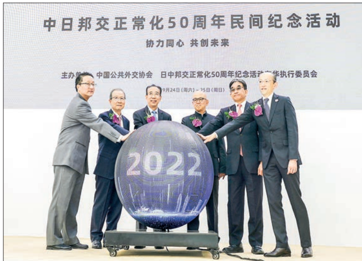
Japanese Ambassador to China Hideo Tarumi (2 nd from R) is pictured at an event held in Beijing on 24 September 2022, ahead of the 50 th anniversary of the normalization of ties between Japan and China on 29 September.

As part of measures to prevent the spread of COVID-19, the event at a Beijing shopping mall where 70,000 people visit daily adopted pre-recorded video footage and online exchanges, providing chances for visitors to get glimpses of Japan while the pandemic-induced travel restrictions remain in place.