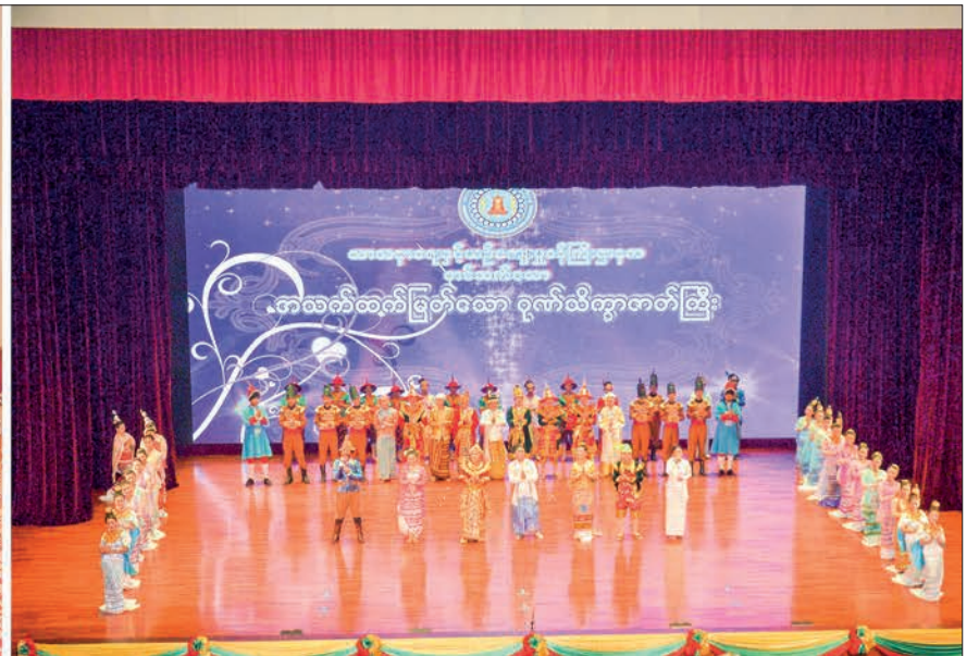
State Administration Council Chairman Prime Minister Senior General Min Aung Hlaing views the play "The Prestige Nobler than the Life" in Nay Pyi Taw on 24 September 2022.

STATE Administration Council Chairman Prime Minister Senior General Min Aung Hlaing attended the premiere of the play titled, "The Prestige Nobler than the Life" which was first performed publicly at the theatre hall of Zeyathiri Beikman yesterday evening.