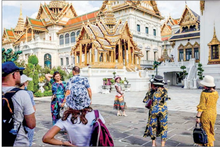
The lifting of controls have helped Thailand to lure back foreign visitors in large numbers in recent months.

"The spreading will be gradually eased into a level of influenza in the future, only a small wave will be seen in the