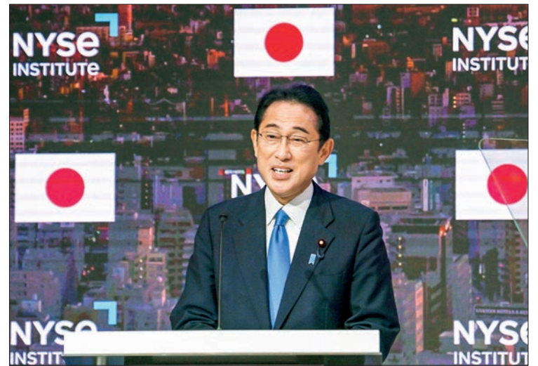
Japanese Prime Minister Fumio Kishida delivers a speech at the New York Stock Exchange in New York on 22 September 2022.

powerful as that of the Los Angeles Angels' two-way baseball star Shohei Ohtani from Japan as it could help the Japanese economy to achieve "growth and sustainability". Under the incentive system known as NISA, holders of designated accounts at financial institutions are exempted from taxes to be levied on proceeds from investments up to 2042. NISA stands for Nippon Individual Savings Account.—Kyodo