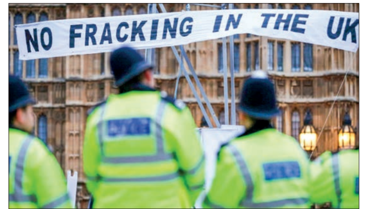
Protestors erected a mock gas fracking rig in front of Britain's Houses of Parliament in 2012.

in 2019 called a halt to fracking — or hydraulic fracturing which is used to release hydrocarbons locked deep underground — due to fears it could trigger earthquakes. The moratorium was imposed under Truss' predecessor Boris Johnson following a series of earth tremors, but the government has switched tack after Russia cut off gas supplies to most of Europe, sending prices soaring.—AFP