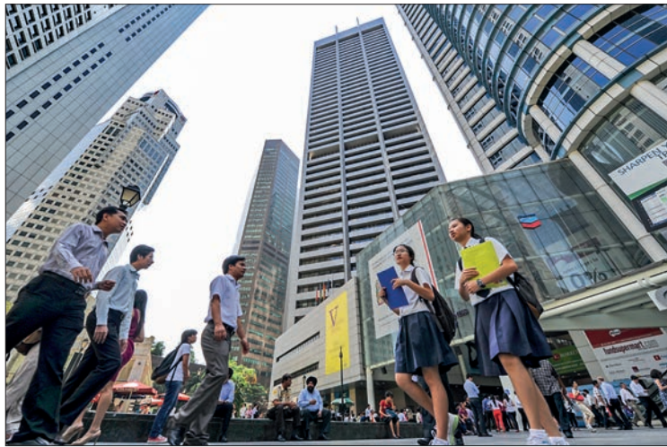
People walk near high rise building of Raffles place in Singapore.

HONG Kong has lost its crown as Asia's premier finance centre to Singapore in a global ranking list where New York and London maintained their number one and two spots.