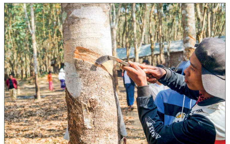
The rubber tapping process is being demonstrated.

Rubber is commonly grown in Mon State and Taninthayi Region. It is cultivated in Yangon and Bago regions and Kayin State. There are over 1.6 million acres of rubber across the country and the production acreage is estimated at only 800,000 acres. —TWA/GNLM