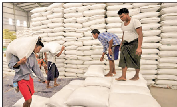
Workers are seen carrying rice bags at a warehouse.