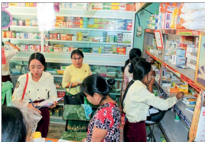
Shoppers are seen in a pharmacy.

FOLLOWING relaxations of the import permit, pharmaceutical and medical device importing companies can directly apply for the import licence through Myanmar Tradenet 2.0 portal, according to the statement released by the Trade Department.