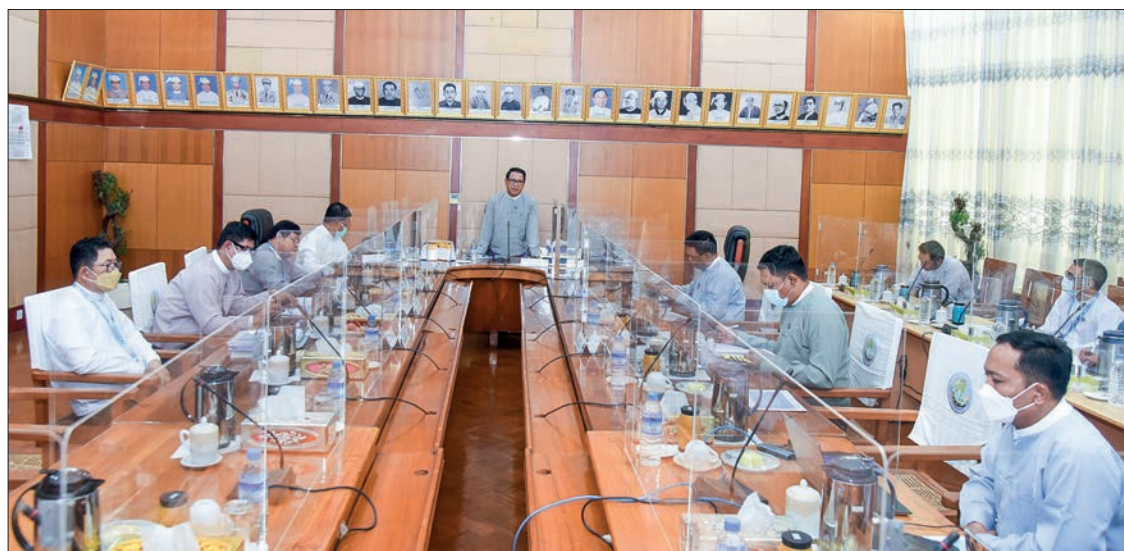
Union Minister for Information U Maung Maung Ohn addresses the presentation session of the MTube video sharing and live streaming platform yesterday.

First, the Union minister said the ministry is making changes upholding the three objectives – to inform, entertain and educate in accordance with the demand of time. In doing so, new MRTV channels are launched and media sectors are also expanded online. The media is essential to all sectors and it needs to be applied properly. The ministry drafted the MRTV application and it was removed from the platform and this destroyed the rights of people to receive