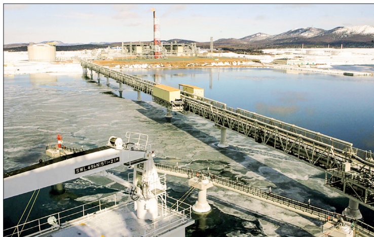
File photo taken February 2009 shows pipes extending from a liquefied natural gas terminal (back) in Sakhalin Oblast, Russia, to a carrier ship.

The resource-poor country faced a power crunch during a summer heatwave this year, and