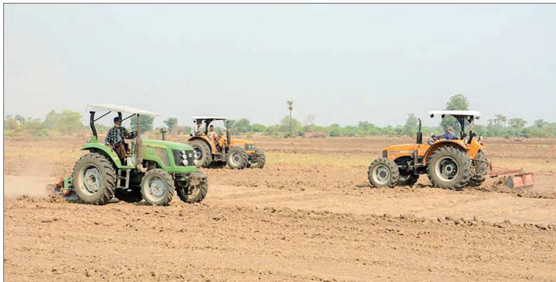
Starting from 1 September 2022, those items related to agricultural machinery included in the HS code lines declared by the Ministry of Commerce are exempted from obtaining an import licence.

Among the import items, the price of agricultural inputs such as fertilizers is soaring. Additionally, the price of fuel oil used in agricultural machinery is rocketing as well. — NN/GNLM