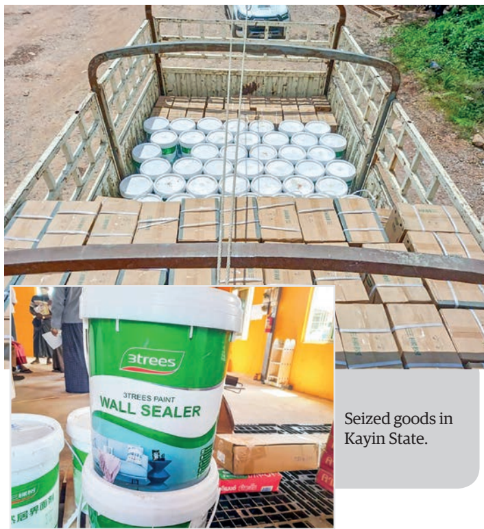
Seized goods in Kayin State.

Afterwards, a combined on-duty team conducted inspections at the Mayanchaung Permanent Checkpoint on 31 August. Officials confiscated K14,939,000 worth of edible oil