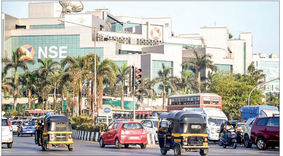
Commuters drive past the National Stock Exchange (NSE) building in Mumbai.

But Wednesday's result is lower than the 16.2 per cent forecast by India's central bank, and other economists expect headwinds to buffet the economy and dampen growth into the next year.