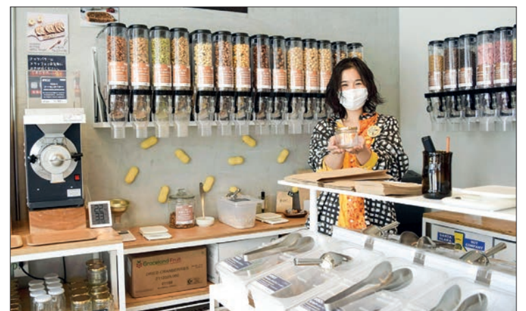
Photo taken in June 2022 shows Poco Mucho, a specialty shop for sales by volume in Fukuoka, southwestern Japan. PHOTO: KYODO

Specialty store Poco Mucho, which opened in the city of Fukuoka, southwest Japan in April 2020, sells some 200 different foodstuffs and daily necessities by weight, such as smoked pistachios at 80 yen per 10 grammes and peanut butter at 55 yen for the same amount. Shoppers pay for products after they are weighed in a store-provided paper bag or bottle. Customers receive a three per cent discount if they bring their own shopping bags or containers.—Kyodo