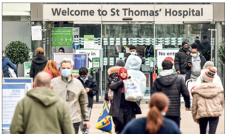
People, some wearing face coverings to combat the spread of the coronavirus, arrive at and depart from St Thomas' hospital in central London on 23 December 2021.

UK hospitals bosses on Thursday warned that patient care may have to be cut to offset huge increases in energy bills over the winter months.