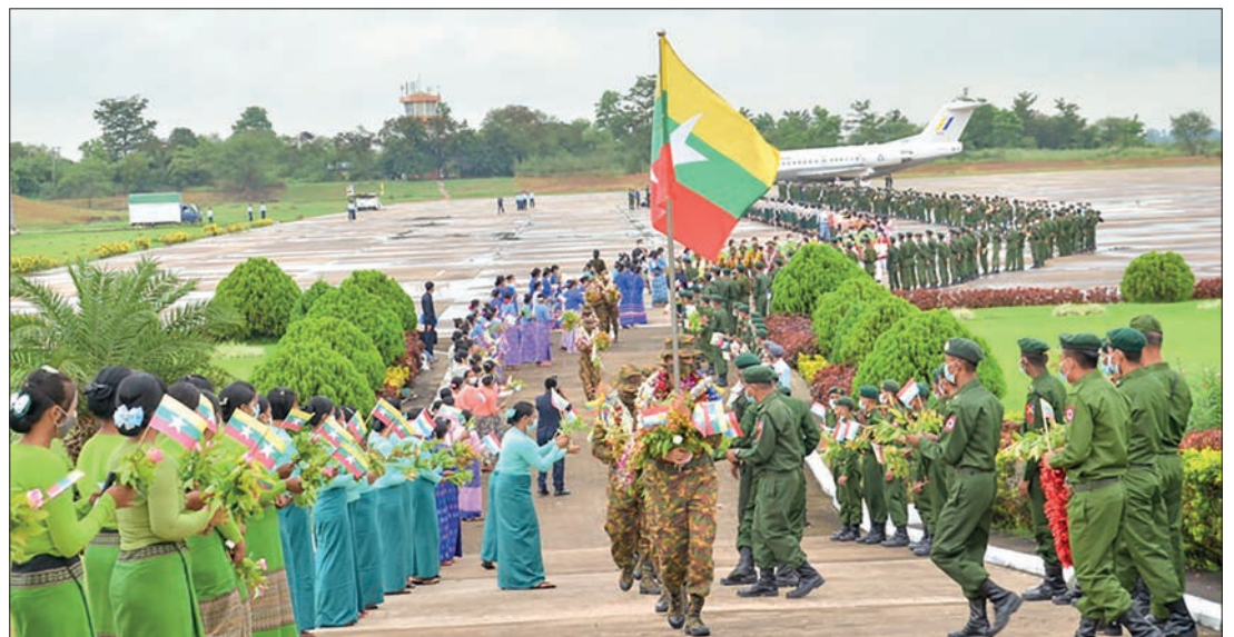
Myanmar Tatmadaw delegation which participated in the International Army Games-2022 in the Russian Federation are welcomed back on their arrival yesterday.