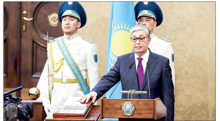
It came after career diplomat Tokayev, 69, was hand-picked in 2019 by Nursultan Nazarbayev, who had ruled Kazakhstan for close to three decades, to replace him in the presidency. Kazakhstan's Senate chairman Kassym-Jomart Tokayev takes the oath as Kazakh interim president during a ceremony in Astana, 20 March 2019.

Tokayev said he would move the parliamentary vote forward after constitutional changes earlier this year set "completely new standards for a political system with fair and open rules of the game".