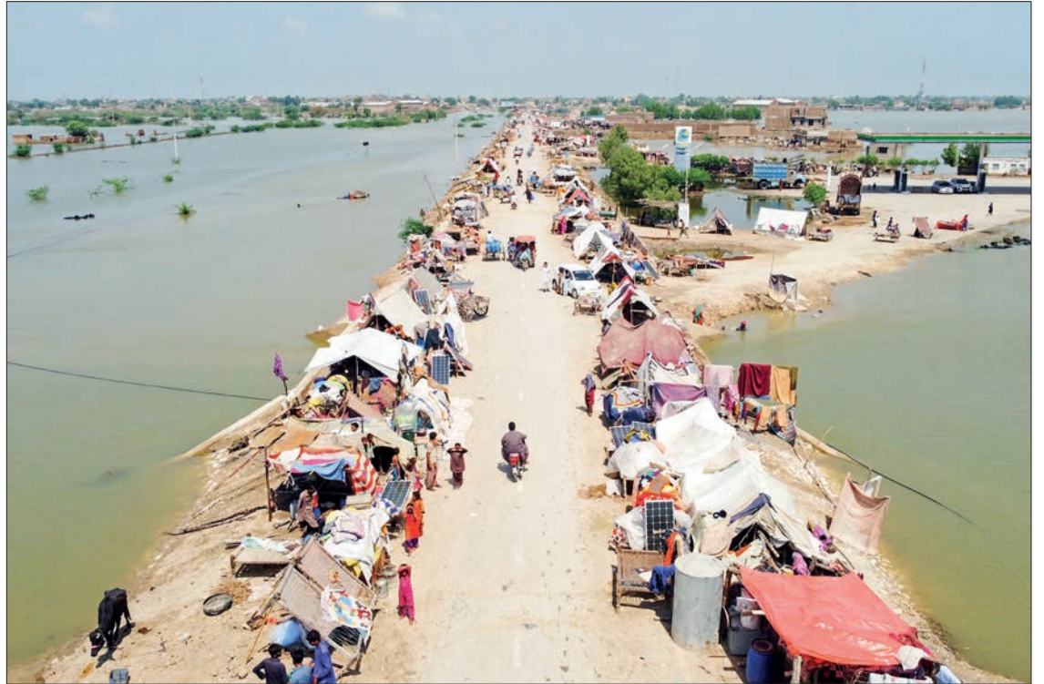
Pakistan has estimated the cost of rebuilding at around $10 billion.

The human and economic impact is already staggering and "this is an ongoing disaster; the rains are still going on", he told AFP. Countries like Pakistan that have contributed the least to global warming are often battered by the worst impacts, observers say.— AFP