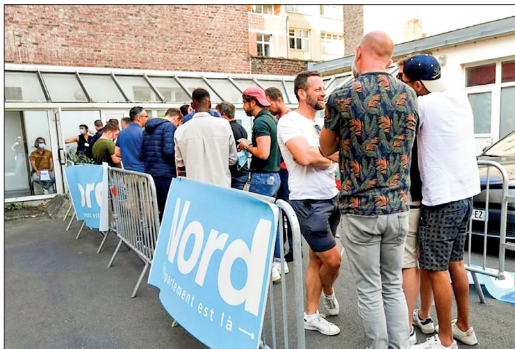
In this file photo taken on 6 August 2022, people line up to receive the monkeypox vaccine in Lille, northern France.

In the 53 countries that make up the WHO Europe region, which includes Russia and countries in Central Asia, more than 22,000 monkeypox cases have been registered across 43 countries, accounting for more than a third of cases worldwide.