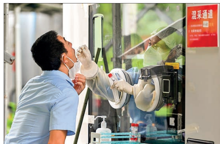
A medical worker takes a swab sample from a man for nucleic acid test in Sanya, south China's Hainan Province, 26 August 2022.

Testing also shows that CIPS can inhibit viral entry and infection in cells, organoids and mice, and effectively relieve lung inflammation in mice caused by SARS-CoV-2 infection.—Xinhua