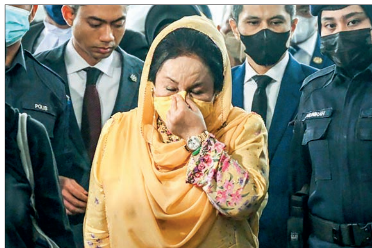
Rosmah Mansor (C), the wife of jailed former Malaysian PM Najib Razak, has been found guilty of corruption.

Born the only child of two teachers in the country's south, Rosmah rose to become one of Malaysia's most influential people.—AFP