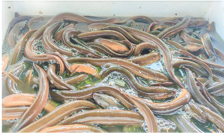
The live eels and crabs from Rakhine State, Ayeyawady Region, Yangon Region and Bago Region are exported to China through the Muse border trade zone.

The country exports about 20 tonnes of eels and crabs per day through official border trade camps. If 100 visses are exported from Yangon, it leaves about 90 visses in Muse. Therefore, the water exchange process