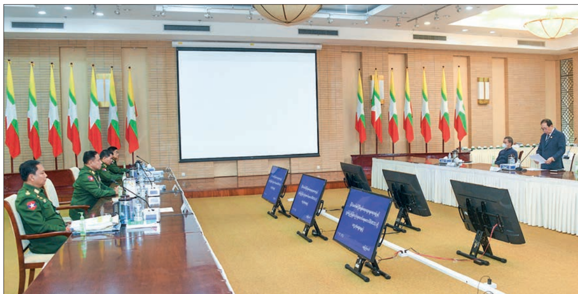
The third-day meeting between the State Peace Talks Team and the Restoration Council of Shan State-RCSS delegation is in progress yesterday.