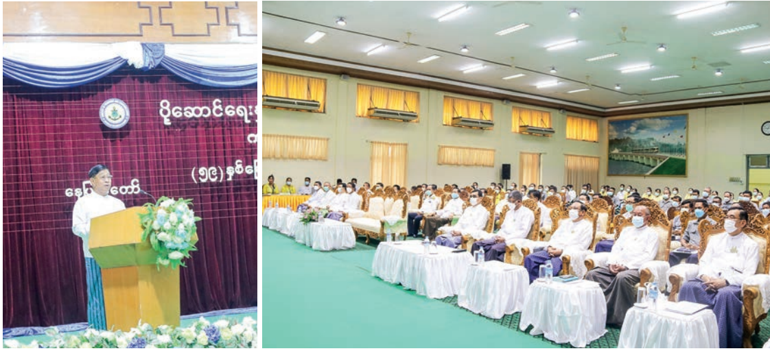
MoTC Union Minister Admiral Tin Aung San addresses the 59 th Anniversary of Road Transport event yesterday.

REVIEWING the strengths and weaknesses experienced through many years, staff are assignments unhesitatingly required to carry out their in accordance with the motto