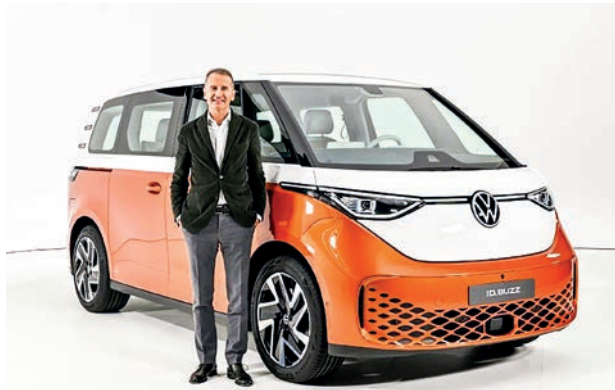
Herbert Diess stirred up discontent with his uncompromising push as CEO to electrify the group.

a good job strategically and technologically”, Blume said at a conference Thursday. “We will keep up the current pace and where