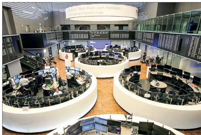
Frankfurt, London and Paris stocks dropped as data showed eurozone inflation hit 9.1 per cent in August on surging fuel prices.

The ECB is set to lift borrowing costs next week, having increased them in July for the first time in a decade to help