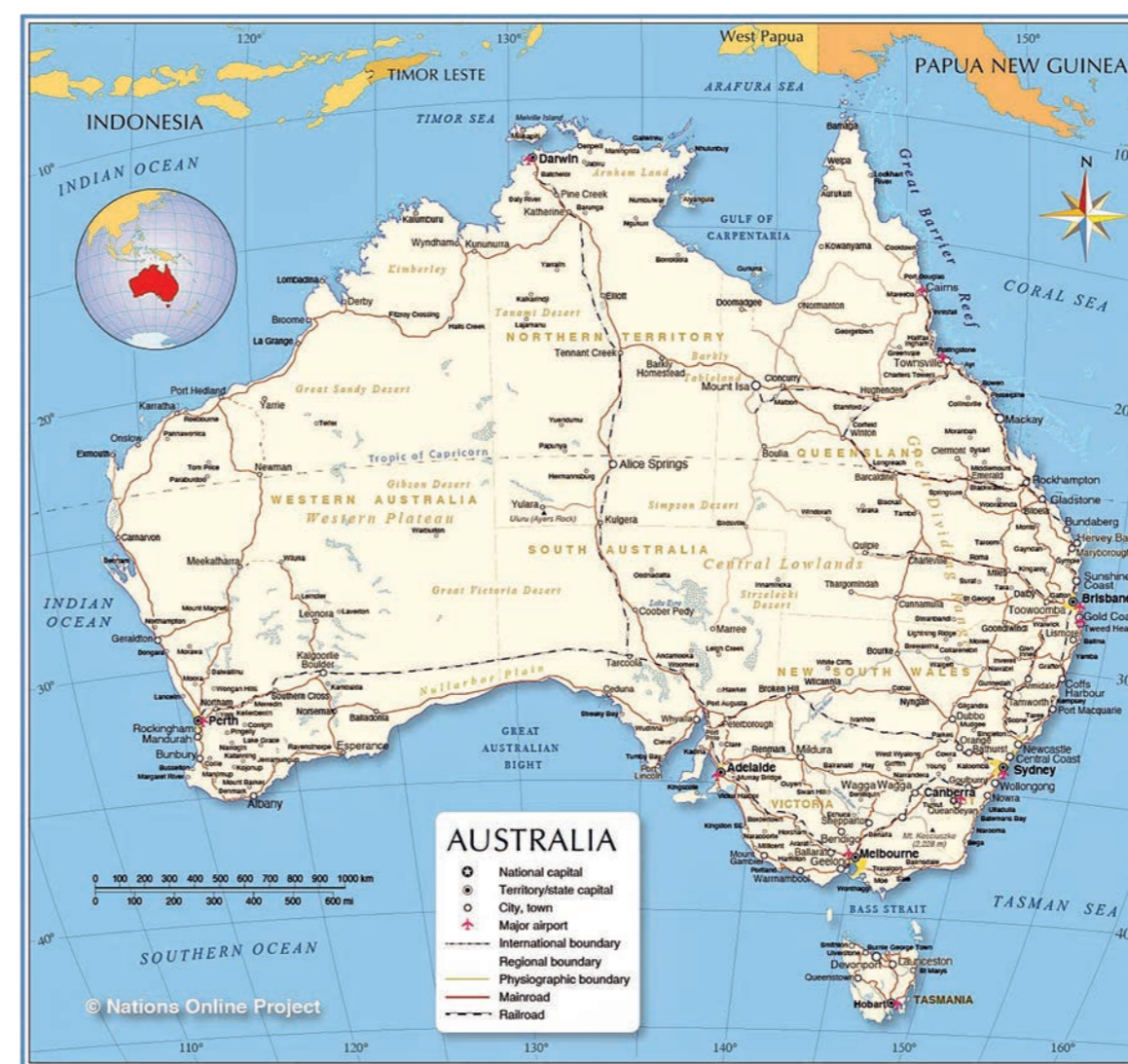
Map of Australia.

In Australia, English is the de facto national language. Australian English is a language with a distinctive accent and lexicon and differs slightly from other varieties of English in grammar and spelling. English is the only language spoken in the home about 72.7 per cent of the population. Other com-