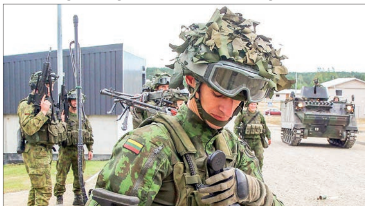
Baltic states, the north-eastern region of Europe containing the countries of Estonia, Latvia, and Lithuania, on the eastern shores of the Baltic Sea. NATO has sent extra forces to train with Lithuania's small army in 2017.

The move backed by many EU members including Germany would make EU visas more costly for Russian travellers and lift a deadline on visa issuance times.—AFP