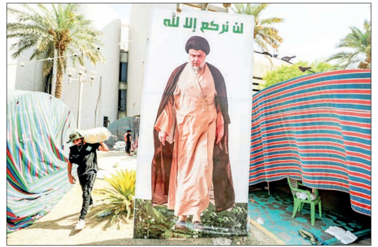
A Sadr supporter carries away items as they leave Baghdad's Green Zone.

Sadr's rivals in the pro-Iran Coordination Framework want a new head of government to be appointed before any new elections are held.—AFP