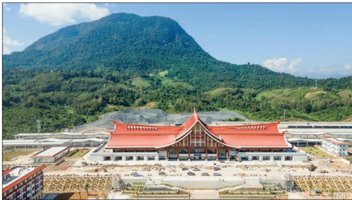
Aerial photo taken on 22 November 2021 shows the Luang Prabang station along the China-Laos Railway in Luang Prabang, Laos. Luang Prabang, the ancient capital of Luang Prabang Province in northern Laos, lies in a valley at the confluence of the Mekong and Nam Khan rivers. Inhabited for thousands of years, it was the royal capital of the country until 1975.

The full operation of the China-Laos Railway, and the draws of scenic Vangvieng, the Luang Prabang World Heritage Site and the low value of the kip are among the main attractions for visitors from neighbouring countries. —Xinhua