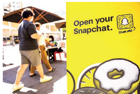
People walk past Snap Inc. Snapchat signage displayed in downtown Los Angeles, California on 2 October 2021.

“We must now face the consequences of our lower revenue growth and adapt to the market environment,” Snap CEO Evan Spiegel said in a note to employees Wednesday announcing the decision “to reduce the size of our team by approximately 20 per cent.”—AFP