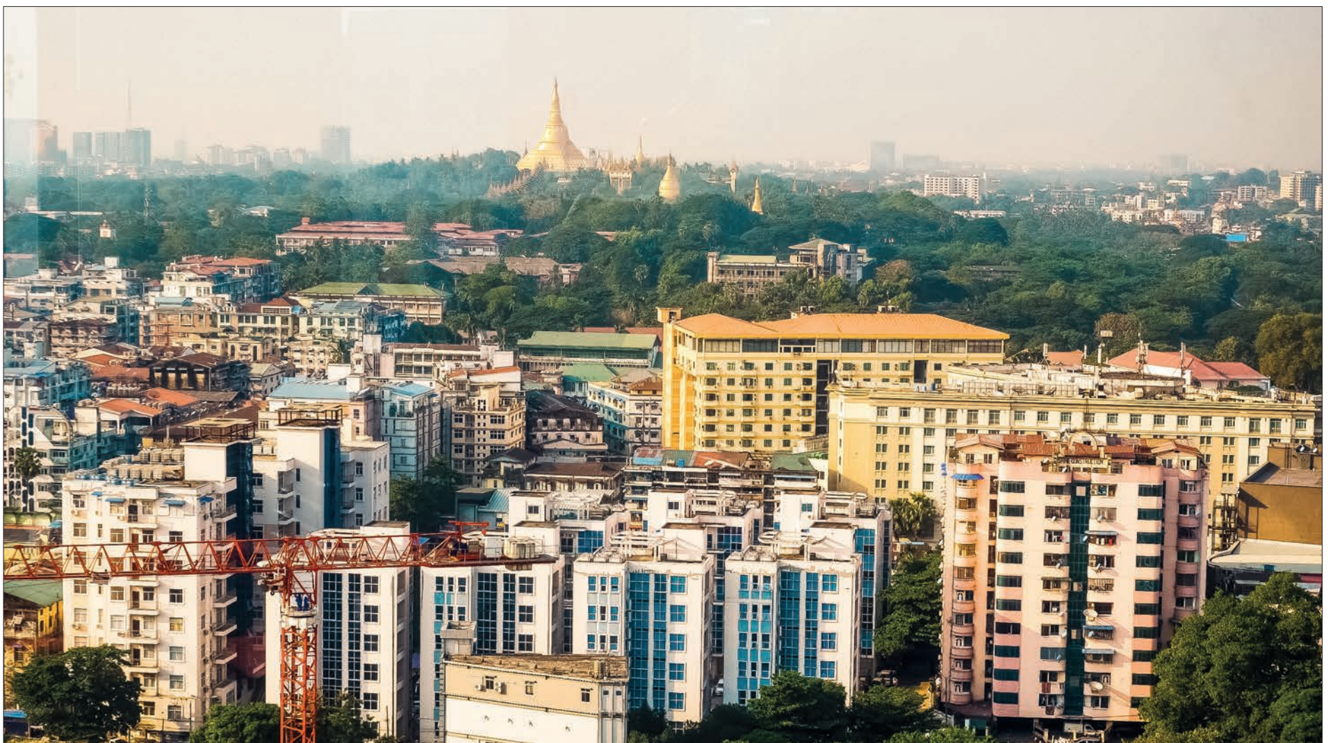
The photo shows a landscape view of Yangon at the background of the Shwedagon Pagoda.