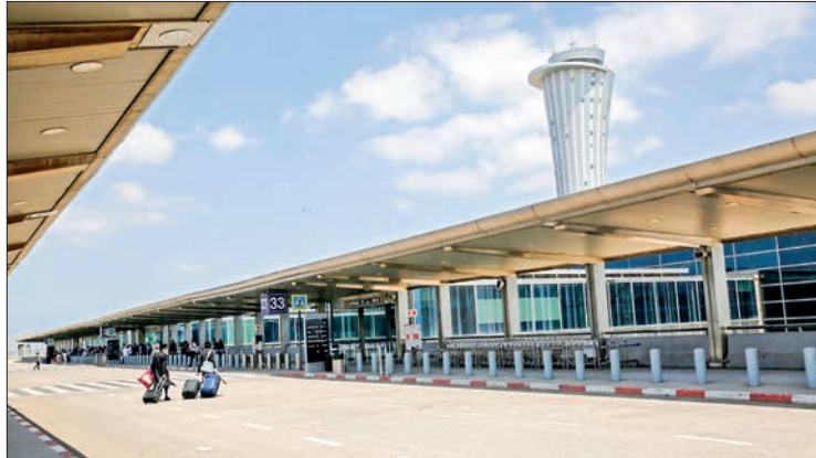
Israel's Ben Gurion International Airport near Tel Aviv.

In most cases foreigners will no longer be able to arrive via