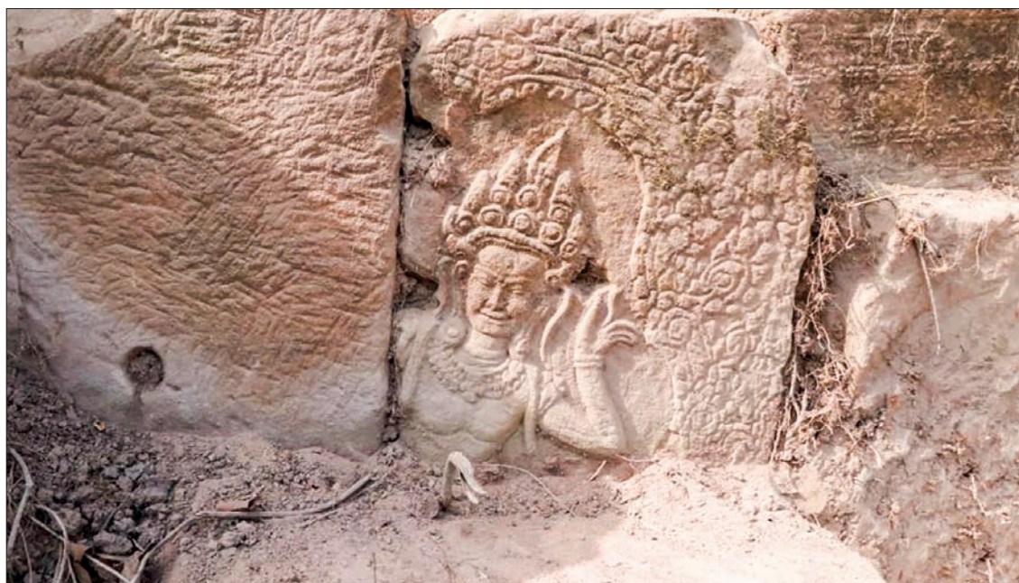
Undated photo shows an Apsara carving found recently at the causeway of the Angkor Thom temple's Takav Gate in the Angkor Archaeological Park in Siem Reap province, Cambodia. Archaeologists have discovered pieces of the 12 th century Apsara, or fairy carvings, in the Angkor Archaeological Park, the APSARA National Authority (ANA) said in a statement on 2 May 2022.