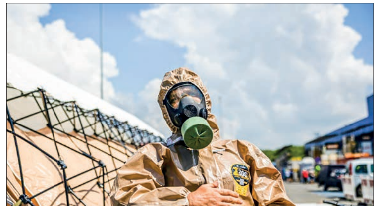
There has been growing alarm over Europe's largest nuclear plant, Zaporizhzhia, which is under Russian control.

"President Erdogan stated that Türkiye can play a facilitator role in the Zaporizhzhia nuclear power plant, as they did in the grain deal," the Turkish presidency said, referring to a grain export agreement signed in July by Kyiv and Moscow with the United Nations and Türkiye as guarantors.