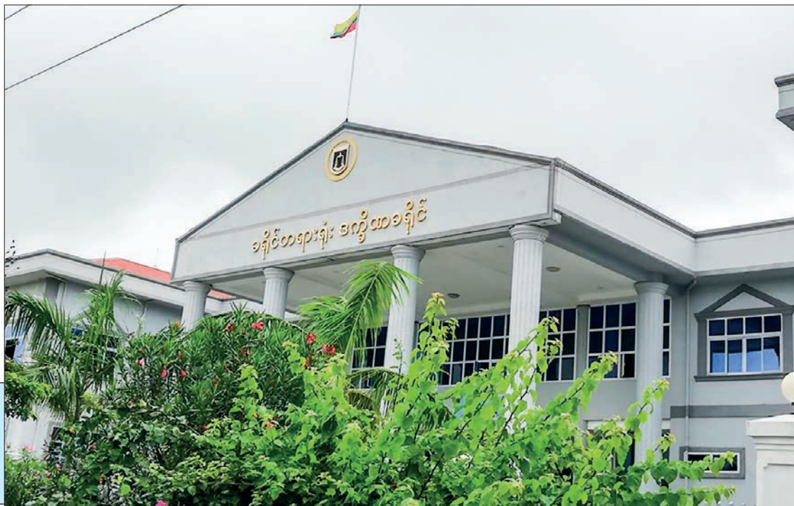
Photo shows Dekkhina District Court in Nay Pyi Taw.

With the approval of the Union Government Meeting No 5/2022 held on 29 July 2022, the organizational setups of the District Courts were confirmed in order to carry out judicial activities in the districts. —TWA/GNLM