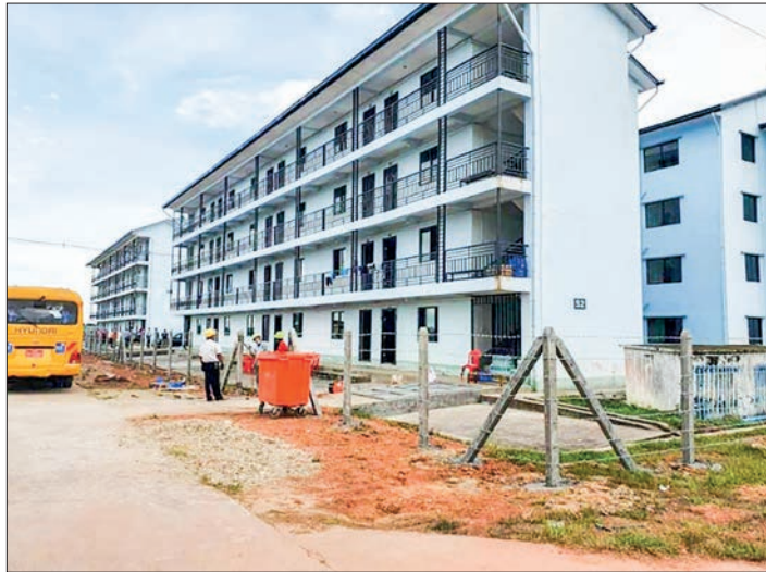
Yoma Yeiktha treatment centre in Dagon Myothit (Seikkan) Township in 2020.

The centre plans to reopen three treatment buildings where sanitation and maintenance of the buildings and oxygen plant are being carried out. The centre was used as healthcare service centre for suspect patients and approved ones in 2020 when the Covid-19 pandemic broke out.