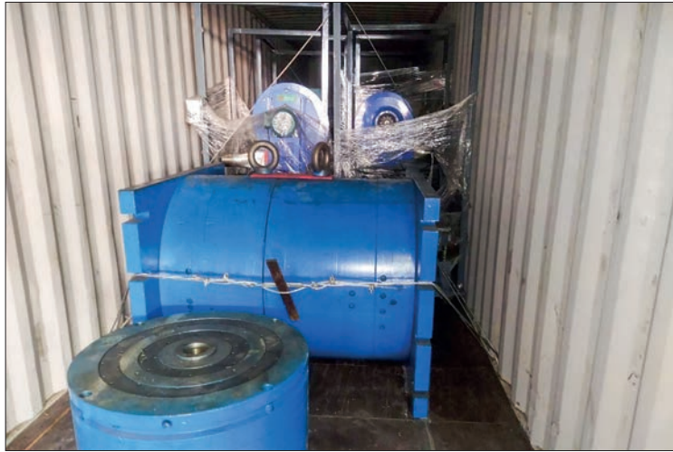
Undeclared Industrial materials seized at Myanmar industrial port Container Inspection Camp on 3 September.

Similarly, a combined team under the supervision of the Anti-Illegal trade task force of