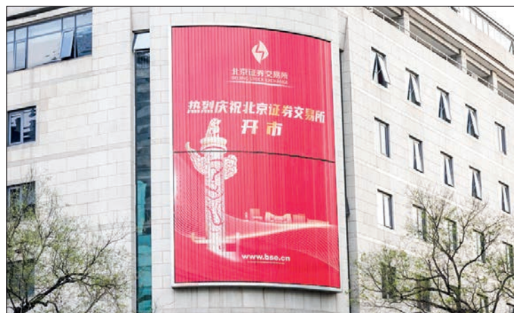
Photo taken on 15 November 2021 shows an exterior view of the office building of the Beijing Stock Exchange, in Beijing, capital of China.

THE Beijing Stock Exchange on Friday said it would launch its first benchmark index, a further