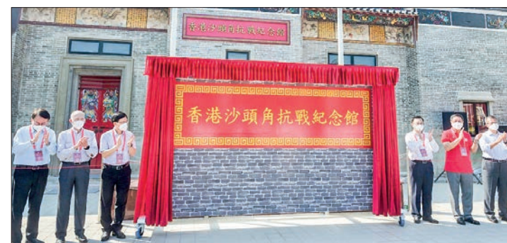
John Lee (fourth left), Chief Executive of the Hong Kong Special Administrative Region, presides over the opening ceremony of a new memorial hall on the history of the Chinese People's War of Resistance Against Japanese Aggression in Hong Kong on 3 September 2022.

Lee also said that he hopes the memorial hall will write a new chapter for patriotic education in Hong Kong. —Xinhua