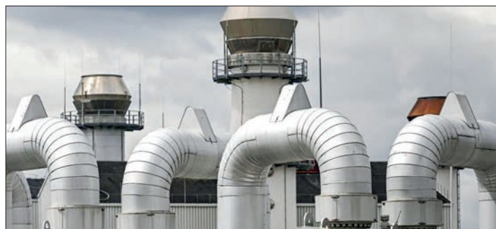
In this file photo taken on July 15, pipes and pressure gauges for gas lines are pictured at Open Grid Europe (OGE), one of Europe's largest gas transmission system operators, in Werne, western Germany.

He added that the increase in gas and electricity prices is "a catastrophe" for EU citizens, families, households, and businesses. —ANI