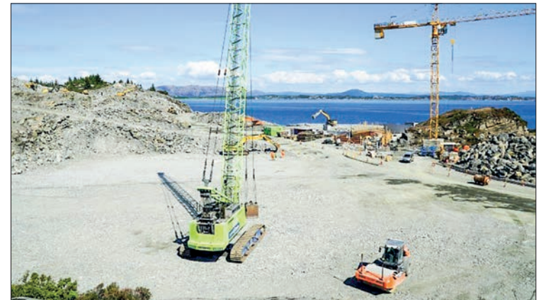
The future terminal in Oygarden is to pump liquefied carbon dioxide into cavities deep below the seabed.

"It is the world's first open-access transport and storage infrastructure, allowing any