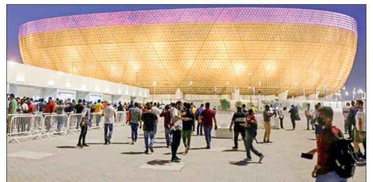
People arrive at the Lusail Stadium on the outskirts of Qatar's capital Doha on 2 September 2022 ahead of the orientation event for the FIFA World Cup Qatar 2022 Volunteers Programme.

Qatar has predicted more than one million visitors for the