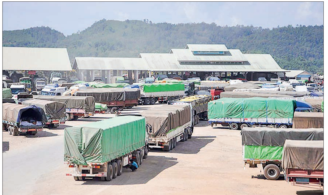
Muse 105 th -mile trade zone.

Compared to the operation of the previous week, the export value increased by $0.543 million and the import value decreased by $0.143 million, so the trade vol-