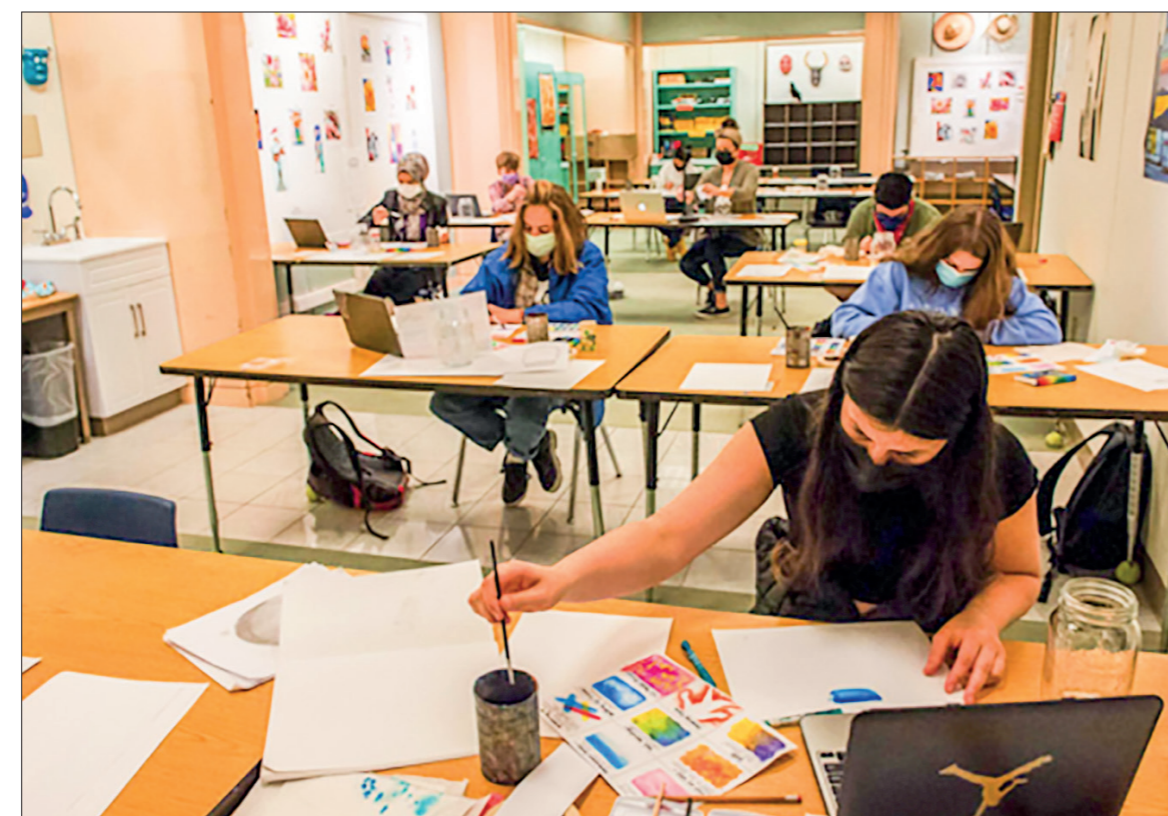
High school students learn art in a room at a closed Macy's department store in Burlington, Vermont, on 30 March 2021.

M ore than 30 children in the United States have tested positive for monkeypox, according to local media citing officials.