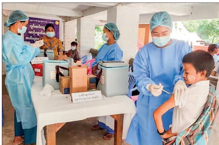
A student in Mandalay Region gets COVID-19 vaccine shot yesterday.

On 3 and 4 September, doctors and nurses from public hospitals, medical teams from the Tatmadaw, relevant healthcare workers in collaboration with