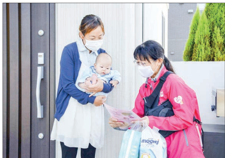
A female staffer (R) delivers free diapers to a household with a baby in October 2020 in the western Japan city of Akashi, Hyogo Prefecture, under a program to support childrearing.

THE number of births recorded in Japan between January