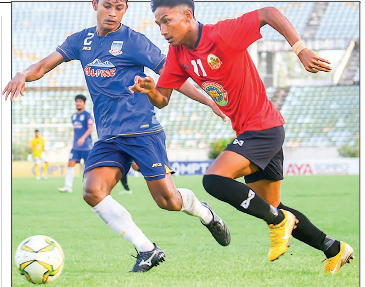
Yadanabon FC player (blue) vies for the ball against Rakhine United player during their Myanmar National League Week-10 match at Thuwunna YTC in Yangon on 4 September 2022.