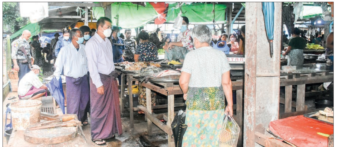
Mayor U Bo Htay visits Hanthawady tax-free market in Kamayut Township on 4 September.

He also visited Hanthawady golf training ground and Hanthawady nursery, and No