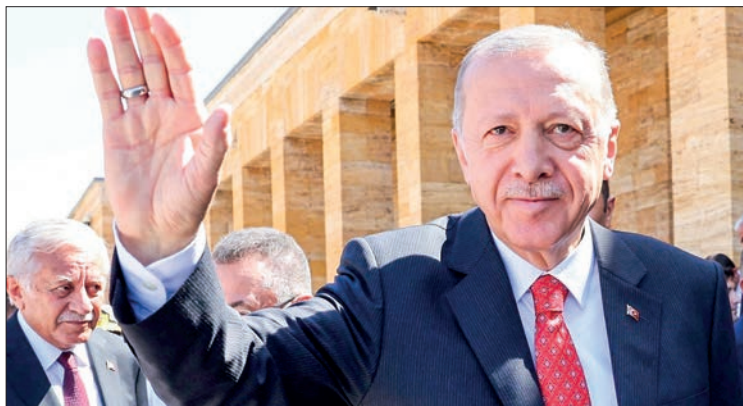
President Recep Tayyip Erdogan on Saturday warned Greece it would pay a "heavy price" if it kept on harassing Turkish fighter jets over the Aegean and hinted at military action.

"Hey Greece, take a look at history. If you go further, you will pay a heavy price," Erdogan told a packed rally in the Black Sea city of Samsun.