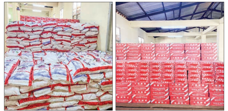
Dali Beer cartons and Loutus flower detergent bags seized at Mehan Checkpoint in Lashio on 2 September.

A combined team under the supervision of Customs Department of Shan State conducted inspection at Yaypu checkpoint on 3 September. They found a Suzuki swift estimated at K6 million near the Yaypu checkpoint and the action was taken under the