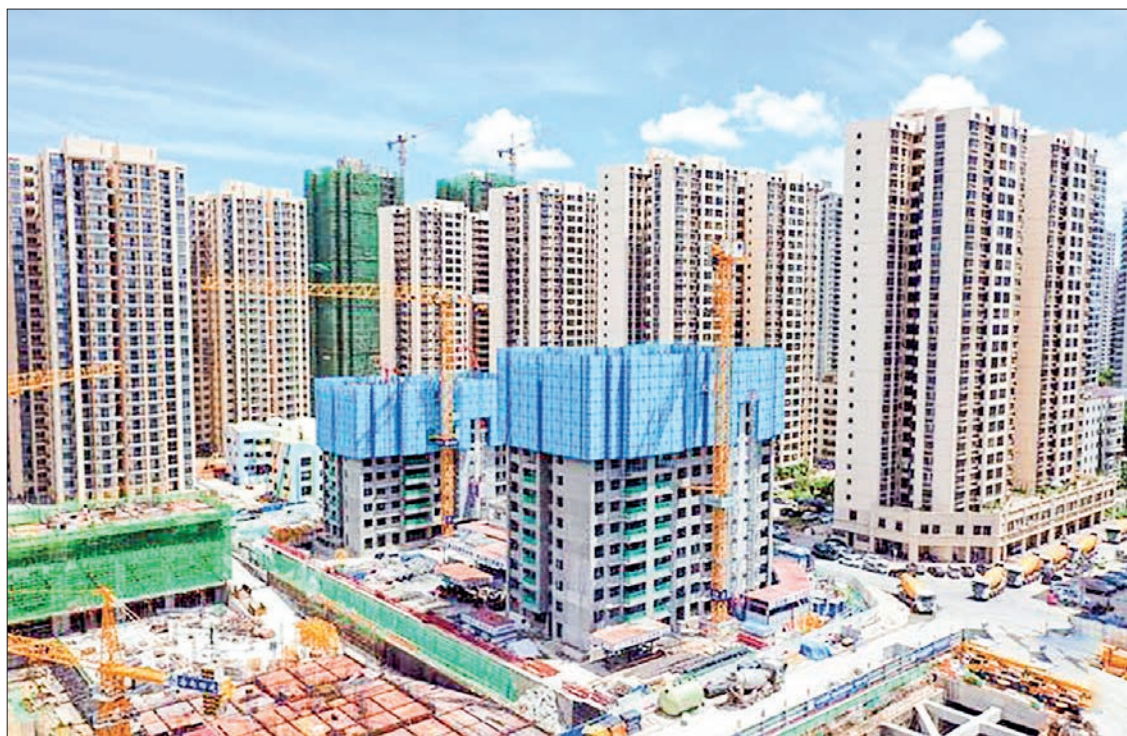
A property construction site in Haikou, Hainan province.

Three of China's biggest airlines — Air China (AIRYY), China Southern Airlines (ZNH), and China Eastern Airlines (CEA) — posted record losses, with a combined loss of 50 billion yuan (USD 7.2 billion) for the first half. They all blamed travel disruptions because of Covid