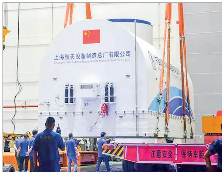
A photo shows the Mengtian space lab, the second lab component of China's Tiangong space station, arriving at the Wenchang Space Launch Center in Hainan province.