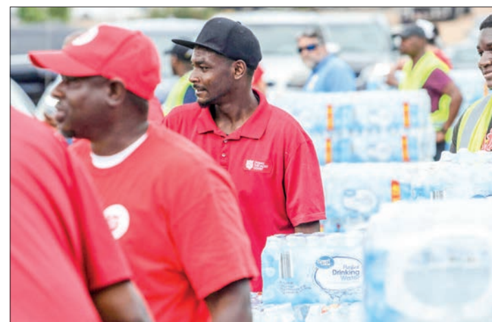
Many residents of Jackson, Mississippi are relying on bottled water.

However, the statement didn't outline plans to restore the water supply to the city's capital, nor did it provide updates on when Jackson's nearly 150,000 residents can expect the shortage to end. Instead, they have been told they'll be without clean water "indefinitely." Some experts are comparing the current situation in Jackson to the 2014 water crisis in Flint, Michigan, during which the city's primarily Black residents didn't have access to clean water due to lead contamination for years, according to the report. —Xinhua