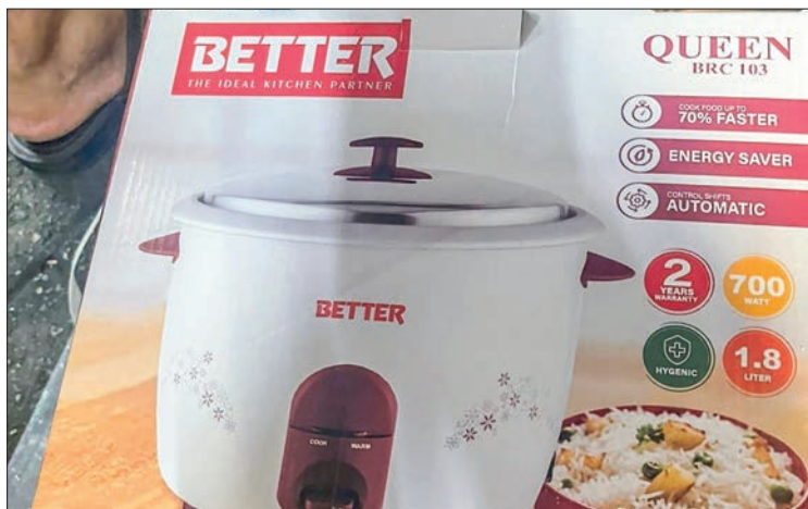
Illegal household goods seized at Asia World Container Inspection Camp on 2 September.

Therefore, nine cases at estimated value of K57,358,776 were taken action from 1 to 3 September, according to the Anti-Illegal Trade Steering Committee. — MNA