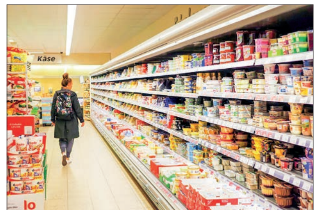
German inflation rose again to 7.9 per cent in August, after falling for two months under the influence of government relief measures. PHOTO: XINHUA

Berlin, for years reliant on Russian energy imports to meet its needs, has been acutely exposed to energy price rises as supplies from Moscow dwindle. —AFP