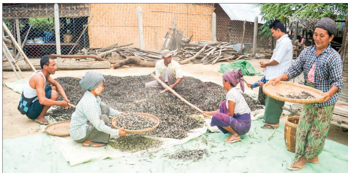
Farming workers are sorting mung bean seeds in winnowing process.

Furthermore, the price hike can also be attributed to the soaring price in Chennai and Mumbai markets at the end of August as