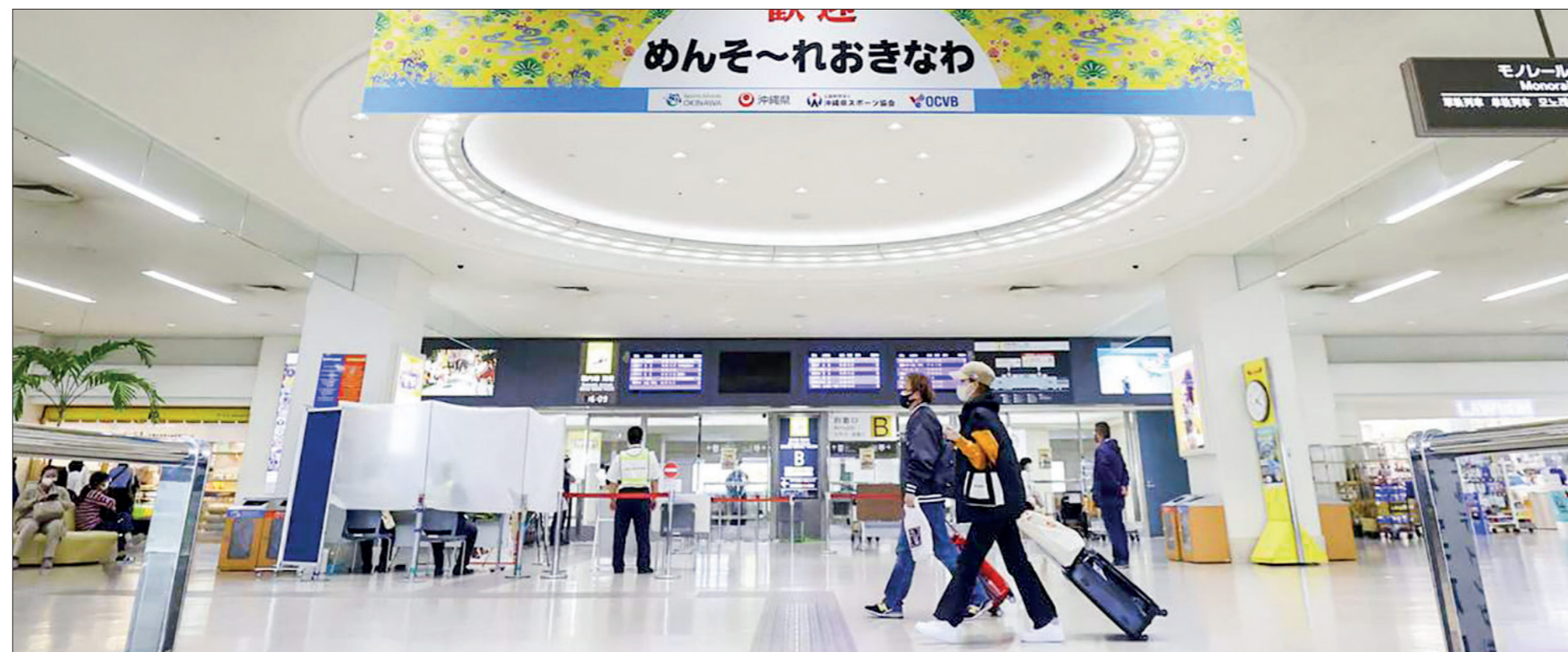
A near-deserted Naha Airport is seen on 8 January amid a coronavirus outbreak in Japan's Okinawa Prefecture.

The scientists modelled the spike proteins in a simpler way – with each spike protein represented by a single sphere on the surface of the ellipsoids.