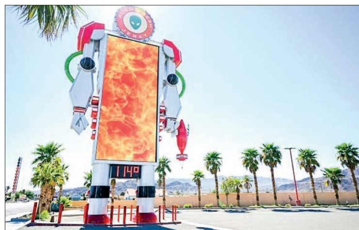
The mercury is rising in California and other parts of the western United States as a heat dome parks itself over the region.

IT is too hot in Nelly Amaya's place when the mercury surges into triple digits, driven by the punishing heat wave gripping the western United States.