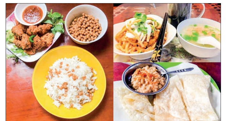
Some dishes of breakfast displayed to attract consumers at higher prices.

Hence, most of the people criticize that as cost of breakfast is some K200 higher on a daily basis depending on rising prices of materials, a family needs to spend K500 to K1,000 more cost on daily breakfast rather than the past.—TWA/GNLM