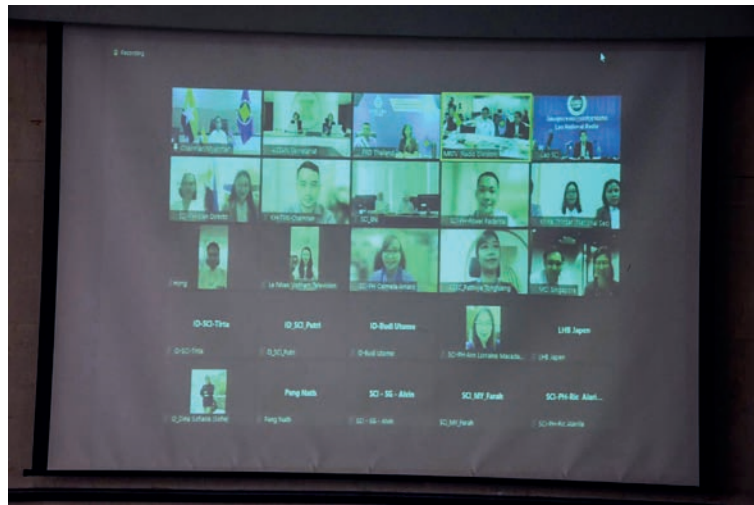
The preparatory meeting for the tenth ASEAN Quiz (Regional Level) is in progress in Nay Pyi Taw yesterday.

At the meeting, the MRTV director-general gave an opening speech. Then, preparatory activities regarding the organizing of the 10 th ASEAN Quiz (Regional Level), contest rules and regulations, technical arrangements concerning questionnaires, preparations and