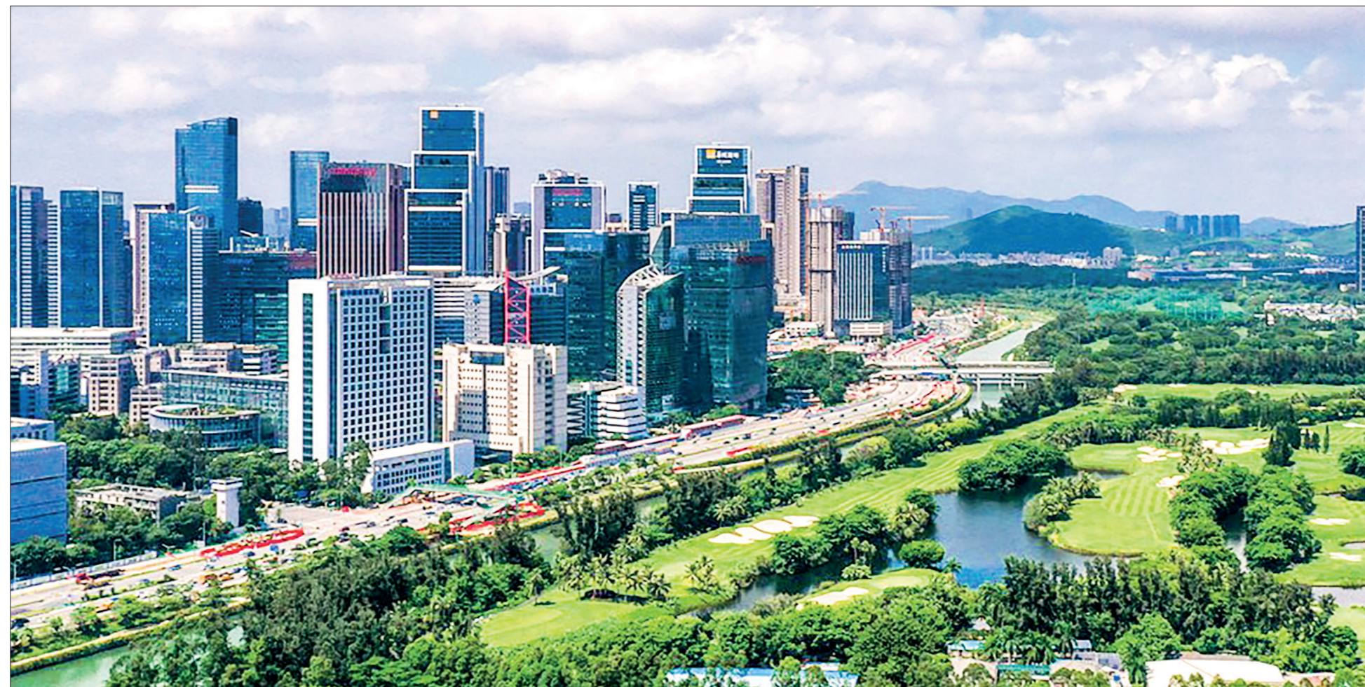
Aerial photo taken on 27 Sept, 2020 shows the science and technology park along the bank of the Dasha River in Nanshan District of Shenzhen, south China's Guangdong Province.

This is evident from China's monumental achievements in poverty alleviation. Over 770 million have been lifted out of poverty since China's reform and opening up began in the late 1970s, and nearly 100 million in the past decade, perhaps the greatest victory over poverty ever in the history of humankind.