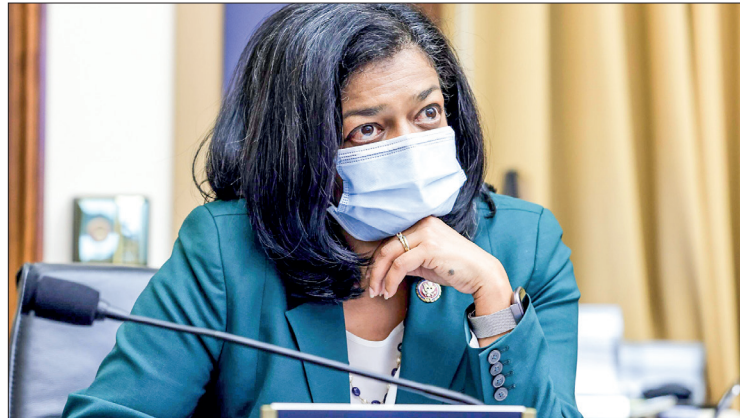
Representative Pramila Jayapal has led an appeal by progressive Democrats for a negotiated end to the Ukraine war.

"But as legislators responsible for the expenditure of tens of billions of US taxpayer dollars in military assistance in the conflict, we believe such involvement in this war also creates a responsibility for the United