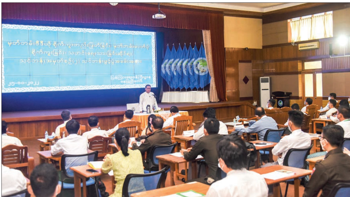
Union Information Minister U Maung Maung Ohn inaugurates the course No 2 in Nay Pyi Taw yesterday.

THE opening ceremony of documentary video editing, documentary photo shooting and news writing course No 2 was held at the Ministry of Information in Nay Pyi Taw yesterday.