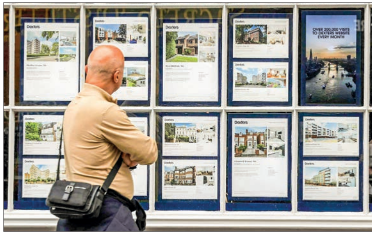
A member of the public looks at residential properties displayed for sale in the window of an estate agents in London on 30 September 2022.