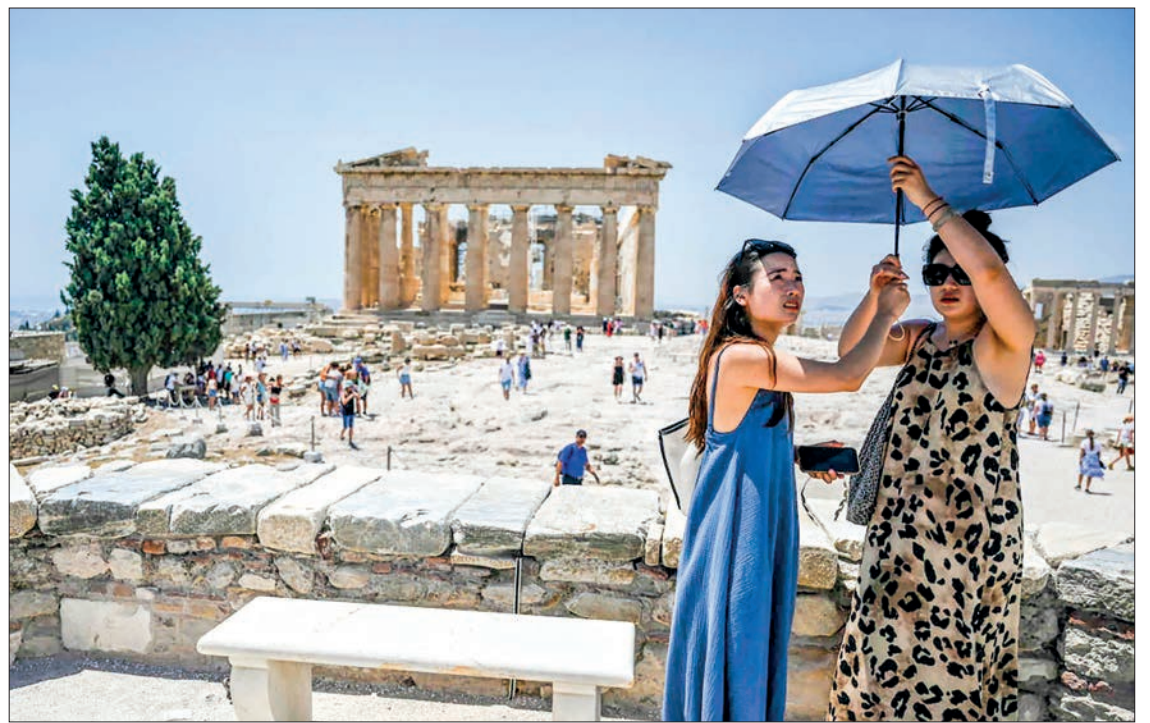
Tourists visiting the Acropolis in Athens in July. PHOTO: LOUISA GOULIAMAKI / AFP

Tourism represents a quarter of Greece's annual economic output, but questions linger over the future of the sector.—AFP