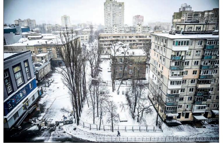
A man walks on the snow-covered pavement in an empty street of the Ukrainian capital, Kyiv, 1 March 2022.

Steinmeier will provide aid to the municipality for its energy infrastructure, he said.—AFP