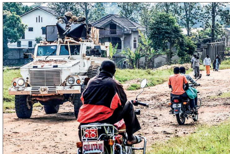
There are more than 120 militias operating in the DRC's troubled east. The UN first deployed an observer mission to the region in 1999.

They demanded heightened security at medical sites, a bonus for working in areas of risk, and the right for security guards to bear arms in dangerous "red zones".—AFP