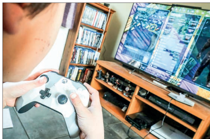
A concept from science fiction imagined by gamers for years is finally here, thanks to the internet and the global pandemic.

They looked at survey answers, cognitive test results, and brain images from around 2,000 nine- and ten-year-olds, who were separated into two groups: those who never played games, and those who played for three hours or more a day.