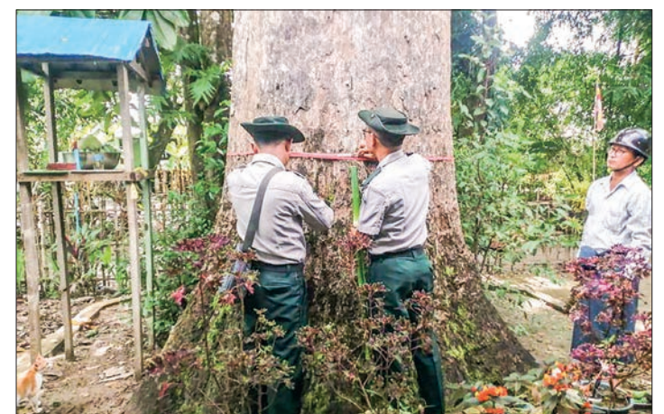
Forest Department officials measure the Kanyin tree.

tus. The Dipterocarpus costatus mostly grows in upper Myanmar and the Dipterocarpus alatus in lower Myanmar, according to the Forest Department.