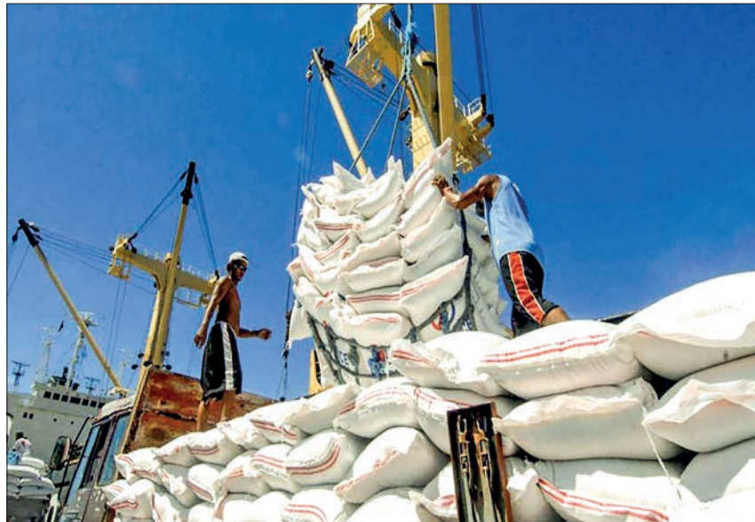
Two workers are handling rice bags to be loaded onto the vessel with the help of a crane system.

Furthermore, Myanmar has signed an agreement to export 250,000 tonnes of white rice to Bangladesh and 21,300 tonnes have been conveyed to Bangladesh so far. According to the Memorandum of Understanding between Myanmar and Bangladesh,