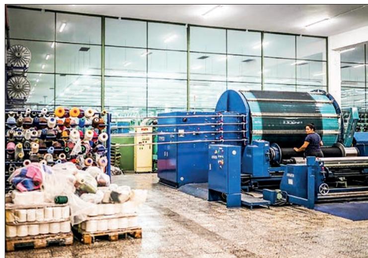
Portuguese textile exports from the Riopelle factory and others hit a record 5.4 billion euros last year.