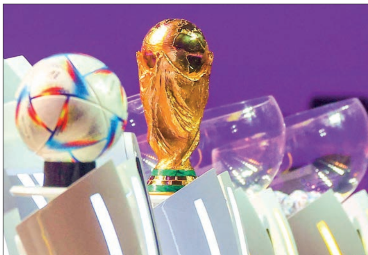
The FIFA World Cup trophy and the 2022 tournament's official ball are displayed on stage during the draw in Doha on Friday.

"But it soon became clear to us that the campaign continues, expands and includes fabrications and double standards, until it reached an amount of ferocity that made many wonder, unfortunately, about the real reasons and motives behind this campaign," he said.—AFP