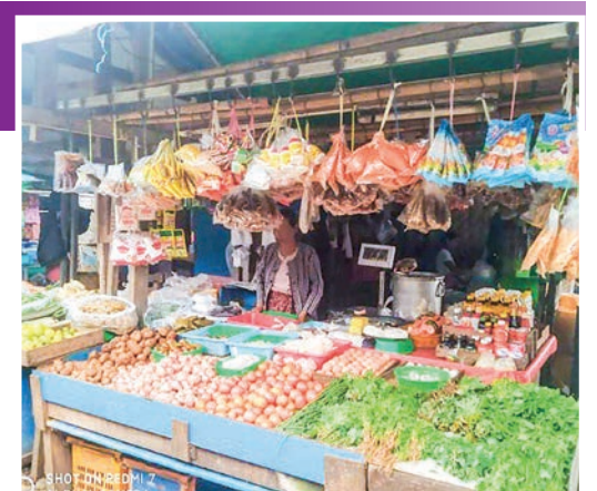
The picture shows a retail shop of kitchen groceries.

On 25 October, the prices of broken rice were K38,000-39,000 per bag. The prices of low-grade rice were K40,000 for new rice, K44,000 for rice cultivated under intercropping system and K46,000 for low-grade short-matured rice (90 days). The wholesale prices of Pawsan rice varieties stood at K85,000-91,000 per bag from the Shwebo