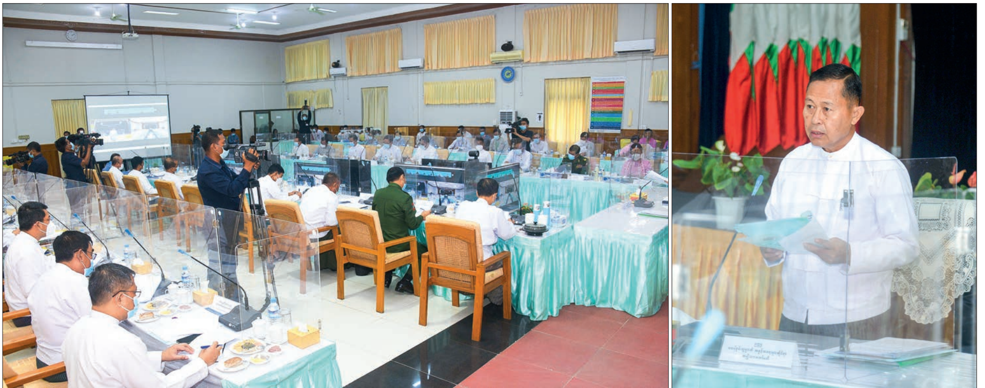
State Administration Council Vice-Chairman Deputy Prime Minister Vice-Senior General Soe Win chairs the National Committee on Rights of Persons with Disabilities meeting 2/2022 in Nay Pyi Taw on 25 October 2022.

T HE 2024 census enumeration must be conducted together with registration of persons with disabilities, said Chairman of the National Committee on Rights of Persons with Disabilities Vice-Chairman of the State Administration