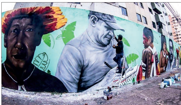
A mural in homage to murdered British journalist Dom Phillips and Brazilian indigenous affairs expert Bruno Pereira, in Belem, Para State, Brazil, in July 2022.

A Brazilian judge has allowed one of the suspects in the murder of British journalist Dom Phillips and Brazilian Indigenous expert Bruno Pereira to be released on bail to house arrest, local media said Monday.