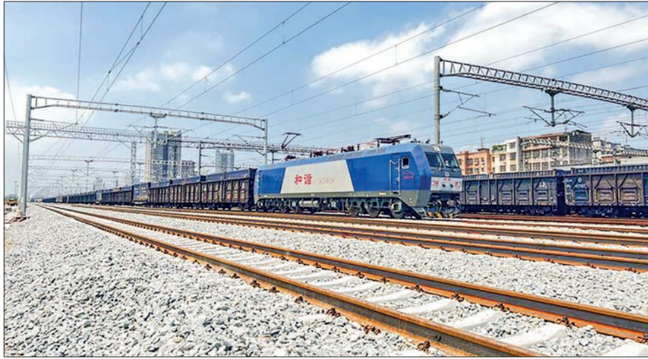
A rail-sea cargo freight loaded with imported goods is to leave Qinzhou railway station in Guangxi Zhuang autonomous region for Chongqing municipality.

A cargo train carrying containers of goods, including paper pulp, quartz sand, and ceramics, arrived in southwest China's Chongqing Municipality on Saturday, marking the completion of the 7,000th rail-sea intermodal train trip running along the New International Land-Sea Trade Corridor this year.