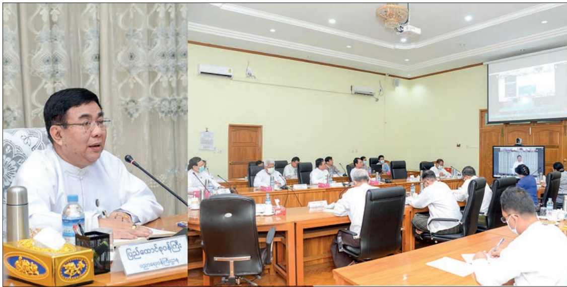
Union Education Minister Dr Nyunt Pe chairs the coordination meeting on the opening of universities and degree colleges yesterday.

UNION Minister for Education Dr Nyunt Pe presided over a coordination meeting on the opening of universities and de-