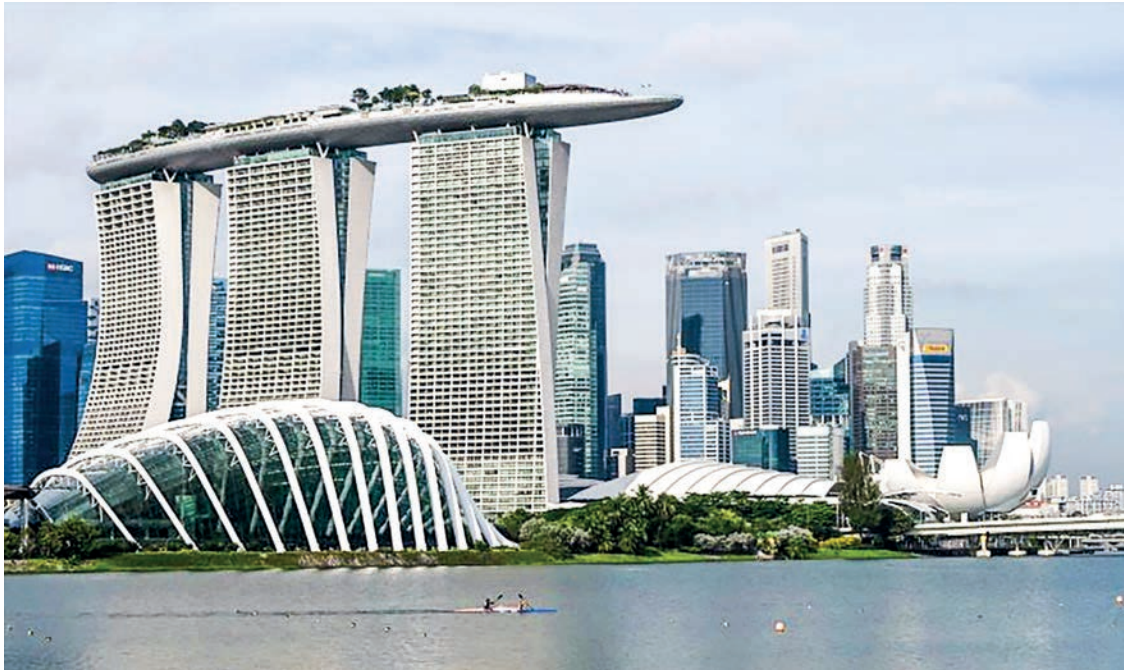
Low-lying Singapore is seen as especially vulnerable to rising sea levels.

SINGAPORE announced Tuesday it aims to achieve carbon neutrality by 2050, giving a firm date for the first time, and will look at using hydrogen as a major power source.