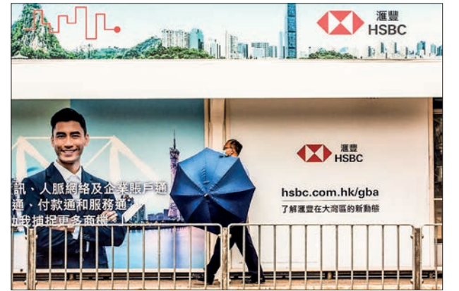
A man walks past an HSBC advertisement outside the bank's main building in Hong Kong on 2 August 2021. PHOTO: AFP

Stripping out the one-off hits, adjusted pre-tax profit jumped 18 per cent to $6.5 billion, beating analyst expectations.—AFP