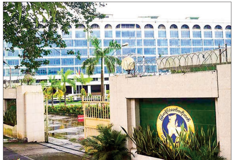
The office building of the Central Bank of Myanmar (Yangon branch).

Under the guidance of the Central Committee on Ensuring Smooth Flow of Trade and Goods, the Monitoring and Steering Committee on Gold and Currency Market was formed on 17 Decem-