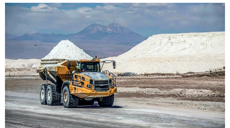
"Lithium triangle" countries are looking towards battery manufacturing as a way to turn the natural bounty into an industrial revolution. PHOTO: AFP

Unlike in Australia — the world's top lithium producer that extracts the metal from rock — in South America it is derived from salars, or salt flats, where saltwater containing the metal is brought from underground briny lakes to the surface to evaporate.—AFP