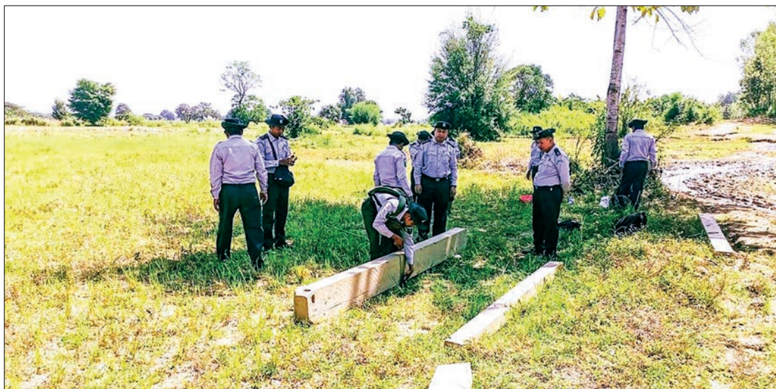
Officials check confiscated illegal timbers.

SUPERVISED by the Anti-Illegal Trade Steering Committee, a combined team led by the Forest Department under the supervision of the Nay Pyi Taw Union Territory Anti-Ille-