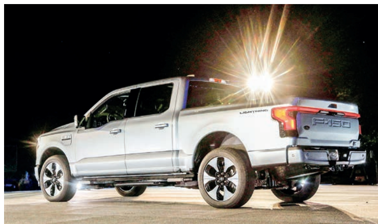
Like other electric vehicles being developed by Detroit, Ford Motor Co.'s F-150 Lightning has been praised as an improvement in addressing climate change, although it requires more energy to recharge than does a smaller vehicle.

the possibility that consumers can have it all: address global