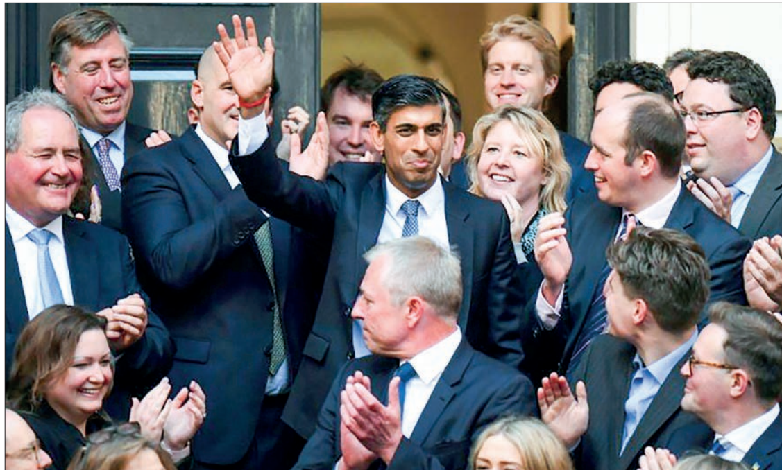
Sunak will be Britain's first PM of colour - but it still helps to have gone to the right school.

But for many UK South Asians, as with the country at large, the arrival of Britain's first prime minister of colour provoked as much debate about his economic credo as about the colour of his skin.—AFP