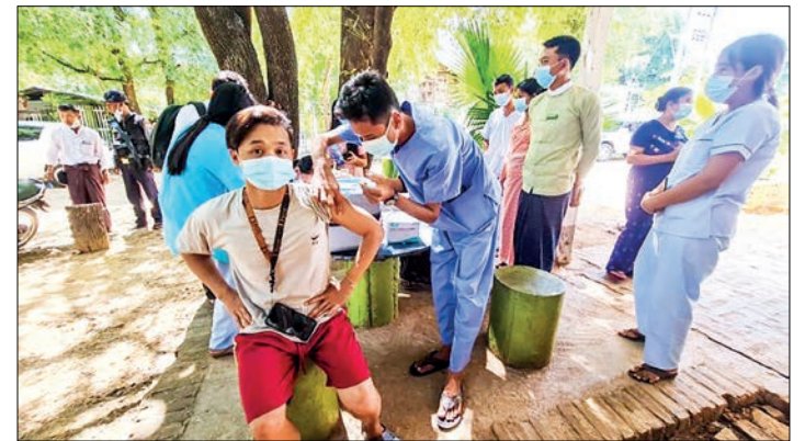
A local in Mandalay Region gets jabbed against COVID-19 on 25 October.

In addition, to assist in the control and prevention of the covid-19 disease, military officials from various military commands in collaboration with district and township administrative officials, departmental personnel and members of civil society organizations (CSOs) conducted educational campaigns such as prevention of COVID-19, wearing of masks in public places and distribution of masks to the locals at schools, markets, streets, city entry points and crowded areas in three townships in Taninthayi Region and , 44 townships in Yangon Region, and Phyarpon Town in Ayeyawady Region. —MNA