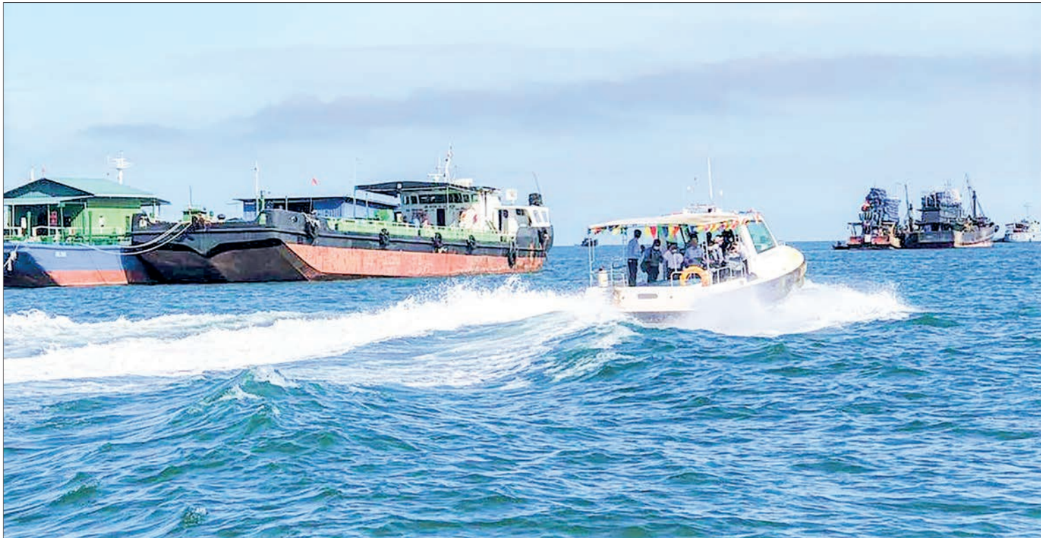
Officials are seen ready onboard the inspection vessel to combat illegal fishing on inshore waters along the Taninthayi coast.

THE Danish-Myanmar project handed over two inspection vessels to Myeik Fish Harbour on 24 October for the inspection of inshore fishing. The vessels will conduct inspections in November to combat illegal fishing on inshore waters along the coast of the Taninthayi Region.