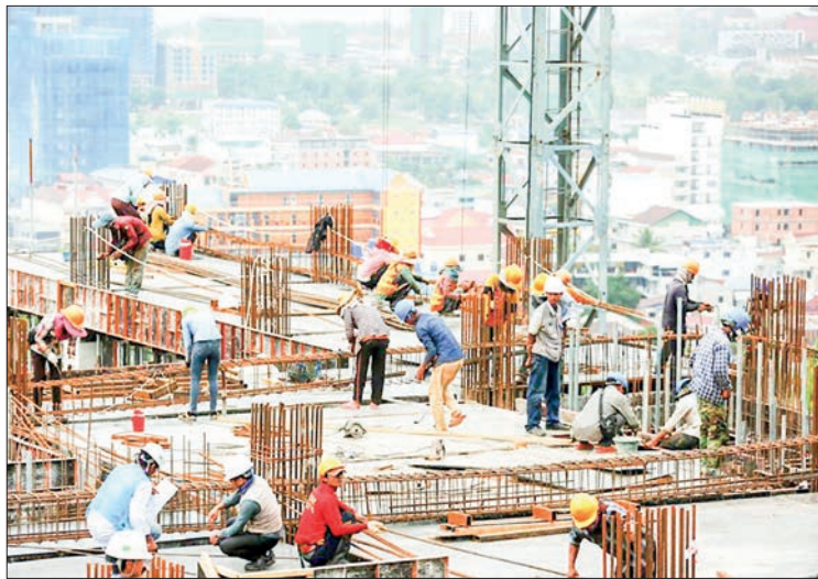
Cambodian labourers work on a high-rise building construction site in Sihanoukville.

THE International Monetary Fund (IMF) said on Friday that Cambodia's economic growth is expected to be robust this year and the next couple of years, supported by free trade agreements and high vaccination rate.