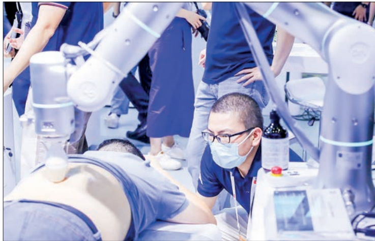
A visitor experiences a massage robot at the 2022 World Artificial Intelligence Conference (WAIC) in east China's Shanghai, 1 September 2022.

The throttle, brakes, steering wheel and gear lever in these autonomous vehicles are all managed by computers, allowing the "driver" to keep a better eye on events during test drives, according to He Jiancheng, one of the