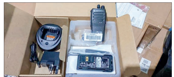
Seized items at the warehouse of Yangon International Airport.