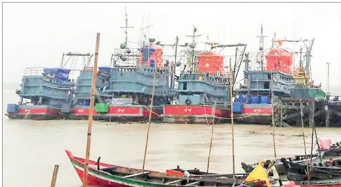
In a bid to conduct surveillance of the offshore fishing vessels in Kawthoung District, the VMS devices have been located in Myeik, Taninthayi Region, Yangon Region, Rakhine State and Mon State and Nay Pyi Taw.

Taninthayi Region has more than 8,000 inshore fishing vessels and over 1,400 offshore fishing vessels. Due to the increase in global fuel prices, fishing vessels cannot fully