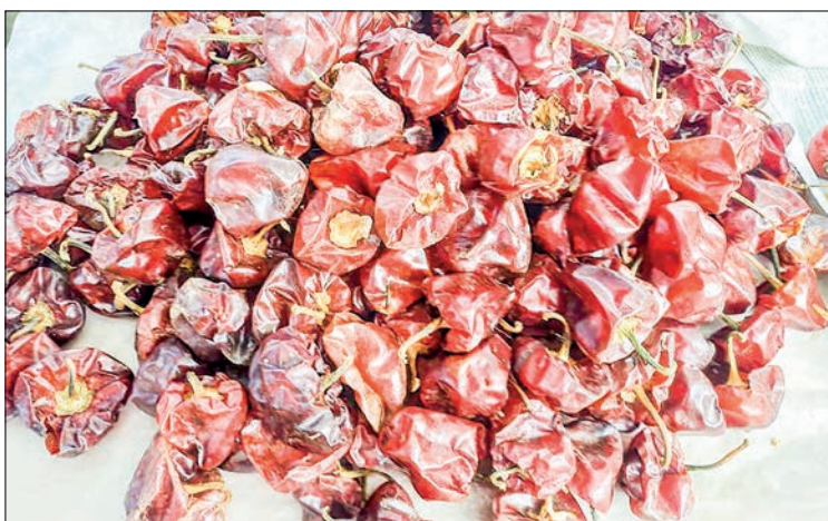
The bell pepper is seen being transported to the market.