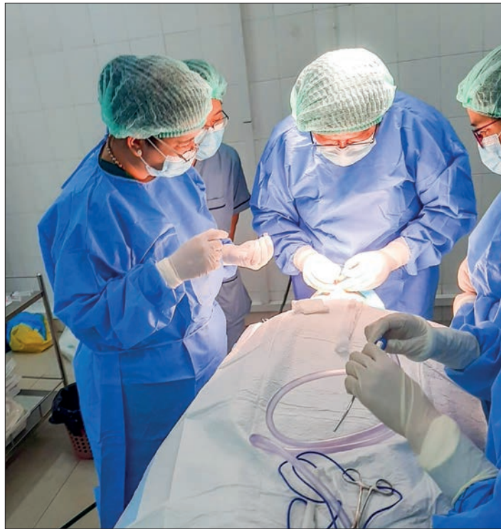
One of the cleft lip and palate surgeries is underway.

The surgeons will continue free surgical care at the Dental Hospital in Pobbathiri Town-