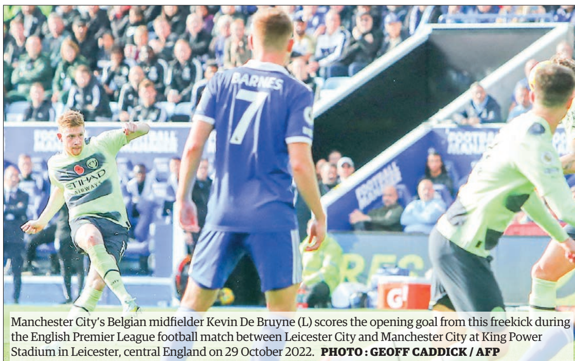
Manchester City's Belgian midfielder Kevin De Bruyne (L) scores the opening goal from this freekick during the English Premier League football match between Leicester City and Manchester City at King Power Stadium in Leicester, central England on 29 October 2022.

Tottenham fought back from 2-0 down to beat Bournemouth 3-2 to remain in third ahead of Newcastle, who thrashed Aston Villa 4-0. City were without the free-scoring Erling Haaland for the trip to the King Power due to a foot injury and were blunted up front without the Norwegian's firepower. But one moment of magic from De Bruyne was enough as the Belgian's free-kick four minutes into the second half clipped the inside of the post on its way past Danny Ward. City needed one brilliant