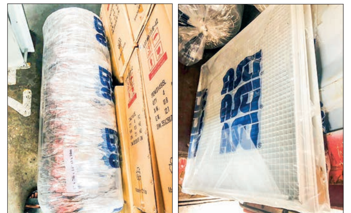
Confiscated illegal goods at Asia World Port Terminal Container Checkpoint.

Therefore, ten arrests (estimated value of K174,976,985) were made on 28 and 29 October, according to the Anti-Illegal Trade Steering Committee. — MNA