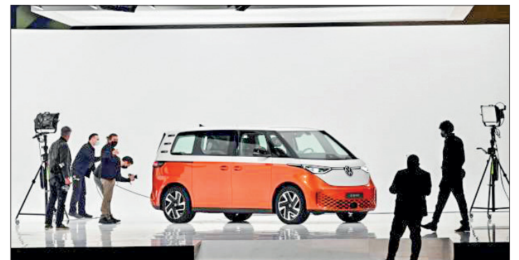
The new Volkswagen ID Buzz electric van is displayed during its presentation in Hamburg, northern Germany on 9 March 2022.

Along with other German automakers including rivals Mercedes-Benz and BMW, Volkswagen halted exports to Russia shortly after the invasion of Ukraine and closed its local production sites. Last month, luxury sports carmaker Porsche floated on the Frankfurt stock exchange in one of Europe's biggest listings in years. Volkswagen is expected to use some of the cash raised in the listing in its shift towards electric vehicles.—AFP