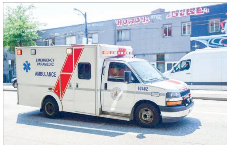
The first monkeypox cases in Canada were reported on 19 May 2022 in Montreal. British Columbia’s first case was confirmed on 6 June 2022.

Monkeypox is a viral disease that can spread from person to person through close contact with an infected person, including through hugs, kisses, massages or sexual intercourse, according to experts.—Xinhua