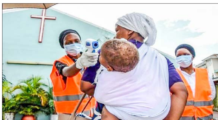
During the early phase of the COVID-19 outbreak, Tanzania adopted a preventive strategy whereby the community was sensitized, and measures were taken to ensure that overcrowding was avoided, and frequent handwashing practiced.

She said the medical specialists have been selected from the country’s leading medical facilities.—Xinhua