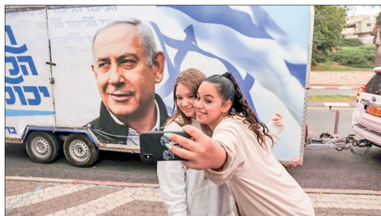
Two girls pose for a selfie photo before a vehicle showing Israel's former prime minister Benjamin Netanyahu, ahead of 1 November general elections.

Netanyahu, meanwhile, is hoping his record 15 years in power can convince the electorate