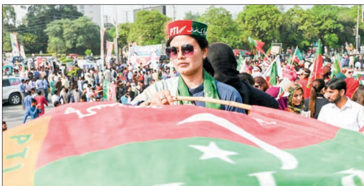
Former Pakistan prime minister Imran Khan launched a so-called "long march" on the capital Islamabad to demand early elections.

Security has already been tightened in the capital, with hundreds of shipping containers positioned at key intersections, ready to block marchers should they try to storm the government enclave. Clashes erupted between Khan's supporters and police during a similar protest in May.—AFP