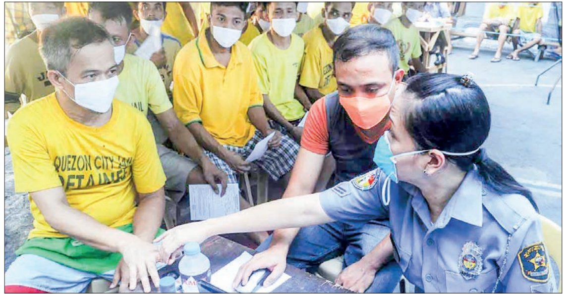
This file photo shows inmates from the Quezon City jail being processed during a mass screening for tuberculosis (TB) in suburban Manila.

“Because of the lack of funding, existing tools to fight tuberculosis are not reaching all those who need them and new tools are not fast-tracked through the research pipeline,” said Sahu, who was present virtually at a press conference Thursday before the opening of the meeting.—Xinhua