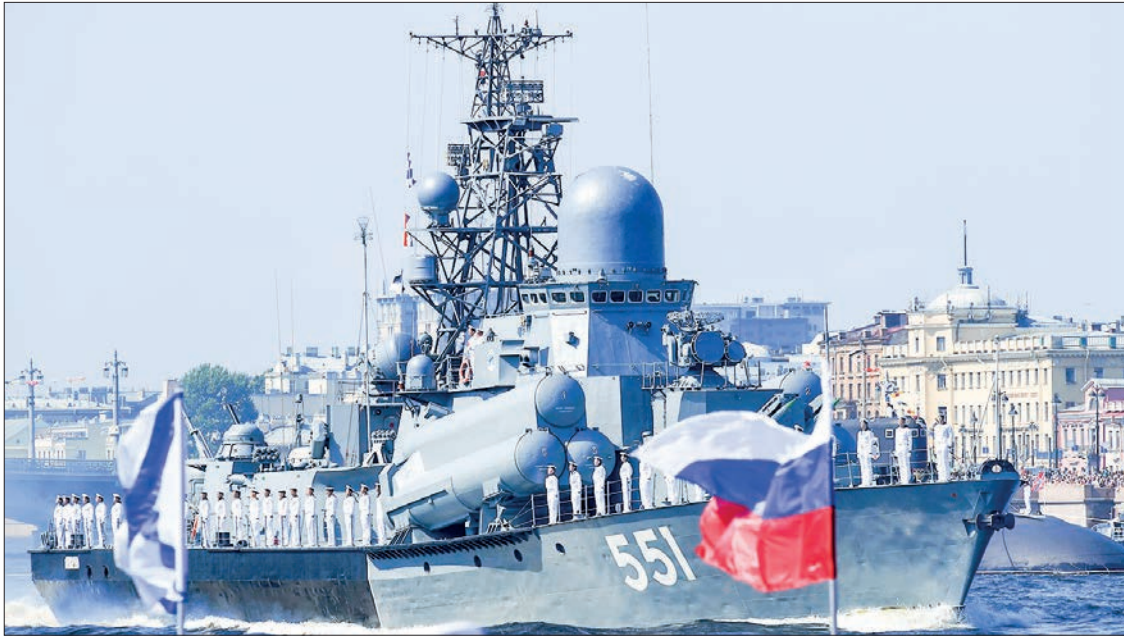
A Russian warship sails on the Neva river during the Navy Day parade in Saint Petersburg on 29 July 2018.

THE Russian navy on Saturday thwarted a drone attack on the Sevastopol port, home to Moscow's Black Sea Fleet in Russia-annexed Crimea, Moscow-installed authorities said.