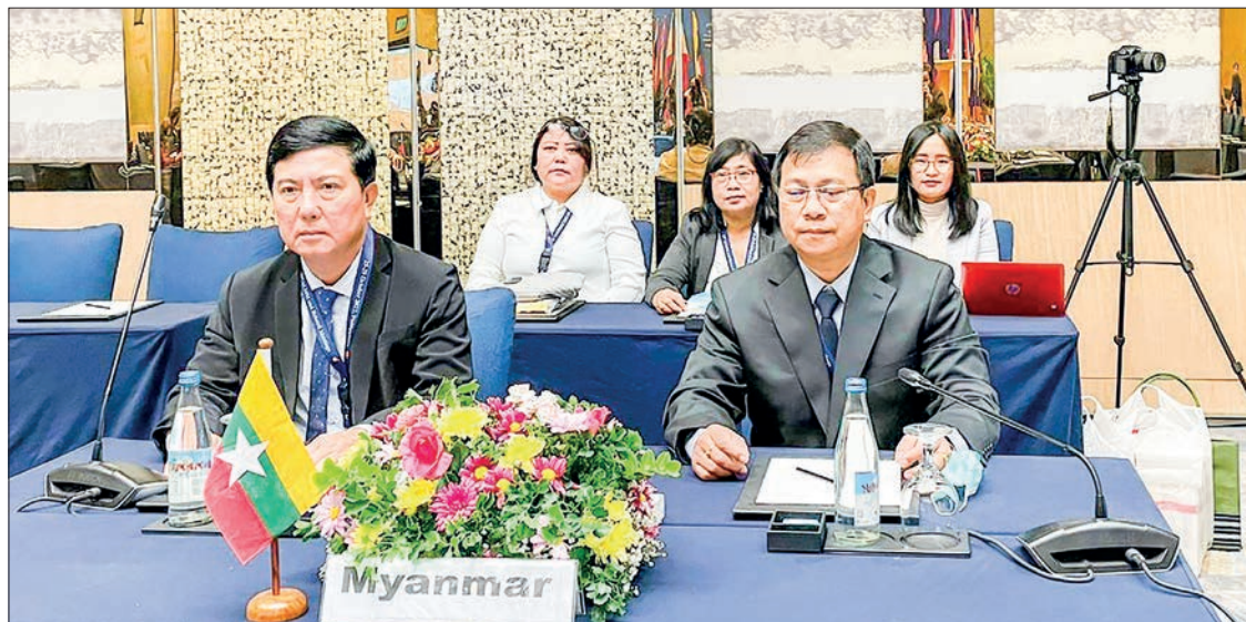
Union Minister for Labour Dr Pwint San attends the 27 th ASEAN Labour Ministers' Meeting (ALMM) and 12 th ASEAN Plus Three Labour Ministers Meeting (ALMM+3) in Manila on 28 and 29 October.

During the 27 th ALMM held under the topic of "Together as One: Reshaping the World of Work the ASEAN Way Towards Digitalized, Inclusive and Sustainable Recovery and Growth", the Union Minister said the technological inventions that are not conformity with the requirements of future job opportunities have impacts on the employment of the labourers. It should adopt the skills properly