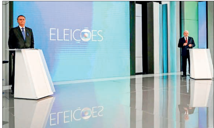
After a bitterly divisive campaign and inconclusive first-round vote, Brazil will elect its next president on 30 October in a cliffhanger runoff between far-right incumbent Jair Bolsonaro and veteran leftist Luiz Inacio Lula da Silva.

FAR-RIGHT incumbent Jair Bolsonaro and leftist ex-president Luiz Inacio Lula da Silva repeatedly slammed each other as liars in a final debate Friday night that touched on the economy, corruption and foreign policy only two days before Brazil's runoff elections.