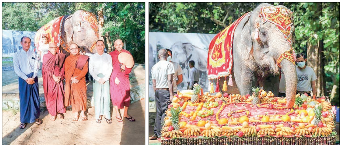
The 69 th birthday event of Elephant Momo is progress yesterday.

A living icon of the Yangon Zoological Garden — Momo the elephant was congratulated on its 69 th birthday on 29 October.