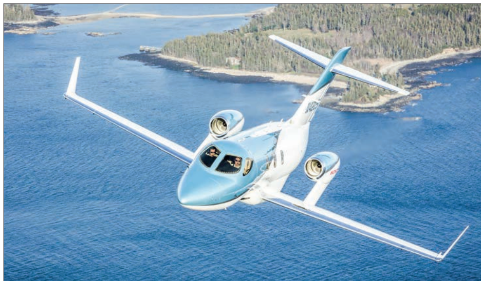
The HondaJet Elite.

"The HondaJet Elite II once again pushes the boundaries of its category on all fronts of per-