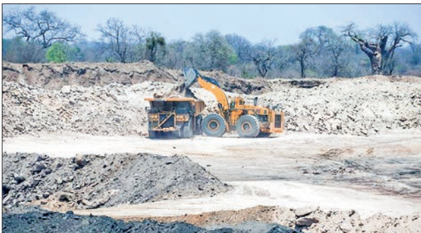
Brazilian mining giant Vale reported a third-quarter net profit of US$4.45 billion on Thursday, a 12.2 per cent year-on-year climb.

Prices for iron ore were down sharply in the