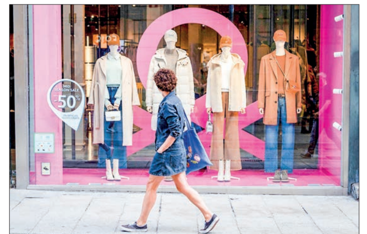
A woman walks past a shop window displaying autumn clothes in Barcelona, Spain, 27 October 2022.

tials like groceries, housing, and gas by looking for ways to increase their incomes and cut down on expenses, said the ABC News in a report Wednesday.—Xinhua