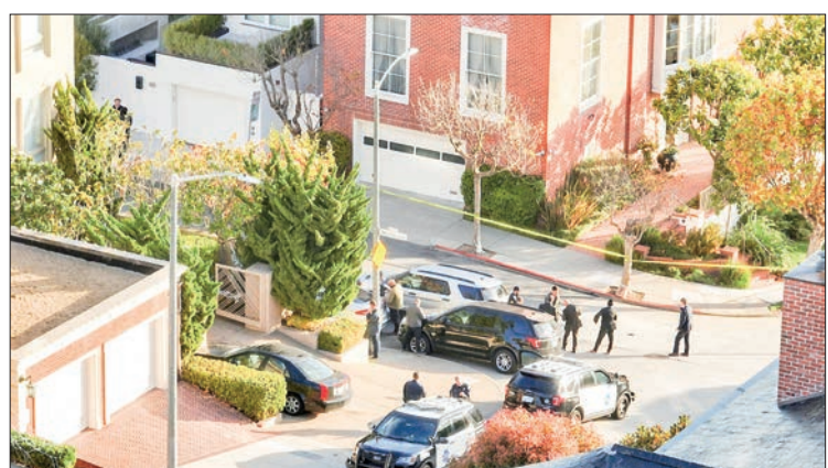
San Francisco police officers and FBI agents gather in front of the home of US Speaker of the House Nancy Pelosi in San Francisco, California.

For Netanyahu that means rekindling his longstanding ties to the ultra-Orthodox, while he has also courted the extreme-right alliance of Itamar Ben-Gvir and Bezalel Smotrich.—AFP