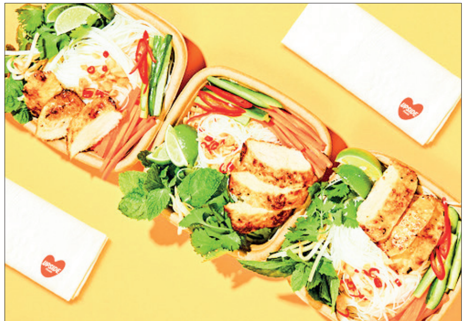
Upside Foods will still have to undergo inspection by the US Department of Agriculture, for example, before it can sell its products. Noodle bowl with UPSIDE Chicken.

Several start-ups are aiming to produce so-called lab-grown meat, which would allow humans to consume animal protein without harming the environment through farming and without any animal suffering.—AFP