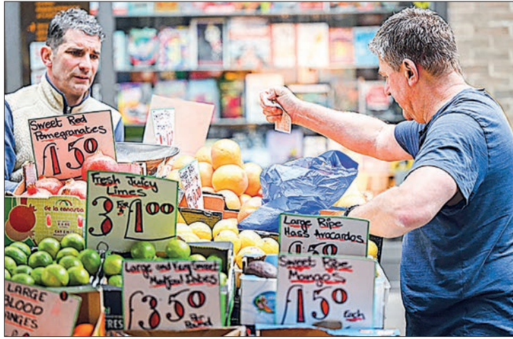
The Consumer Prices Index hit 11.1 per cent in October, reaching the highest level since 1981, the Office for National Statistics (ONS) said in a statement.

prices drove headline inflation to its highest level for over 40 years, despite the Energy Price Guarantee," said ONS chief economist Grant Fitzner.