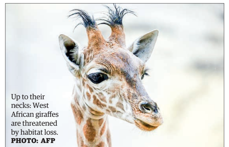
Up to their necks: West African giraffes are threatened by habitat loss.

CONSERVATIONISTS in Niger said on Wednesday they had transferred threatened West African giraffes to a new home 600 kilometres (375 miles) away.