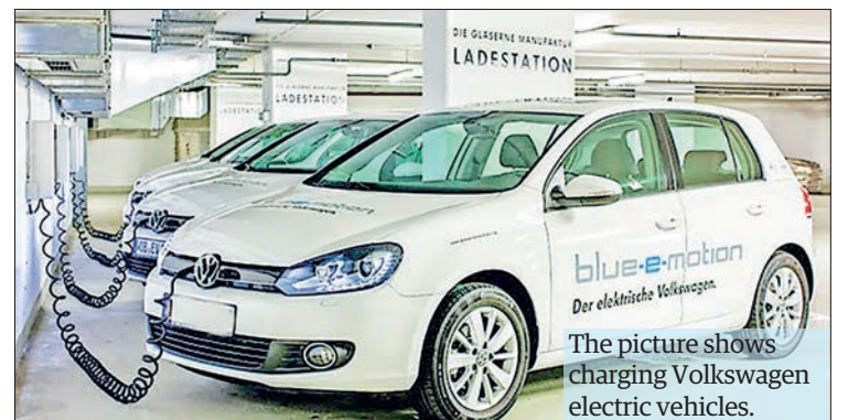
The picture shows charging Volkswagen electric vehicles.

The companies must seek permission from the MoC to register with the Road Transport Ad-