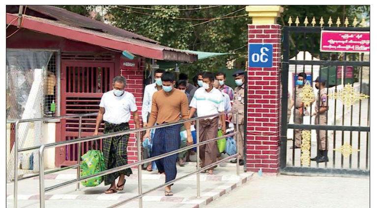
The photo shows inmates released from the Mandalay Central Prison.

ducted COVID-19 inspections for exempted inmates and released them from prison after giving them travel expenses.