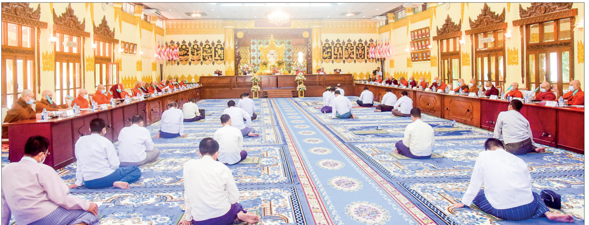
The second-day session of the twelfth plenary meeting of the eighth 47-member State Sangha Maha Nayaka Committee is in progress in the Maha Pasana Cave on Thiri Mingala Kaba Aye Hill in Yangon on 17 November 2022.

THE second-day session of the 12 th plenary meeting of the 8 th 47-member State Sangha Maha Nayaka Committee was organized in the Maha Pasana Cave on Thiri Mingala Kaba Aye Hill in Yangon yesterday.