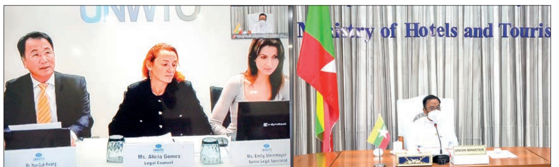
MoHT Union Minister Dr Htay Aung virtually participates in the Asia-Pacific regional meeting.

UNION Minister for Hotels and Tourism Dr Htay Aung joined the Asia-Pacific regional meeting relating to the International Code for the Protection of Tourists organized by the World Tourism Organization in Spain online yesterday.