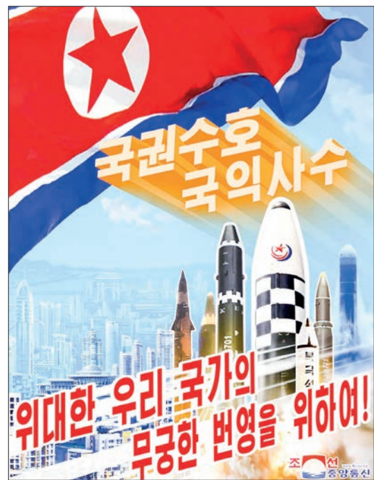
File photo shows an illustration published by the state-controlled Korean Central News Agency on 13 Sept 2022, showing multiple ballistic missiles.