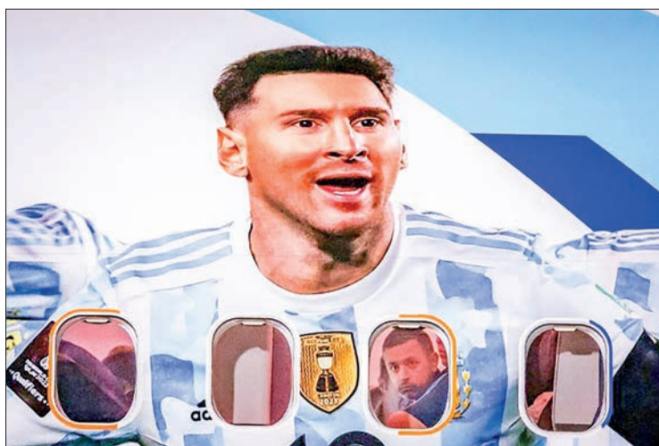
Argentina's team plane, emblazoned with a picture of Lionel Messi, lands in Qatar.

gentina squad in the early hours of the morning from Abu Dhabi where he scored in a straightforward 5-0 win against the United Arab Emirates in front of 36,000 spectators on Wednesday.