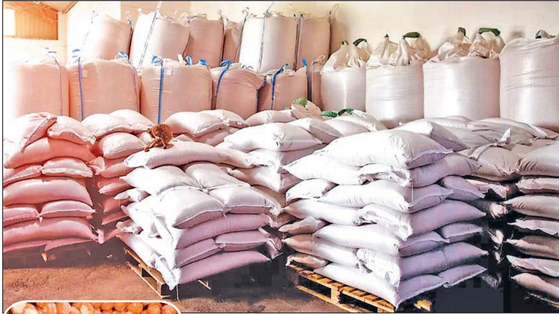
Above: Sugar bags are piled up in a warehouse. Left: Pieces of jaggery to be sold are displayed at a shop.