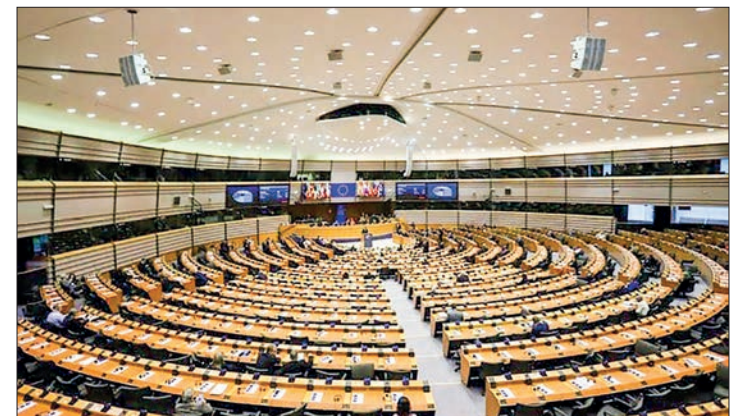
The Digital Services Act (DSA) rules will be fully applied 12 months later from 17 February 2024, but officials will need time next year to decide which tech giants are big enough to need close observation.

At current user numbers, this definition would hit around 20 firms, including Meta and its social networks Facebook and Instagram; Google and its video platform YouTube; and iPhone-maker Apple's platforms.—AFP