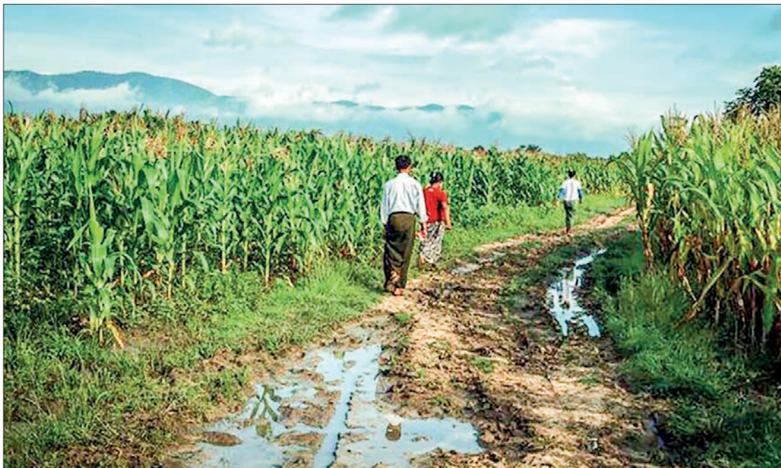
The photo shows a thriving maize plantation.

MYANMAR has delivered 300 tonnes of maize silage to China through the Muse border and further exports will be undertaken, stated the Ministry of Commerce.