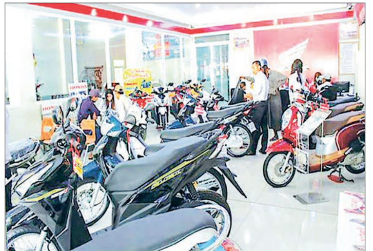
The picture shows a motorbike showroom.

They must follow the rules of the Ministry of Commerce on the specification and import