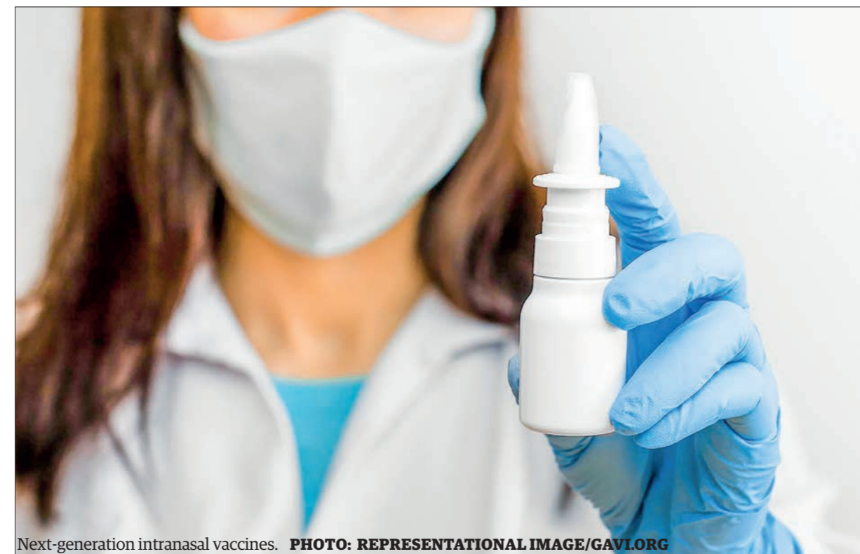
Next-generation intranasal vaccines.