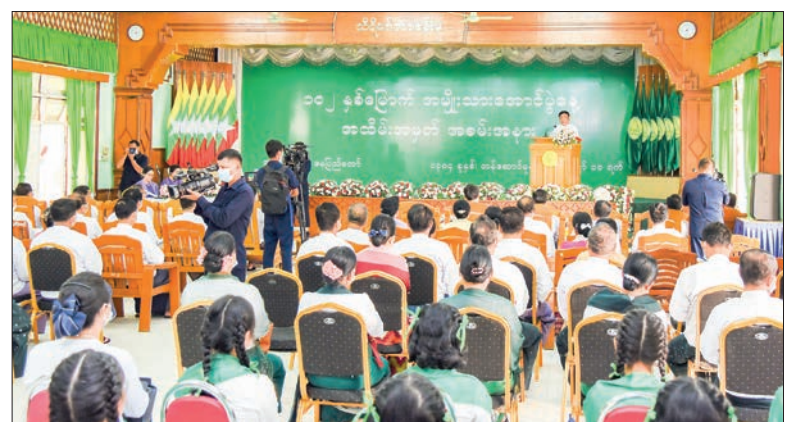
Nay Pyi Taw convenes the 102 nd Anniversary of National Victory Day yesterday.

from the Department of Basic Education. First, students from No 6 Basic Education High School sang the song “Zartiman” and Union Minister Dr Nyunt Pe read out the message sent by Chairman of the State Administration Council Prime Minister of the Republic of the Union of Myanmar Senior General Min Aung Hlaing to the ceremony to mark the 102 nd National Victory Day. Afterwards, the ceremony ended with the singing of the song “the Myanmar School” by the students.—MNA