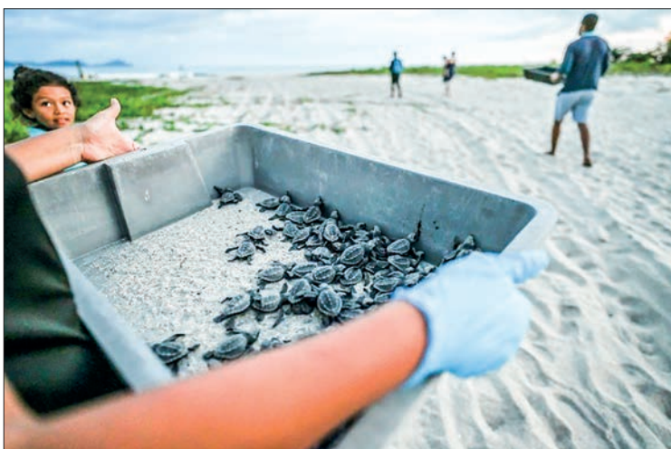
Marine turtles and their uncertain fate are on the agenda of a global wildlife summit taking place in Panama City.

THE sea turtles of Punta Chame, a peninsula of Panama that juts into the Pacific Ocean, face an existential threat similar to the rhino and pangolin: human su-