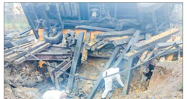
This handout photo taken and released on 16 November 2022 by the Polish police shows forensic experts investigating the site where a missile hit the southeastern Polish village of Przewodow, some six kilometres (four miles) from the Ukrainian border.

THE explosion that killed two Polish civilians in a village near the Ukraine border was probably caused by Ukrainian air defence units firing at incoming Russian missiles, the Belgian defence minister said Wednesday.