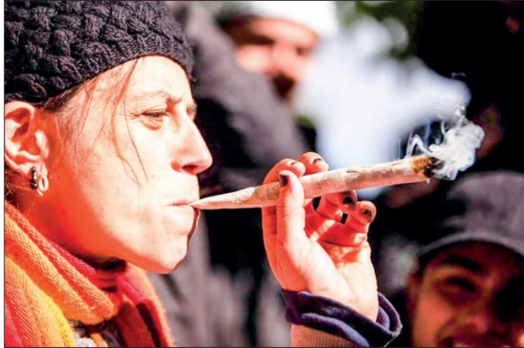
Canada legalized the recreational use of cannabis in 2018.

"Marijuana smoking is on the rise and there's a public