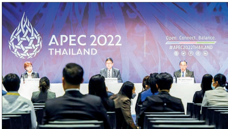
This photo taken on 16 Nov 2022 shows a press conference after the Asia-Pacific Economic Cooperation (APEC) Senior Officials' Meeting in Bangkok, Thailand.

PACIFIC rim leaders fly into Bangkok on Thursday for a summit on pandemic recovery and the global economic turmoil unleashed by the war in Ukraine.