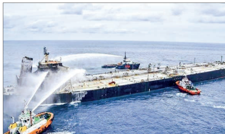
Oil tanker. PHOTO: REPRESENTATIONAL IMAGE/AFP

"There is some minor damage to the vessel's hull but no spillage of cargo or water ingress," said the company which is owned by Israeli billionaire Idan Ofer -- one of two sons of