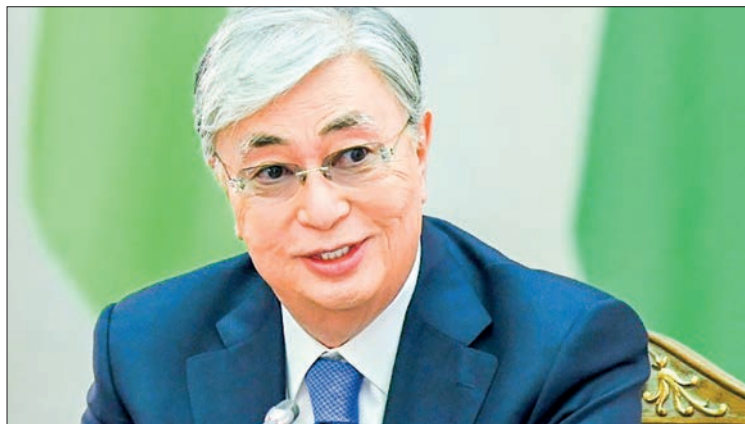
Kazakhstan President Kassym-Jomart Tokayev became leader in 2019 and has since stymied opposition to his rule.

KAZAKHSTAN will hold snap presidential elections Sunday expected to cement the incumbent Kassym-Jomart Tokayev's