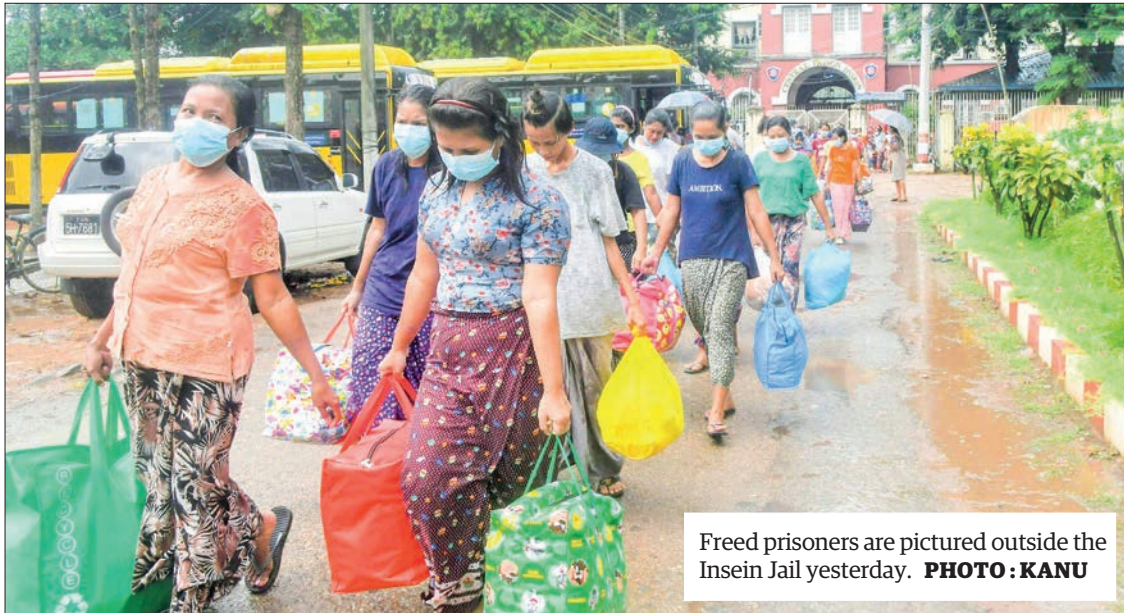
Freed prisoners are pictured outside the Insein Jail yesterday.

THE Government has granted amnesty for 5,774 prisoners from prisons across the country in honour of the National Victory Day and on humanitarian grounds. It is learnt that 985 prisoners, including four foreigners, were released from the Insein prison under amnesty at 2:30 pm yesterday.