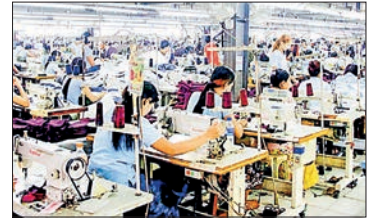
Workers are seen at the workplace of a garment factory in Myanmar.

When the sugar price is rocketing, the price of jaggery from the NyaungU area is down by K400 per viss these days. — TWA/GNLM