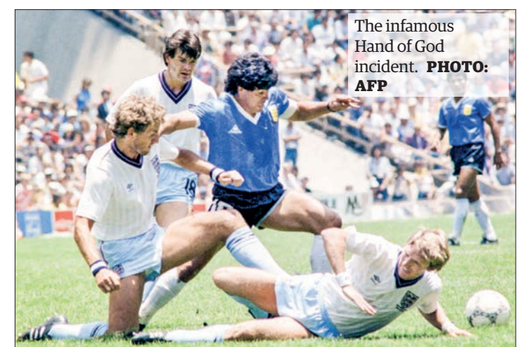
The infamous Hand of God incident. PHOTO: AFP

It comes six months after the jersey Maradona wore in the historic quarter-final in Mexico City sold at auction for nearly $9.3 million -- more than twice the value predicted by Sotheby's.—AFP