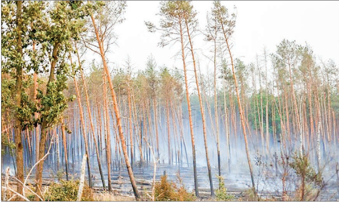
Besides recurring drought, the monoculture composition of Germany's forests has also made them more vulnerable.

ONCE a sea of green, thousands of spruces with brown crowns and charred trunks now stand in a forest in eastern Germany, testament to one of the most ferocious forest fires to have ravaged the region in years.