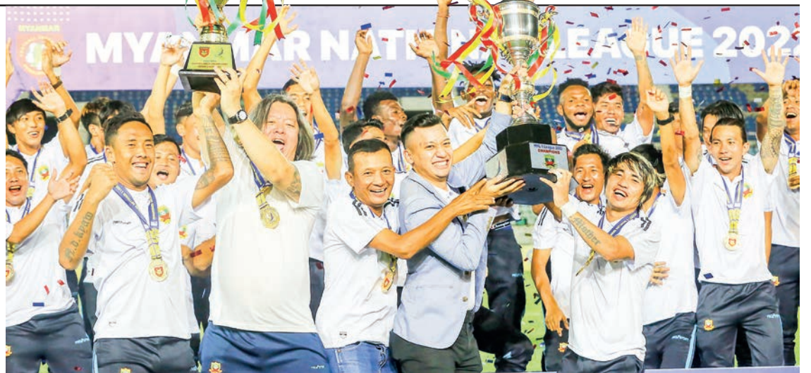
Shan United players and team authorities hold the trophies after winning the Myanmar National League 2022 with an unbeaten record.