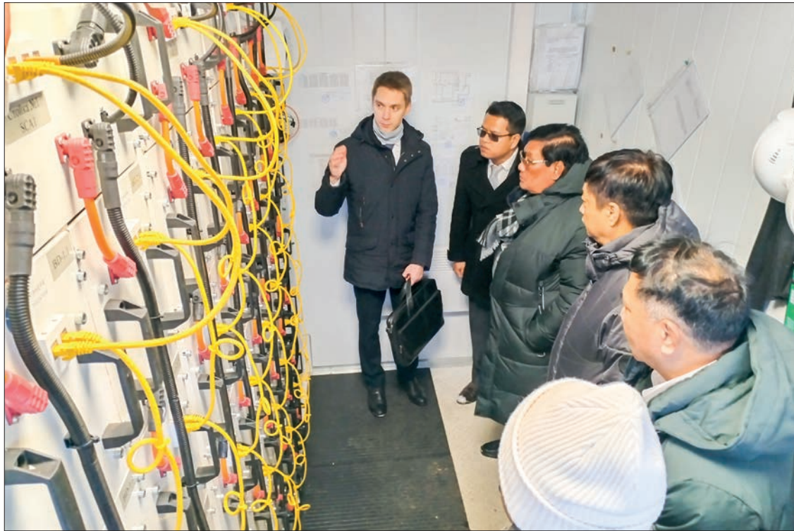
MoEP Union Minister U Thaug Han and MoST Union Minister Dr Myo Thein Kyaw view round the Renera battery production company in Moscow.

A Myanmar delegation led by Union Minister for Electric Power U Thaug Han and Union Minister for Science and Technology Dr Myo Thein Kyaw along with Myanmar Ambassador to the Russian Federation U Lwin