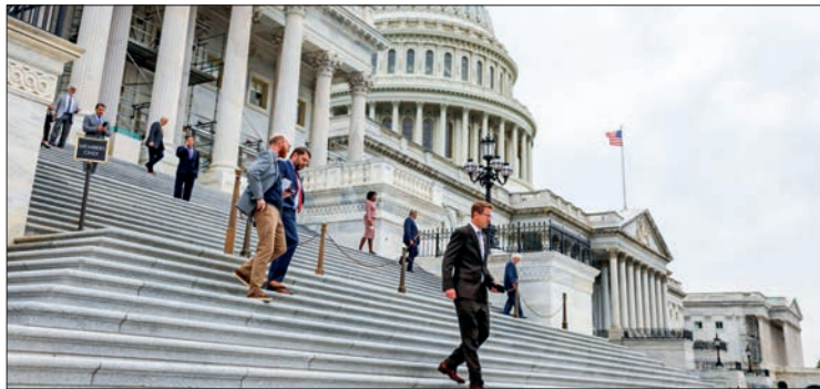
Lawmakers depart from the US Capitol Building on 30 September 2022 in Washington, DC ahead of starting a six week recess to campaign for midterms.

But the prospect that Republicans can only secure control of the House by a slim margin – falling short of what some speculated may become a “red wave” of victories – while the Senate is retained by the Democrats appears to have given an unexpected boost to the 79-year-old president.