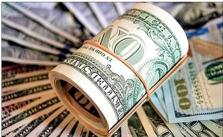
Last August, the dollar hit K4,500 in the grey market. At present, the dollar was exchanged at K2,860 for buying and K2,880 for selling.

KYAT-US Dollar over the counter rate dipped to K2,800 in the local forex market, the money changers said.