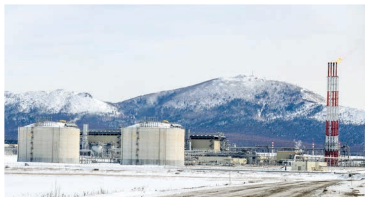
File photo taken in February 2009 shows a liquefied natural gas processing facility at the Sakhalin 2 project in Sakhalin, Russia.

OIL from Russia's Sakhalin 2 energy project bound for Japan will be excluded from facing a price cap the United States will roll out as part of efforts to squeeze Moscow's revenues for