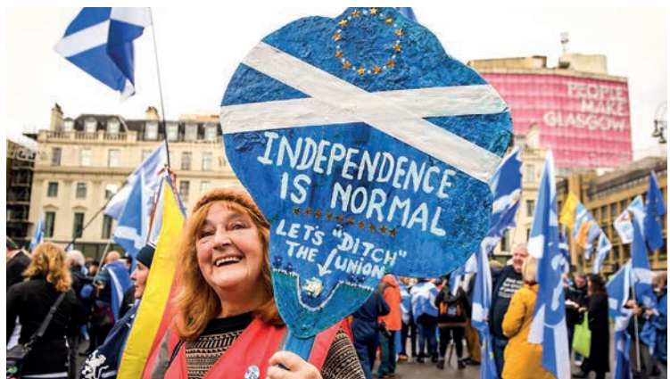
Thousands of people have descended on central Glasgow to demand Scotland's independence from Britain on 11 February 2019.

THE UK's top court will on Wednesday rule whether it is legal for Scotland to hold an independence referendum next year without the consent of London.