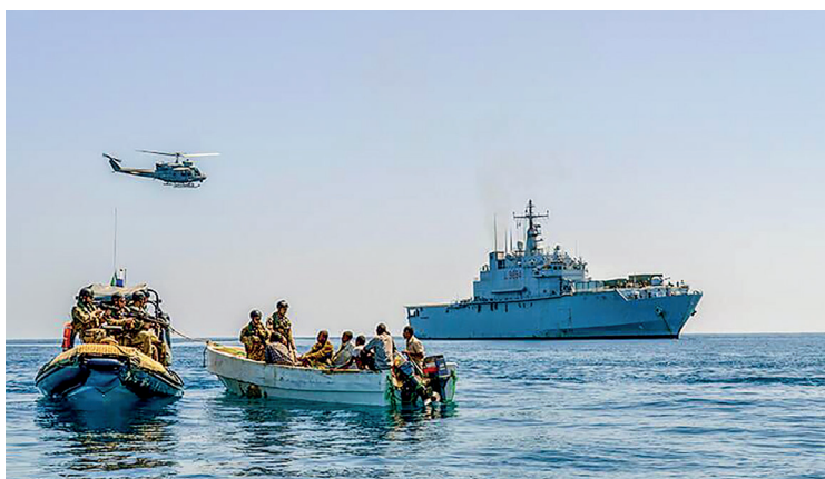
The EU Naval Force in Somalia is active in locating and arresting pirate groups.

that it is still too early to draw definitive conclusions with regard to this decline.