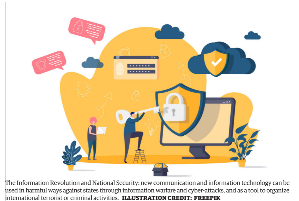
The Information Revolution and National Security: new communication and information technology can be used in harmful ways against states through information warfare and cyber-attacks, and as a tool to organize international terrorist or criminal activities. ILLUSTRATION CREDIT: FREEPIK

Crime: transnational organized crime can undermine a state's economic development and internal political stability; it can also weaken a state's social fabric and promote violence;