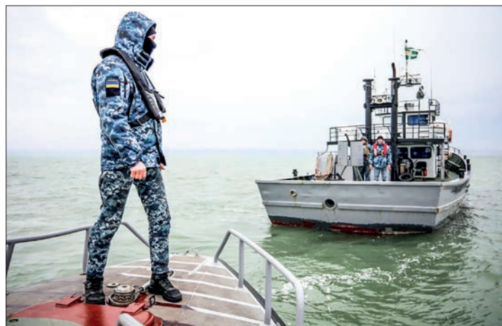
A patrol boat at the Black Sea port of Mariupol, Ukraine, on 11 February 2022.

As for the price cap level, a senior Treasury official said discussions are taking place among members of the European Union before the entire international “Price Cap Coalition” can announce it. Under the Treasury's guidance, U.S. persons will be allowed to provide a range of services, including finance, insurance and shipping, for sea-borne transportation of Russian oil only if the oil is purchased at or below the price cap.—Kyodo