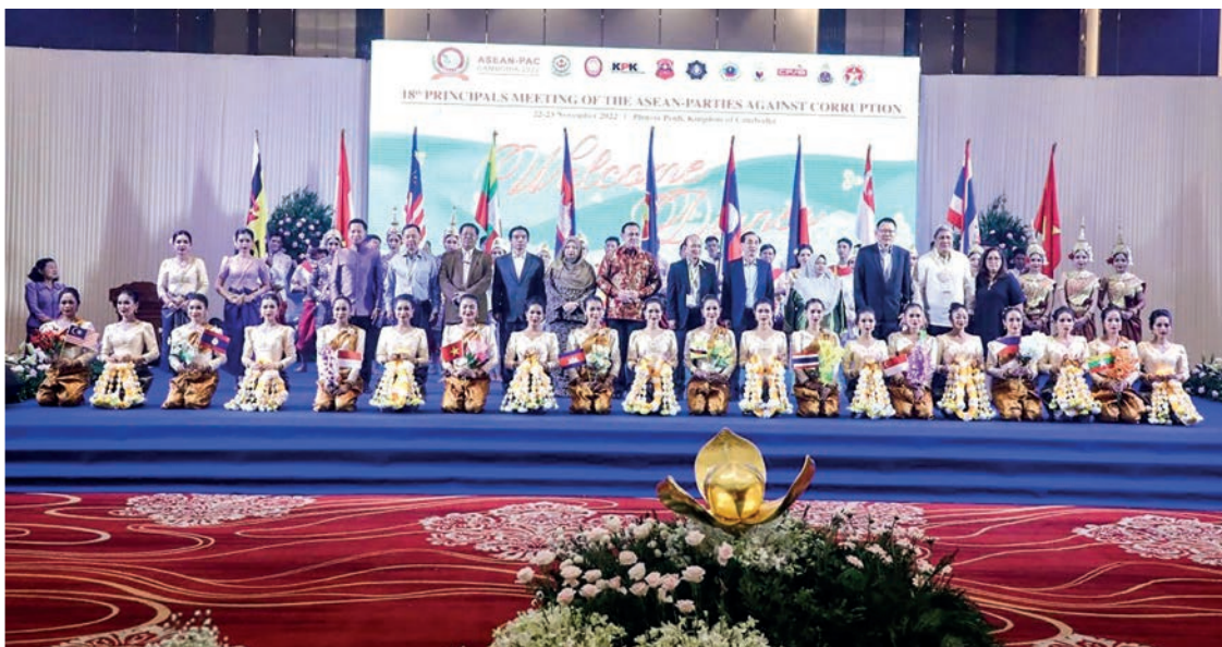
The documentary group photo at the concluding event of the 18 th ASEAN-PAC Heads' Meeting in Cambodia.