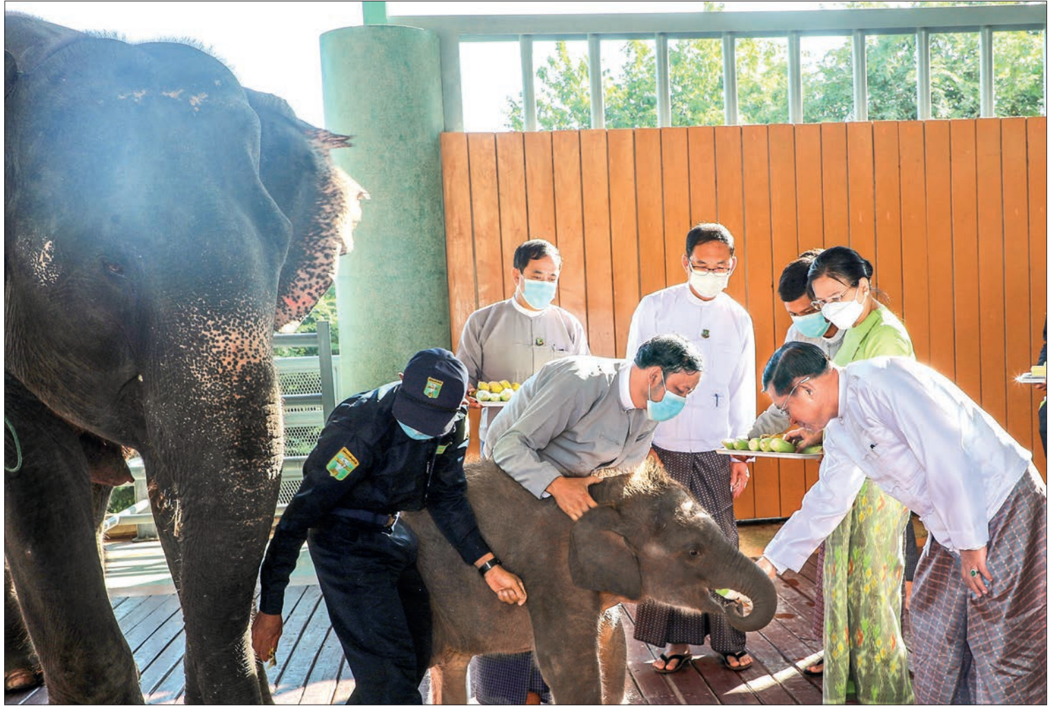
State Administration Council Chairman Prime Minister Senior General Min Aung Hlaing and wife Daw Kyu Kyu Hla are pictured feeding Rattha Nandaka white elephant in Nay Pyi Taw yesterday.

The Senior General asked about the health conditions of Rattha Nandaka white elephant