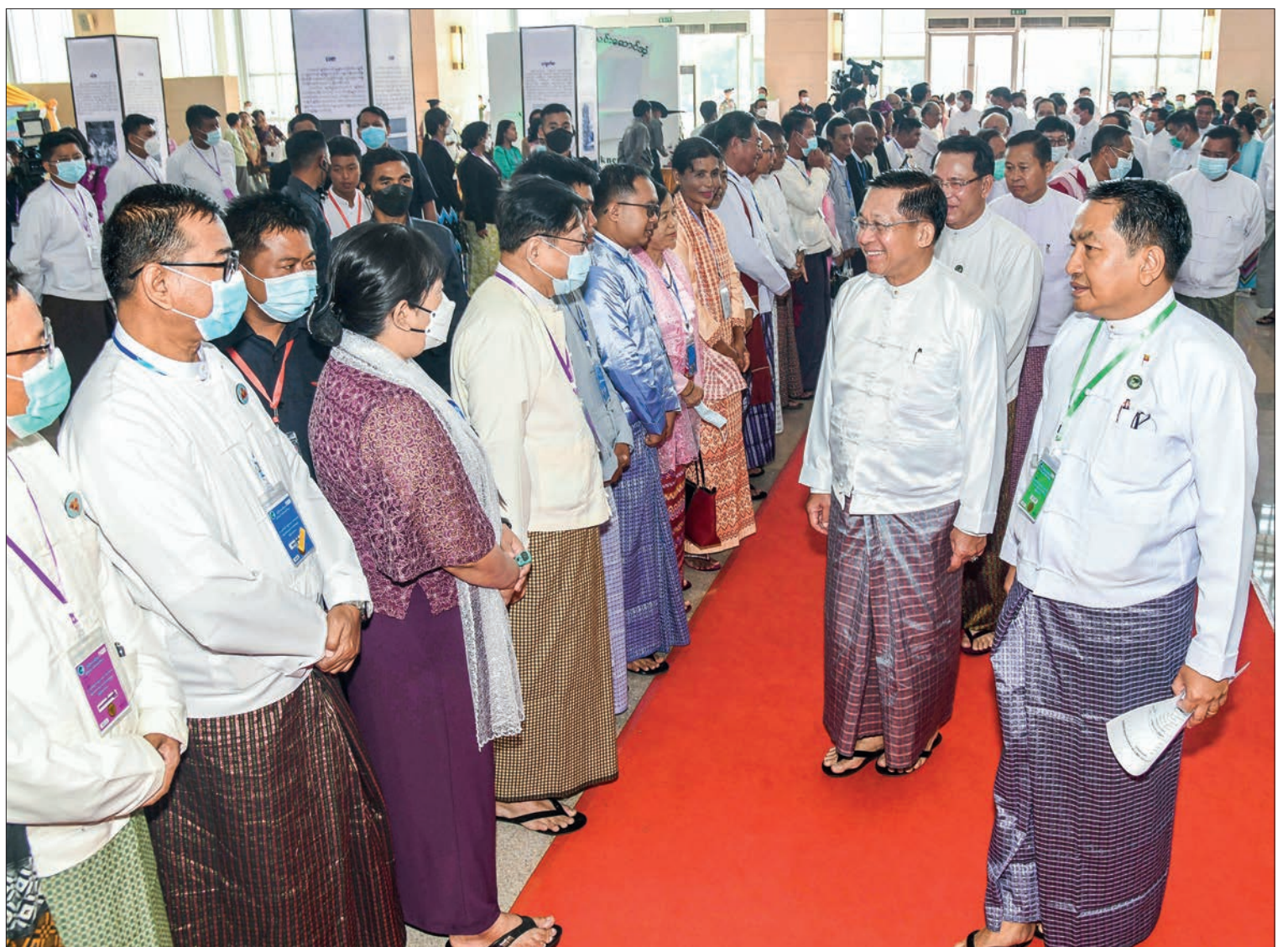
State Administration Council Chairman Prime Minister Senior General Min Aung Hlaing warmly greets the literati and attendees at the presentation event of National Lifetime Awards for Literary Achievement, National Literary Award and Sarpay Beikman Manuscript Award in Nay Pyi Taw on 23 November 2022.