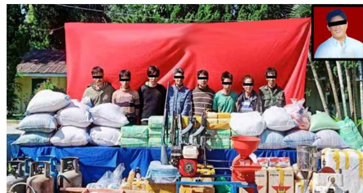
Eight arrestees are pictured along with seized drugs, ammunition and related items.

Legal action is taken against the suspects and Myanmar Police Force is trying to expose those connected with them, it is learnt. — MNA