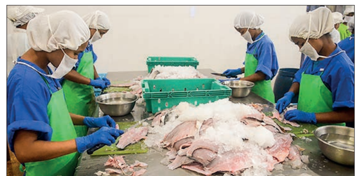
Workers are seen processing the seafood.

Furthermore, king prawn is highly demanded. The prevailing price of king prawns is 1,121.85 Thai Baht per kg. About 500 to 1,000 kilogrammes of scorpion prawns are exported to Thailand with eight to 12 four-wheel trucks every day. — NN/GNLM