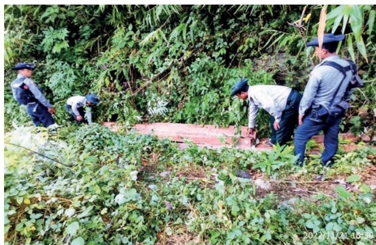
Officials check confiscated illegal timbers.

A combined team under the management of the Sagaing Region Anti-Illegal Trade Task Force seized an unregistered Nissan AD van car (approximately K5 million) at the Mau Combined Checkpoint of Monywa township. The action was taken under the export and import law.