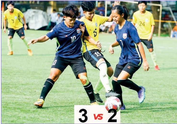
An ISPE player (yellow) attempts to get football amidst the Thitsa Arman players during their Week 13 match of Myanmar Women's League at Thuwunna Training Ground in Yangon on 23 November 2022.

THITSA Arman shaped a narrow 3-2 win over ISPE FC in the Week 13 match of the Myanmar Women's League 2022 played at Thuwunna Training Ground in Yangon yesterday.