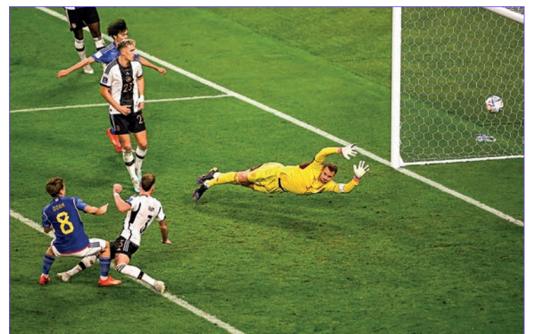
Japan's midfielder #08 Ritsu Doan (L) scores his team's first goal during the Qatar 2022 World Cup Group E football match between Germany and Japan at the Khalifa International Stadium in Doha on 23 November 2022.

Germany's World Cup future is now once again on the line, with games to come in Group E against Spain and Costa Rica. "We made it too easy for Japan. I don't know if an easier goal has ever been scored at a World Cup," Gundogan told Germany's ARD TV network.—AFP