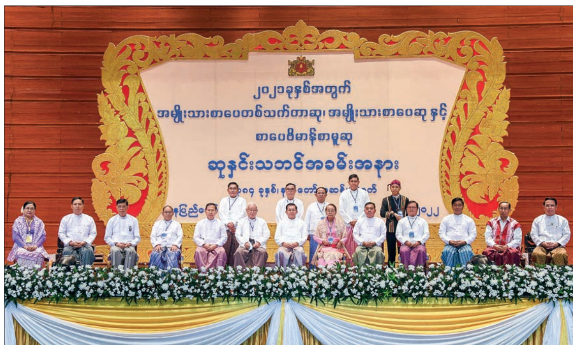
The Senior General takes the group photo with the awardees of the National Literary Award and Sarpay Beikman Manuscript Award.

The State Administration Council conferred the Alinka Kyawswa title on 25 outstanding persons from the literary and fine arts arena in March 2022, eight