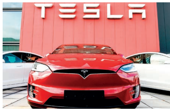
Tesla plans a free remote software update to fix the problem on the affected Model 3 and Model Y 2020-2023 cars.

“In rare instances,” the rear lights on affected cars light up intermittently because of a software problem, the company said in a document to the National Highway Traffic Safety Administration (NHTSA) dated 15 November but made public this week-end. —AFP