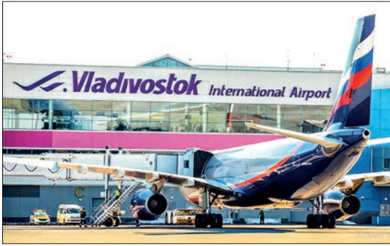
The photo shows the Vladivostok International Airport in the Russian Federation.