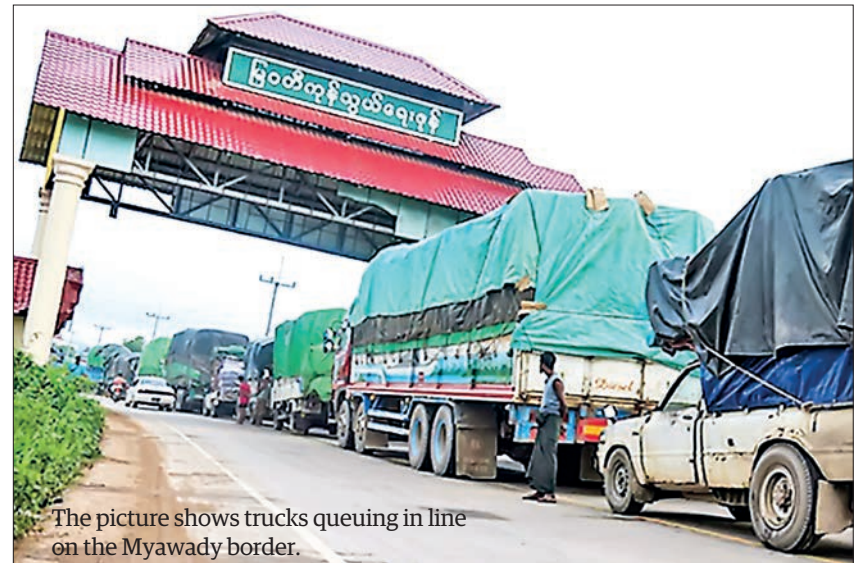
The picture shows trucks queuing in line on the Myawady border.

Exports of Agricultural products ($0.637 million), forest products ($0.054 million), minerals ($0.045 million) and other goods ($0.009 million) plummeted, whereas the import values of capital goods ($1.032 million) and intermediate goods ($1.988 million) rose in October against September's. — TWA/GNLM