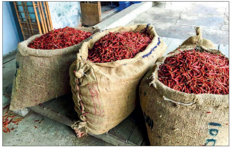
The picture shows dried chilli peppers placed at a warehouse in the Bayintnaung Wholesale Market.

of Moehtaung chilli peppers from Shan State dropped from K16,500-16,000 per viss. Those Moehtaung chilli peppers from various regions are priced at only K15,000 per viss. The newly harvested Moehtaung chilli peppers from the Pyawbwe area decreased from K16,200 to K15,000 per viss. The new bell peppers are valued at over