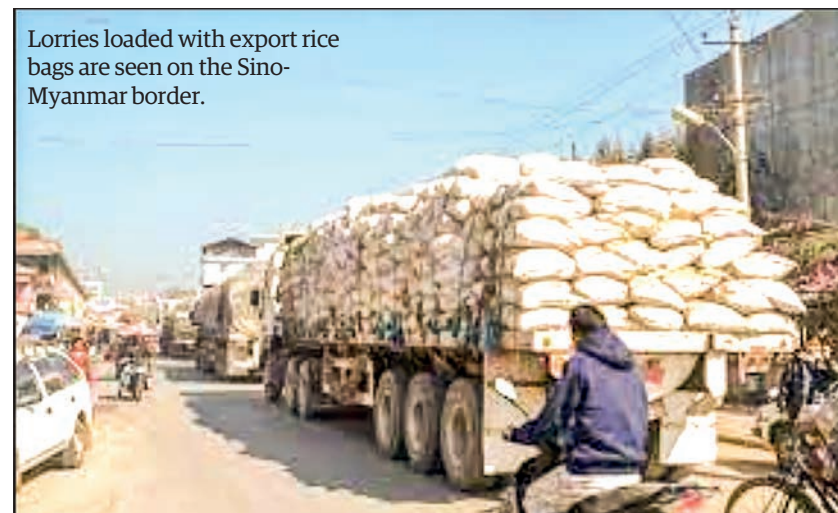
Lorries loaded with export rice bags are seen on the Sino-Myanmar border.

on the Sino-Myanmar border and over 450 tonnes on the Myanmar-Thailand border. Therefore, the export value of broken rice by sea or across borders amounted to over 5,680 tonnes worth $2.033 million. — TWA/GNLM