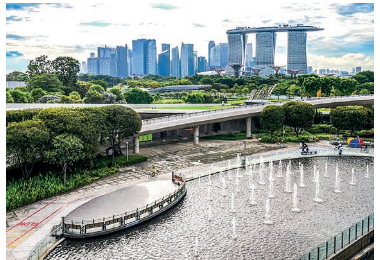
This picture taken from Marina Barrage shows water fountains with the city skyline in the background in Singapore on 10 October 2022.

New rules announced by Beijing earlier this month appeared to signal a shift away from its controversial zero-Covid strategy but the latest flare-up and the first deaths in months have sparked fears of another harsh clampdown.—AFP