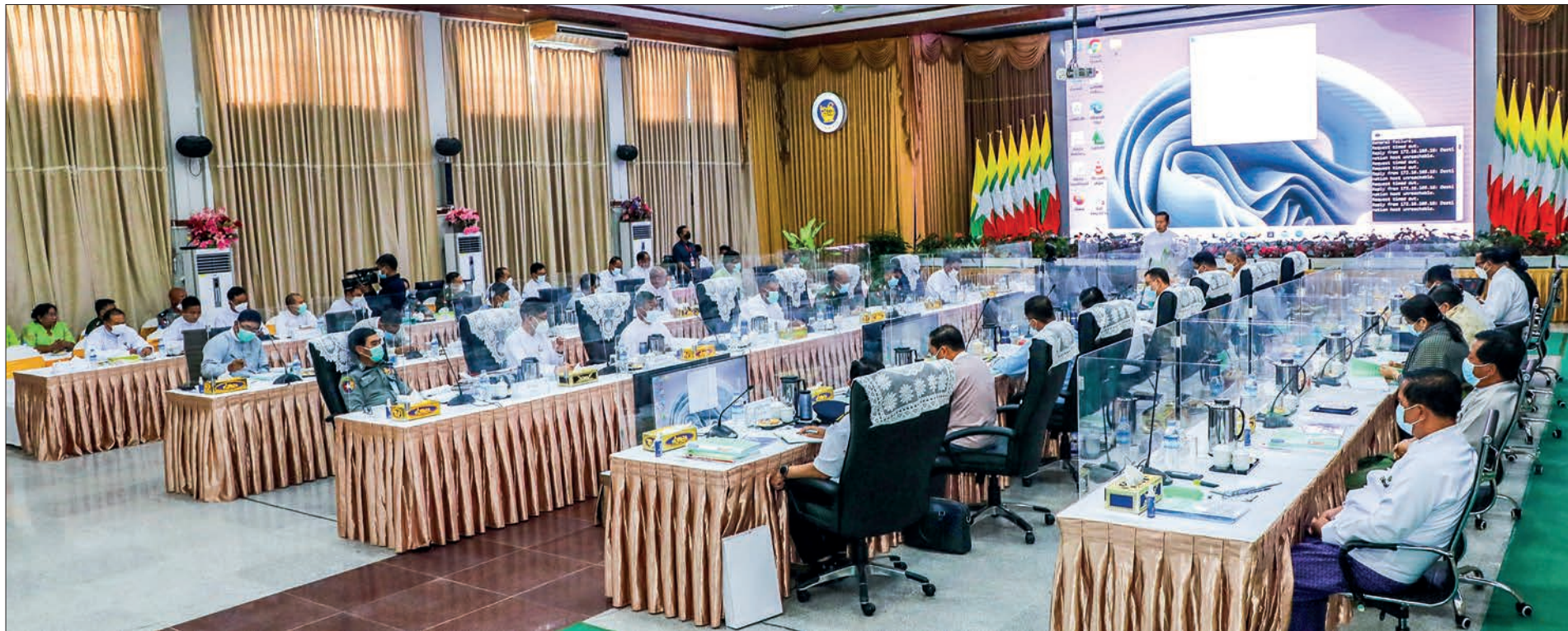
State Administration Council Vice-Chairman Deputy Prime Minister Vice-Senior General Soe Win chairs the coordination meeting 5/2022 of the Illegal Trade Eradication Steering Committee in Nay Pyi Taw on 23 November 2022.

SPECIAL task forces and departments concerned need to emphasize inspection of secret conveyance of illegal arms and ammunition, and explosives, said Chairman of Illegal Trade Eradication Steering Committee Vice-Chairman of the State Administration Council Deputy Prime Minister Vice-Senior General Soe Win at the coordination meeting 5/2022 of the steering committee at the Ministry of Commerce in Nay Pyi Taw yesterday afternoon.