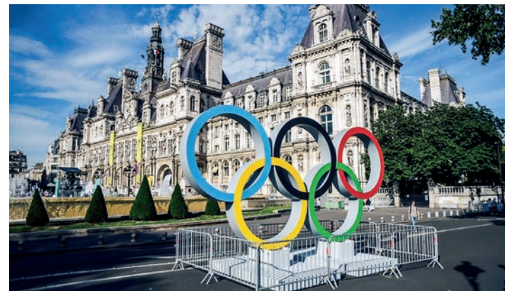
Olympics rings are installed in front of the Paris City Hall during 'Olympics Day' to celebrate the upcoming of the 2024 Paris Olympics Games.