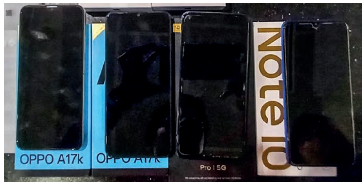
Seized illegal mobile phones.

SUPERVISED by the Customs Department, an on-duty team conducted inspections on 21 November.