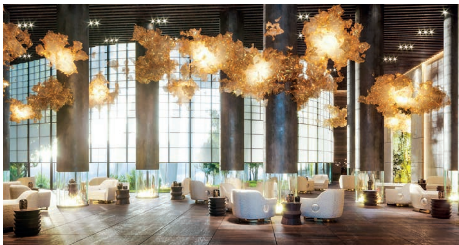
Image of the main lobby of a hotel to be opened by Dorchester Collection within Torch Tower in Tokyo.

Favoured among royalty and celebrities, the hotel will open its doors within the 390-metre-high “Torch Tower”, which will be built near JR Tokyo Station, with construction expected to be completed in fiscal 2027. Under the current plan, the hotel will occupy the 53rd