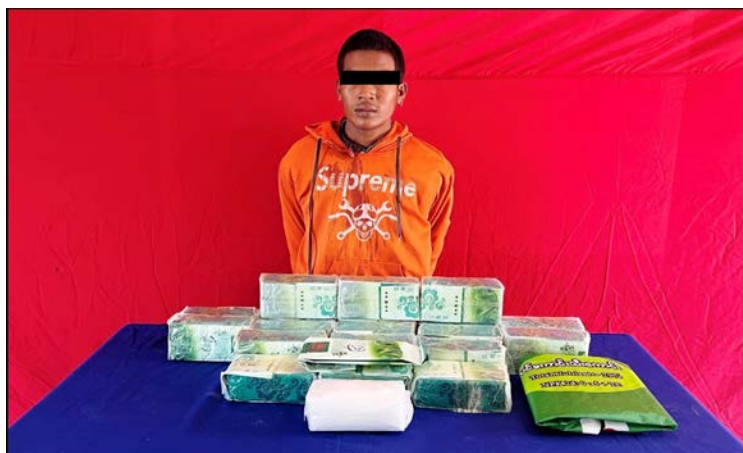
An offender is seen along with seized drugs.

same day, Myanmar Police Force searched his house in Thingangyun township and seized 10,000 stimulant tablets.