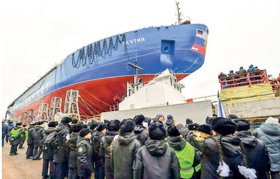
The vessels are designed to resist extreme weather conditions in the Far North.

PRESIDENT Vladimir Putin on Tuesday oversaw the launch of a new nuclear-powered icebreaker as