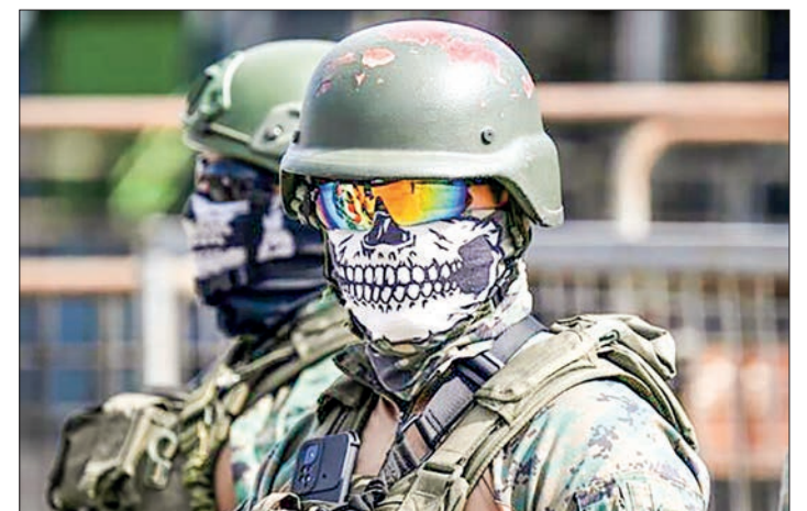
Ecuadorian soldiers guard the perimeter of the Guayas 1 prison amid disturbances there on 4 November 2022.

In September, the United States listed Ecuador among the top 22 drug-producing or transit countries in the world.—AFP