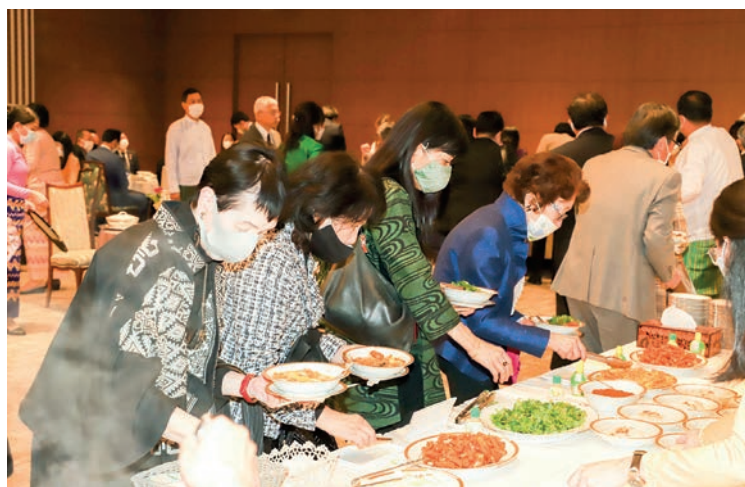
Japanese people are seen having Myanmar's 'Mohingna' and traditional snacks at the event.

Tokyo with the purpose of raising knowledge about Myanmar traditions and Myanmar cuisines among Japanese people