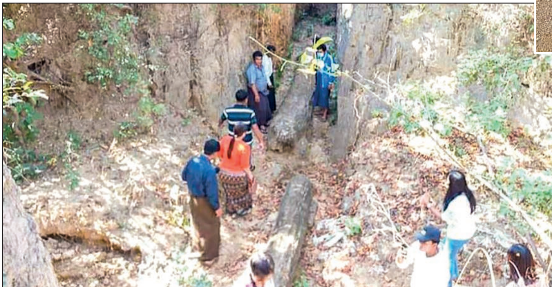
Large petrified wood from sal trees is found in Thanbo Village of Kyaukpadaung Township.

The administrator has collected approxi-