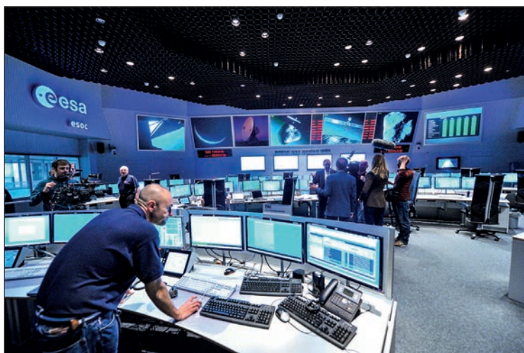
Main Control Room / Mission Control Room of ESA at the European Space Operations Centre (ESOC) in Darmstadt, Germany.

THE European Space Agency will vote on Wednesday on whether to spend billions more euros to keep up with rising competition in space, as well as unveiling its much-anticipated new crop of