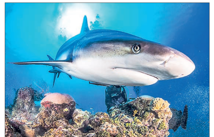
The proposal would place dozens of species of the requiem shark and the hammerhead shark families on Appendix II of the Convention on International Trade in Endangered Species (CITES).

The initiative was one of the most discussed at this year's CITES summit in Panama, with the proposal co-sponsored by the European Union and 15 countries. The meeting began on 14 November, and ends on Friday.—AFP