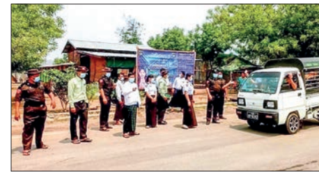
The CSC check is being made to passers-by at the relevant inspection stations.

According to data available as of October, there is a total of 29,284,909 people who have CSCs and 12,163,723 people without CSCs. — TWA/GNLM