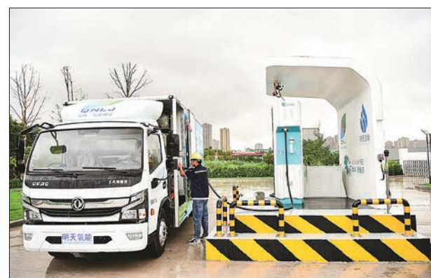
A man refuels a hydrogen fuel cell logistics vehicle in Chongqing.

moting future industries was also released, which proposed building five future industrial clusters.