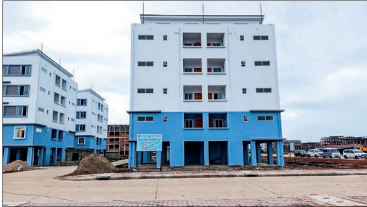
The picture shows the Public Rental Housing Project located between No 7 and No 2 highways in Dagon Myothit (South) Township of Yangon Region.

THE Yangon mayor met officials of YESC and Urban and Housing Development Department to supply electricity temporarily to the sub-power station during its construction period at the public rental housing project in Yangon Region on 23 November.