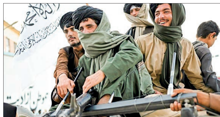
Taliban fighters celebrate the first anniversary of the withdrawal of US-led troops from Afghanistan in Kabul on 31 August this year.