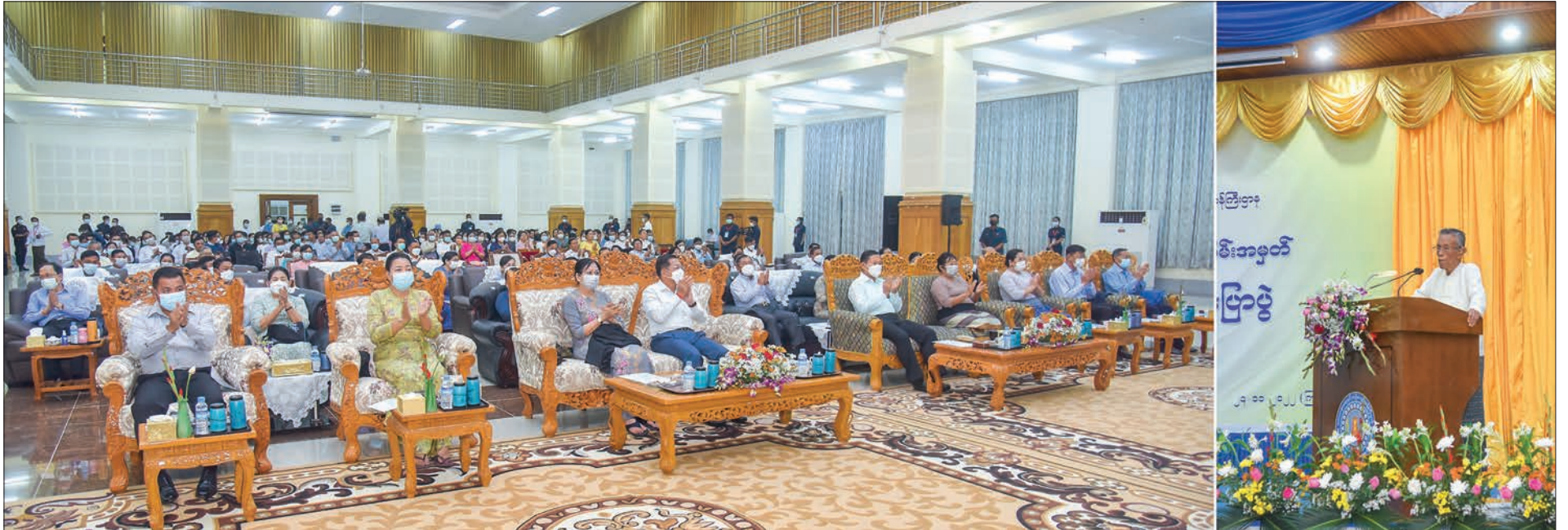
State Administration Council Chairman Prime Minister Senior General Min Aung Hlaing hears the literary talks to mark Sarsodaw Day (literary day) in Nay Pyi Taw on 24 November 2022.

CHAIRMAN of the State Administration Council Prime Minister Senior General Min Aung Hlaing attended the literary talks held in commemoration of the literary day at the Wunzin Min Yaza Hall of the National Library (Nay Pyi Taw) under the Department