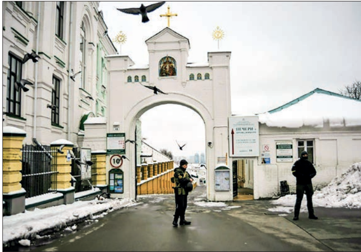
Ukraine's security service said Tuesday it had conducted raids at locations including the 11th century Pechersk Lavra monastery in the capital Kyiv.