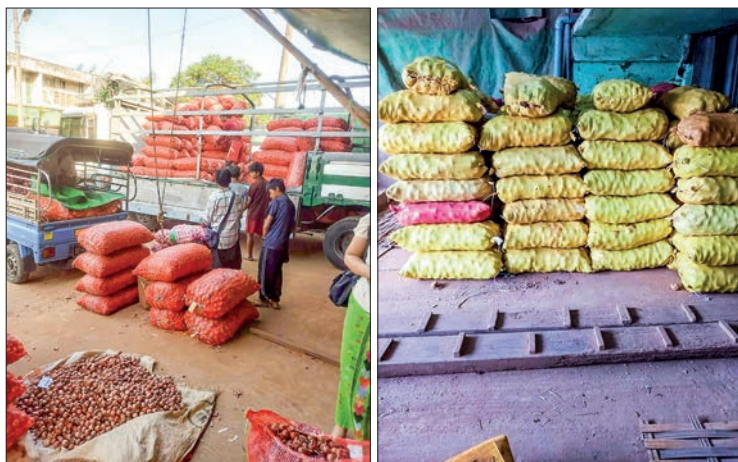
Bags of Shan potatoes and Chinese onions were supplied to the Bayintnaung Market on 24 November.

On 23 November, 114,000 visses of Chinese potatoes and 6,000 visses of Shan potatoes entered the market. Large volumes of Chinese potatoes are daily flowing into Yangon markets, while only small volumes of potatoes from Shan State are seen in the market. The opening price of Shan potatoes was not set on the two days (9 and 12 November). On 15 and 16 November, Chinese potatoes were priced at K2,500-2,550 per viss.