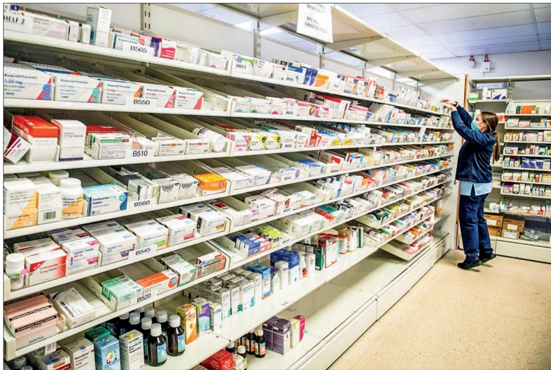
Observers say the intense demand for painkillers has been triggered by an unusual rise in viral infections among children.