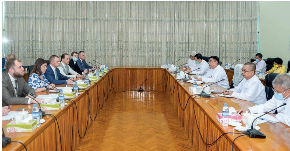
Union Education Minister Dr Nyunt Pe holds talks with the delegation from universities of the Russian Federation yesterday.

UNION Minister for Education Dr Nyunt Pe met the delegation of higher education from universities of the Russian Federation at the meeting hall of the Ministry of Education in Nay Pyi Taw yesterday afternoon.