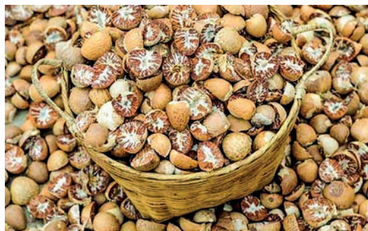
Pieces of cut betel nuts are seen in the market.

ENTRY of new areca nuts drove the prices down when there is a lack of foreign demand, according to the areca nut market in Mawlamyine city.