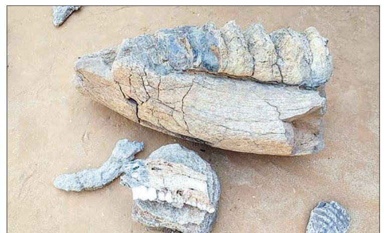
Pieces of primate fossils.

Region as an eighth tour destination connected with Bagan trips for visitors, according to the Directorate of Hotels and Tourism (Bagan Branch).