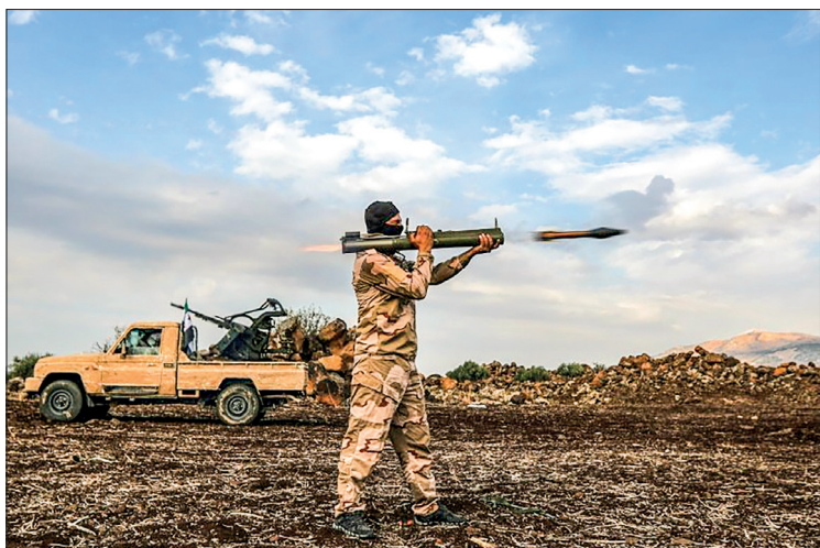
A Syrian fighter fires a rocket-propelled grenade (RPG) during military drills by a Turkish-backed division in northern Syria.

The Iraqi and Syrian governments should not be disturbed by the Turkish operations in those places, he emphasized, adding Türkiye will ensure the protection of territorial integrity of Iraq and Syria.—Xinhua