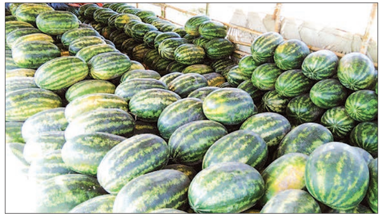
In December 2020, the seedless watermelons were shipped to Dubai for the first time.

Last year, the COVID-19 restrictions hindered Myanmar's watermelon and muskmelon exports to China. Chinese Customs Regulation increased delay. Long delays of trucks caused harm to watermelon quality and only one