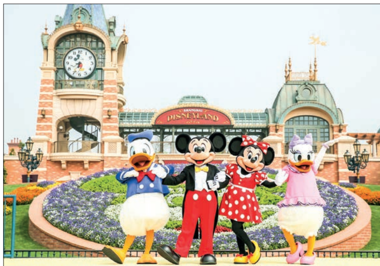
Performers greet tourists at the entrance of the Shanghai Disneyland theme park in east China's Shanghai, 11 May 2020

Shanghai Disney Resort was temporarily closed on 31 Oct 2022 due to COVID-19 control needs. It reopened Disneytown, Wishing Star Park and theme hotels on 17 Nov.—Xinhua