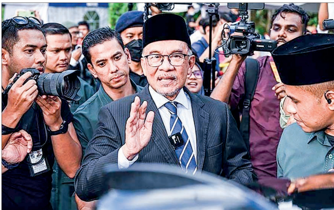
Malaysia opposition leader Anwar Ibrahim (C) leaves after meeting with Malaysia's King at the National Palace in Kuala Lumpur on 22 November 2022.