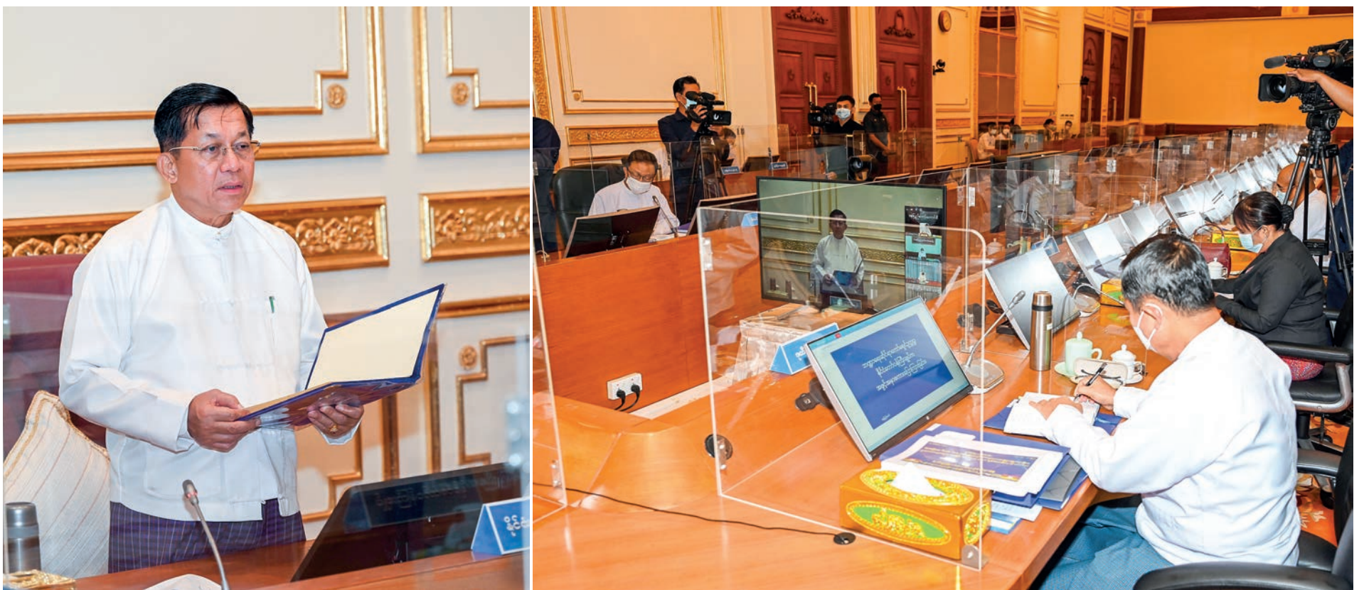
State Administration Council Chairman Prime Minister Senior General Min Aung Hlaing addresses the meeting 2/2022 of the financial commission in Nay Pyi Taw on 24 November 2022.

I T is necessary to levy deserved taxes for the State and the people as local construction projects, agriculture and livestock businesses, CMP industries, manufacturing industries and tourism industries regain improvement, said Chairman of the Financial