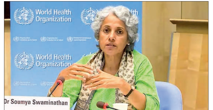
Dr Soumya Swaminathan

Indian paediatrician and clinical scientist Soumya Swaminathan is leaving her post as the WHO's chief scientist.