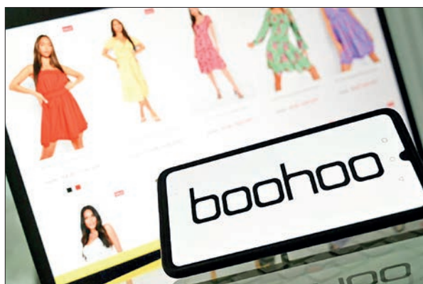
The online retail group has annual sales of almost £2.0 billion per year.

BRITISH online fashion retailer Boohoo on Wednesday denied allegations that staff in a UK warehouse worked in harrowing and health-threatening conditions and regarded themselves as "slaves".