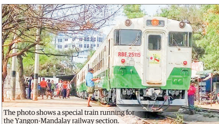
The photo shows a special train running for the Yangon-Mandalay railway section.

For the Yangon-Pyay down-train, the departure time from Yangon Central Railway Station is