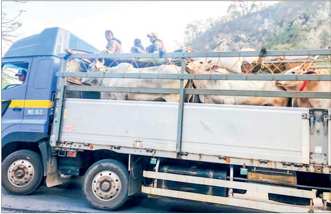
Live cattle were exported to China in 2020.

MYANMAR exported over 1,100 tonnes of wet salted hides of cows and buffalo to India in the past six and a half months of the current financial year 2022-2023, according to the Ministry of Commerce. Between 1 April and 15 October of the current FY, 1,175