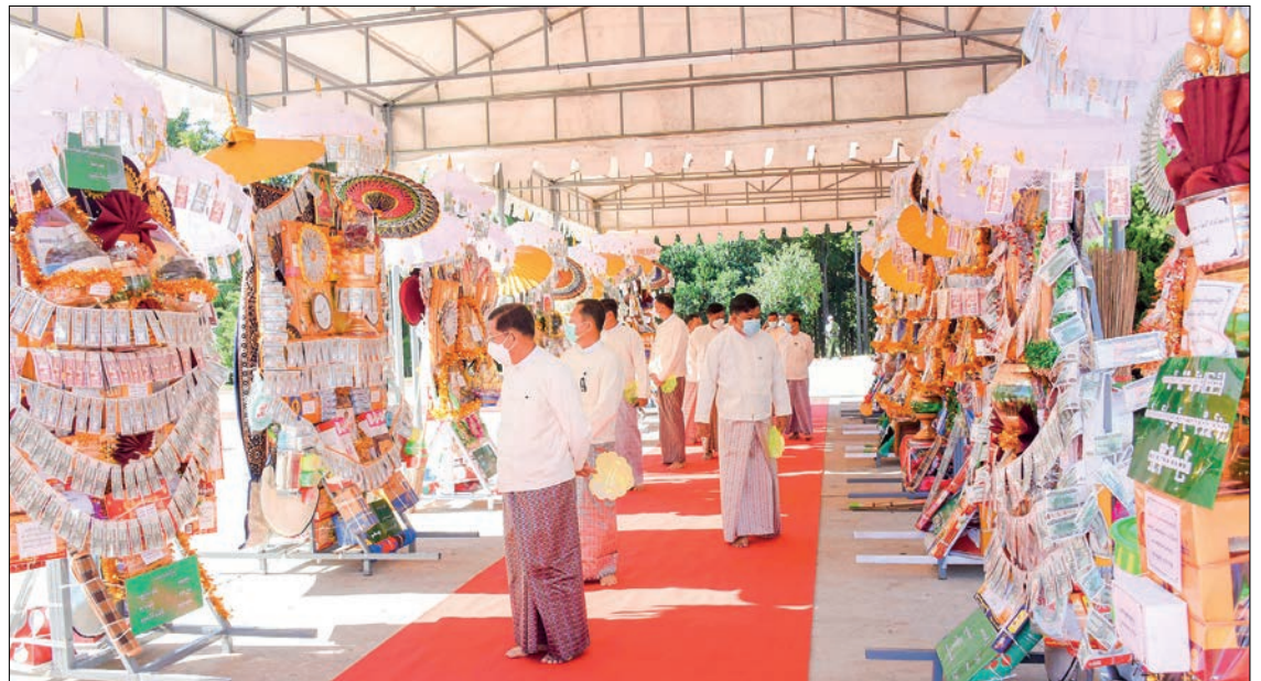
The Senior General and the congregation view the Padathabin donations at the event.

ers, water, oil lights and fruits to the Buddha image in the Anawrahta Hall.