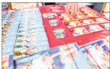
Sim cards are seen being plentifully sold in roadside shops.

Those SIM cards in which the users put wrong and incomplete info will be closed by checking the national database of the Ministry of Immigration and Population, the department stated. — TWA/GNLM