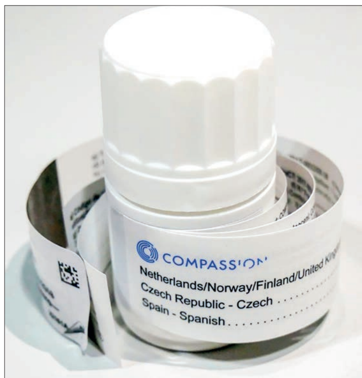
Pills containing psilocybin used in a study conducted by a British startup company, COMPASS Pathway.

The researchers tested a synthetic version of psilocybin developed by the start-up Compass Pathway, which also funded the trials.—AFP