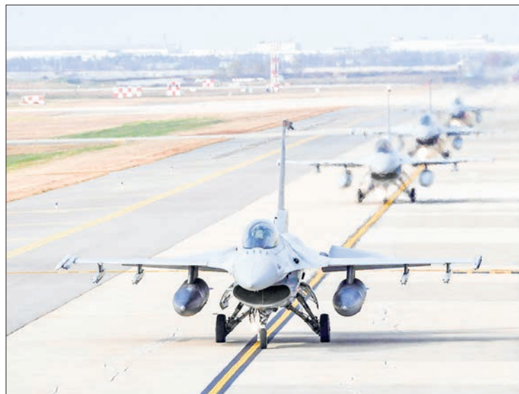
South Korean Air Force KF-16 fighter jets take part in the Vigilant Storm joint South Korean-US air drills at an airbase in Gunsan, South Korea, on Tuesday.

Vigilant Storm, the first large-scale joint air drill in five years involving more than 240 warplanes, began Monday and was initially due to last until Friday. The two countries have agreed to show their firm deterrence posture amid heightened worries over North Korean