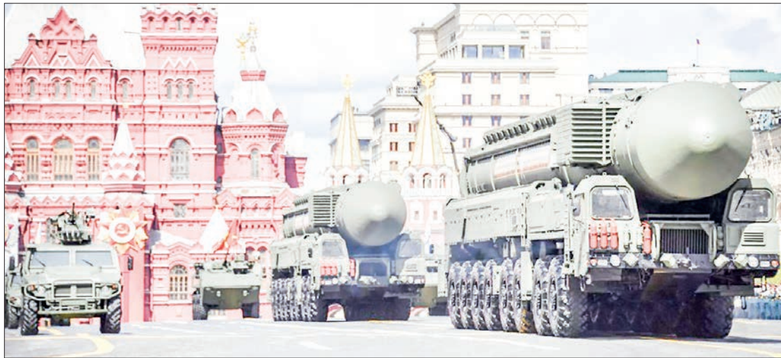
Russian Yars intercontinental ballistic missile launchers parade through Red Square during the Victory Day military parade in Moscow on 9 May 2022

ment came amid rising fears of nuclear use in the Ukraine con-