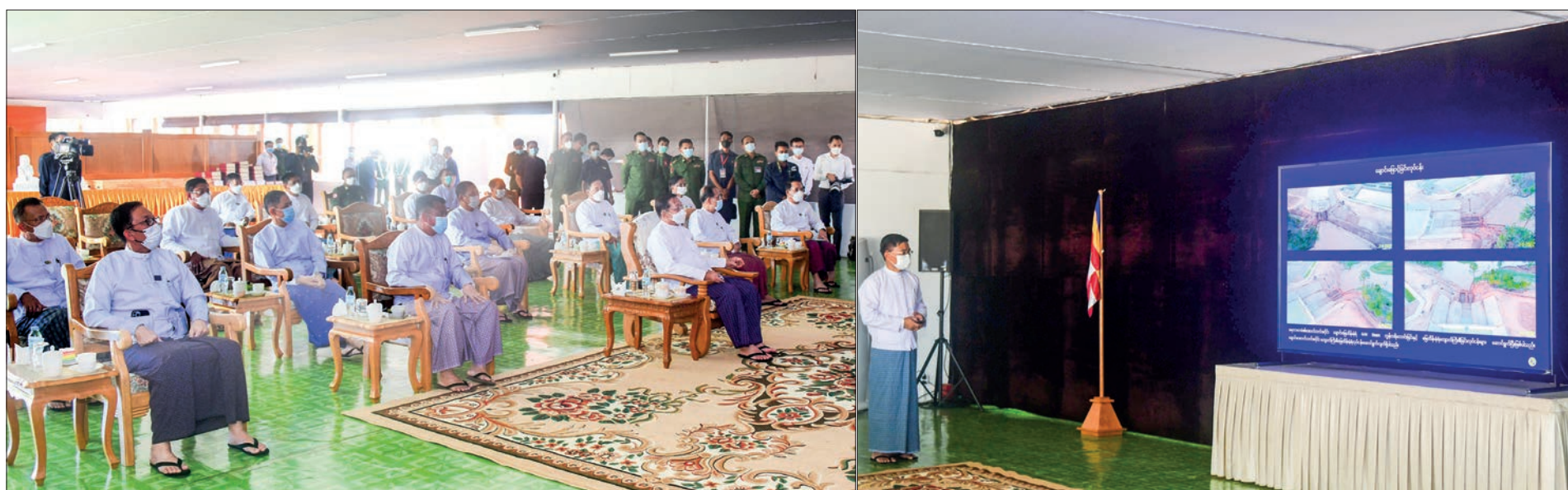
State Administration Council Chairman Prime Minister Senior General Min Aung Hlaing hears the progress reports on the construction of Maravijaya Buddha Image in Nay Pyi Taw yesterday.