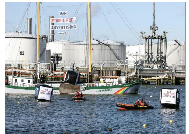
Activists of the environmental NGO Greenpeace take part in an action blocking the port of Dutch oil company Shell's refinery on Pernis site in Rotterdam, on 4 October 2021.

The 3.2 billion euros the government expects to raise through the levy will be used to partly compensate for an energy cap for small consumers affected by high energy prices, the letter said. (1 euro = 1 US dollar)—Xinhua