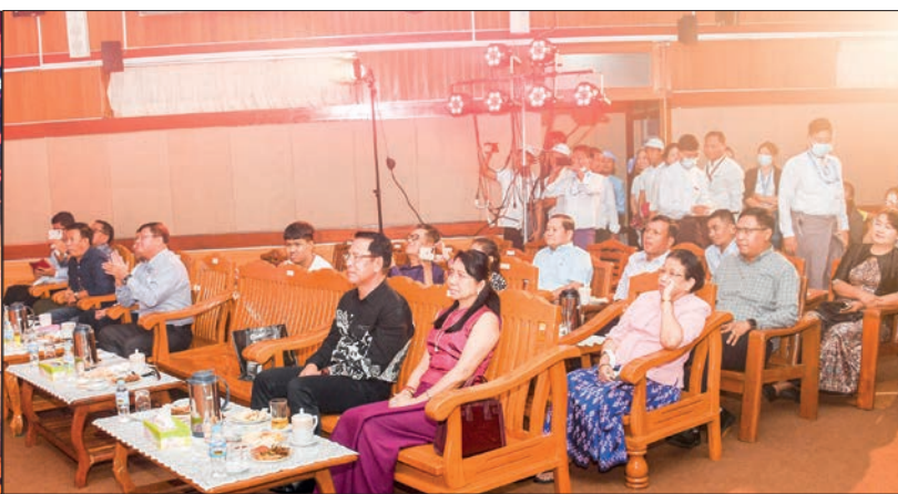
Union Information Minister U Maung Maung Ohn and wife, employees and family members watch the concert to mark the Tazaungdaing Festival yesterday.

AIMING to provide relaxation and happiness to the employees who are responsible for the smooth operation of the State government, a concert related to the Tazaungdaing Festival was held at the Ministry of In-