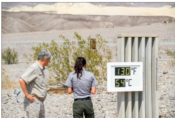
Visitors feel the heat in California's Death Valley on 19 June 2021.

The team analyzed the global impact of rising temperatures on public health and the economy, finding that heat-related deaths increased 68 per cent between 2017-2021, compared with the same duration of time from 2000-