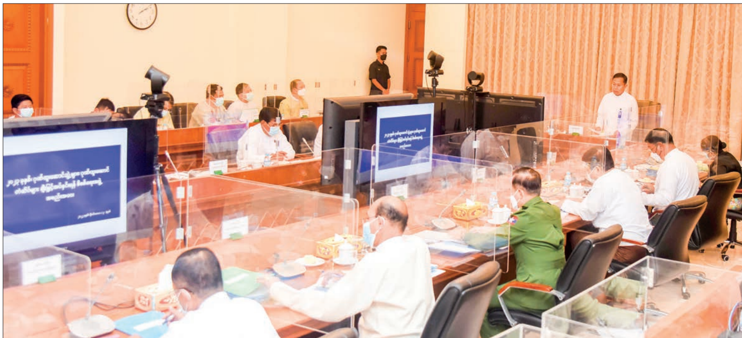
State Administration Council Vice-Chairman Deputy Prime Minister Vice-Senior General Soe Win chairs the meeting of the scrutinizing body to confer titles and medals of honour for 2023 yesterday.

He added that there will be 12 categories of titles and medals to be awarded to people from all fields and all spheres of life and the list of those who deserve to be awarded will be announced on the diamond jubilee Independence Day which falls on 4 January 2023.