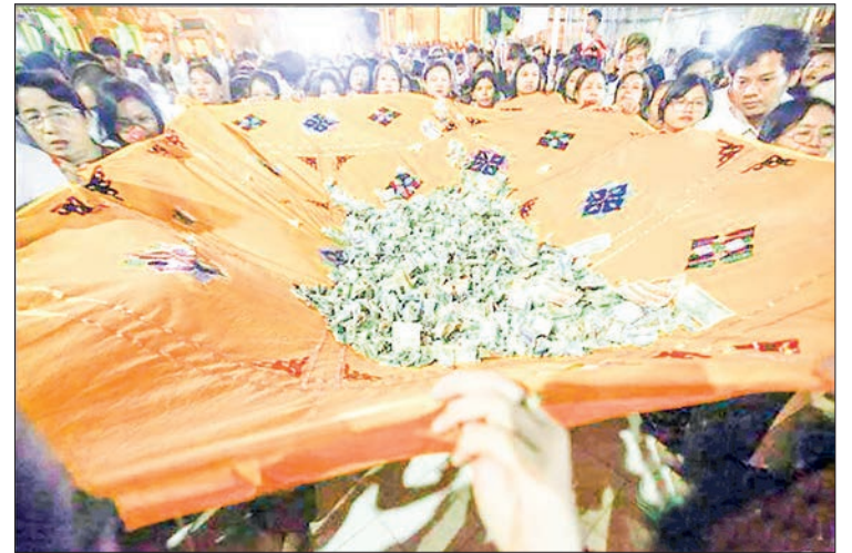
The Matho Thingan (non-perishable robe) offering ceremony was held at Shwedagon Pagoda on the full moon day of Tazaungmone in 2018.

This year, the annual weaving of Matho Thingan (non-perishable robe) and Matho Thingan offering festival will not be held at the Shwedagon Pagoda on the full moon day of Tazaungmone. In Tazaungmone, the people celebrate the Matho Thingan donation ceremonies. They are called non-perishable robes because they are not allowed to go stale, they are woven within the space of the night. It seems to imitate the Kathina robe. According to the sermons