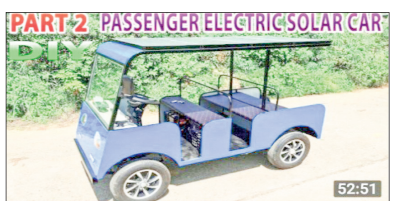
Build a Passenger Electric Solar Car at Home - Tutorial - Part 2

The cost-effective and easy-to-install solar energy pumping system for agricultural purposes.