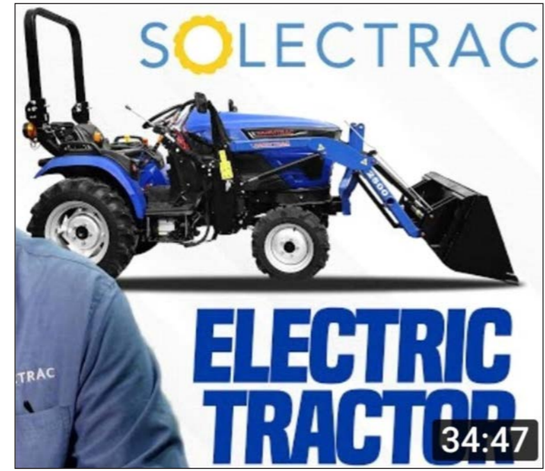
Sample Electric Tractor-Shovel for village road & Mini Irrigation Works.