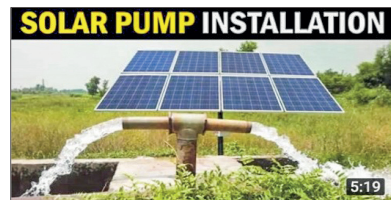
Solar Water Pump Irrigation System | Solar water Pump Install...

The cost-effective and easy-to-install solar energy pumping system for agricultural purposes.