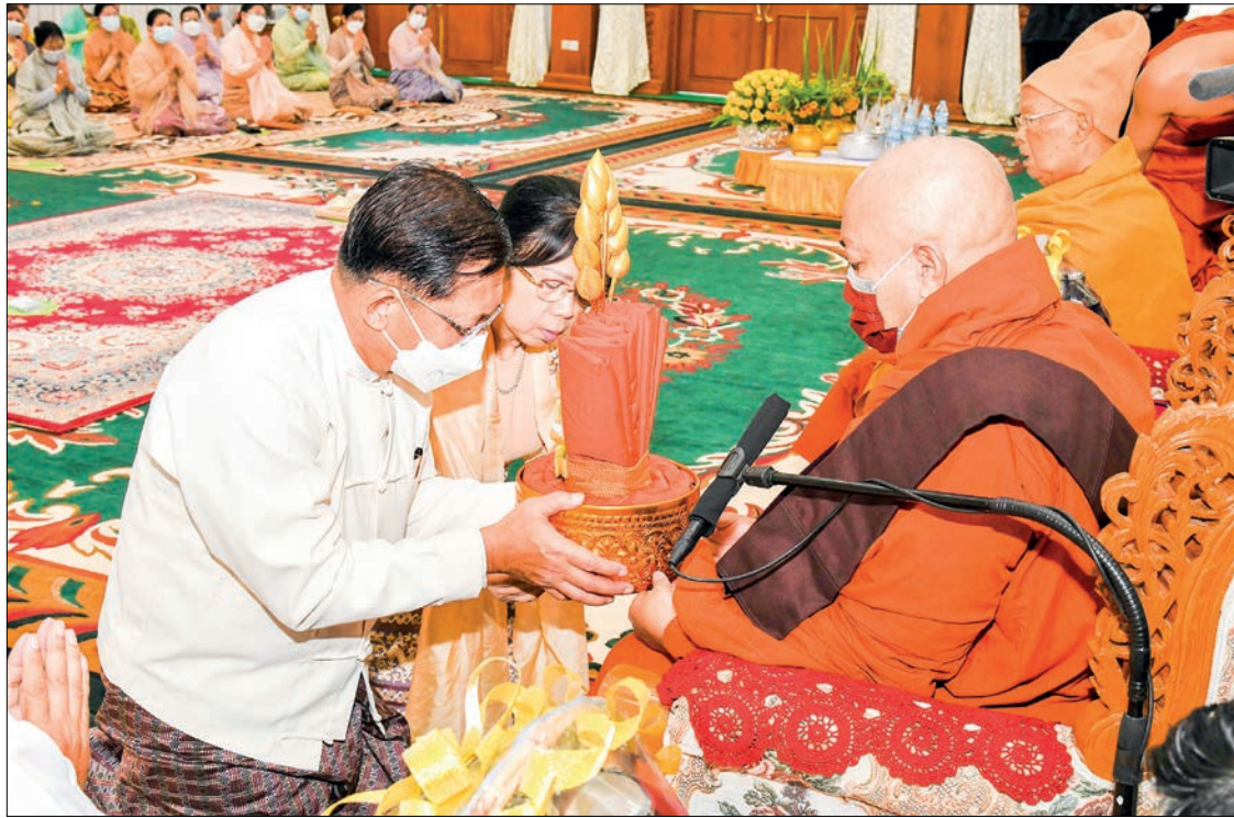
Senior General Min Aung Hlaing and wife present Kathina robes to the Sayadaws yesterday.

First, the Senior General and wife together with congregation viewed round the Kathina robes, offertories and Padethabin structures to be donated to monasteries. The Senior General and wife paid homage and offered alms in the emerald alms bowl, flow-