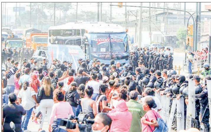
A mass transfer of inmates from the Guayas 1 prison is said to have sparked the attacks.

Two police officials were also injured. Groups armed with guns and explosives, including car bombs, hit more than 18 targets Tuesday in the cities of Guayaquil and Duran in Guayas province and in Esmeraldas along the border with Colombia.—AFP