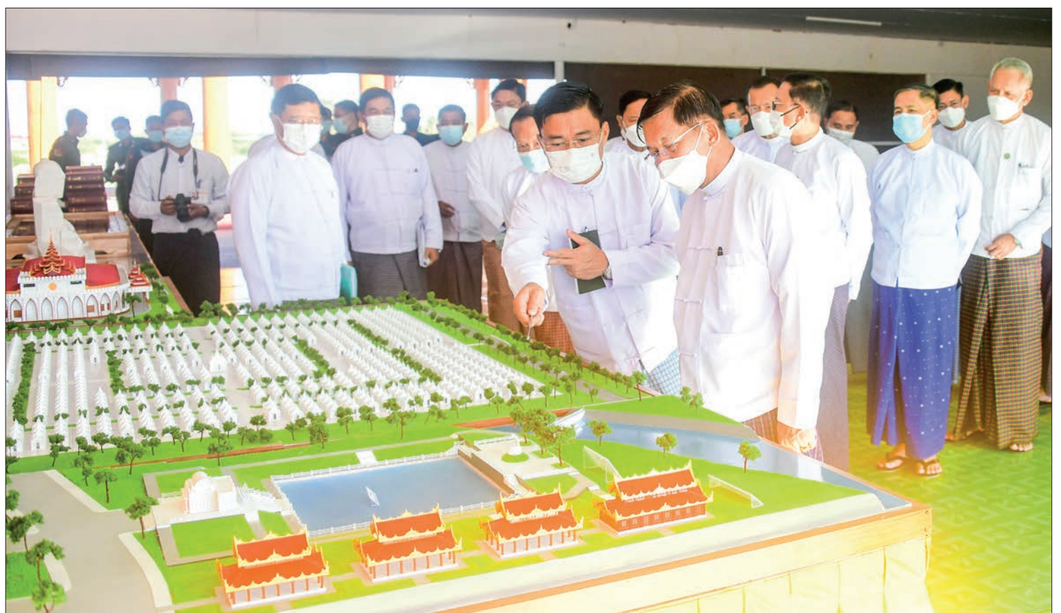
State Administration Council Chairman Prime Minister Senior General Min Aung Hlaing looks into the scale model of the Maravijaya Buddha Park in Nay Pyi Taw on 3 November 2022.