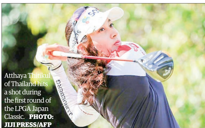
Atthaya Thitikul of Thailand hits a shot during the first round of the LPGA Japan Classic.

The 19-year-old Atthaya is playing her first tournament since becoming the second-youngest world number one in women's golf history this week, following a stunning debut year on the LPGA tour.— AFP