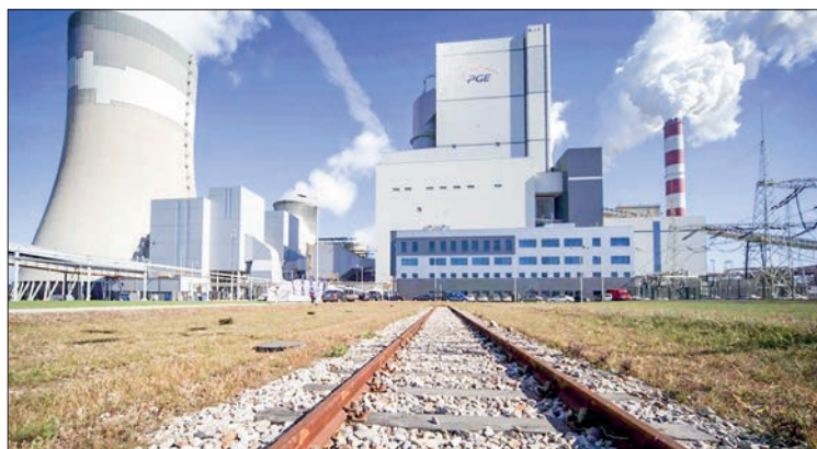
A coal-fired power plant in Poland.

POLAND said Wednesday its first nuclear power station will cost around $20 billion (euros) to build, days after the government announced it had picked US firm Westinghouse for the job.