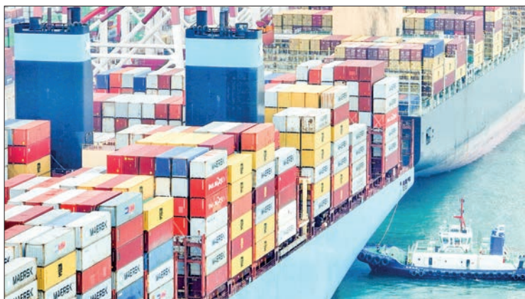
Goldman Sachs CEO David Solomon said that the global economy is undergoing a rebalancing period, which in the past usually takes between two to four quarters.

"My gut is the central banks will, in aggregate, tame inflation," Morgan Stanley CEO James Gorman said. "It's highly improbable we'll get back to the kind of one to two per cent