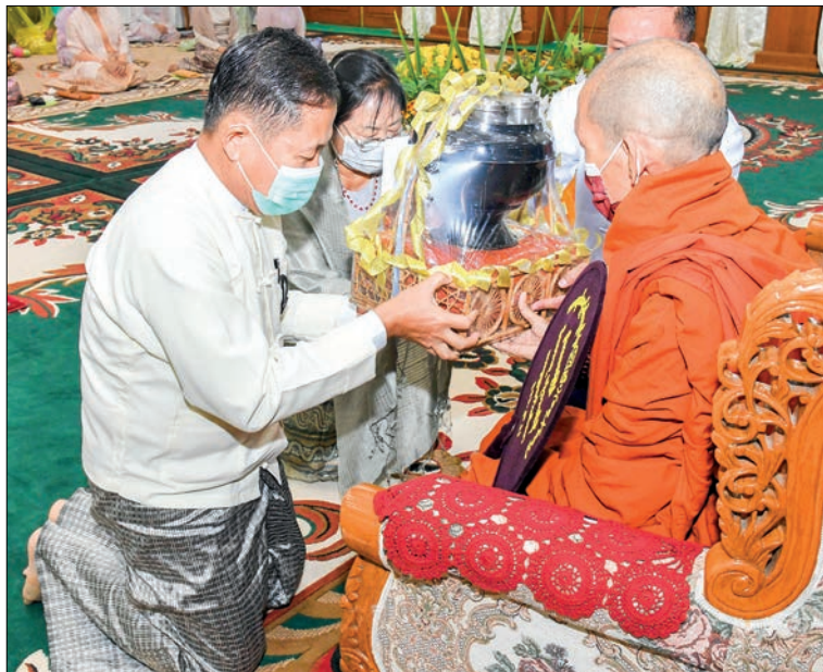
Vice-Senior General Soe Win and wife offer Kathina robes to the Sayadaw.

Today's donation ceremony totalled 84 Padethabin