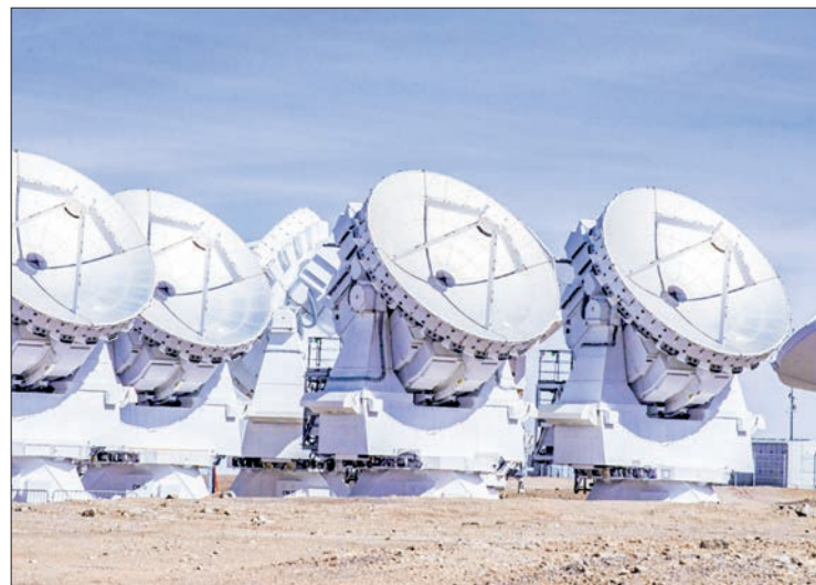
The ALMA space telescope in Chile has been the target of a cyberattack.

It is built in one of the driest places on earth, in the Atacama desert, more than 5,000 metres above sea level. In April, ALMA helped find the most distant galaxy candidate observed to date — some 13.5 billion light-years from Earth.—AFP