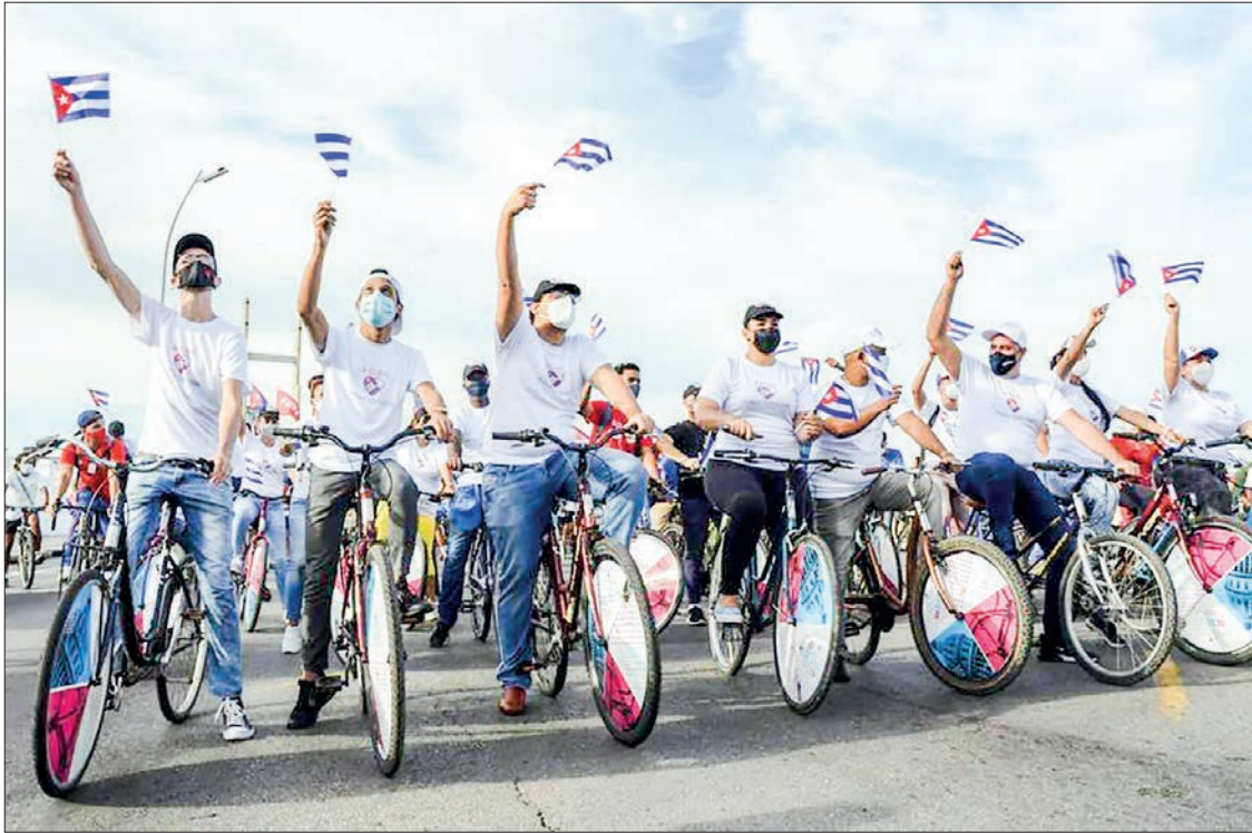
People participate in a rally against US embargo in Havana, Cuba, 5 Aug 2021.

THE US trade embargo against Cuba has cost the Caribbean country's sports sector an estimated 15 million US dollars in lost revenue over the past five years, according to an official.