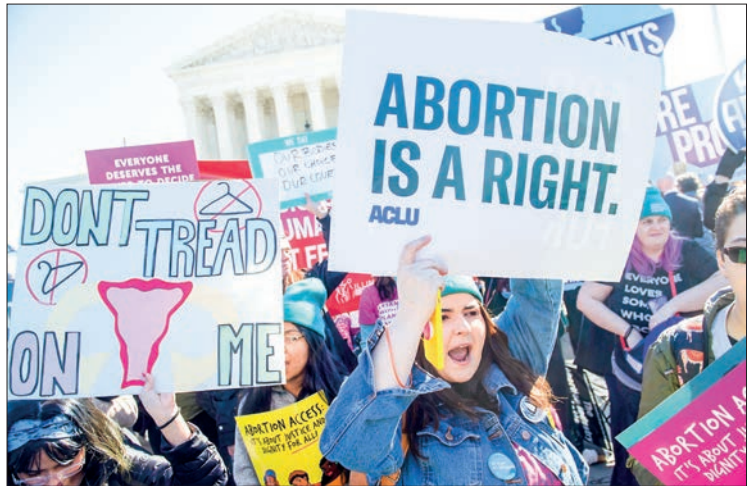
Activists supporting legal access to abortions protest during a demonstration outside the Supreme Court on March 4, 2020.

REQUESTS by Americans for abortion pills from outside the United States have surged since the US Supreme Court's explosive decision last summer to overturn the nationwide right to the procedure, according to a study published Tuesday.