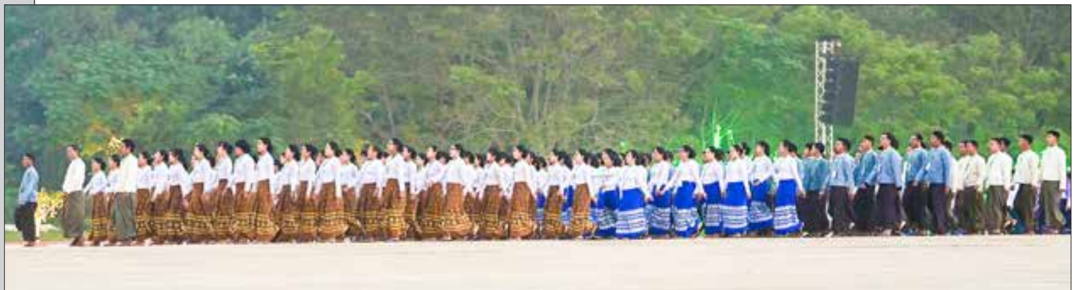
Vice-Senior General Soe Win and dignitaries watch the full-dressed rehearsal in Nay Pyi Taw on 31 December 2022.

The Vice-Senior General who is in his capacity as Chairman of the Central Committee on Organizing the Diamond Jubilee Independence Day ceremony was accompanied by members of the State Administration Council, central committee member Union ministers, and the chairman of Nay Pyi Taw Council, deputy ministers who are in the capacity of relevant subcommittee chairpersons, officials, and senior military officers from the Office of the Commander-in-Chief. The Vice-Senior General coordinated necessary measures with officials.