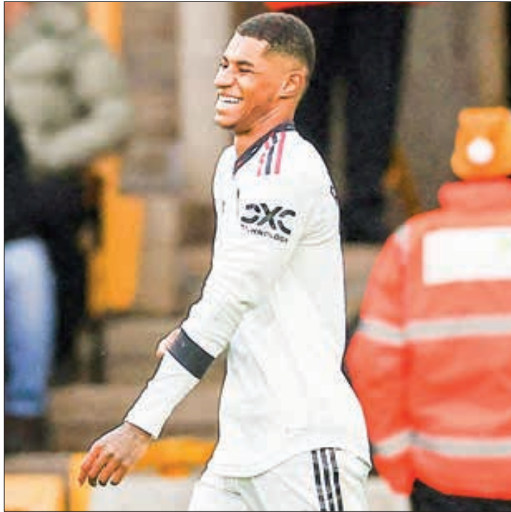
Manchester United's English striker Marcus Rashford smiles as he celebrates after scoring the opening goal of the English Premier League football match between Wolverhampton Wanderers and Manchester United at the Molineux stadium in Wolverhampton, central England on 31 December 2022.

Rashford looked determined to prove Ten Hag was wrong to drop him as he rampaged through the Wolves de-