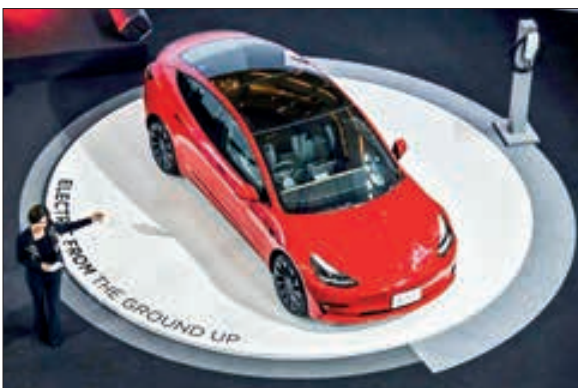
Tesla lost a staggering two-thirds of its market value in 2022.

But this is slower than the furious pace of growth that CEO Musk demands of his company with his stated ambition that Tesla unseat Apple as the world's most valued company. Even if the share price is subject "to a lot of emotional elements... Tesla will be by my best guess the most valuable company in the world in less than five years," a defiant Musk told a forum on Twitter this month.—AFP