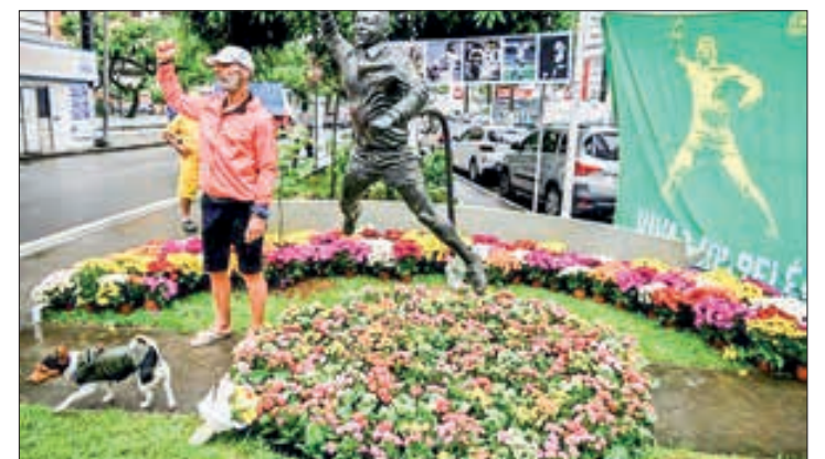
A man poses for a photo by the statue of late football legend Pele outside the Vila Belmiro stadium in Santos, Brazil.

"In the New Year, the Ukrainian athletes can count on the full commitment to this solidarity from the IOC and the entire Olympic Movement. We want to see a strong team from... Ukraine at the Olympic Games Paris 2024 and the Olympic Winter Games Milano Cortina 2026." —AFP