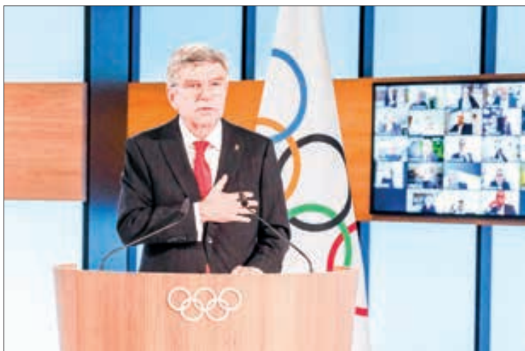
IOC president Thomas Bach.

THE sporting sanctions imposed on Russia and Belarus over the invasion of Ukraine must remain firmly in place in 2023, the head of the International Olympic Committee insisted Friday.