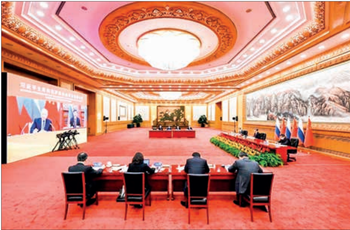
Chinese President Xi Jinping meets Russian President Vladimir Putin via video link in Beijing, capital of China, 30 December 2022.

CHINESE President Xi Jinping had a virtual meeting with Russian President Vladimir Putin in Beijing on Friday afternoon.