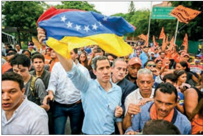
Venezuelan opposition leader Juan Guaidó waves a national flag during a demonstration in October 2022.

THE Venezuelan opposition on Friday dissolved the “interim government” led by Juan Guaidó, once the popular and internationally recognized face of a failed drive to oust leftist leader Nicolás Maduro.