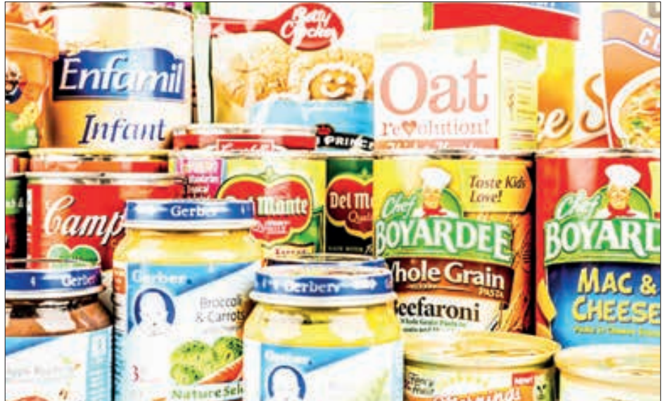
The overall exports of agricultural and processed food products rose to 17.43 billion US dollars during April-November from 15.07 billion dollars in the same period a year earlier.

INDIA'S exports of agricultural and processed food products rose by 16 per cent in the first eight months (April-November) of the current financial year 2022-23, in comparison to the corresponding period of the last financial year, said the federal Ministry of Commerce and Industry on Friday. The overall exports of agricultural and processed food products rose to 17.43 billion US dollars during April-November in the same period a year earlier, data released by the Directorate General of Commercial Intelligence and Statistics showed. Thus the country has achieved nearly 74 per cent