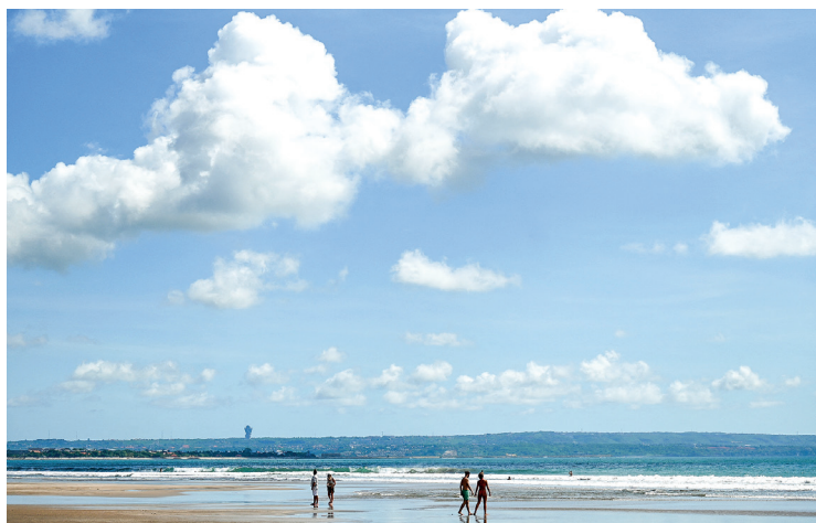
Foreign tourists walk on a beach in Seminyak, Badung regency on Indonesia resort island of Bali, on 7 December 2022.

Businesses have voiced worries that the sweeping overhaul of the criminal code will be detrimental to tourism