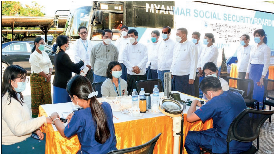
Union Information Minister U Maung Maung Ohn, Union Labour Minister Dr Pwint San and party inspect the healthcare services yesterday.

The Social Security Board of MoL is drafting a strategic plan under the Social Insurance system and providing 15 SSB benefits of two insurance systems out of six to the employees, who are mainly from the country's manufacturing sector, using the SSB contributions of employer, employee and government under the 2012 Social Security Law. Depending on the monthly SSB fees,