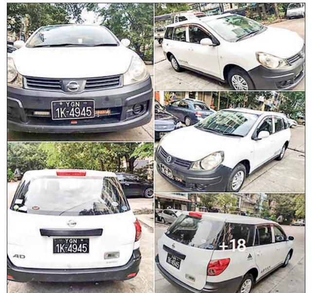
An online sale post on Tamway car market Facebook page.

san March, K55-80 million for 2006-2008 Mitsubishi Fuso Canter, K15-30 for 2018, 2019 Suzuki Carry Truck. —TWA/EMM