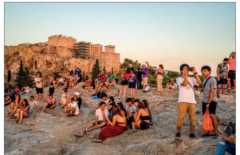
Tourists sit at Areopagus hill overlooking the ancient Acropolis in Athens on 12 July 2022.

"You live a great one or two months here enjoying your vacation and spending less than you would have spent staying at home," Kikilias said. —AFP