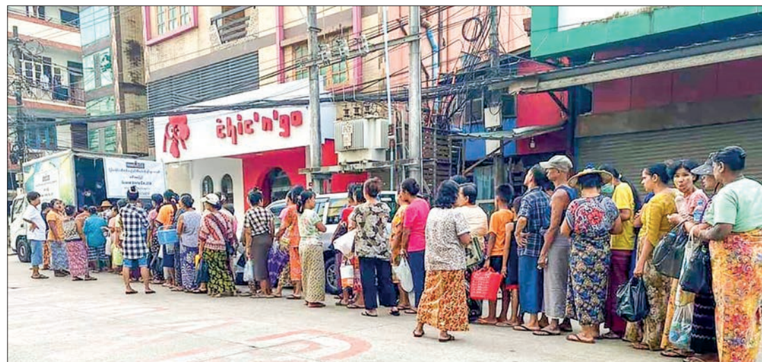
Locals are seen lining up to buy palm oil at the reference price.

THE wholesale reference rate of palm oil in the Yangon market continued rising, according to the Supervisory Committee on edible oil import and distribution.