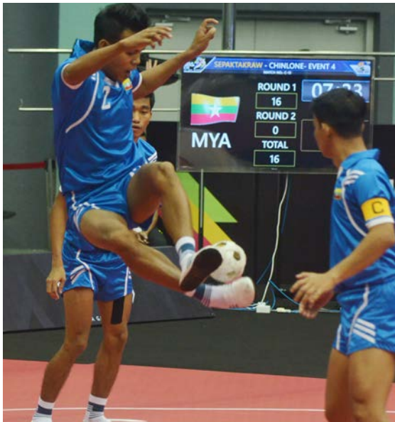
The Myanmar team is seen competing in the previous SEA Games.

THE 32 nd SEA Games, which will be hosted by Cambodia, will include 12 types of competition in the Chinlone (cane ball) sports event.