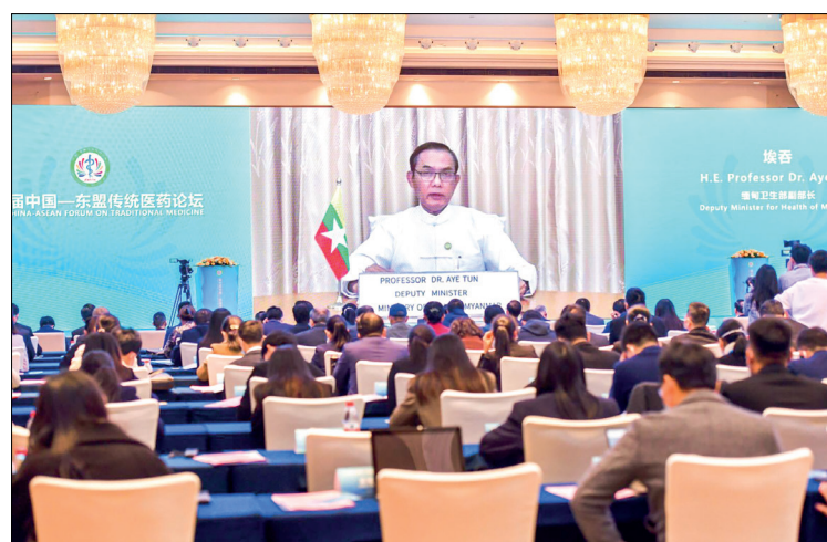
The seventh China-ASEAN Forum on Traditional Medicine is in progress yesterday.

THE opening ceremony of the seventh China-ASEAN Forum on Traditional Medicine was held in China's Guangxi Zhuang Autonomous Region via a hybrid method yesterday.