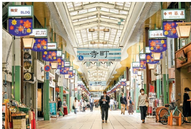
People walk along a popular covered shopping street in central Kyoto on 13 October 2022.

The yen's weakening, particularly against the US dollar, has been boosting the import costs of everything from energy and raw materials to food items. Import prices jumped 28.2 per cent from a year earlier, compared with a 15.1 per cent gain in export prices.