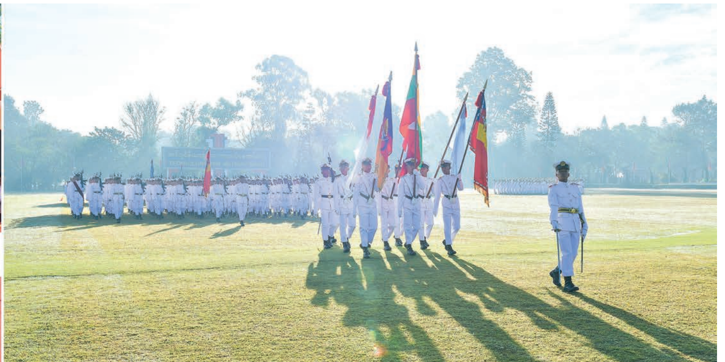
State Administration Council Vice-Chairman Deputy Commander-in-Chief of Defence Services Commander-in-Chief (Army) Vice-Senior General Thray Sithu Soe Win addresses the Passing-out Parade of the 24 th Intake of the Defence Services Technological Academy in PyinOoLwin yesterday.

ON behalf of Chairman of the State Administration Council Commander-in-Chief of Defence Services Senior General Maha Thray Sithu Min Aung Hlaing, Vice-Chairman of the State Administration Council Deputy Commander-in-Chief of Defence Services Commander-in-Chief (Army) Vice-Senior General Thray Sithu Soe Win delivered an address at the Passing-out Parade of the 24 th Intake of the Defence Services Technological Academy, which took place at the parade ground of DSTA in PyinOoLwin yesterday morning.