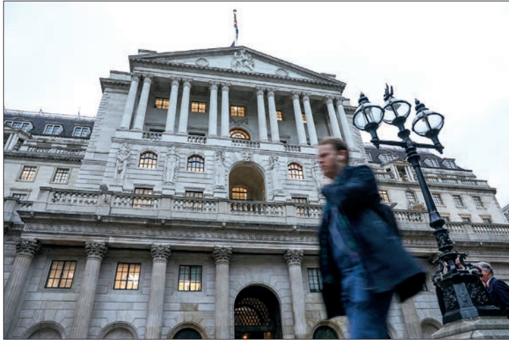
The Bank of England, Britain's central bank, is pictured in the City of London on 2 November 2022.

BRITAIN'S economy grew 0.5 per cent in October, official data showed Monday, after a sharp fall the previous month in part because of the national holiday for Queen Elizabeth II's funeral.