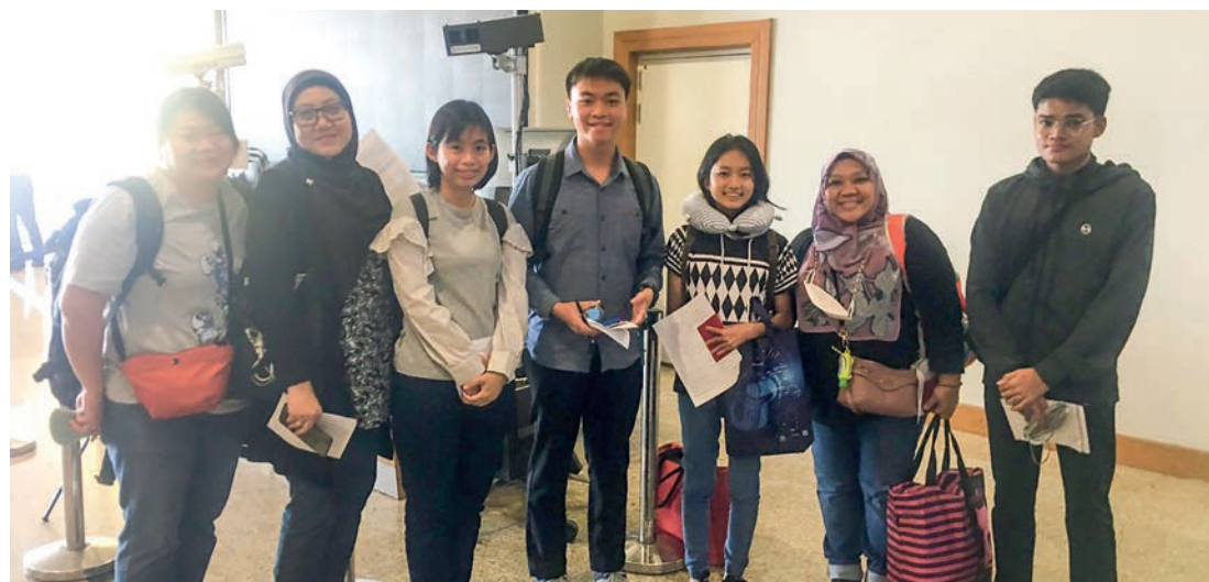
Students from ASEAN countries are seen at Yangon International Airport on 11 December.

yesterday and will conduct the rehearsal event at Nay Pyi Taw MICC-II today. They will compete in the 10 th ASEAN Quiz-Regional Level representing their respective countries on 14 December.—MNA /KTZH