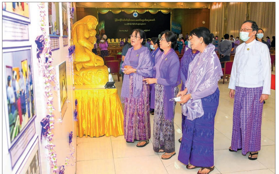
The wife of the SAC Chairman Prime Minister and party view round the documentary photos at the event.