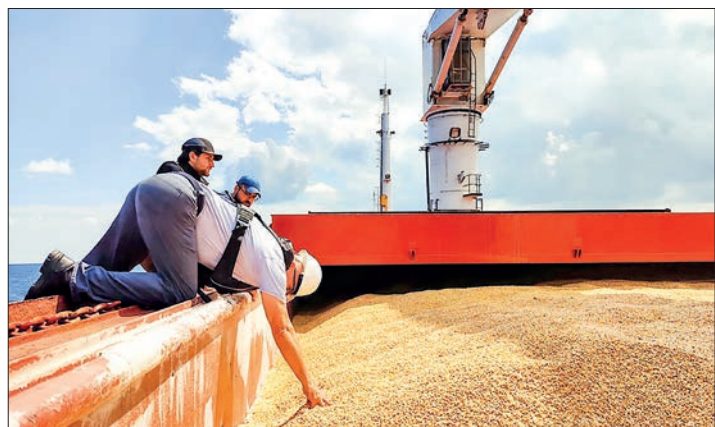
A team of representatives from the Joint Coordination Centre inspects on the first grain-laden ship leaving Ukraine on the northwestern entrance of the Bosphorus Strait in Istanbul, Türkiye, 3 August 2022.

Earlier in the day, Erdogan had a phone talk with Russian President Vladimir Putin, during which they discussed Türkiye-Russia relations, exports through the Black Sea grain corridor and the fight against terrorism along the Turkish-Syrian border, said the Turkish presidency.—Xinhua