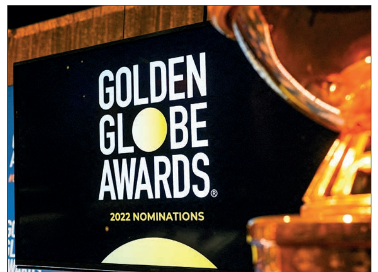
(FILES) In this file photo taken on 13 December 2021, the stage is set for the nominations announcement for the 79th Golden Globe Awards at the Beverly Hilton Hotel in Beverly Hills, California.

"It's because of the history that I have with them. And my mother didn't raise a hypocrite," Fraser told GQ last month.