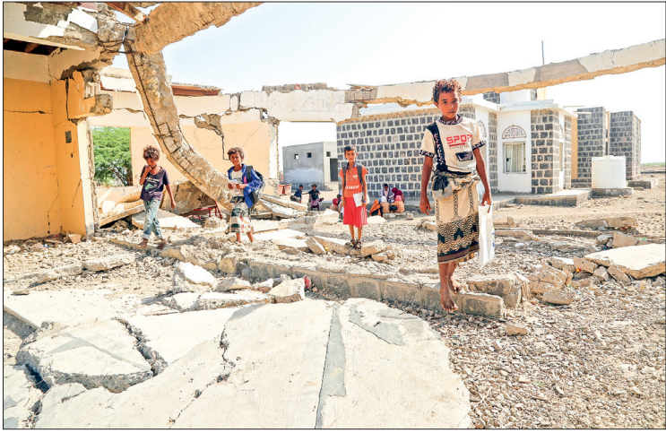
Yemeni children attend class outdoors in a heavily damaged school on the first day of the new academic year in Yemen's war-torn western province of Hodeida on 17 October 2022.

MORE than 11,000 children are known to have been killed or maimed in Yemen's civil war since it escalated nearly eight years ago, the United Nations said Monday.