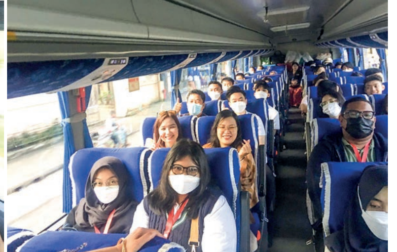
ASEAN students are seen on the way to Nay Pyi Taw (above and below photos).

gapore in 2020 was an online event due to the outbreak of COVID-19.