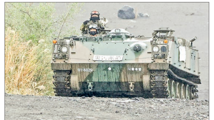
Japan Ground Self-Defence Force personnel conduct an evacuation drill on 19 November 2022, for a massive eruption on Sakurajima in Kagoshima Prefecture, southwestern Japan.

But the prime minister has ruled out new government bonds as a stable funding source, with Japan's fiscal health in dire straits. The ruling coalition is expected to finalize a tax reform plan for the next fiscal year later this week.—Kyodo