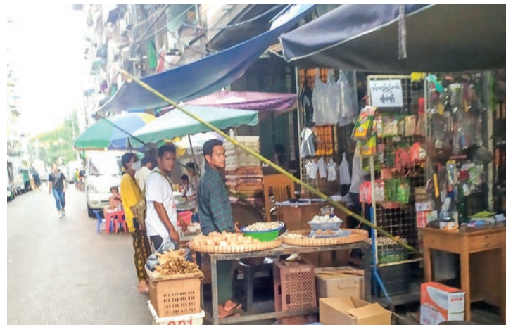
A grocery is seen near the Lanmadaw Than Market.

It is known from the market that the prices of some commodities decreased again in December, so it has become convenient for consumers. —TWA/KZL