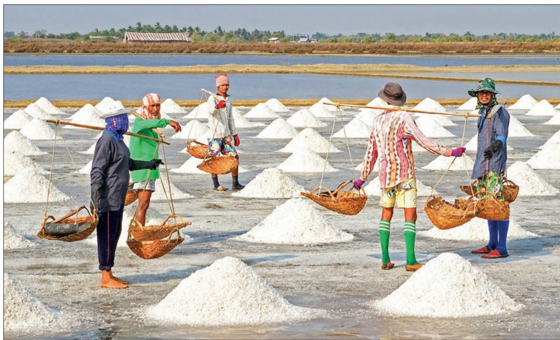
Mon State, the second largest producer in Myanmar, yearly produces 40,000 tonnes of sun-dried salt, beyond magnesium chloride (MgCl 2 ), iodized salt (I2) and table salt (NaCl).

Mon State, the second largest producer in Myanmar, yearly produces 40,000 tonnes of sun-dried salt, beyond magnesium chloride (MgCl 2 ), iodized salt