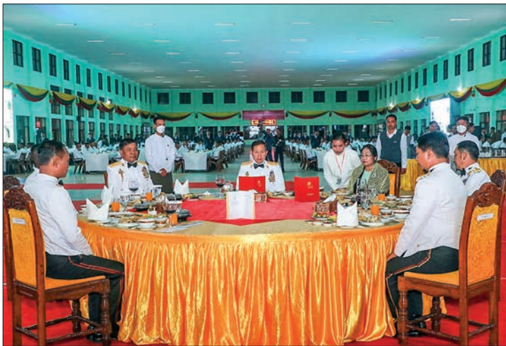
The Vice-Senior General attends the graduation dinner (Left) and the song and dance performances are in progress during the dinner (Right).