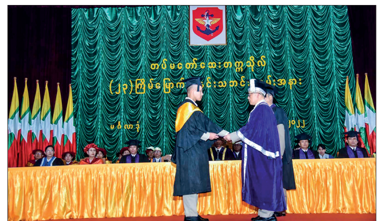
The Convocation of the 23 rd Intake of Defence Services Medical Academy is underway yesterday.

After the commandant gave the convocation speech, the ceremony came to a close and the commandant, the rector and party left the convocation hall.