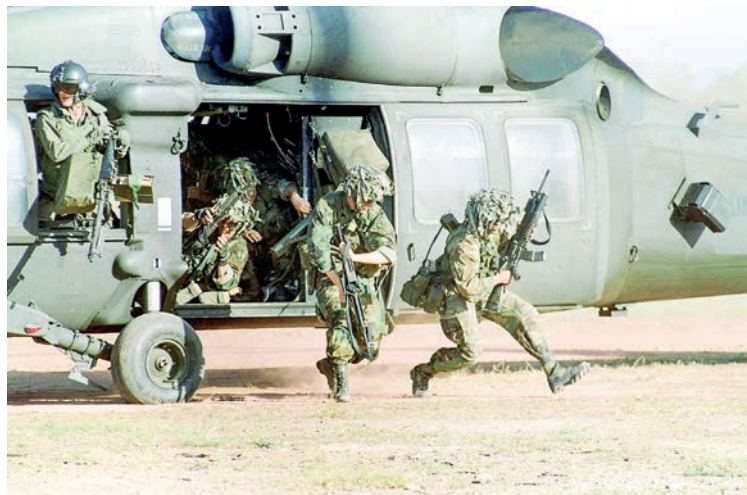
US soldiers run for cover following their arrival at a military command post loyal to General Manuel Antonio Noriega in Santiago, Panama in this 23 Dec 1989 file photo.

PANAMA on Tuesday observed a day of national mourning for the first time ever to mark the anniversary of the US invasion in 1989 to oust dictator Manuel Antonio Noriega.