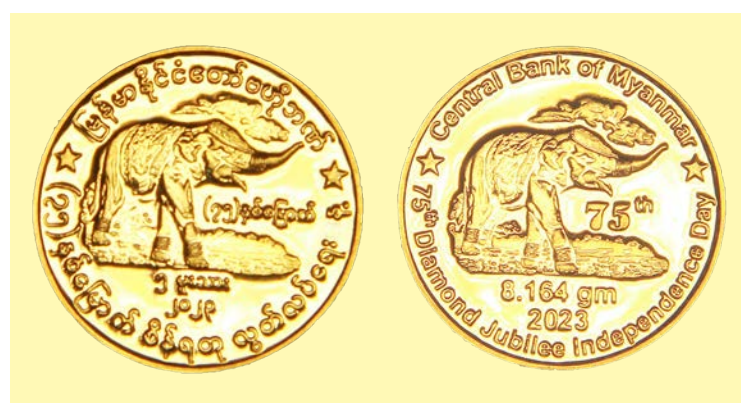
Samples of half-tical gold coins.

At the centre of the face of the new gold coin is a portrait of a White Elephant with the words “half-tical 2023” writ-