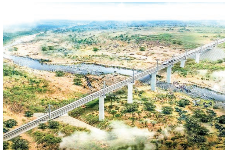
Rendering of one of the stages of Phase 5 of Tanzania’s Standard Gauge Railway.

President Samia Suluhu Hassan, who witnessed the signing, said the construction of the final section of the Standard Gauge Railway (SGR) from Tabora to Kigoma in western Tanzania would be completed in 2026, nine years after it began.