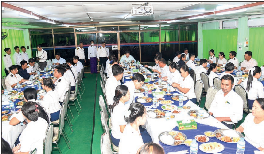
The Senior General lunches together with the factory employees.