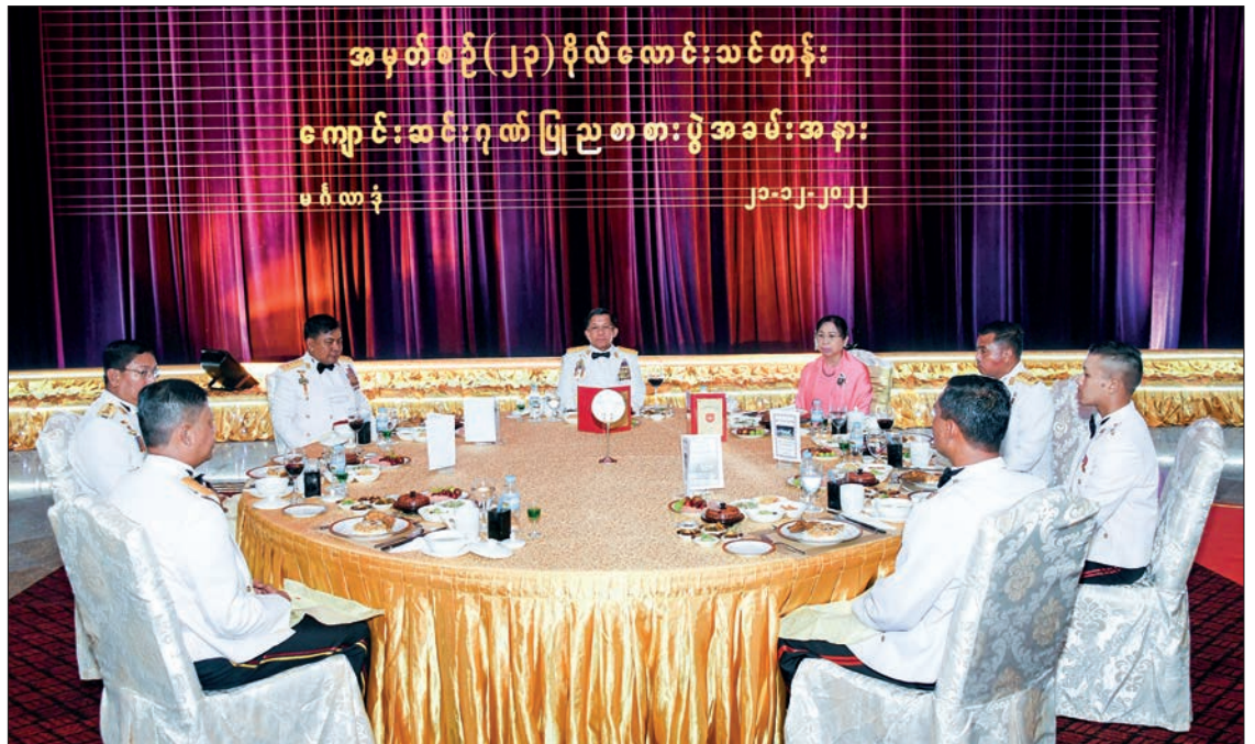
State Administration Council Chairman Commander-in-Chief of Defence Services Senior General Min Aung Hlaing attends the dinner yesterday.

Before and during the dinner the Myawady Band entertained the guests. The Senior General and party watched performances. — MNA