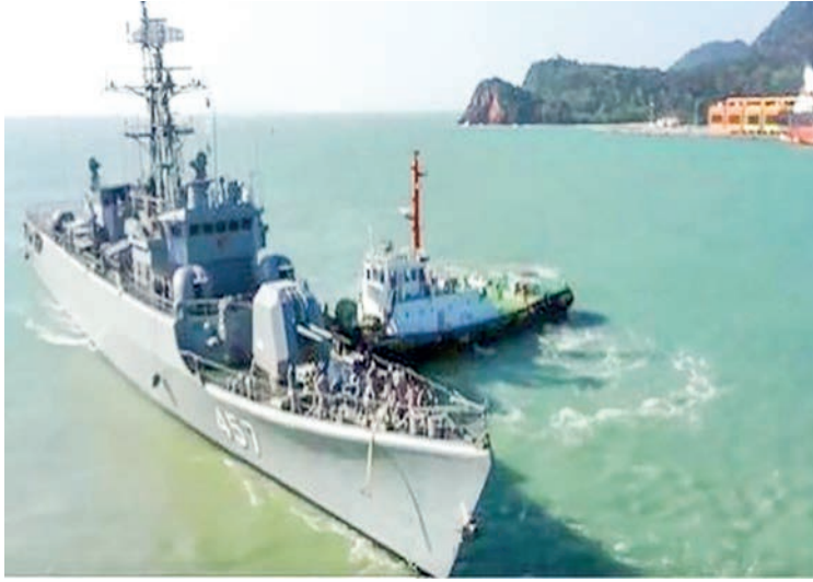
Search and rescue efforts are continuing by air and sea, with rescue workers sent off the coast of Prachuap Khiri Khan Province in central Thailand.

THE Royal Thai Navy said Tuesday that six bodies have been recovered and 23 other crew members remain missing after one of its ships sank in the Gulf