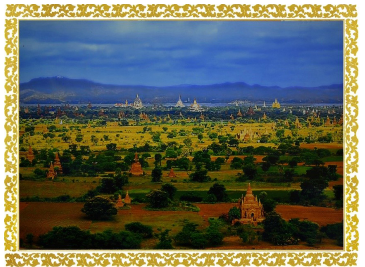
Scenic Beauty of Bagan.

(Excerpt from the message sent by Chairman of the State Administration Council Prime Minister Senior General Min Aung Hlaing to the 74 th Anniversary of the Shan State Day on 7 February 2021)