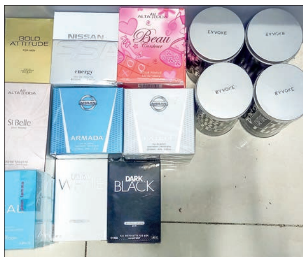
Officials check confiscated illegal timbers.

Therefore, 17 arrests (estimated value of K172,811,800) were made on 19 and 20 December, according to the Illegal Trade Eradication Steering Committee. — MNA/MKKS