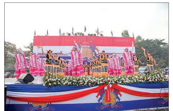
People celebrated the Kayin New Year Festival 2016 at the Kayin Yard of Ahlon Township, Yangon Region.

It is reported that most of the exported items this month are various kinds of nuts, and imported items are machines and equipment, building materials, petroleum products, chemical products, fertilizers, plastic raw materials, cotton fabrics, pharmaceutical products and other materials. — TWA/CT