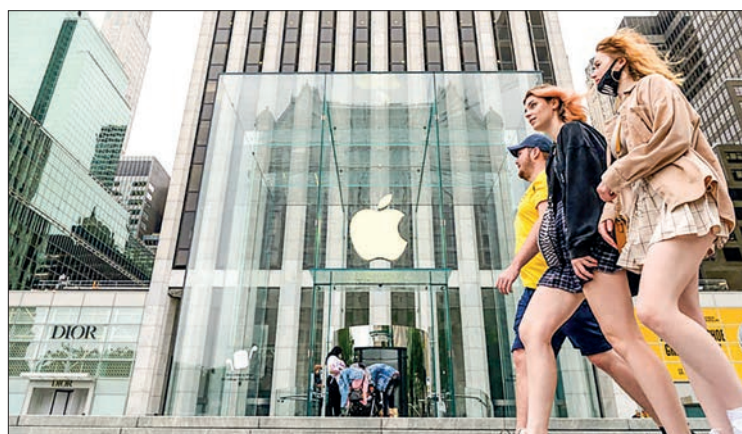
People walk past an Apple retail store in New York City.

Apple told AFP that it would examine the ruling in detail and would continue to support developers while offering a safe platform for consumers.—AFP