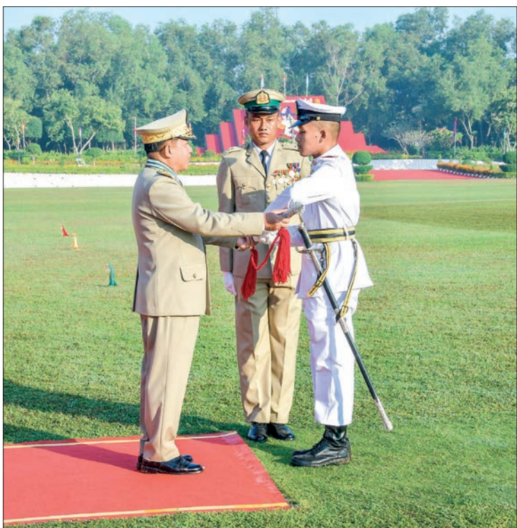
The Senior General presents the Best Cadet Award.

In his speech, the Senior General stressed the need for the cadets to adhere to ethics and morality of prestige to be persons with good morality. The cadets have to pay back debts of gratitude to their parents, the academy, Tatmadaw and the State by faithfully serving their duties. They have to continuously try hard to meet their goal in life while studying the advancements in medical technologies throughout their life.