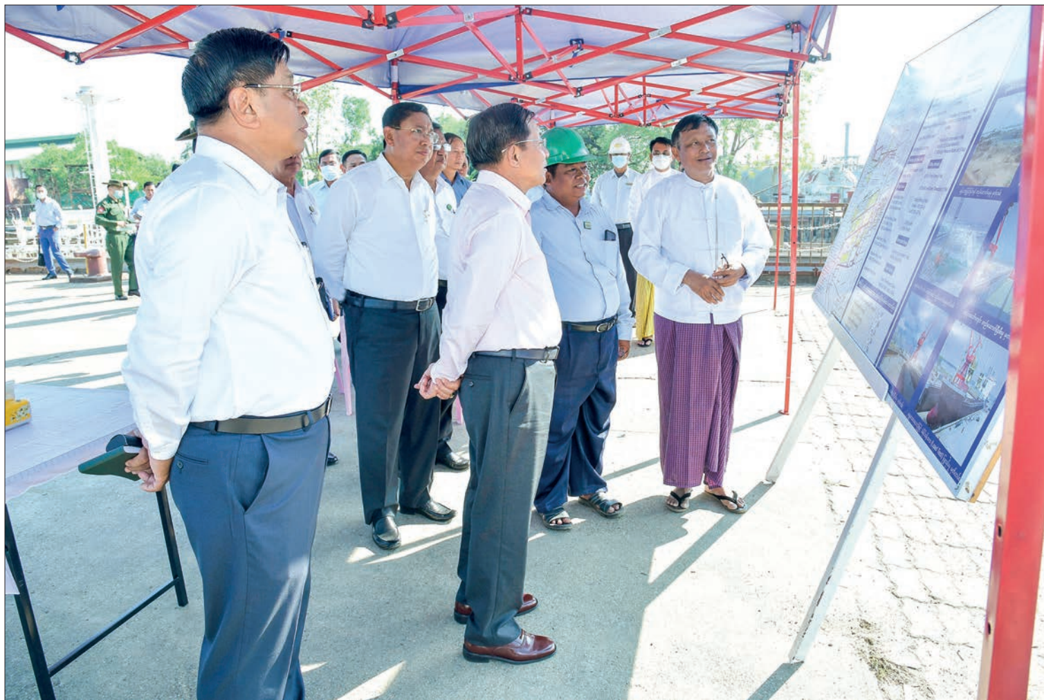
State Administration Council Chairman Prime Minister Senior General Min Aung Hlaing hears the report of the Myanmar Shipyard yesterday.