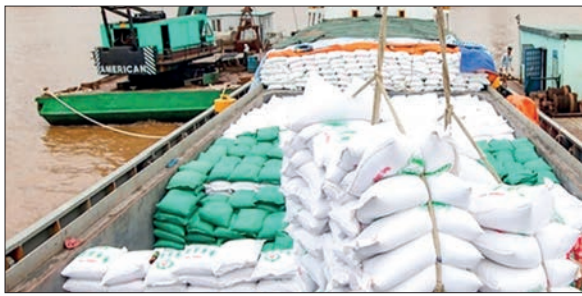
Sugar bags are loaded onto the ship