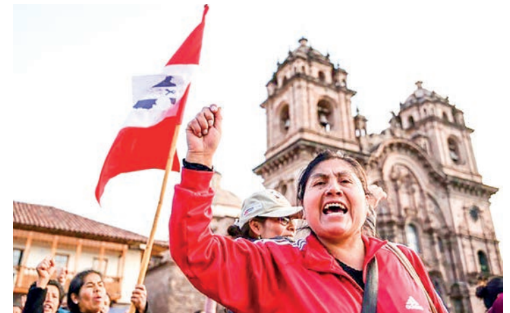
Protesters have taken to the streets in support of Peru’s ousted president Pedro Castillo. PHOTO: AFP

A subsequent security clampdown, including the deployment of armed soldiers during a state of emergency declared under Boluarte, followed. Officials say at least 21 people have died in the unrest. More than 650 others have been injured.—AFP