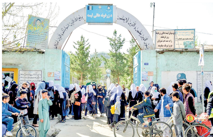
Girls leave their school following order of closure just hours after reopening in Kabul on 23 March 2022. The Taliban ordered girls’ secondary schools in Afghanistan to shut just hours after they reopened, an official confirmed, sparking confusion and heartbreak over the policy reversal by the hardline Islamist group.

she said. Hassan said Tanzania’s investment in the SGR had now reached $10.04 billion, including the latest contract.—AFP