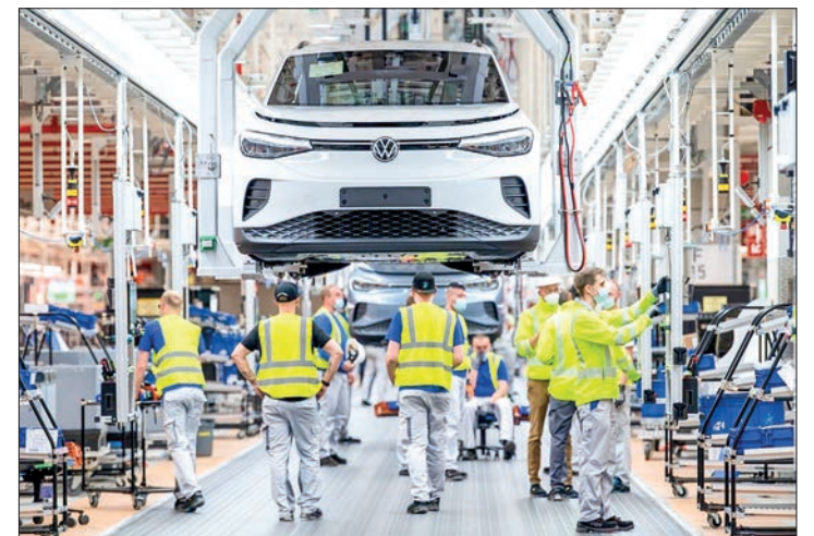
The assembly line for the Volkswagen ID 4 electric car, in Emden, northern Germany.

"It is in our mutual interest to rapidly find common ground" on the issue when Europe and the United States are "cooperating to face Russia's war against Ukraine," France's finance minister Bruno Le Maire and his German counterpart Robert Habeck said in joint statement.—AFP