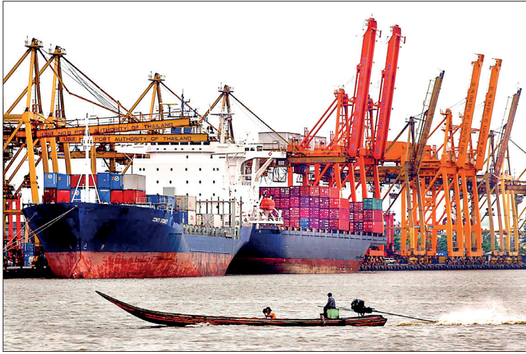
In this picture taken on 15 August 2002, a long-tail water taxi zips across Bangkok's industrial and commercial port.

MINISTERS of 14 Indo-Pacific nations affirmed Tuesday they will accelerate US-led negotiations to set rules on their economic cooperation in the region to counter China's growing clout, the Japanese government said.