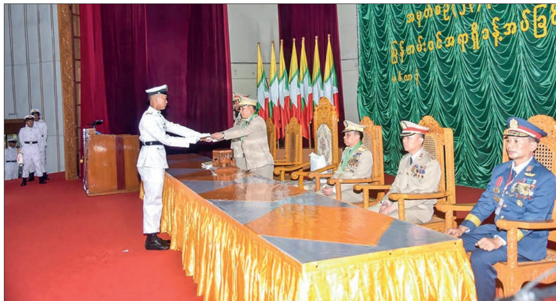
The commissioning ceremony for graduate cadets of the 23 rd Intake of the Defence Services Medical Academy is in progress.