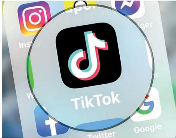
TikTok is a hugely popular video-sharing platform but some in the United States see it as a threat to national security.

The measure would follow bans in nearly 20 US states, where Republicans