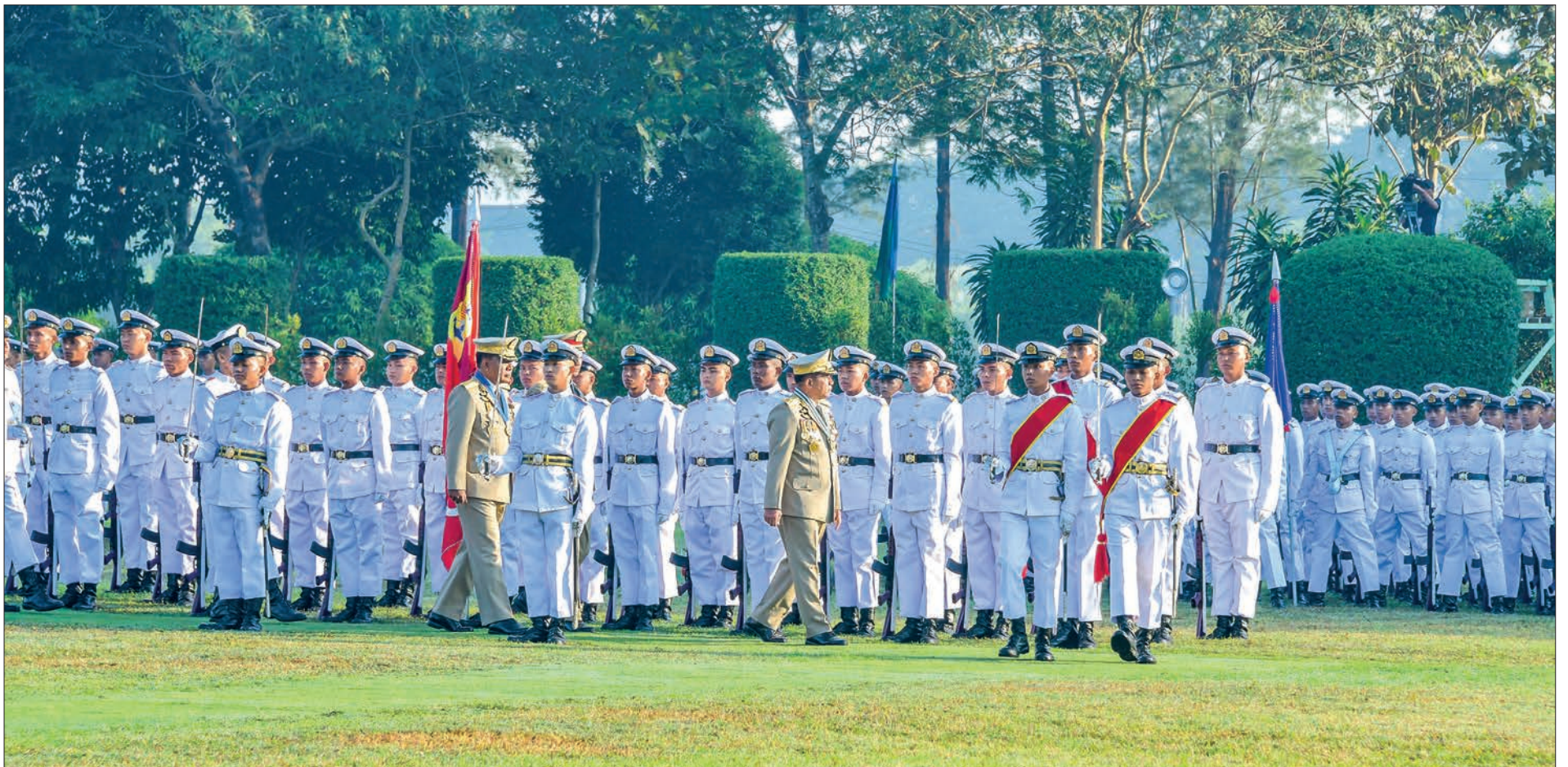
Chairman of the State Administration Council Commander-in-Chief of Defence Services Senior General Maha Thray Sithu Min Aung Hlaing inspects the graduate cadet company at the Passing-Out Parade of the 23 rd Intake of the Defence Services Medical Academy in Yangon on 21 December 2022.

T HE Passing-Out Parade of the 23 rd Intake of the Defence Services Medical Academy took place at the parade ground of DSMA in Yan-