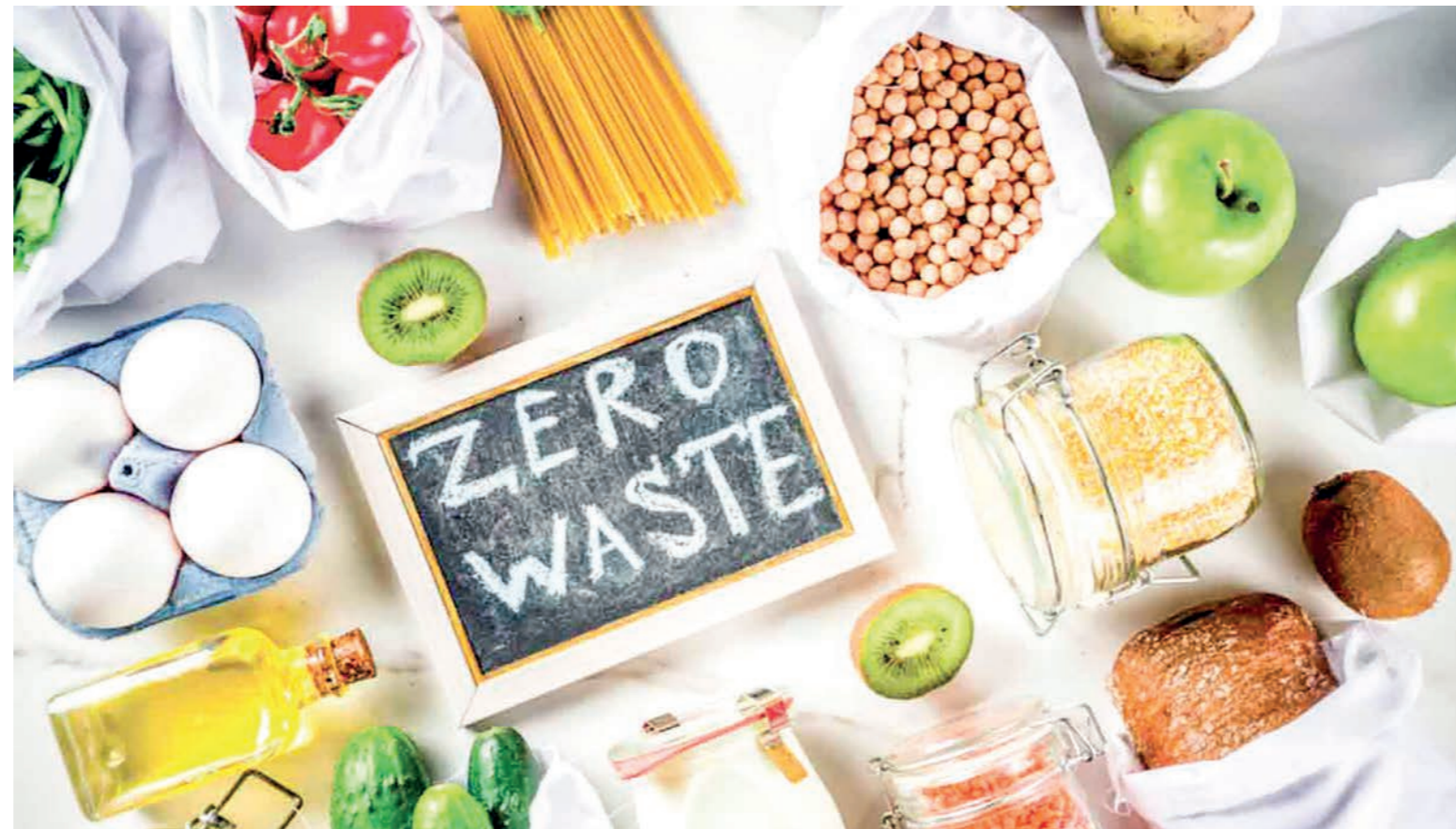
Food loss and waste, which the Food and Agriculture Organization estimates is costing US$1 trillion every year has the potential to create new income streams for local governments and businesses. ILLUSTRATION: UN TODAY

and can be downloaded to a mobile phone from Google Play or Apple's App Store. Once installed, users simply search for outlets within 3-30 kilometres of a selected area and, if available, are