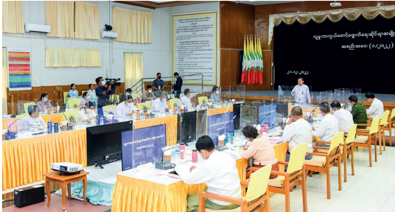
State Administration Council Vice-Chairman Deputy Prime Minister Vice-Senior General Soe Win chairs the meeting 1/2022 of the National Committee on Social Protection on 21 December 2022 in Nay Pyi Taw.

Currently, the Vice-Senior General said that the Social Management Information System-SMIS is being drawn for effectively implementing the social protection measures, and such