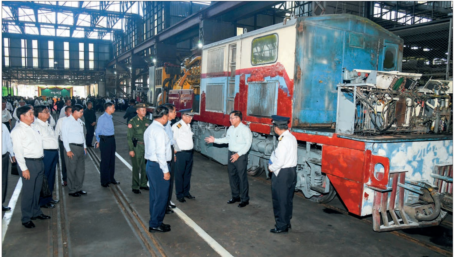
State Administration Council Chairman Prime Minister Senior General Min Aung Hlaing views round the Locomotive Factory (Insein) in Insein Township, Yangon yesterday.

Speaking on the occasion, the Senior General said the development of a country depends on a political driving force, an economic driving force and military capability. Whatever political system is implemented, if the country is politically united, it will develop. Only when the economic driving force is strong will the country be wealthy. Countries with strong economic driving forces are powerful. Likewise, countries with military capability are powerhouses. Every country has the right to exercise its sovereignty. Myanmar has sound foundations for the enhancement of the State economy.