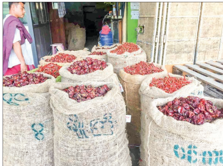
Some chilli pepper varieties are displayed for sale at the Bayintnaung brokerage house.

Prices of new bell pepper from the Sinphyukyun area, Kyauksaung bell pepper, Zee bell pepper and Shan bell pepper stood at K18,000, K13,000, K12,500 and K13,500 per viss. Although cold storage bell peppers from delta regions have