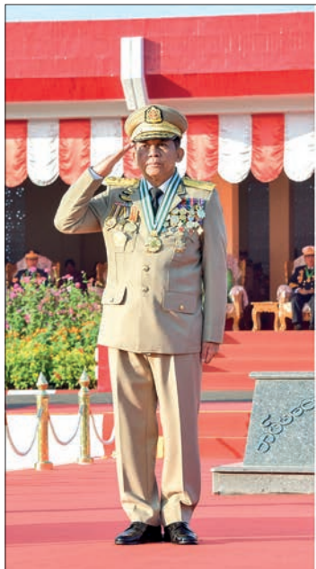
State Administration Council Chairman Commander-in-Chief of Defence Services Senior General Maha Thray Sithu Min Aung Hlaing takes salutes of the cadet companies.