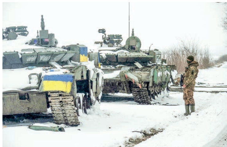
As temperatures drop, Ukraine faces a major crisis with Russia targeting vital infrastructure.

Zelensky’s trip was so carefully arranged that even though reported by multiple US media outlets earlier on Tuesday, it was said to still have the potential of failing to materialize at the last minute due to heightened security concerns — until the senior administration official formally made the